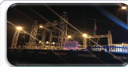
Construction of Zinchaung-Saneh Electric Power Sub-Station