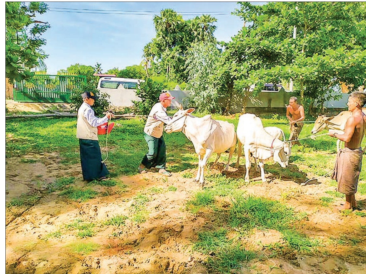
Veterinary team vaccinating the cattle against foot-and-mouth disease in Depaiyin Township, Shwebo District, Sagaing Region.

Concerning public health and socio-economic impact, the transboundary animal diseases have been revealed as paramount important livestock diseases in the ASEAN. According to regional tripartite workshop based on individual country priorities, the prioritized diseases are Foot and Mouth Disease (FMD), Porcine Reproductive and Respiratory Syndrome (PRRS), Classical Swine Fever