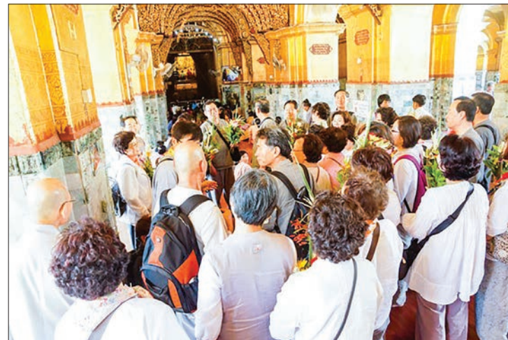
Tourists visit Mahamuni Pagoda in Mandalay.