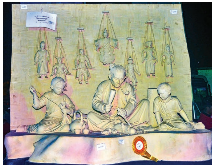
The first prize winning award in the optional category.