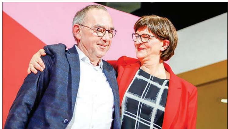
Incoming SPD leaders Norbert Walter-Borjans and Saskia Esken are critical of Merkel's grand right-left coalition.

BERLIN — Headed by a new leftist leadership duo, Germany's struggling Social Democrats are gearing up for a crunch congress from Friday that could decide the future of Chancellor Angela Merkel's fragile coalition government.