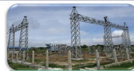
Construction of Hsat Yoe Kya Electric Power Sub-Station