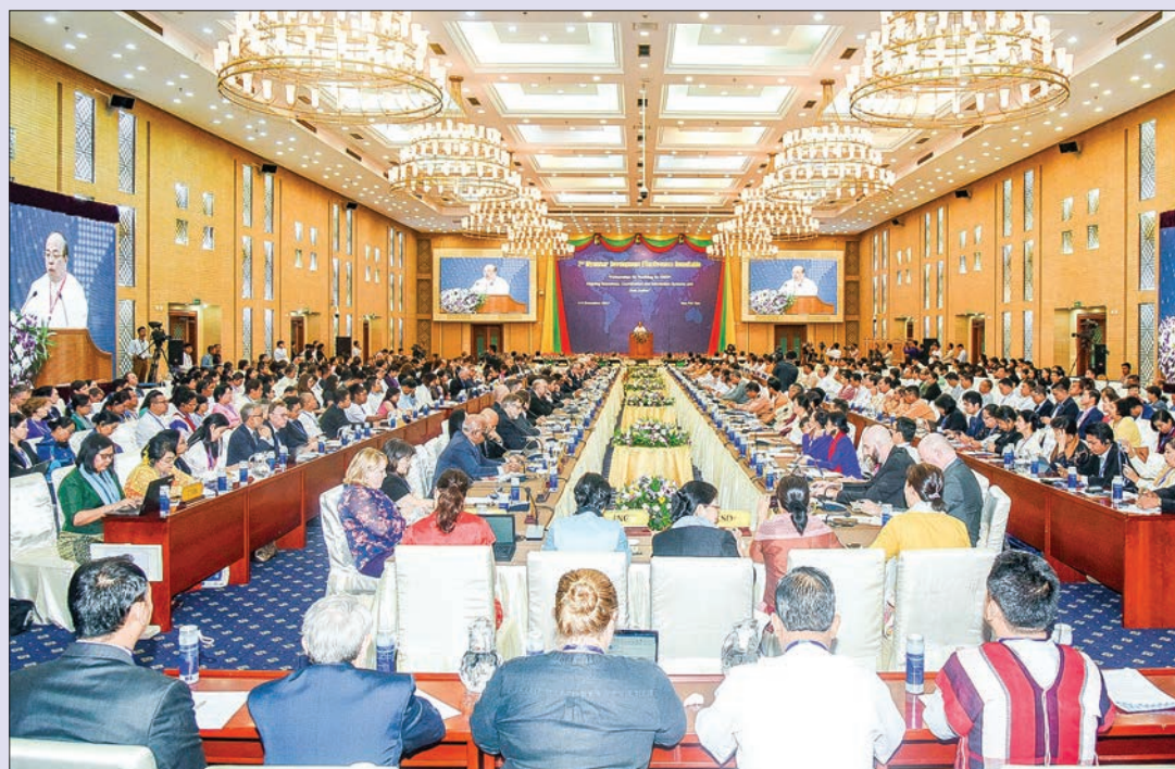
Union Minister U Thaung Tun delivers the speech at the opening ceremony of the 2 nd Myanmar Development Effectiveness Roundtable in Nay Pyi Taw yesterday.

The Minister also emphasized the implementation of Myanmar Sustainable Development Plan, supported by the establishment of key institutional mechanisms including the Project Bank, the Land Bank, a new Public-Private Partnership (PPP) Center,