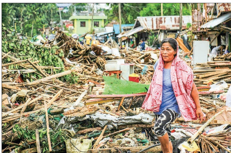
Kammuri's fierce winds toppled trees and flattened flimsy homes across a swathe of the nation's north on Tuesday.

phoons each year, killing hundreds and putting people in disaster-prone areas in a state of constant poverty. —AFP ■