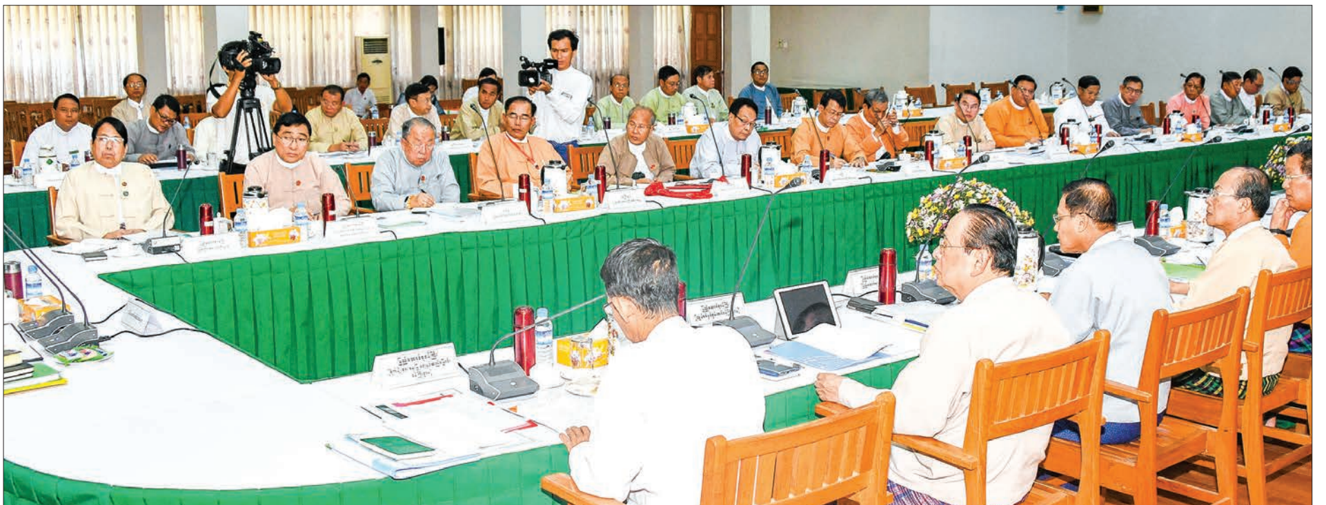
Vice President U Henry Van Thio addresses the meeting of Leading Committee for Farmer Rights Protection and Enhancement of their Benefits in Nay Pyi Taw yesterday.