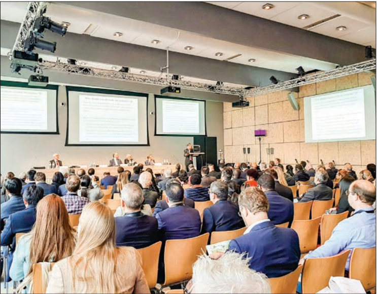
Union Minister Dr Than Myint attends the 30 th anniversary of Common Fund for Commodities (CFC) and the 31 st Annual Meeting of the Governing Council in the Netherlands.

technology from CFC in the development of the agricultural sector of Myanmar and providing help for holding workshops in Myanmar. The Union Minister also attended the programmes of 31 st Annual Meeting of the Governing Council, and voted in the election of its managing director. — MNA (Translated by Aung Khin)