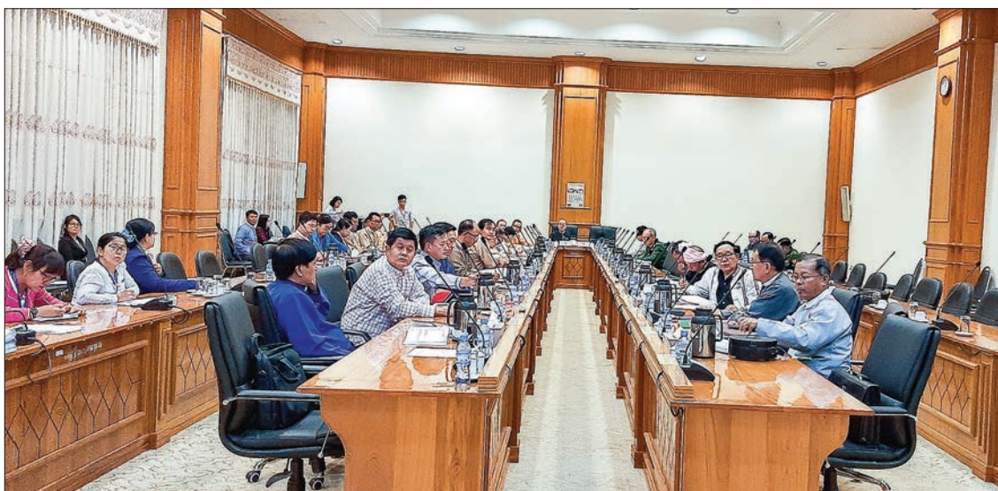
Meeting 65/2019 of the Joint Committee on Amending the 2008 Constitution held in Nay Pyi Taw yesterday.