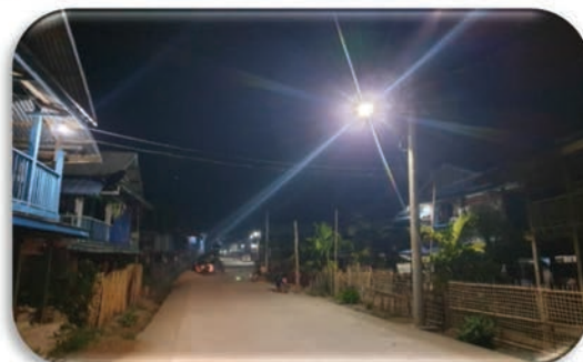
Electricity Supply to Sanè Town from the Grid