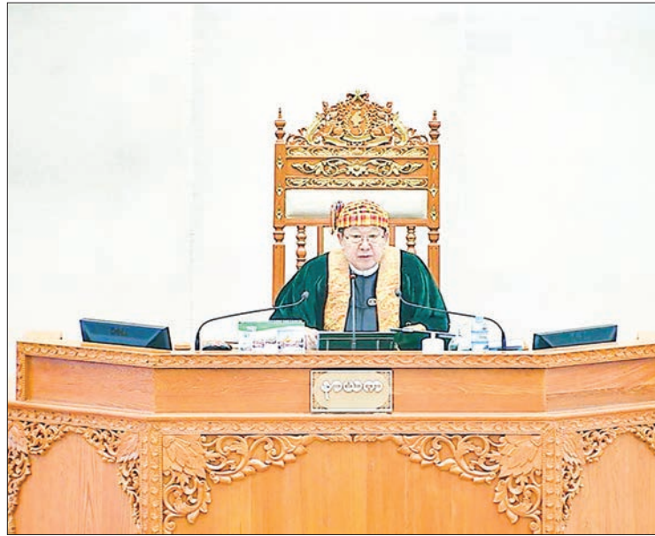
Pyidaungsu Hluttaw Speaker U T Khun Myat.