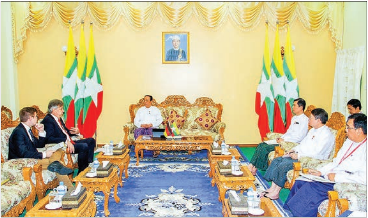
Union Minister U Win Khaing meets with German Ambassador Mr Thomas Neisinger in Nay Pyi Taw yesterday. UNION Minister for Electricity and Energy U Win Khaing received German Ambassador Mr Thomas Neisinger at his office in Nay Pyi Taw yesterday. They discussed cooperation in the electricity and energy sector between Myanmar

and Germany, cooperation with German companies, increasing cooperation in renewable energy sources, assistance for technology and human resource development, increasing technical and financial assistance from Germany in MoEE's current and future projects, assistance in upgrading power plants and fertilizer factories, the formation of the National Renewable Energy Committee and its objective and ongoing processes, and assistance in elevating skills of the policy, technology and financial management sectors.—MNA (Translated by Zaw Htet Oo)