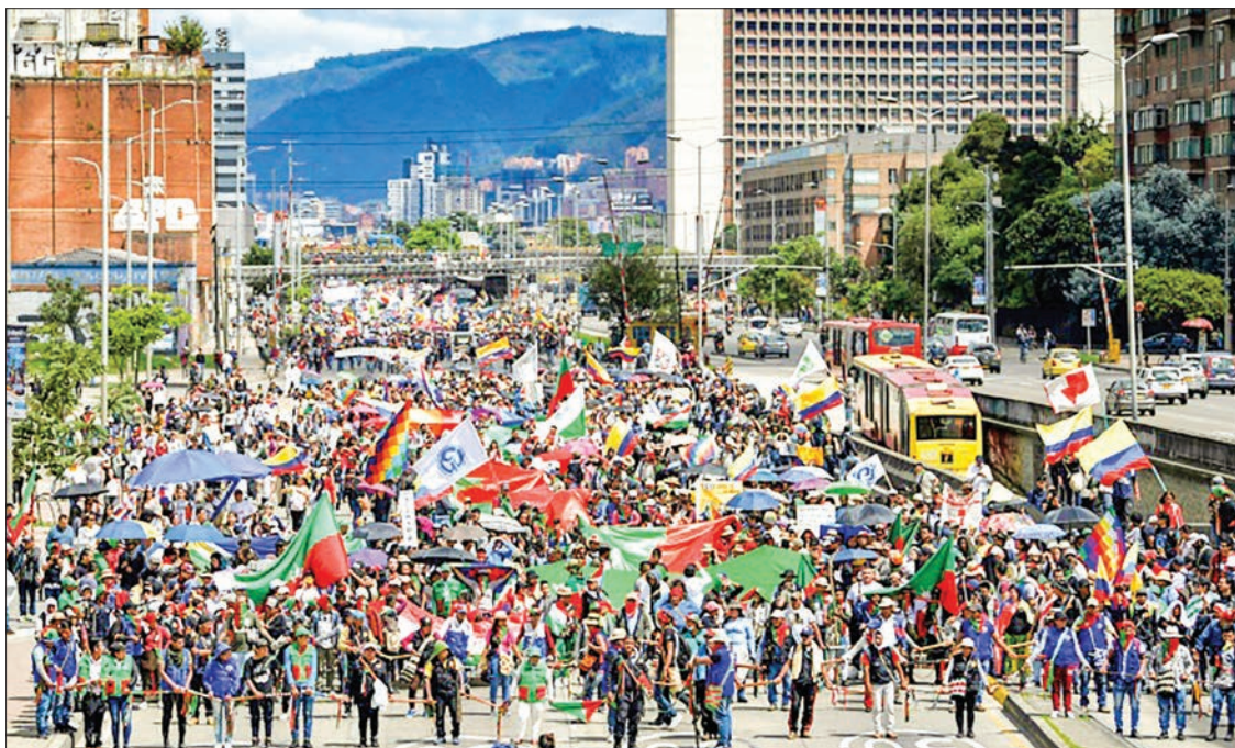
Indigenous people and students take part in a protest in Bogota against the government of Colombian President Ivan Duque.

Around 250,000 people took part in the first demonstration against Duque's 15-month-old government on 21 November, when the initial general strike brought the country to a stand-