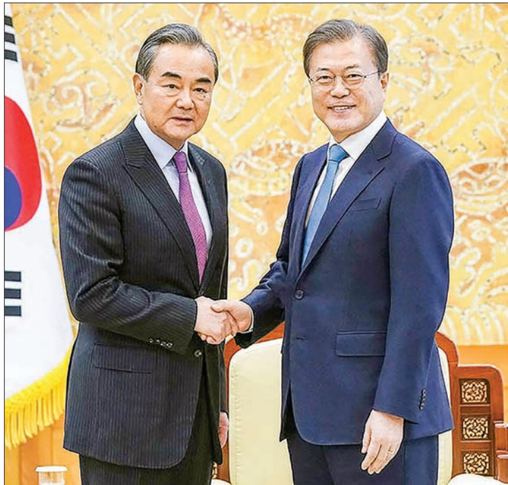
South Korean President Moon Jae In meets with Chinese Foreign Minister Wang Yi in Seoul on 5 December, 2019.

In response, Wang said that the goal of his visit to Seoul was to have "strategic communication" with South Korea, adding that there will be more room for improvement in bilateral ties as China continues to open up.