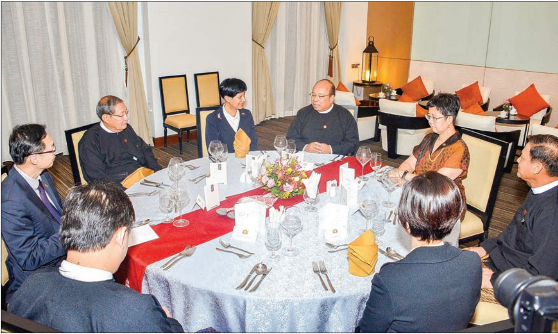
Union Minister U Thaung Tun hosts dinner for Minister in the Prime Minister's Office and Second Minister for Education and Finance of the Republic of Singapore, Ms. Indranee Rajah in Nay Pyi Taw, PHOTO: MNA

UNION Minister for the Ministry of Investment and Foreign Economic Relation U Thaung Tun hosted a dinner for Minister in the Prime Minister's Office and Second Minister for Education and Finance of the Republic of Singapore, Ms Indranee Rajah at M. Gallery by Sofitel Hotel, Nay Pyi Taw, yesterday evening. Union Minister for Planning, Finance and Industry U Soe Win, Union Attorney-General U Tun Tun Oo, Deputy Minister for Planning, Finance and Industry U Min Ye Paing Hein were attended the dinner.—MNA