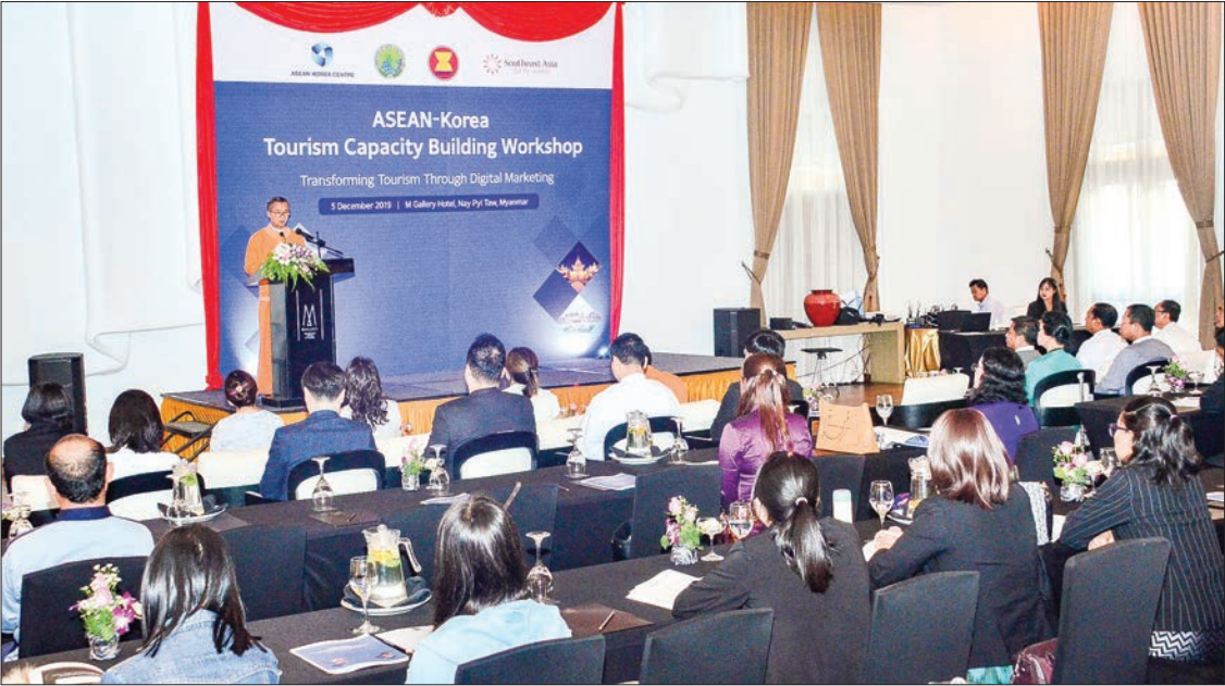
Union Minister for Hotels and Tourism U Ohn Maung delivers the opening address at the ASEAN-Korea Tourism Capacity Building Workshop in Nay Pyi Taw yesterday.

THE workshop titled ‘Transforming Tourism Through Digital Marketing’ was held at the M Gallery Hotel in Nay Pyi Taw yesterday. Union Minister for Hotels and Tourism U Ohn Maung delivered an opening remark at the workshop which aimed for capacity building in tourism industry between ASEAN and the Republic of Korea. The Union Minister said that the ministry has focused on digital technology in tourism industry of the country since 2018 for promoting the image of the country, expanding tourism market, and using digital marketing for distribut-