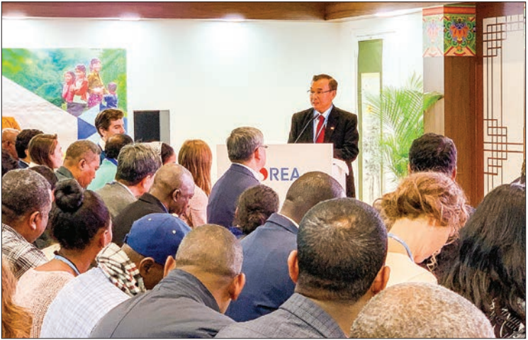
Union Minister U Ohn Win addresses the event on reducing carbon emissions and preserving natural forests to limit climate change in Spain. UNION Minister for Natural Resources and Environment Conservation U Ohn Win attended an event on reducing carbon emissions and preserving natural forests to limit climate change organized by the Korea Forest Service, a South Korean government agency specializing in forestry, at Feria de Madrid's exhibition centre in Spain on 4 December. Speaking at the event, the Union Minister highlighted Myanmar's efforts to reduce climate change by drafting appropriate policies and cooperating with the international community, in addition to signing relevant UN Conventions. He also mentioned Myanmar's 10-year reforestation plan and said he believes it will also raise the socio-economic livelihood of the local residents. He then thanked the ROK agency for providing technical and financial assistance. Next, the Director of the Yezin Forestry Research Department, under the Forestry Department, explained the facts and experiences of Myanmar's project to reduce carbon emissions from deforestation and forest conservation. Additionally, officials from Cambodia and ROK also explained their REDD+ implementations, experiences and objectives, and experts from CIFOR and Wildlife Works recounted their international experiences. The Union Minister also attended a panel discussion on opportunities in renewable energy sources to reduce climate change at the World Wide Fund for Nature Pavilion, New Zealand's discussion on Impact of Climate Change on Pacific Blue Economics, and England's research paper reading session on climate change and consequences on aquatic life. — MNA (Translated by Zaw Htet Oo)