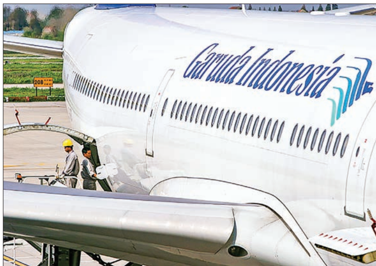
A Garuda Indonesia jet is serviced at a flight line at Pudong International Airport in Pudong, China.

JAKARTA — The Indonesian government decided Thursday to fire the head of national carrier PT Garuda Indonesia over his alleged role in the smuggling of Harley-Davidson motorcycle parts into Indonesia from France.