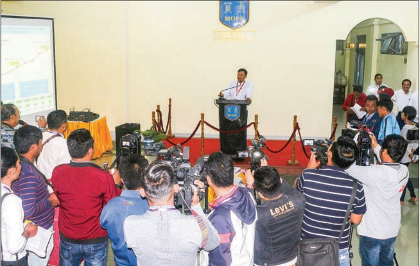
Ministry of Electricity and Energy holds press conference in Nay Pyi Taw yesterday.