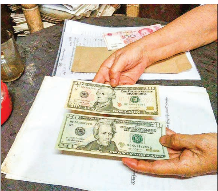
A man checking US dollar notes at a money changer in Yangon.

per tical (0.578 ounces, or 0.016 kilograms) on 5 December from a record high of K1.3 million in early September. This year, the exchange rate stood at K1,540 on 1 January and fell to a low of K1,515 on 15 January. It continued to drop and reached K1,503 on 28 February. Thereafter, it rose to K1,527 on 18 March and K1,538 on 14 May. The rate stood at K1,259 on 1 June and K1,514 on 26 August. Then, the dollar exchange rate hit a peak of K1,565 on 6 September. It was pegged at around K1,528-1,537 in October. Last month, the rate moved in the range of K1,510-1,524. —Ko Htet (Translated by Ei Myat Mon)