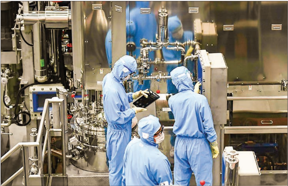
Shiseido relies heavily on human intervention for its high-end products.

Nevertheless, Japan is more than holding its own, with exports nearly quadrupling since 2013 to 546 billion yen ($5 billion), according to finance ministry figures, nearly two-thirds of that going to China and Hong Kong.