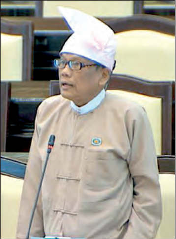
MP U Khin Maung Latt.