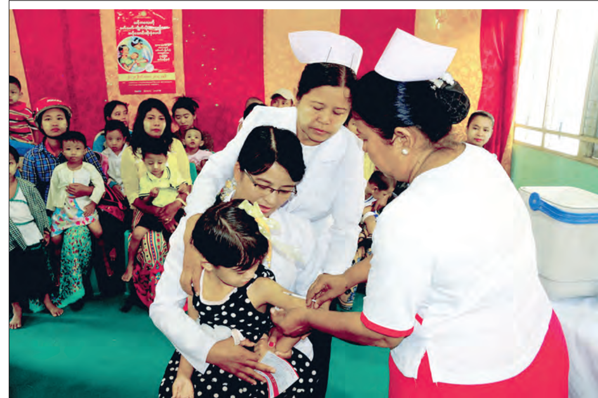
Nurses vaccinate children against measles at a township public healthcare centre in Yangon on 28 November.

The Ministry of Health and Sports has been conducted its extended vaccination program as a priority. It is giving 11 types of vaccinations to children under