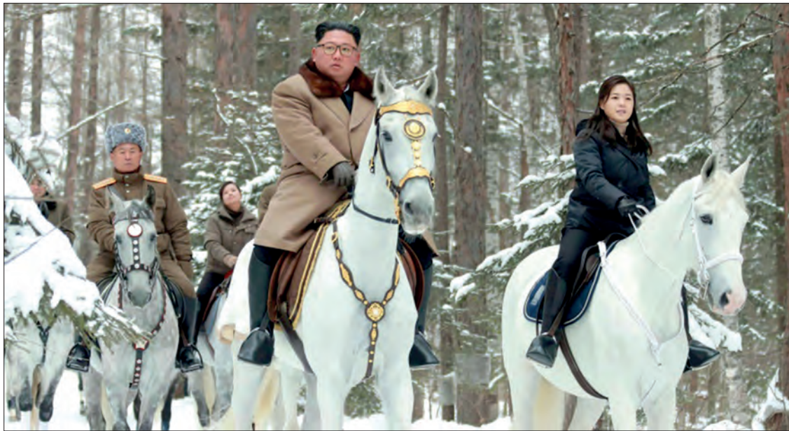
Mt Paektu has great symbolic significance in the North as both the spiritual birthplace of the Korean nation and, according to Pyongyang's orthodoxy, the birthplace of Kim's father Kim Jong Il.