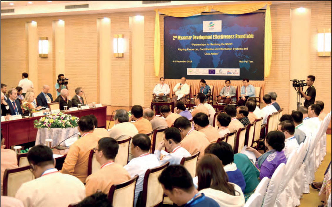
Union Minister U Thaung Tun participates in the 2nd Myanmar Development Effectiveness Roundtable discussion in Nay Pyi Taw on 4 December 2019.

WITH the title of “Partnerships for Realizing the MSDP: Aligning Resources, Coordination and Information Systems and Civic Action”, the 2nd Myanmar Development Effectiveness Roundtable was launched at the Myanmar International Convention Center- II in Nay Pyi Taw. The two-day talk was started yesterday, with an opening remark of Union Minister for Investment and Foreign Economic Relations U Thaung Tun, and was attended by Union Ministers, Chief Ministers of States/Regions, Deputy Ministers, Hluttaw representatives, permanent secretaries, directors-general, ambassadors to Myanmar, representatives from the development partner countries and organizations, UN agencies, local and foreign civil organizations and the invited guests. Union Minister U Thaung