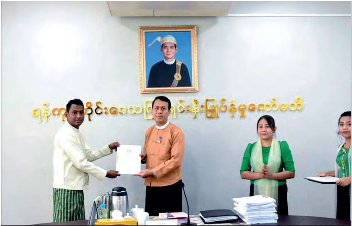
Yangon Region Chief Minister U Phyo Min Thein presents the permission to a responsible person of the FDI projects.