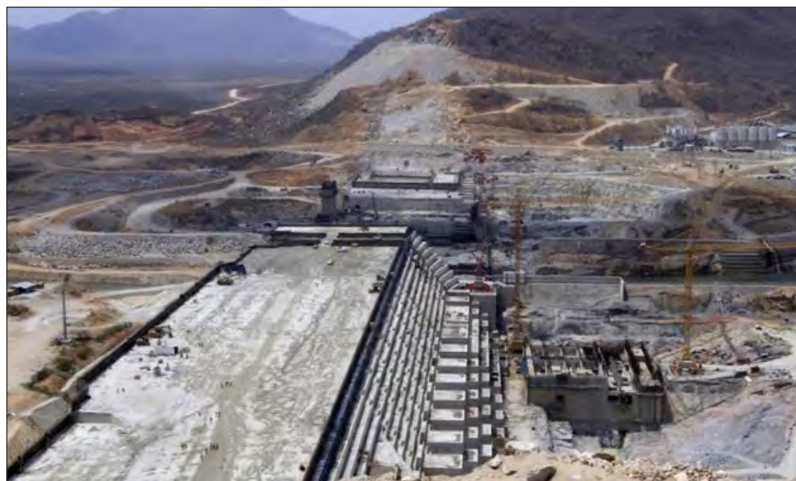
A general view of Ethiopia's Grand Renaissance Dam is seen during a media tour along the river Nile in Benishangul Gumuz Region, Guba Woreda, in Ethiopia 31 March, 2015 - AFP.

Ethiopia started building the GERD in 2011, but Egypt, a downstream country that relies heavily on the Nile for water, is concerned that the dam might affect its share of the water resources.—Xinhua ■