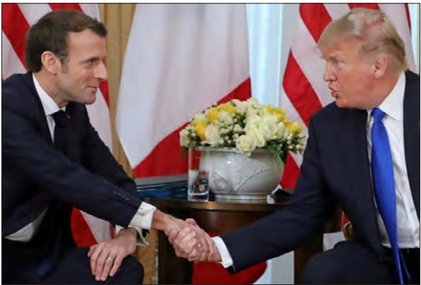
US President Donald Trump and France’s Emmanuel Macron held a meeting ahead of a NATO summit in London.

of the Russian S-400 air defence system. Turkish President Recep Tayyip Erdogan meanwhile has threatened to hold up NATO efforts to bolster the protection of the Baltic republics against Russia unless the allies brand the Kurdish militias who defeated the IS group in Syria as “terrorists”. Amid fears Erdogan could even veto the summit declaration and with barely two hours to go before the leaders sat down for their sole roundtable, NATO Secretary General Jens Stoltenberg admitted a solution to the row with Turkey had still not been found. “I’m confident that we will be able to find a solution to the issue related to the updating the revised defence plans,” he said as he arrived for the summit at a luxury golf hotel in Watford, on the outskirts of London.—AFP ■