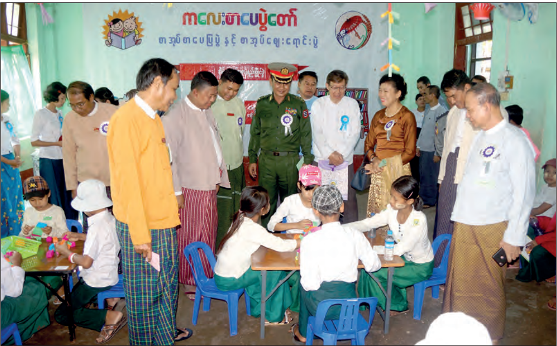
Ayeyawady Region Government officials observe children participating in the competitions during children literary festival in Myaungmya yesterday.

ORGANIZED by the Ayeyawady Region Government, the ninth Children Literary Festival of the Region was opened at the Basic Education High School No.1 (Myaungmya) in Myaungmya