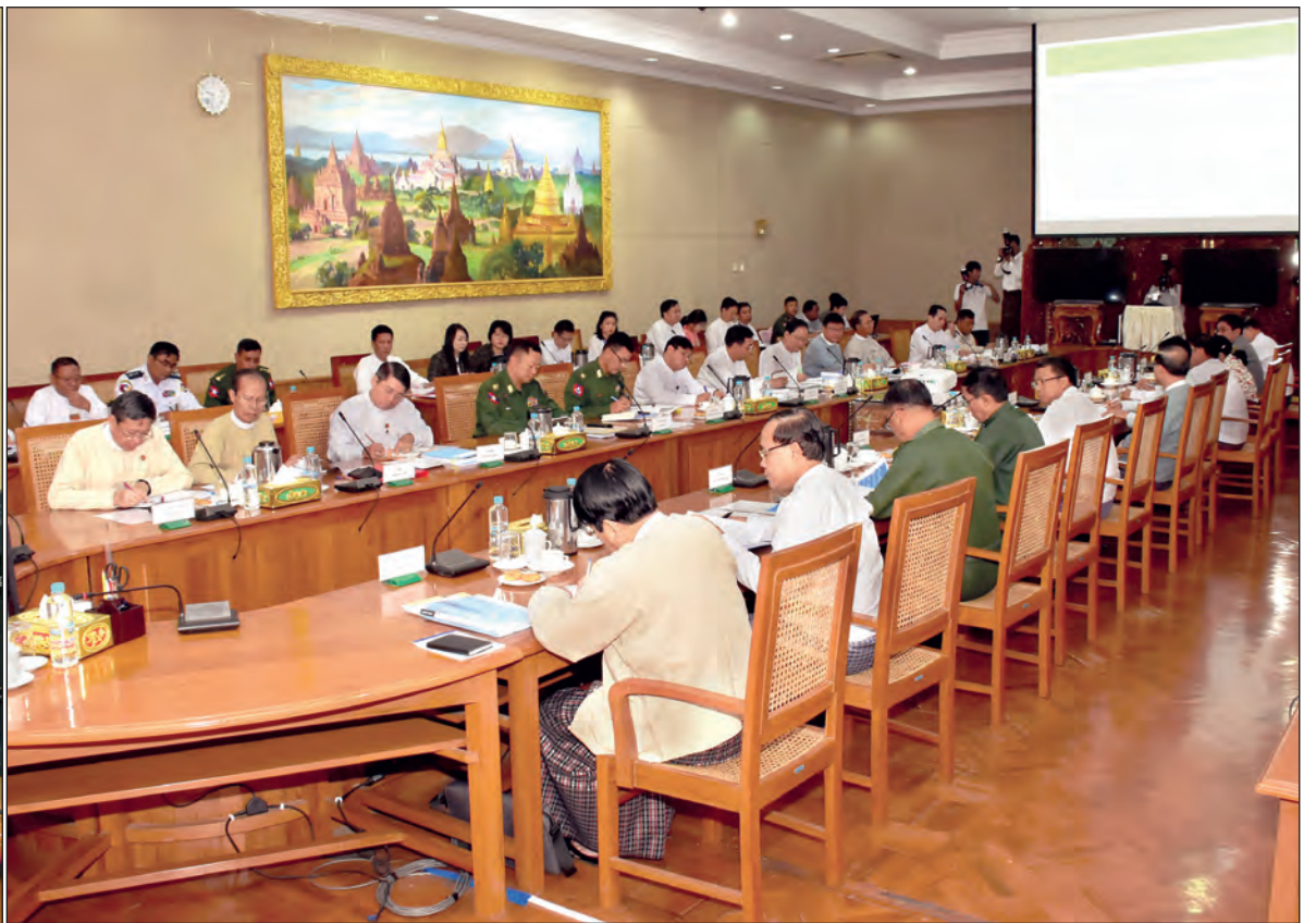
Vice President U Myint Swe delivers the address at the 3 rd coordination meeting for holding the 72 nd Independence Day ceremony to be held on 4 January 2020 in Nay Pyi Taw.