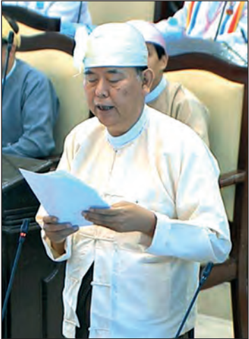
Deputy Minister U Win Maw Tun.

THE 11 th day meeting of the 14 th regular session of the Second Amyotha Hluttaw was held at Amyotha Hluttaw building yesterday morning where Hluttaw agreed to discuss a motion on properly regulating tissue-culture banana plantations. Earlier in the meeting questions raised were answered and Hluttaw representatives discussed a bill.