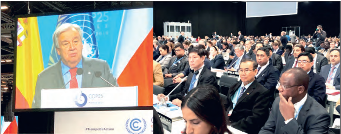
Union Minister for Natural Resources and Environmental Conservation U Ohn Win attends the 25 th UN Climate Change Conference (COP25) in Madrid, Spain, on 2 December.