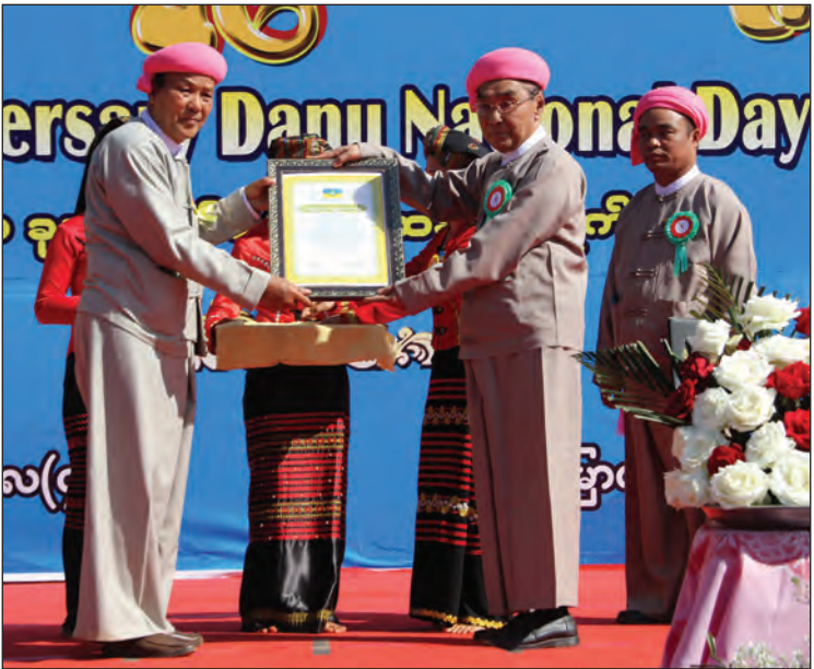
Union Minister Nai Thet Lwin presents certificate of honour to Organizing Committee member at the 2 nd Anniversary of Danu National Day ceremony.

Kalaw and Aungban of Southern Shan State. They also moderately populate Pyinmana, Yamethin, Tharsi and hilly regions linking to them. Danu National Day came about when Danu representatives from ten townships mostly populated by Danu people in Shan State and from all across the nation held a Danu National Conference in Pindaya on the 8 th Waxing of Nadaw in 1380 ME and became the first conference where five decisions were reached unanimously, thereby chosen to be commemorated as a special day.—MNA (Translated by Zaw Htet Oo)