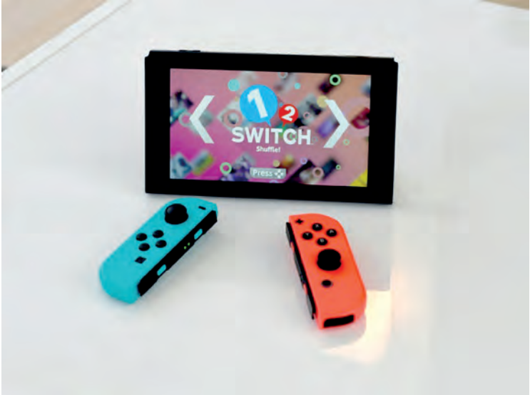
The Nintendo Switch is a hugely popular console around the world, helped by family-friendly games.

The Switch has become a huge global seller, aided by the release of innovative, family-friendly titles that have been well-received by critics and gamers. The console will come with “New Super Mario Bros. U Deluxe Edition” pre-installed, with “Mario Kart 8 Deluxe Edition” and “Super Mario Odyssey” also available soon, company officials said. Tencent added that it would work to “enrich” the console’s game line-up, including with titles created by Chinese developers, and that up to 20 games could be available to play on Switch in 2020. China in 2014 began easing a more than decade-long ban on consoles imposed out of concern over the negative impact gaming may have on children.—AFP ■