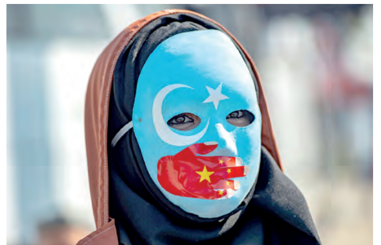
The legislation condemns Beijing's 'gross human rights violations' linked to the crackdown on mainly Muslim Uighurs in Xinjiang.

"If you look beneath that, at the Democrat view and the fact that this was bi-partisan, it seems the only thing the people in politics in Washington can agree on is that China is, somehow, an evil empire," he added.—ANI ■