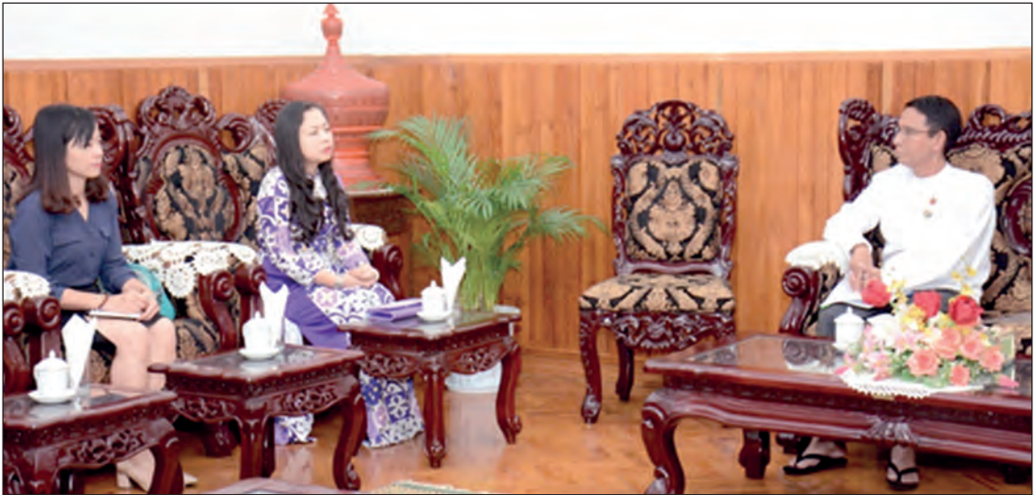
Union Minister Dr Aung Thu meets with Vietnamese Ambassador Dr Luan Thuy Duong in Nay Pyi Taw yesterday.

livestock sector cooperation signed in 2017, establishment of fishery task force and meetings to be alternatively hosted by the two countries from 2020. Being the members of ASEAN countries, Myanmar and Viet Nam are closely cooperating with other regional countries in promoting on agricultural and rural development sectors, Livestock breeding sector, doing researches and holding academic conferences.—MNA (Translated by Kyaw Zin Tun)