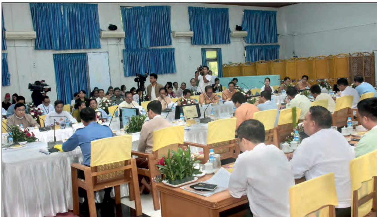
Vice President U Henry Van Thio addresses the fifth meeting of the National Committee on the Rights of Persons with Disabilities in Nay Pyi Taw yesterday.

THE fifth meeting of the National Committee on the Rights of Persons with Disabilities was held at the Ministry of Social Welfare, Relief and Resettlement in Nay Pyi Taw yesterday and National Committee Chairman Vice President U Henry Van Thio delivered a speech.