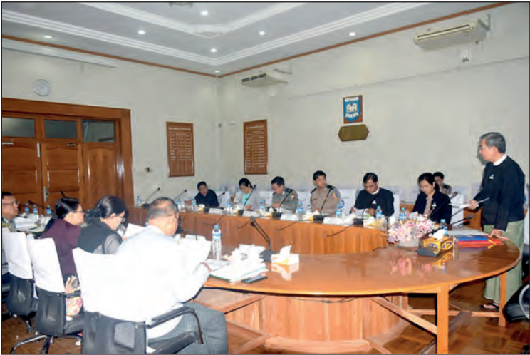
Union Attorney-General U Tun Tun Oo addresses the coordination meeting on anti-money laundering, counter-terrorism financing meeting in Nay Pyi Taw.

THE Office of Union Attorney General organized the 1 st coordination meeting of Supervising Committee for Implementing Strategic Area (1) in National Strategy on Anti-Money Laundering and Countering the Financing of Terrorism, yesterday morning. Union Attorney-General U Tun Tun Oo presided over the meeting held at the headquarters of UAGO in Nay Pyi Taw. He explained the works of Supervising Committee to monitor the process of state-departments in implementing the policies, directives and legal frameworks in preventing money laundering and countering the financing of terrorism. Myanmar has carried out the National Risk Assessment (NRA) in 2015 with the technical assistance of IMF, and adopted