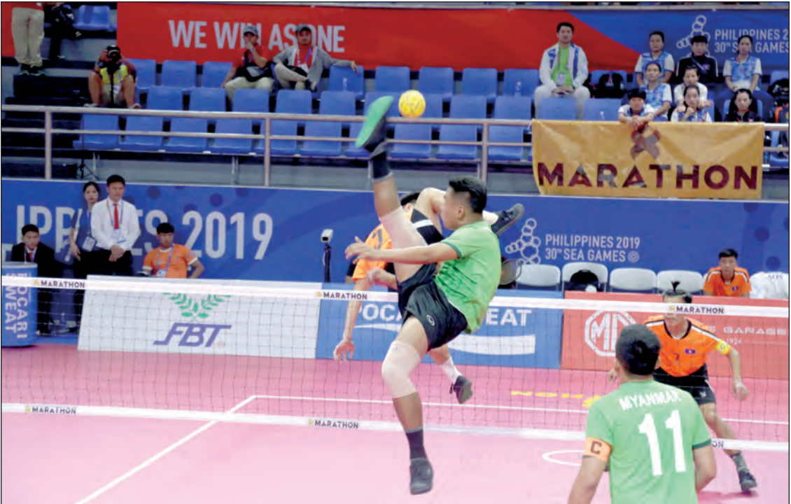
Myanmar and Laos players compete in the men’s doubles Sepak takraw competition at the 30 th SEA Games yesterday at the Subic Bay Gymnasium in the Philippines.