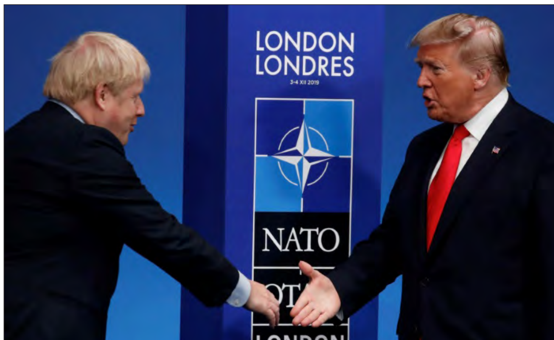
Arriving for the formal NATO talks on Wednesday, Boris Johnson denied he was trying to avoid being seen with Donald Trump.

In a press conference on Tuesday, the president promised to "stay out" of the election cam-