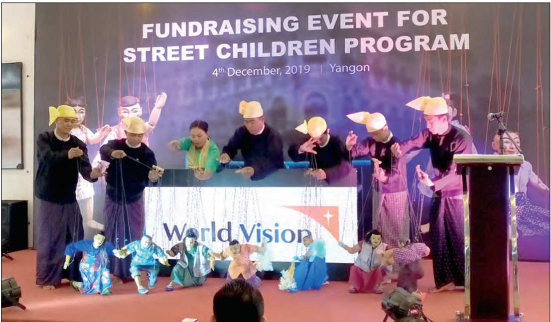
Traditional puppet show at a Fundraising Event for street children programme held in Yangon on 4 December.

MORE than 700 out of 2,000 street children in Myanmar have been reunited with their families and will get rehabilitation support, according to aid agencies. Out of 2,000 street children, 734 have been returned to their families, with 136 children completing vocational training courses and 66 establishing their own small businesses, according to World Vision. To support street children in Myanmar, a fund-raising event was held on 4 December at the Kafe in Town on Pansodan Road, Yangon. The event was jointly held by World Vision and TODAY Ogilvy. “People need to know that there are children suffering woes from having to live on the road in Myanmar. This being so, everyone needs to know and be concerned about their development. This event was held to help people learn about the woes of street children, who are being exploited, and support them,” said Dr Thar Tun Oo, chairman