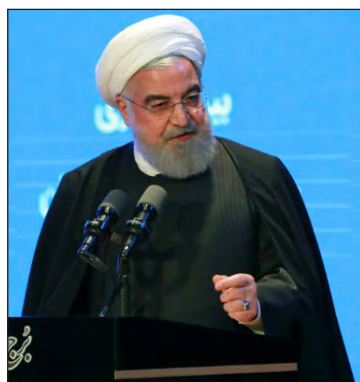
President Hassan Rouhani has long demanded the lifting of US sanctions in exchange for Iran's return to talks on its nuclear programme. President office.

It is a rise many Iranians can ill afford in a country whose sanctions-hit economy is expected to contract by 9.5 per cent this year.