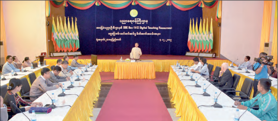
Union Minister Dr. Myo Thein Gyi delivers the speech at the launching ceremony of the pilot phase of installation of DBE Boxes (K-12 Digital Teaching Resources) in Nay Pyi Taw yesterday.

Basic Education would be able to easily access books, lessons, teacher’s manuals, and general supplementary textbooks for KG, Grade 1, Grade 2, and Grade 3, and on education policy, law, and reforms,” the minister said. DBE Boxes include teaching aids with a Creative Commons License and have been designed by international universities and organizations for the purpose of education. Teachers would be able to study the lessons and teaching sources using smartphones and tablets, said Dr. Myo Thein Gyi. He pledged to install the boxes in schools across the country after reviewing the survey of pilot schools. “The installation of DBE Boxes is among the reforms based on technology being introduced by the Ministry of Education, and it can be said that the plan will develop educational