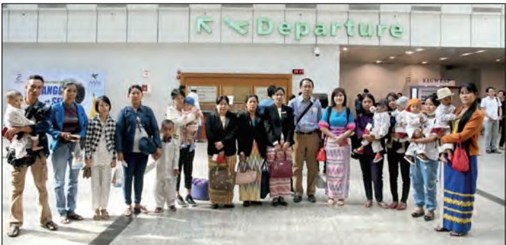
Children diagnosed with congenital heart defects and their families seen at the Yangon International Airport before departing for China.