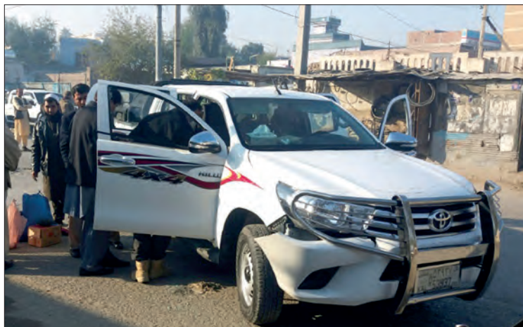
Tetsu Nakamura, 73, who headed Peace Japan Medical Services, died from wounds sustained when gunmen attacked his vehicle in Jalalabad.