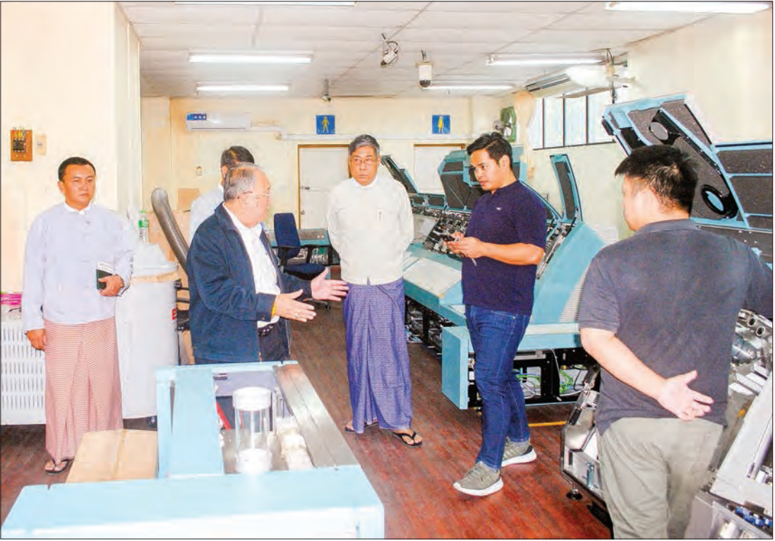
CBM Governor U Kyaw Kyaw Maung inspects bank note processing machines in Yangon.

GOVERNOR of the Central Bank of Myanmar U Kyaw Kyaw Maung inspected the installation of German made bank note processing machines at the Central Bank of Myanmar (Yangon branch) in Yangon in yesterday.