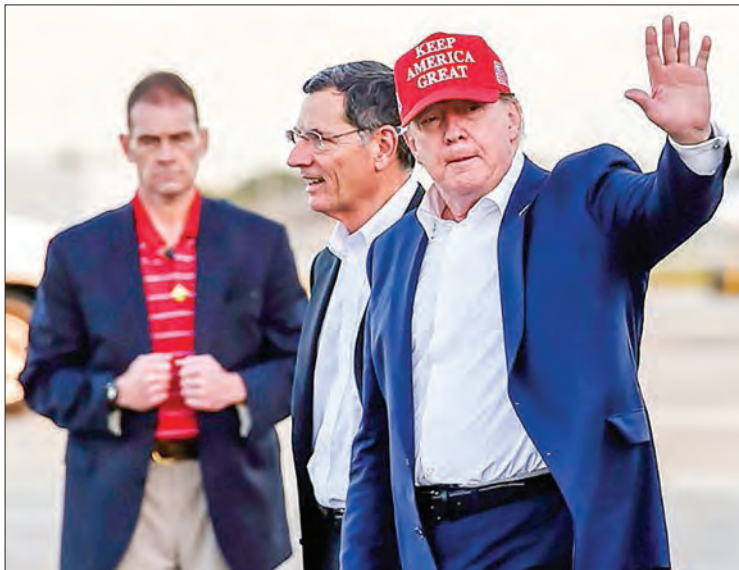
US President Donald Trump steps off Air Force One upon arrival in West Palm Beach, Florida, in November 2019.

"We cannot fairly be expected to participate in a hearing while the witnesses are yet to be named and while it remains unclear whether the Judiciary Committee will afford the President a fair process through additional hearings," White House counsel Pat Cipollone wrote in a letter to Jerry Nadler, the Democratic chairman of the House Judiciary