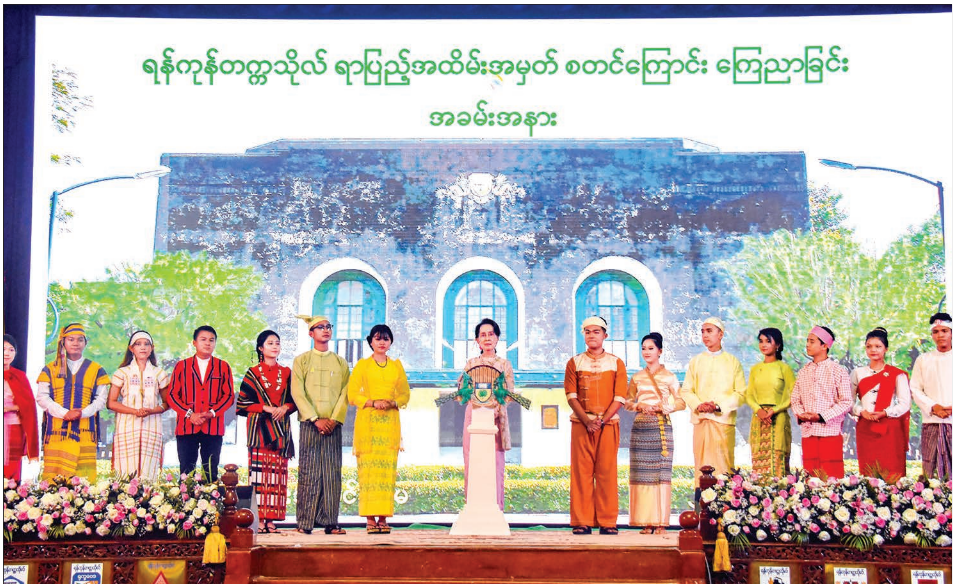
State Counsellor Daw Aung San Suu Kyi opens the University of Yangon's centennial celebration at the convocation hall of the university yesterday.

STATE Counsellor Daw Aung San Suu Kyi attended the grand opening ceremony of University of Yangon's centennial celebrated in its convocation hall in the campus yesterday morning, and she delivered a speech at the event.