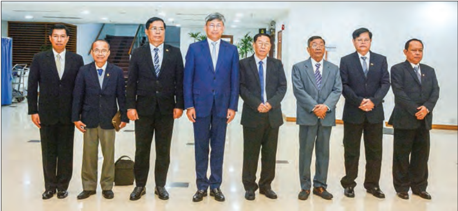
The Myanmar delegation led by Union Election Commission Chairman U Hla Thein is seen before departing for China.

UNION Election Commission U Hla Thein left for the People’s Republic of China on 1 December night as study tour till 6 December on promoting understanding on election system between Myanmar and China. The UEC delegation led by UEC Chairman U Hla Thein was seen off at Yangon International Airport by Ambassador of PRC Mr Chen Hai and officials from UEC office and Yangon Region Sub-Election Commission. UEC Chairman was accompanied by officials from the commission. — MNA (Translated by TTN)