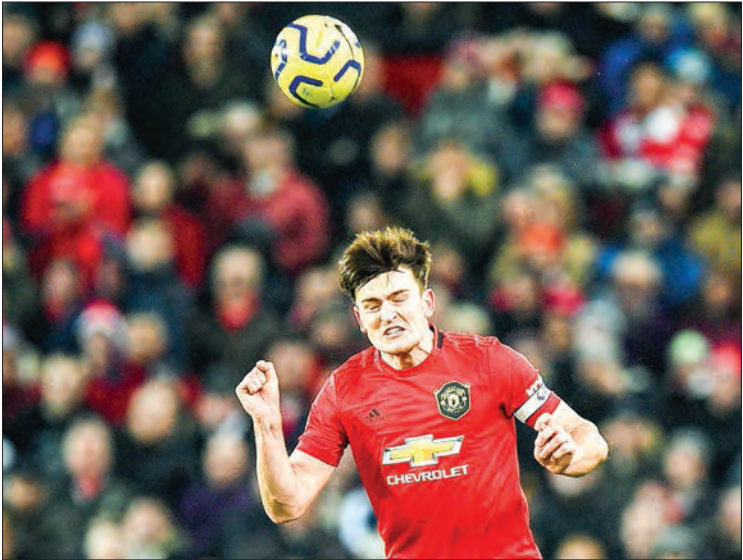
Manchester United defender Harry Maguire in action against Aston Villa.

“We got ourselves in a great position in the second half (against Villa) and again conceded a sloppy goal really,” Maguire told MUTV. “As a defender especially, it’s frustrating,” he added. “We haven’t really conceded many chances or goals prior to the last two games and then we’ve conceded five.”—AFP ■