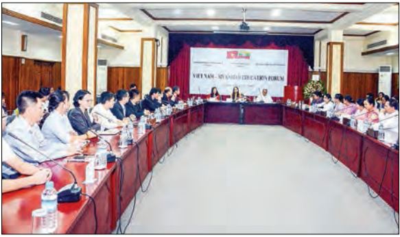
The Viet Nam-Myanmar Education Forum is in progress at the Diamond Jubilee Hall of the Yangon University in Yangon on 2 December.

ORGANIZED by Viet Nam Embassy in Yangon, the Viet Nam-Myanmar Education Forum was held yesterday at the Diamond Jubilee Hall of the Yangon University in Yangon yesterday. The aim of the forum is to widely implement the memorandum of understanding signed by Viet Nam Ministry of Education & Training, and Myanmar Ministry of Education in 2017. During the meeting, they discussed matters related to the businesses in Viet Nam that will give scholarships to the students in Myanmar, scholarship programmes of universities in Viet Nam, the scholarship courses co-assisted with other foreign universities and bilateral cooperation in education sector and Myanmar's education reform process. — MNA (Translated by Kyaw Zin Tun)