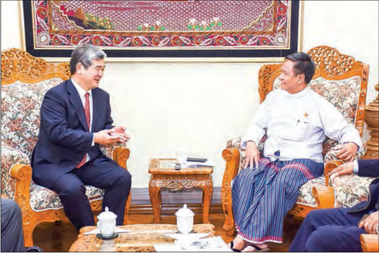
Deputy Commerce Minister U Aung Htoo receives WTO official in Nay Pyi Taw yesterday.