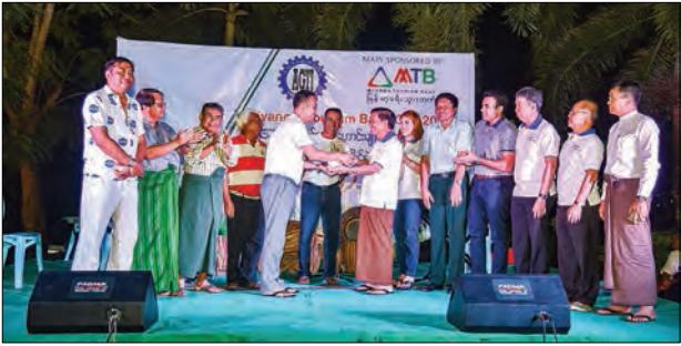
Winners of the Myanmar Tourism Bank Cup 2019 are awarded with prizes at the Myanmar Golf Club in the 9 th Miles, Yangon yesterday.