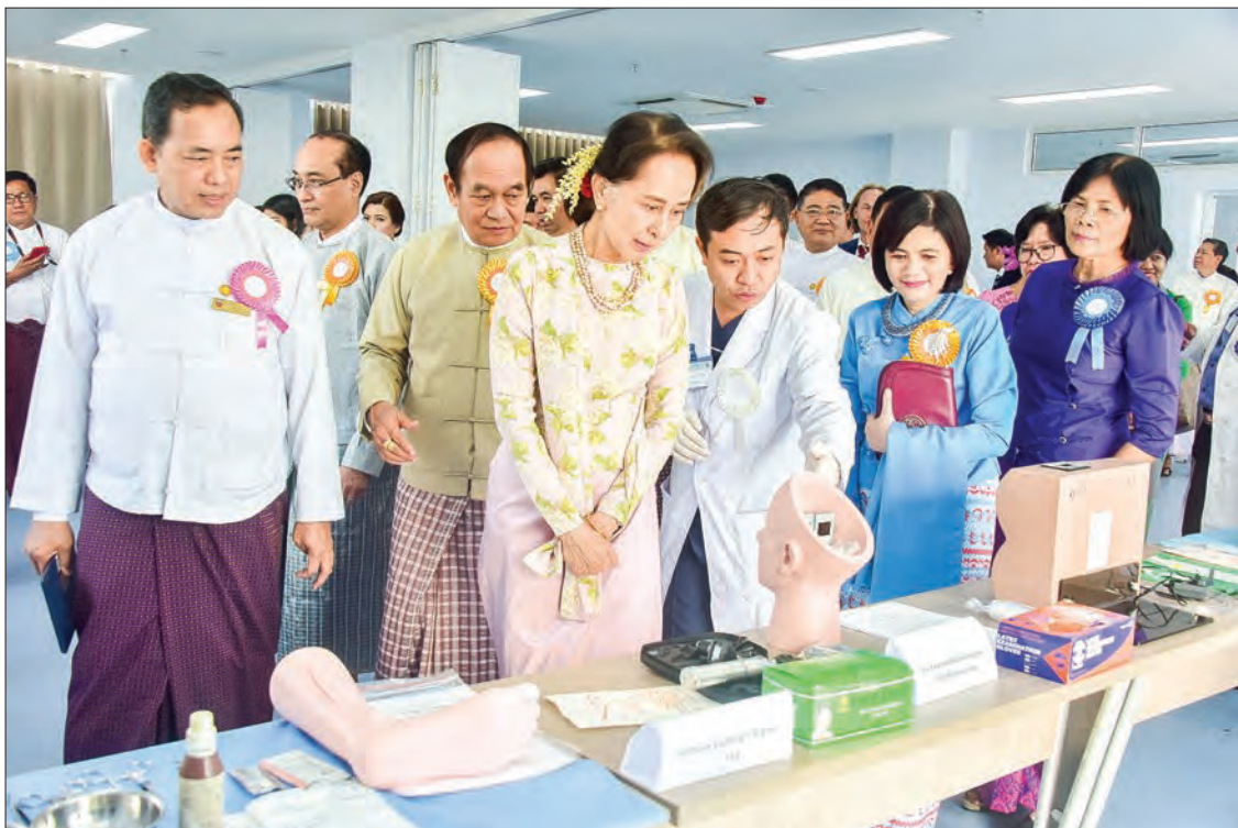
State Counsellor Daw Aung San Suu Kyi observes equipment used for medical skill and simulation.

In research works, medical universities as well as other universities in our country are to use modern and developed lab and equipment. Much need to be done toward development in research. The State was providing more and more funds for development in research works. Starting from fiscal year 2017-2018, the Ministry of Health and Sports was specially provided with more funds. At the moment, an increasing numbers of health care personnel were reading papers and making presentations at international research conferences. Post graduate, master and doctorate students need to make more efforts toward producing more international level research papers. They need to be more involved in international medical area.