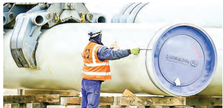
The Nord Stream 2 gas pipeline is likely to make western Europe more dependent on Russian natural gas, critics say. PHOTO: AFP

"This is important for our country, this is important for China," he said ahead of the launch, stressing that the project would create jobs and infrastructure in Russia's Far East. — AFP ■