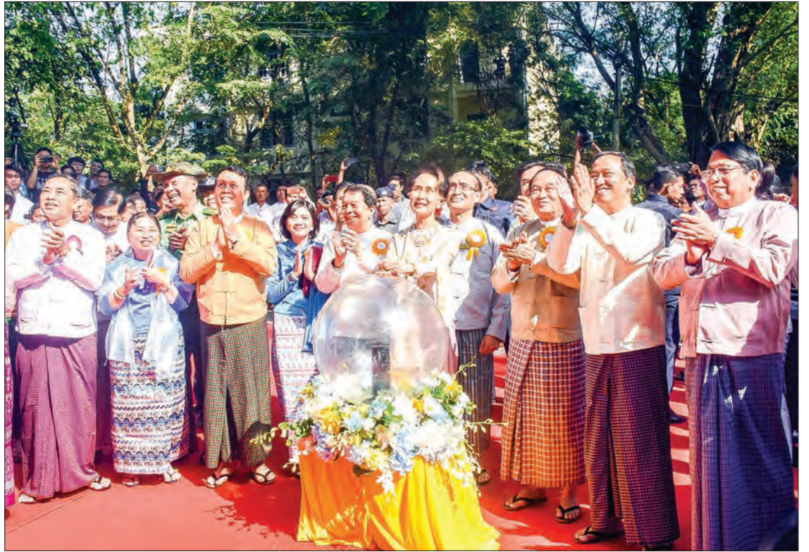
State Counsellor Daw Aung San Suu Kyi formally opens the Medical Skill, Simulation and Research Centre at the University of Medicine-1 in Yangon.

S TATE Counsellor Daw Aung San Suu Kyi attended and addressed an opening ceremony of the Medical Skill, Simulation and Research Center held in the compound of University of Medicine 1, Yangon yesterday afternoon.