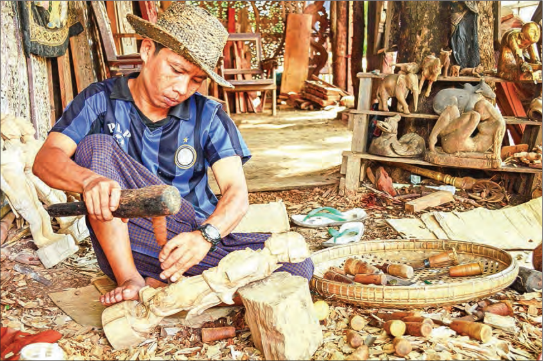
A man carves a wooden statue in Mandalay.

Mandalay is welcoming more tourists year over year. Once the high season starts, the Mandalay carving market teems with buyers, according to shops selling sculptures. Myanmar sculptures are popular in China, Thailand, and Laos. Carvings, priced K10,000-100,000, depending on the quality of wood, size, and design, are selling well. — Min Htet Aung (Mandalay Sub-Printing House) (Translated by Ei Myat Mon)