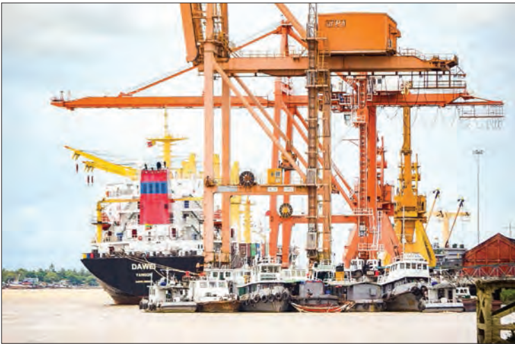
A cargo ship loading containers at a shipping container port in Yangon.