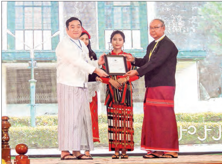
Amyotha Hluttaw Speaker Mahn Win Khaing Than presents a certificate of honour to a dignitary.