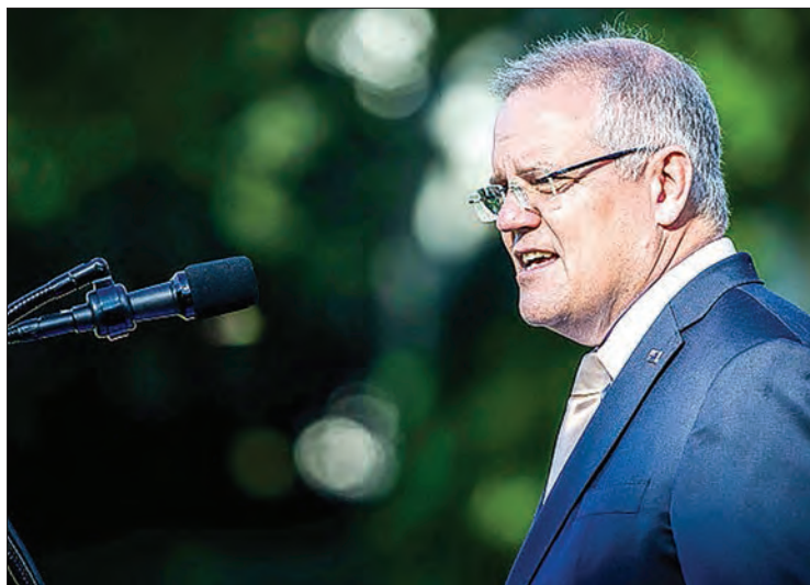
Australian Prime Minister Scott Morrison speaks during an official visit ceremony at the South Lawn of the White House on 20 September 2019 in Washington, DC. Prime Minister Morrison will participate in an Oval Office meeting, a joint news conference, and a state dinner during his state visit in Washington.

ization Nine, Bo “Nick” Zhao, a Melbourne-based luxury car dealer was approached by a Chinese intelligence group offering AU$1 million to fund his campaign for a lower house seat in last May’s general election.