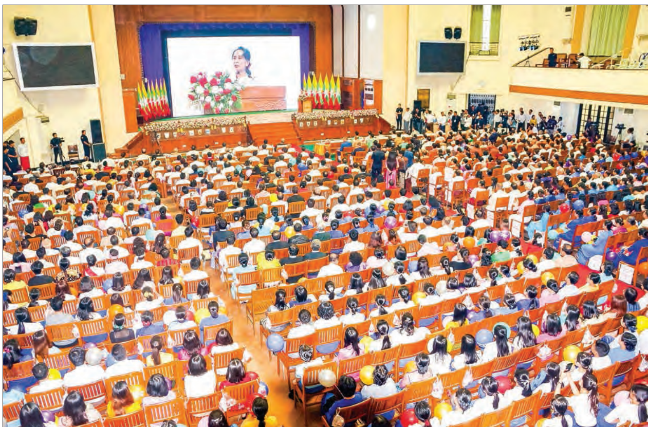
State Counsellor Daw Aung San Suu Kyi delivers the address at the grand opening ceremony of University of Yangon's centennial celebration at the university's convocation hall yesterday.

State Counsellor, a documentary video of University of Yangon's history was screened, and she greeted the attendees at the event.