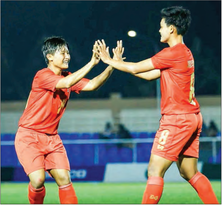
Myanmar women’s football players celebrate after they scored a goal against Malaysian team in the 30 th South East Asian Games yesterday.