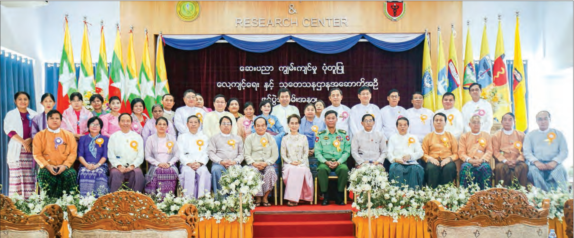
State Counsellor Daw Aung San Suu Kyi poses for photo together with dignitaries at the ceremony to open the Medical Skill, Simulation and Research Center in Yangon.

Medical and related universities ought to conduct more medical research with Medical Research Department and National Laboratory. Here they need not be down hearted. If we are left behind, put more efforts with a belief that there are more roads left to be taken up ahead. Learning and practicing medical expertise was not as easy as thought. There were situations where a patients feeling pain and fatigue need to be taken into consideration. In international workshops and discussion, mannequins, donated body parts, medicine and equipments were used to simulate real life situations. This was similar to using simulators to train pilots with