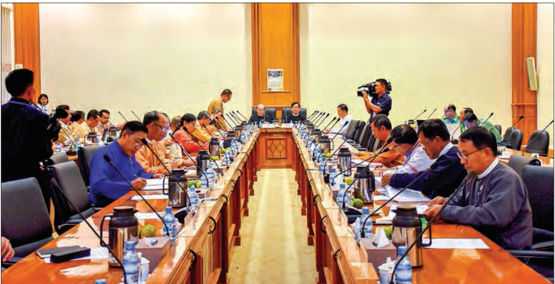
Joint Committee on Amending the 2008 Constitution holds its meeting 63/2019 at the Pyidaungsu Hluttaw Building D in Nay Pyi Taw yesterday.