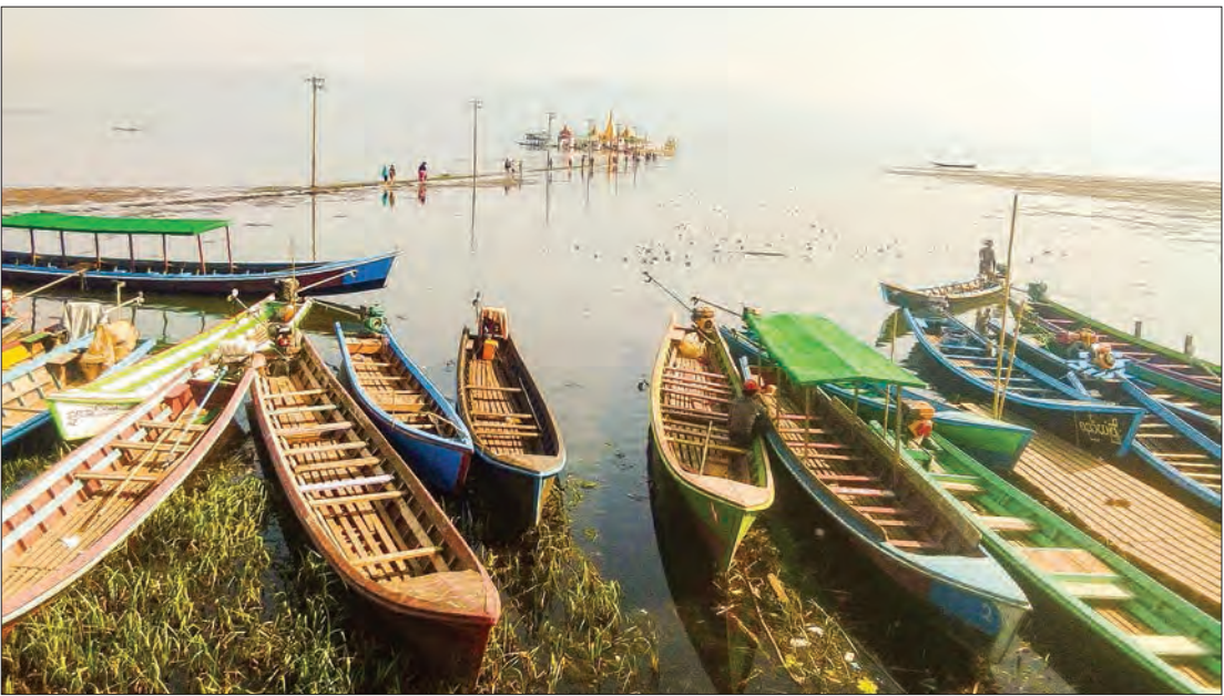
Indawgyi lake is one of the tourist attractions in upper Myanmar.