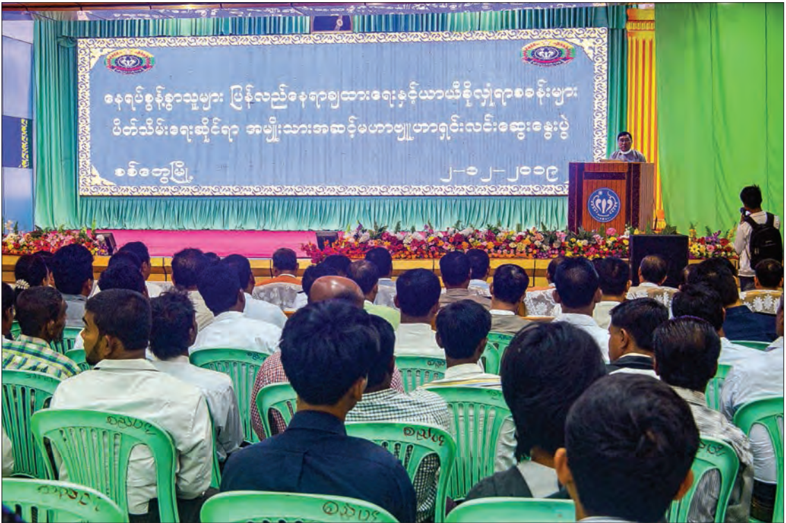
Union Minister Dr Win Myat Aye explains strategy for resettlement of IDPs and closing IDP Camps at a ceremony in Sittway, Rakhine State.

The Ministry of Social Welfare, Relief and Resettlement is taking up resettlement and socioeconomic development committee out of the four work committees for peace and development in Rakhine State.