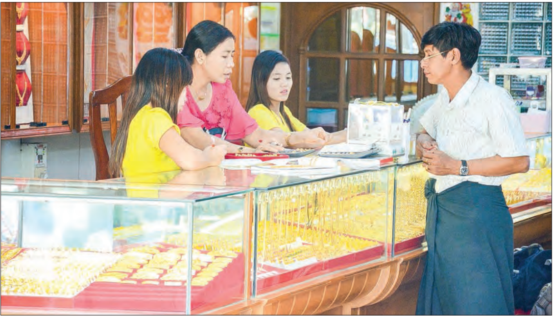
Sales girls show gold jewellery to a customer at a shop in downtown.

“Despite the price drop, regular trading is being witnessed in the domestic market. About