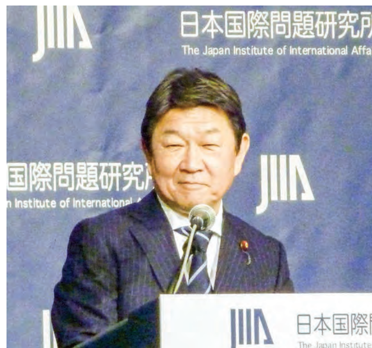
Foreign Minister Toshimitsu Motegi.

China will take further necessary actions in accordance with the development of the situation to firmly defend the stability and prosperity of Hong Kong and safeguard national sovereignty, security and development interests, she said. — Xinhua ■