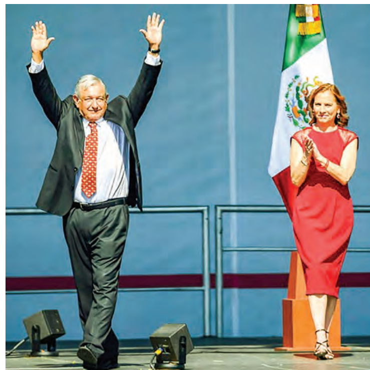
Mexican President Andres Manuel Lopez Obrador (left) waves next to his wife Beatriz Gutierrez Muller during a rally marking his first year in office at the Zocalo square in Mexico City on 1 December 2019.

MEXICO CITY (Mexico) — Mexican president Andres Manuel Lopez Obrador said Sunday that former Bolivian leader Evo Morales was the "victim of a coup d'etat."