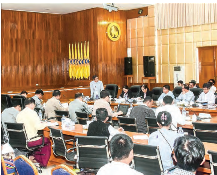
CBM Deputy Governor U Bo Bo Nge makes key-note remarks at the workshop on the rule for outward remittances businesses.