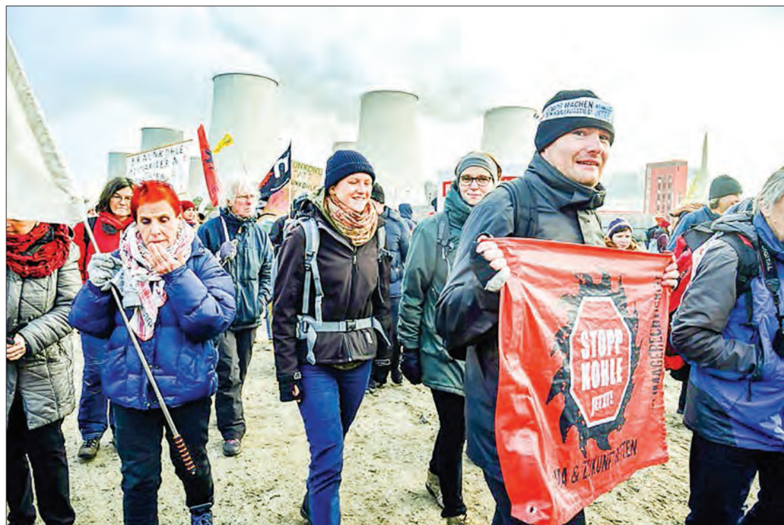
Campaigners say the government's plans to phase out coal by 2038 announced this year do not go far enough.

SPREMBERG — Thousands of activists on Saturday occupied several opencast coal mines in eastern Germany, seeking to put pressure on the government to phase out the fossil fuel -- a divisive issue in the country's rust belt.