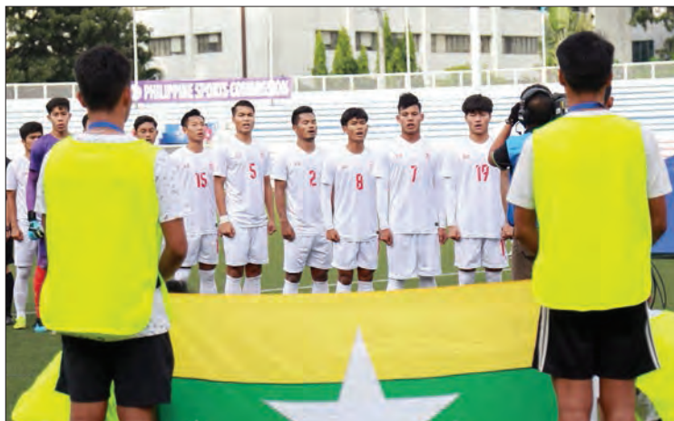
The Myanmar U-22 men's football team sing the national anthem ahead of their match against Timor Leste on 29 November at the Rizal Memorial Stadium in Manila, the Philippines.

THE U-22 men's national football teams of Myanmar and Cambodia will play a decisive Group A match in the men's football competition of the South East Asian Games today at the Binan Football Stadium in Binan, the Philippines.