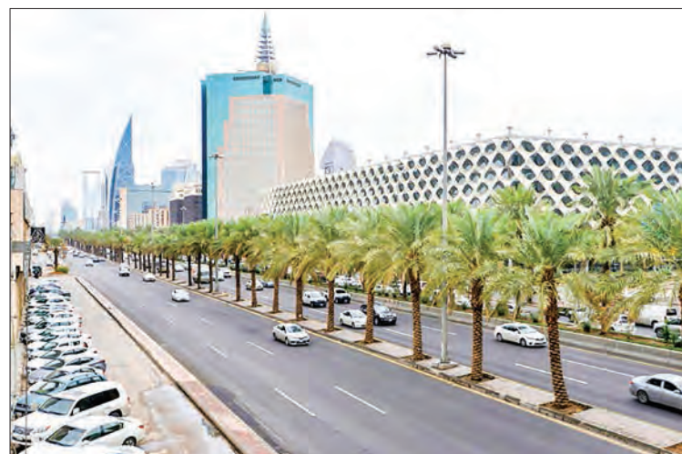
The G20 presidency, which Saudi Arabia takes over from Japan, will see it host world leaders for a global summit in its capital next November 21-22.

“This presidency... will be challenged by a central paradox: global risks like climate change, demographic developments, such as low birth rates, rising life expectancy and aging societies... but rising populism and nationalism are preventing progress at the multilateral level.”—AFP