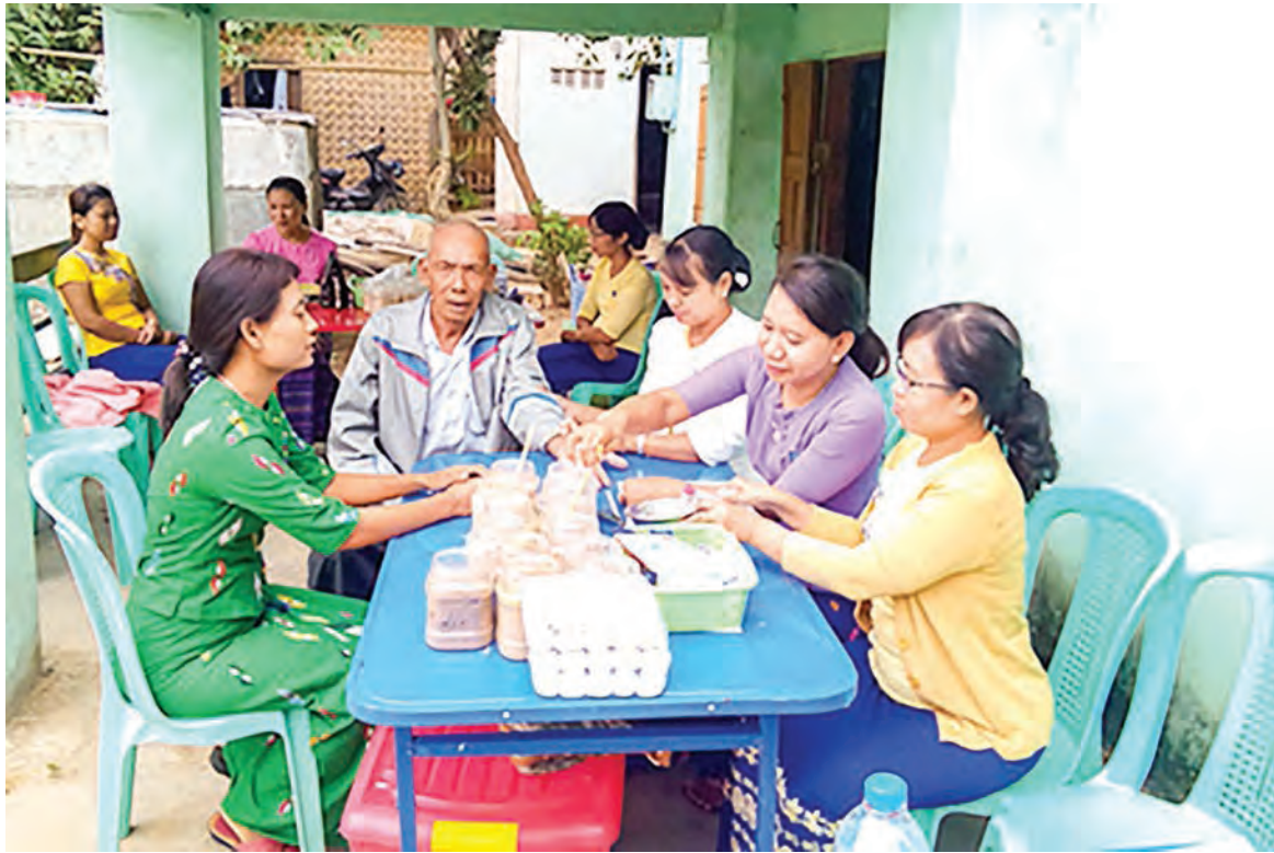
Traditional medicine practitioners provide health care to public.

It cannot be denied that there are some limitations in TM to explain every single thing under scientific terms as some practices go beyond the scientific field. But there are still many practices needed to promote into EBP for those clinical experi-