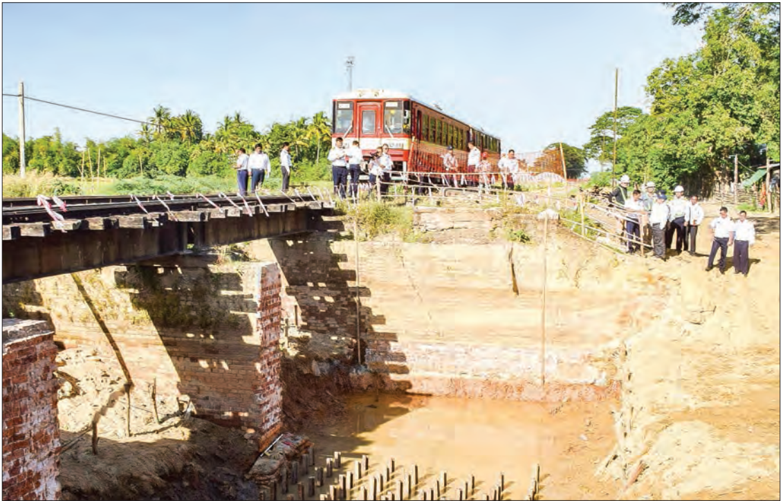
Union Minister U Thant Sin Maung and party inspect the bridge construction between Swa and Konegyi stations yesterday.

works with the staff members and local companies which are working with the foreign counterparts in the project. The Union Minister and party then arrived at Phyu Creek Bridge 203 and inspected soil preparations under the bridge. They also looked into soil tests near the milepost 95/5-6. They also inspected Bridge 83 and 79 between Pynpongyi and Phayagyi stations, and a railway section near Htoneygi station. — MNA ■ (Translated by Aung Khin)