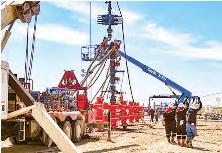
Drilling work is under way in the U.S. state of Texas to produce shale oil as seen in this file photo taken on March 13, 2014.

The growing role of the United States as a global energy supplier would exert downward pressure on oil prices. According to the data, U.S. oil exports