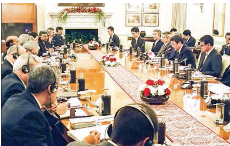
Japan and India agreed Saturday to conduct their first-ever joint fighter aircraft exercise in Japan.

NEW DELHI—Japan and India agreed Saturday to conduct their first-ever joint fighter aircraft exercise in Japan as part of efforts to promote bilateral security cooperation in the