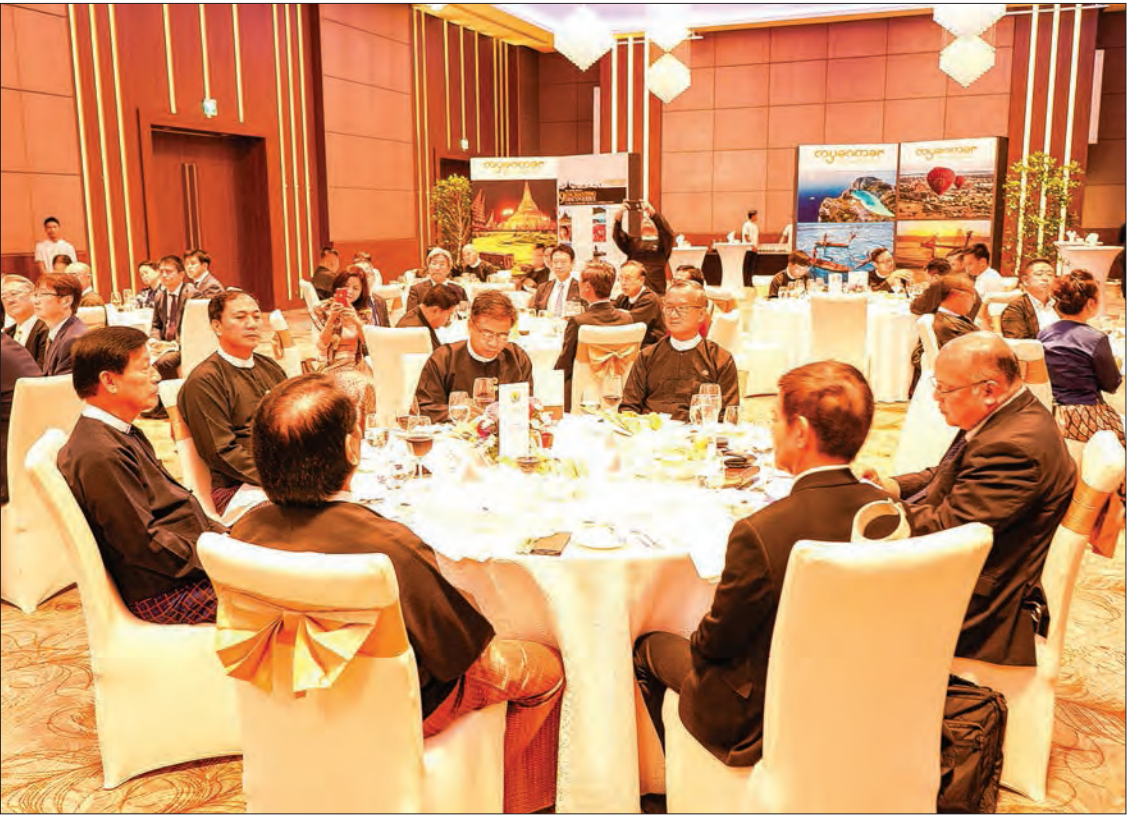
The welcoming dinner being hosted to honour the representatives of JATA Fam Trip from Japan.