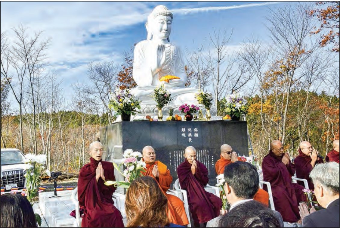
A Buddha statue donated by a company in Myanmar to Minamisanriku, Miyagi Prefecture, as pictured on Nov. 25, 2019.

SENDAI — A consecration ceremony was held on recently for a Buddha statue donated by Myanmar for victims of the devastating 2011 earthquake and tsunami that hit northeastern Japan. Monks from the Southeast Asian country, which also suffered damage from the 2004 Indian Ocean tsunami, offered prayers in front of the 5-meter-high marble statue on 25 November. It was placed last month on a hill overlooking Shizugawa Bay in the town of Minamisanriku, Miyagi Prefecture. The hill is in a forest park created by the operator of Minami Sanriku Hotel Kanyo to commemorate the disaster that left more than 15,000 people dead. A Myanmar trading house gave the statue to the hotel op-