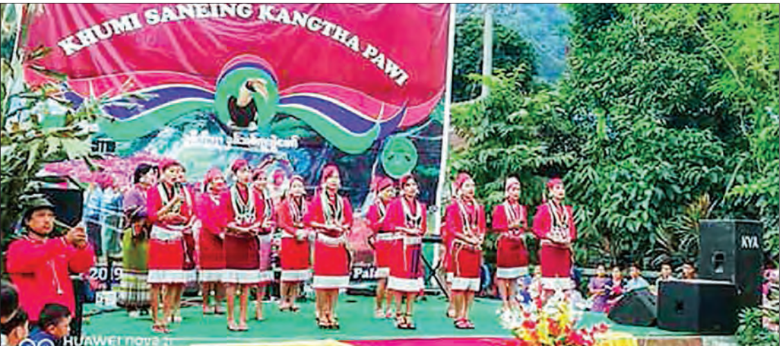
Khumi ethnic tribe perform with traditional dances and songs at the Khumi New Year festival in Paletwa yesterday.