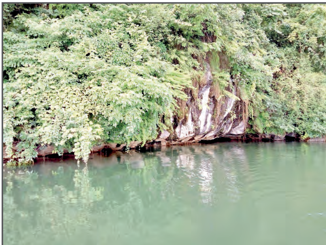
Saddan Lake.

seasons, as there is leakage of some water in the Cave, it is humid in it, or otherwise in summer seasons.