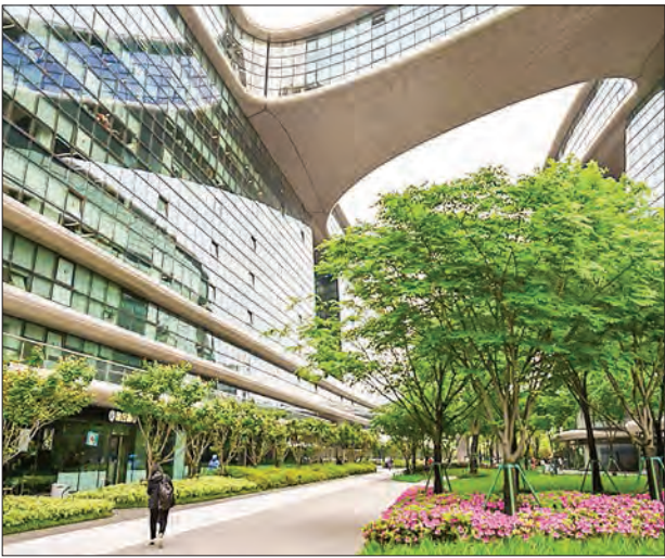
Jane Sun wants to drive female representation across the 45,000-strong Trip.com workforce.

As a working mother, she understands the challenges faced by many women in China, whose participation in the labour force has been falling for decades. She runs China's largest online tourism agency and is one of the country's business elite: a Silicon Valley returnee who moves in friendship circles