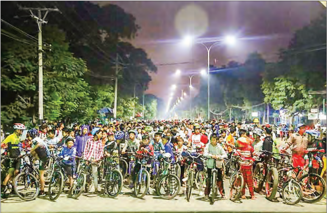
Young cyclists take part in the mass cycling event in Monywa on 1 December.

“The cycling event also includes 700 lucky draw programs for participants,” an event organizer said.