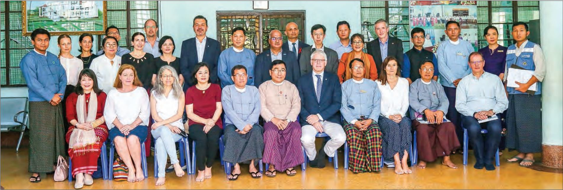
Union Minister Dr Win Myat Aye, officials and representatives from UN agencies pose for a group photo at the Yangon Region Branch of Social Welfare Department yesterday.