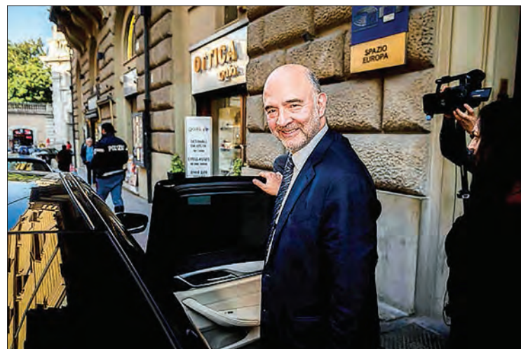
European Commissioner for Economic Affairs Pierre Moscovici leaves the press conference at the headquarters of the European Commission during the two-day visit to Italy, on November 22, 2019, in Rome. Italy.

BRUSSELS—The European Commission’s outgoing finance chief has called for reviving European initiatives to introduce a digital tax for the region if attempts to find a global solution fail.