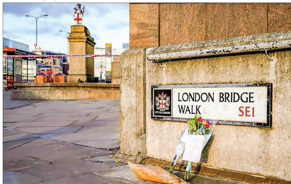
The incident comes two years after Islamist extremists in a van ploughed into pedestrians on the bridge before attacking people at random with knives.

The incident comes two years after Islamist extremists in a van ploughed into pedestrians on the bridge before attacking people at random with knives, killing eight people and wounding 48.—AFP ■