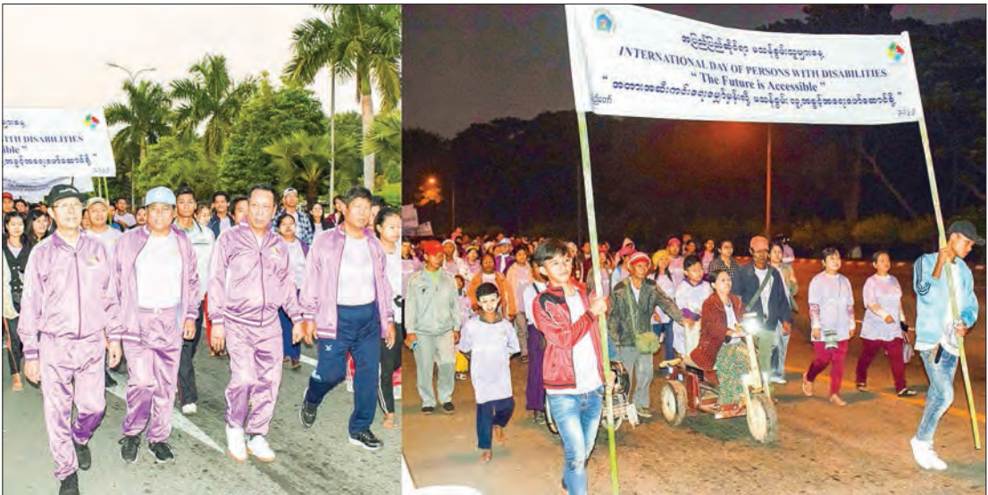
The mass walk event being held in Nay Pyi Taw yesterday morning to mark the 2019 International Day of People with Disabilities.

The event was taken part by Nay Pyi Taw Council Chairman Dr Myo Aung, and its members, Deputy Minister for Social Welfares, Relief and Resettlement U Soe Aung, departmental staff, the affiliated