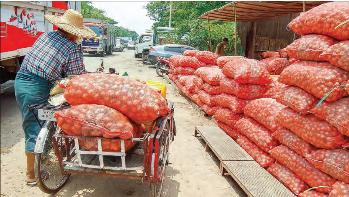
A man carrying sacks of onion near a warehouse in Yangon.

DESPITE the surge in onion prices in the local market, onion imports will not be allowed during harvest time, said Deputy Minister for Commerce U Aung Htoo.