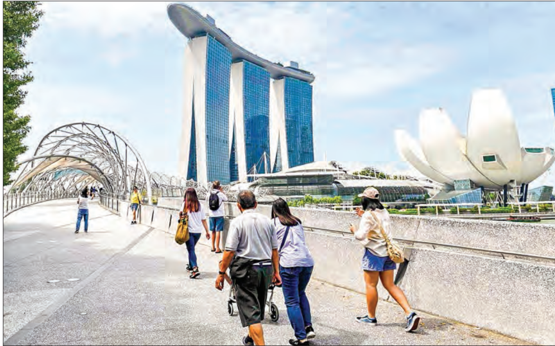
The Singapore government has ordered Facebook to issue a correction notice on an anti-government website's page after the site's editor remained defiant over an article it posted to the social networking site earlier this month.

The so-called Targeted Correction Direction, allows