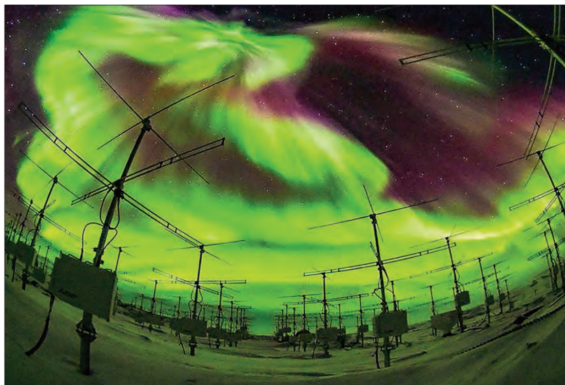
The PANSY radar is an active phased array of 1045 Yagi antennas.

Using the Program of the Antarctic Syowa Mesosphere-Stratosphere-Troposphere/Incoherent Scatter (PANSY) radar, the largest and fine-resolution atmospheric radar in the Antarctic, researchers performed the first incoherent scatter radar observations in the southern hemisphere in 2015. — ANI