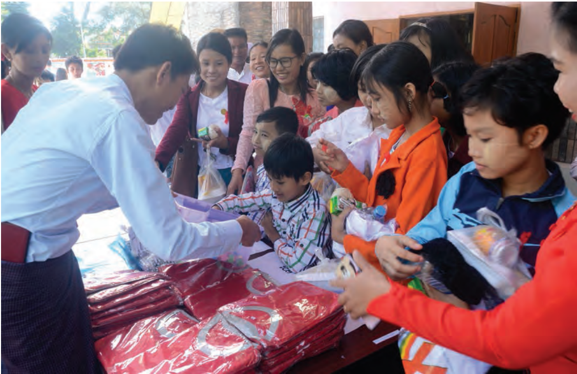
Children receive gift at the ceremony to mark the World AIDS Day in Sittway.