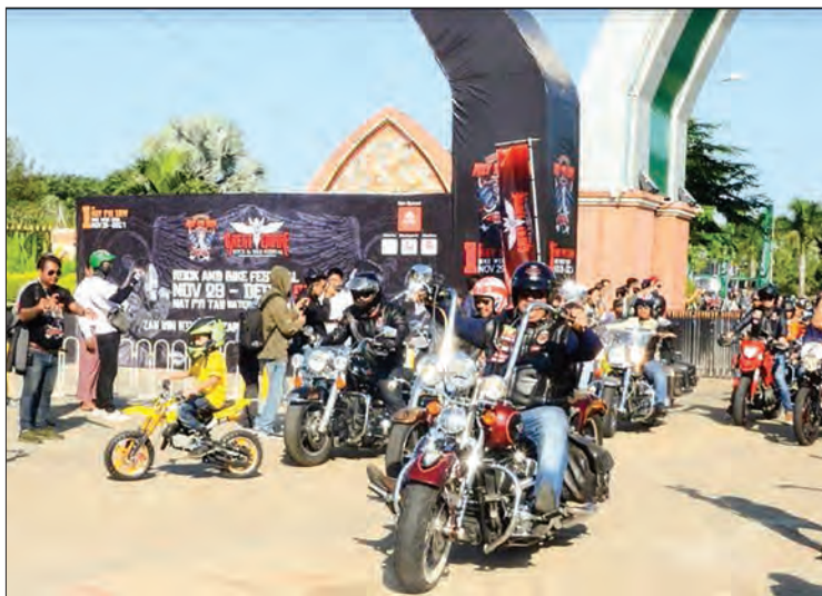
Bikers participate in the Nay Pyi Taw Bike Week 2019 event.

"This event is a gathering of motorcycle lovers from motorcycle clubs across the country. About 3,000 motorcyclists from over 100 motorcycle clubs participated in the festival. The