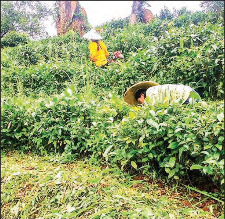
Farmers picking tea leaves in a farm in northern Shan State.

es, agro products, bamboo and rattan finished products, forestry products, apparels and finished industrial goods. Nevertheless, EU imposed three-year tariff on indica rice (long-grain rice) imported from Myanmar and Cambodia starting from 18 January 2019. Trade value with Germany was registered at $373 million in the past mini-budget period (April-September 2018), $584 million in 2017-2018 FY, $342 million in 2016-2017 FY and $153 million in FY 2015-16 respectively.—GNLM (Translated by EMM)