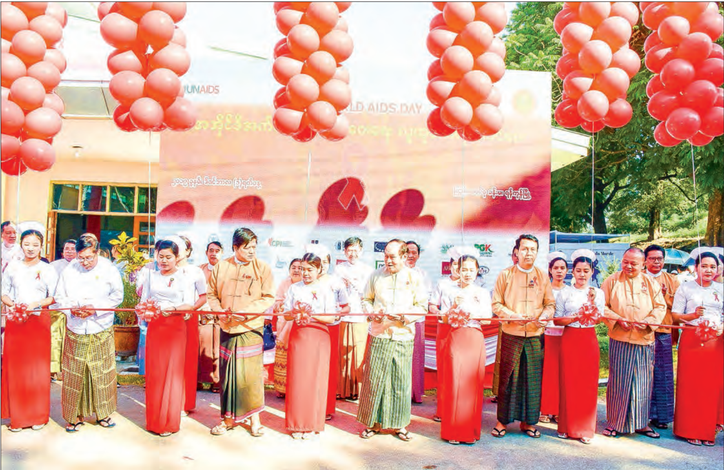
Union Minister Dr Myint Htwe and dignitaries open the World AIDS Day 2019 celebration in Yangon yesterday.

UNION Minister for Health and Sports Dr Myint Htwe attended the celebration of the World AIDS Day 2019, taken place at the Union Hall in Kyaik-kasan Sports Ground in Yangon yesterday morning. At the event, the Union Minister said Myanmar has adopted the National Strategic Plan for HIV/AIDS (2016-2020), and preparing for extending of the plan to 2021-2025 period for prevention and treatments