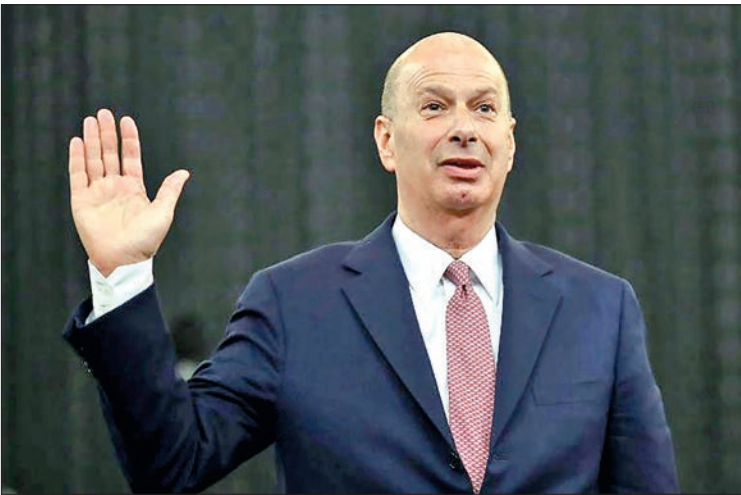
FILE PHOTO: Gordon Sondland, the US ambassador to the European Union, testifies before the House Intelligence Committee.

"Without a majority, the nightmare continues. All other MPs will gang together to stop Brexit and give EU citizens the vote," Cummings added.—AFP ■