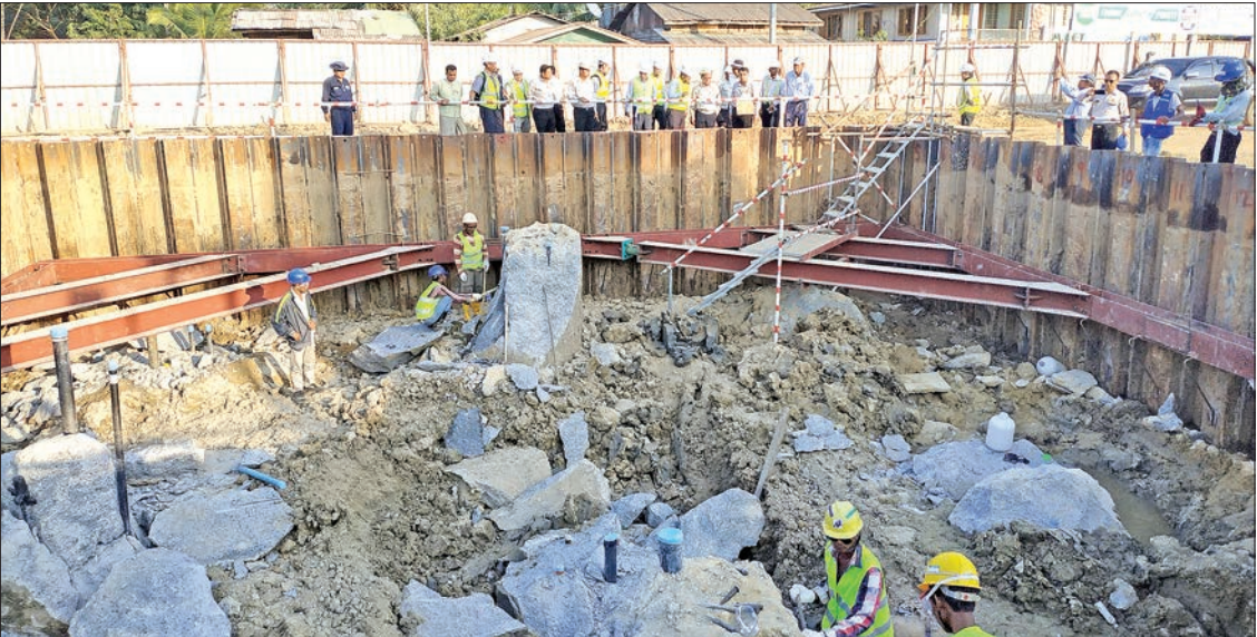
Union Minister U Han Zaw inspects the construction site of the project area of the Korea-Myanmar Friendship Dala Bridge yesterday.

in the evening of 24 November, where ROK President Mr Moon Jae-in delivered the keynote speech. The ceremony was attended by prime ministers from ASEAN member countries, government ministers and deputy ministers, and mayors. The Union Minister attended the ministerial meeting at Park Hyatt Hotel on the morning of 25 November and explained Myanmar's smart city strategy and future cooperation with ASEAN, ROK and other affiliated organizations. A decision was also made to form a consultative body at the ministerial level between South Korea and the ASEAN member states for ensuring sustainable cooperation in the smart city sector. Next, the Union Minister visited the ASEAN-ROK Smart City Fair 2019 at the Busan Exhibition and Convention Centre (BEXCO) along with representatives from ASEAN member states. Upon arriving at the Myanmar booth, the Union Minister received an explanation from Daw Aye Aye Myint, Deputy Director-General