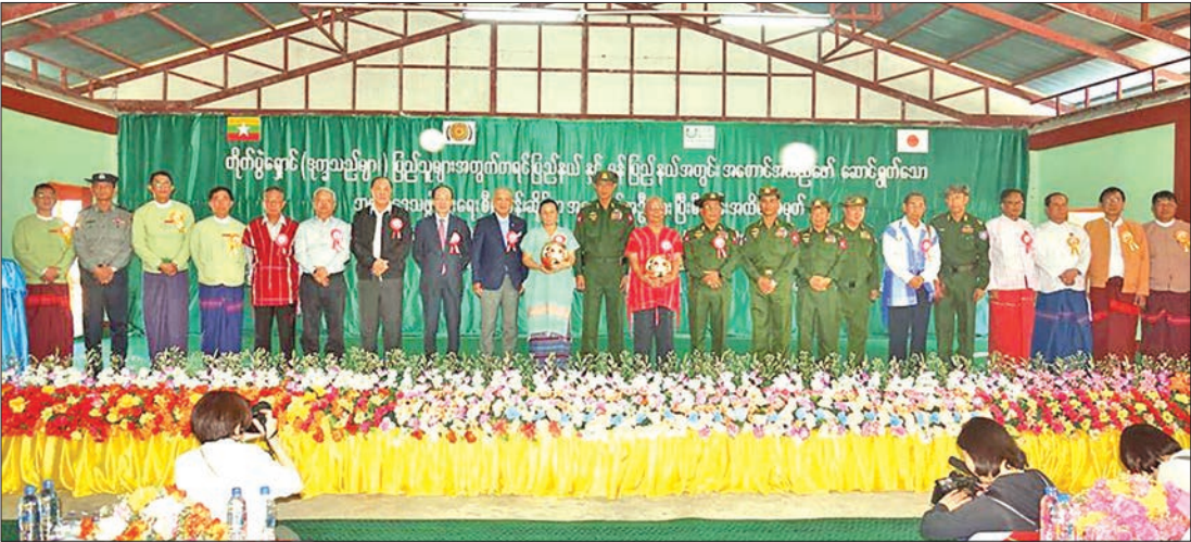
Union Minister Lt-Gen Ye Aung attends a completion ceremony of all-round development project buildings in Kayin and Mon states in Myawady Township, Kayin State.

UNION MINISTER for Border Affairs Lt-Gen Ye Aung attended a completion ceremony of all-round development project buildings in Kayin and Mon states held at Kayin State Myawady Township Lay Ke Kaw Town Duplaya High School hall yesterday afternoon.