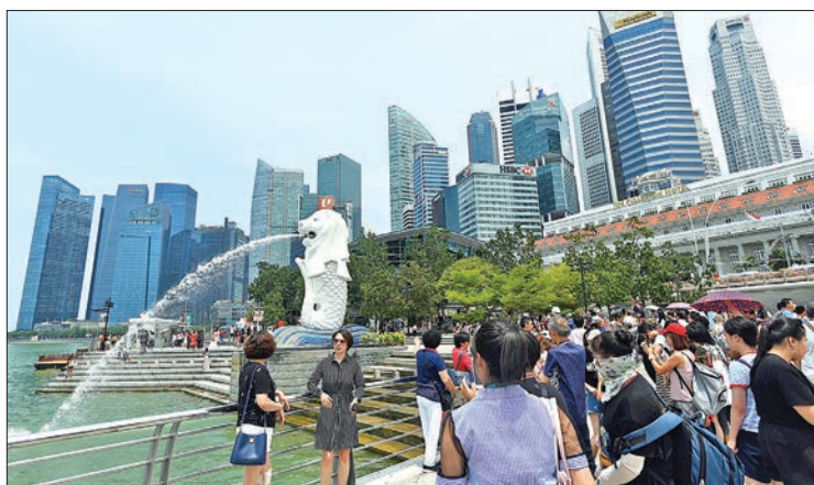
Visitors at the Merlion park, Singapore, 13 August 13, 2019.

The Protection from Online Falsehoods and Manipulation Act