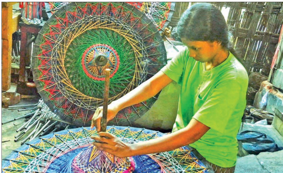
A woman is making one of the colorful Pathein parasol which is made from bamboo and fabric at an industry in Mahaaungmye Township, Mandalay Region.

Traditional umbrellas are made completely by hand. First, bamboos are trimmed and dipped into water. Then, threads are connected to the trimmed bamboos and cloths are fixed onto the shaped bamboos with glue paste and then, the umbrellas are dried