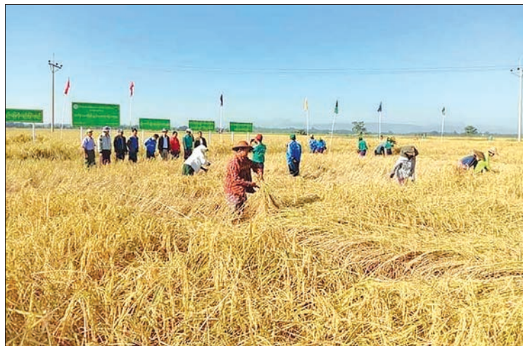
Farmers harvest paddy in Indaw Township.

The demonstration and harvesting were attended by