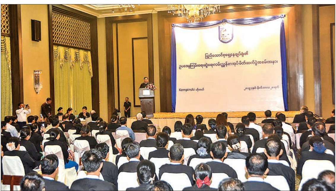
Union Attorney-General U Tun Tun Oo addresses the launching ceremony for Union Attorney-General's Office introduced a guidebook for drafting bills in Nay Pyi Taw yesterday.