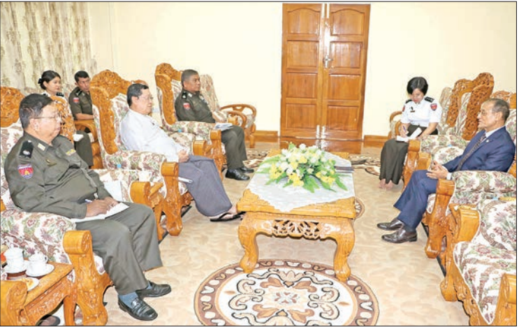
Union Minister U Thein Swe meets with Ambassador of Nepal Mr Bhim K Udas in Nay Pyi Taw yesterday.