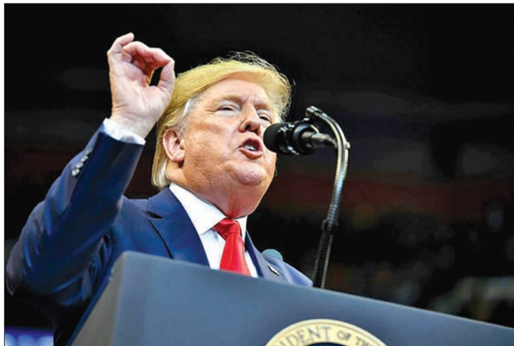
China said it would respond with ‘firm countermeasures’ after Donald Trump signed into law a bill recognising Hong Kong’s rights.

Trump on Wednesday put his name to the Hong Kong Human Rights and Democracy Act,