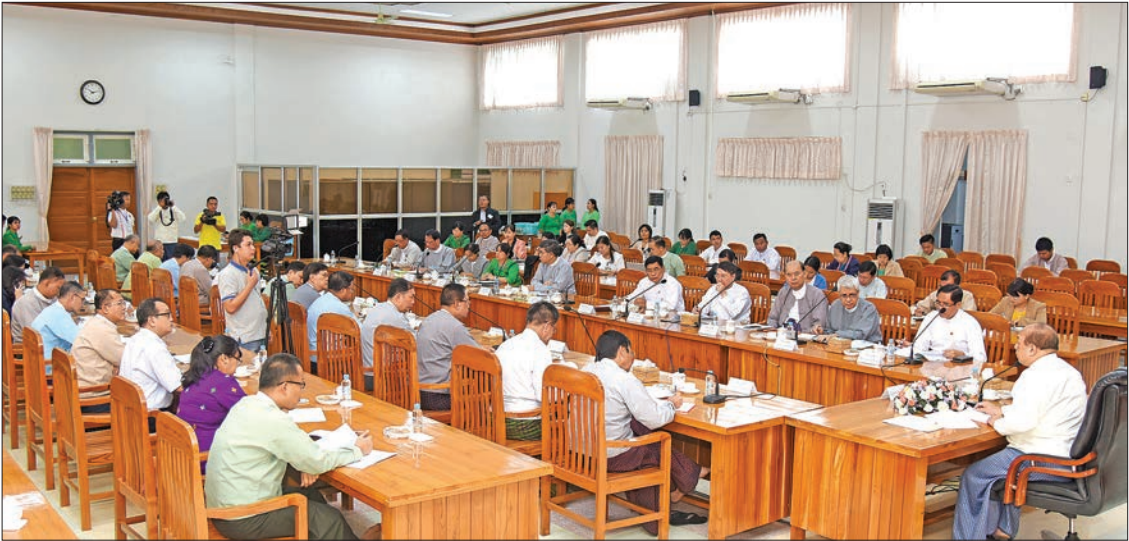
Union Minister for Investment and Foreign Economic Relations U Thaung Tun attends the 2 nd meeting of Investment Promotion Committee (IPC) in Nay Pyi Taw.

THE Investment Promotion Committee (IPC), which was set up by the Ministry of Investment and Foreign Economic Relations (MIFER), convened its second meeting yesterday at its office in Nay Pyi Taw. The meeting was attended by U Thaung Tun, Union Minister for Investment and Foreign Economic Relations and chairman of the IPC, U Aung Hla Tun, Deputy Minister for Information, U Hla Kyaw, Deputy Minister for Agriculture, Livestock and Irrigation, U Kyaw Myo, Deputy Minister for Transport and Communications, U Aung Htoo, Deputy Minister for Commerce, U Kyaw Lin, Deputy Minister for Construction, U Khin Mg Win, Deputy Minister for Electricity and Energy, U Win Maw Tun, Deputy Minister for Educa-