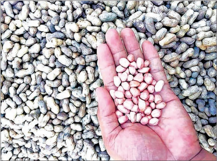
A man shows some of the white peanut in Monywa market.

ALTHOUGH the white peanut market receives China’s high demands, the prices are still freezing in Monywa market according to U Thein Oo, an owner of Myanmar Thein Depot. “Currently, the price of peanuts has decreased to low price and the peanuts in the market are from ChaungU, Myinmu, and Myaung townships. The old peanuts from Budalin, Tabayin and Kani townships fetch K2,800 per viss (a viss equals 1.6 kg) but they are currently out of stock in Monywa market. The new peanut ranges K3,000 per viss in current market. Moreover, this new peanut have received the high demands due to the quality”, said U Thein Oo. The white and red peanuts are mainly exported to China market because they are widely used for food businesses. As the peanuts are available every season, the price fluctuations have occurred among the commodity depot depending on the qualities.