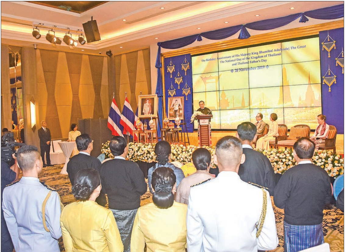
Union Minister U Kyaw Tint Swe addresses the celebration to mark the National Day of the Kingdom of Thailand and Thailand Father's Day in Nay Pyi Taw yesterday.

video about friendship and cooperation between Myanmar and Thailand was shown and the ambassador hosted a reception with Thai food to mark the day. The reception was also attended by Union Ministers U Win Khaing, Dr Myint Htwe and U Kyaw Tin, Chief of General Staff (Army, Navy and Air) General Mya Tun Oo, senior military officers, Commander of Nay Pyi Taw Command, deputy ministers, permanent secretaries, departmental heads, ambassadors, diplomats and staff of the Embassy of Thailand and guests. —MNA (Translated by Kyaw Zin Lin)