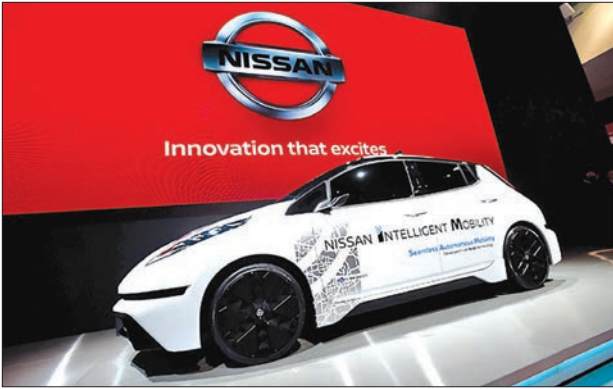
A Nissan Leaf, an electric vehicle is displayed at the Nissan Booth at CES 2017 at the Las Vegas Convention Center on January 5, 2017 in Las Vegas, Nevada.