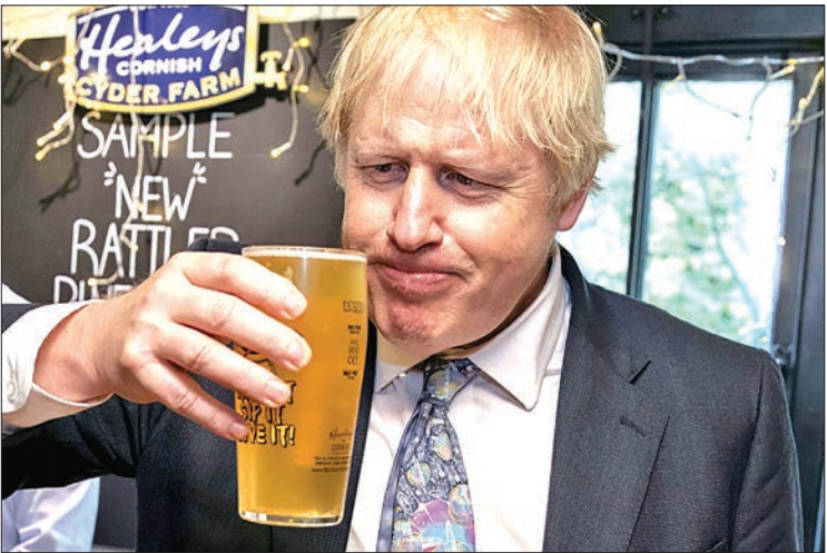
Britain's Prime Minister Boris Johnson is on course for an increased majority in next month's general election, a new poll says.

Dominic Cummings, a Johnson advisor who masterminded the 2016 Brexit campaign, warned just hours before the YouGov poll