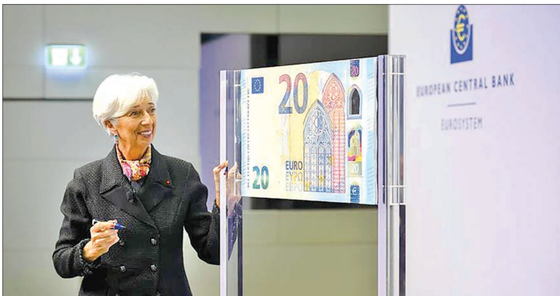
The new president of the European Central Bank (ECB) Christine Lagarde prepares to write her signature on a 20 Euro display banknote at the ECB headquarters in Frankfurt, Germany, 27 November, 2019.

As the ECB’s fourth president, Lagarde embarked on her eight-year term on 1 November, 2019.—Xinhua ■