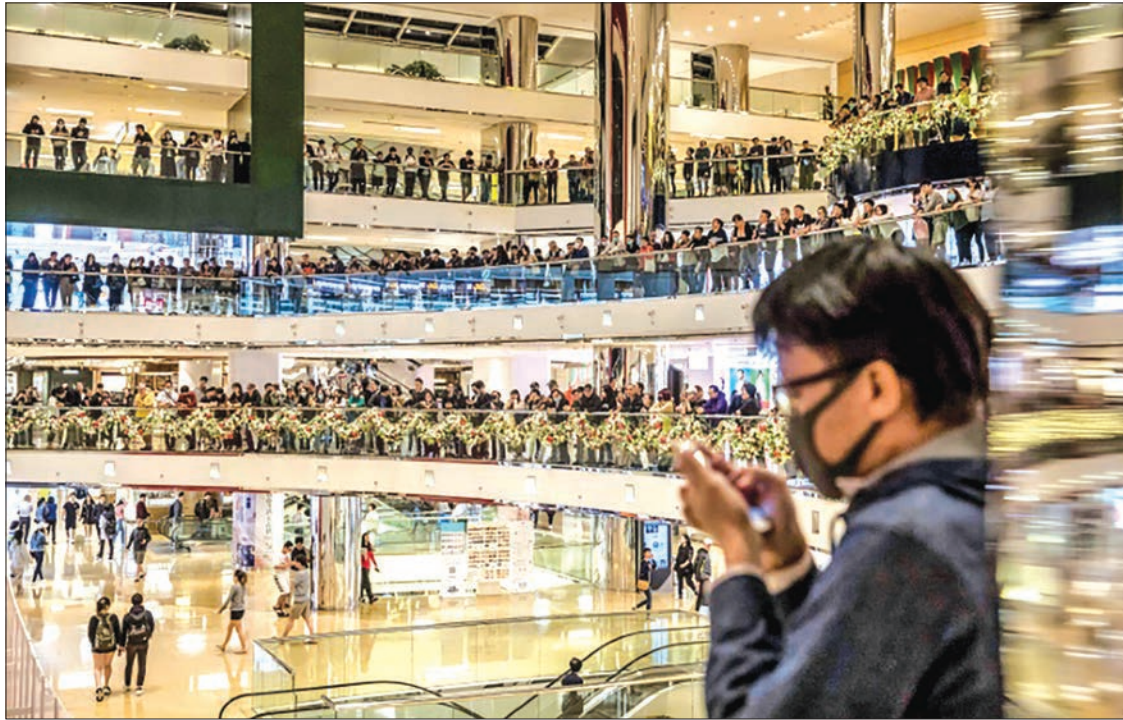
Hong Kong activists have welcomed the US move.

And Beijing’s liaison office in the city condemned Washington’s “disgusting conduct”, saying it would bring “trouble and chaos” to Hong Kong.—AFP ■