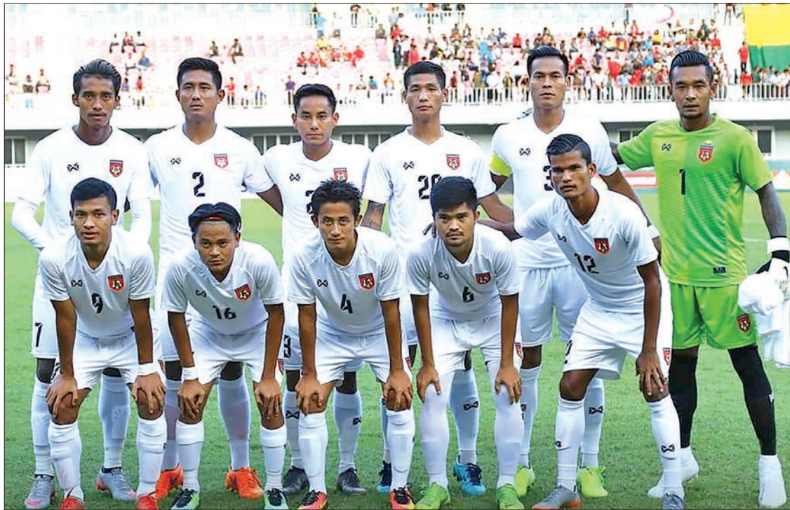
The Myanmar men's national football team seen at an international match.

THE Myanmar men's national football team has climbed 11 spots to 136 from 147 in FIFA rankings, according to a statement released yesterday by FIFA.