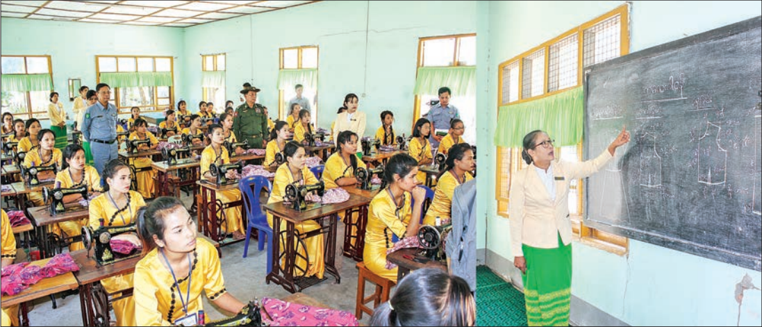
Union Minister Lt-Gen Ye Aung visits the Vocational Training School of Domestic Science for Women in Myawady Township on 27 November

UNION MINISTER for Border Affairs Lieutenant General Ye Aung visited Kayin State and inspected the regional development on 26 and 27 November.