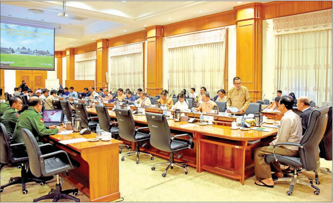
Pyidaungsu Hluttaw Deputy Speaker U Tun Tun Hein attends the meeting of the Joint Committee on Amending the 2008 Constitution 62/2019 in Nay Pyi Taw yesterday.