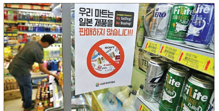
The South Korean boycott campaign has seen Japanese beer exports to the country wiped out, while shipments of instant noodles and sake have also taken a hit.

The historic dispute morphed into a trade spat between the two market economies, as Japan removed South Korea from a so-called “white list” of countries that enjoyed streamlined export control procedures.—AFP ■