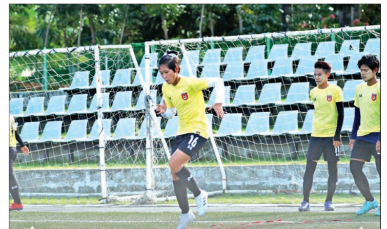
Myanmar women footballers train in Binan ahead of the SEA Games Group A match against Malaysia, which will be played on 2 December.

The last match for Group A between Myanmar and Malaysia will start at 2.30 p.m. Myanmar Standard Time on 2 December at the Binan Stadium in Binan. —Lynn Thit (Tgi)