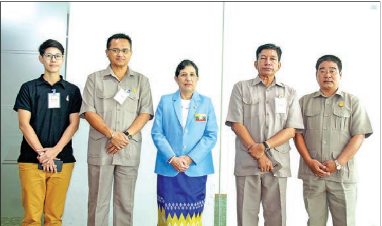
Deputy Minister Dr Mya Lay Sein seen off at the Yangon International Airport by officials before departing for the Philippines.