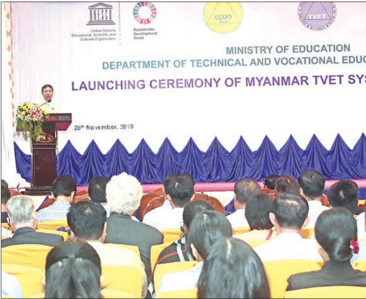
Union Minister for Education Dr Myo Thein Gyi addresses the Launching Ceremony of Myanmar TVET System Review Report in Nay Pyi Taw yesterday.

The Department of Technical and Vocational Education and Training under the Ministry of Education introduced a report that reviews Myanmar TVET system, at the Mingalar Thiri Hotel in Nay Pyi Taw yesterday morning.