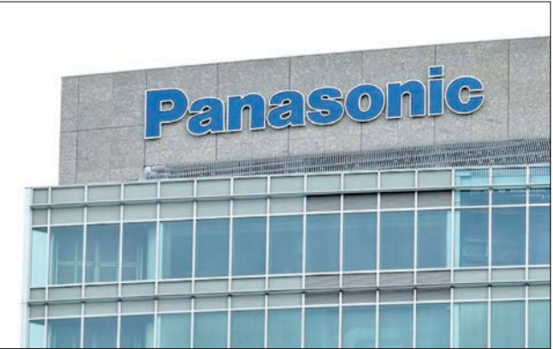
Japan's Panasonic has been gradually selling off some of its loss-making units.

However, traders cheered the news, with shares in the firm closing up 2.82 per cent at 1,009 yen. Only last week, Panasonic said it would end its production of liquid crystal display panels by 2021, again in the face of Chinese and South Korean manufacturers dominating the global market.—AFP ■