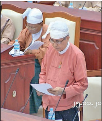
Deputy Minister U Kyaw Myo.

marked question and answer session Daw Nan Kham Aye of Namtu constituency tabled and explained a motion urging Union, State/Region governmental departments to post particulars about tenders invited, tender winning company and the tender work conducted until completion. The motion was supported by U Sai Oo Kham of Hsenwi constituency. As the Hluttaw agreed to accept and discuss the motion, an announcement was made accordingly about it. Pyithu Hluttaw Speaker U T Khun Myat then announced for Hluttaw representatives who want to discuss the motion to