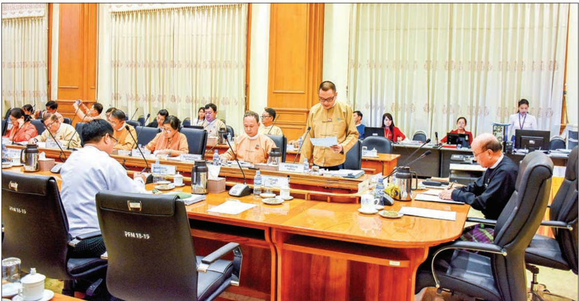
Pyidaungsu Hluttaw Deputy Speaker U Tun Tun Hein attends the meeting 60/2019 of the Joint Committee on Amending the 2008 Constitution in Nay Pyi Taw yesterday.