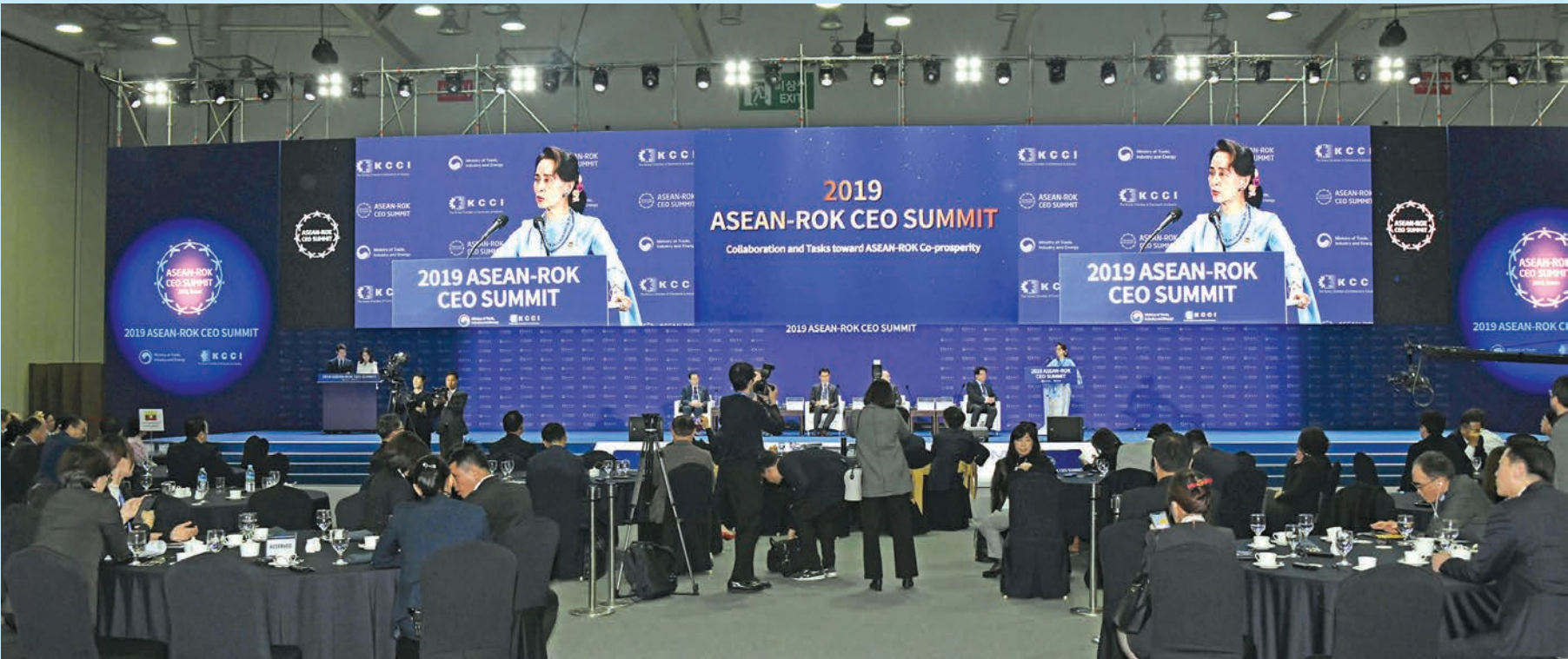
State Counsellor Daw Aung San Suu Kyi delivers the speech at the ASEAN-Republic of Korea CEO Summit (Session-3) in Busan, the Republic of Korea yesterday.

Keynote Speech delivered by State Counsellor Daw Aung San Suu Kyi at the ASEAN-ROK CEO Summit Busan, 25 November 2019