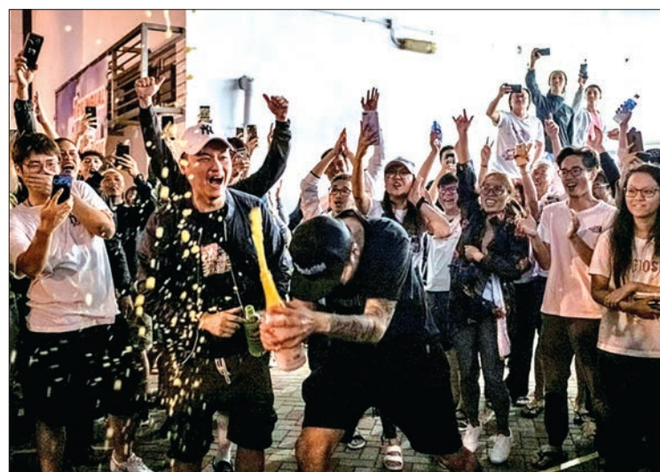
Crisis-hit Hong Kong’s pro-democracy camp has scored a stunning victory in district council elections.

Chatter on a popular web forum used to urge people to turn out for protests called for a march on Sunday to press the government to respond to the movement’s demands.—AFP ■