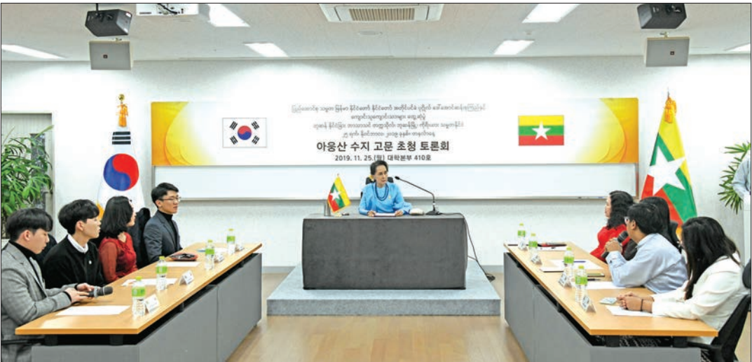
State Counsellor Daw Aung San Suu Kyi meets with Myanmar students and students from Busan University of Foreign Studies in Busan yesterday.