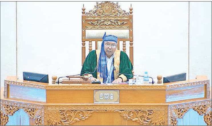
Amyotha Hluttaw Speaker Mahn Win Khaing Than.

Chaung Village Tract, Kyaukpuy Township, Rakhine State were answered by Deputy Minister for Agriculture, Livestock and Irrigation U Hla Kyaw. Meanwhile, questions raised by U Min Swe Naing of Kachin State constituency 6 on a plan to upgrade Kachin State, Mohnyin Township, No. 1 Myoma market into a modern market and U Aung Thein of Bago Region constituency 12 on land grant application matter in Yangon Region were answered by Nay Pyi Taw Council member U Nyi Tun.