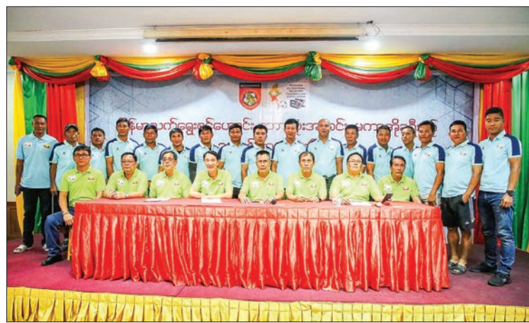
Myanmar veteran footballers and MFF officials pose for a group photo at the press conference held for the 19 th Veterans Football Tournament at the meeting hall of MFF on 25 November.

At the invitation of the Macau Football Association, 22 players from team Myanmar and 10 officials from the Myanmar Football Federation will pay their first visit to Macau. The tourney will be held from 29 November to 1 December.