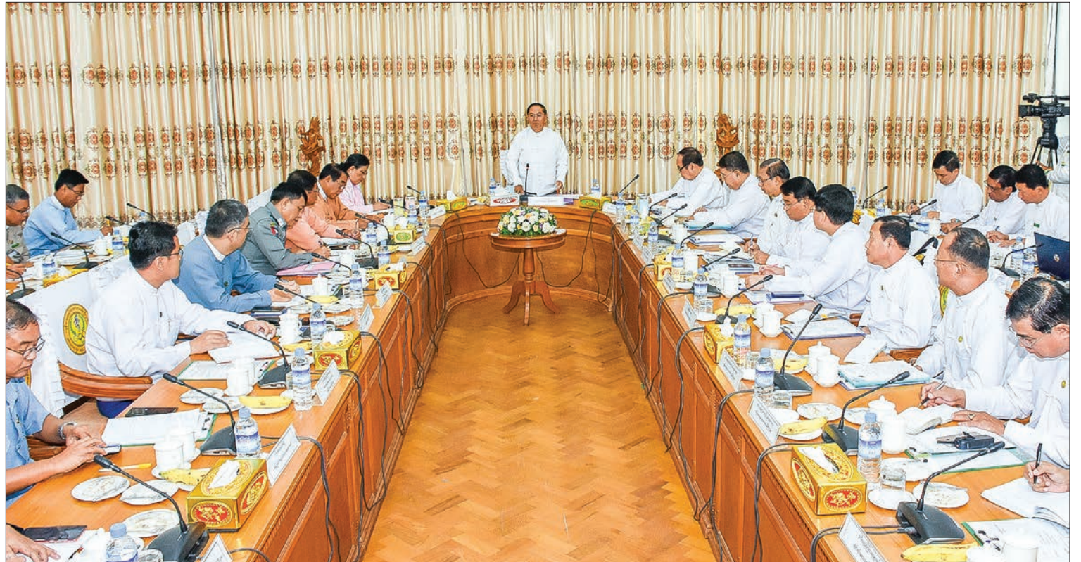
Vice President U Myint Swe addresses the committee meeting to organize the 20th Myanmar Traditional Medicine Practitioners' Conference (20th MTMPC) and Seminar in Nay Pyi Taw yesterday.

The 20 th MTMPC will be organized with the objectives of 'To