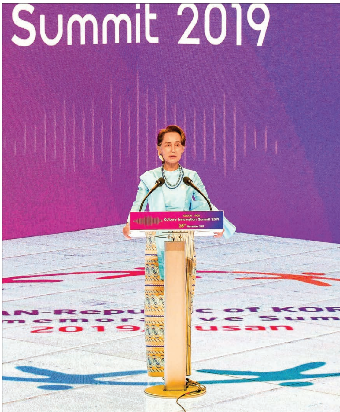
State Counsellor Daw Aung San Suu Kyi delivers the speech at ASEAN-ROK Culture Innovation Summit in Busan, the Republic of Korea, yesterday.