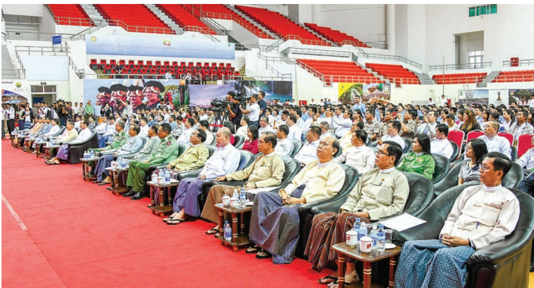
Vice President U Henry Van Thio addresses the ceremony to present victory flag to Myanmar contingent of 30th SEA Games at Wunna Theikdi sports stadium in Nay Pyi Taw yesterday.

striving towards reaching international level in all sectors. Systematic arrangements were made and implemented in the sports sector. Accomplishment of these aims was to be shown with individual and team wise capabilities in the forthcoming competition by achieving successes.