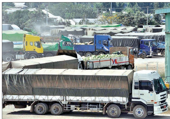
Watermelon are seen ready to export to China.

Watermelons and muskmelons are primarily grown in Mandalay and Sagaing regions and Shan State. Myanmar's watermelons and muskmelons have grabbed a large market share in China. — GNLM