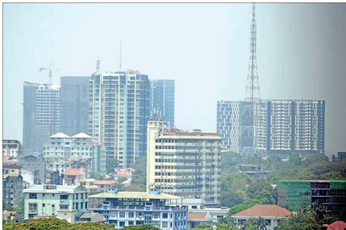
File photo shows an aerial view of downtown Yangon with high-rise buildings.

year, the standard land price per square foot in Yangon's townships has been reduced by 10 per cent compared to the year-ago period, according to the Internal Revenue Depart-