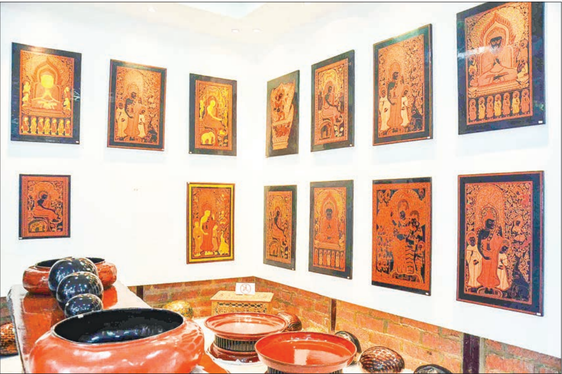
Lacquerware handicrafts displayed at a shop in Bagan.

TRADITIONAL lacquerware businesses in Bagan are currently working towards exporting to foreign countries in order to promote their products in international markets. The art of making lacquerware — decorative articles, typically made of wood or bamboo, that have been coated with lacquer — has been preserved in the area since the 11 th century, with businesses still continuing