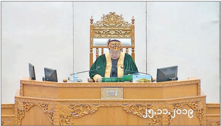
Pyithu Hluttaw Speaker U T Khun Myat.

Asterisk marked questions In the asterisk marked question and answer session, a question raised by U Pe Than of Myebon constituency on a village connecting road in Myebon Township was answered by Deputy Minister for Transport and Communications U Kyaw Myo. A question by Dr Lin Lin Kyaw of Myittha constituency on drawing up and implementing work plan to prevent flooding and inundation in Myittha Town Buta Ward and Yway Village was also answered by Deputy Minister U Kyaw Myo. A question by U Win Win of Minbu constituency on plan to construct a bridge on a village connecting road in Minbu (Saku) Township was answered by Deputy Minister for Construction U Kyaw Lin while questions raised by U Aung Kyaw Zan of Pauktaw constituency on the reason for the delay in constructing