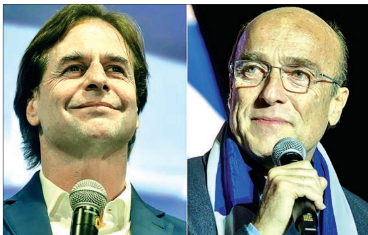
Uruguay's center-right candidate Luis Lacalle Pou (l) is in a tight race with Daniel Martinez (r), who represents the ruling leftist coalition government.

Lacalle Pou said he was confident his victory would be confirmed, however.