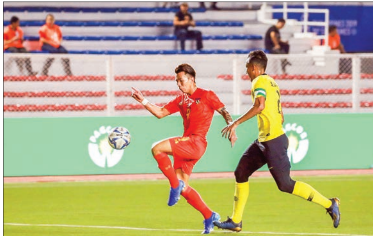
Myanmar player (red) and Malaysian player (yellow) vie for the ball at the men's football tournament at the 2019 Southeast Asian Games at the Rizal Memorial Stadium in the Philippines on 25 November.

Myanmar will play against the Philippines on 27 November, Timor-Leste on 29 November, and Cambodia on 2 December.