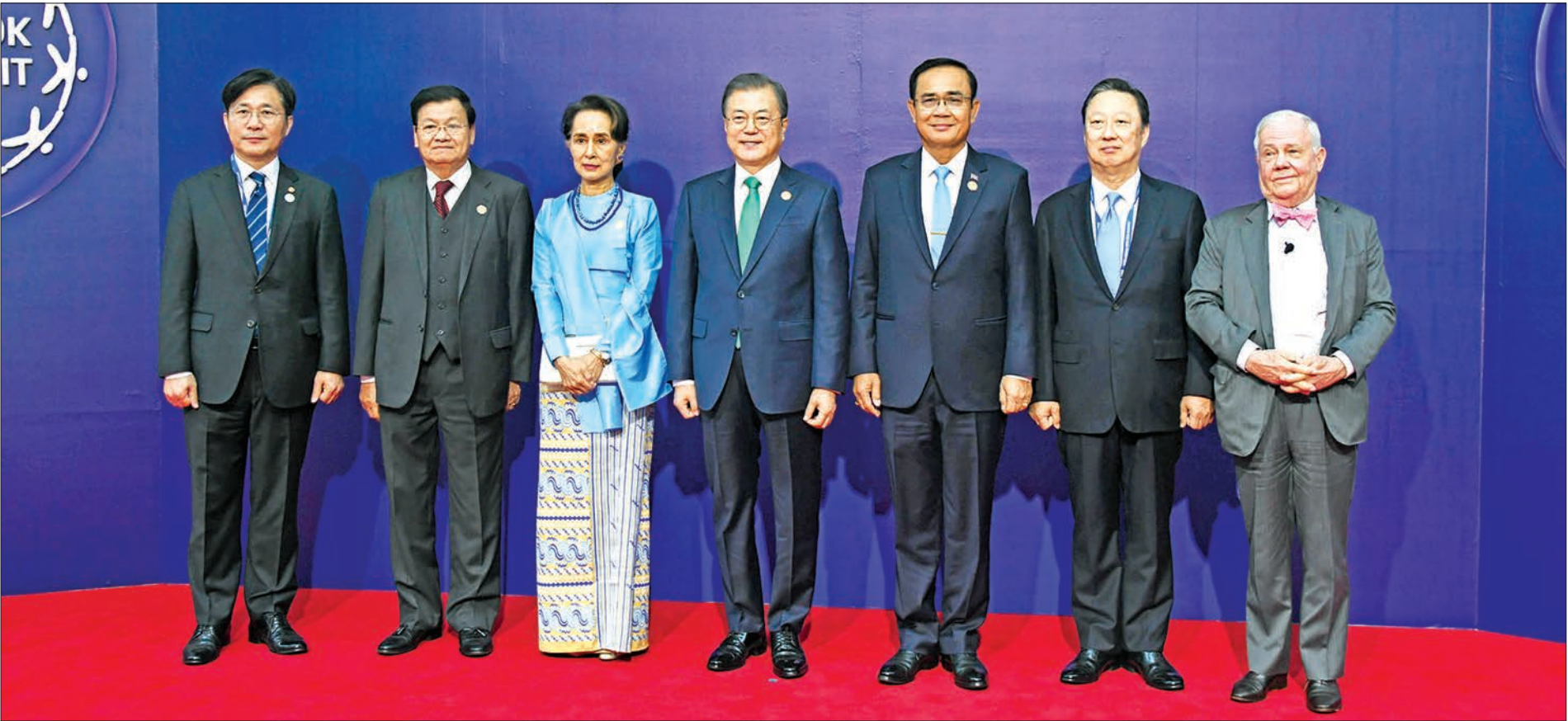
State Counsellor Daw Aung San Suu Kyi poses for documentary photo together with ROK President Mr Moon Jae-in, Prime Minister of Thailand (Retired) General Prayut Chan-o-cha, Prime Minister of Laos Mr Thongloun Sisoulith and business CEOs from the ASEAN and ROK before the opening ceremony of ASEAN-ROK CEO Summit in Busan yesterday.