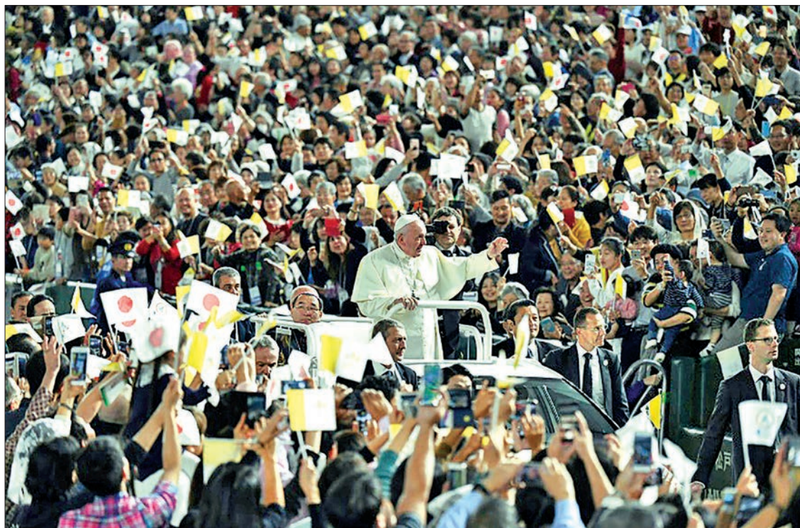
Tens of thousands of people packed into the Tokyo Dome stadium for a Mass given by Pope Francis.