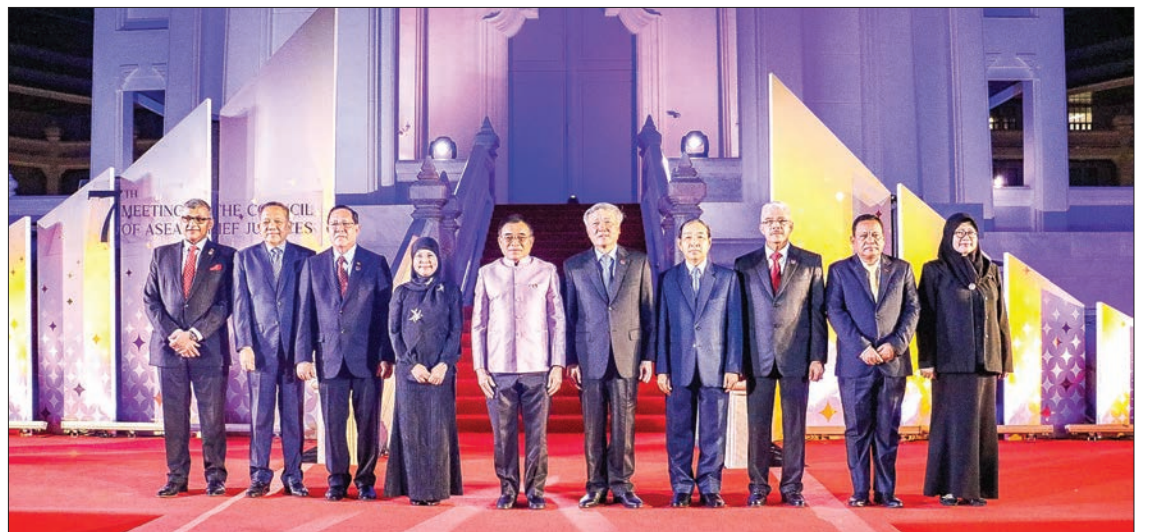
Union Chief Justice U Htun Htun Oo poses for a group photo with Chief Justices from other countries at the 7 th Council of ASEAN Chief Justices Meeting in Thailand.

On 23 November afternoon, the Union Chief Justice attended the signing ceremony of the Bangkok Declaration held at the