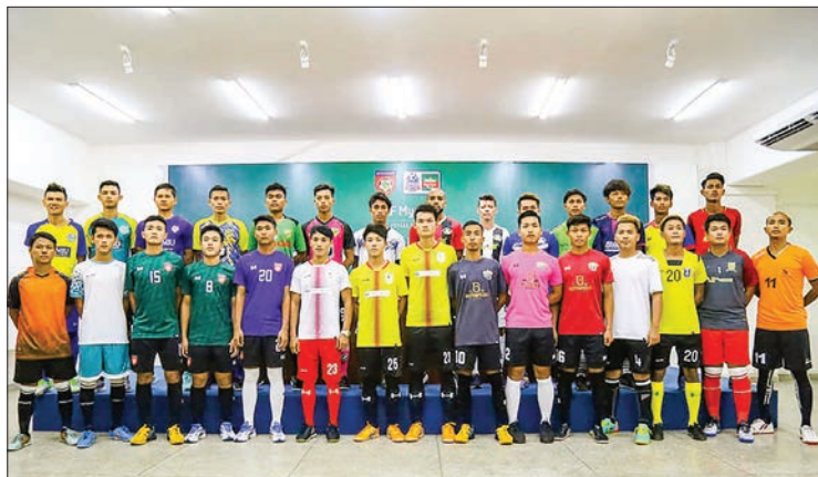
Officials and players of futsal clubs that will take part in MFF Myanmar Futsal League 2019-2020 pose for a group photo at the pre-match press meet ahead of the league at the Thuwunna Stadium on 25 November.