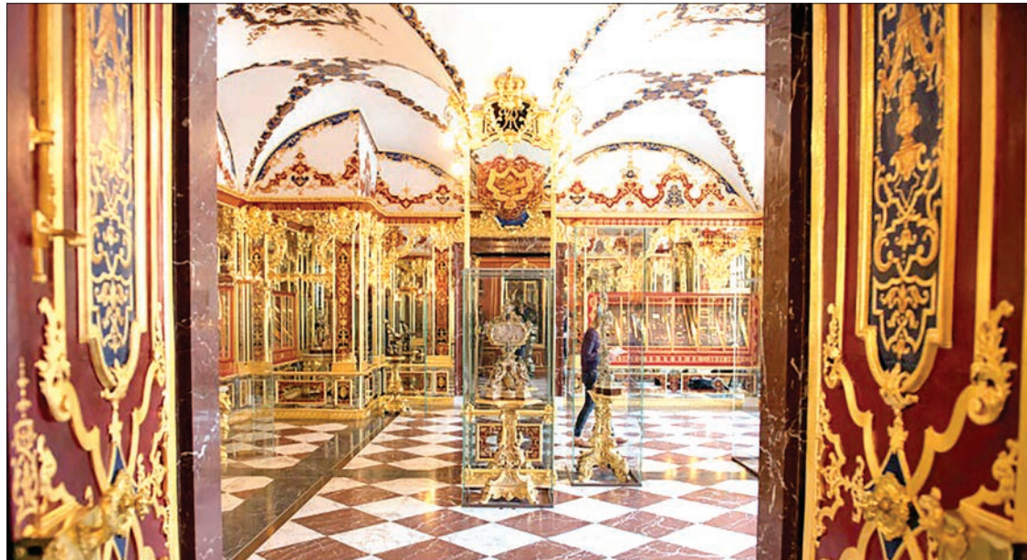
Bild newspaper said the stolen items could be worth up to a billion euros.

One of the oldest museums in Europe, the Green Vault holds treasures including a 63.8-centimetre figure of a Moor studded with emeralds and a 547.71-carat sapphire gifted by Tsar Peter I of Russia. Bild said the criminals