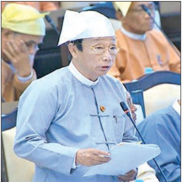
Deputy Minister for Agriculture, Livestock and Irrigation U Hla Kyaw.