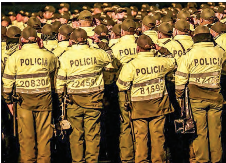
Colombian President Ivan Duque said he was stepping up the police presence and ordering the "deployment of joint patrols of police and army in the most critical places".

The protesters dispersed peacefully about one hour after the 9:00 pm (0200 GMT on Saturday) curfew began.—AFP ■