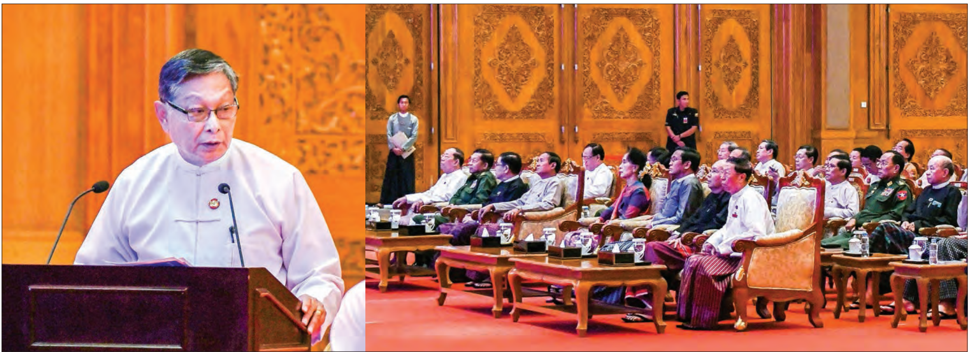
Union Minister for Office of the State Counsellor U Kyaw Tint Swe briefing on Myanmar's preparations to defend the application of the Gambia at the International Court of Justice by the defence team led by State Counsellor Daw Aung San Suu Kyi.

State Counsellor Daw Aung San Suu Kyi will lead the defence team at The Hague