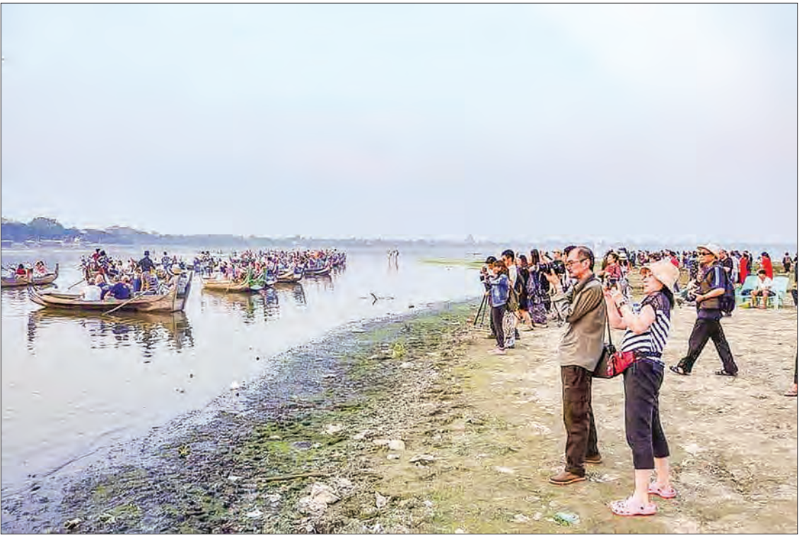
Tourists visit Taung Tha Man Lake in Mandalay.