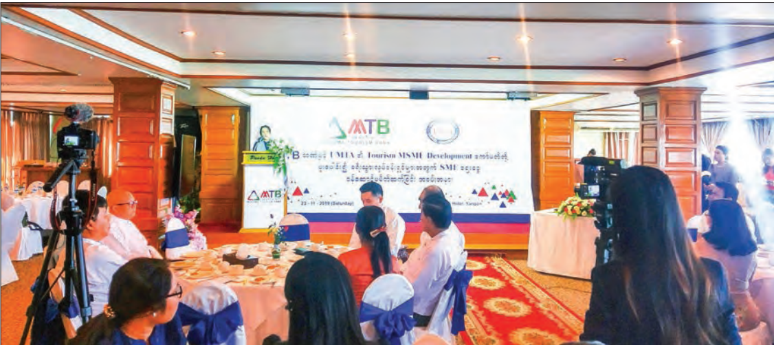
The ceremony to introduce SME loans services for the small tourism businesses being held in Yangon on 23 November.

IN a bid to boost the Myanmar tourist industry, Myanmar Tourism Bank (MTB) will provide SME loans to the small tourism businesses, in cooperation with the Tourism MSME Development