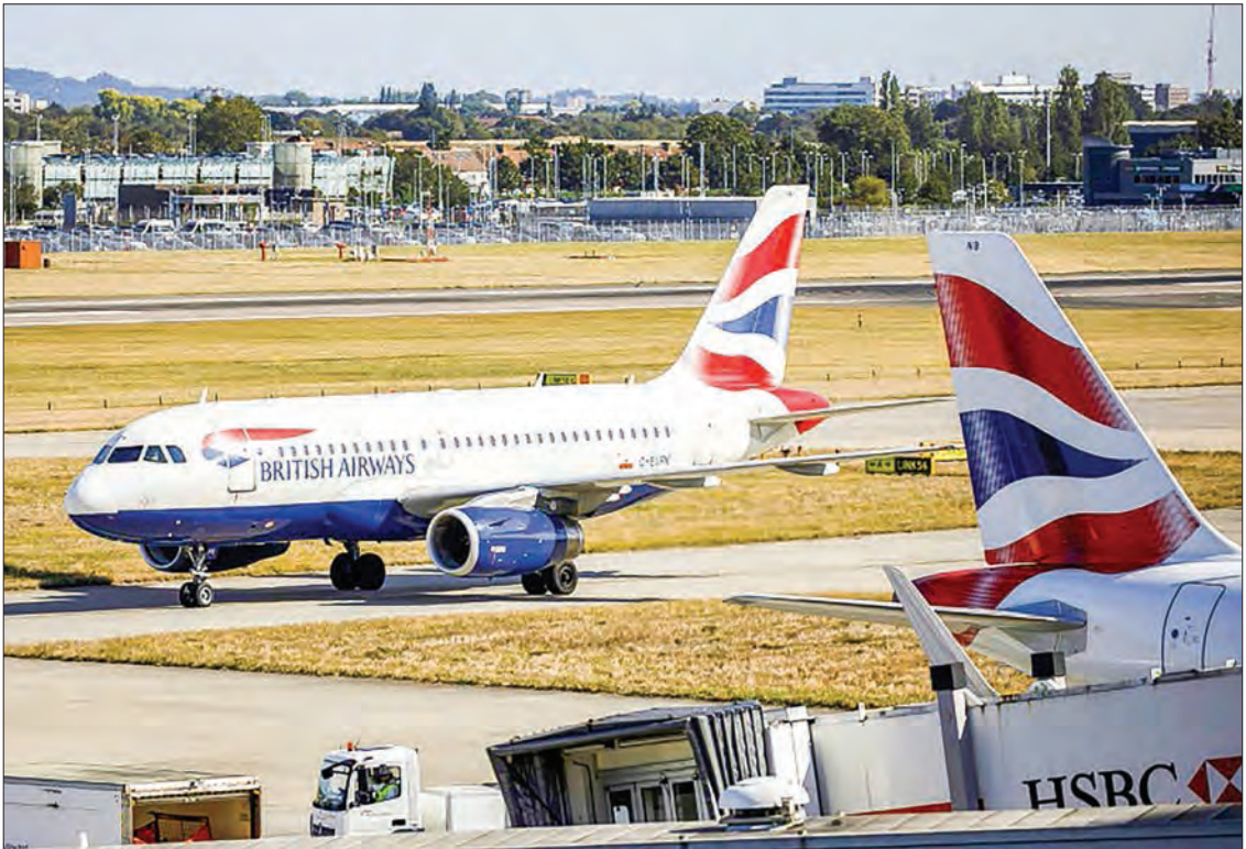
The airline has agreed to an inflation-proof pay rise of 11.5 percent over three years, according to the report; In this file photo taken on September 13, 2019, a British Airways jet is pictured in London.

mas walkout. “We welcome this positive step,” a BA spokesperson told AFP in a statement. Airline giant IAG admitted last month that recent historic strikes by British Airways pilots had hurt its performance in the third quarter. Net profit sank nine percent to 1.0 billion euros ($1.1 billion) in the three months to the end of September from a year earlier, said IAG, which also owns Spanish carrier Iberia and Ireland’s Aer Lingus. The London-listed company added in a results statement that it took a 155-million-euro charge from the cost of major disruption including industrial action by BA pilots in September. The two-day strike, on 9 and 10 September, was the first time in its 100-year history that pilots employed by the airline had walked out. — AFP ■