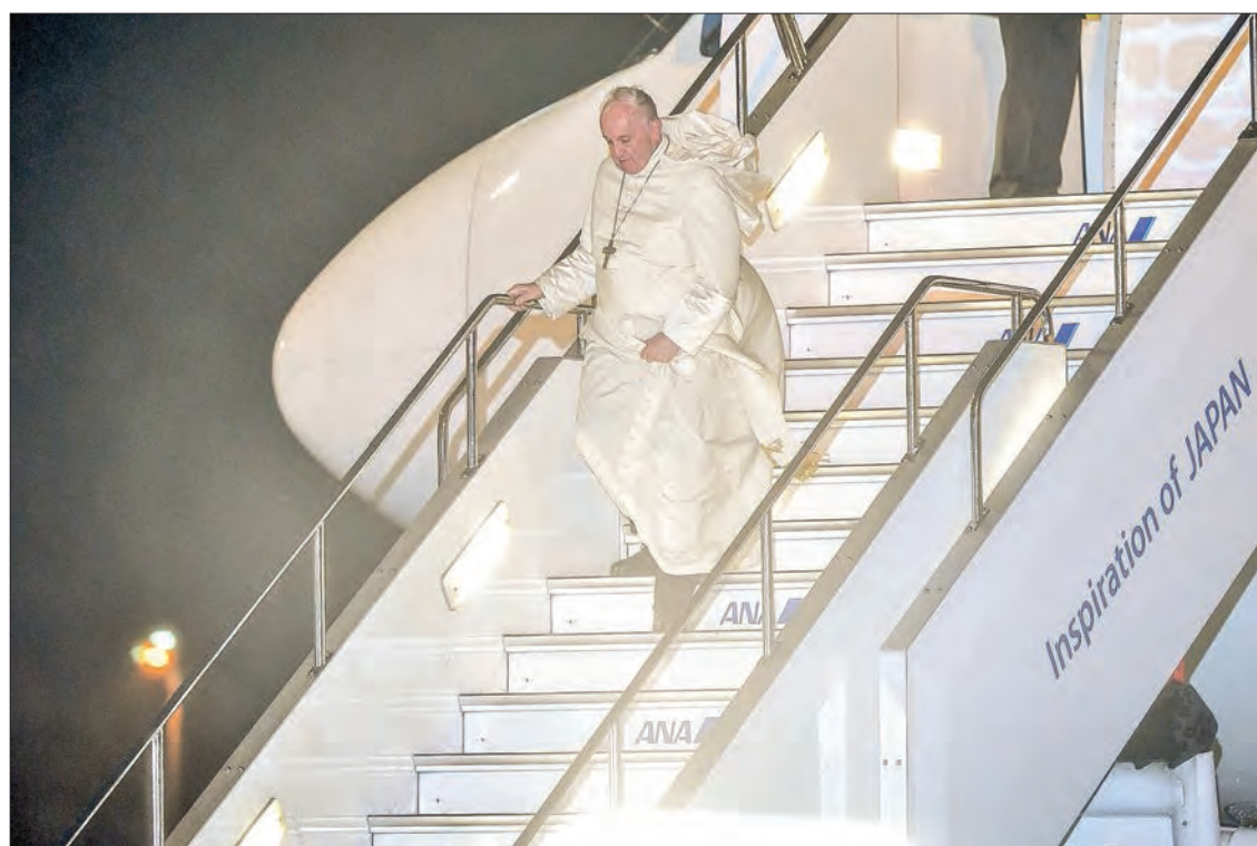
Pope Francis arrives in Tokyo's Haneda airport on 23 November 2019, following his visit to Thailand.

TOKYO (Japan)—Pope Francis on Saturday issued a call for nuclear disarmament as he arrived on a long-awaited trip to Japan, which will take in visits to the cities of Hiroshima and Nagasaki, targets of the "catastrophic" atomic bomb.