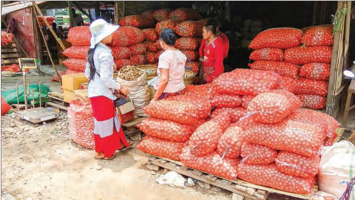
A local onion depot in Yangon.

the last few days, because the Bangladesh government controls them. Now, they are not purchasing as many onions,” he added. Onion prices on the local market was more than K1,000 per viss in the first week of October, K2,400 per viss at the end of October and K4,000 per viss in November. India suspended the export of onions until February, 2020, because the production of onions is on the decline in India due to constant rainfall. Therefore, Bangladesh and Sri Lanka imported onions from Myanmar, Egypt, Turkey and China. At present, the price of onions is K 3,000 per viss in the wholesale market.—Aye Cho (Translated by Hay Mar)