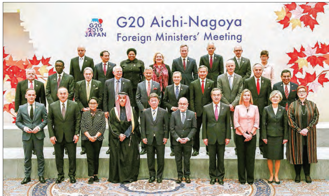
Foreign ministers from the Group of 20 major economies pose for a photo on 23 November 2019, the final day of their two-day meeting in Nagoya, central Japan.

NAGOYA—Foreign ministers from the Group of 20 major economies agreed Saturday that it is “urgent” to reform the World Trade Organization, Japanese Foreign Minister Toshimitsu Motegi said, amid an escalating U.S.-China tit-for-tat tariff trade war.