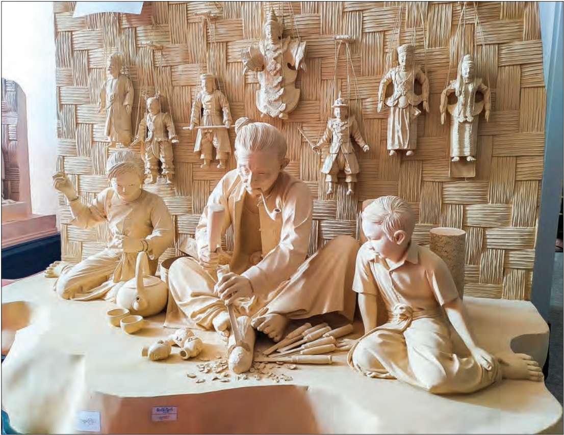
One of the wood sculpture to be displayed at the exhibition is seen.

In its eighth exhibition, 227 wood sculptures made by the