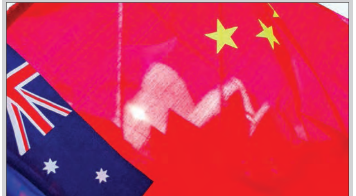
A Chinese defector gave Australia's counter-espionage agency the identities of Beijing's intelligence officers in Hong Kong and provided details of how they conduct operations in Australia, Hong Kong and Taiwan, Australian media reported.

SYDNEY (Australia)—A Chinese spy has defected to Australia with a trove of intelligence on China's political interference operations in Hong Kong, Taiwan and elsewhere, according to a media report Saturday.