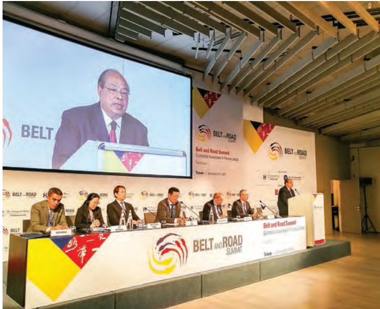
Union Minister U Thaung Tun delivers the speech at the “Belt and Road Summit” in Trieste, Italy.

MYANMAR Delegation led by U Thaung Tun, Union Minister for Investment and Foreign Economic Relations and Chairman of the Myanmar Investment Commission (MIC), attended the “Roundtable Discussion with French Companies” in Paris, France and the third edition of the “Belt and Road Summit” in