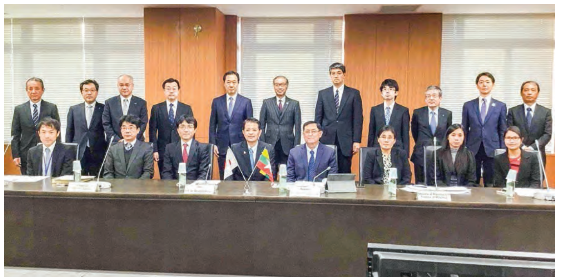
Deputy Minister U Maung Maung Win attends the Tokyo Fiscal Forum held in Tokyo, Japan from 20 to 21 November.

DEPUTY Minister for Planning and Finance U Maung Maung Win attended the Tokyo Fiscal Forum held in Tokyo, Japan on 20 and 21 November.