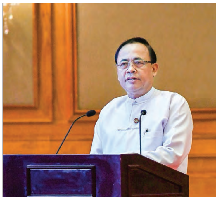
Union Minister U Kyaw Tin briefing on Myanmar's preparations to defend the application of the Gambia at the ICJ.

The Union Minister added that the Government did not ignore the issue of accountability and had formed Maungdaw In-