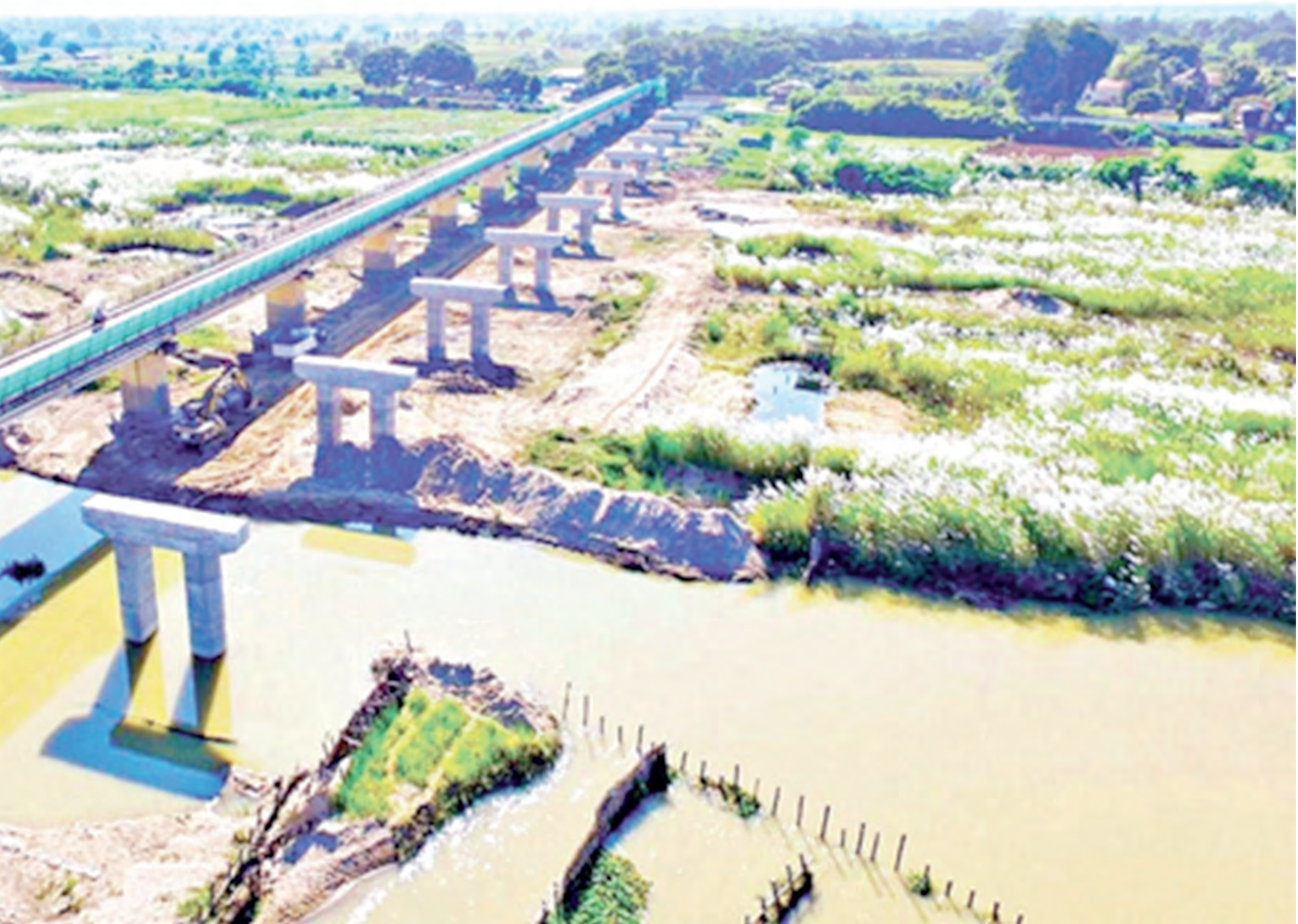
A new bridge in parallel with the Mu River crossing bridge in Sagaing Region is being built by Ministry of Construction.