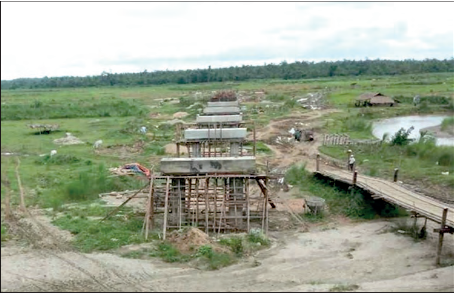
Construction work of Pyaunghwe Bridge in Kyunhla Township, Sagaing Region is 35 per cent finished.

will be 70 ft long, 14 ft wide and 18 ft in high. It is under construction by a private construction firm from Monywa and is slated for completion in March 2020. A riverbank protection project was undertaken by the Directorate of Water Resources and Improvement of River Systems in Mawlaik Kalay Village, Mawlaik Township in Sagaing Region. The retaining wall is 2,400 ft long and was constructed mostly from concrete at a cost of K 640 million. Construction task commenced in February this year and the project has already been finished, said an assistant director from the DWIR. “The newly-constructed retaining wall is expected to prevent the homes along the river from relocating. In 2017, three houses have been relocated due to riverbank erosion and it is beneficial to the village,” said a resident from the village.