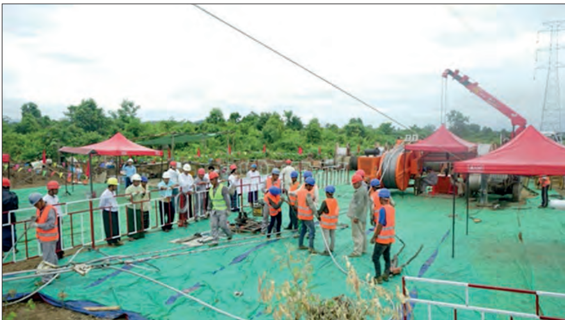
A 230 kV power transmission line is designed to distribute electricity generated by Tarpein-1 Hydropower Plant to households in ten townships in Sagaing Region.

Construction of the Pyaunghwe Bridge on the Intaing-Kwete-Inhla-Leik-sintaung inter-village road in Kyunhla Township, Sagaing Region has been 35 per cent finished, according to a source