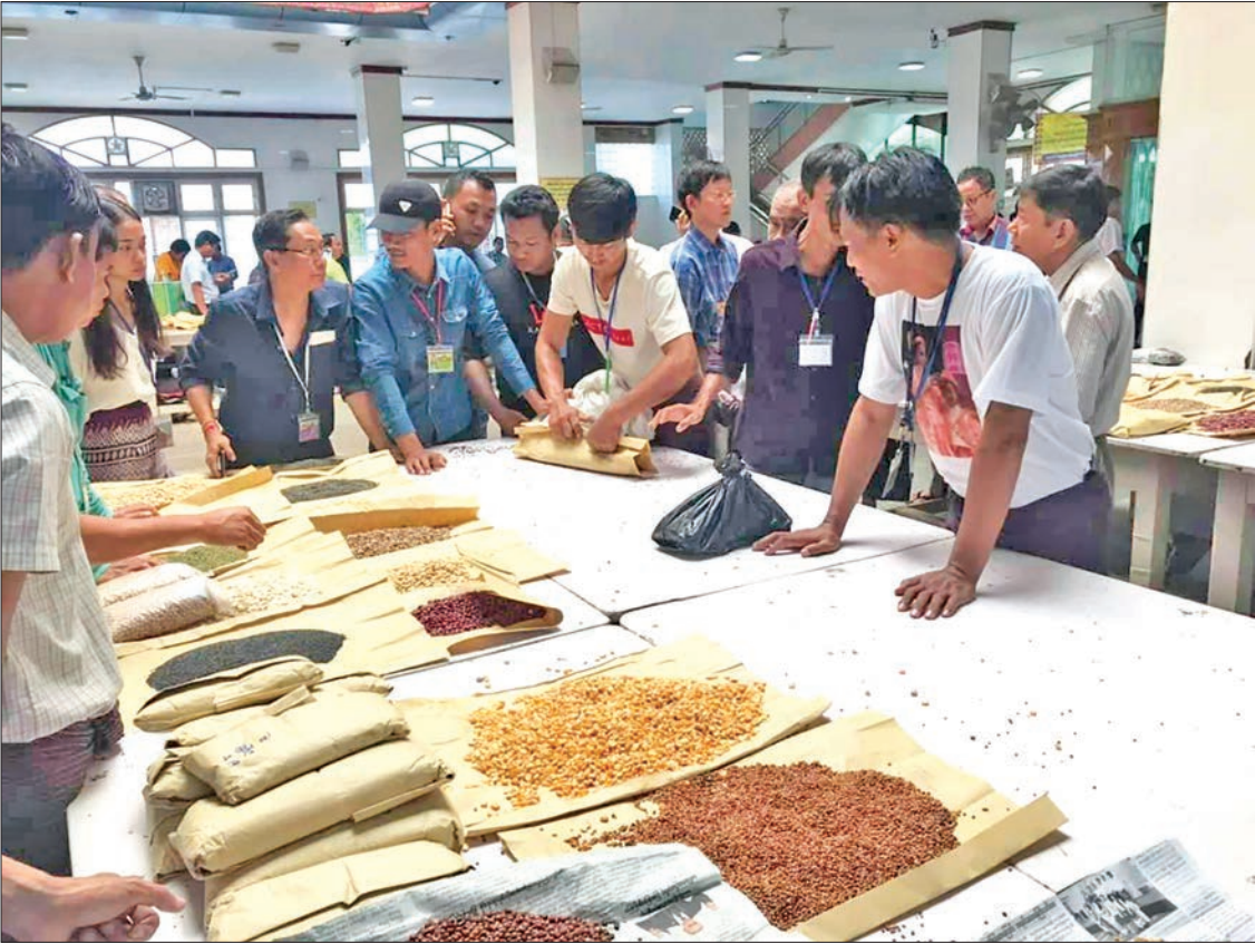
Merchants evaluate quality of pulses at the Mandalay wholesale market.

BLACK sesame from Bhamo, Katha and Htigyaing townships and white sesame from Shwebo and Wetlet townships has started to enter the Mandalay market and is commanding a good price, according to Mandalay bean traders. Among the winter sesame, the quality of black sesame from Magway region is better than that of monsoon black sesame. Although the price of monsoon black sesame is K250,000 per bag in the local market, the price of winter black sesame entering the market is K258,000 per bag. The price of winter white sesame has also increased slightly this year compared to last year. The price of winter white sesame is K152,000 per bag this year in Mandalay market, said U Soe Win Myint, the owner of Soe Win Myint brokerage. “Black sesame from Bhamo and Katha townships enters the Mandalay market every year in