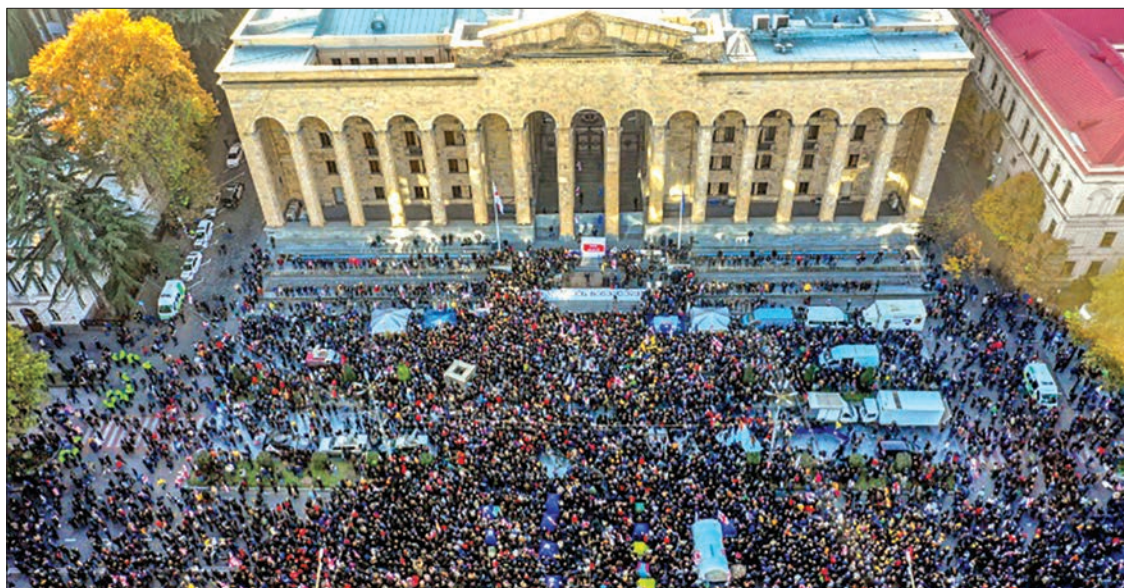
Tens of thousands of protesters gathered outside parliament on Monday.

The brigadier, a member of France’s elite CRS riot-control police based in the southwestern city of Toulouse, faces charges of “deliberate violence by a person in a position of public authority.”—AFP ■