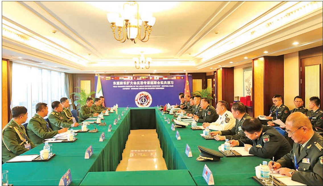
Defence Services Commander-in-Chief Senior General Min Aung Hlaing attends ADMM-Plus (VIP Program) held in the People's Republic of China.

On arrival at the venue, the Senior General and party were