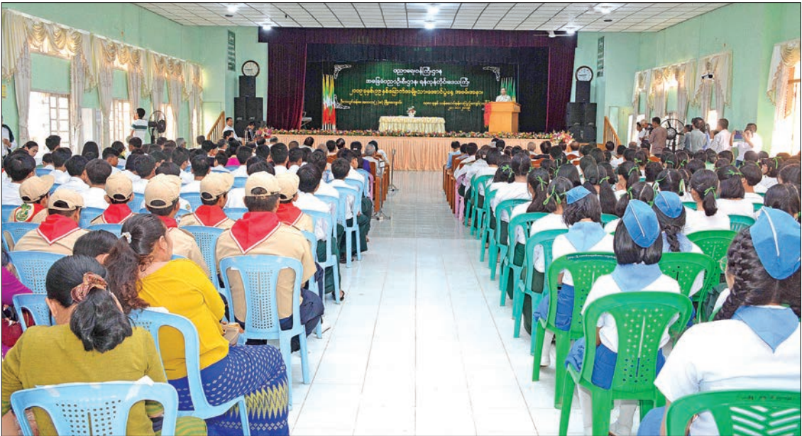
Union Minister Dr Myo Thein Gyi delivers the speech at the ceremony to mark 99 th National Victory Day in Dagon Township, Yangon yesterday.

THE ceremony of 99 th National Victory Day was held at U Ba Lwin Hall of No 2 Basic Ed-