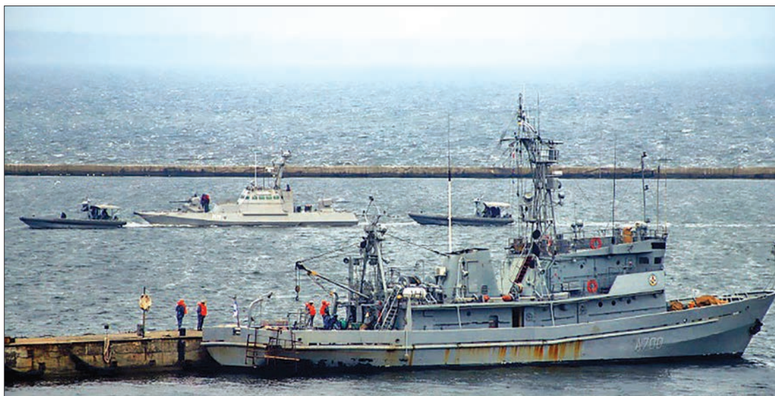
The two gunboats and a tugboat were handed back this week after they were held in evidence following what Moscow says was an illegal breach of the Russian border.

navy vessels are back where they belong. As promised, we have brought back our sailors and our ships,” Zelensky said.