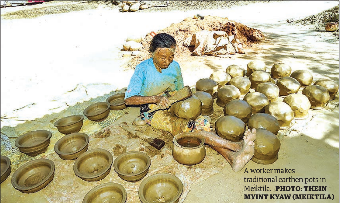
A worker makes traditional earthen pots in Meiktila.

Taungtha markets. But, water bottles are being used instead of water pots and bronze pots are also being used as flower pots. Therefore, potters are making fewer water and flower pots due to low demand in the market. Demand is still strong for planters and earthen pots for palm juices. We will continue to hand over our pottery businesses from one generation to the next even if raw materials become scarce, in order to maintain the cultural heritage of our family,” said Daw Tin Mya.—Thein Myint Kyaw (Meiktila) (Translated by La Wonn)