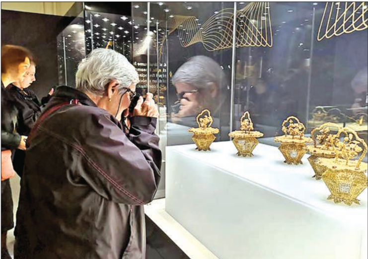
Photo taken on 20 November, 2019 shows exhibits during an exhibition of Chinese royal goldware of Ming Dynasty (1368-1644) at the National History Museum of Romania in Bucharest, Romania.

BUCHAREST — An exhibition of Chinese royal goldware of Ming Dynasty opened Wednesday at the National History Museum of Romania, on the occasion of the 70 th anniversary of China-Romania diplomatic relations.