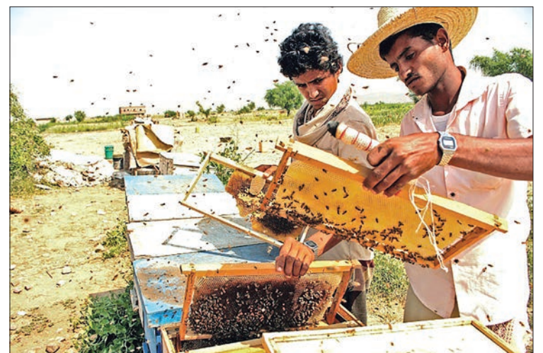
Beekeepers at work producing 'Yemen's gold' in Hajjah province.

Ahead of its formal establishment the union registered 400 expressions of interest from Samsung Electronics employees, the FKTU says.—AFP ■