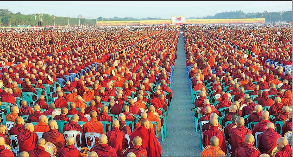
Myanmar and Thai Buddhist monks participate in an alms-offering ceremony in Mandalay last year. The similar ceremony will be held on 8 December which will also include a photo contest.

The competition will be open for everyone. Photographers will be allowed to submit five 10X15 inch photo entries. The winner of the contest will be awarded K700,000, the second placed winner will get K500,000, the third placed winner will get K300,000, and there will also be a consolation prize of K100,000.