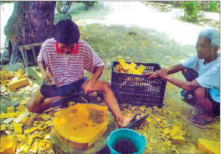
Workers make wooden combs at work in Thet Kael Kyin Village, Monywa Township.

WOODEN comb-making businesses in Thet Kael Kyin Village, Monywa Township, have almost vanished due to lack of raw materials and substitution products. “Earlier, the whole village was involved in weaving, making rosary beads, and the comb-making business. Now, the village is almost deprived of wooden-comb making businesses and weaving businesses. There are only four people who are still making wooden combs,” said Ko Myint, a local from Thet Kael Kyin Village. Thet Kael Kyin Village is located 5 miles from Monywa town. The village has over 960