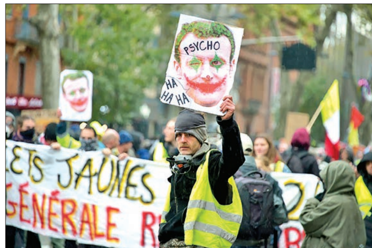
Yellow vest marches took place in several cities across France, including Bordeaux.

In the biggest anti-government protest in years, more than 20,000 demonstrators rallied Sunday outside the parliament building and some protesters who attempted to block building entrances were dispersed on Monday.—AFP ■