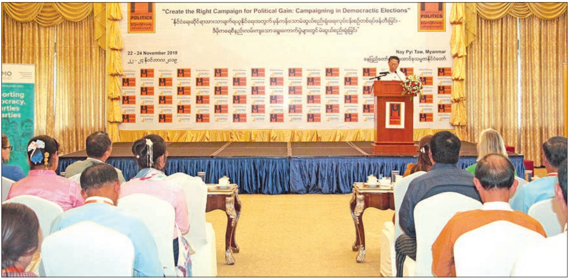
Union Election Commission Chairman U Hla Thein addresses the opening ceremony of 8 th Alumni Forum of MySoP (Myanmar School of Politics) in Nay Pyi Taw yesterday.