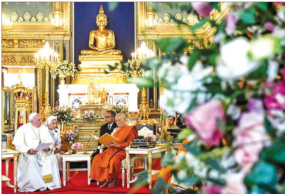
Pope Francis meets Thailand's Supreme Buddhist Patriarch at Wat Ratchabophit Monastery in Bangkok.

In an earlier speech, the Pope said the meeting was "a sign of the importance and ur-