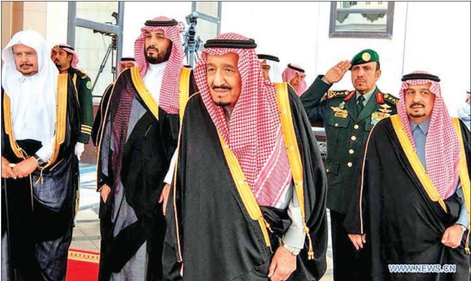
Saudi King Salman bin Abdulaziz Al Saud (c, Front) attends the 7th session of the Shura Council in Riyadh, Saudi Arabia, on 20 November, 2019.

He also said Saudi Arabia is determined to carry on with its reform programs to raise its competitiveness to become one of the 10 most business-friendly countries in