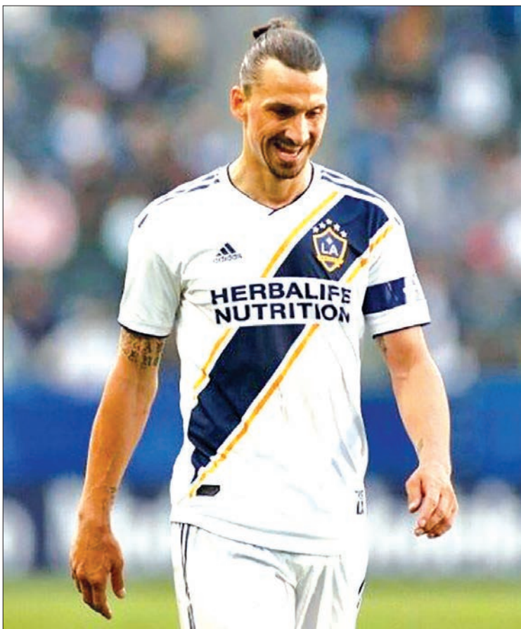
Zlatan Ibrahimovic won Serie A titles with both AC Milan and Inter Milan.

He also won three league titles with Inter Milan, and two with Juventus, which were both revoked following the 'Calciopoli' match-fixing scandal.—AFP ■