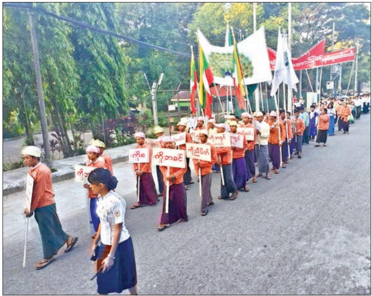
The Myoma Alumni Association in Yangon celebrate a ceremony to mark 99 th anniversary of the National Victory Day yesterday.

Before the ceremony, the participants gathered in front of No.2 Basic Education High School (Myoma), and marched by holding the names of posters printed with 11 historic stu-