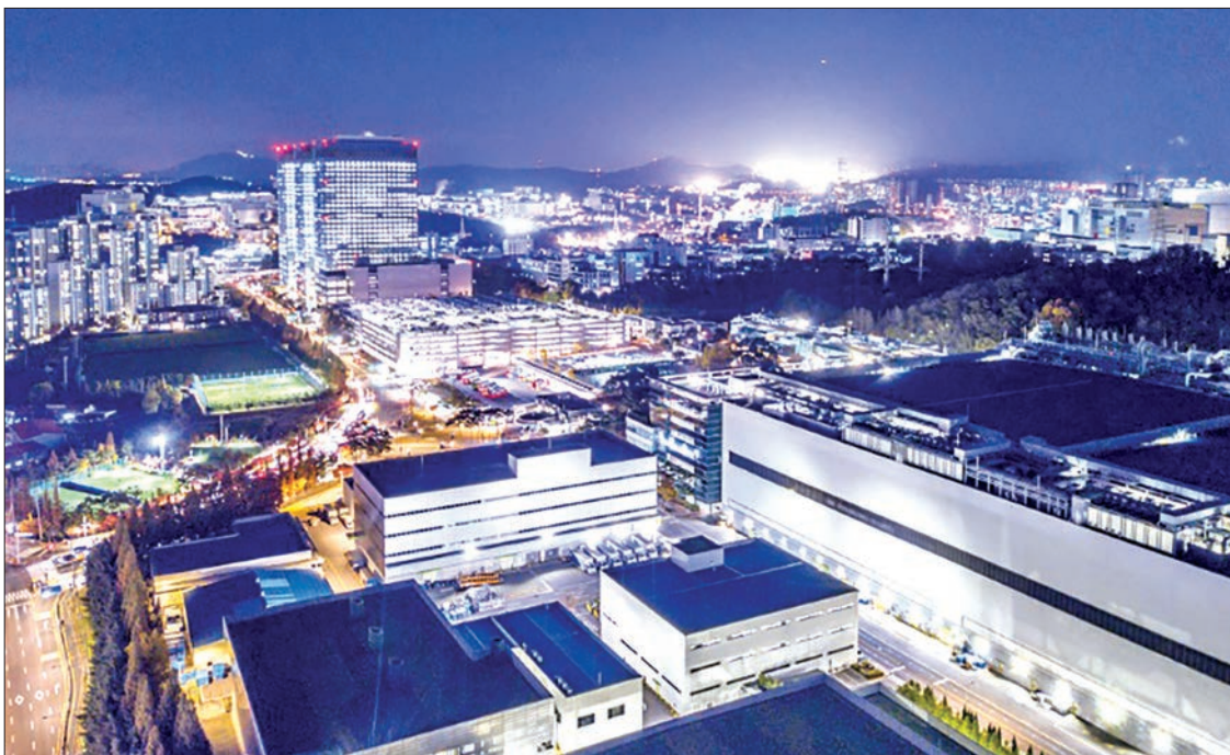
Samsung Group is by far the biggest of the family-controlled conglomerates in South Korea.

"Honey production has dropped," he said pointing to the challenges of exporting during wartime and the logistical difficulties of keeping bees. ■