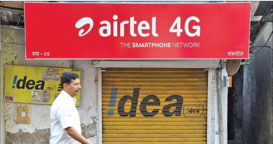
An Indian man walking past a shop with an advertisement for mobile service provider Airtel and Idea in Mumbai.

Vodafone Idea and Bharti Airtel have both struggled since India's richest man Mukesh Ambani launched Reliance Jio in 2016. The new mobile operator has offered dirt-cheap internet and free calls. All three companies have announced plans to raise their charges in the next few weeks in a bid to boost their bottomline and help the sector recover after years of cut-price tariffs.—AFP ■