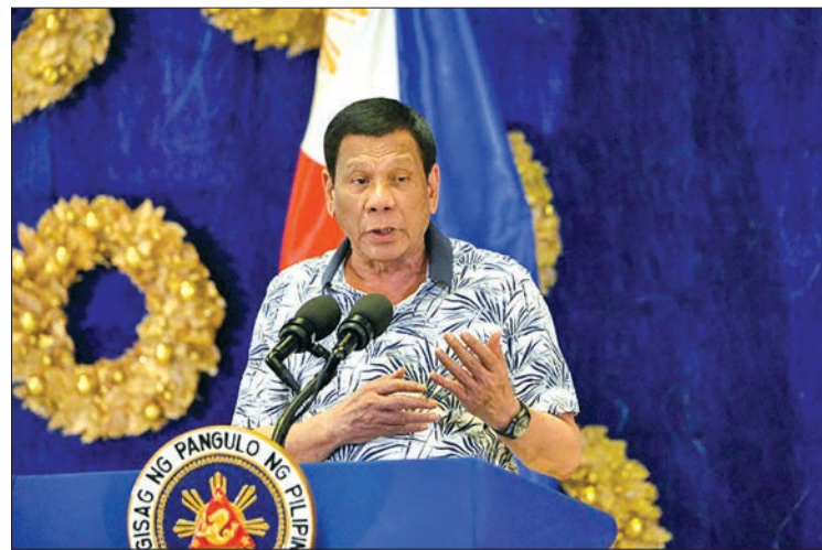
The president told a late-night press conference that the use and import of electronic cigarettes would be banned.

Duterte is notorious internationally for his deadly an-