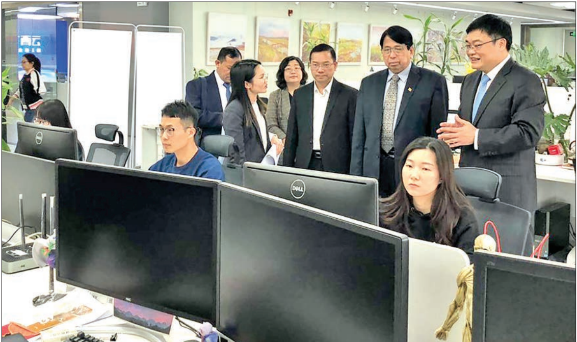
Union Minister Dr Pe Myint visits Guangxi Daily newspaper in Nanning City, Guangxi Zhuang Autonomous Region of People's Republic of China yesterday.

During the meeting, they discussed technology integration of mainstream and modern media, cooperation in news media between the two countries, collaboration in film and music, in addition to media sector, when holding 70 th anniversary to mark the establishment of