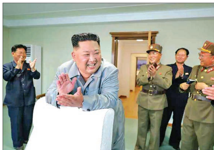
North Korean leader Kim Jong Un (2nd from l).