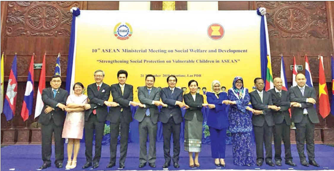
ASEAN ministers pose for a group photo at the 10th ASEAN Ministerial Meeting on Social Welfare and Development (AMMSWD) in Lao PDR yesterday.

UNION Minister for Social Welfare, Relief and Resettlement Dr Win Myat Aye led a delegation to Vientiane, Laos, and attended the 10 th ASEAN Ministerial Meeting on Social Welfare and Development (AMMSWD) at Don Chan Palace Hotel yesterday. During the opening ceremony, Laotian Deputy Prime Minister Mr Soudy Douangsdy