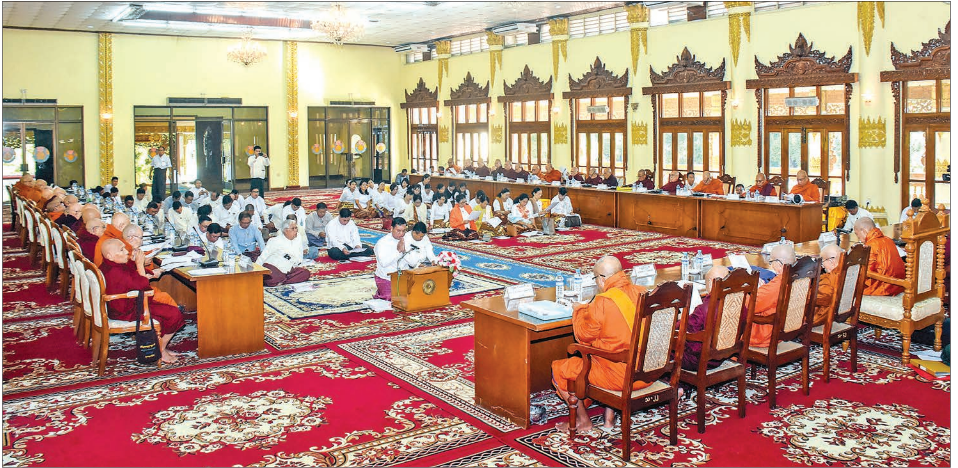
47-member leading committee of the 8 th State Sangha Maha Nayaka Committee holds its 3 rd meeting at the Wizaya Mingalar Dhammathabin Hall on Kaba Aye Hill in Yangon.