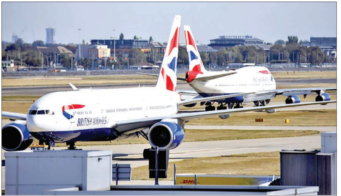
BA suffered a computer glitch in 2016 that severely affected its global check-in system.

"Yet again it's thousands of passengers who are paying the price — left tired, frustrated and with a lack of information and assistance from the airline."