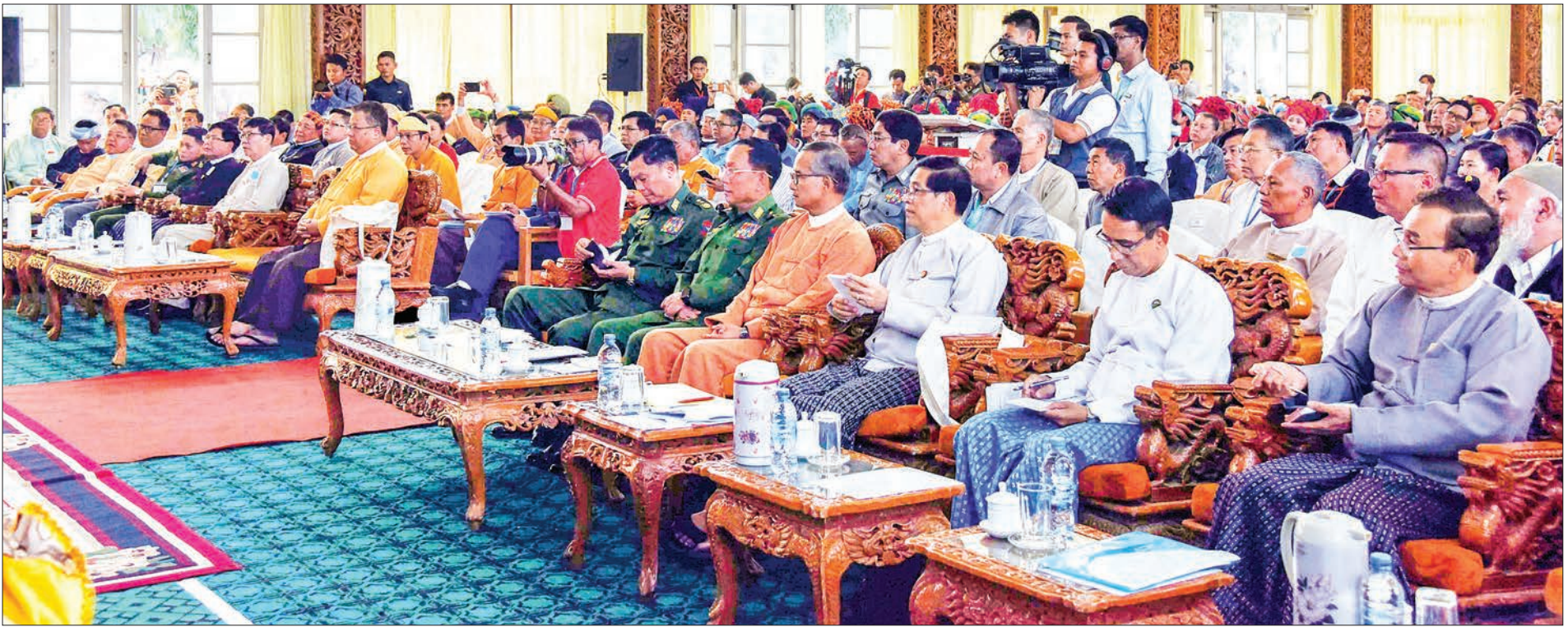
State Counsellor Daw Aung San Suu Kyi meets with locals of Shan State at the Town Hall in Taunggyi yesterday.

PARLIAMENT Pyithu Hluttaw approves bill amending Myanmar Medical Council Law PAGE-2