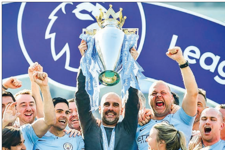
Manchester City posted record revenues of £535 million after winning a domestic quadruple of trophies last season.

The sale of a host of players unable to break into the first team helped boost profits to £10.1 million. Prior to Sheikh Mansour's takeover of City in 2008, the club's