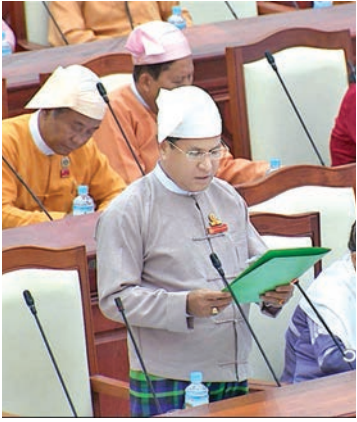
Deputy Minister for Office of the Union Government U Tin Myint.