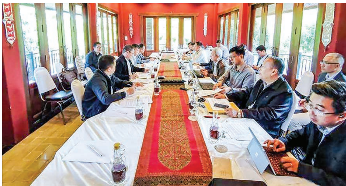
Representatives from National Reconciliation and Peace Center (NRPC), Restoration Council of Shan State (RCSS) hold a meeting at Chiang Mai, Thailand yesterday.