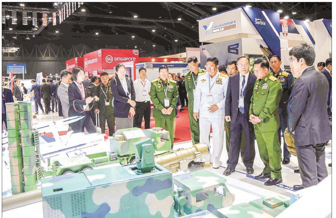
Senior General Min Aung Hlaing visits Myanmar Tatmadaw exhibition displayed at the Defense & Security 2019 event in Thailand.