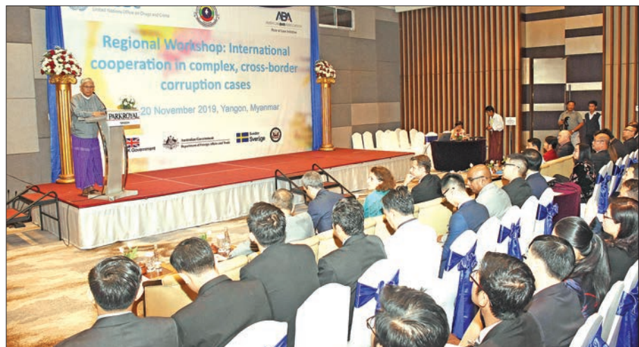
Cross-border Corruption Cases workshop taking place in Yangon.

Jointly organized by the United Nations Office on Drugs and Crime-UNODC, American Bar Association-ABA and the Anti-Corruption Commission of Myanmar, Regional Workshop on International Cooperation in Complex, Cross-border Corruption Cases was held at the Park Royal Hotel in Yangon yesterday.