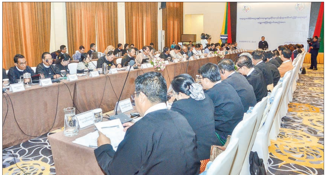
Union Attorney-General U Tun Tun Oo delivers the opening speech at the 7 th meeting of the coordination body of Rule of law department and judiciary fairness works in Nay Pyi Taw.

THE Rule of Law Centres and Justice Sector Coordinating Body organized its 7 th meeting at Park Royal Hotel in Nay Pyi Taw yesterday morning.