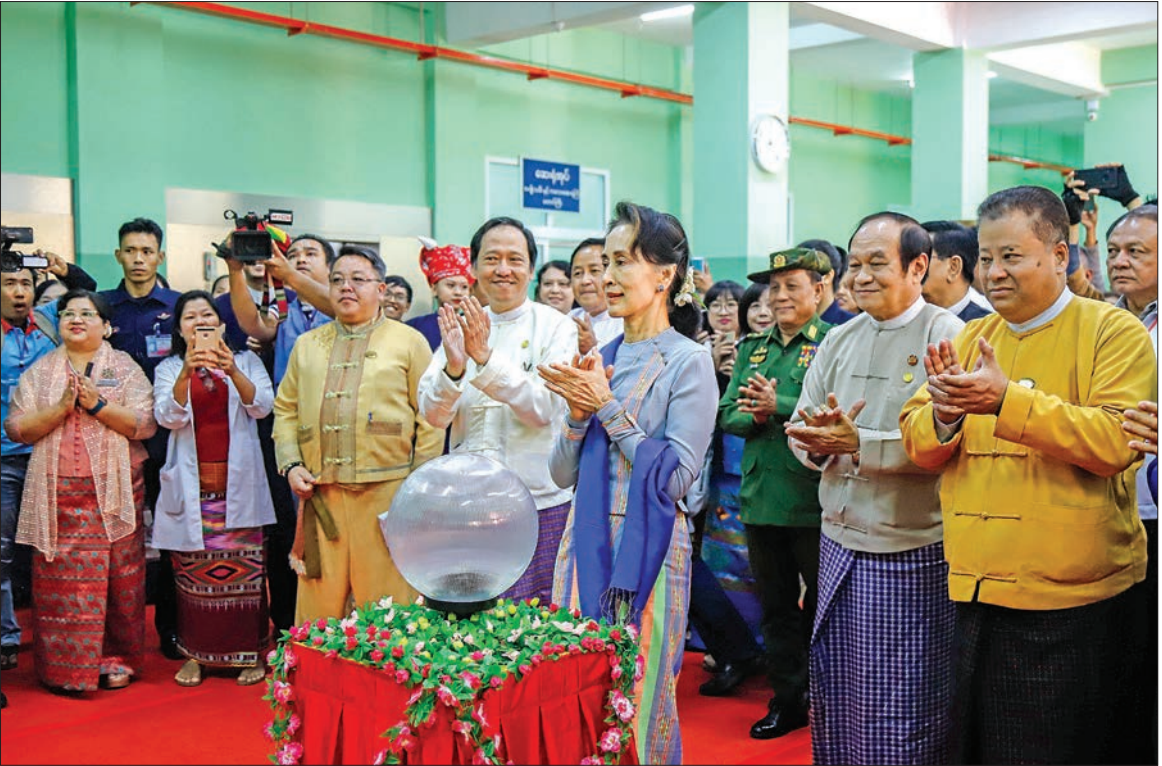
State Counsellor Daw Aung San Suu Kyi officially opens the new building of Women and Children Hospital in Taunggyi, Shan State yesterday.

It was not a government appointed post. Town elders are people accepted by locals as respectable and reliable persons like their parents. In this meeting there are only three town elders and this is not good because it looks as though there were very few people respected by the people in Taunggyi. At these meetings, we need to become close to one another. It is for this reason that question and answer session were included in our meeting with the people. To ensure that many questions were raised and answered, the questions should be short to the point. Sometimes, questions were long like an essay and answers