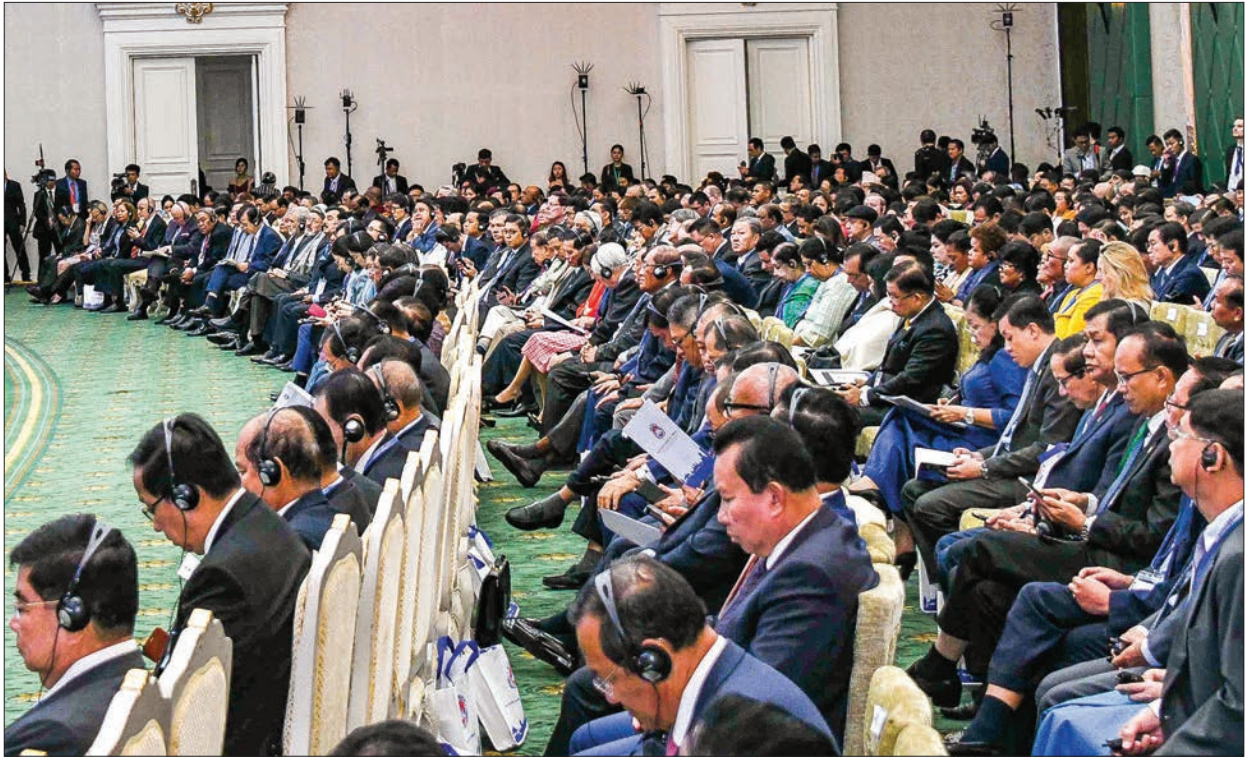
Vice President U Henry Van Thio addresses the inaugural ceremony of 2 nd Asia Pacific Summit in Phnom Penh, Cambodia yesterday.

VICE PRESIDENT U Henry Van Thio delivered a speech at the inaugural ceremony of 2 nd Asia Pacific Summit held the Peace Palace in the Prime Minister's Office in Phnom Penh, Cambodia, yesterday morning.