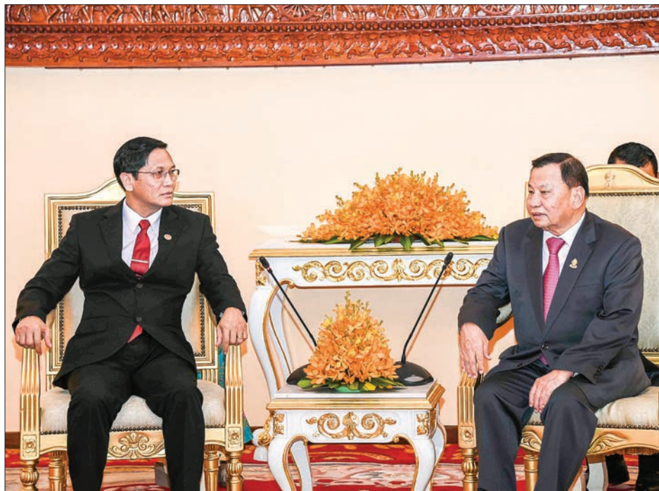
Vice President U Henry Van Thio holds talks with Cambodia's Senate President, Samdech Vibol Sena Pheakdei Say Chhum in Phnom Penh, Cambodia yesterday.