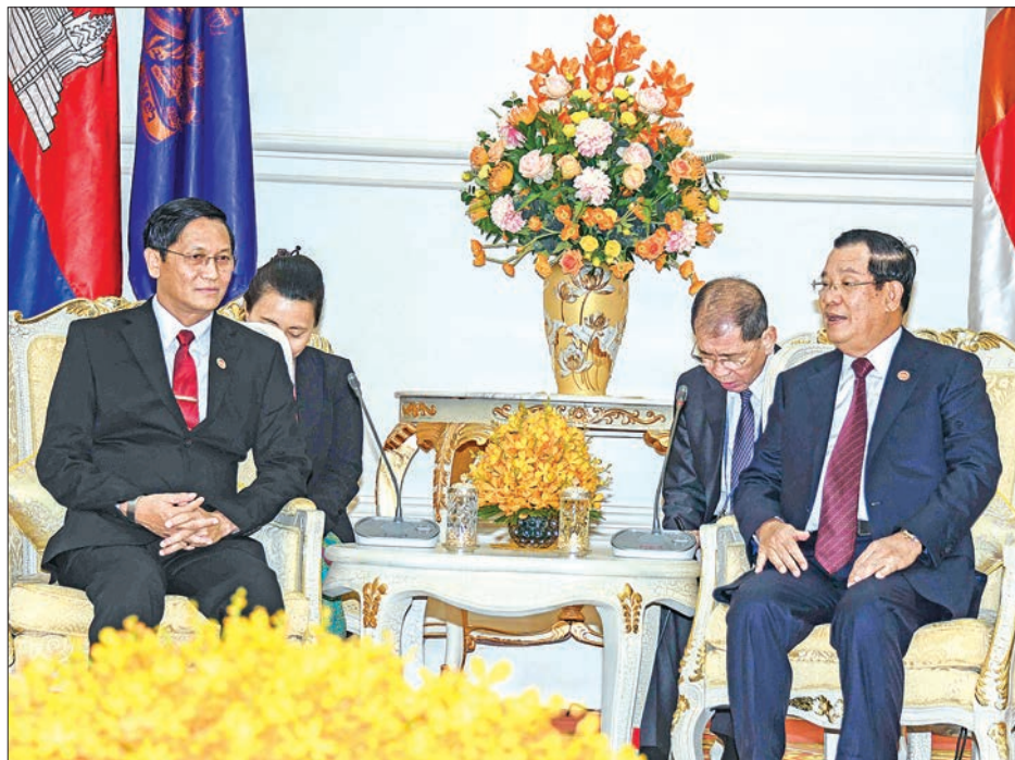
Vice President U Henry Van Thio meets with Cambodian Prime Minister Samdech Hun Sen at the Peace Palace in Phnom Penh, Cambodia yesterday.