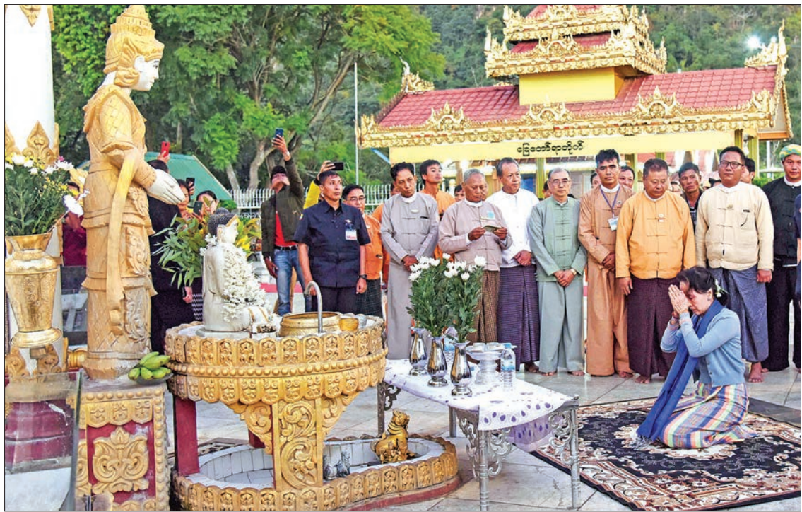
State Counsellor pays homage to the Buddha image at Sulamuni Pagoda in Taunggyi, Shan State.

For example, who was responsible to achieve peace? All must have the mindset of being responsible for it. The country will develop only through peace. Only when the country develops can each and every one have sustainable development. We should not be proud of being rich alone when the country is poor. In fact, it is something to be ashamed of. All need to share the fruits as well as the burdens. Challenges must be faced and overcome together. Only with this spirit can our country become a true Federal Democratic Union. The belief that this was possible was due to a region like Taunggyi. We have places like Taunggyi in our country where different ethnic nationals with different languages and different religious belief lived together peacefully. If such places expand into the whole