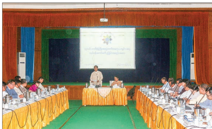
Deputy Minister for Information U Aung Hla Tun addresses the coordination meeting for holding youth development festival in Magway yesterday.