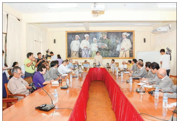
Union Minister for Information Dr Pe Myint addresses the meeting with members from Myanmar Motion Picture Organization in Yangon yesterday.

UNION Minister for Information Dr Pe Myint held a meeting with the patrons and new executive body of Myanmar Motion Picture Organization at the meeting hall of organization in Yangon yesterday morning.