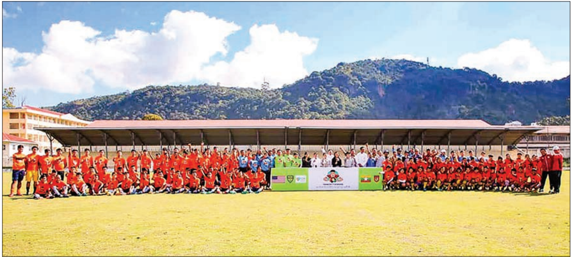
The attendees at the Community Champions Football Clinic programme pose for a group photo at the event in Taunggyi on 19 November.