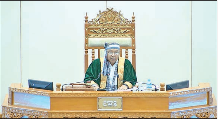
Amyotha Hluttaw Speaker Mahn Win Khaing Than.

Similarly a question raised by Dr Kyaw Ngwe of Magway Region constituency 10 on plan to allow Department of Road or companies to repair roads on road and rail combined bridges operated by Myanma Railways was answered by Deputy Minister for Transport and Communications U Kyaw Myo.