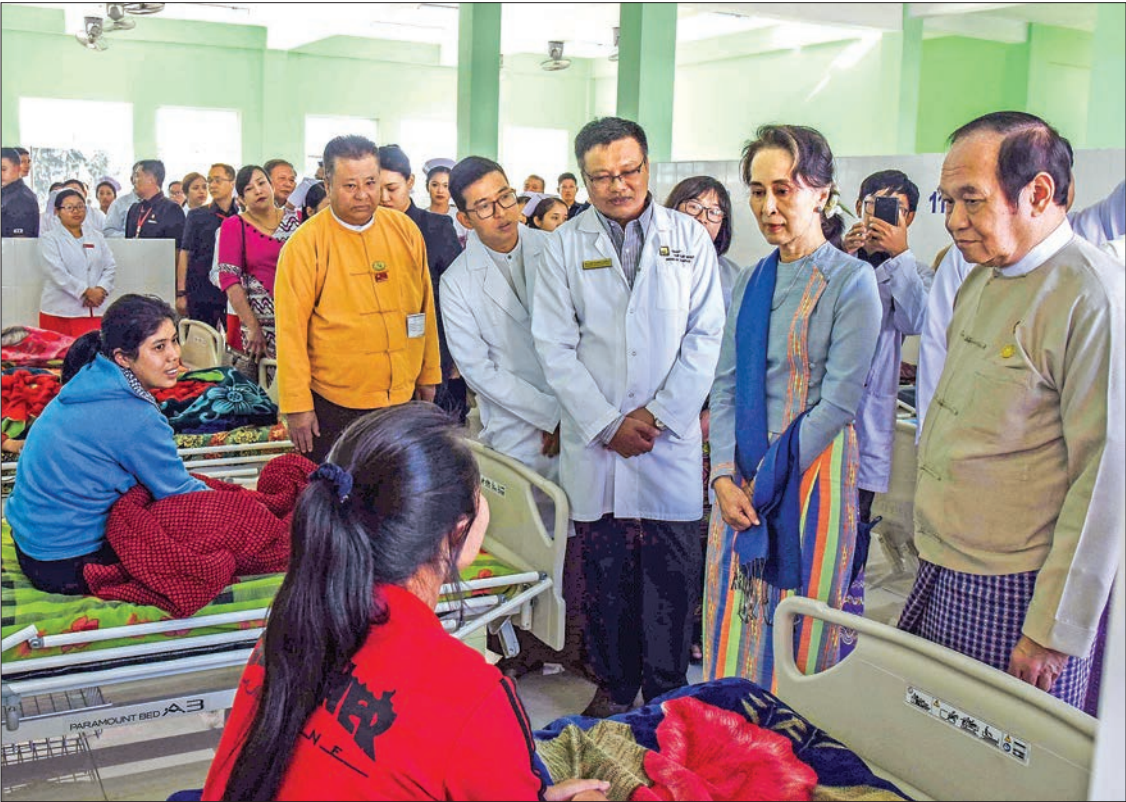
State Counsellor Daw Aung San Suu Kyi encourages patients at the Women and Children Hospital in Taunggyi, Shan State yesterday.

to have a long term sustainable organization. Only then can our country go down the path we ought to in unity. Some asked whether we should start with the heart or mind. Both need to be started simultaneously. Just like riding a bicycle. Both wheels must turn to reach our destination smoothly. It is important to organize both. The reason we discuss, meet and talk with the people is for both wheels to turn smoothly. Questions should be more on the mind. Why a matter was delayed? When will it be done? How will it be done? These are related to development. Development is desired in every country and society. It is not wrong to have this desire. This desire is required for development. I don't think there are many people in this hall have experienced the Second World War first hand. I was born when it ended. But we were so used to hearing about it because as we grew up, we heard a lot about it from our elders who were still talking about it. There were differences in the way countries badly affected by the war develop. The rate of development was dependent on the mind and spirit of the people. Some develop quickly and effectively due to their people. For our country to develop, the mindset of each citizen needs to be correct. Not only mindset, but effective support by work is also required. Hope or expectation not supported by work will become a dream that disappears. If hope or expectation is to be achieved, work must be done.