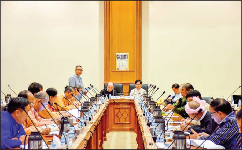
Pyidaungsu Hluttaw Deputy Speaker U Tun Tun Hein attends the meeting 59/2019 of the Joint Committee on Amending the 2008 Constitution in Nay Pyi Taw.

tion security management committees, arrangements for holding the election that covers the whole country, formation of electoral coordination committees, and inviting local and international election observation organizations. Members of the commission and officials from the commission office were also present at the meeting. —MNA (Translated by Kyaw Zin Tun)