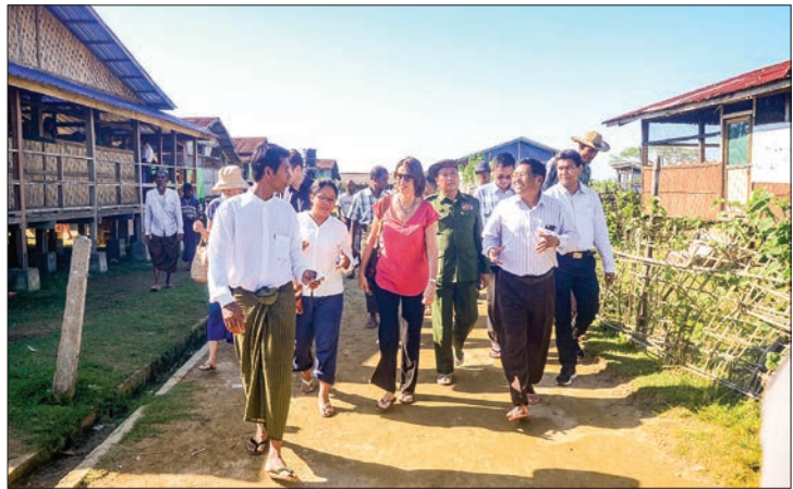
UN Secretary-General's Special Envoy to Myanmar Ms. Christine Schraner Burgener visits IDPs camp in Rakhine.