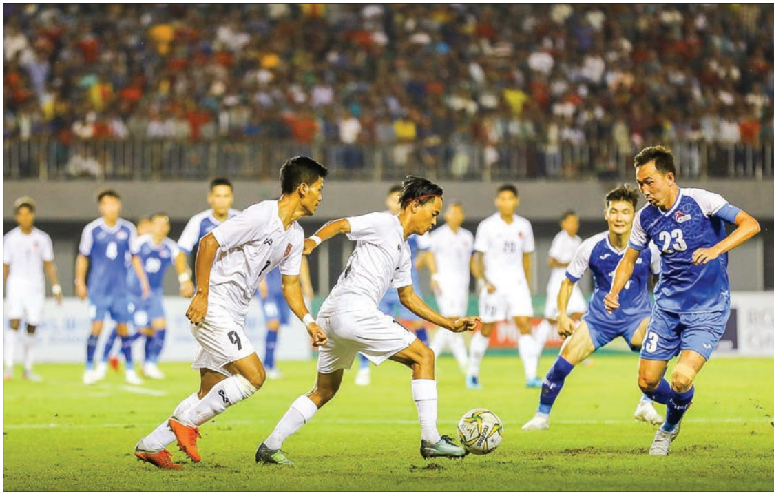
Myanmar players (white) and Mongolian players (blue) vie for the ball in the 2022 World Cup Qualifiers match at the Mandalay Thiri Stadium in Mandalay on 19 November.

MYANMAR beat Mongolia 1-0 in the 2022 World Cup Qualifiers match at the Mandalay Thiri Stadium in Mandalay yesterday.