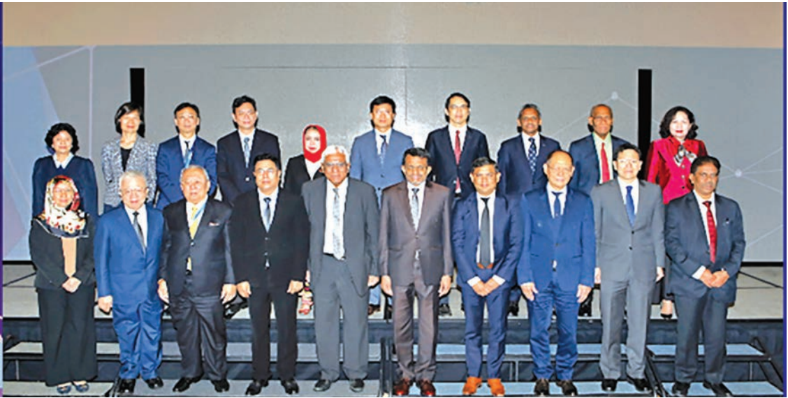
Central Bank of Myanmar's Governor U Kyaw Kyaw Maung poses for a photograph with high-level officials at the SEACEN Board of Governors' meeting.

A delegation led by Governor of the Central Bank of Myanmar U Kyaw Kyaw Maung attended the 55 th Southeast Asian Central Bank (SEACEN) Governors' Conference/High Level Seminar and the 39 th SEACEN Board of Governors' Meeting from 13 to 14 November in Singapore. The Governor first attended a seminar on the effects of financial technology on monetary stability at Singapore EXPO Convention and Exhibition Centre on 13 November. Keynote speeches were delivered there by Queen Maxima Zorregueta Cerruti of The Netherlands, Managing Director Mr Ravi Menon of the Monetary Authority of Singapore, and General Manager Mr Agustin Carstens of the Bank for International Settlements. On 14 November, the CBM Governor attended the 55 th SEACEN Governors' Conference/High Level Seminar at JW Marriott Hotel where they discussed on data-driven economy and AI-driven economy. Later in the afternoon, they attended the 39 th SEACEN Board of Governors' Meeting. There, Dr Indrajit Coomaraswamy handed over the role of