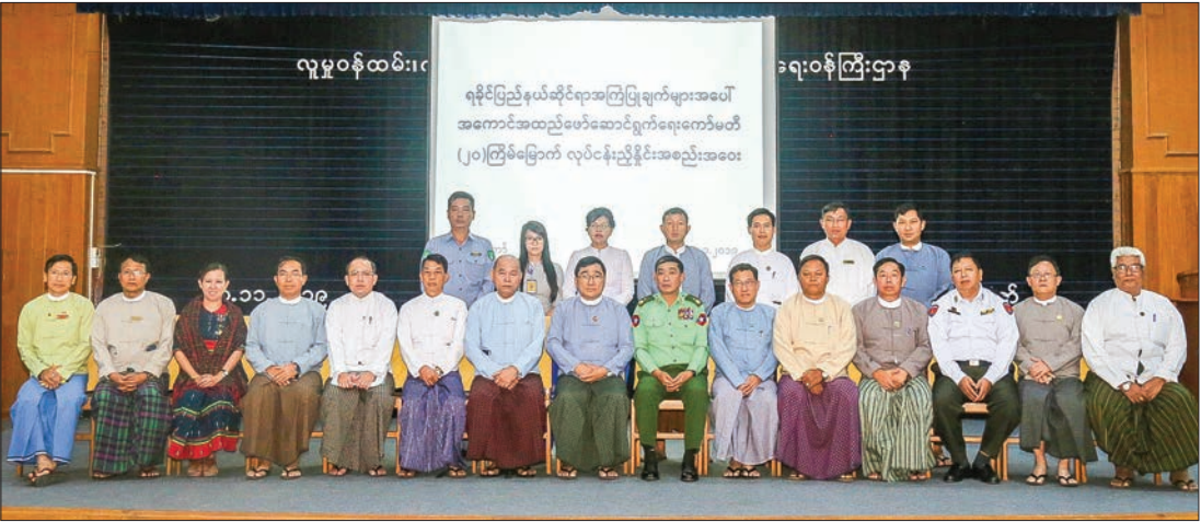
Union Minister Dr Win Myat Aye and attendees pose for a documentary photo at the 20 th coordination meeting of Committee for Implementation of the Recommendations on Rakhine State.

THE Committee for Implementation of the Recommendations on Rakhine State organized its 20 th coordination meeting at the Ministry of Social Welfare, Relief and Resettlement in Nay Pyi Taw yesterday afternoon. It was attended by Union Minister Dr Win Myat Aye, in his capacity as the committee chairman, Deputy Minister for State Counsellor Office and Vice Chairman of the committee U Khin Maung Tin, Deputy Minister for Border Affairs and Secretary of the committee Maj-Gen Than Htut, and committee members. At the meeting, the Union Minister explained the committee’s works for peace and development of Rakhine State, the formation of Advisory Commission on Rakhine State chaired by Dr Kofi Annan