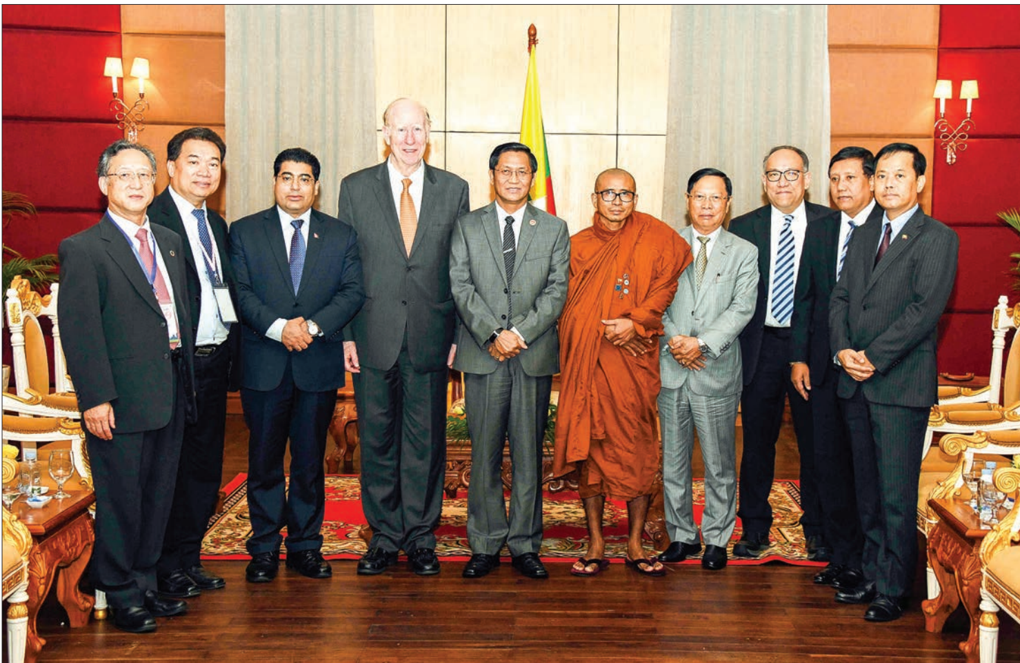
The Myanmar delegation led by Vice President U Henry Van Thio poses for photo together with Dr Thomas G Walsh, the President of Universal Peace Federation (UPF), and party at the Sokha Phnom Penh Hotel yesterday.

M YANMAR delegation led by Vice President U Henry Van Thio will attend the 2 nd Asia-Pacific Summit in Phnom Penh, Cambodia.