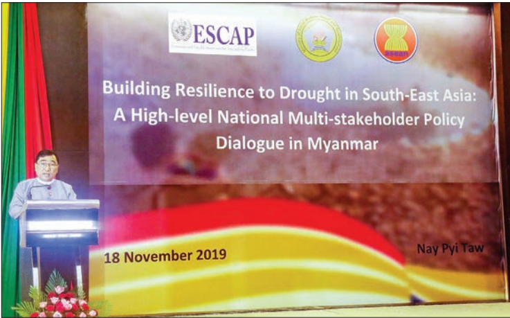
Union Minister Dr Win Myat Aye delivers the speech at the high-level national multi-stakeholder policy dialogue in Myanmar held in Nay Pyi Taw on 18 November.