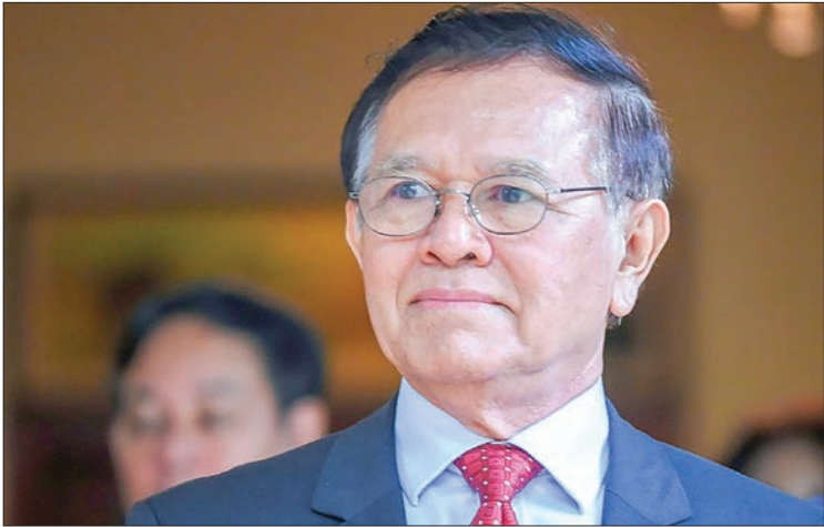
Kem Sokha, 66, is the co-founder of the banned Cambodia National Rescue Party.

Arrested in 2017 and accused of plotting to overthrow Hun Sen's government, he was detained first in a remote prison and then under house arrest before his bail conditions were relaxed last week. The court closed the investigation into his case on Friday but Hun Sen, who has ruled Cambodia since 1985, clarified Monday he would still