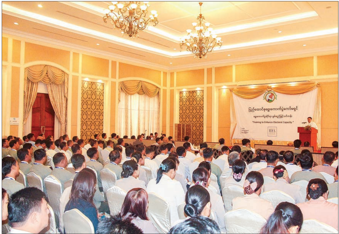
Union Election Commission Chairman U Hla Thein addresses the ceremony to open the “Training to Enhance Electoral Capacity” for the 2020 General Election in Nay Pyi Taw yesterday.

THE opening ceremony of Training to Enhance Electoral Capacity for 2020 General Election for officials and staff from various levels of election sub-commissions was held at Grand Amara Hotel, Nay Pyi Taw yesterday morning. Union Election Commission (UEC) Chairman U Hla Thein attended and addressed the event.