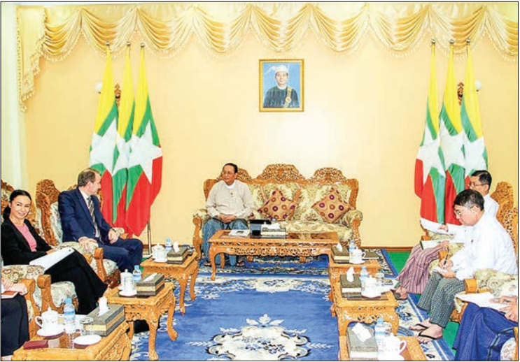
Union Minister U Win Khaing meets with Euro Cham Myanmar Energy Advocacy Group delegation at the Ministry of Electricity and Energy in Nay Pyi Taw yesterday.