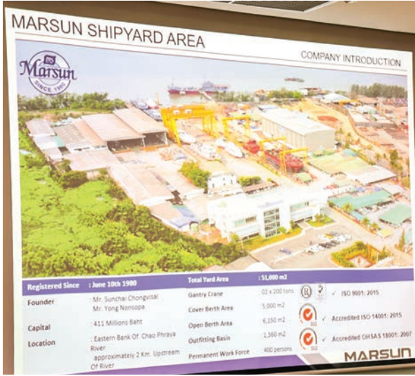
Senior General Min Aung Hlaing observes the Marsun Public Company Ltd in Bangkok, Thailand.

Next, the Senior General visited iGroup Ltd, which focuses on E-Education. The iGroup (Asia Pacific) Limited, is a Hong Kong registered multinational