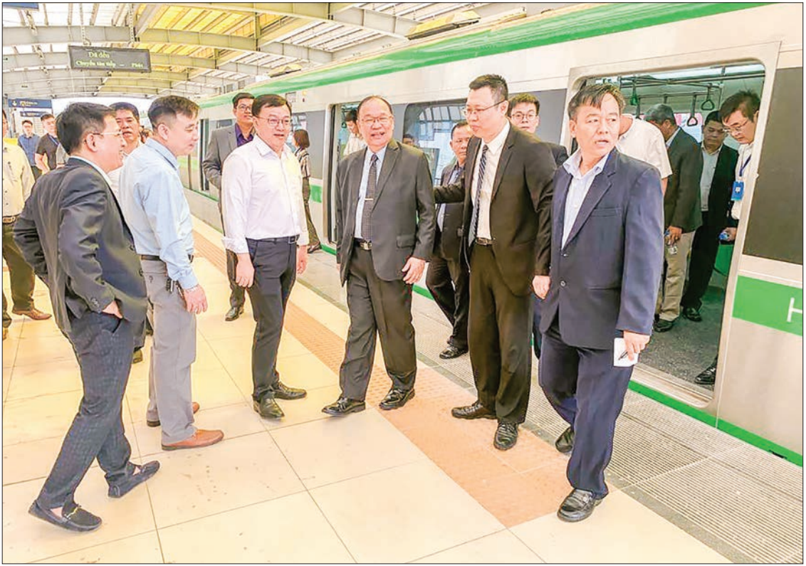
Union Minister U Thant Sin Maung observes the Hanoi Metro rapid transit system project in Hanoi, Viet Nam on 16 November.

to the project. The 13.1 km-long Hanoi Metro system consists of 8 lines, including 12 elevated and underground sections. The estimated cost for the project is US$868 million and is slated to open soon. The Union Minister and party also visited Vietnam Railway headquarters, and Deputy Director General Mr Phan Quoc Anh explained the existing and future railway system of the country. The Union Minister and party arrived back to Yangon on 16 November afternoon.—MNA (Translated by Aung Khin)