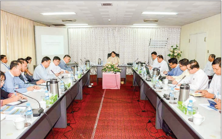
Union Minister for Information Dr Pe Myint attends the preliminary coordination meeting on holding awarding ceremony for the National Literature Awards at MRTV.