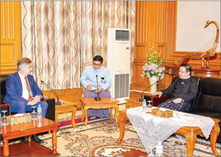
Pyithu Hluttaw Speaker U T Khun Myat meets with German Ambassador Mr Thomas Karl Neisinger in Nay Pyi Taw yesterday.

PYITHU Hluttaw Speaker U T Khun Myat received German Ambassador Mr Thomas Karl Neisinger at the Pyithu Hluttaw guest hall in Nay Pyi Taw yesterday. During the meeting,