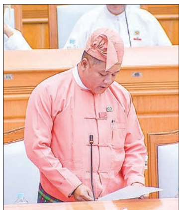
MP U Thant Zin Tun, Dekkhinathiri constituency.