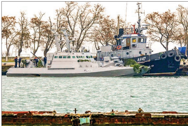
The Ukrainian ships were seized in November last year in the most serious confrontation between the two countries since the start of the conflict in 2014.

said on Monday that the ships — two gunboats and a tugboat — had been handed over to Ukraine.