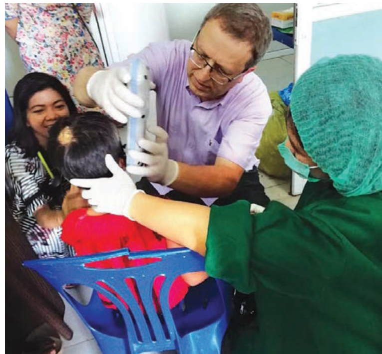
Doctor gives medical check-up to a child.