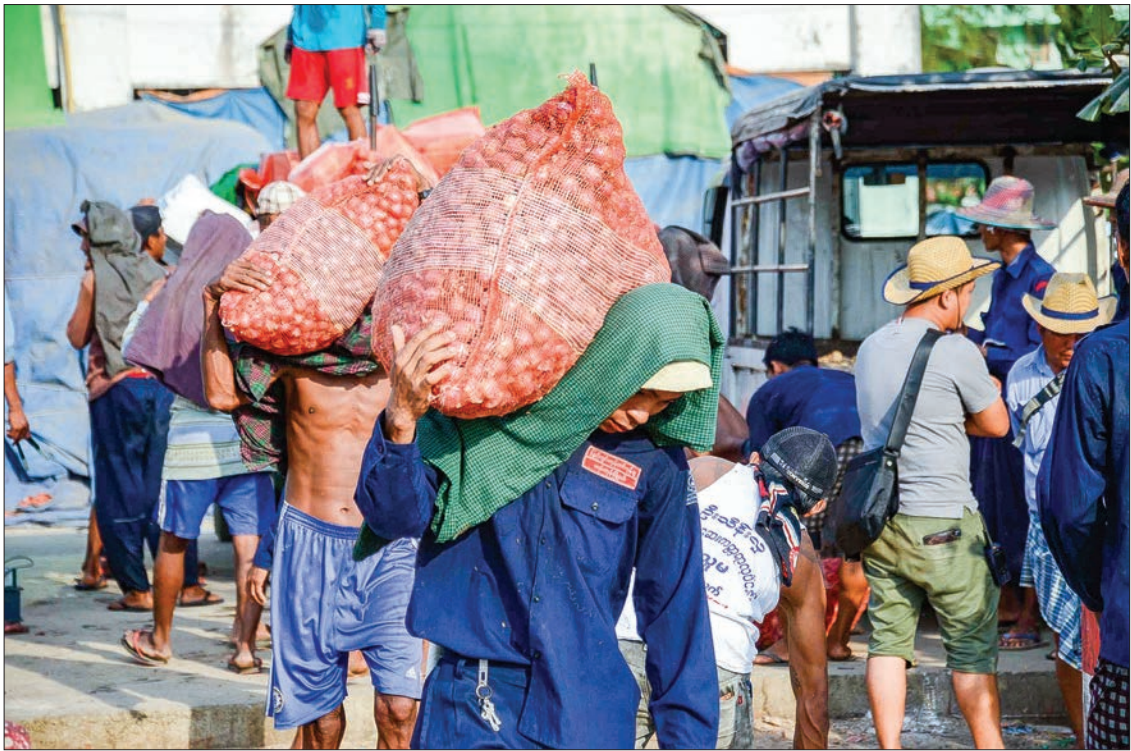
Labourers carrying sacks of onions on their shoulders.

900 per viss in September. Last month, Bangladesh's demand for Myanmar's onions coupled with