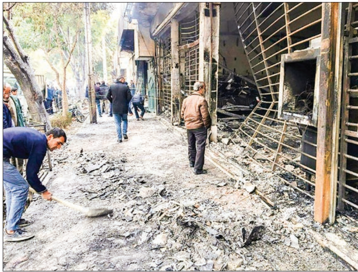
This bank was set ablaze by protesters in Iran’s central city of Isfahan.

Ali Rabiei said the situation was “calmer” on Monday.