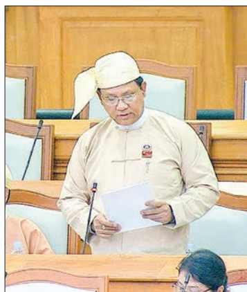
MP U Maung Maung Ohn, Ayeyawady Region constituency 5.