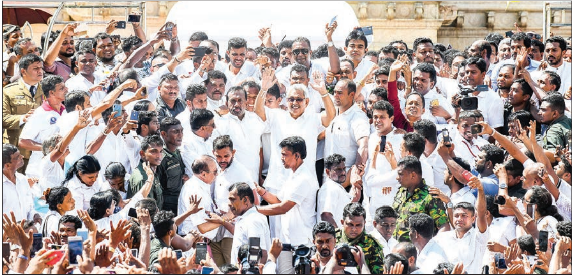
Gotabaya Rajapaksa's landslide election win split the island nation of 21.6 million on religious and ethnic lines as never before.

This makes the brothers heroes among Sri Lanka's Sinhalese majority and the powerful Buddhist clergy. But around 40,000 Tamil civilians were allegedly killed in the closing stages of the conflict, which ended in 2009, and Saturday's election saw Tamils — who account for about 15 percent of the population — vote overwhelmingly against Rajapaksa. —AFP ■