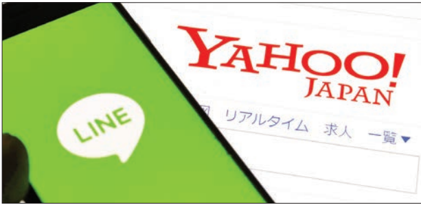
Photo taken in Tokyo on 15 November 2019, shows the logos of Line and Yahoo Japan.

TOKYO — A SoftBank Corp. group firm said Monday it has agreed to merge its subsidiary Yahoo Japan Corp. with messaging app provider Line Corp. by October next year to create the largest online company in Japan to compete with Amazon.com Inc. and other foreign rivals. By making full use of the combined number of domestic users, exceeding 100 million, Yahoo Japan