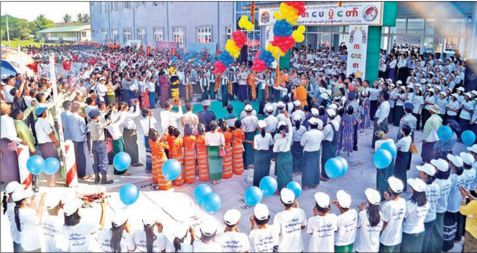
The opening ceremony for Children Literary Festival held in Kyaiklat Township, Pyapon District in Ayeyawady Region.