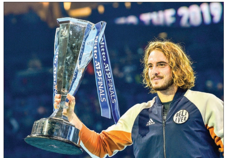
Stefanos Tsitsipas poses with the ATP Finals trophy.

Last year, young German Alexander Zverev pummelled Novak Djokovic in the final but