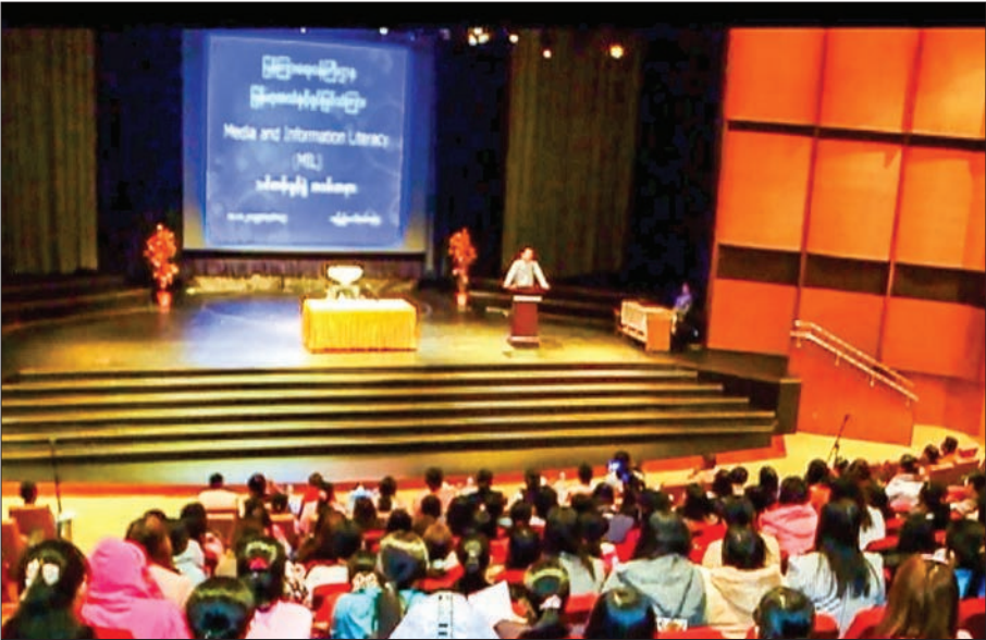
Deputy Minister for Information U Aung Hla Tun delivers the speech at the opening ceremony of Media and Information Literacy course in Nay Pyi Taw.

THE first Media and Information Literacy Course for the staff members of Myanmar Radio and Television under the Ministry of Information was launched at the Auditorium of MRTV in Tatkon in Nay Pyi Taw yesterday morning. Deputy Minister for Information U Aung Hla Tun made an opening remark on the course, saying the rising num-