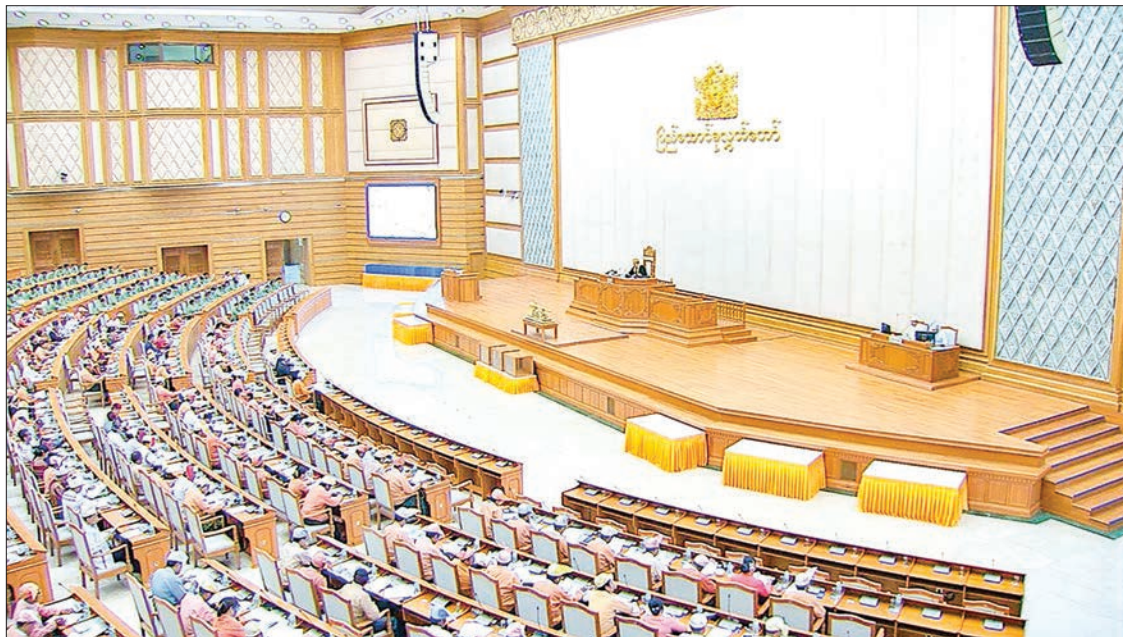
Second Pyidaungsu Hluttaw's 14 th regular session holds its sixth-day meeting in Nay Pyi Taw yesterday.