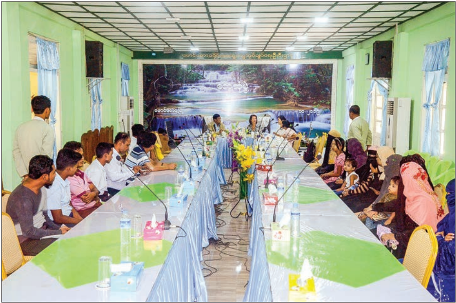
Deputy Minister U Soe Aung and UN Secretary-General's Special Envoy on Myanmar Ms. Christine Schraner Burgener hold a meeting with ethnic locals, Muslim people and Hindu community in Maungtaw Township yesterday. PHOTO: MNA

try. She also privately met with women from the fled families. In the afternoon, the Deputy Minister and party arrived back to Sittway by the military helicopter. The Special Envoy and party held talks with Rakhine State Hluttaw Speaker U San Kyaw Hla and Deputy Speaker U Mya Than at the Hluttaw about IDPs, ceasefire talks, possibility of more returnee arrivals, views on 2020 General Election and holding elections in Rakine State.—MNA (Translated by Aung Khin)