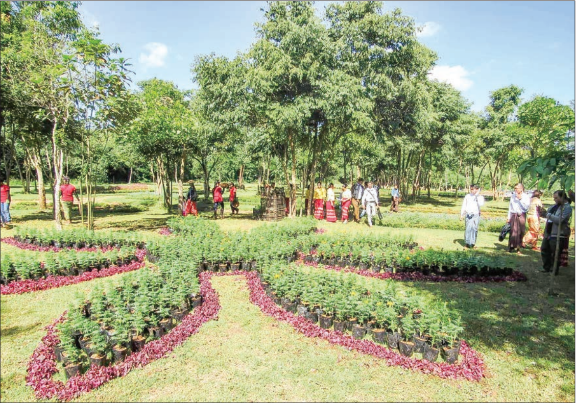
Visitors are going sightseeing at December Garden in Pyin Oo Lwin. The first flower festival will be held in December Garden from 18 December to 18 January

“With the aim to conserve the environment, we have built all buildings with wood, bamboo, and natural products. All the things in our garden are decorated with streams, waterfalls, and flower gardens. In addition, visitors can take recreation while enjoying the natural scenic views of our garden,” said U San Tint, in charge of the garden. The month-long flower festival will take place on 50 acres out of the 150-acre Garden. An entrance fee of K1,000 will be charged per person