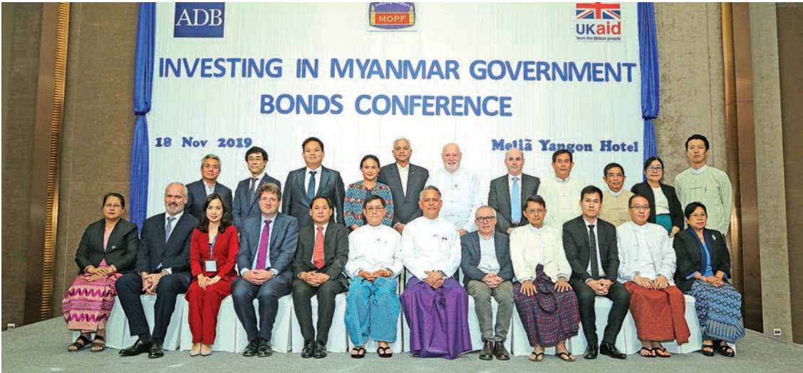
Deputy Minister for Planning & Finance U Maung Maung Win and attendees of the conference pose for a photo.

A conference on investing in Myanmar government bonds was organized at the Melia Hotel in Yangon yesterday. It was jointly organized by the Ministry of Planning and Finance, the Asian Development Bank and the UK's Department for International