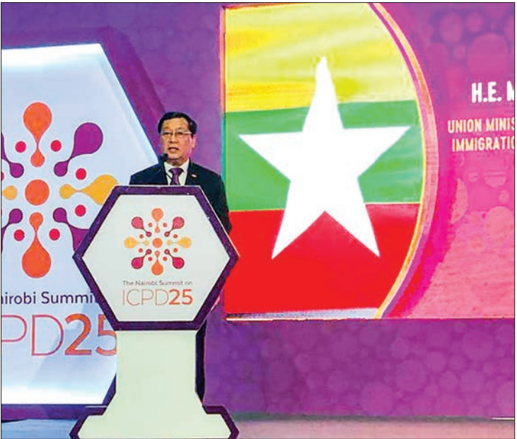
Union Minister for Labour, Immigration and Population U Thein Swe addresses the 25 th World Population Day commemoration and Nairobi Summit on ICPD25 in Nairobi, Kenya.

On the first day of the summit, the Union Minister met with UNFPA Deputy Executive Director (Programme) Mr Dereje Wordofa and discussed the success of the 2014 Myanmar Population and Housing Census undertaken with UNFPA's collaboration, technical assistance in the 2019 Interim Census, implementation of an e-ID system in Myanmar, further assistance for the 2024 Census, and other areas of cooperation. On the second day of the summit, Union Minister U Thein Swe took on the role of patron at the Health Work Force: The Dream Team for Sustainable Transformation