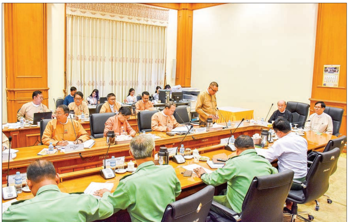
Hluttaw Deputy Speakers U Tun Tun Hein and U Aye Tha Aung attend the meeting 58/2019 of the Joint Committee on Amending the 2008 Constitution in Nay Pyi Taw yesterday.