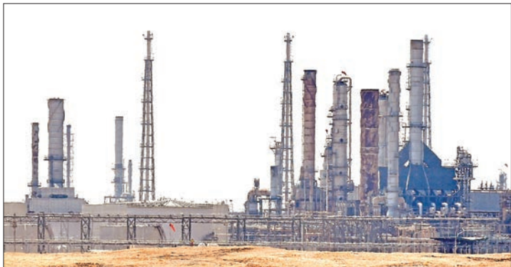
The file photo taken on 15 September 2019 shows an Aramco oil facility near al-Khurj area, just south of the Saudi capital Riyadh.

The source did not offer an explanation but the company has shied away from plans to list on foreign exchanges such as New York owing to litigation risks. The launch has been dogged by delays since the idea was first announced in 2016, with Prince Mohammed's desired valuation of $2 trillion meeting with scepticism from investors and analysts.—AFP ■