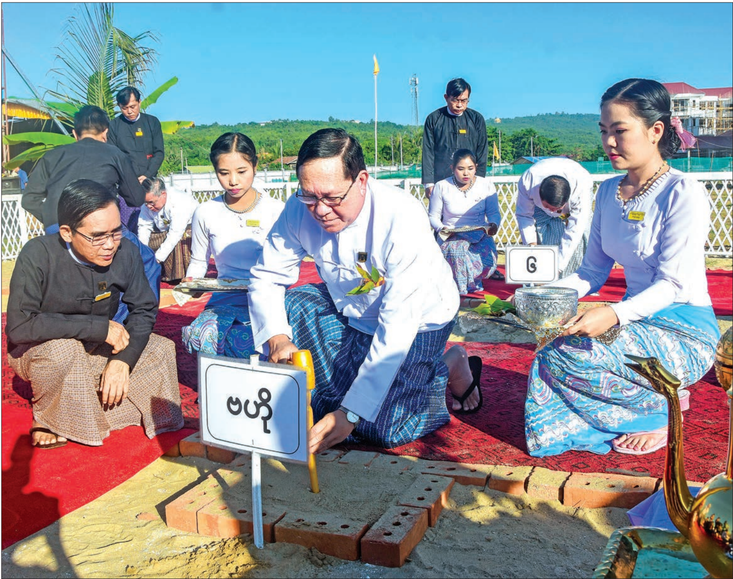
Union Chief Justice U Htun Htun Oo strikes the stake at the groundbreaking ceremony to build Judicial College of the Union Supreme Court in Nay Pyi Taw yesterday.

Vol. VI, No. 215, 7 th Waning of Tazaungmon 1381 ME www.globalnewlightofmyanmar.com Monday, 18 November 2019