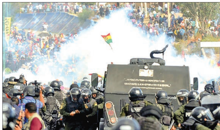
There have been frequent clashes between supporters of ex President Evo Morales and Bolivian riot police.

Thousands of coca growers had tried to reach the city to join a protest against Anez but they were blocked by riot police, who stopped them from crossing a bridge and dispersed the crowd after dark with the support of the army. Five protesters were initially reported dead in the confronta-