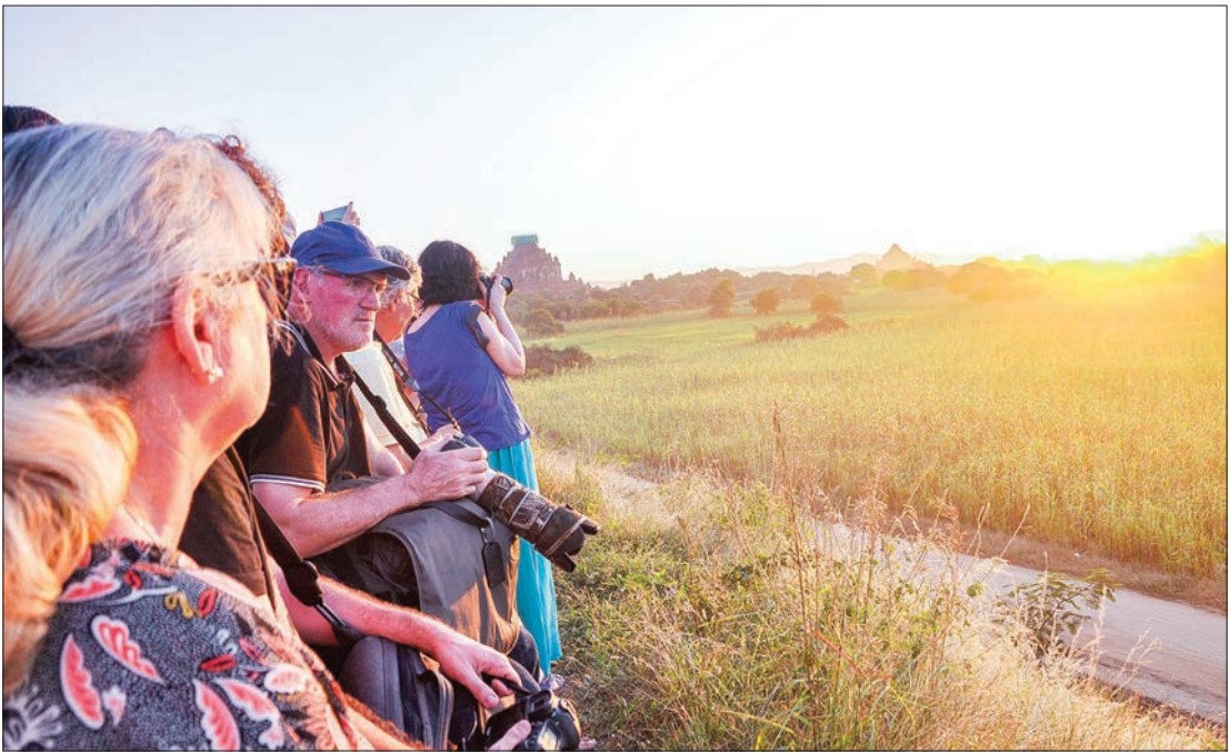
Tourists visit Bagan to catch the glimpse of historical temples in the backdrop of sunset.

“Starting from the first week of November, tourists are increasingly thronging to Bagan, a famous tourist destination in Myanmar, and they are mostly visiting in the high season. They like to enjoy Bagan’s sunset views. Most of them are Chinese,