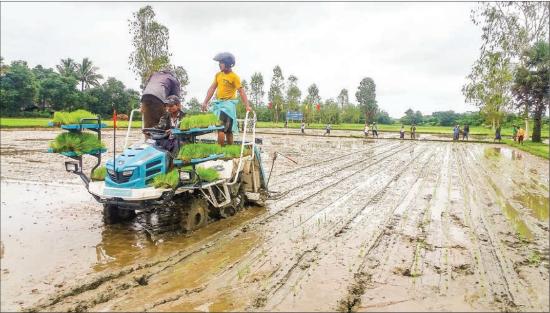
Farmers planting rice in the field by using rice planting machine.

During Phase I, four ASC projects will be implemented in Kyaiklat Township in Ayeyawady Region, Twantay Township in Yangon Region, Madaya Township in Mandalay Region, and Kyauktaw Township in Rakhine State, according to the signing