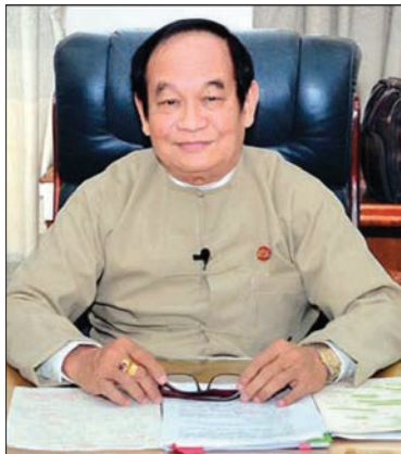
Union Minister for Health and Sports Dr Myint Htwe.

"In order to do this, we organize training courses and send them abroad for international