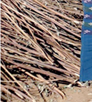
Tourists visit a CBT village in Meiktila Township, Mandalay Region.

mains for generations to come. The CBT provides opportunities for local people to bring in income and also to introduce their culture to visitors. The CBT can provide income and opportunities for all people, including women and other disadvantaged groups such as people with disabilities. In addition, the CBT gives local people a chance to share their culture with the world, as well as learn more about other peoples' cultures and experiences. Tourism activities should not damage the local community's way of life or traditions. Safety is important to CBT travelers, especially because some developing countries are politically unstable. Most international tour operators do not offer holi-