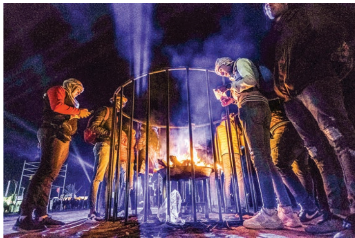
People dance at the electronic music festival “Les Dunes Electroniques” at Ong Jmel, near the town of Nefta in western Tunisia on 16 November 2019, where the original Star Wars film was shot.

It is organised by a Franco-Tunisian hotelier with backing from the Tunisian tourism ministry. This year the festival — named “Les Dunes Electroniques” — has drawn around 20 musicians, including award-winning Swiss-Chilean DJ Luciano.—AFP ■