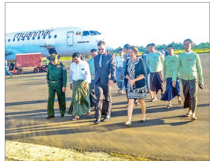
Officials welcome Deputy Minister U Soe Aung and Special Envoy of United Nations Secretary-General to Myanmar Ms. Christine Schraner Burgener at Sittway Airport yesterday.

A delegation led by Deputy Minister for Social Welfare, Relief and Resettlement U Soe Aung and Special Envoy of United Nations Secretary-General to Myanmar Ms. Christine Schraner Burgener arrived at Sittway from Yangon by air at