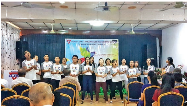
Youths performing at the World Week of Prayer by the World YMCA and YWCA event in Yangon.

THIS year’s World Week of Prayer by the World YMCA and YWCA was held from 10 to 16 November, under the theme “Young people transforming