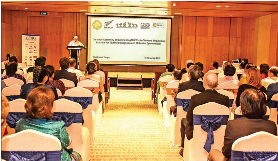
Union Minister Dr Myint Htwe delivers the speech at the Donation ceremony of the Whole Genome Sequencing machine in Yangon on 16 November.

MINISTRY of Health and Sports has received a modern Whole Genome Sequencing machine which can determine complete genome sequence for a given organism at one time.