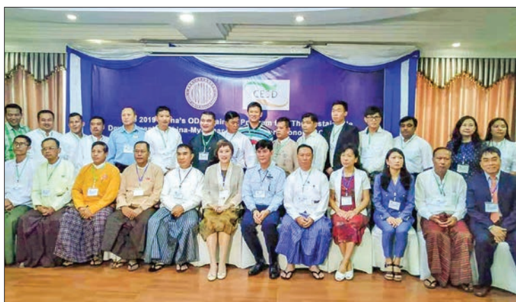
Officials and trainees pose for a group photo at the opening ceremony of the training course for sustainable economic cooperation between Myanmar and China in Mandalay yesterday.