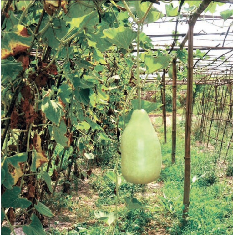
Fresh green vegetable plantations of the Community based tourism (CBT) in Kyaikthale Village in Twantay Township.