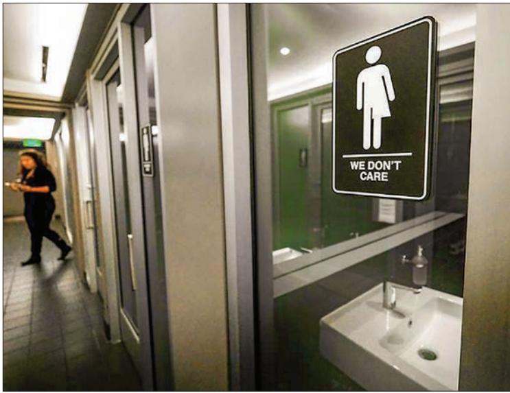
Gender-neutral signs are posted in public restrooms in a hotel in Durham, North Carolina in May 2016.