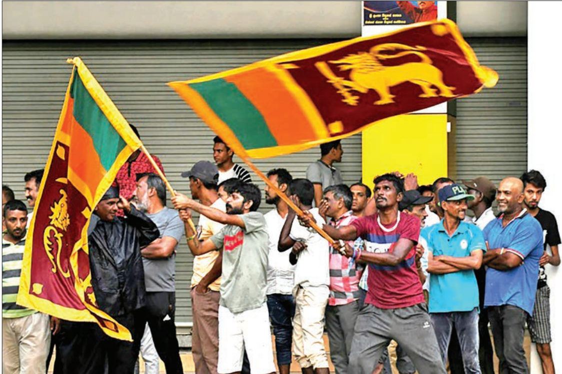
The election was relatively peaceful by the standards of Sri Lanka's fiery politics.

COLOMBO (Sri Lanka)—Gotabaya Rajapaksa, who spearheaded the brutal crushing of Tamil Tigers a decade ago, stormed to power Sunday but promised to be a president for all Sri Lanka's races and religions after a divisive election.