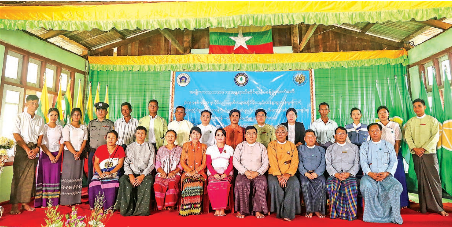
Union Minister Dr Win Myat Aye and officials pose for a group photo at the opening ceremony of the four-day course of training for trainers to conduct grading and registration of persons with disabilities in Nyaunglebin yesterday.

ernment also expressed thanks for selecting Nyaunglebin Township as a pilot project area. The Deputy Representative of UNICEF in Myanmar explained the processes of pilot project for the grading and registration. The TOR course for this programme is attended by 148 persons from the government departments, women committees, the associations of persons with disabilities, Red Cross Society, and social organizations. In the afternoon, the Union Minister and party arrived at Thamin Inn Gone Village in Kyauktaga Township and presented K 1.6 million for reconstruction of toilet damaged by floods. They proceeded to Taungkhin village to provide K 194.473 million cash assistance of National Disaster Management Committee for reconstruction of inter-village rock road between Thahtaygone and Taungkhin villages. The Union Minister and party also presented 2,000 units of school dresses and K15 million for construction of earth retaining walls to prevent soil erosion of Tonkan creek.—MNA (Translated by Aung Khin)