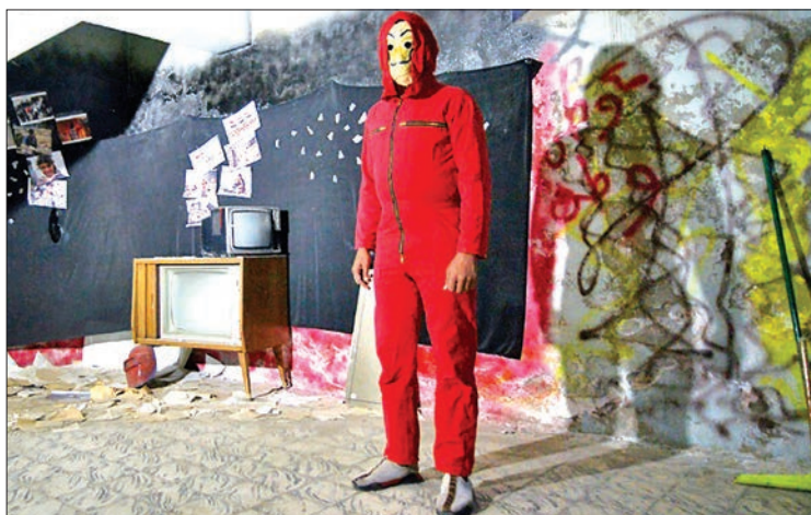
The viral music video has scored hundreds of thousands of hits despite frequent internet blackouts in Iraq.

internet blackouts, hold up signs that read "Justice for our martyrs" and "I want my rights."—AFP ■