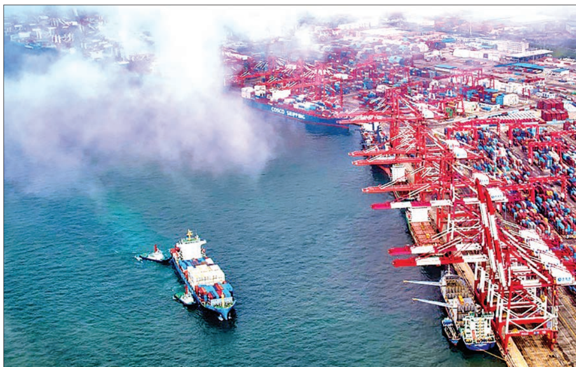
The long-running trade war between Washington and Beijing has weighed on the global economy and spooked markets.