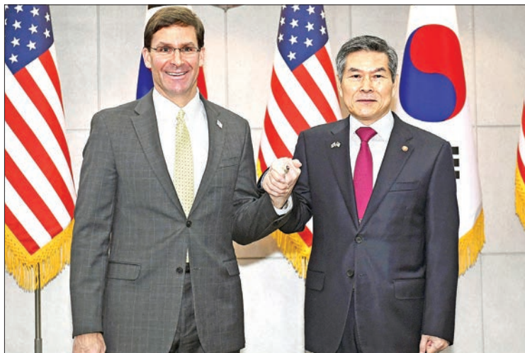
US Secretary of Defense Mark Esper (L) and South Korean Defense Minister Jeong Kyeong Doo shake hands in Seoul on 15 November 2019. They held the annual Security Consultative Meeting.

The gesture toward Pyongyang, which has protested the upcoming drills, appears aimed at reviving nuclear negotiations between North Korea and the United States.