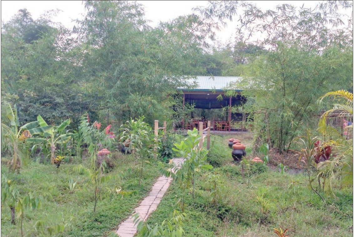
Mingalar Bar Bio Garden Community Based Tourism in Kyaikthale Village in Twantay Township.

prefer CBT to enjoy its natural sceneries, and at the same time the locals will have a chance to communicate with foreigners. The CBT will help local residents reduce poverty rate in the area and contribute to improve their socioeconomic status. The local governments