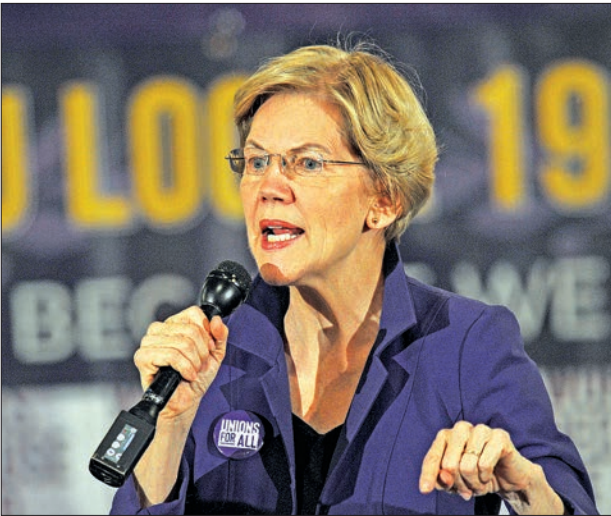
Democratic presidential candidate Elizabeth Warren has taken aim at billionaires in a new campaign ad.

The one-minute campaign ad shows clips of several leading businessmen criticizing her plans for a wealth tax and predicting economic ruin if she is elected to succeed Donald Trump, a