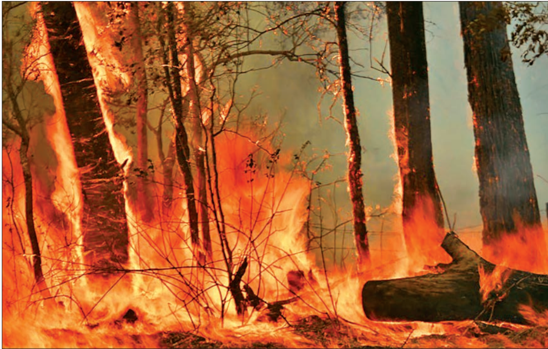
Devastating bushfires have razed more than a million hectares along Australia's seaboard.

SYDNEY (Australia)—An Australian man has been accused of deliberately lighting a fire to protect his cannabis crop, sparking an out-of-control bushfire as blazes rage along the country's east coast.