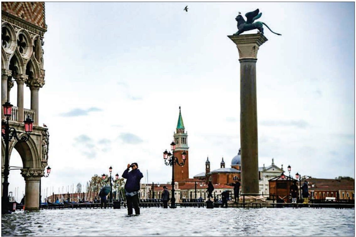
Churches, shops and homes have also been inundated in the city, a UNESCO World Heritage site.

To the south, Tuscany president Enrico Rossi tweeted a warning of a "flood wave" on the Arno and said boards were being installed on the swollen river's banks in Pisa "as a precautionary measure". The Italian army tweeted photos of paratroopers helping to bolster river defences in Pisa, with authorities monitoring the same river in Florence after heavy rain made it rise dramatically overnight. Arno flooding devastated Renaissance jewel Florence in 1966, killing around 100 people and destroying thousands of priceless works of art. Civil protection units in Florence advised citizens "not to stand near the Arno's riverbanks". Firefighters tweeted footage of a hovercraft being deployed to rescue stranded citizens in southern Tuscany's Grossetano province. —AFP ■