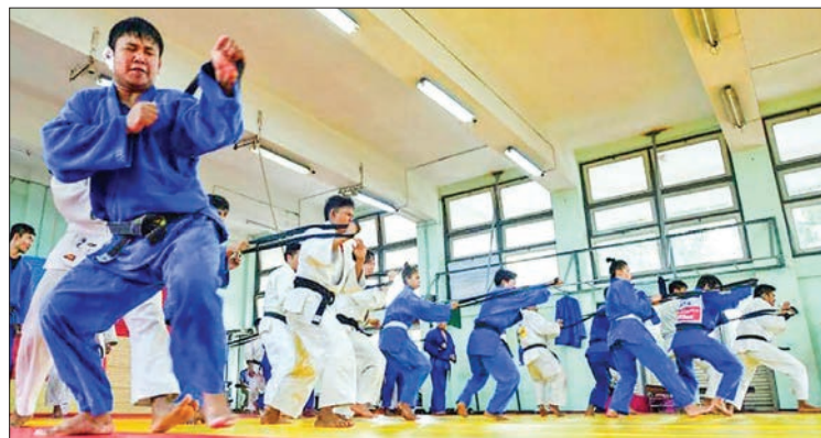
Myanmar athletes take intensive judo training under the supervision of Japanese Judo rainer from Japan's Kodokan Judo Institute.

The team will leave for the Philippines for the SEA Games on 23 November, according to the Myanmar Football Federation.