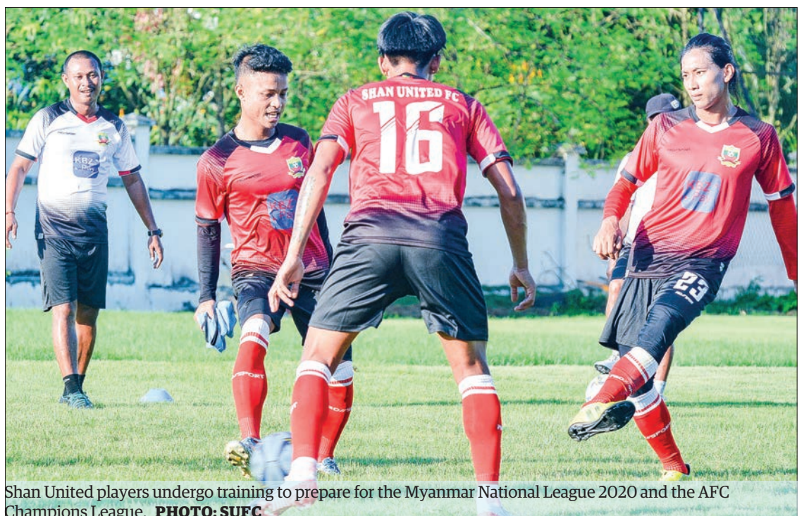
Shan United players undergo training to prepare for the Myanmar National League 2020 and the AFC Champions League.

In 2020, Shan United is slated to compete in two international tournaments — AFC Champions League and the AFC Cup 2020. The team will also compete in a domestic competition — the General Aung San Shield 2020.—Lynn Thit (Tgi)