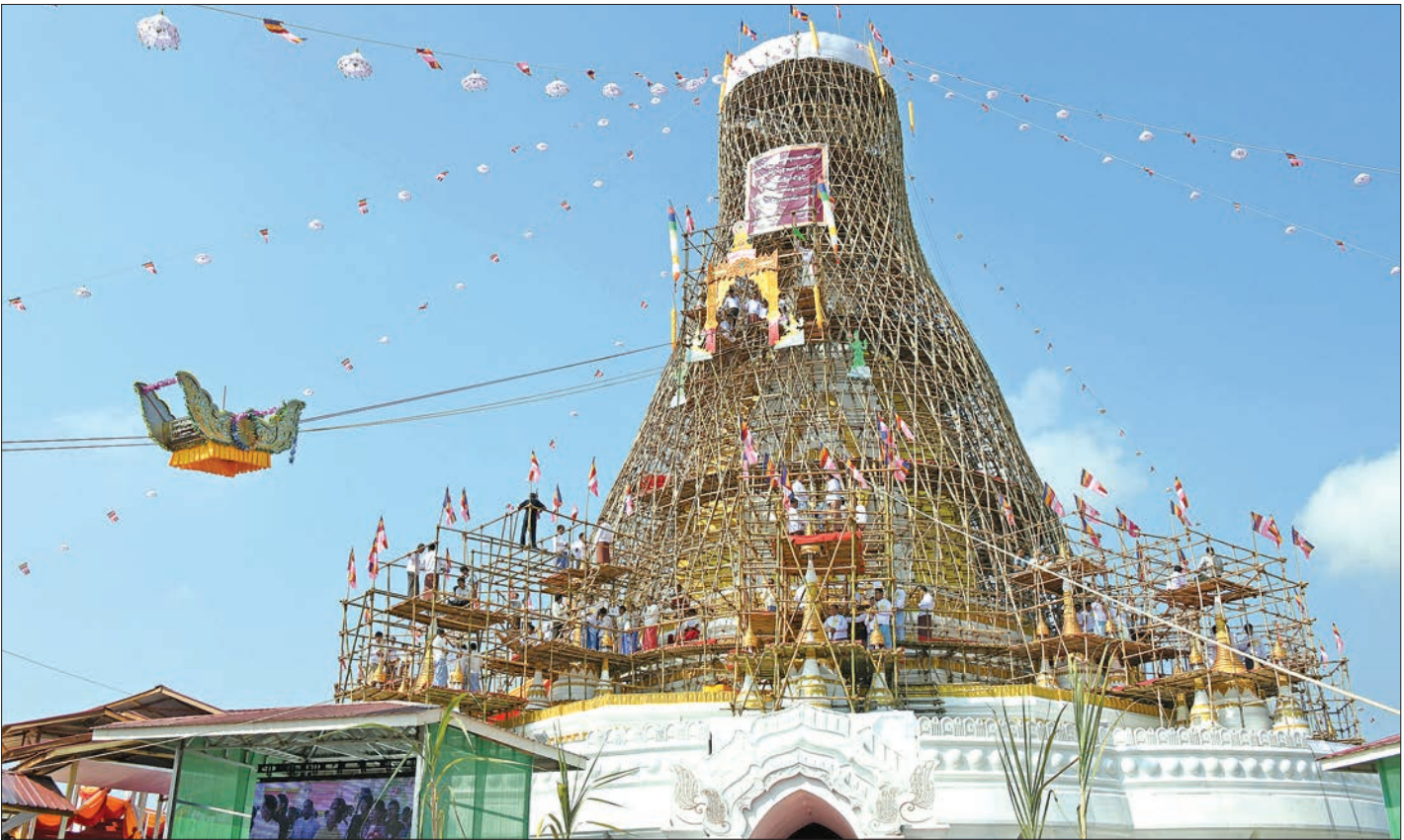
The scared religious objects being conveyed to the Eternal Peace Pagoda.

Sayadaw, the President, the Vice President, the Chairman of Nay Pyi Taw Council and the donors enshrined the relic objects into the reliquary and sprinkled it with scented water.