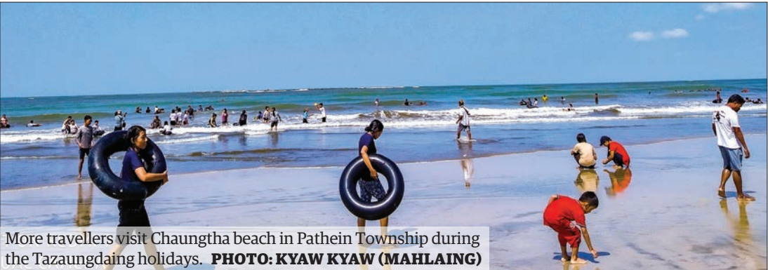
More travellers visit Chaungtha beach in Pathein Township during the Tazaungdaing holidays.

nicipal licenses, while some do not have licenses. Chaungtha beach is crowded with visitors during public holidays, such as the water festival, Thadingyut festival, and Tazaungdaing festival. On such holidays, the hotels are fully booked and room rates are a bit high,” said owners of local hotels, motels, and guesthouses on Chaungtha beach. On 10 November, local and foreign visitors had to shell out anywhere between K60,000 and over K100,000 to stay at Chaungtha beach, depending on the size and condition of the room. According to local residents, the concerned authorities need to conduct an inspection to ensure the safety of visitors at Chaungtha beach. —Kyaw Kyaw (Mahl-aing) (Translated by Hay Mar)