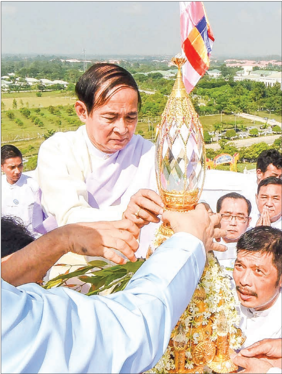
President U Win Myint fixes the diamond bud atop the Eternal Peace Pagoda.