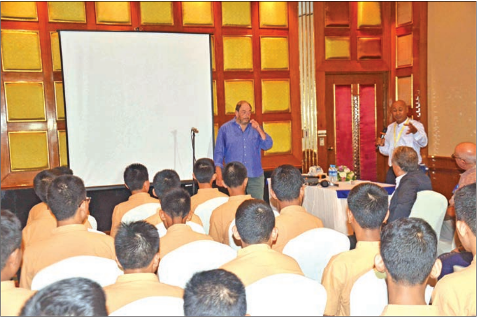
The last day of the 5 th Irrawaddy Literary Festival takes place in Mandalay, yesterday.

THE third and last day of the 5th Irrawaddy Literary Festival took place at Hotel Mercure, Mandalay, yesterday. The festival had paper reading sessions on arts and humanities, roundtable discussions, cartoon drawings and poem recitals as well as