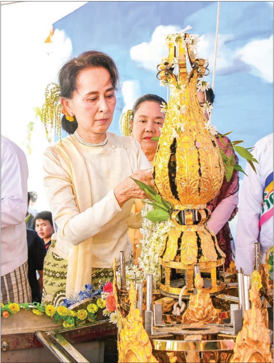
State Counsellor Daw Aung San Suu Kyi sprinkles scented water over the religious object before it is fixed atop the Eternal Peace Pagoda.

the Union Ministers, the Union Attorney-General, Chairman of the Nay Pyi Taw Council, Chairman of the Myanmar National Human Rights Commission, the Chief of General Staff (Army, Navy and Air), Commander of Nay Pyi Taw Command, Deputy Ministers, Members of Nay Pyi Taw Council and wives, donors and invited guests.