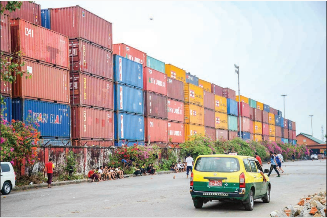
Containers seen at the container yard in Yangon.

MYANMAR’s external trade as of 1 November in the current fiscal year reached US$3.19 billion, an increase of $417 million compared to the corresponding period of the 2018-2019 fiscal year, according to the Ministry of Commerce.