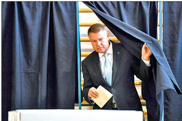
Romanian President Klaus Iohannis casts his ballot at a polling station, in Bucharest.

A Iohannis victory would potentially add to a liberal fightback against the region's prevailing nationalism, following the election of an anti-corruption activist as Slovakia's president and a cen-