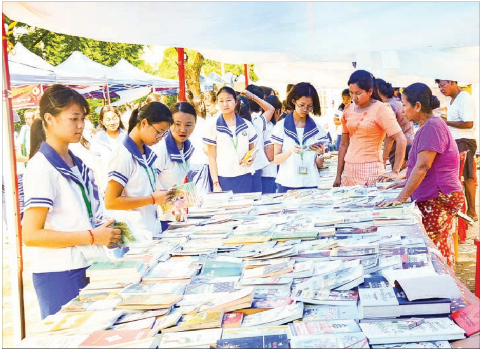
A book shop attracts students at the Irrawaddy Literary Festival in Mandalay.