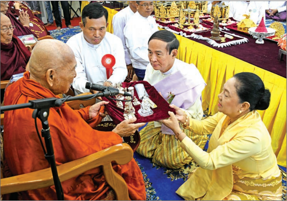
President U Win Myint and First Lady Daw Cho Cho offer religious objects to Sayadaw at the consecration ceremony of Eternal Peace Pagoda yesterday.