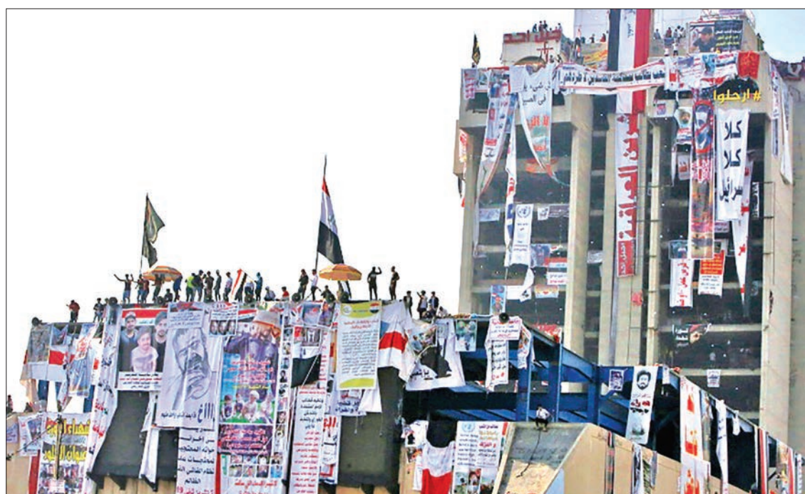
Mass rallies calling for an overhaul of the ruling system have rocked the capital Baghdad and the Shiite-majority south since 1 October.

“If the three authorities — executive, judiciary and legislative — are not able or willing to conduct these reforms decisively,