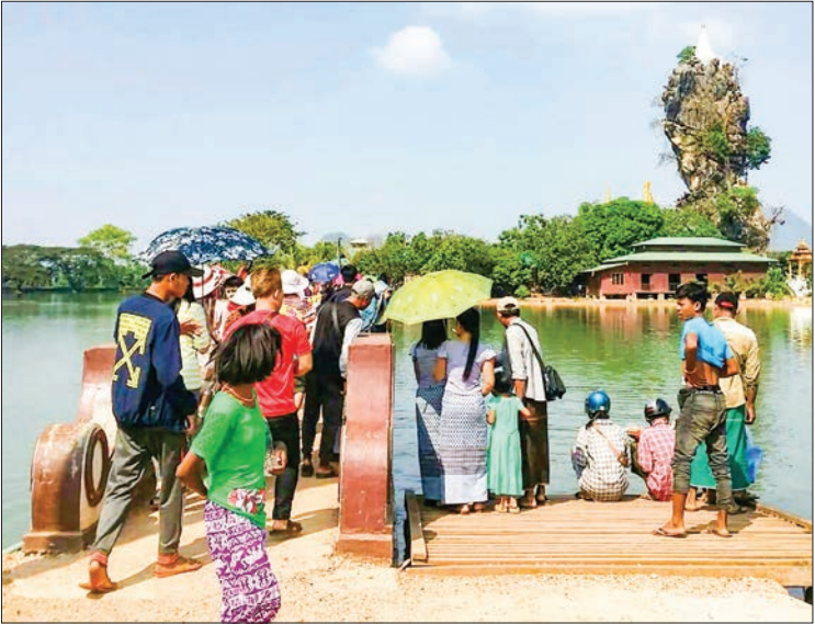
People visit Kyauk Kalat in Hpa-an Township, Kayin State during their Tazaungdaing holidays.