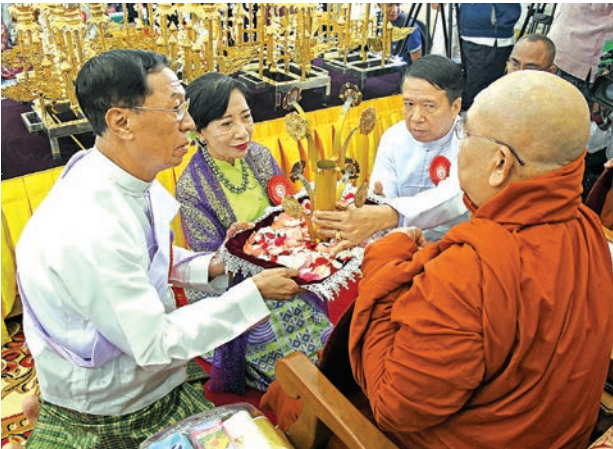
Union Election Commission Chairman U Hla Thein and wife offer religious objects to a Sayadaw.