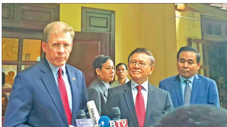
Kem Sokha (c) and Patrick Murphy (l), US Ambassador to Cambodia are pictured at Kem Sokha's house on 11 November 2019.

“The move that was made by authorities yesterday is a step forward,” Ambassador Patrick Murphy told reporters after the one-hour meeting with Kem Sokha, who shares the party’s