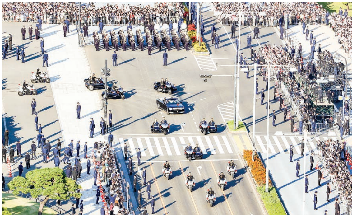
Motorcade of Japan's Emperor Naruhito and Empress Masako leaves the Imperial Palace during a royal parade in Tokyo on 10 November 2019.

“And Empress Masako is someone who can be a role model for modern women with full-time jobs.” After the national anthem was played, the royal couple boarded a specially made car featuring the chrysanthemum imperial logo on the sides and the royal flag on its bonnet. — AFP ■