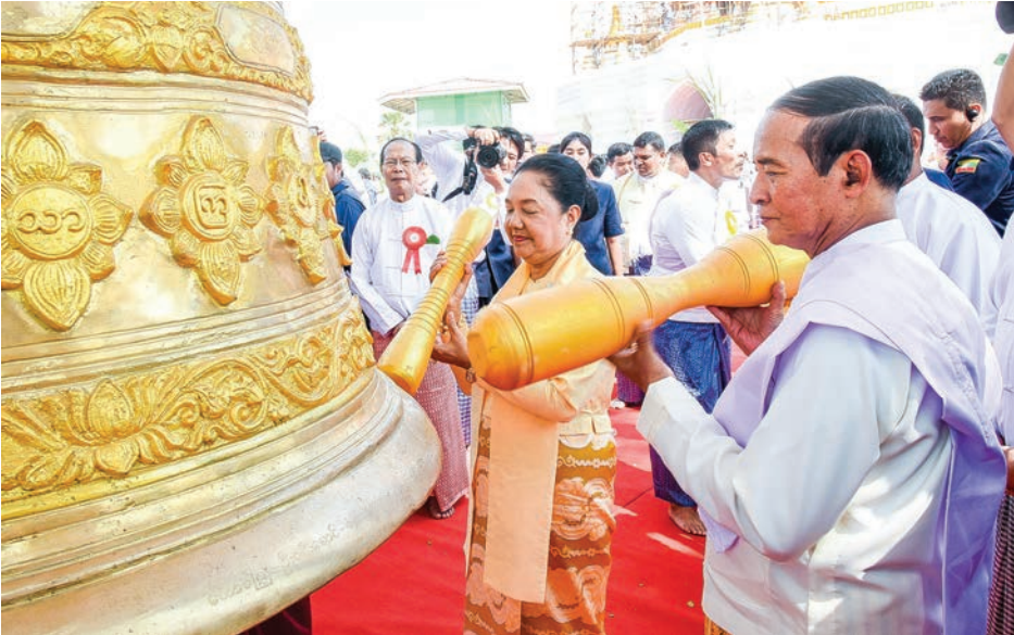
President U Win Myint and First Lady Daw Cho Cho strike a bell at the ceremony to consecrate the Eternal Peace Pagoda.