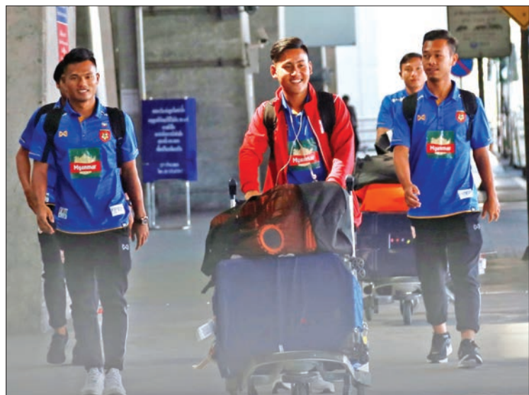
The Myanmar U-22 national footballers arrive in Bangkok yesterday for a friendly match against the Thailand U-22 team.