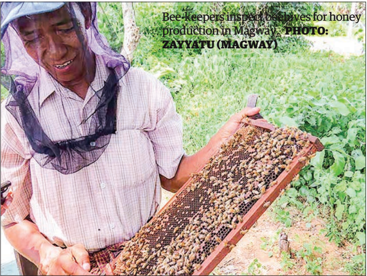
Bee-keepers inspect beehives for honey production in Magway.