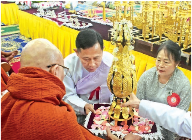
Vice Senior General Soe Win and wife offer religious objects to a Sayadaw.

Shwe Parami Forest Monastery Sayadaw, the President, the Vice President and the Chairman of Nay Pyi Taw Council attached the golden holy umbrella to the top of the ornamented Victory Column or Tagundaing, and sprayed with scented water on it. The State Counsellor also sprayed scented water over the monument of the Victory Column. Then, the President and wife, and the State Counsellor struck the golden bell, and the Vice President and wife struck the golden gong nine times respectively before spraying the scented water on these ceremonial objects.