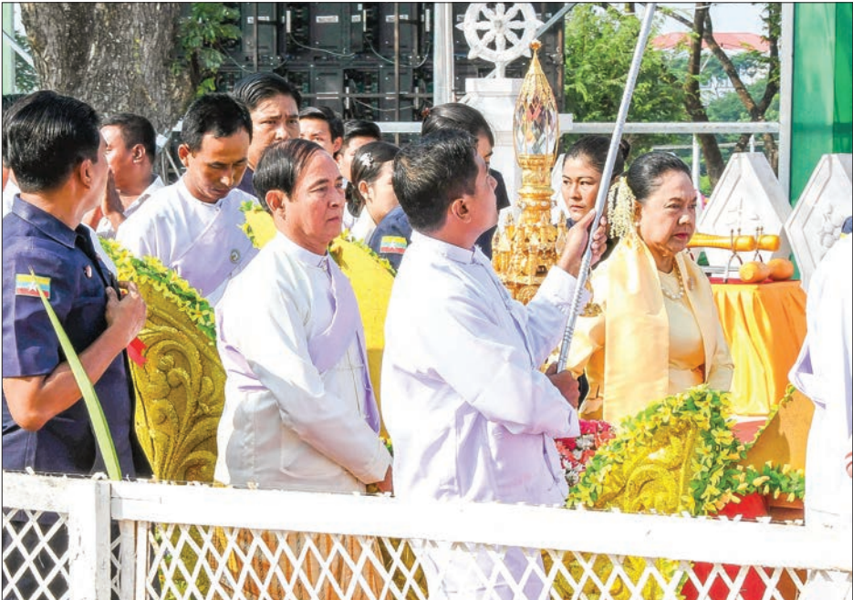
President U Win Myint and First Lady Daw Cho Cho convey religious objects which will be fixed atop the Eternal Peace Pagoda in Nay Pyi Taw yesterday.