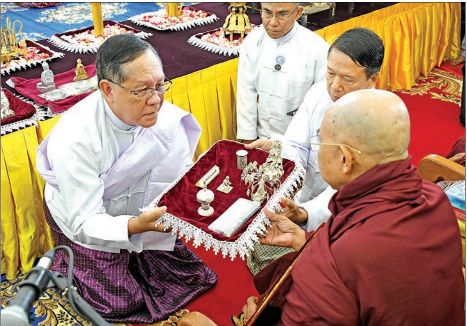
Chief Justice of the Union U Htun Htun Oo offers religious objects to Sayadaw at the consecration ceremony of Eternal Peace Pagoda yesterday.