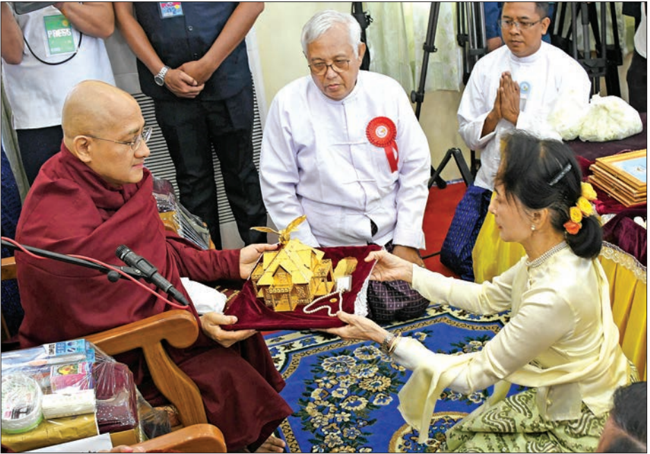
State Counsellor Daw Aung San Suu Kyi offers religious objects to Sayadaw at the consecration ceremony of Eternal Peace Pagoda yesterday.