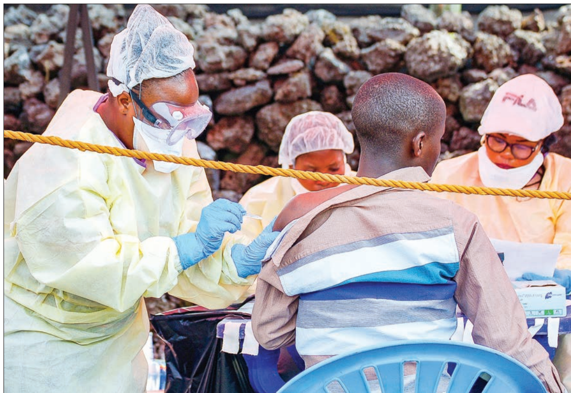
A young man receives a vaccine against Ebola from a nurse in Goma on 7 August 2019.

GOMA (DR Congo) — A local radio station that has been involved in the fight against Ebola in eastern DR Congo said Monday it was closing down after one of its broadcasters was murdered.