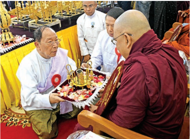
Constitutional Tribunal Chairman U Myo Nyunt offers religious objects to a Sayadaw.