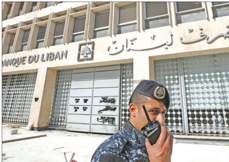
A member of the Lebanese security forces stands at the entrance of the Central Bank after anti-government protesters broke down a construction barrier as they rally at the same time of a press conference held by the bank's governor in Beirut on 11 November 2019.

He said the central bank had asked banks to maintain the same ceilings on credit cards and allow customers to repay US dollar loans in the local currency. —AFP ■