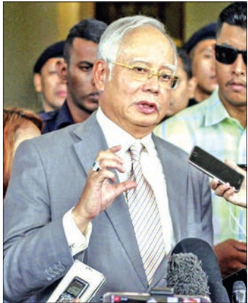
Former Malaysian Prime Minister Najib Abdul Razak speaks to reporters in Kuala Lumpur on 25 October 2018, after being released on bail.

KUALA LUMPUR — A Malaysian court on Monday ordered a corruption case against former Prime Minister Najib Abdul Razak to proceed, saying the prosecution has provided sufficient evidence so far in his first trial linked to a scandal-plagued state investment fund.