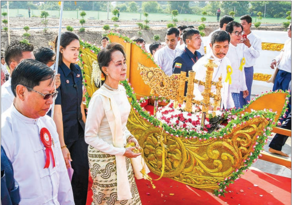
State Counsellor Daw Aung San Suu Kyi conveys religious objects which will be fixed atop the Eternal Peace Pagoda in Nay Pyi Taw yesterday.