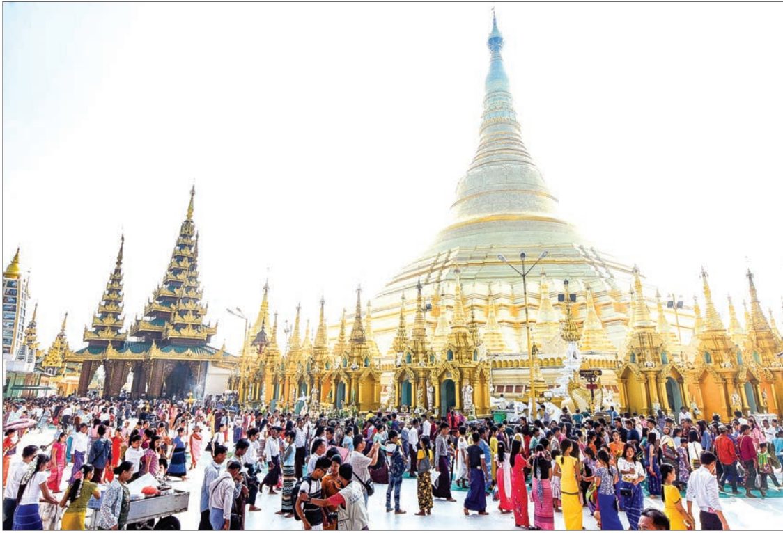
Shwedagon Pagoda is crowded with pilgrims on the Fullmoon of Tazaungmon in Yangon yesterday.