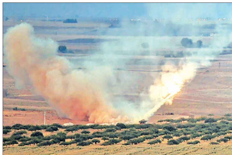
Turkey captured many IS fighters in recent operations in Syria.

He defended his legacy Sunday, which includes landmark gains against hunger and poverty and tripling the country’s economy during his nearly 14 years in office.—AFP ■