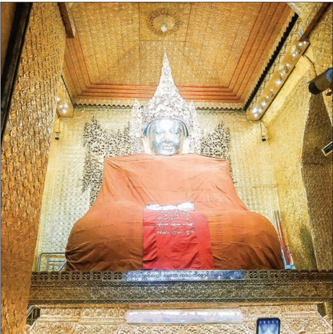
Pilgrims pay homage to Mahamuni Buddha Image in Mandalay on the fullmoon of Tazaungmon yesterday.