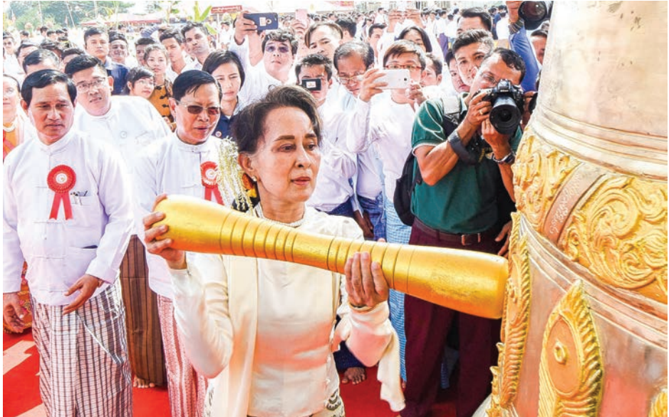
State Counsellor Daw Aung San Suu Kyi strikes a bell at the ceremony to consecrate the Eternal Peace Pagoda.