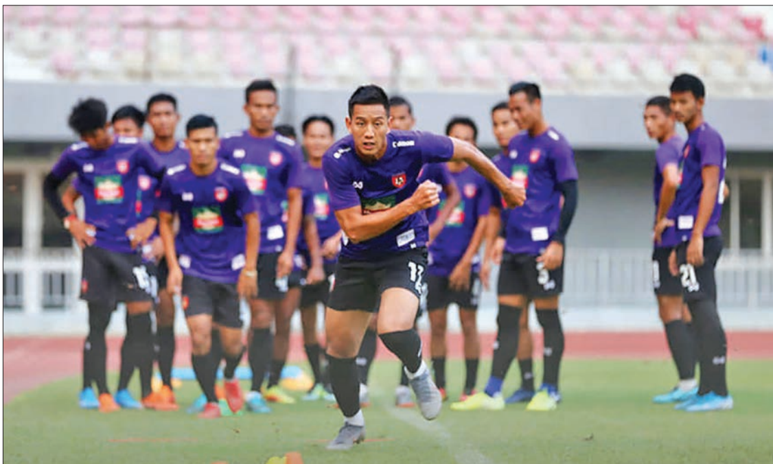
The Myanmar national team footballers undergo special training at the Mandalay Thiri Stadium in Mandalay ahead of the match against Tajikistan.

The Myanmar vs Tajikistan match will start at 5 p.m. (Myanmar Standard Time) on 14 November.—Lynn Thit (Tgi)