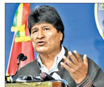
Bolivian President Evo Morales resigned on 10 November 2019, a day after this pictured address.