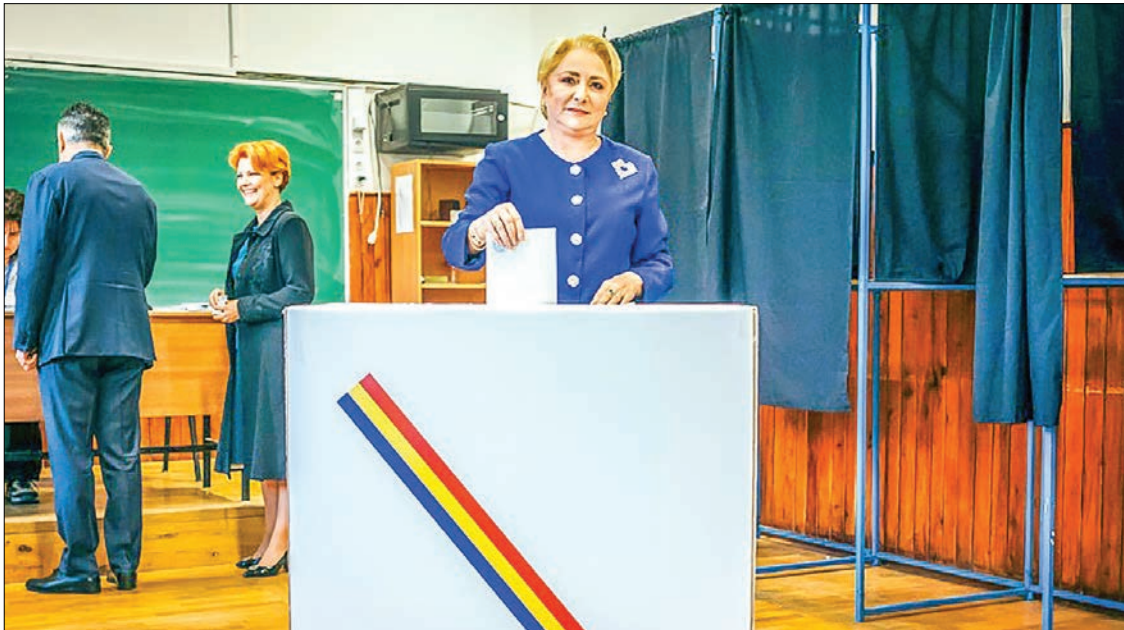
Former prime minister and presidential candidate Viorica Dancila casts her ballot.

BUCHAREST—Romania voted in the first round of a presidential election on Sunday, with pro-European incumbent Klaus Iohannis the favourite to win, potentially adding to a liberal fightback against the region's prevailing nationalism.