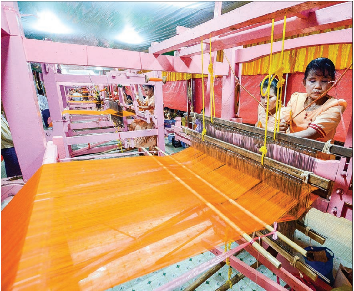
Women weaving of Matho Thingan (robe) at the Botahtaung Pagoda, Yangon yesterday.