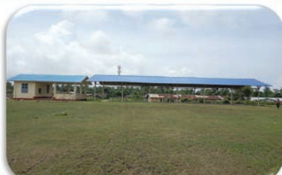
Construction of Passenger Terminal at Sittwe Railway Station