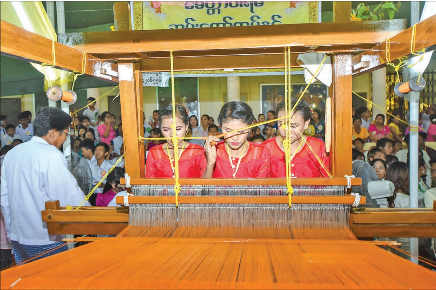
Contestants weaving a robe at the Matho Robe-Weaving Contest at the Shwedagon Pagoda in Yangon yesterday.

TRADITIONAL robe-weaving contests were organized at famous pagodas across the country yesterday, on the eve of the Full Moon Day of Tazaungmon. At the Matho robe-weaving contest, a centuries-old tradition, participating teams make beautiful decorative robes for the Buddha statues in the temples. The teams that make the most beautiful robes win.