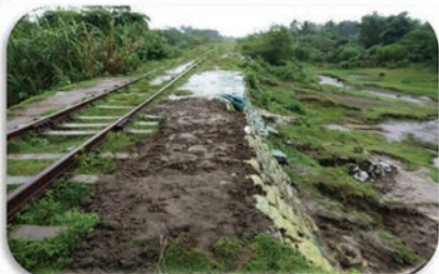
Maintenance of Raised Roadway in Pyitawthar-Yaychanpyin Section of the Road