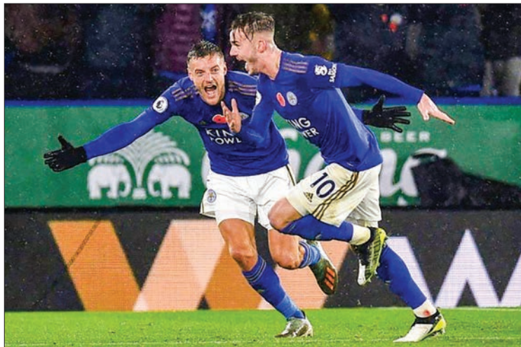
Flying Foxes: Jamie Vardy (left) and James Maddison (right) scored in Leicester's 2-0 win over Arsenal.

advantage of kicking off a day earlier to move a point ahead of City and close to within five