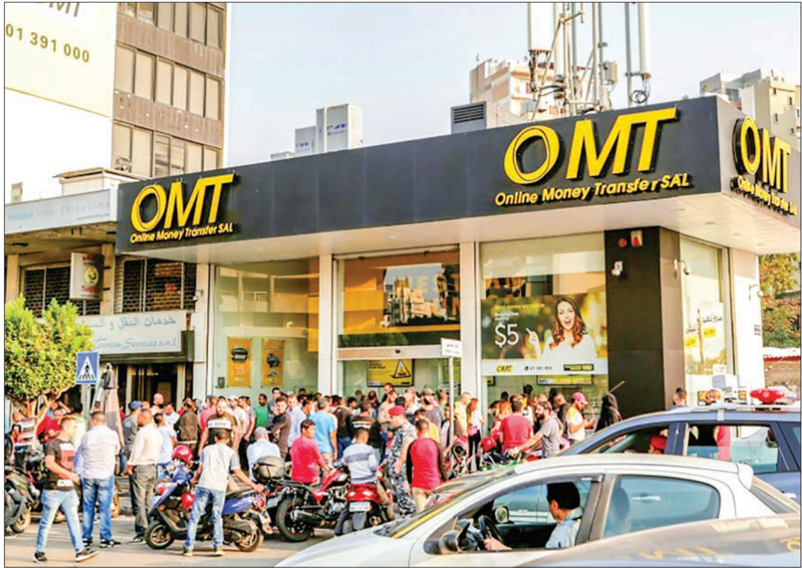
A big queue formed outside this money transfer shop in Beirut.

BEIRUT — A rationing of dollars by banks in protest-hit Lebanon sparked growing alarm on Saturday as some petrol pumps ran dry and grocery stores hiked prices. The president and banking officials responded by pledging to take steps to improve the situation and help businesses to stay open. For two decades, the Lebanese pound has been pegged to the greenback and the currencies are used interchangeably in daily life. But banks have been reducing access to dollars since the end of the summer, following