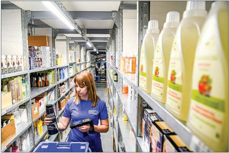
Online retailer Ozon handles over 100,000 packages a day at one of its logistics centres in the town of Tver.

an appealing – and sometimes even the only – option in Russia. Even in affluent Moscow, where shopping malls offer a huge variety of consumer goods, many prefer to shop online to avoid the ubiquitous traffic jams. ‘Transformative for the country’ One of Russia’s biggest online retailers, Ozon, began as an online bookstore — much like the global giant Amazon — and later expanded into other types of merchandise. On a recent tour of Ozon’s offices in Moscow’s business district, chief executive Alexander Shulgin said the potential for