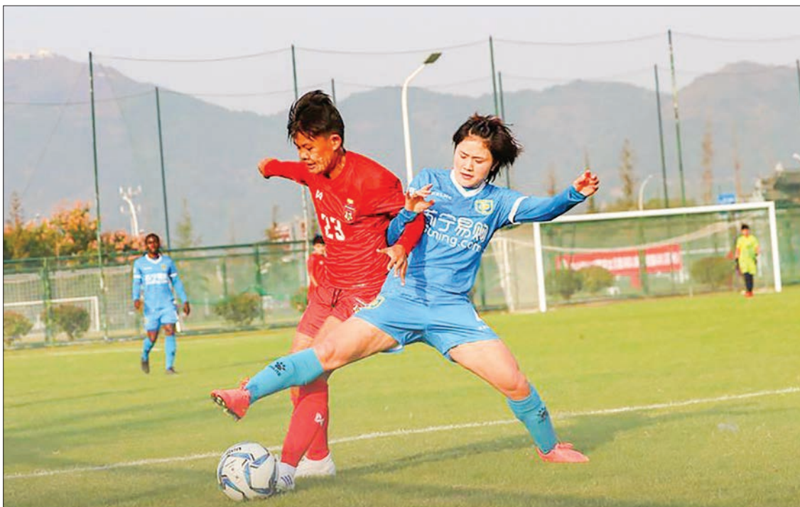
In the second half, the Myanmar National Women's Team was again forced to play but failed to score.

The Myanmar Women's National Team will be training in China until November 15, and plans to play two more matches with the China Women's Youth National. — Lynn Thit (Tgi)