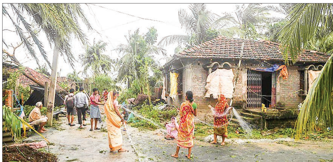
Villagers gather in front of a collapsed house after Cyclone Bulbul hit the area in Bakkhali, Bangladesh, on November 10, 2019.

Three people were killed in India's West Bengal state, two after uprooted trees fell on their homes and another after being struck by the falling branches of a tree in Kolkata. A fourth person died in a wall collapse in nearby Odisha state.