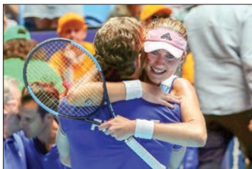
Kristina Mladenovic of France celebrates her victory against Ashleigh Barty of Australia with team's captain Julien Benneteau during the third rubber of the Fed Cup tennis final match between Australia and France in Perth on November 10, 2019.

the planet right now, I'm so proud of my girls and my team.—AFP ■