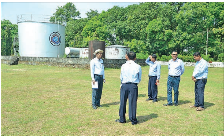
Deputy Minister Dr Tun Naing inspects the storage and distribution sub-department of Myanmar Petroleum Product Enterprise (MPPE) in Mawlamyine, Mon State, yesterday. PHOTO: MNA

Afterwards, the Deputy Minister and entourage visited MPPE's petrol station No. 0862 in Hpa-an, Kayin State, where he gave instructions to ensure private petrol stations serve good quality products, to regulate for illegal sales, and ensure there are no losses prior to the tender process. The Ministry of Electricity and Energy helping SMEs in rural areas develop by issuing licenses to operate rural petrol shops beginning from 4 November.—MNA (Translated by Zaw Htet Oo)