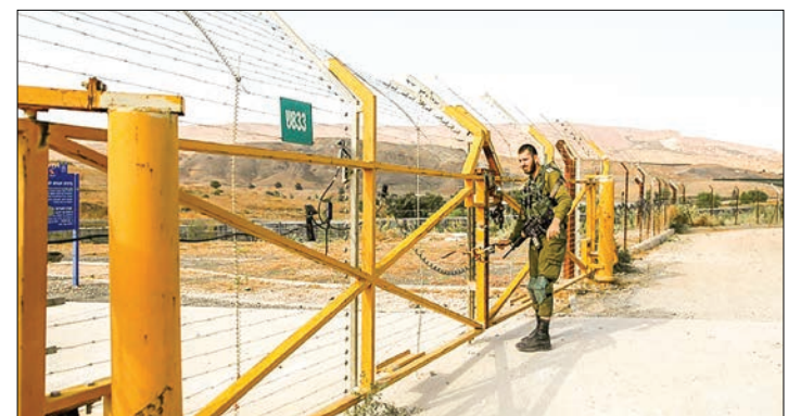
The gate on the Israeli side of the border with Jordan at Naharayim / Baqura was locked on Sunday.

The lands have been privately owned by Israeli entities for decades, but the 1994 deal saw the kingdom retain sovereignty there. Since the heady days of Israel's second peace treaty with an Arab state -- after Egypt -- relations with Amman have been strained. Opinion polls have repeatedly found that the peace treaty with Israel is overwhelmingly opposed by Jordanians, more than half of whom are of Palestinian origin.—AFP ■