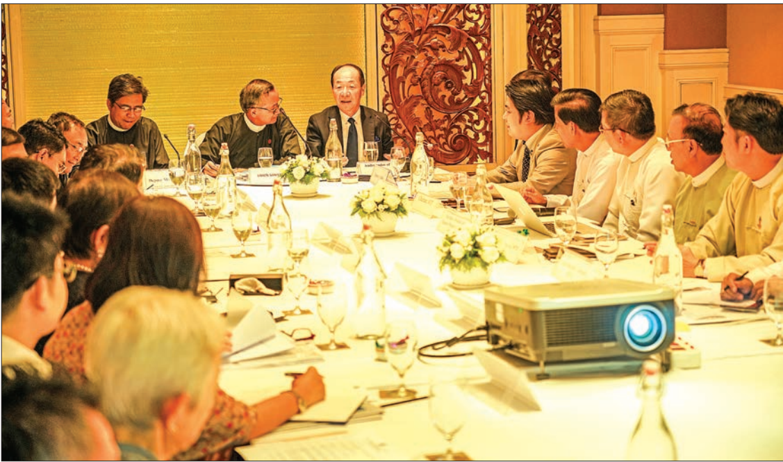
Union Minister for Hotels and Tourism U Ohn Maung attends the coordination meeting to promote Japan market for tourism held in Yangon yesterday.

THE Ministry of Hotel and Tourism organized a coordination meeting to promote the Japan market for tourism as Yangon's Sule Shangri-La Hotel yesterday. Union Minister U Ohn Maung discussed how they have prepared digital marketing groups for the travel destina-