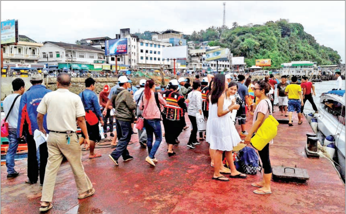
Visitors seen at the Kawthoung Myoma Jetty during the Tazaungmone holidays.

ISLANDS in Kawthoung District have attracted locals and foreigners in the Tazaungmone holiday period. “This is our first trip to the natural islands in our lives,” said a man from Mandalay. He and his family decided to visit Kawthoung during the Tazaungmone holiday, which began last Saturday and will end on the coming Tuesday. Most of the local travellers hail from big cities such as Yangon and Mandalay. Most of the local travellers are from big cities likes Yangon and Mandalay while most tourists are entering through the border with Thailand. Since the beginning the holidays, the jetties in Kawthoung have been seen busy with travellers and ferries. There are 30 untouched islands featured in the archipelago trips in Kawthoung District.