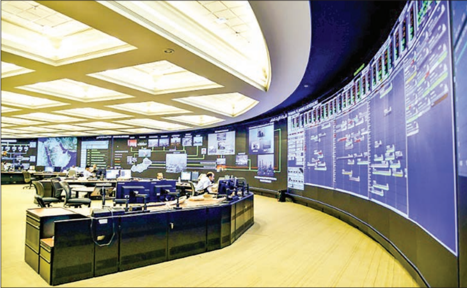
In recent years Saudi Aramco, the world’s most profitable company, increased spending on research and development as most of its competitors scaled back.

“Aramco has never had to answer to investors