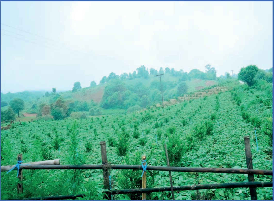
Orange farm.