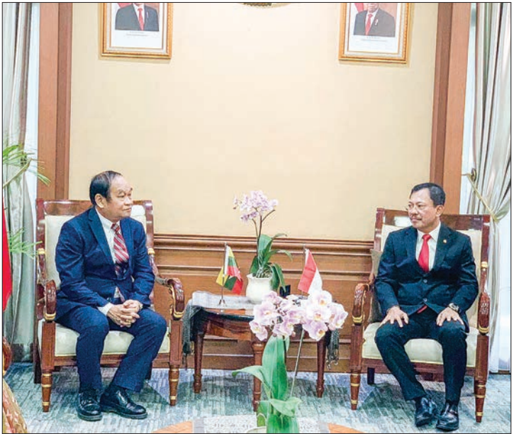
Union Minister Dr Myint Htwe meets with Indonesian Health Minister Dr. Terawan Agus Putranto on 8 November.