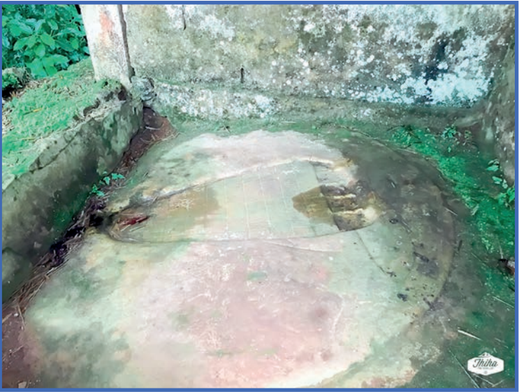
Footprint of King Kyansittha.

least would be a very attractive souvenir for any visitors be they locals or foreigners.