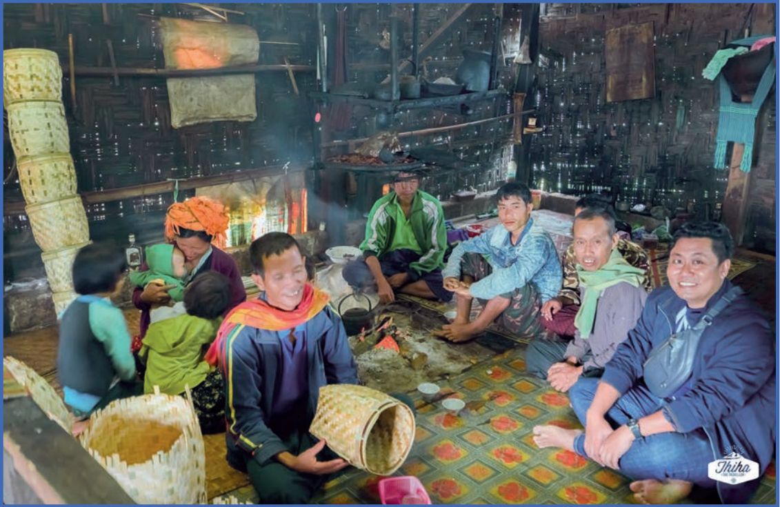
People sitting around the fire.

Villages producing Pa-O traditional wicker ware are must-visit places for any visitors, local or foreigner. Buying one as a souvenir would be better still as all were within the range of K