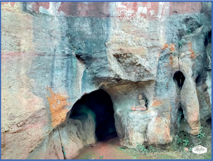
A cave where Kyansittha hid.