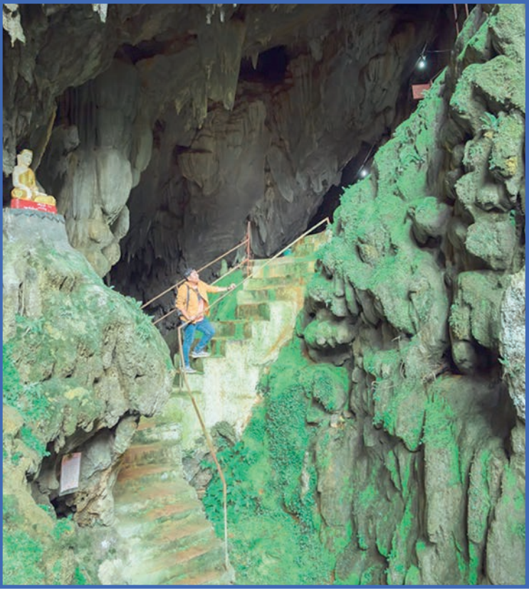
Kaungdaw natural cave.

There were many more places of interests near Pinlaung