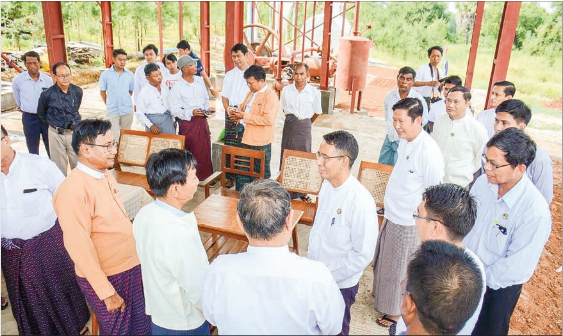
Union Minister Dr Aung Thu meets officials at Shwe Hintha Company's palm powder factory in Yesagyo Township, Magway Region yesterday.

ister handed over 250 packets of veterinary medicine to Regional Minister U Win Maw Htay for local residents affected by natural disasters.—MNA (Translated by Zaw Htet Oo)