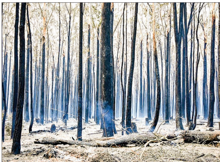
In Old Bar, hectares of bushland had turned charcoal and small pockets of flames continued to smoulder.

It is the first time Sydney has been warned of a “catastrophic” fire danger, the highest possible level, since the grading system was introduced