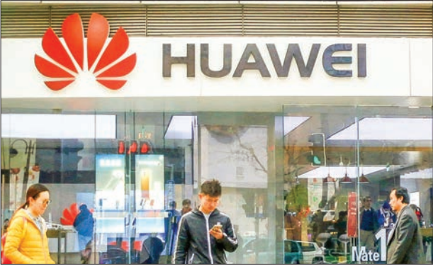
A Huawei store in Shanghai. The company increased phone shipments in China as new models sold briskly.