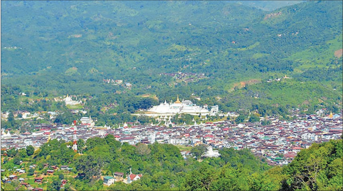
Photo shows the panoramic view of Mogok which is also known as Ruby Land.

Foreign tourists who visited Mogok last month were mainly from China, Thailand, India, France, the United States, Britain, Russia, and Germany. A total of 207 tourists visited