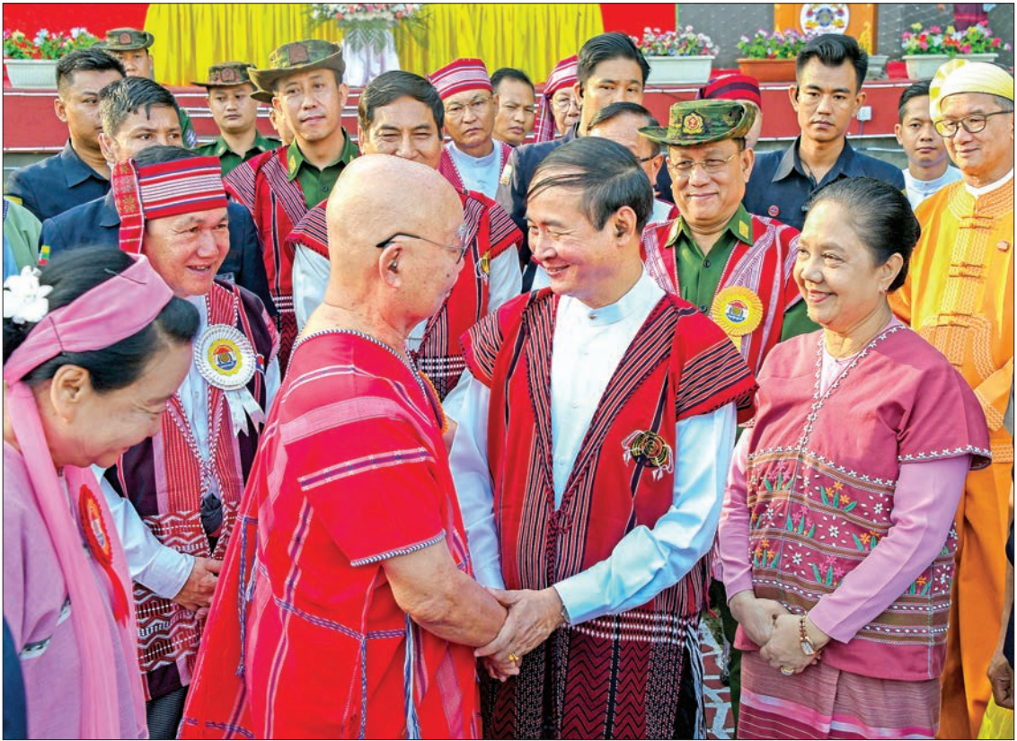
President U Win Myint greets with Chairman of KNU Saw Mutu Say Poe at the ceremony of 64 th anniversary of Kayin State Day in Hpa-an, Kayin State yesterday.

Union comprising many ethnic people and national races, and that Union spirit is required for it. The President praised all the national people who are like colourful attractive flowers in a garden, and that they would have different concepts and ideologies. However, they need to have mutual understanding, trust, respect and cooperation for closer ties with each other to ensure a better union. He also said that Kyain State has a lot of potential, and the Union ministers are also ready to provide assistance for the development of this state. The President added that there are various prominent caves in Kayin State, such as Kawgun Cave, Saddan Cave, and Yathe Pyan Cave. He said the Beikthano Nat idols in Kawgun Cave predate the Bagan Dynasty and houses tens of thousands of images of the Buddha. He said that the Mon language inscrip-