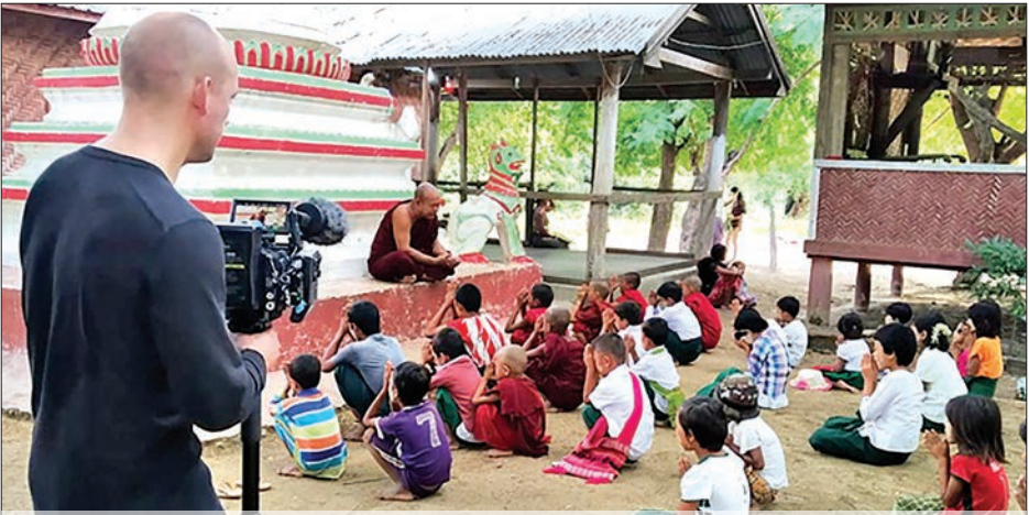
Danish film crew shoot children learning Buddha's guidance from Sayadaw in Mahathala monastery in Chaungmagyi village, yesterday.

River. On 5 November, the film crew recorded the lifestyle of the two girls at their home, students gathering to pay homage to the pagoda within the school grounds before taking lessons, and receiving sermons from the presiding monk. From 8 to 14 November, the film crew documented the girls' journey to nunhood at Dhammazedhi Monastic School near Mingun Pahtodawgyi. They also filmed the Mya Thein Tan Pagoda, Mingun Bell and the natural beauty of Mingun District. Toolbox Film will release