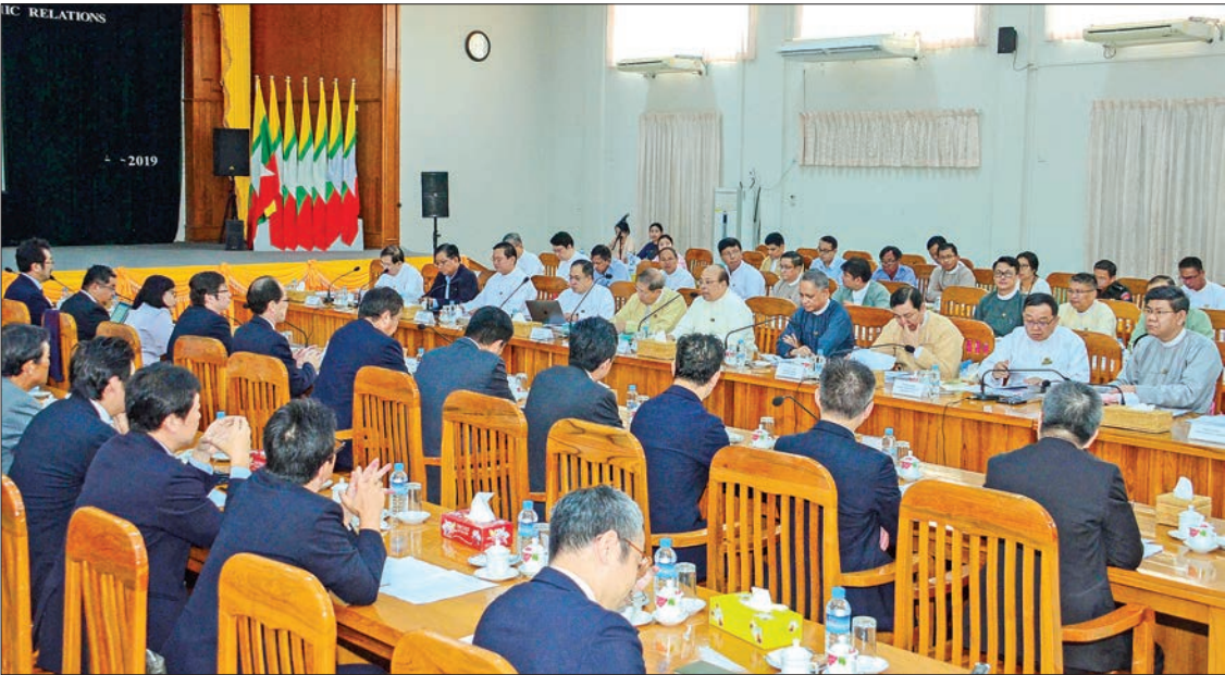
Union Ministers U Thaung Tun, U Soe Win, and Japanese Ambassador Mr Ichiro Maruyama attend the 7 th General Meeting of the Myanmar-Japan Joint Initiative (MJJI) Phase II in Nay Pyi Taw.

THE 7 th General Meeting of the Myanmar-Japan Joint Initiative (MJJI) Phase II co-chaired by U Thaung Tun, Union Minister for Investment and Foreign Economic Relations, U Soe Win, Union Minister for Planning and Finance and Mr Ichiro Maruyama, Japanese Ambassador to Myanmar was held at the Ministry of Investment and Foreign Economic Relations, yesterday.