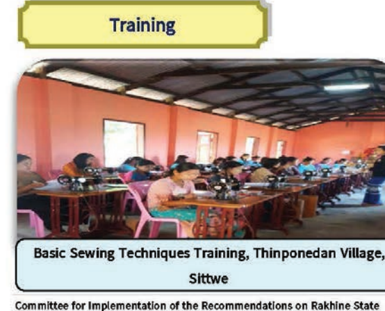
Committee for Implementation of the Recommendations on Rakhine State