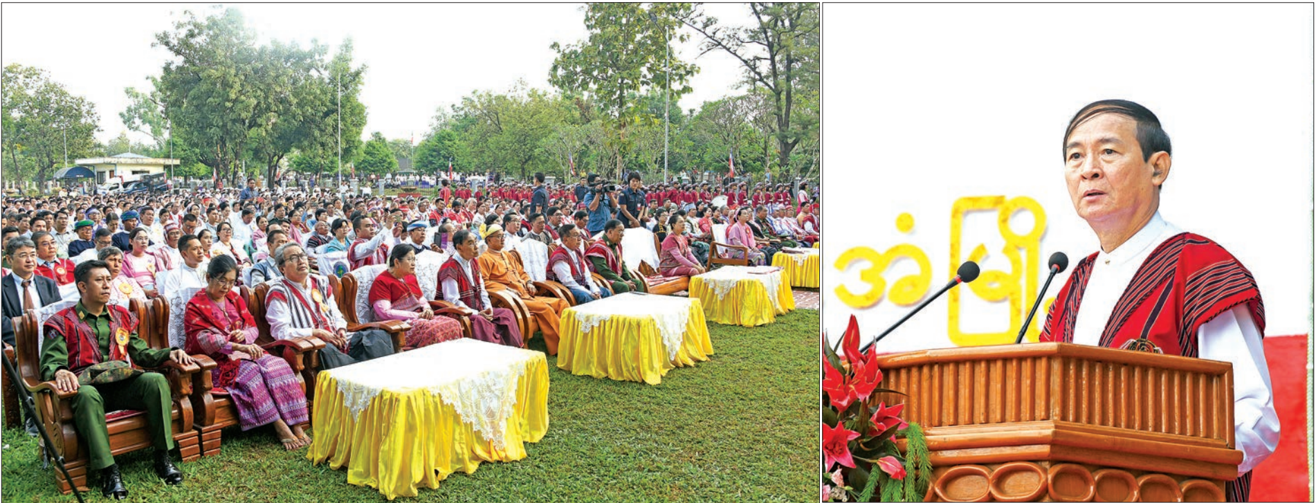
President U Win Myint delivers the speech at the ceremony to mark the 64 th anniversary of Kayin State Day in Hpa-an, Kayin State yesterday.