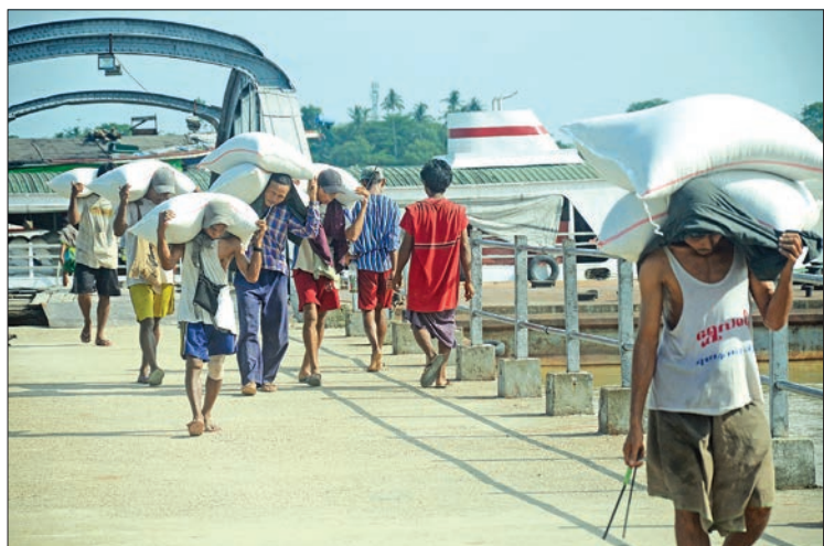
Workers unloading sacks of rice from a vessel at a jetty in Yangon.