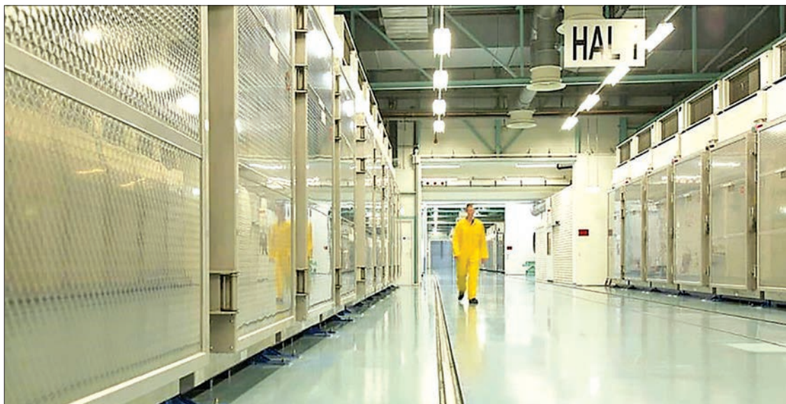
Iran's resumption of uranium enrichment at its underground Fordow plant is the fourth step in a phased suspension of its commitments to a 2015 nuclear deal in response to US President Donald Trump's abandonment of the agreement last year

Britain, China, France, Germany and Russia have been trying to salvage the hard-won deal since Washington abandoned it in May last year and reimposed