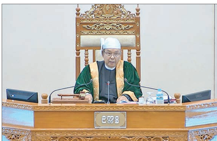
Amyotha Hluttaw Speaker Mahn Win Khaing Than.

Questions raised by U Kyaw Than of Rakhine State constituency 10 on plan to construct a new