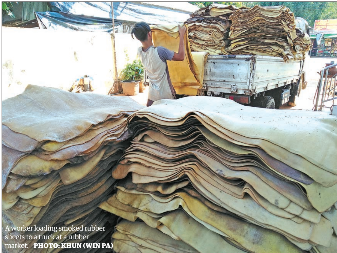
A worker loading smoked rubber sheets to a truck at a rubber market.

Rubber is primarily produced in Mon and Kayin states and Taninthayi, Bago, and Yangon regions in Myanmar. There are over 1.6 million acres of rubber plantations in Myanmar, with Mon State accounting for about 500,000 acres, followed by Kayin State (270,000 acres),