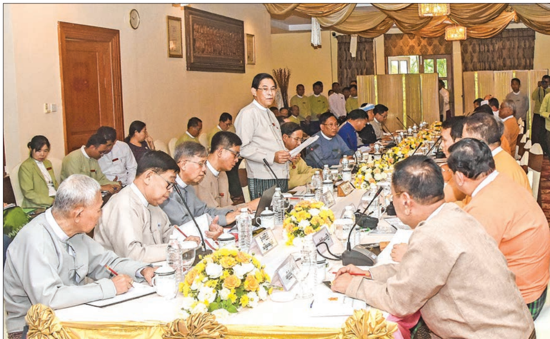
Union Minister U Min Thu attends the meeting for 2019 Reform Framework of General Administration Department in Nay Pyi Taw yesterday.

CHIEF ministers of States/Regions and senior government officials discussed the 2019 Reform Framework of the General Administration Department under the Ministry of Union Government Office yesterday morning.