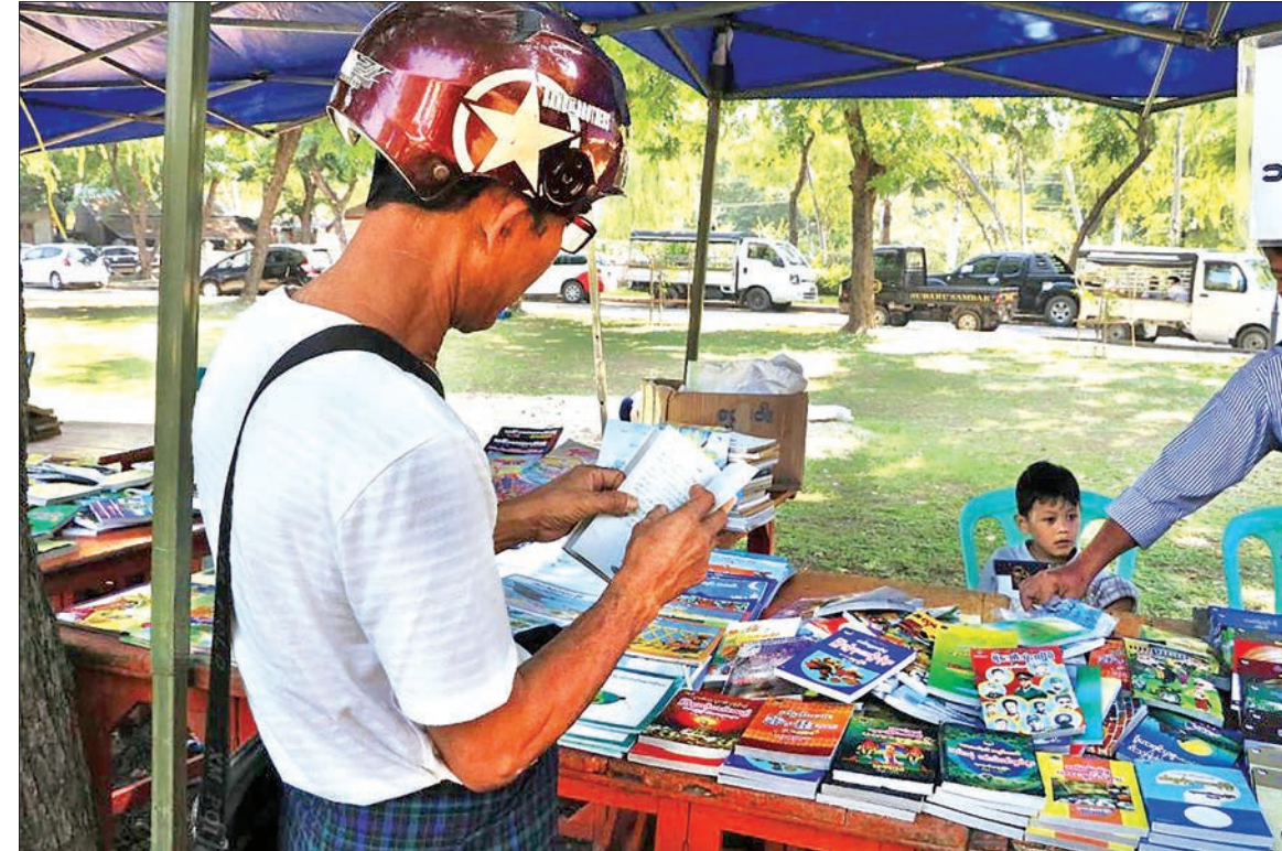
A reader browsing inside of books while visiting bookstalls at the Irrawaddy Literary Festival on 4 November 2017.

Just like the Irrawaddy Festivals of previous years, this year's event will be attended by famous writers from home and abroad. There will still be roundtable discussions on different topics, paper reading sessions, seminars, poem recitals and workshops. Each day of the