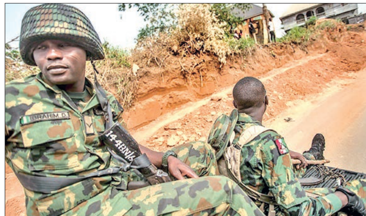
Nigerian soldiers have been caught up in a jihadist insurgency for more than a decade.

The area of the attack is on the edge of the Sambisa Forest which is a stronghold of the Boko Haram faction led by long-time leader Abubakar Shekau. Soldiers were forced to withdraw after an hour-long battle in which nine jihadists were also killed, said the second source. The militants burnt five military vehicles and took away a pickup truck along with six machine guns.—AFP ■