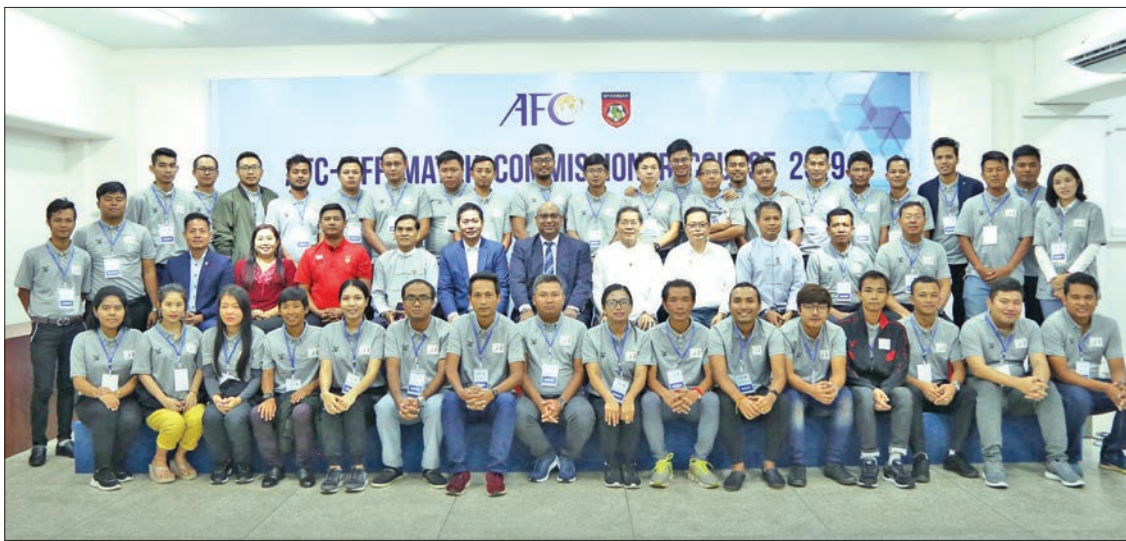
Trainees and officials from the Myanmar Football Federation pose for a group photo at the opening ceremony of the AFC-MFF Match Commissioner Course 2019, held yesterday in Yangon.

The AFC-MFF Match Commissioner Course 2019 will be held from 7 to 9 November.—Lynn Thit (Tgi) ■