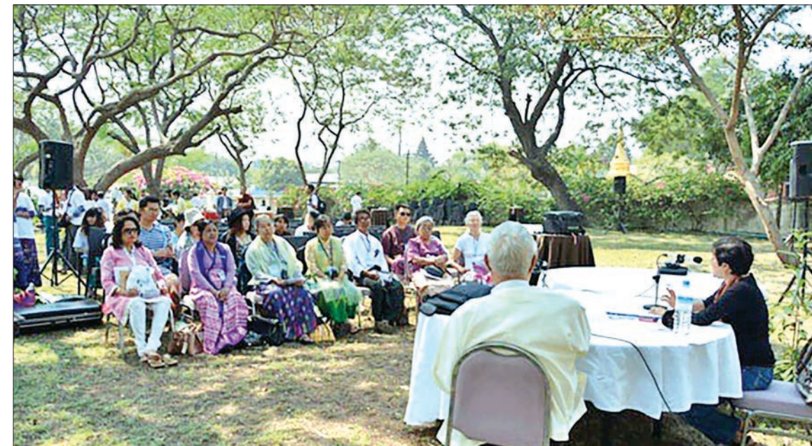
Authors participate in International Panel discussion in the garden of Mandalay Hill Resort in 2015.

since before she became State Counsellor. They would meet up with her frequently and it was