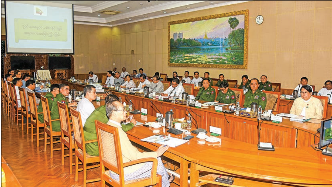
Vice President U Myint Swe addresses the second coordination meeting of the central committee for holding the 72 nd Independence Day ceremony.

The Vice President also advised to complete the remaining works and to review the 29 decisions of the previous Independence Day for better performance than the events of previous years across the country. In Union Territory Nay Pyi Taw, ceremonies to hoist and salute the national flag would be held in the morning of 4 January, and a state-level dinner party