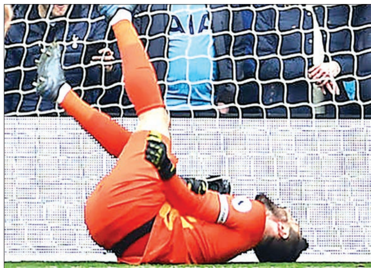
Tottenham Hotspur's goalkeeper Hugo Lloris lies injured after Brighton's Neal Maupay scores his team's first goal during their English Premier League match at the American Express Community Stadium in Brighton on October 5, 2019.