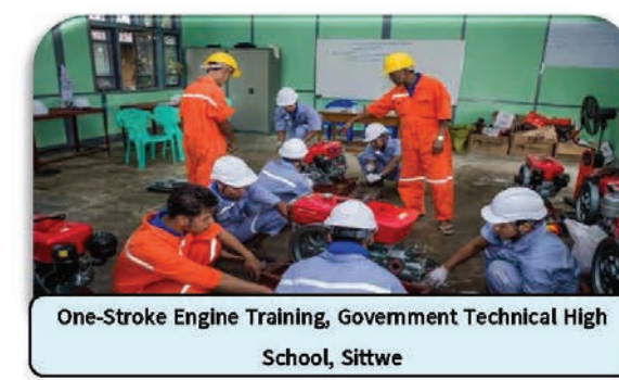
One-Stroke Engine Training, Government Technical High School, Sittwe