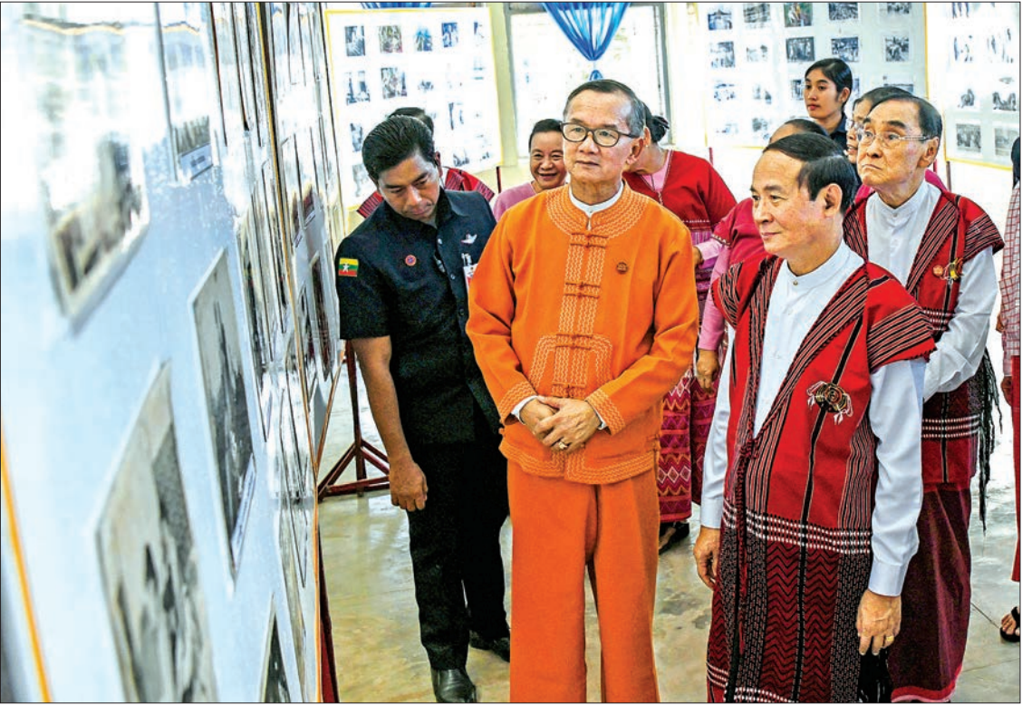
President U Win Myint observes documentary photos displayed at the Hpa-an Culture Museum in Hpa-an, Kayin State yesterday.

Later in the afternoon, the President and entourage left