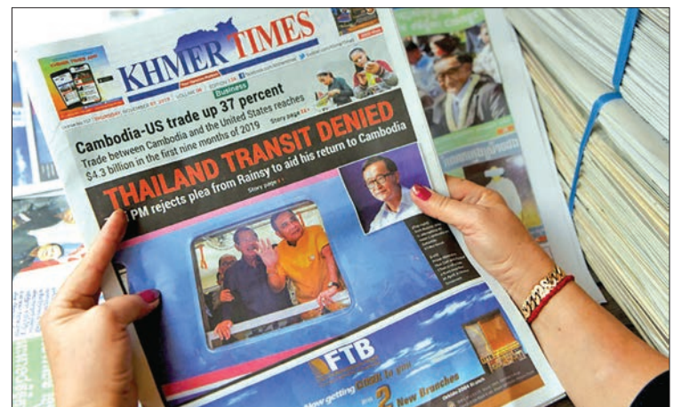
Cambodian strongman Hun Sen has vowed to prevent the return of exiled opposition leader Sam Rainsy, and has sought help from neighbouring countries.

Its removal ahead of the July 2018 election enabled Hun Sen's party to win all 125 seats and him to extend his 33-year rule for another five years.—Kyodo ■