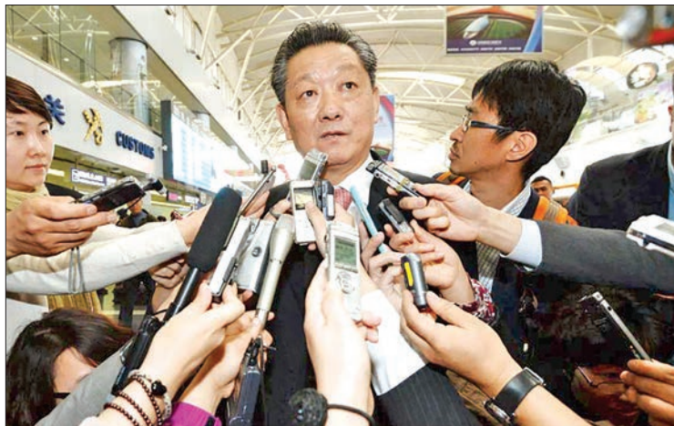
FILE PHOTO: Song Il Ho, North Korean ambassador.

of ill-intended remarks that the DPRK's test-fire of super-large multiple rocket launchers is the ballistic missile launch and a threat to Japan," Song added in a statement carried by the official Korean Central News Agency.