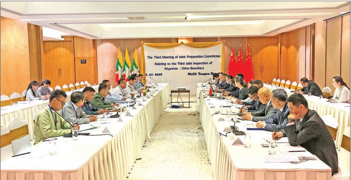
Third Meeting of Joint Preparation Committee relating to the Third Joint Inspection of Myanmar-China Boundary held in Yangon from 5 to 7 November 2019.

During the meeting, both sides exchanged views based on the spirit of friendship and mutual understanding and reached a number of consensuses on Term of References (ToRs) to implement the works of the third joint inspection. The meeting mainly focused on the ToR relating to the aerial photography of the whole stretch of Myanmar-China Boundary.—MNA