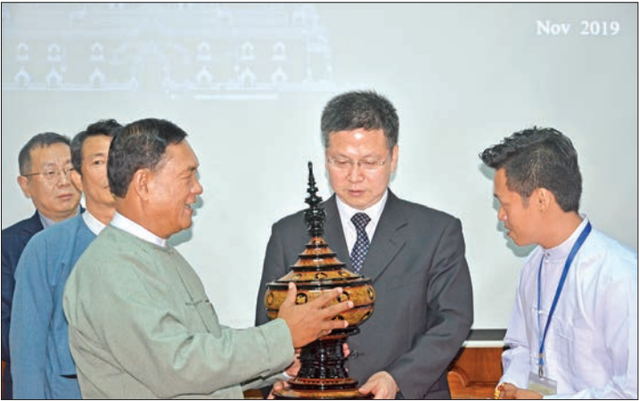
Deputy Minister U Kyi Min presents a gift to Chinese Vice Governor of Shaanxi Province Mr Fang Guang Hua at the meeting.

DEPUTY Minister for Religious Affairs and Culture U Kyi Min received a Chinese delegation including Vice Governor of Shaanxi Province Mr Fang Guang Hua, businesspersons, officials from Chinese Embassy in Myanmar, Chinese engineers involved in conservation of Thatbyinnyu Temple at the meeting hall of Bagan Archaeological Museum at 2 pm on 5