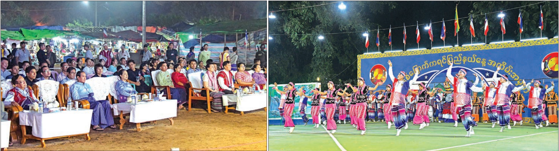
President U Win Myint, First lady Daw Cho Cho and officials enjoy the traditional Kayin Don Dance at the ceremony to mark the 64 th Kayin State Day in Hpa-An, Kayin State yesterday.