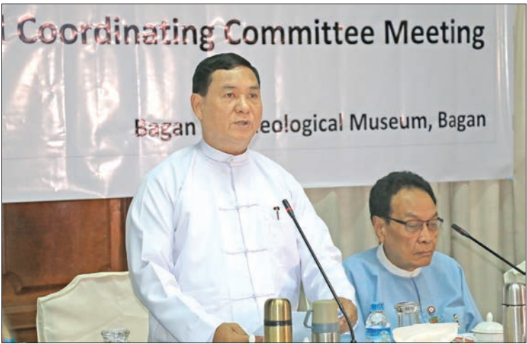
Deputy Minister for Religious Affairs and Culture U Kyi Min delivers the speech at the Bagan International Coordinating Committee (BICC) meeting in Bagan yesterday.

BAGAN International Coordinating Committee (BICC) held their second meeting at the Bagan Archaeological Museum yesterday. Deputy Minister for Religious Affairs and Culture U Kyi Min and Mandalay Region Minister for Planning and Finance U Myat Thu delivered separate opening addresses.