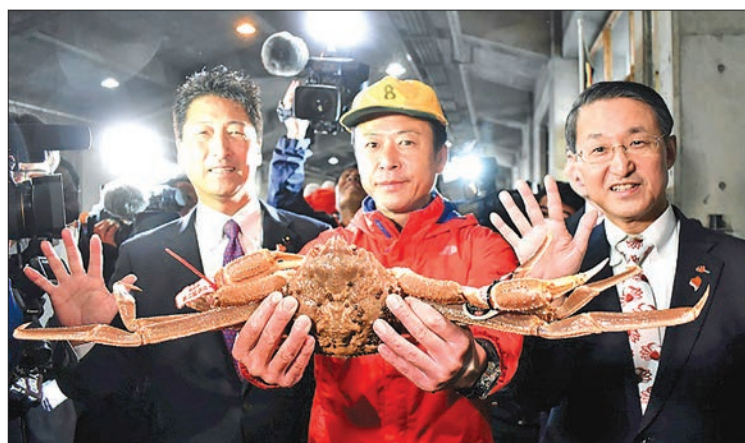
The crab will be sold to a restaurant in Tokyo's Ginza shopping district, the company said.

TOTTORI — A snow crab caught in the western Japan prefecture of Tottori attracted the highest-ever bid for a crab at auction of 5 million yen ($46,000), the prefecture said Thursday.