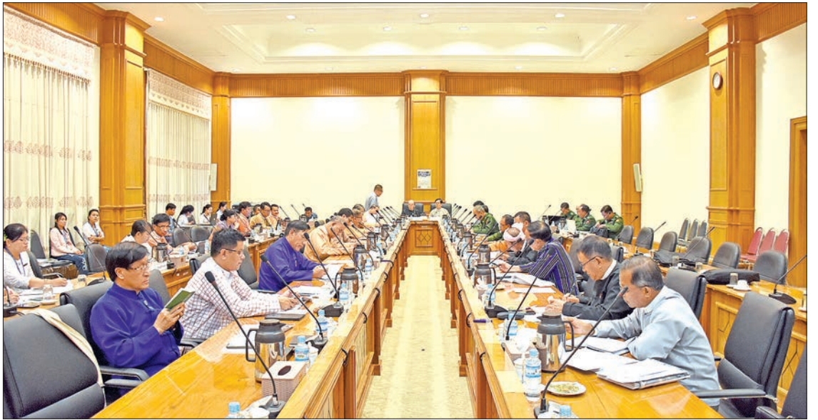
The meeting of Joint Committee on Amending the 2008 Constitution held at the Pyidaungsu Hluttaw Building in Nay Pyi Taw yesterday.