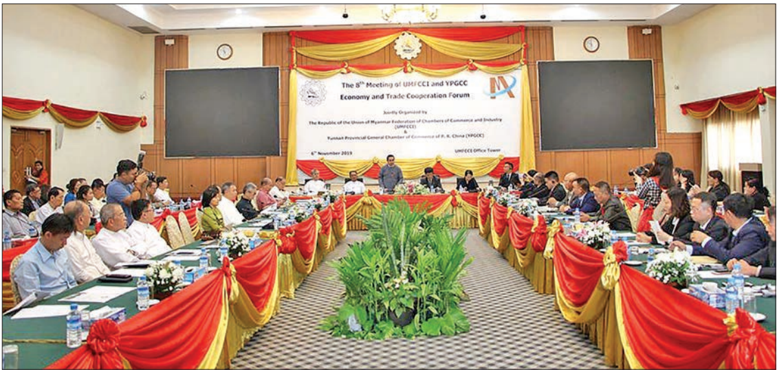
The 8 th Meeting of UMFCCI and YPGCC held in Yangon on 6 November.

THE Union of Myanmar Federation of Chambers of Commerce and Industry (UMFCCI) and Yunnan Provincial Gen-