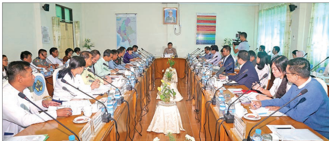
Union Minister Dr Win Myat Aye attends the second technical working group meeting on the implementation of Preliminary Needs Assessment's Recommendations.

In his speech, the Union Minister updated the TWG members about the progress of the Ministry's endeavors for Rakhine State including but not limited to the adoption of Rakhine Joint Assessment Report (RJA) and the National Strategy for the Closure of IDP Camps and Resettlement of Internally Displaced Persons. The Union Minister emphasized the ongoing efforts on the social and economic development of Rakhine State through UEHRD and the MoU with UNDP and UNHCR. He also encouraged TWG members to review those ongoing projects and programmes in order to avoid duplications and