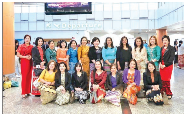
The Myanmar women entrepreneurs delegation poses for a group photo before departure for Bangkok on 29 October.

The Women CEOs Summit is themed as Globalization 4.0 and Beyond: Shaping the Future of Women Enterprises and it brings together industry leaders plus prominent CEOs and policy executives to share their views and experiences on the challenges posed by, and the responses made to, Globalization 4.0 within and beyond ASEAN. —GNLM