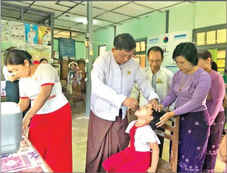
A public health officer gives drops of the oral polio vaccine to a child in Shwekyin Township.

the Union government. With the Myanmar Tourism Law 2018 coming into effect, the sector has been decentralized to the region and state governments, said Naw Pan Thinzar Myo, the Yangon Region Minister for Kayin Ethnic Affairs. —Than Naing Oo (Translated by Ei Myat Mon)