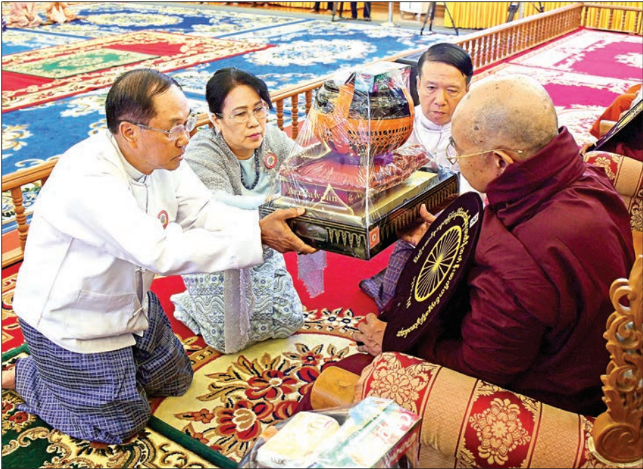
Vice President U Myint Swe and wife offer Kathina robes to a Sayadaw at the Kathina Robe Offering Ceremony, Uppatasanti Pagoda, in Nay Pyi Taw.