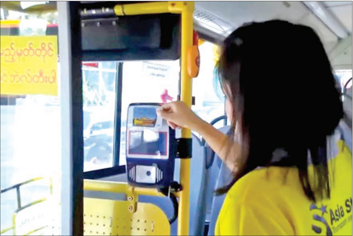
A staff of YBS demonstrates how to use a smart card with the card payment system.

After the first phase, the installation will continue at 1,000 Fonton buses and 39 Scania buses in the second phase. The two sets of card payment system could be set