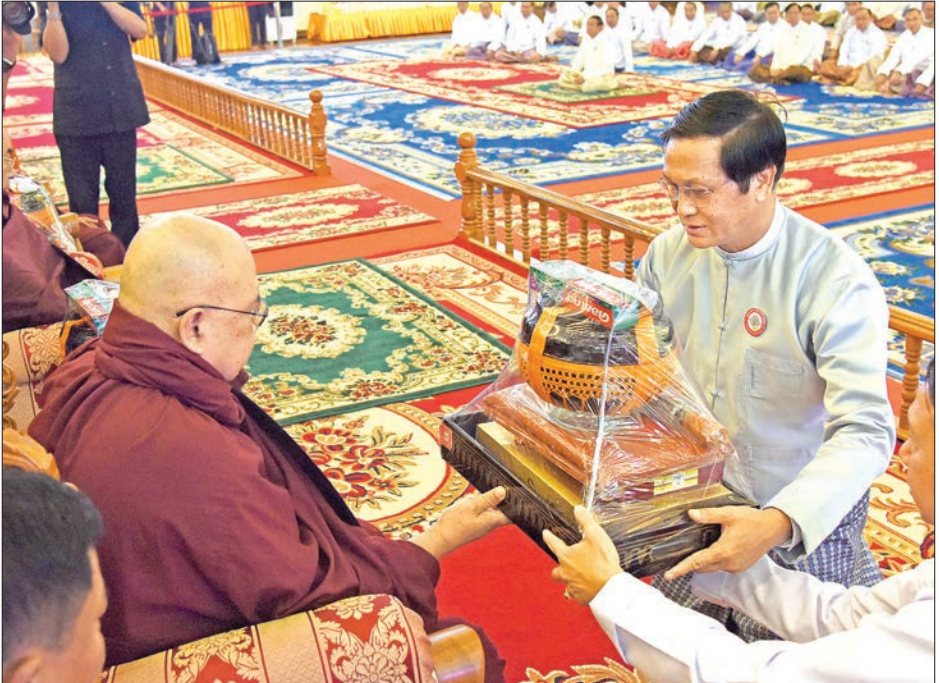
Vice President U Henry Van Thio offers Kathina robes to a Sayadaw at the Kathina Robe Offering Ceremony, Uppatasanti Pagoda, in Nay Pyi Taw.