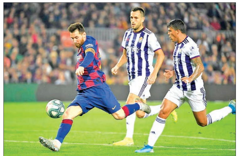
Barcelona's Argentine forward Lionel Messi celebrates his goal during the Spanish league football match between FC Barcelona and Real Valladolid FC at the Camp Nou stadium in Barcelona on October 29, 2019.

It was his free-kick that Valladolid made a mess of clearing, as Sergi Guardiola lashed the ball against Joaquin Fernandez and Lenglet reacted fastest, his shot deflecting in before two minutes were on the clock. —AFP ■