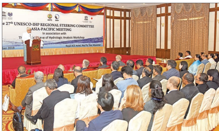
Deputy Minister U Kyaw Myo addresses the 27 th IHP RSC meeting for Asia and the Pacific in Nay Pyi Taw yesterday.

THE 27 th International Hydrological Programme Regional Steering Committee (27 th IHP RSC) Meeting for Asia and the Pacific is organized at the Hotel Royal Ace in Nay Pyi Taw.