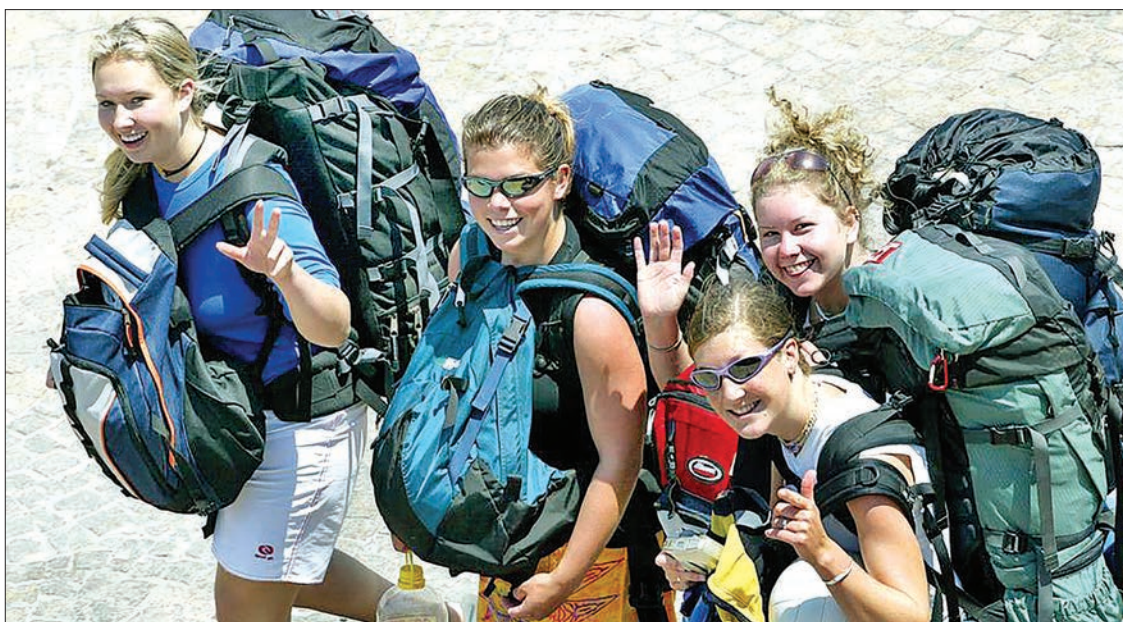
From 2017, Canberra applied a 15 per cent levy for every dollar earned for two categories of working holiday visas linked to seasonal labour.

Similar agreements are also in place with the United States, Germany, Finland, Chile, Japan, Norway and Turkey according to international accounting firm