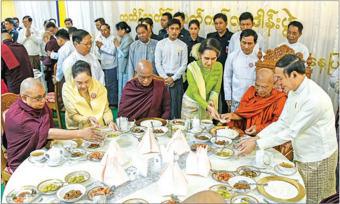
President U Win Myint and First Lady Daw Cho Cho, State Counsellor Daw Aung San Suu Kyi offer soon (a day meal) to the Members of Sangha at the Kathina Robe Offering Ceremony 2019 in Nay Pyi Taw.