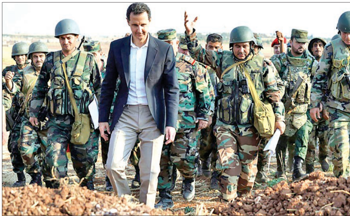
Opposition negotiators fear that Syrian President Bashar al-Assad will use its participation in the Geneva talks as a bargaining chip to normalise relations with the West.

UN Secretary General Antonio Guterres agreed. The committee would be taking "the first step on the political path out of the tragedy of the Syrian conflict", he said in a statement. The committee's 150 members — includ-