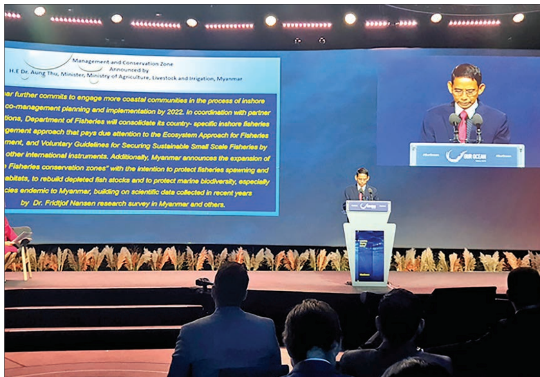
Union Minister for Agriculture, Livestock and Irrigation Dr Aung Thu makes a discussion at the 'Our Ocean 2019' Conference in Oslo, Norway, on 23 October.

UNION MINISTER for Agriculture, Livestock and Irrigation attended the 'Our Ocean 2019' Conference held in Oslo, Norway, on 23 October.