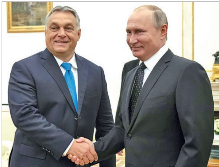
Orban and Putin have held talks at least annually over the last five years

He has tasked his foreign ministry with sourcing trade