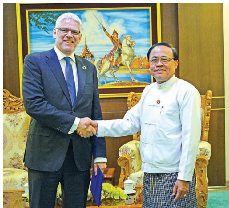
Union Minister U Kyaw Tin shakes hands with Mr Ola Almgren, United Nations Resident Coordinator to Myanmar, in Nay Pyi Taw.

cooperation between Myanmar and the United Nations in Myanmar's efforts for peace and national reconciliation, democracy and development and the implementation of Myanmar Sustainable Development Plan (MSDP), the role of the new Resident Coordinator system of the United Nations and the efforts of the Government of Myanmar for repatriation of displaced persons from Rakhine State and creating conducive environment for returnees.—MNA