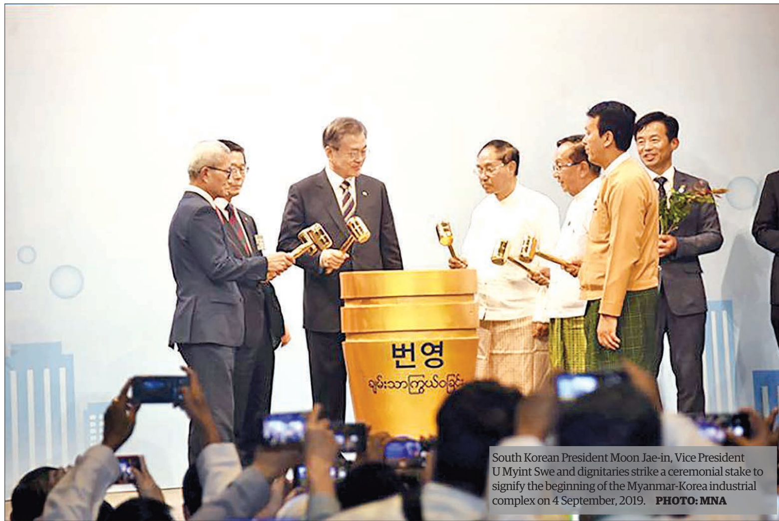
South Korean President Moon Jae-in, Vice President U Myint Swe and dignitaries strike a ceremonial stake to signify the beginning of the Myanmar-Korea industrial complex on 4 September, 2019.

for the convenience of starting a business, the Ministry of Investment and Foreign Economic