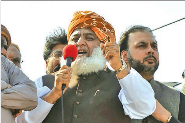
Maulana Fazlur Rehman is leading thousands of protesters in a march on Islamabad, calling for the overthrow of Prime Minister Imran Khan.

he says, did not win last year’s election, but was “selected” by the powerful security establishment — a suggestion denied by