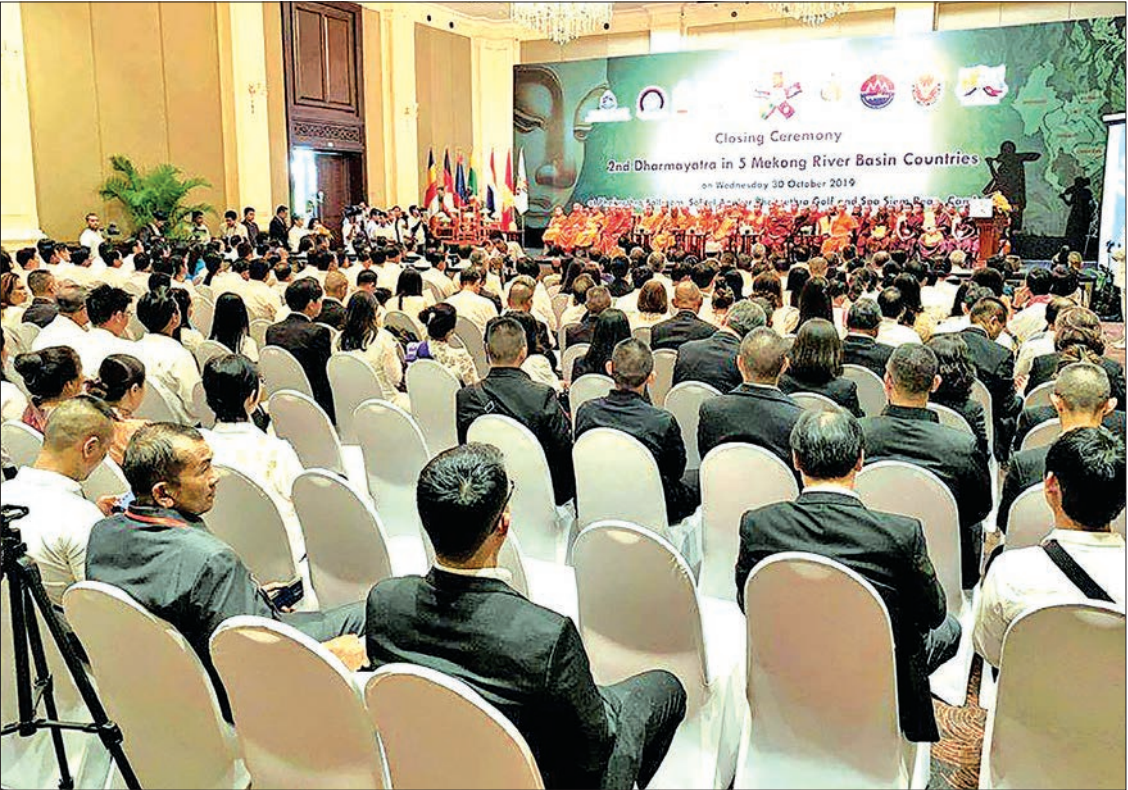
A closing ceremony of 2 nd Dharmayatra in five Mekhong River Basin Countries held in Cambodia on 30 October 2019.