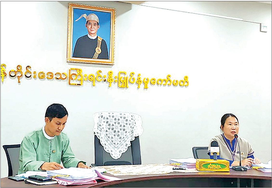
Yangon Region Investment Committee has approved 11 foreign projects and one domestic enterprise on 30 October.

The manufacturing sector attracted the most foreign investments in Yangon Region, for enterprises engaged in the manufacturing of pharmaceuticals, vehicles, container boxes, and Cutting, Making, and Packing (CMP) garments.