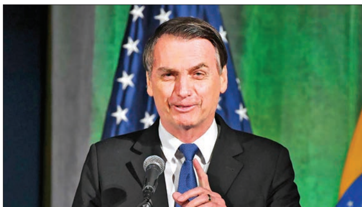
Brazilian President Jair Bolsonaro.

On Tuesday night, TV network Globo reported that the first suspect visited the condominium building where Bolsonaro lived, telling the doorman he intended to visit the then-presidential