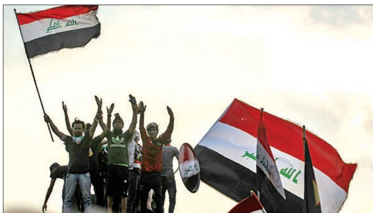
Iraqi protesters are demanding a total overhaul of a political system they see as corrupt.

By Wednesday, demonstrators were waiting to see whether the first fruit of their struggle — the ouster of Prime Minister Adel Abdel Mahdi — was finally