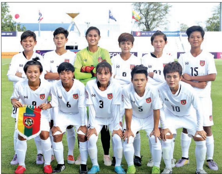
The Myanmar U-19 national women's team pose for a group photo before their opening match against the Japan U-19 team in the AFC U-19 Women's Championship, which is being held in Chonburi, Thailand.

THE Myanmar U-19 national women's football team will play against the China U-19 team today in the second Group B match of the AFC U-19 Women's Championship 2019 at the Institute of Physical Education (IPE) Stadium in Chonburi, Thailand.