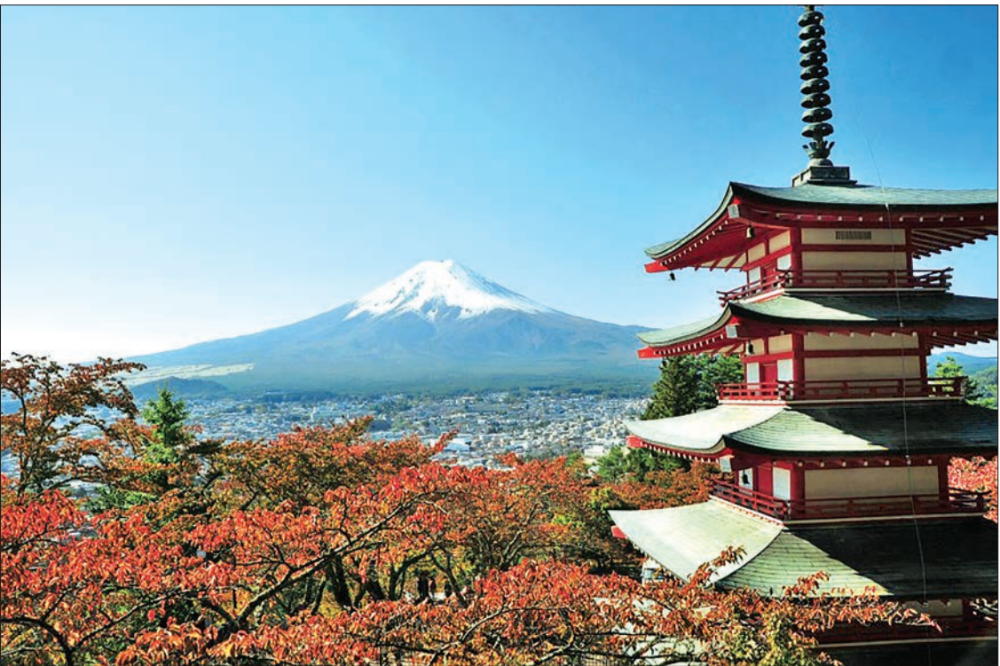
Experts warn that climbing Mount Fuji outside of the official season is dangerous, though it is not prohibited.