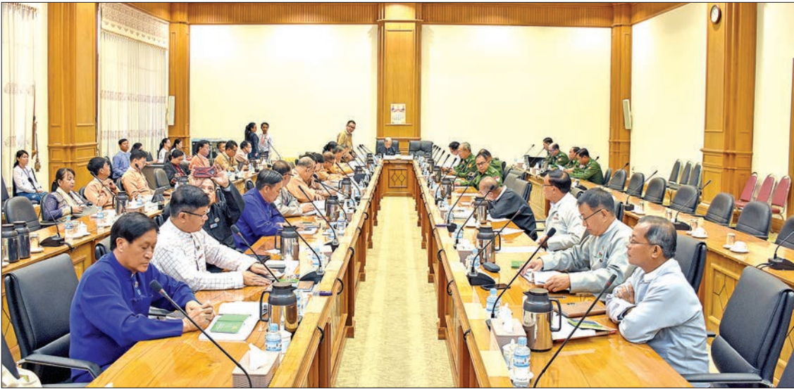
Pyithu Hluttaw Deputy Speaker U Tun Tun Hein attends the meeting 52/2019 of the Joint Committee on Amending the 2008 Constitution at Pyidaungsu Hluttaw Building D in Nay Pyi Taw yesterday.