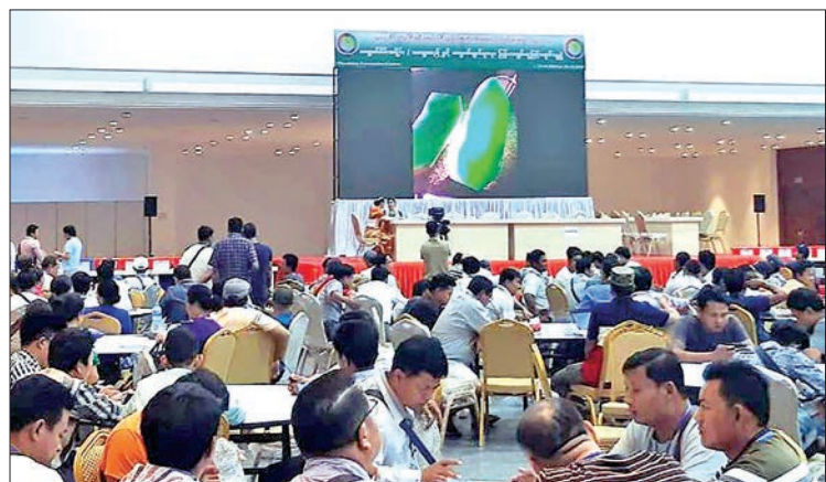
Gem merchants gather at auction room after sale opened at jade emporium in Mandalay.

Mandalay City has the largest demographic of jade entrepreneurs and workers. The open tender system used in the emporium offered a transparent purchasing opportunity for domestic jade businesses.—Khaing Set Wai