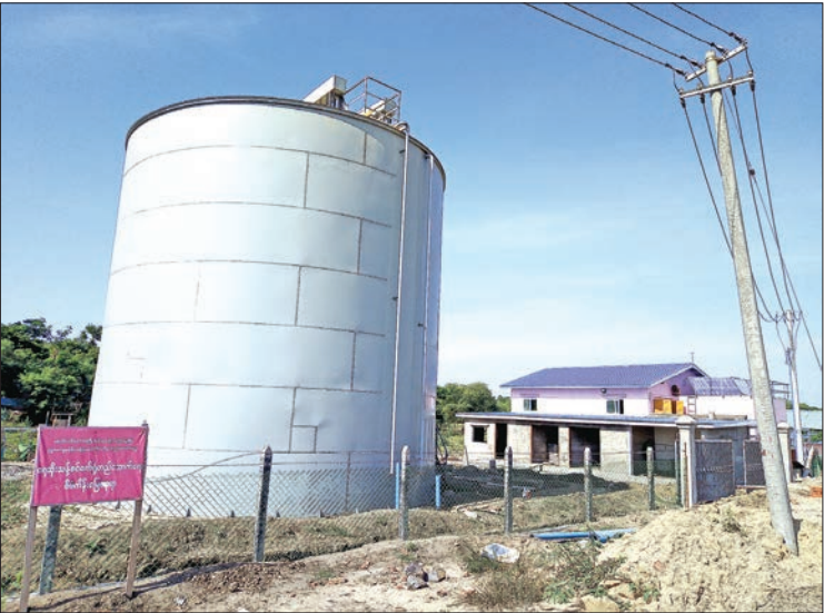
Wastewater treatment plant project seen in the industrial zone in Monywa.

MACHINES are being installed at the wastewater treatment plant in the Monywa industrial zone, and construction of the facility is expected to be completed in December, said U Wai Tint, the chairman of the Monywa Industrial Zone Committee. The wastewater treatment plant is being built with the assistance of the Denmark Responsible Business Fund (RBF). The plant will recycle wastewater discharged from 17 factories in the industrial zone. “The construction of the plant is estimated to cost K1,500 million. And, the RBF has agreed to pay 50 per cent of the total cost of the project. When we entered into a contract with the RBF team, the