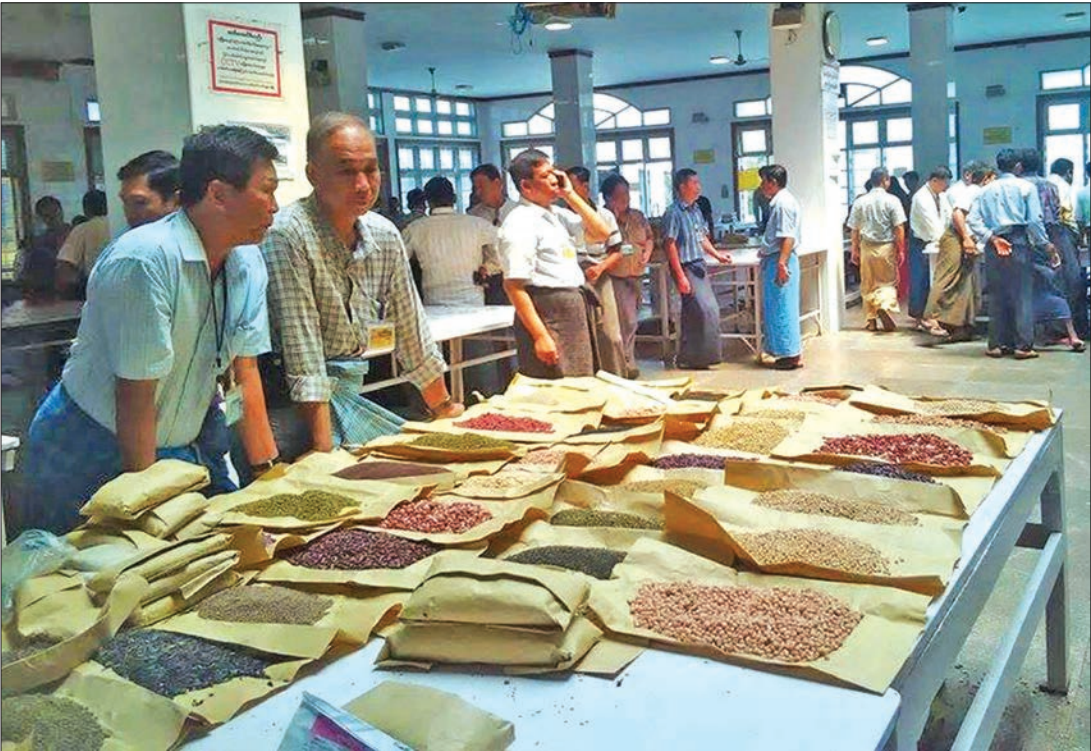
Merchants appraise quality of peas and pulses at the Mandalay wholesale market.

IMPORTS of foreign green garden peas into Mandalay has caused a decline in prices of local garden peas and chick peas, buffeting the local market and bringing hardships to local farmers and pea millers, according to U Soe Win Myint of the Soe Win Myint brokerage. As consumers replaced chick peas with green garden peas, the price of chick peas also decreased, and almost half of all pea mills in Mandalay