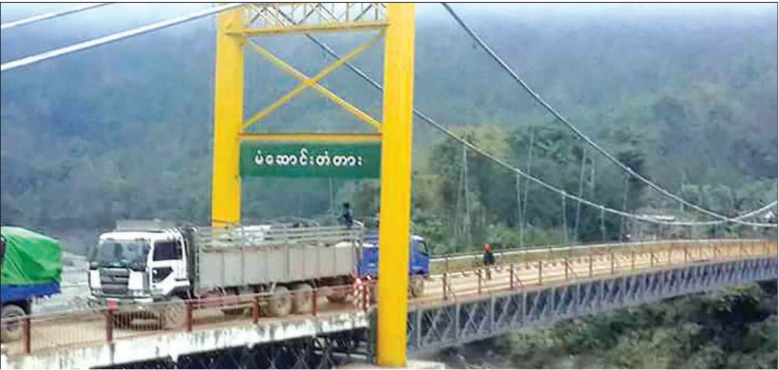
Vehicles are seen on the Mansaung Suspension Bridge in Chin State. The new Manipur River Crossing Bridge will be constructed in 2019-2020 fiscal year.