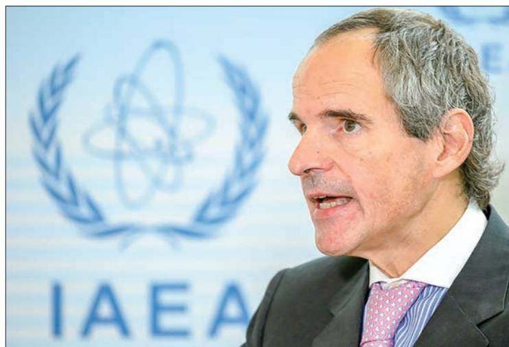
Grossi becomes the first IAEA head from Latin America and is believed to have had the backing of the US.

An IAEA general conference is expected to approve the