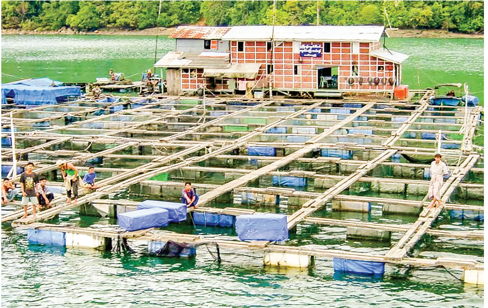
Fish are farmed in an artificial pond in Ayeyawady Region, where fish and shrimp farming businesses are likely to receive funding as part of an EU aquaculture project.