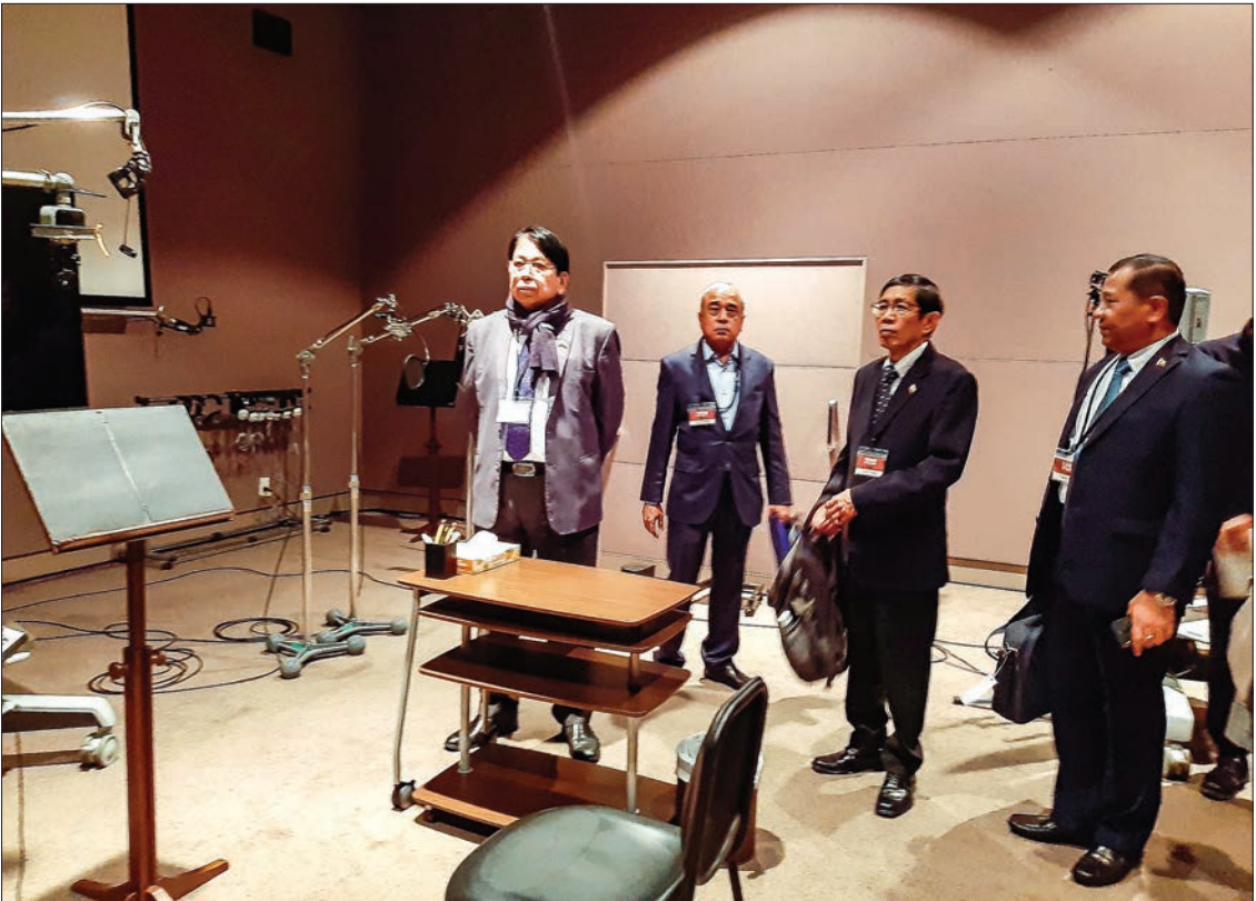
Union Minister for Information Dr Pe Myint visits Toho Studios in Tokyo, Japan, yesterday.