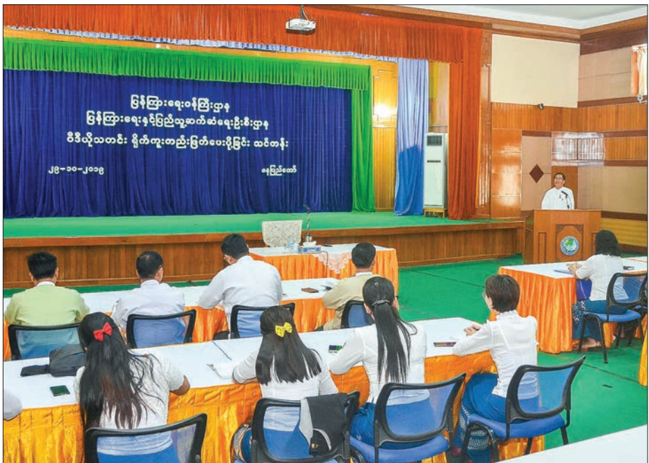
Deputy Minister U Aung Hla Tun delivers the speech at the opening ceremony of four-day training course on video reporting in Nay Pyi Taw yesterday.

THE Ministry of Information conducts a four-day training course on video reporting to upgrade its MOI Web portal that is now presenting the news in texts and photos.