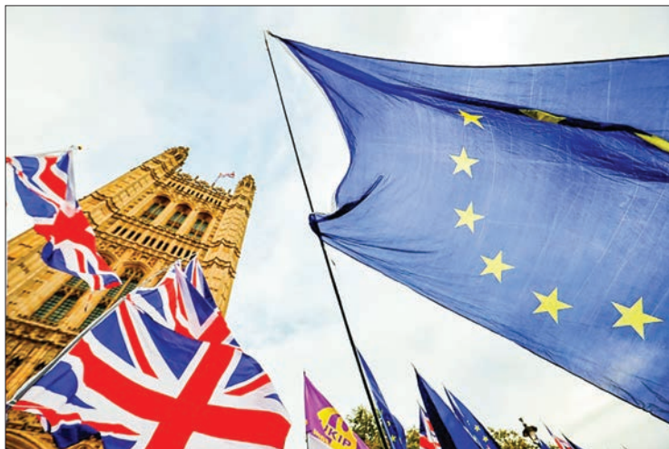
Britain has now delayed the date of Brexit three times.

Britain's inability to break its half-century bond with the EU has halted costly "no-deal"