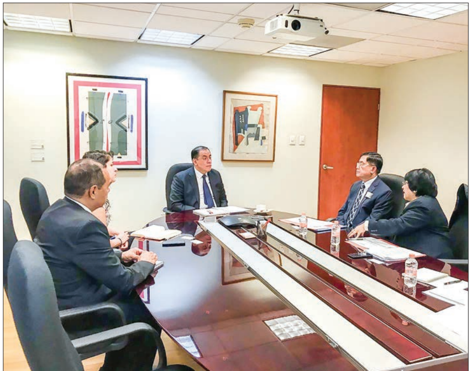
Deputy Minister U Maung Maung Win meets with officials from Mexico's Ministry of Finance and Public Credit in Mexico City, Mexico.