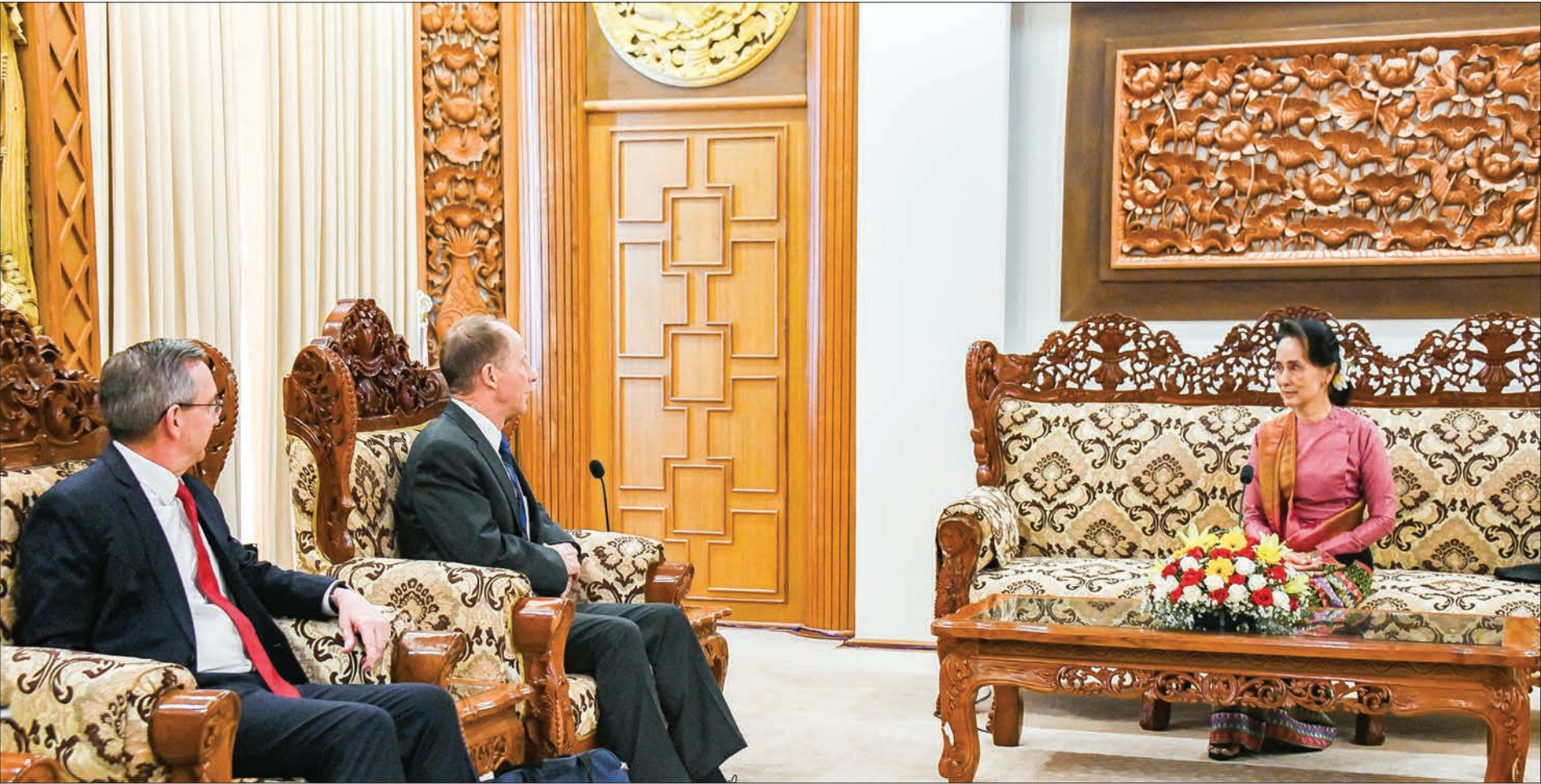
State Counsellor Daw Aung San Suu Kyi meets with Mr David Stilwell, US Assistant Secretary of State for the Bureau of East Asian and Pacific Affairs, in Nay Pyi Taw yesterday.

Vol. VI, No. 196, 3 rd Waxing of Tazaungmon 1381 ME www.globalnewlightofmyanmar.com Wednesday, 30 October 2019