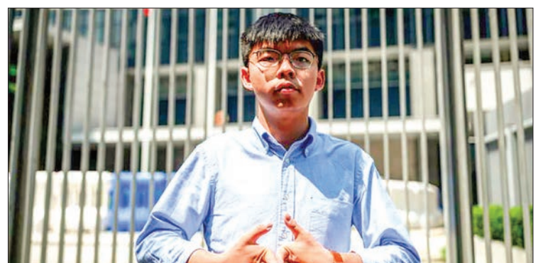
In this file photo taken on 28 September, 2019, pro-democracy activist and South Horizons Community Organiser Joshua Wong stands in front of the Central Government Complex before the announcement of his run for 2019 District Council elections in Hong Kong. PHOTO: AFP

Millions have hit the streets, with hardcore activists clashing repeatedly with police, in the biggest challenge to China's rule since the city's handover from Britain in 1997.—AFP ■