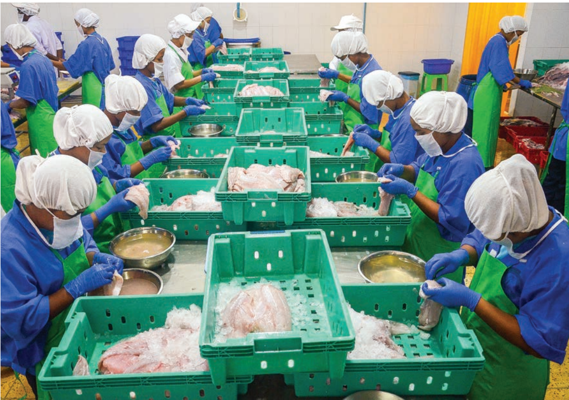
Workers processing fish at a marine product industry.

system so as to boost the country’s fish and prawn farming sector.