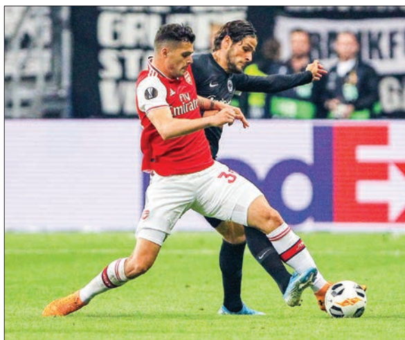
Granit Xhaka has been left devastated by his confrontation with the Arsenal fans but must still apologise said Gunners manager Unai Emery.

LONDON (United Kingdom) — Granit Xhaka has been left "devastated" by the confrontation with Arsenal manager Unai Emery.