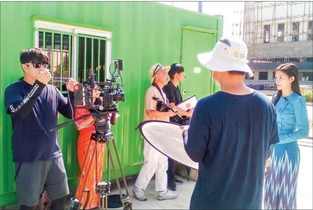
NALBAL film crew shoot the scene of interviewing KOICA and Myanmar Development Institute at Yezin Agricultural University.

FILM production NALBAL based in Seoul, the Republic of Korea, took a documentary film in Nay Pyi Taw Union Territory from 26 to 28 October. The NALBAL shot the project of agricultural course and rural development train-