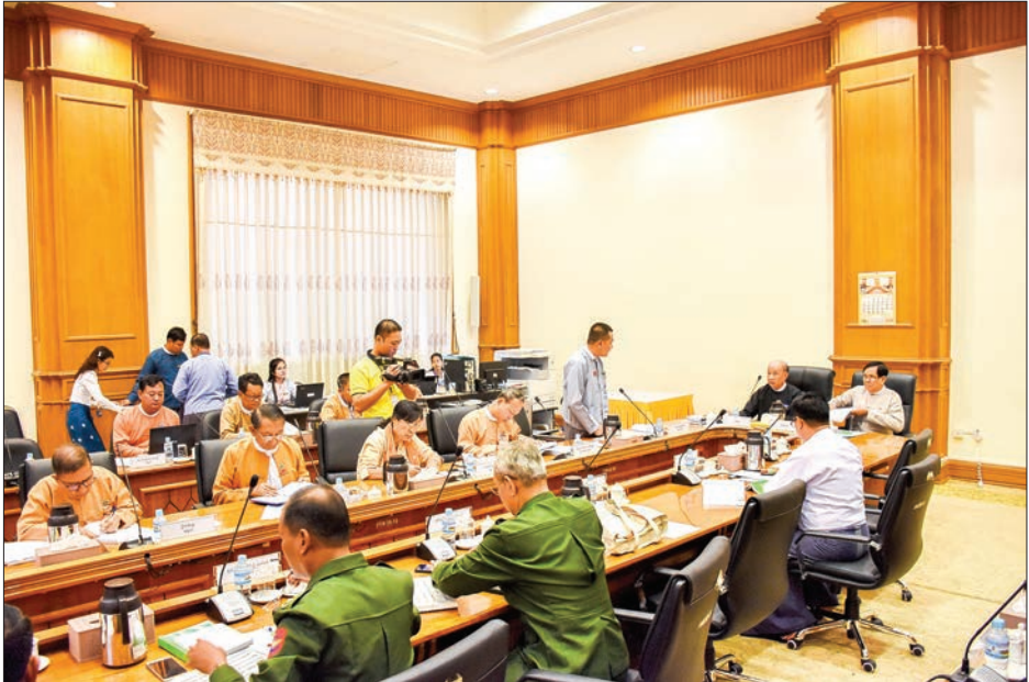
Meeting of the Joint Committee on Amending the 2008 Constitution 51/2019 held in Nay Pyi Taw yesterday.