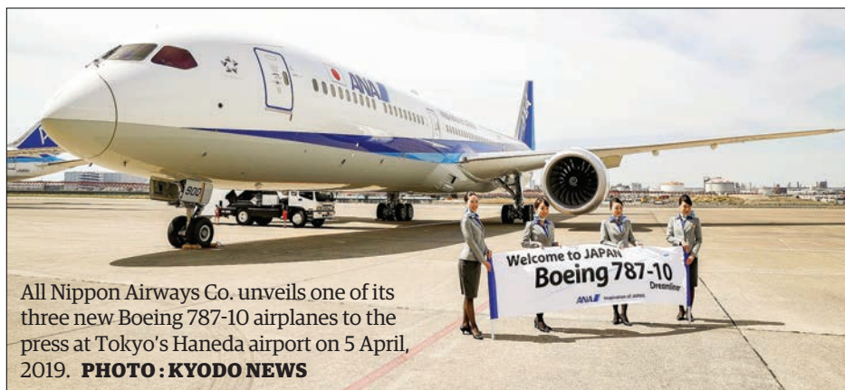
All Nippon Airways Co. unveils one of its three new Boeing 787-10 airplanes to the press at Tokyo's Haneda airport on 5 April, 2019.

group in terms of passenger numbers also said group operating profit is expected to fall to 140 billion yen from its previous forecast of 165 billion yen, on sales of 2.09 trillion yen