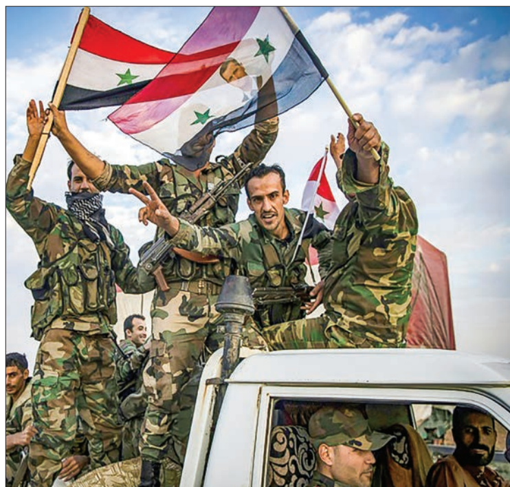
Damascus forces are deploying in much of the formerly Kurish-controlled zone along the border with Turkey but a 10-kilometre-deep strip is to be jointly patrolled by Russian and Turkish troops.

Turkey subsequently reached a deal with the Syrian government's main backer Russia for Kurdish forces to pull back from the entire border area.—AFP ■