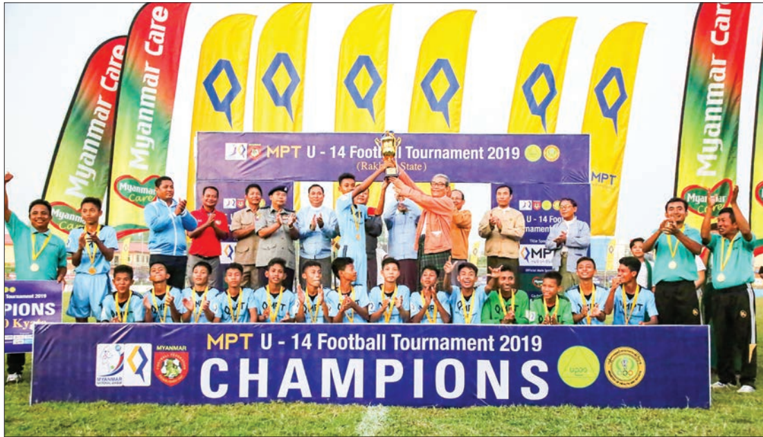
Rakhine State Chief Minister U Nyi Pu presents the championship trophy to Yathedaung team, the winner of the 2019 MPT U-14 Football Tournament (Rakhine State), at the Wasali football ground in Sittway Township on 29 October.

THE Yathedaung U-14 team won the 2019 MPT U-14 Football Tournament (Rakhine State) after beating Kyaukphyu (A) team by 4-2 in a penalty shoot yesterday at the Wasali football ground in Sittway Township, Rakhine State.