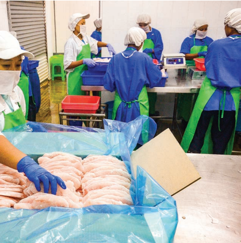
Workers at a fish factory preparing fish for export.

The country also exported 430,000 tons of marine products worth $600 million in the fiscal year 2916-2017 and shipped 560,000 tons of fishery products valued at $700 million in the financial year 2017-2018, according to the statistics from the Ministry of Commerce.