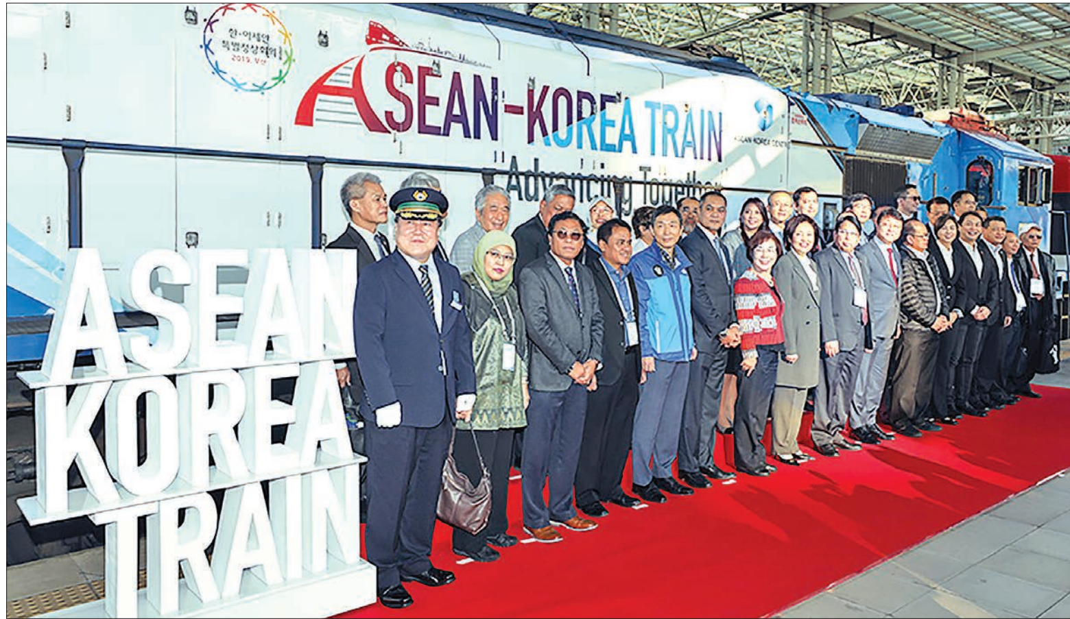
Participants pose at the launching ceremony for the ASEAN-Korea Train at Seoul Station in Seoul on Oct. 16, 2019, ahead of a special summit between South Korea and the 10-member Association of Southeast Asian Nations (ASEAN) set for Nov. 25-26 in the southeastern port of Busan.

I would like to share a unique and truly memorable experience from my participation in the ASEAN-Korea Train Program – which