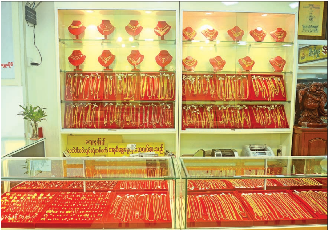
Gold jewelleryes are displayed at a shop in Yangon.

The domestic gold price is positively related to the gold price in the global market, which is currently pegged at $1,492 per ounce, said gold traders. The domestic gold price remained above K1.2 million per tical 7 August onwards, and thereafter, it kept rising and hit a record high of K1.3 million per tical on 5 September, said gold businessmen. With global gold prices on the uptick, the domestic price hit fresh highs this year, reaching K1,000,000 per tical between 17 January and 21 February, crossing K1,100,000 (22 June to 7 August), climbing to 1,200,000 (7 August-4 September), and then reaching a fresh peak of