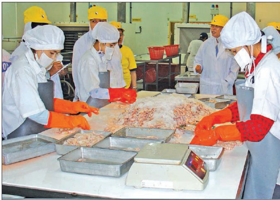
Workers sort out prawns at a factory.