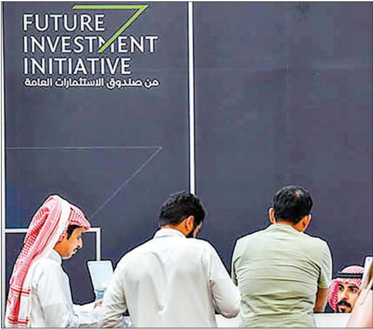
Organisers say 300 speakers from over 30 countries, including American officials and heads of global banks and major sovereign wealth funds, are attending the three-day Future Investment Initiative (FII), nicknamed “Davos in the desert”.

A strong turnout at the annual conference, aimed at projecting the insular kingdom as a dynamic investment destination, will help repair de facto ruler Crown Prince Mohammed bin Salman’s global image that was tainted by Khashoggi’s killing last October. “I have been coming to Saudi Arabia for 20 years but what I have been seeing particularly in the past two or three years is (economic) transformation,” Indian tycoon Mukesh Ambani told the conference, lauding the kingdom’s leaders.