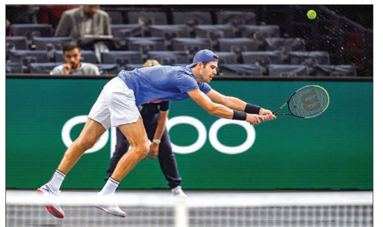
Khachanov's title defence lasted only one match at Bercy.

PARIS (France) — Karen Khachanov's Paris Masters title defence ended at the first hurdle on Tuesday as the Russian lost 7-6 (7/5), 3-6, 7-5 to German Jan-Lennard Struff.