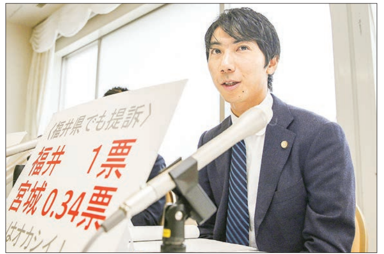
A lawyer speaks to the press in Kanazawa on 29 October, 2019, after the Kanazawa branch of the Nagoya High Court ruled the same day that the July upper house election was constitutional, tolerating a disparity of up to 3.00 times in the weight of a single vote between the most and least populated constituencies.

The plaintiffs immediately appealed the ruling to the Supreme Court.—Kyodo News ■