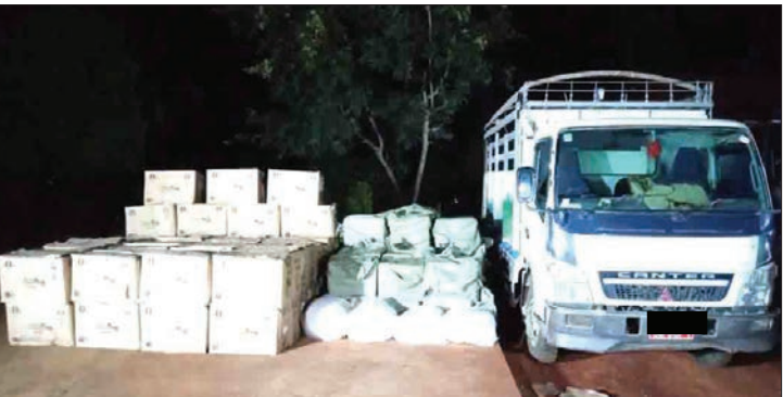
Illegal drugs confiscated seen by the vehicle on 26 October.