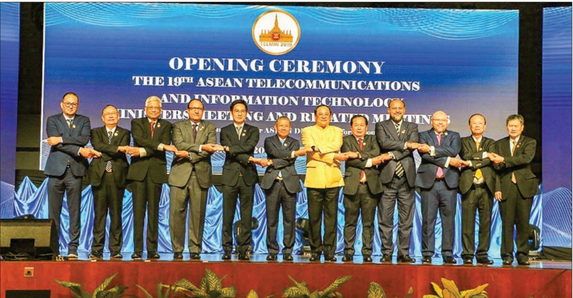
Union Minister U Thant Sin Maung and other ASEAN ministers pose for a group photo at the 19 th ASEAN Telecommunications and Information Technology Ministers Meeting and Related Meetings in Vientiane.

THE fourth anniversary of the Nationwide Ceasefire Agreement (NCA) is to be held at the Myanmar International Convention Center II in Nay Pyi Taw on 28 October 2019. The anniversary of the NCA will be broadcast live by Myanma Radio and Television (MRTV), National Races Channel (NRC), Myanmar International TV (MITV), Myawaddy (MWD) Television, MNTV, Skynet Up to Date, Channel 9, Myanma Radio, MIR (Radio), President’s Office Facebook Page, Myanmar State Counsellor’s Office Facebook Page, MOI Web Portal Myanmar Facebook Page, MRTV Facebook Page and Myanmar Digital News Facebook, starting from 1:45pm. — MNA ■ (Translated by Kyaw Zin Tun)