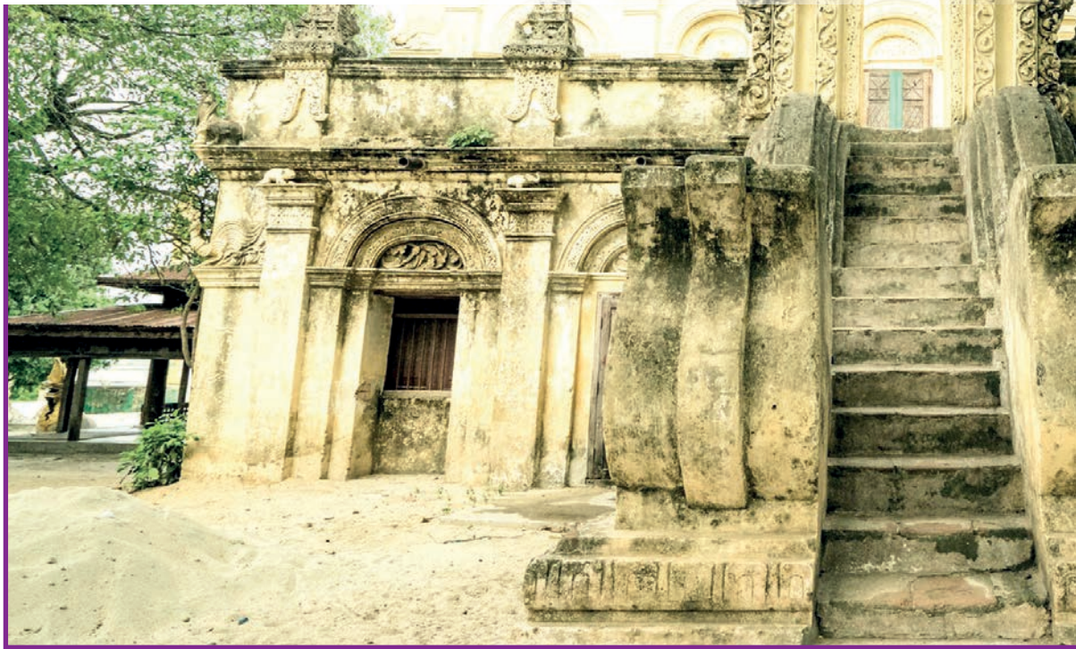
The brick monastery donated by King Mindon (1853-1878).