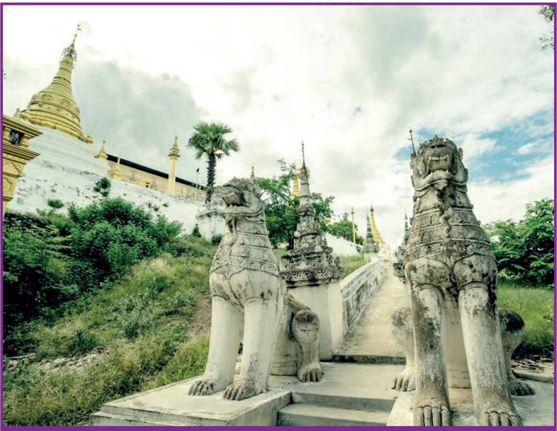
The Chinthe ( the guardian Lions ) are seen at the entrance of pagoda.