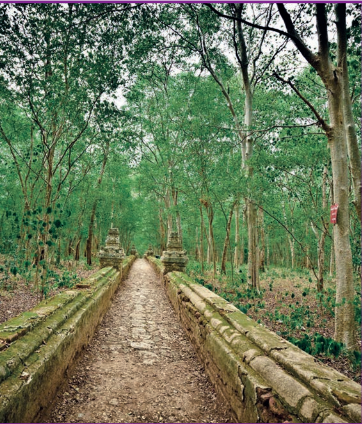
Way to forest retreat monastery.