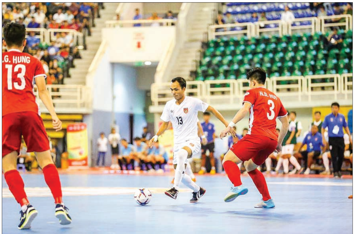
The Myanmar player (white) attempts to pass through the Viet Nam massive defense during the third place match of the AFF Futsal championship in Ho Chi Minh yesterday.

Winning the final 7-3, the Viet Nam team won the bronze