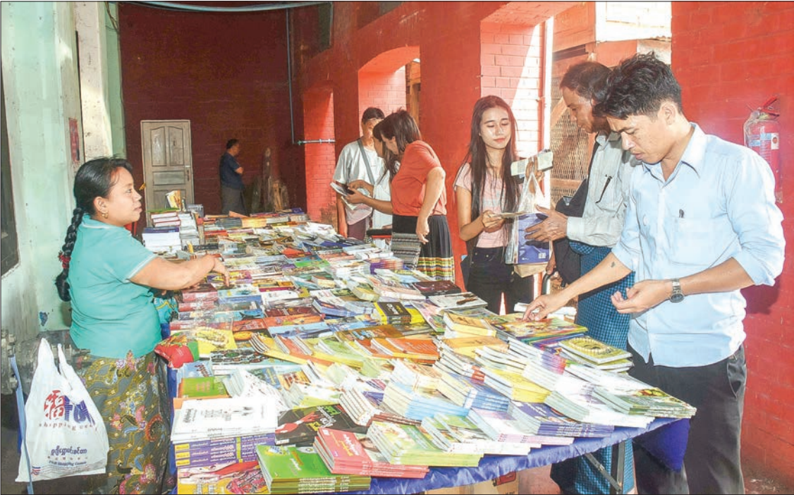
Book-lovers buying books at the book stalls of the Myanmar Literary and Arts Festival in Yangon yesterday.