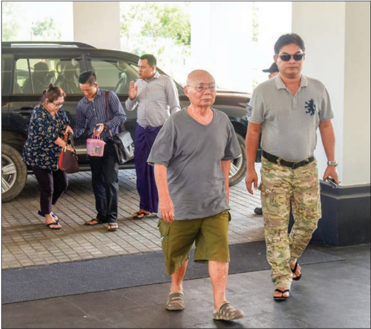
The leaders and representatives of Ethnic Armed Organizations (EAOs) arrive in Nay Pyi Taw to attend the fourth anniversary of Nationwide Ceasefire Agreement.

THE leaders and representatives of Ethnic Armed Organizations (EAOs) arrived in Nay Pyi Taw to attend the fourth anniversary of Nationwide Ceasefire Agreement (NCA). The leaders and representatives of EAOs arrived in Nay Pyi Taw were the Pao National Lib-