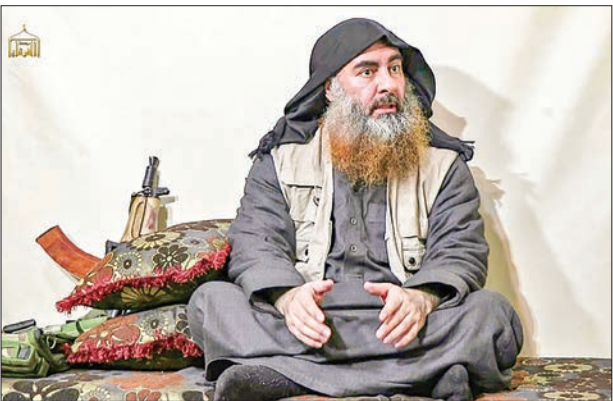
Islamic State group chief Abu Bakr al-Baghdadi appears for the first time in five years in a propaganda video released by the group in April 2019.