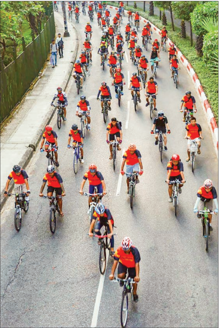
Cyclists take part in the Yangon mass cycling event yesterday.

WITH a view to promoting health-enhancing physical activity, the Yangon mass cycling gathering was held at 6 a.m. yesterday at Kandawgyi Park in Yangon.