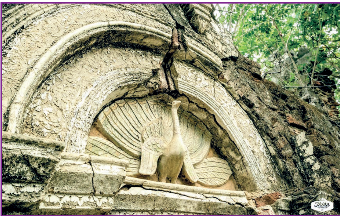
Myanmar concrete art work.

than an hour drive. The two-way road was an awkward one and half lane wide with some portion being very good while some portion in an extremely bad shape. The best car for this road is an off road 4x4 cars but motorcycle is also good enough. But if you are going there by a motorcycle, make sure you wear a helmet, be alert looking where you were going as well as checking the rear view mirror frequently.