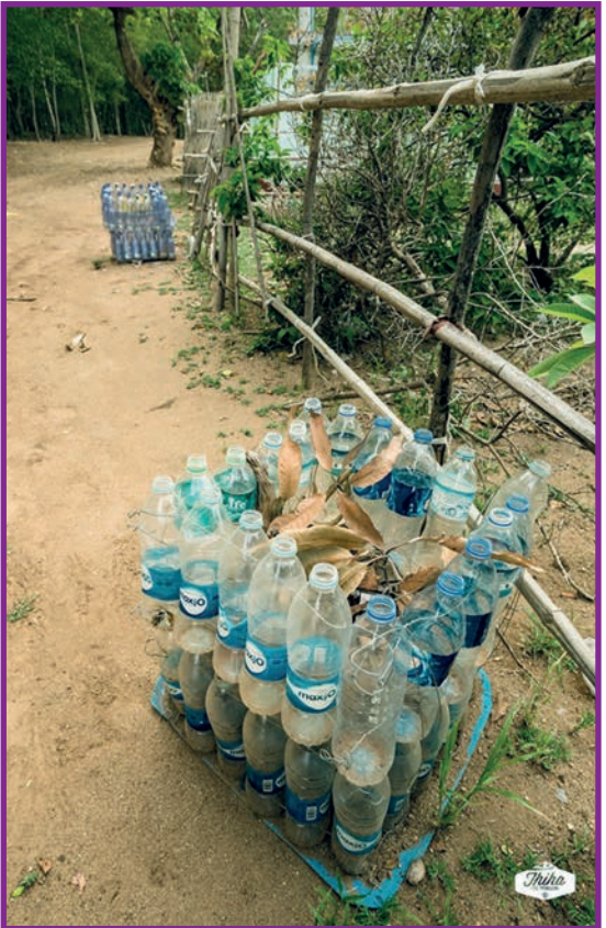
Trash bins made with plastic bottles.