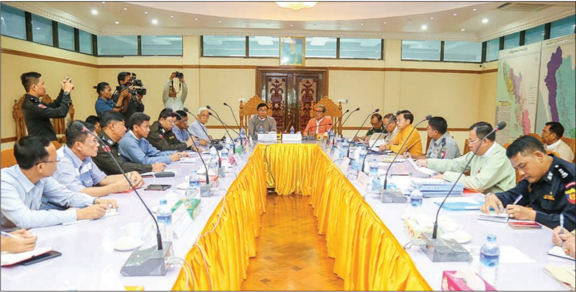
Union Minister Dr Win Myat Aye addresses the coordination meeting on resettlement programme on displaced civilians in Rakhine State yesterday.

security, accommodations, education, health services, possible closures of IDP camps, travel permits for national verification card holders and citizenship registration for them. U Aung Kyaw Zan, the Minister for Electricity, Industry, Roads and Transport of Rakhine State, explained resettlement programme for IDPs from 2017 violence, plans for resettlement of returnees who were accepted under the UEHRD programme, and temporary building designs for them. Deputy Minister U Soe Aung also discussed resettlement programme for Rakhine State, and shared experiences on arrangements for civilians who fled from armed conflicts in Kachin and Shan states.