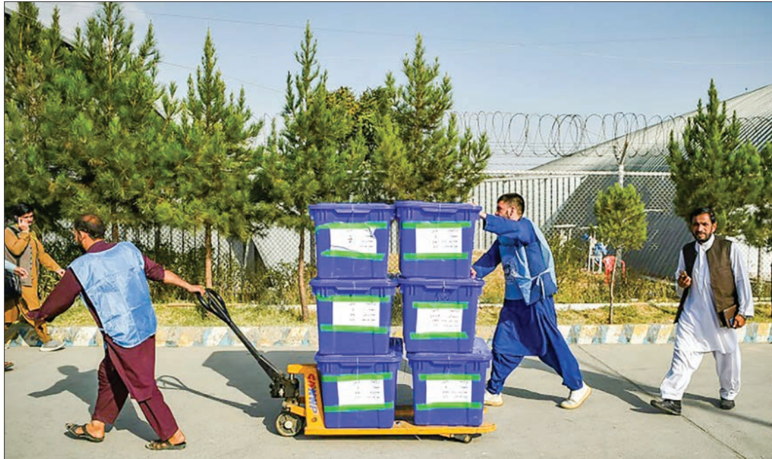
Afghanistan's presidential election in September saw a record low turnout.

"This (election) is a fate-determining issue in the country and we cannot accept sacrificing transparency for speed."