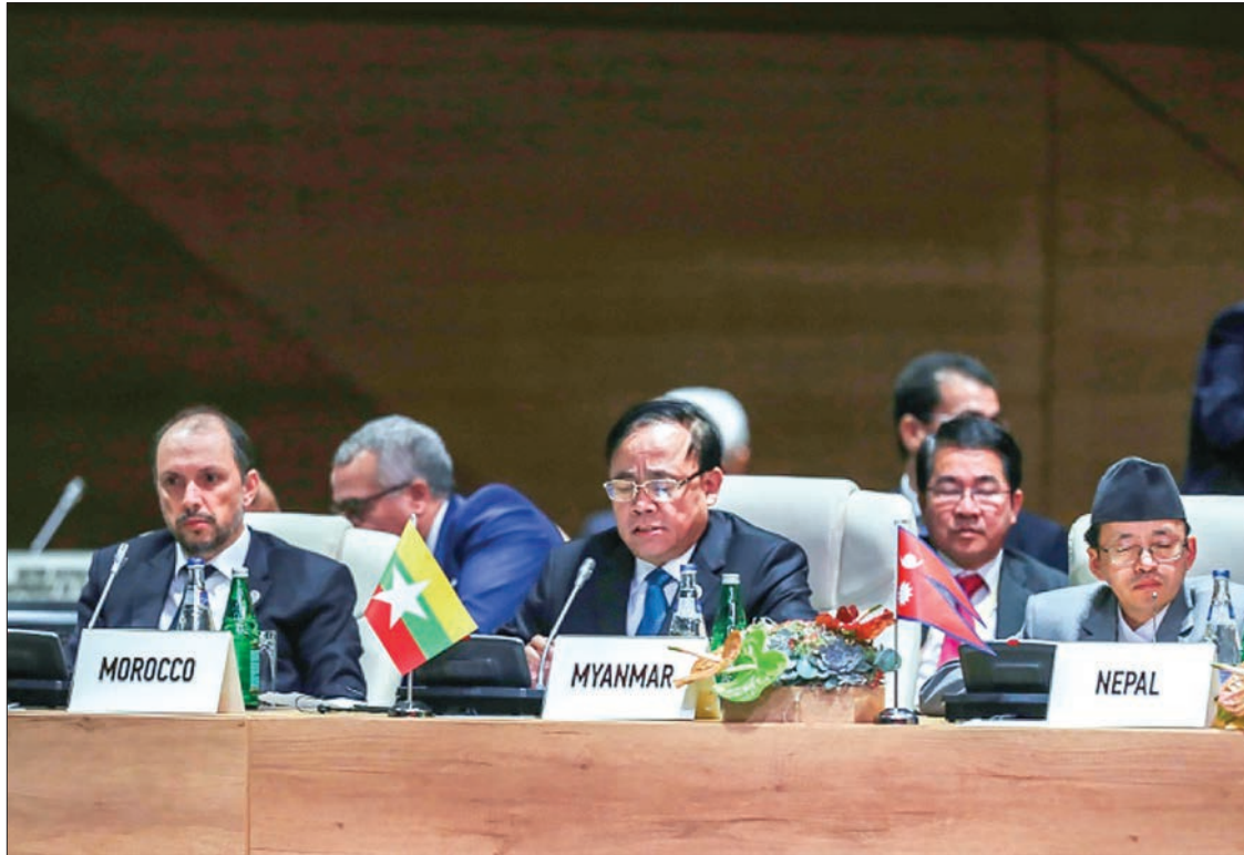
Union Minister U Kyaw Tin attends the 18th Summit of the Non-Aligned Movement in Baku, Azerbaijan from 25 to 26 October.

In his statement made by the Union Minister at the second session of the NAM Summit held on 26-10-2019 under the theme "Upholding the Bandung Principles to ensure concerted and adequate response to the challenges of contemporary world", the Union Minister stated that the Non-Aligned Movement, representing two-third of the UN members and more than half of the humanity, has the great potential to play a more effective and important role in responding to the numerous challenges facing the world today. One of its major achievements was its political and moral drive to the decolonisation process that led to the emergence of many independent countries present at the meeting. The founding fathers had envisaged a peaceful and prosperous world and a just and equitable order where states can determine independently their own destinies. Myanmar, the then Burma, was among the five countries that co-sponsored the Bandung Conference. Suc-