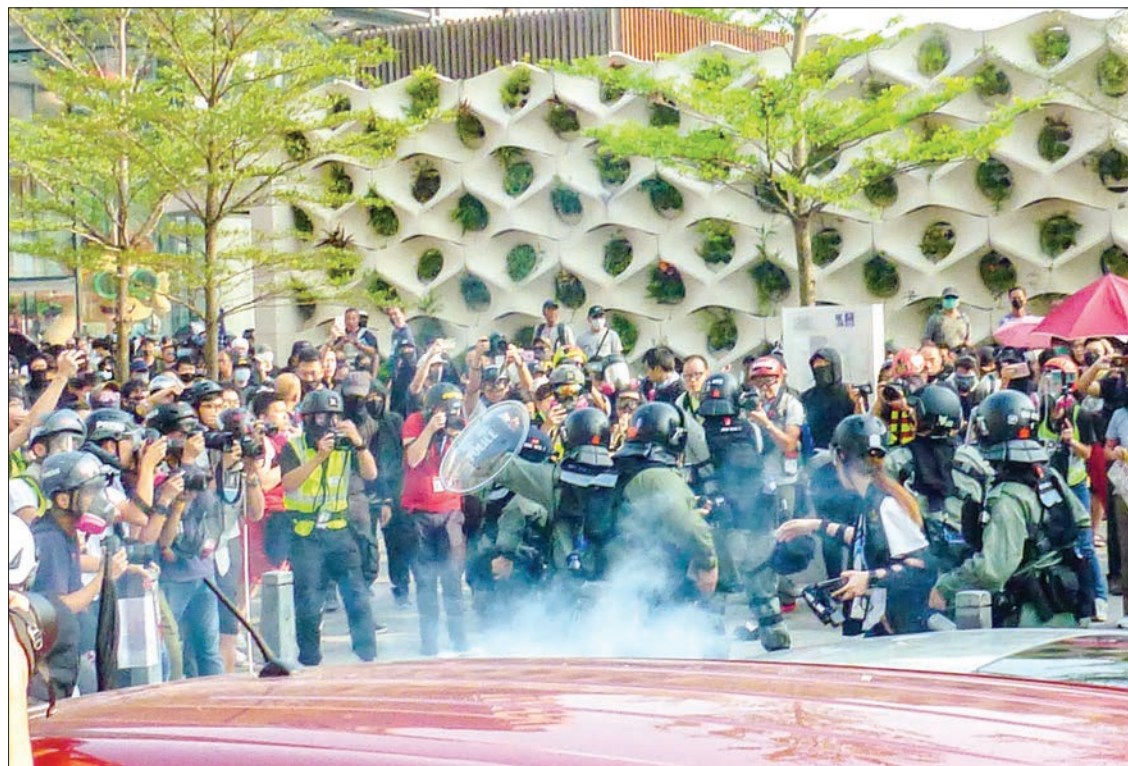
Hong Kong police fire teargas and rubber bullets at hundreds of protesters rallying in the tourist hotspot of Tsim Sha Tsui in the Kowloon peninsula on Oct. 27, 2019 as a fresh round of anti-government protest entered its 21st weeks.