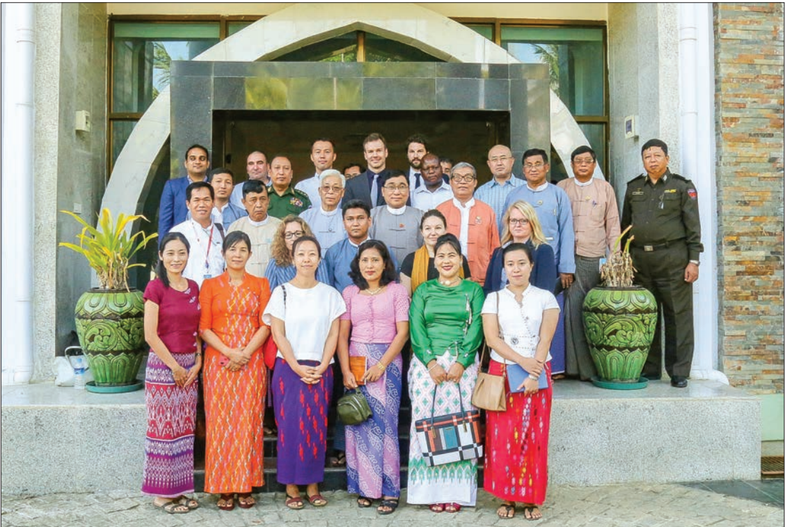
Union Minister Dr Win Myat Aye, Rakhine State Chief Minister U Nyi Pu and other dignitaries and members of the UN agencies pose for a group photo yesterday.

local communities. The Union Minister said the Rakhine Coordination Committee is helping in the works of UN agencies and international organizations, and that the assistances are to be constructive and supportive of peace, stability and development. He also called for full cooperation, especially in challenging situations. Rakhine State's Security and Border Affairs Minister Colonel Min Than, as the Chairman of Rakhine Coordination Committee, said that UN agencies have access to most of the areas, except some areas for security reason, to provide aid and healthcare services for the displaced civilians from armed conflicts. The Minister also asked for effective humanitarian assistance for them. Member of UEHRD U Toe Aung suggested resettlement