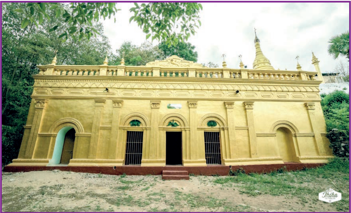
Ancient religious building.