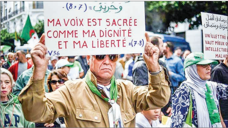
Protester in Algiers holds up sign that reads, 'My voice is sacred just like my dignity and my freedom'.

Tension has mounted in recent days between security forces and protesters, who are blocking roads and bringing the country to a standstill to press their demands for a complete overhaul of the political system. —AFP ■