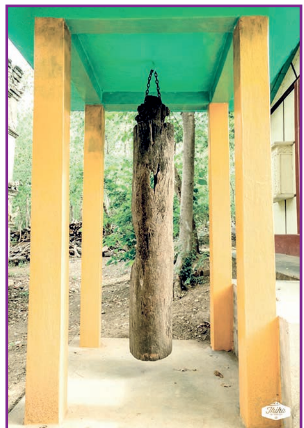
Wooden gong.

pound. There'll be an old monastery known as a forest retreat monastery that was constructed with the donation of King Mindon in ME 1224 (AD 1862). It was in a quite dilapidated condition and not much maintenance seems to be conducted. But old Myanmar architectural forms in concrete are still around in abundance and this was invaluable. There's also a covered walkway or a rest area that was constructed with King