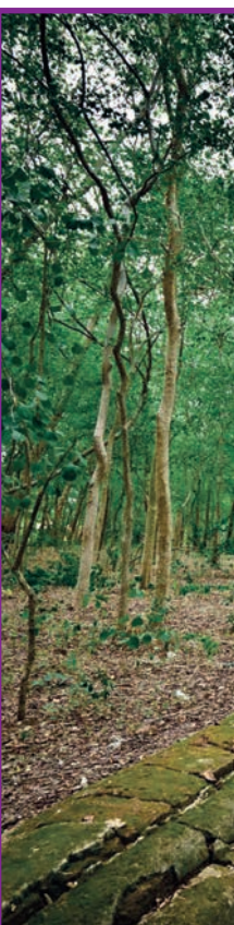
The brick-lined pathway