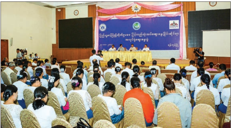
The workshop to review the Public Library Law is being convened in Yangon yesterday.