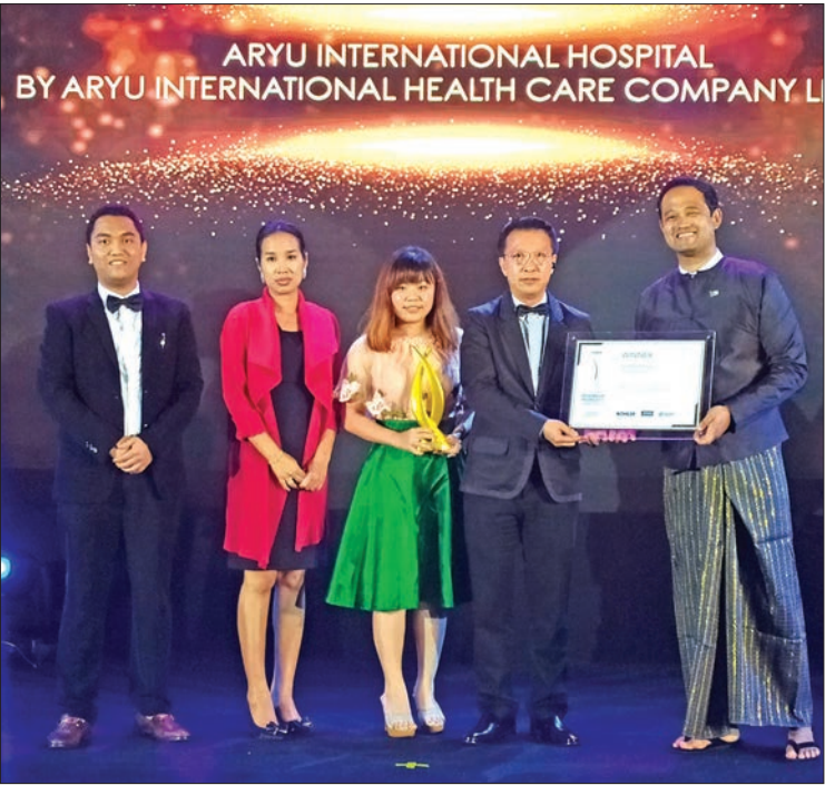
The 5 th Property Guru Myanmar Property Awards 2019 ceremony held on 23 October in Yangon to honour the best construction companies in Yangon Region.

The company constructed Gamone Pwint Wholesale Mall between Myanmar Gone Yi and Bo Min Yaung