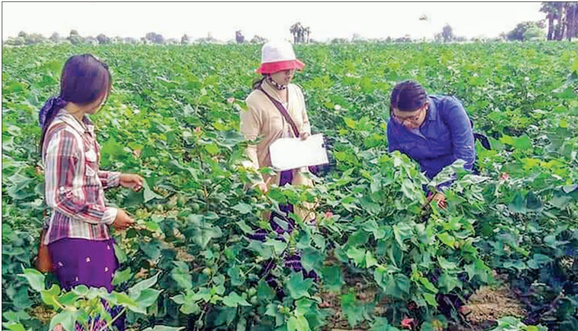
The Township Agriculture Department is currently distributing seeds of long staple cotton with the aim to increase the acreage in Meiktila Township.

THE yield of long staple cotton, grown on 50 acres at the agriculture service centre in Kantaung Village, Meiktila Township, has reached 750 viss (a viss equals 1.6 kg) per acre.