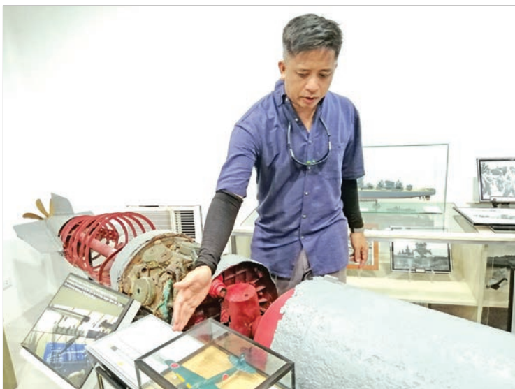
A local historian explains about some items on display at the Battle of Surigao Strait Museum.