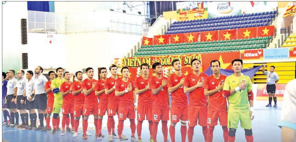
The Myanmar national futsal team sing the national anthem before the match against Thailand in the group stage of the AFF Futsal Championship 2019 in Ho Chi Minh City, Viet Nam.

THE Myanmar national futsal team will play against the Indonesian futsal team today in the semifinal of the ASEAN Football Federation (AFF) HD Bank Futsal Championship 2019 at the Phu Tho Indoor Stadium in Ho Chi Minh City, Viet Nam.