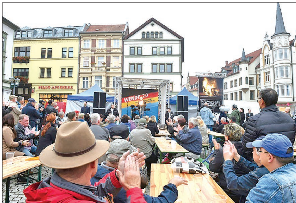
In regional elections in the eastern German state of Thuringia on Sunday, the far-right Alternative for Germany (AfD) party faces a key test of support.

ERFURT (Germany) — Germany's far-right AfD party faces a key test of support in a state election in former communist east Germany on Sunday, following national outrage over a deadly shooting at a synagogue.