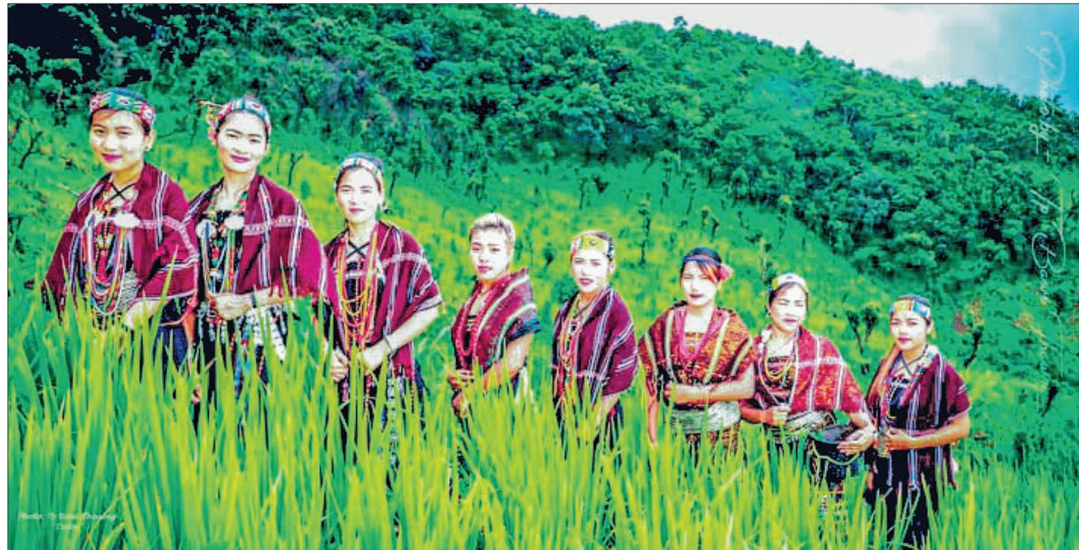
Damsels wearing Chin traditional dress celebrate harvest festival in Chin State.

They were more interested in finding employment overseas