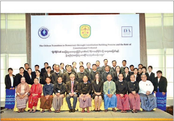
Officials and participants of the democracy transition workshop are seen at the opening ceremony.

was attended by the members of Constitutional Tribunal, its senior officials and representatives of IDEA. The workshop discussed political situations in Chile, the role of its constitutional tribunal during its fledgling democracy, comparative studies between experiences of Chile and other countries. Myanmar's Constitutional Tribunal and the International IDEA Myanmar are the partner organizations, and the latter is providing technical assistance to promote constitutional knowledge in building a democratic federal state.—MNA (Translated by Aung Khin)