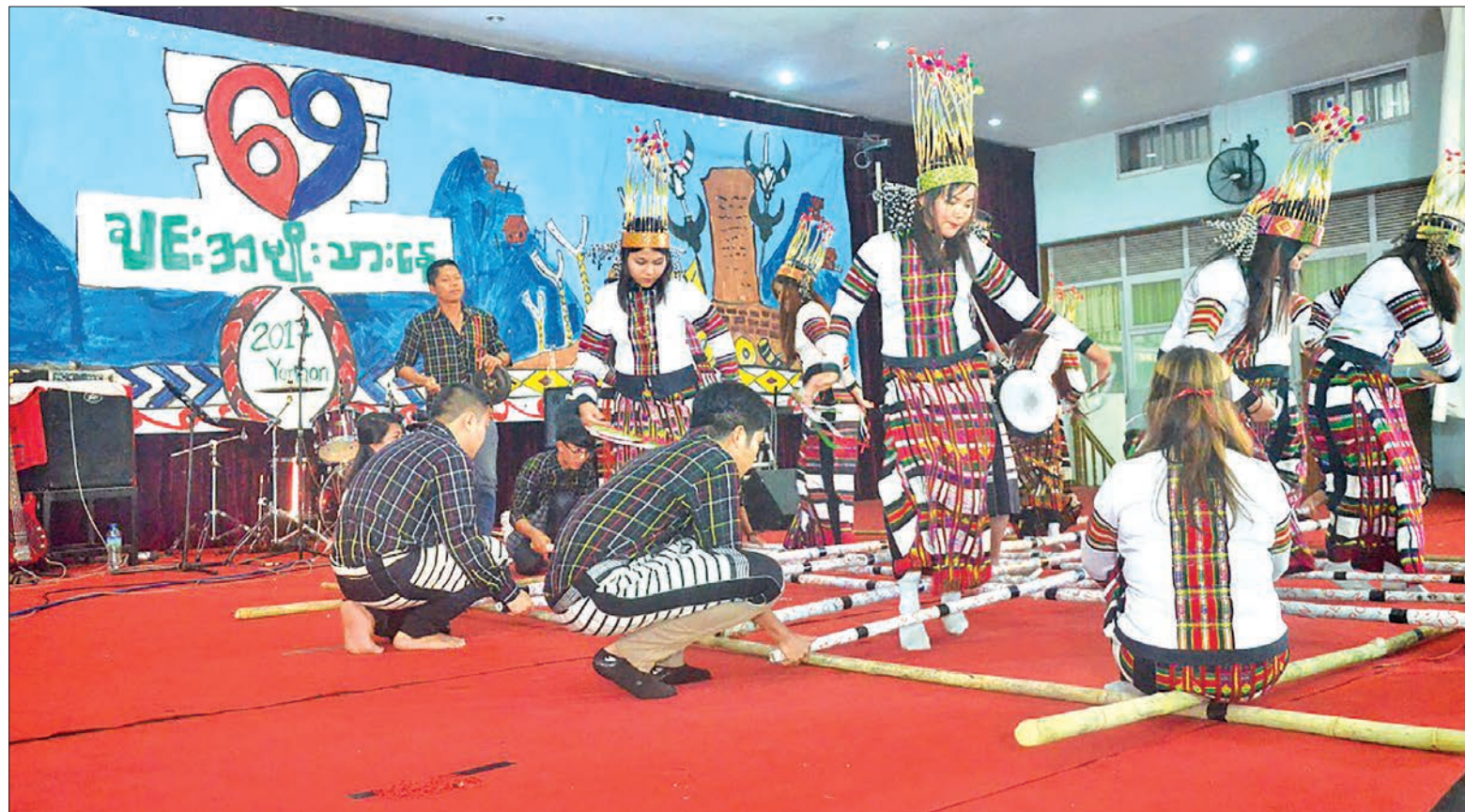
FILE PHOTO: Chin ethnic dancers perform traditional dance at a ceremony to mark the 69 th Chin National Day in Yangon on 20 February, 2017.

In 2010, more civil servant positions were offered in Chin State and the number of youths leaving for another country decreased. The government and NGOs called in more young Chins to increase their staff and they are now serving the national interest across Myanmar.