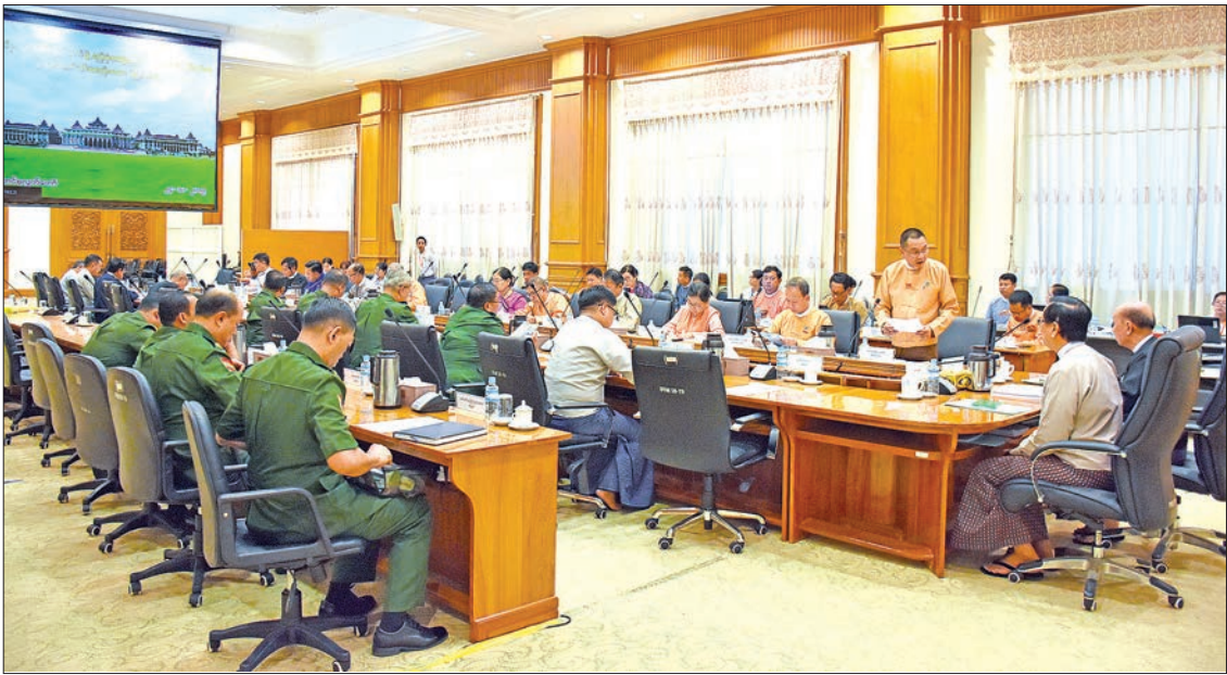
The joint committee meeting on amending the 2008 Constitution in progress.