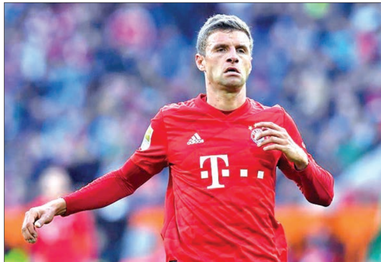
Inter Milan and Manchester United are reportedly interested in signing Bayern Munich's striker Thomas Mueller.

"I'm trying to concentrate on playing football. Slowly all the discussions will come to an end," Mueller told reporters in Athens when asked about his future at Bayern.—AFP ■