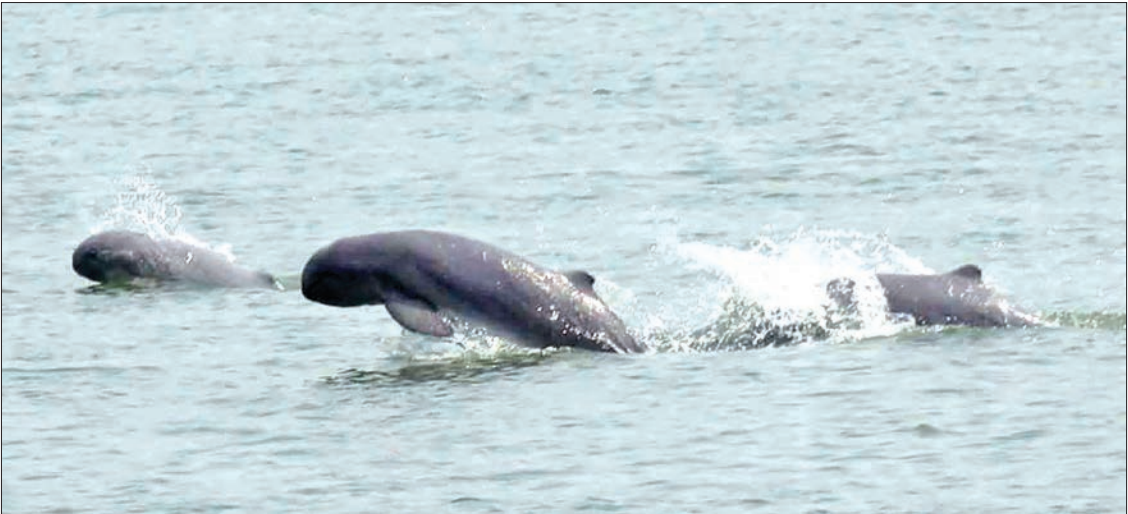
The baby Ayeyawady dolphins were spotted in the conservation area between Mandalay and Kyaukmyaung.