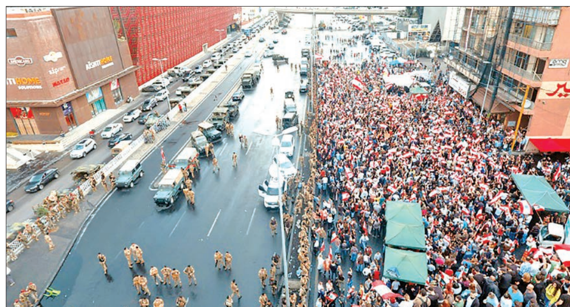
Protesters have cut major highways across Lebanon, crippling the capital Beirut and other cities.

"People think we're playing but we're actually asking for our most basic rights: water, food, electricity, healthcare, pensions, medicine, schooling," he told AFP.—AFP ■