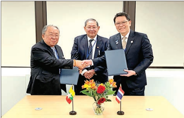
Governor of Central Bank of Myanmar U Kyaw Kyaw Maung shakes hand with Thailand's Central Bank Governor Mr Veerathai Santiprabhob.

The Governor of the Central Bank of Myanmar, U Kyaw Kyaw Maung, attended the annual meetings of the World Bank Group and International Monetary Fund at Washington, D.C., USA, from 17 to 20 October.