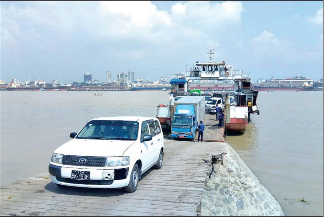
The Z-crafts are operating hourly from 5 am to 7 pm every day.

“Cars can save two hours’ time driving to towns from Ayeyawady region through Wahdan and Dala.