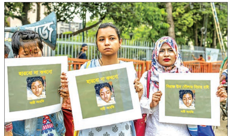
Women hold pictures of murdered teenager Nusrat Jahan Rafi during a protest in Dhaka.

Rafi was lured to the rooftop of the seminary in Sonagazi where her attackers pressed her to withdraw the complaint she had filed with police. —AFP ■