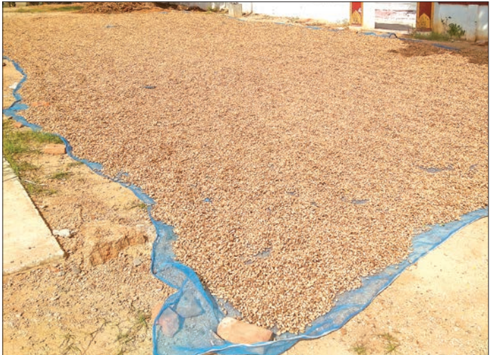
The yield of peanuts is low this year due to the erratic weather and the long spell of rains.