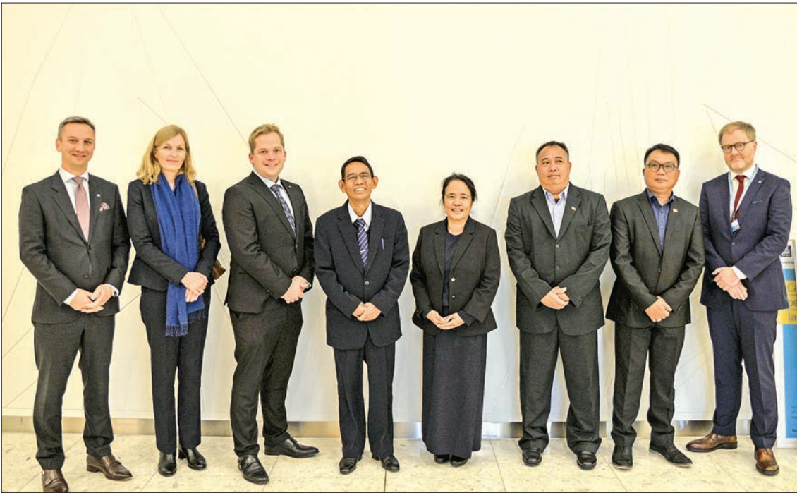
Myanmar delegation led by Union Minister Dr Aung Thu is seen together with officials of the Norway-based Yara International crop nutrition company.