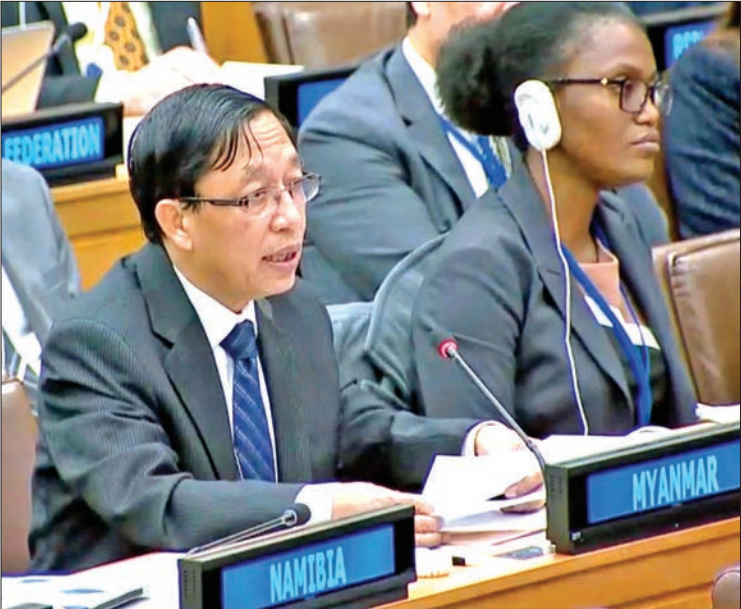
Permanent Representative of Myanmar to the United Nations U Hau Do Suan.

THE Permanent Representative of Myanmar to the United Nations reaffirmed Myanmar's commitment to address the Rakhine State issues with goodwill, in cooperation with the Special Envoy as well as friends near and far during the introductory session of the Report of the Secretary-General on Myanmar. At its 74 th Session of the UN General Assembly, the Third Committee (Social, Humanitarian, and Cultural) continued its debate on the promotion and protection of human rights in the afternoon session on 23 October 2019. Under the agenda item related to the human rights situation and reports of Special