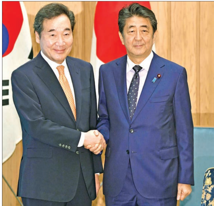
Japanese Prime Minister Shinzo Abe (R) and South Korea Prime Minister Lee Nak Yon.

The Japanese leader expressed his intention to continue diplomatic efforts to break the impasse, while Lee said he