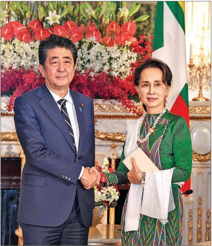
State Counsellor Daw Aung San Suu Kyi meets with Japanese Prime Minister Shinzo Abe at the State Guest House in Tokyo on 21 October.

Ministry of Foreign Affairs Nay Pyi Taw 24 October 2019