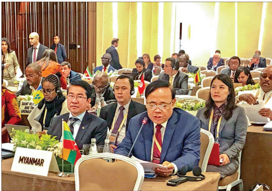
Union Minister U Kyaw Tin delivers the statement at the Preparatory Ministerial Meeting of the 18 th Non-Aligned Movement on 23 October in Baku, Azerbaijan.

Union Minister U Kyaw Tin pointed out that the dream of the Movement to enjoy the right to determine their own destiny or resolve their own internal problems in their own way is still far from realization. The power of globalization made the national boundaries blurred and encroached upon the sovereignty and independence of nations.