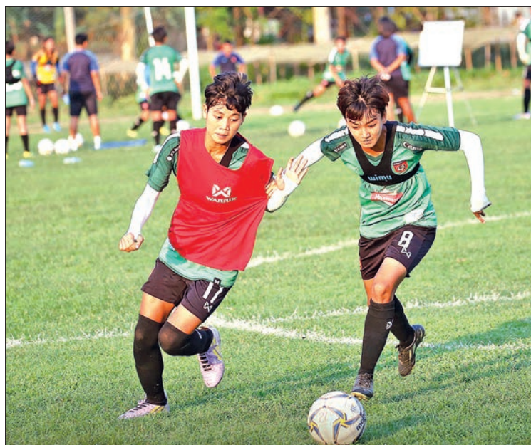
Myanmar U-19 women footballers train in Yangon ahead of the AFC U-19 Women's Championship 2019.

Myanmar will take on Asian football powerhouse Japan on 28 October; China PR on 31 October; and South Korea on 3 November.—Lynn Thit (Tgi)