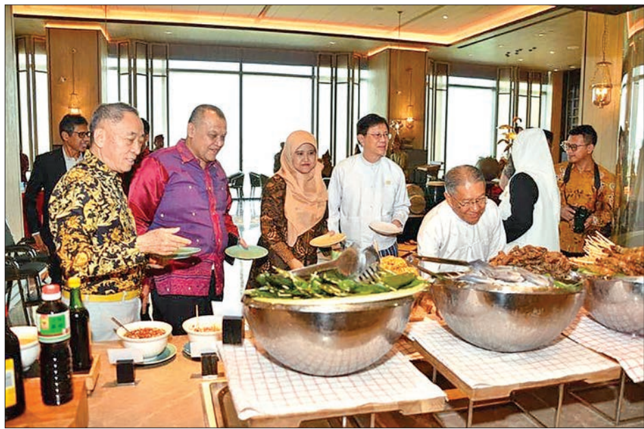
The Indonesian Embassy holds an Indonesian food festival yesterday with a reception and cultural performance at the Pan Pacific Hotel in Yangon.