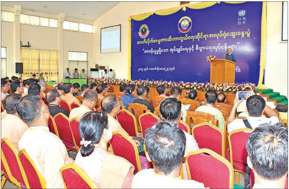
Anti-Corruption public workshop being convended in Monywa.