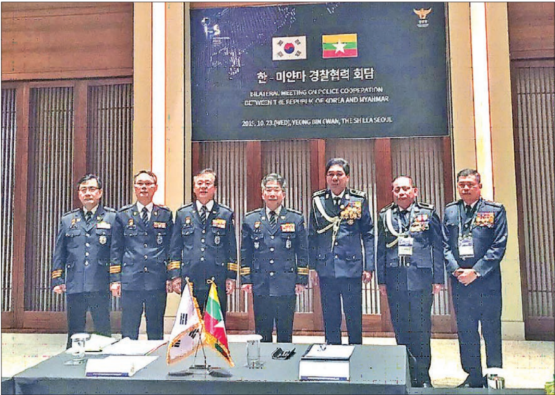
The Myanmar delegation is seen together with Korean police officers before the Bilateral Meeting on Police Cooperation between the Republic of Korea and Myanmar.