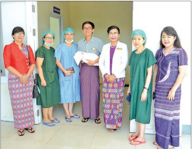
Second successful "test-tube baby," beside the hospital's superintendent, a midwife and surgeons at Central Women's Hospital, Yangon.