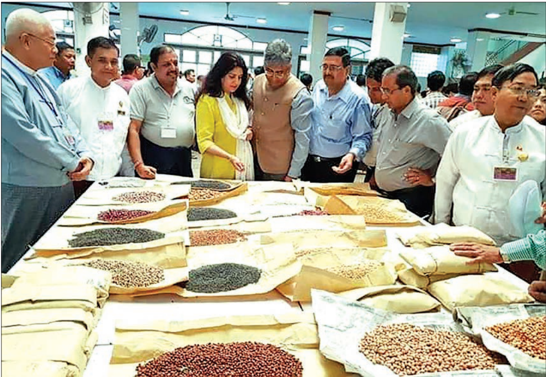
Indian Ambassador and party observe pulses trade at the Mandalay wholesale market.

Myanmar is importing raw materials for garments, textiles, and traditional loom businesses from India. Therefore, the MRCCI called for technical as-