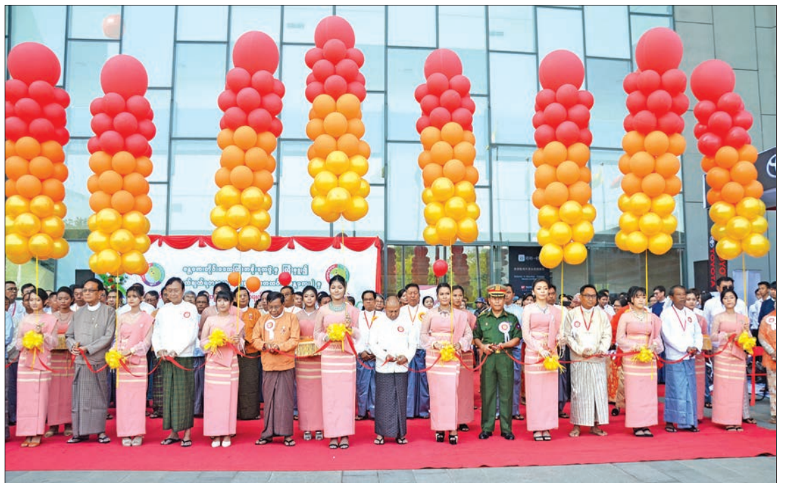
Officials cut the ribbon to launch the first jade and jewelry sales exhibition in Mandalay.