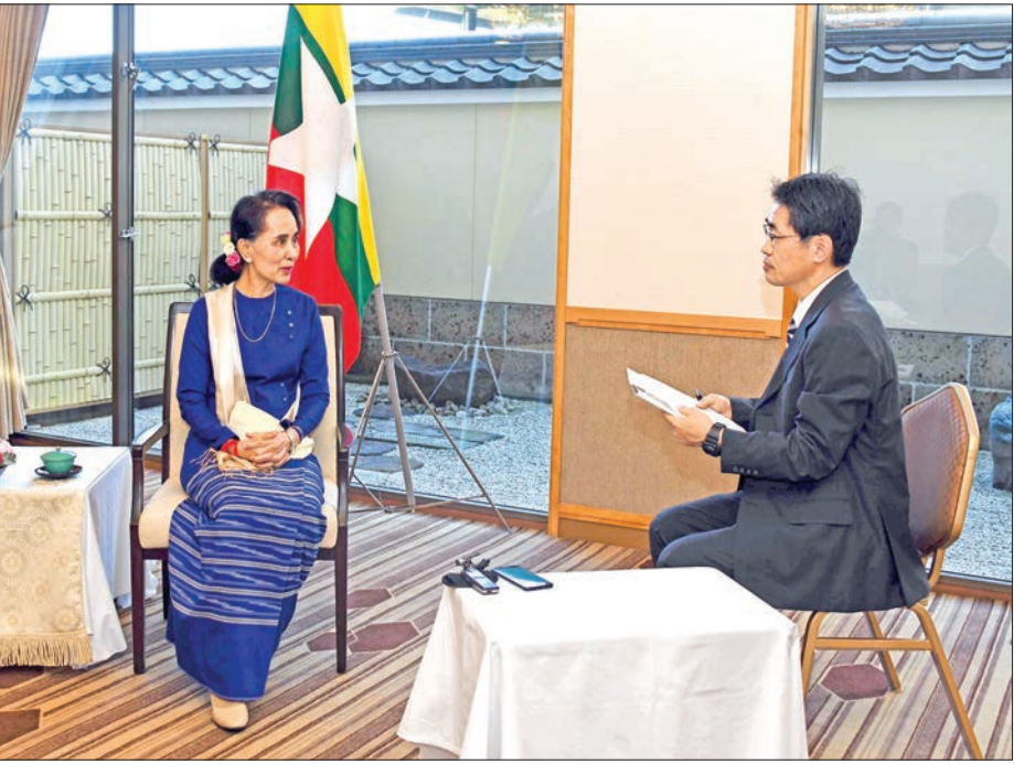
State Counsellor Daw Aung San Suu Kyi, left, gives an interview to the Mainichi's correspondent at The Imperial Hotel in Tokyo, yesterday.