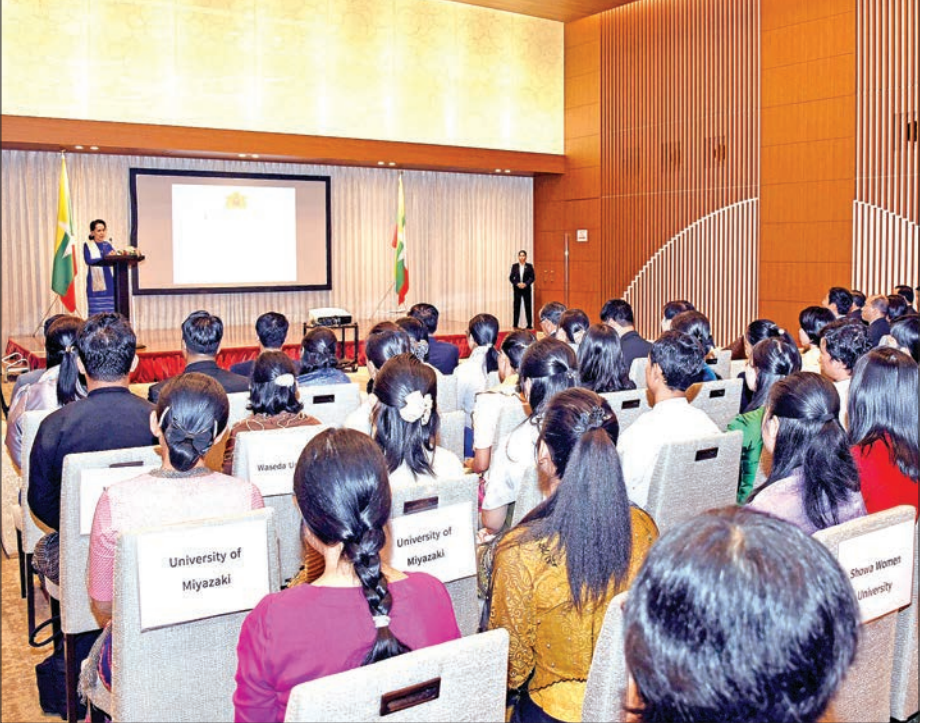
State Counsellor Daw Aung San Suu Kyi meets with Myanmar nationals studying in Japan at the local embassy.