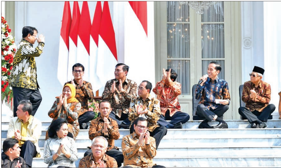
New Indonesian Defense Minister Prabowo Subianto stands up when President Joko “Jokowi” Widodo introduced him to the public at the verandah of the Merdeka (Freedom) Palace in Jakarta on 23 October, 2019.

“I don’t think I have to tell you his duties. He knows better than me,” Jokowi said in introducing Prabowo from the veran-