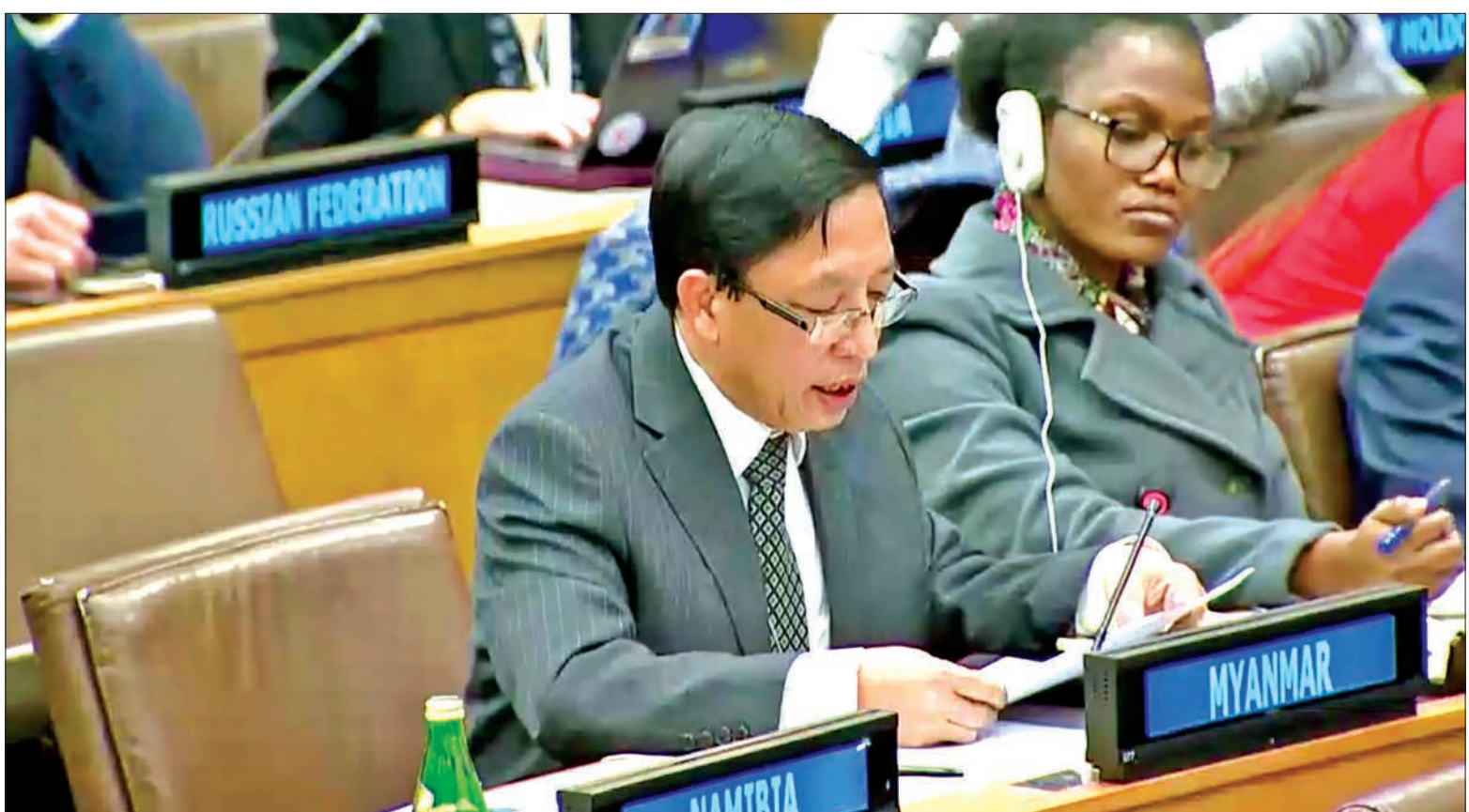
Permanent Representative of Myanmar to the United Nations Ambassador U Hau Do Suan.

In addressing cooperation with the United Nations, he said that Myanmar is disappointed and disheartened because the country's goodwill and spirit of cooperation with the UN Human Rights body throughout the past nearly three decades gave noth-