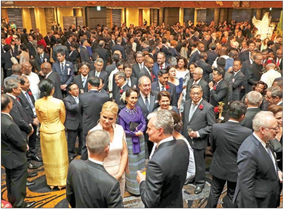
State Counsellor Daw Aung San Suu Kyi socializes with royal and high-ranking dignitaries during Emperor Naruhito's enthronement banquet in Hotel New Otani, Tokyo.