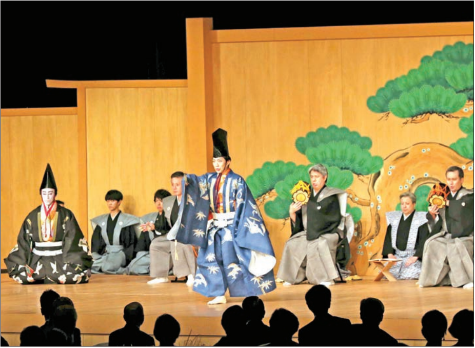
Japanese actors perform a kabuki drama at Emperor Naruhito's enthronement banquet hosted by Prime Minister Shinzo Abe in Hotel New Otani, Tokyo.