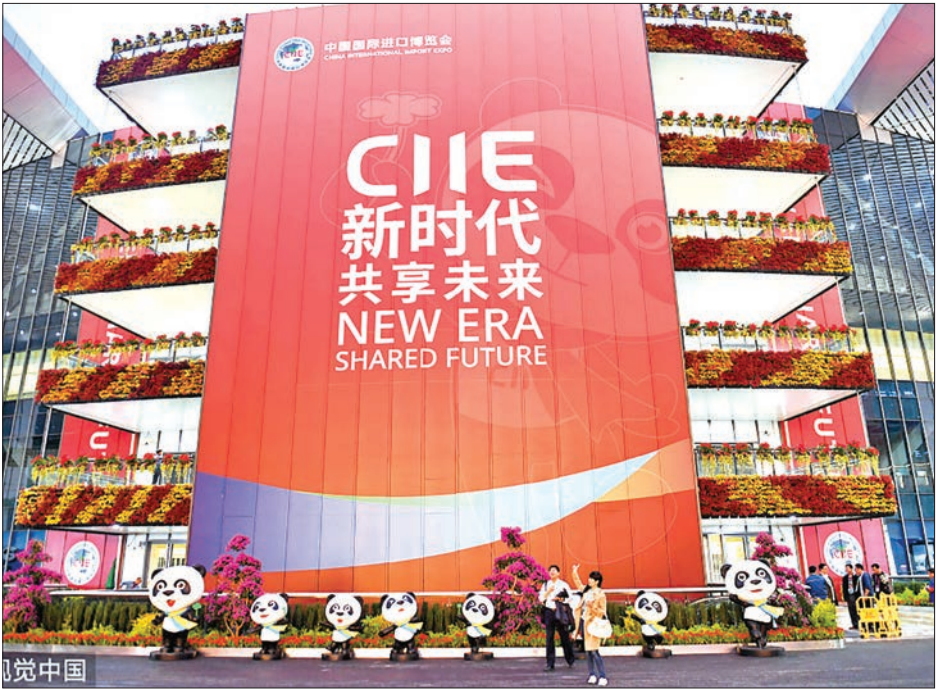
FILE PHOTO: The first China International Import Expo (CIIE) in Shanghai.

on the 165-million-US-dollar project, it will employ minimum 200 people. We want more of that. We want Chinese people to come to live in Sealy,” said Merrell. Besides attending CIIE, the Sealy delegation also plans to visit Hailiang Group headquarters in east China’s Zhejiang province. Organized by Greater Houston Partnership, a delegation of more than 20 business leaders in Greater Houston will go to China attending the second CIIE early next month. —Xinhua ■