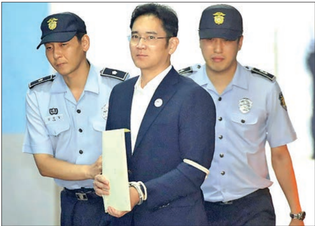
Samsung Group heir Lee Jae-yong arrives at Seoul Central District Court in handcuffs during his trial in 2017.

The new proceedings begin Friday and are like-