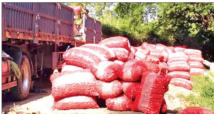
Workers unload bags of onions from a truck at the depot in Kyaukpadaung.

At present, new onions are selling for just K600 per viss. The price of onions increased to K700 per viss in September and K1,000 in October; an increase of K300 within a month, according to the Chogyi onion depot.—Ko Htein (Ngathayout) (Translated by Hay Mar)