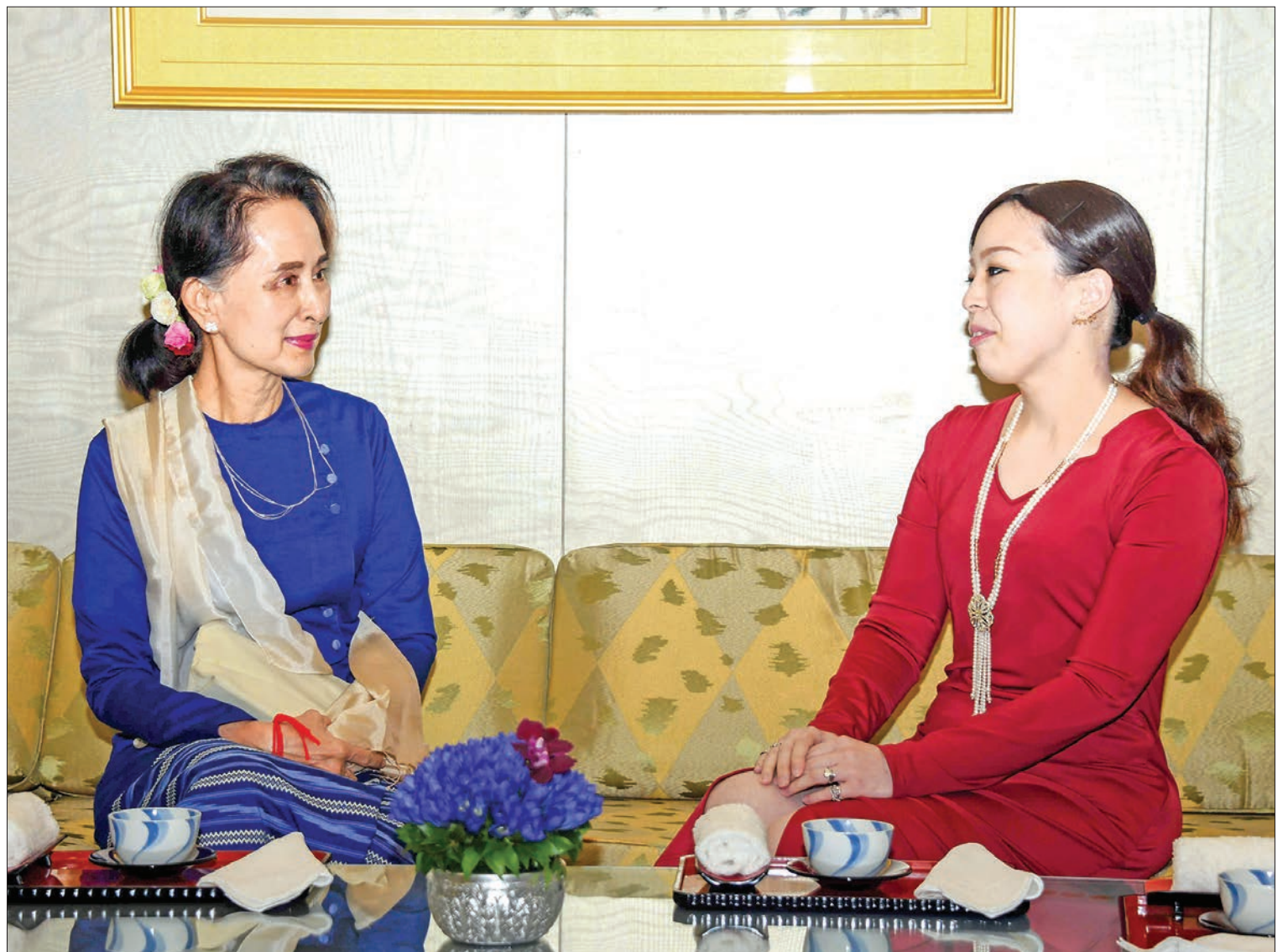
State Counsellor Daw Aung San Suu Kyi meets with Princess Yoko at the State Guest House in Tokyo, Japan yesterday.

State Counsellor attended a banquet for newly enthroned