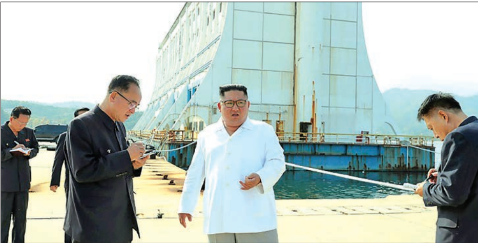
Mount Kumgang tours came to an abrupt end in 2008 after a North Korean soldier shot dead a Southern tourist who strayed off the approved path.

Pyongyang has long wanted to resume the lucrative visits, but they would now violate international sanctions