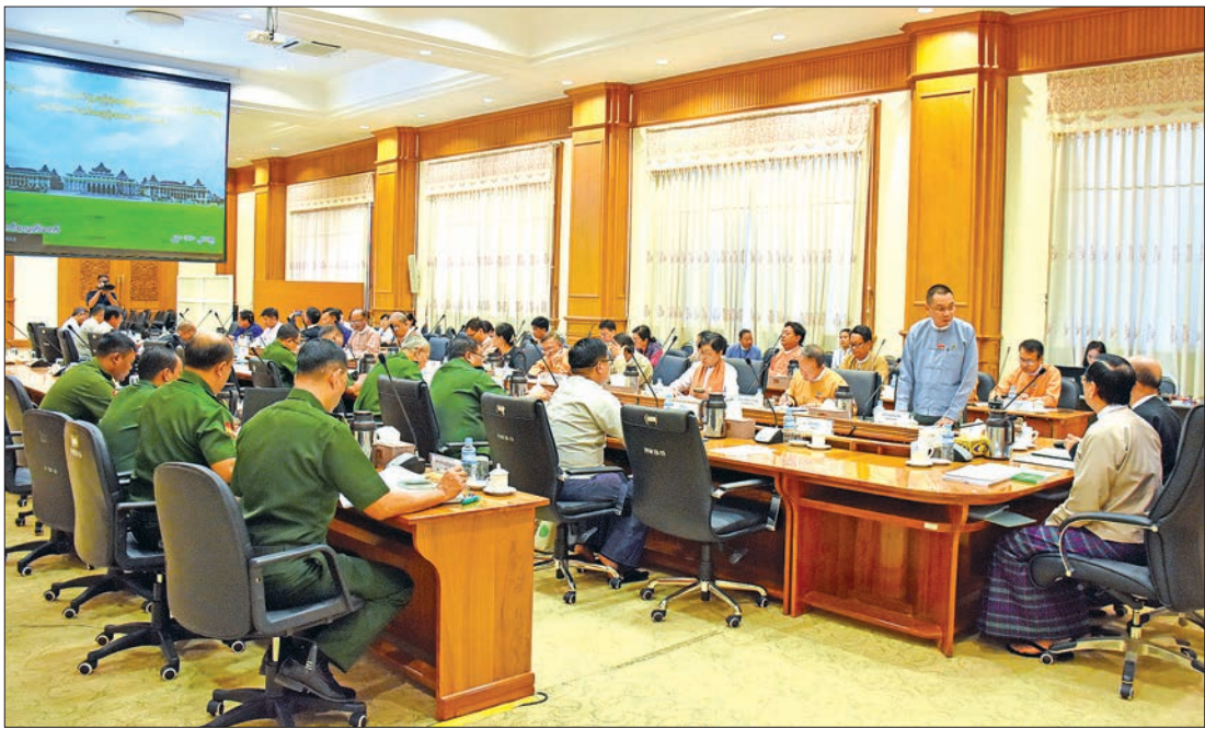
Meeting 48/2019 of the Joint Committee on Amending the 2008 Constitution held in progress in Nay Pyi Taw yesterday.