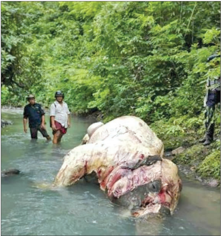
An elephant carcass is found completely skinned in Ngapudaw Township, Ayeyawady Region.