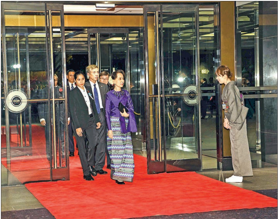
State Counsellor Daw Aung San Suu Kyi arrives for Emperor Naruhito's enthronement banquet at Hotel New Otani in Tokyo yesterday.