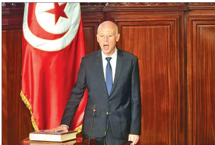
Tunisia's new President Kais Saied, an academic nicknamed "Robocop" for his rigid and austere manner, takes the oath of office after his upstart election victory earlier this month.

A constitutional law professor whose rigid and austere demeanour earned him the nickname "Robocop", Saied has no