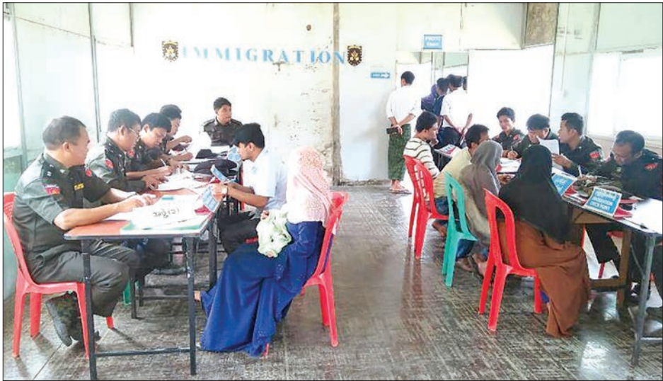
Immigration officers issue national verification cards to returnees at Taung Pyo Letwe Reception Centre in Maungtaw Township, Rakhine State.

A total of 29 persons comprising five families returned on their own volition to Taung Pyo Letwe Reception Centre in Maungtaw Township, Rakhine State at 8: 15 am on 22 October morning. Officials at the reception centre carried out review and acceptance procedures for 18 men and 11 women, totaling 29 persons, from the five families. After completing security checkup and immigration procedures, nine men and eight women, totaling 17 persons, from five families, received National Verification Cards. The reaccepting procedure was completed at 12 noon after health services and humanitarian assistance have been given to them. Deputy Director U Soe Tun, the in-charge of Taung Pyo Letwe Reception