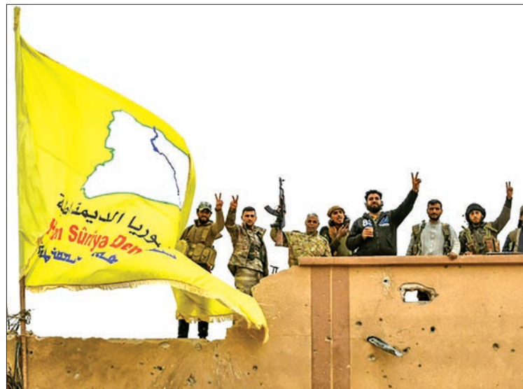
Syrian Kurdish fighters raise their flag in March after overrunning the last vestige of the Islamic State group's "caliphate" in a US-backed offensive they had hoped would earn them Western support for their dreams of self-rule.

The withdrawal by their erstwhile ally left the Kurds completely in the lurch, forcing them to turn to the Damascus regime for protection from an expanded Turkish assault.—AFP ■