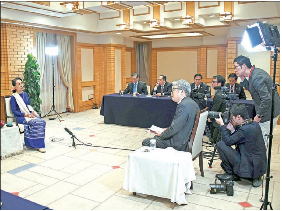
State Counsellor Daw Aung San Suu Kyi, left, interviewed by Nikkei Asian Review's correspondent at The Imperial Hotel in Tokyo, yesterday.