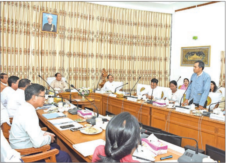
Union Minister Dr Myint Htwe attends the second meeting of National Committee for Combating Antimicrobial Resistance in Nay Pyi Taw.

THE National Committee for Combating Antimicrobial Resistance held its second meeting at the Ministry of Health and Sports in Nay Pyi Taw on 22 October.