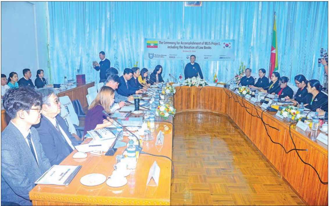
Union Attorney-General U Tun Tun Oo addresses the ceremony for accomplishment of Myanmar Law Information System (MLIS) project in Nay Pyi Taw yesterday.

Sang Su, the Director General of MOLEG presented three sets of law books for 2,788 Subordinate Legislation of Union Laws.