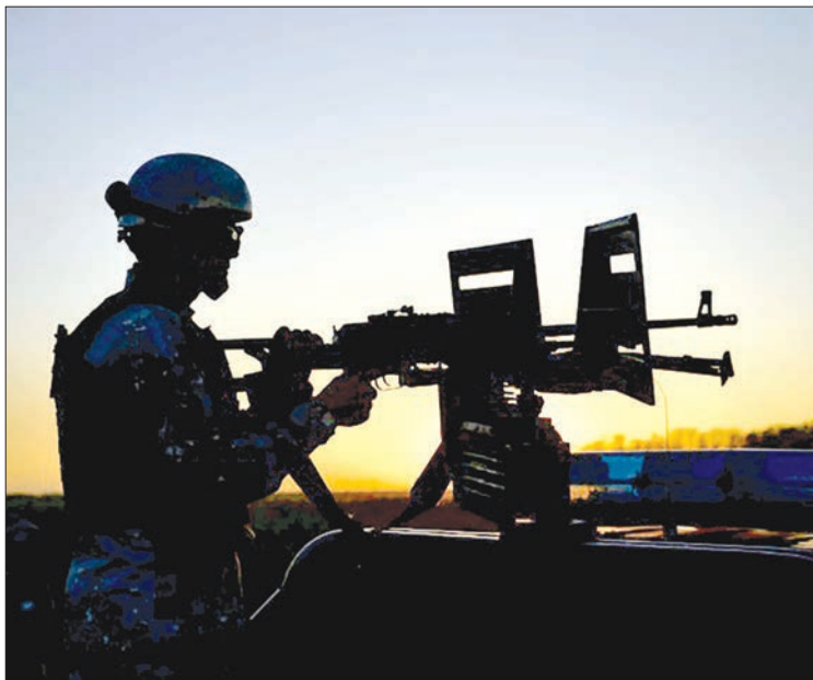
The conference in China is the latest in a number of negotiations seeking to end the conflict in Afghanistan.

The Taliban have steadfastly refused to talk to the Afghan government, and Shaheen said any attendance by Afghan officials in Beijing would be on the understanding they were representing only themselves.—AFP ■