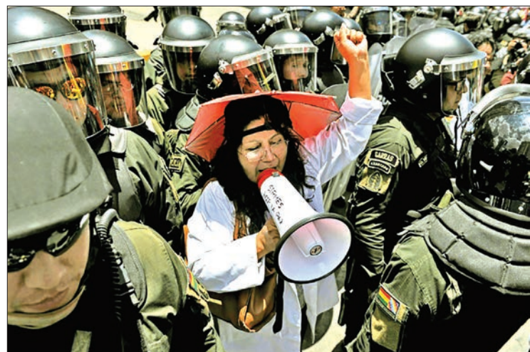
Opposition supporters reacted with fury on Monday to delayed results that showed Morales, Latin America's longest-serving president, edging towards the 10 percentage-point margin.

The government on Tuesday asked the OAS to conduct an audit of the vote counting process as soon as possible.—AFP ■