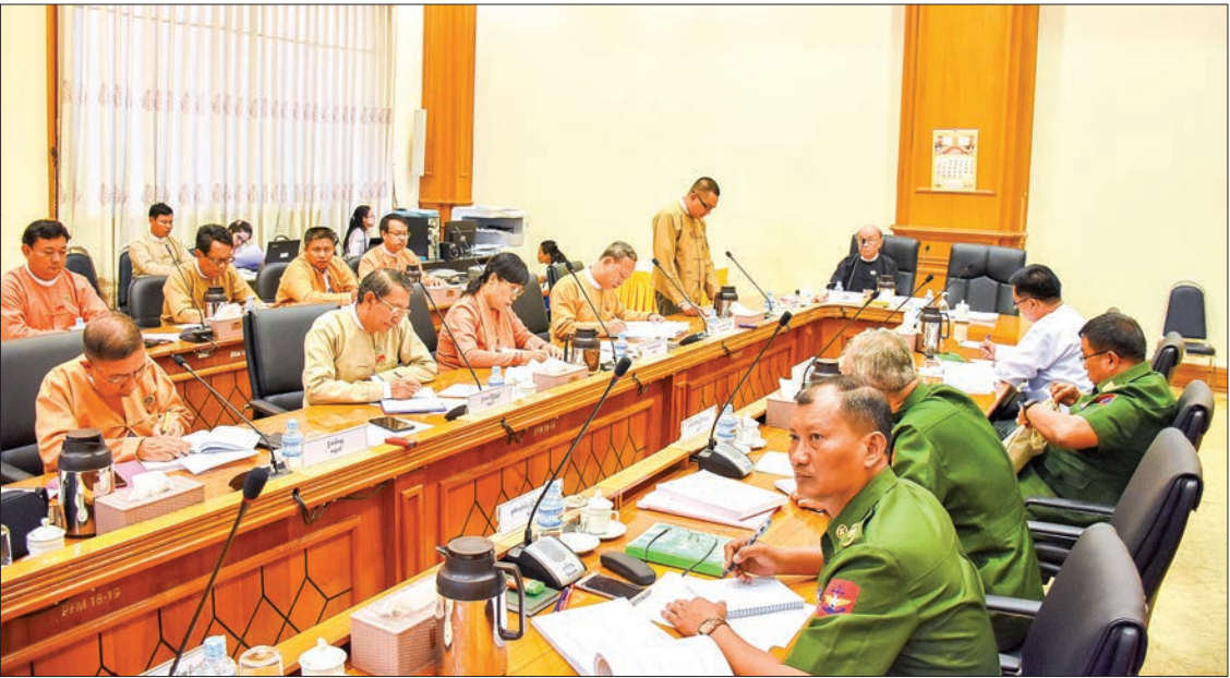
Meeting 47/2019 of the Joint Committee on Amending the 2008 Constitution held in progress in Nay Pyi Taw yesterday.