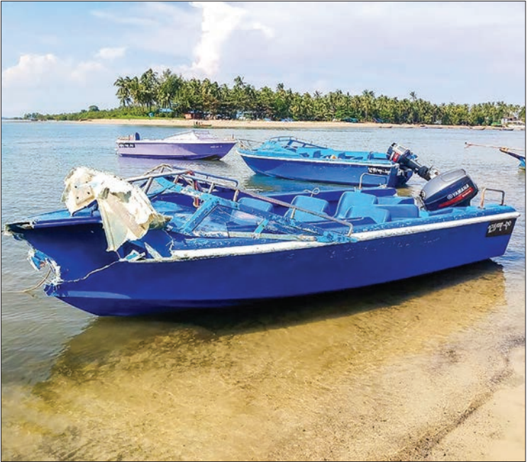
The damaged boat is seen stranded ashore after collision with a fishing vessel.