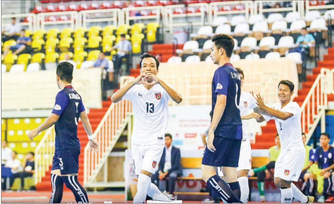
Myanmar futsal player (white) celebrates after scoring the goal against Cambodia at the Phu Tho Indoor Stadium in Ho Chi Minh City, Viet Nam.

THE Myanmar national futsal team has moved closer to entering the semifinals after drubbing Cambodia by 13-3 yesterday, the second day of the AFF HD Bank Futsal Championship 2019, at the Phu Tho Indoor Stadium in Ho Chi Minh City, Viet Nam.