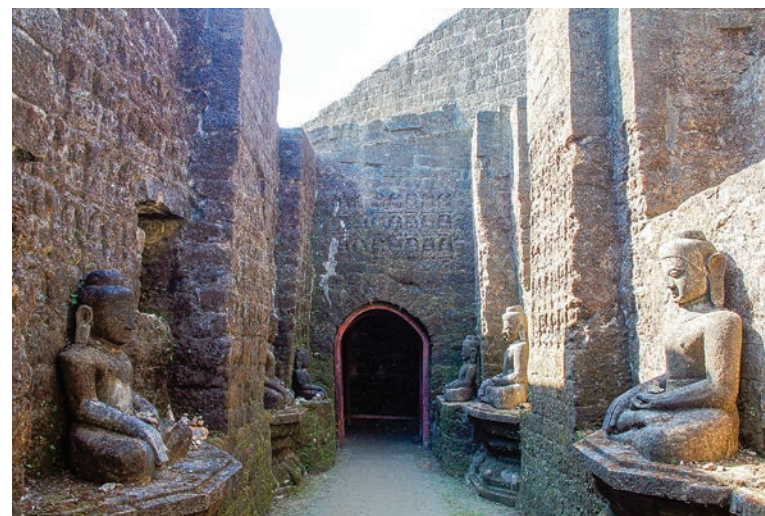
Located in the beautiful hilly landscape, hundreds of ancient temples and pagodas, many of which are well-preserved remain of the powerful empire that once flourished in Mrauk U.