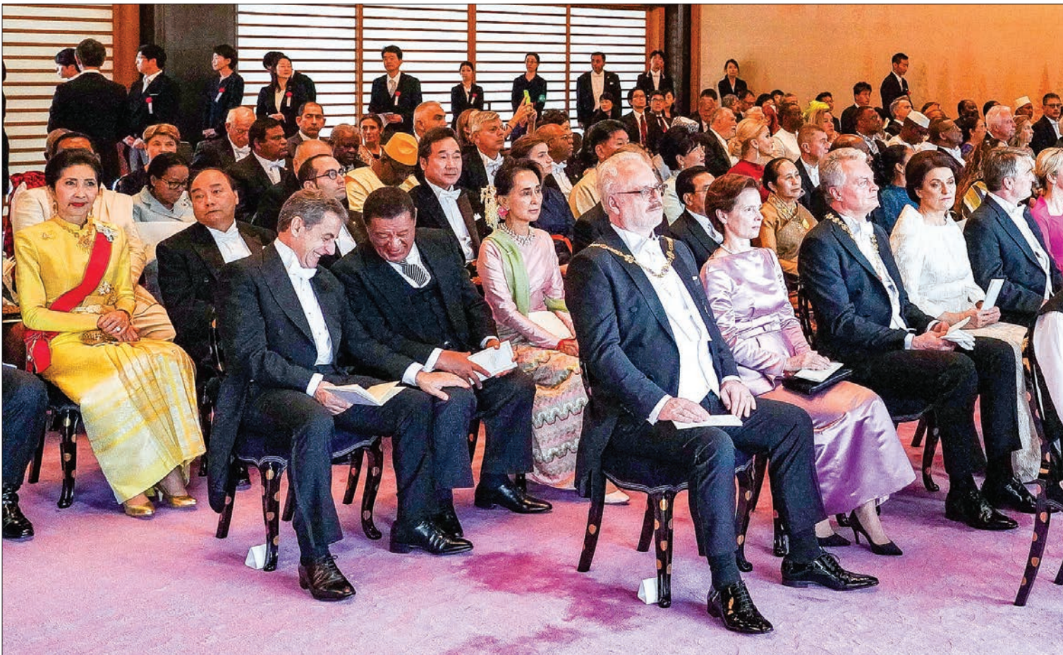
State Counsellor Daw Aung San Suu Kyi attends Japanese Emperor Naruhito's enthronement ceremony at the Imperial Palace in Tokyo yesterday.