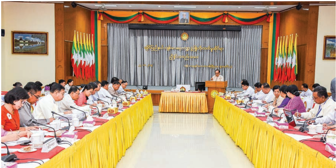
Union Minister Dr Myint Htwe delivers the speech at the coordination meeting for the development of health sector in Rakhine State yesterday.

THE Ministry of Health and Sports organized a coordination meeting for health sector development in Rakhine State yesterday morning. Union Minister Dr Myint Htwe presided over the meeting and said to make appropriate plans for the development of health in Rakhine State by re- viewing the needs and situations in skills, social, administration and management in cooperating with relevant departments and ministries.