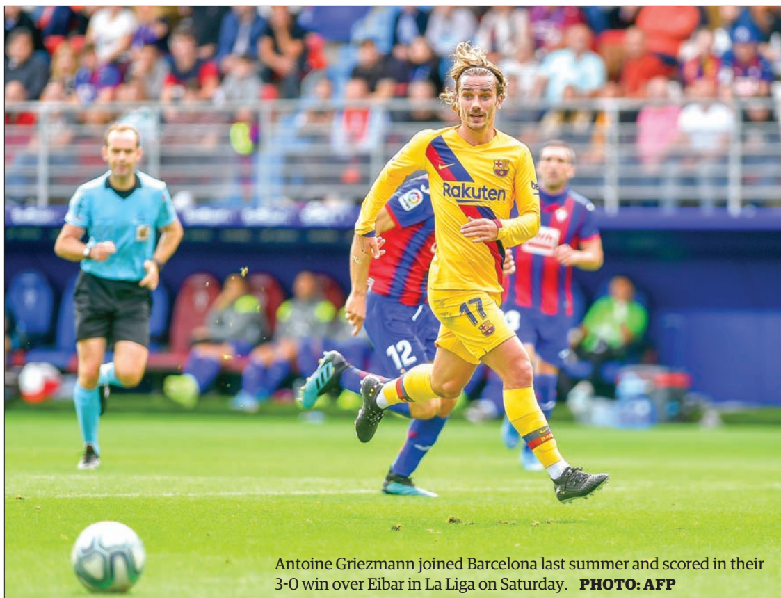
Antoine Griezmann joined Barcelona last summer and scored in their 3-0 win over Eibar in La Liga on Saturday.

The agreement allows Barcelona to match or exceed any offers for those players whenever the player wants to leave, Atletico agree to sell