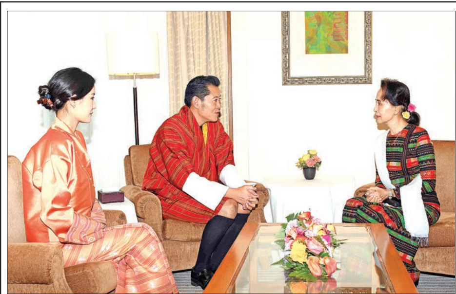
State Counsellor Daw Aung San Suu Kyi meets with King of Bhutan Jigme Khesar Namgyel Wangchuck at the Imperial Hotel in Tokyo yesterday. (NEWS ON PAGE -1)