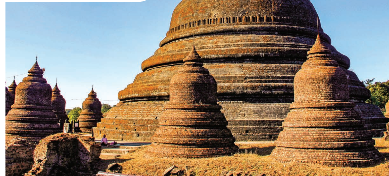
Mrauk U is located between the Kaladan and Lay Myo rivers in Rakhine State in the Western part of Myanmar. Over a period of more than 350 years countless temples and pagodas were built there.