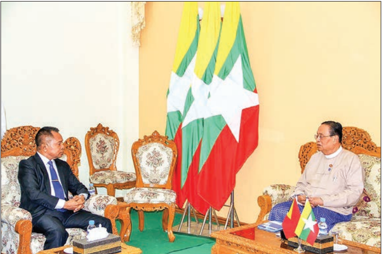
Union Minister U Win Khaing meets with Ambassador of Timor-Leste Mr Joao Freitas de Camara at the Ministry of Electricity and Energy yesterday.

energy sector, experience of gradually privatizing state own enterprises, opportunities and challenges in onshore and offshore oil and gas exploration and production works, power generation status from renewable energy according to Generation Mix and investment status of infrastructures in natural gas and electricity sector were discussed. — MNA ■ (Translated by Zaw Min)