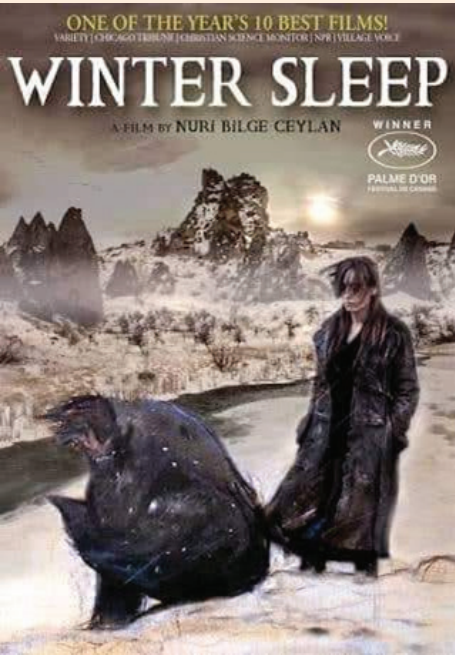
The film also won the Palme d'Or award at the 2014 Cannes Film Festival.