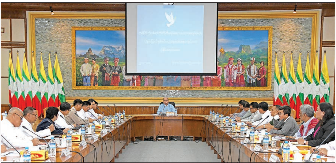
Deputy Minister for State Counsellor Office U Khin Maung Tin discusses preparations for holding Anniversary of Nationwide Ceasefire Agreement in Nay Pyi Taw yesterday.

Convention Center I and the third event was held at the Shwe San Eain Hotel with the participation of 10+10 ethnic armed group leaders of ceasefire signatories. The upcoming anniversary will take place at MICC II together with an official dinner on 28 October. A meeting between government representatives and members of the Peace Process Working Team (PPWT) formed by the Peace Process Supervisory Team (PPST) was held at the NRPC in Nay Pyi Taw on 21 October to prepare for holding the upcoming anniversary which will be attended by senior government officials, Union level organizations, Union Ministers, Chief Ministers and their cabinet members, former senior officials in the peace process, peace negotiators, and leaders of ethnic armed groups. Deputy Minister U Khin