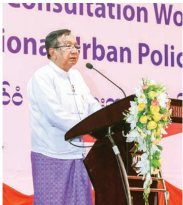
Union Minister U Han Zaw delivers the speech at the Consultation Workshop on National Urban Policy in Myanmar in Nay Pyi Taw yesterday.