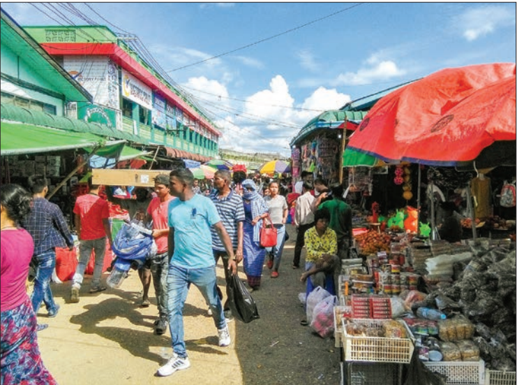
Local People enjoy shopping at the Nanphalon market near Myanmar-India border in Tamu Township, Sagaing Region.