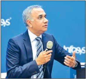
The company said CEO Salil Parekh has been recused from the investigation to ensure its independence.

NEW DELHI — Shares in Indian IT giant Infosys slumped more than 14 percent on Tuesday as the firm launched a probe into whistleblower complaints