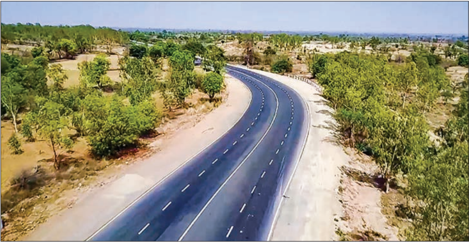
Sagaing-Monywa and Ohn Taw-Shwebo Roads are upgraded with BOT system.

by the Ministry of Construction, the road between Sagaing and Monywa had a width of only 18 feet and that between Ohn Taw and Shwebo measured 12 feet. At the time, it took two-and-a-half to three hours to travel between Sagaing and Monywa and over 2 hours from Ohn Taw to Shwebo. The roads were too narrow and therefore, dangerous for traveling. We widened the Sagaing-Monywa road to 24 feet in 2008, and we upgraded the Ohn Taw-Shwebo road and