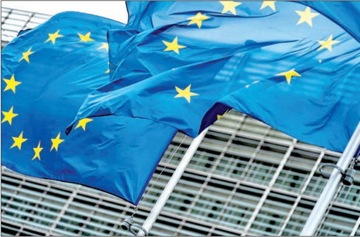
Both France and Italy are promising deficits that meet EU rules – but Brussels has concerns over their spending plans.

“Italy’s plan does not comply with the debt reduction benchmark in 2020,” said a letter signed by EU economics affairs