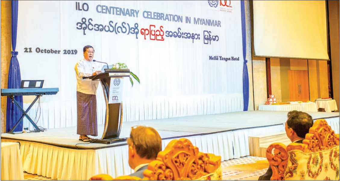
Union Minister of Labour, Immigration and Population U Thein Swe delivers speech at the event.

Of the Sustainable Development Goals (SDGs) established by United Nations (UN), goal 8 of "Promote sustained, inclusive and sustainable economic growth, full and productive employment and decent work for all" is an important goal for workers. Goal 1 of "End extreme poverty in all forms by 2030," goal 2 of "End hunger; achieve food security and improved nutrition and promote