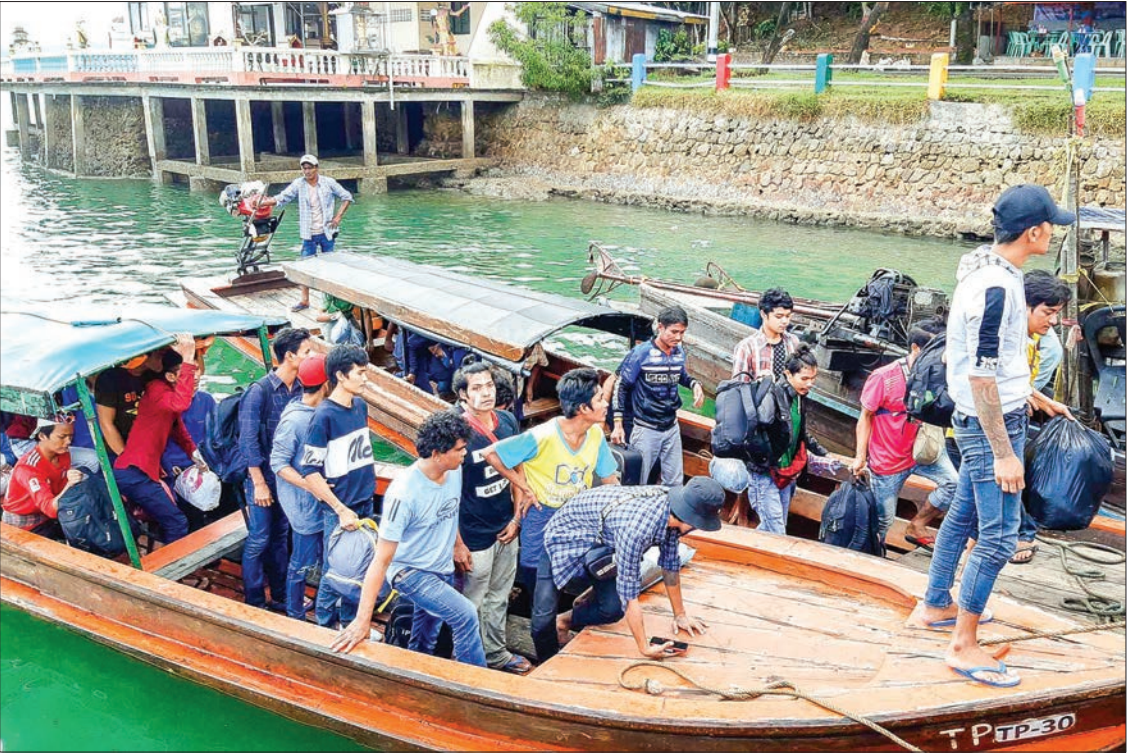
Myanmar migrant workers arriving back home from Thailand.

A total of 102 migrant workers were repatriated to Myanmar from Thailand on the evening of 22 October. The migrants — 90 men, 10 women, and 2 children — were escorted to the Kawthoung border gate by officials from Thailand’s Ranong Immigration Department. The migrant workers were expelled by Thai authorities as their visas had expired and they did not have proper documentation, according to the Ranong Immigration Department. Officials from the General Administration Department, the Labour, Immigration and Population Department, the Anti-Trafficking Police, the Labour Department, and the Natural Disaster Department welcomed the workers and