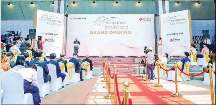
The Central Boulevard Grand Opening ceremony in progress.

"Myanmar's first retail walking street The Central Boulevard is another indication that Marga Landmark was construction the The Central project as the best and highest standard multi-function project not only in Myanmar but also in the Southeast Asia