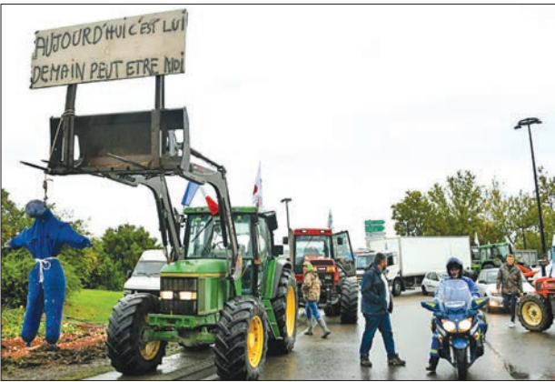
A tractor with a hanged effigy of a farmer under a sign saying “Today it’s him, tomorrow it might be me,” during a protest by farmers in Nîmes, southern France, on Tuesday.

PARIS — Hundreds of farmers rolled out tractors to stage protests at government offices across France on Tuesday, railing against measures they say are crimping revenues and contributing to a spike in