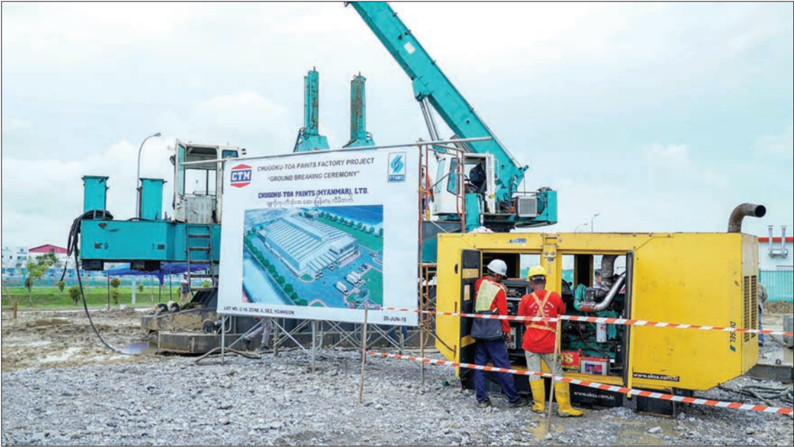
The construction site of TCP's future factory in Thilawa Special Economic Zone.