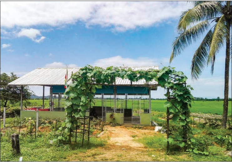
Agriculture training and service centre of Myeik Township Agriculture Department.

extraction, coffee, vegetable and flower plantation,” said Daw Thandar Myint, an official from the Township Agriculture department. There are ten townships in Taninthayi Region, and the service center will be launched in Myeik Township in the second week of November, according to U Win Myat Soe, the head of the Township Agriculture Department. According to data from the department, there are 42,493 acres of paddy fields, 155 acres of pepper plantations, 693 acres of vegetable farms, 87 acres of corn farms, 87 acres of sweet potato, 37,013 acres of rubber, and 5,912 acres of oil palm plantations in 161 villages in 22 village-tracts in Myeik Township.—Myint Oo (Myeik) (Translated by La Wonn)