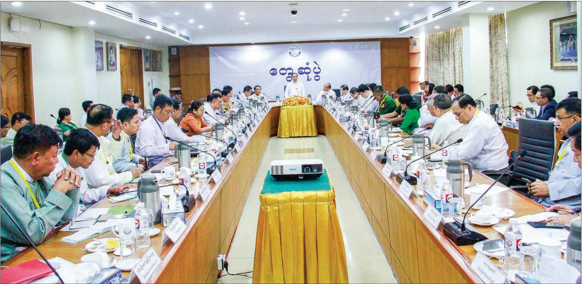
Vice President U Myint Swe addresses the 30 th regular meeting between businesspersons and Private Sector Development Committee.