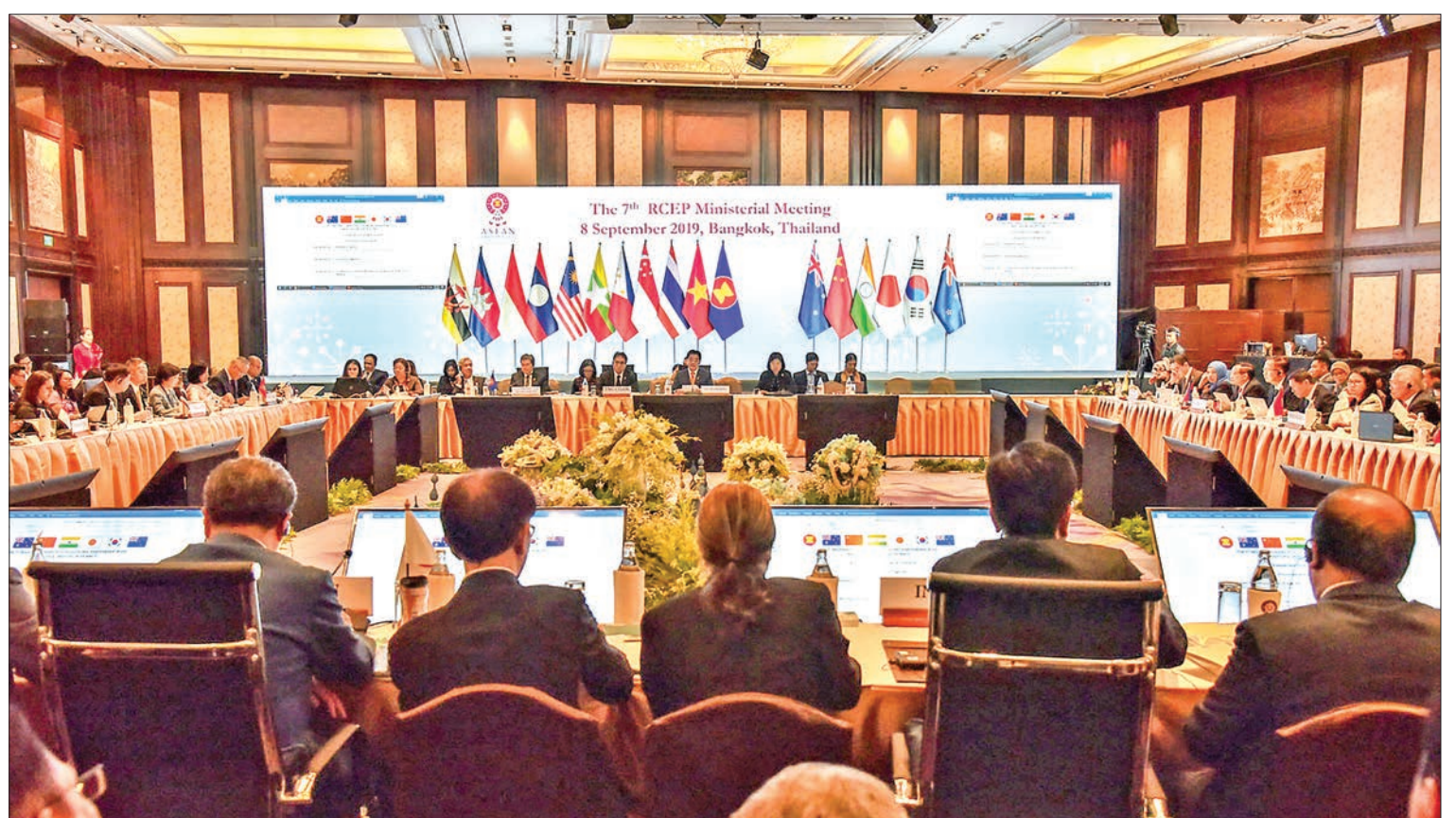
7 th RCEP Ministerial Meeting in progress.

Because it was in a group of countries that were less de-