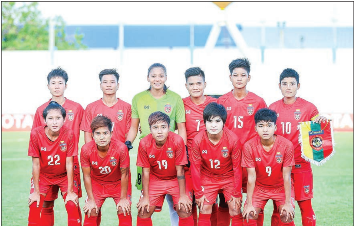
The Myanmar national women's football team pose for a group photo on 18 August, before an international match against the Cambodian team.

"We will first play a group match with the host Philippines team, and the match will be a decisive match for my team to enter the next stage. We are hoping to reach the final match. If we reach the semifinal, we will have five days for preparation, and that will be enough time for our team, and it is good," the head coach added.