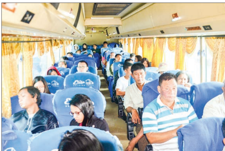
Passengers aboard the express bus after enjoying their Thadingyut holiday.