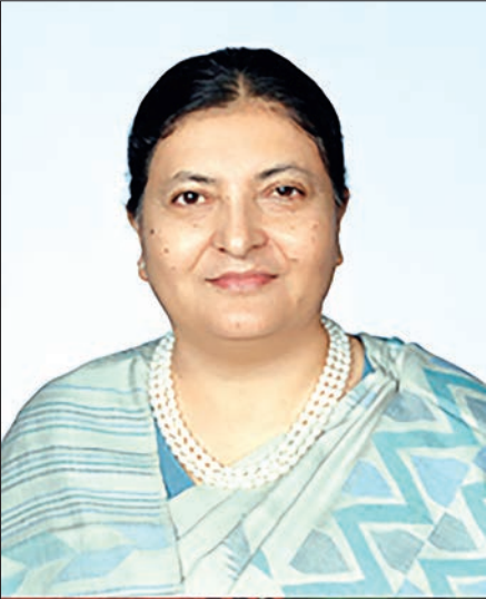
Mrs. Bidya Devi Bhandari

She served as the Chairperson of All Nepal Women Association from 1997 to 2015, as the Vice-Chairperson of the Central Committee of Communist Party of Nepal (United Marxist-Leninist) from 2007 to 2015 for two consecutive terms, as the member of the Central Committee of Communist Party of Nepal (United Marxist-Leninist) from 1997 to 2007.