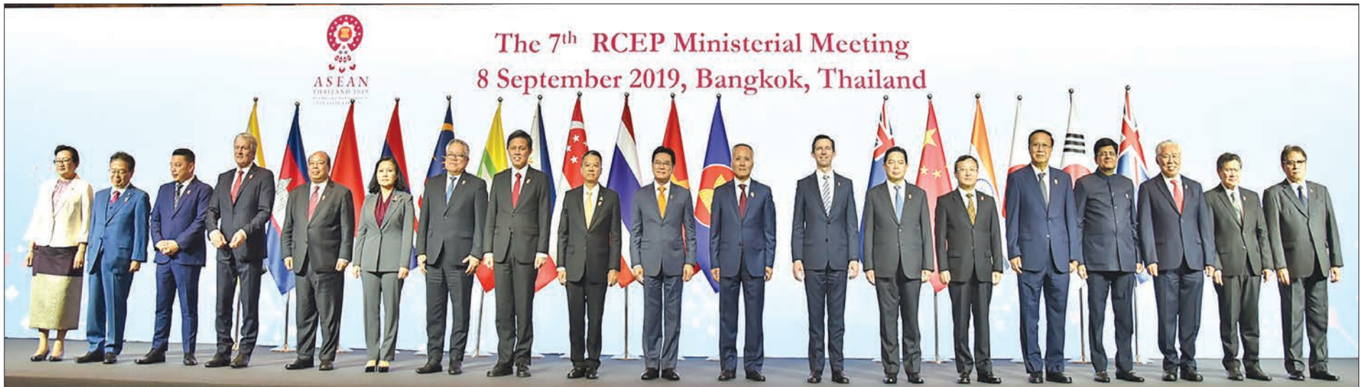
The Ministers from the 16 RCEP Participating Countries (RPCs) gathered in Bangkok on 8 September 2019 for the 7th RCEP Ministerial Meeting to review developments in the RCEP negotiations since the Ministers last met in Beijing on 2-3 August 2019. The Meeting was chaired by H E Jurin Laksanawisit, Deputy Prime Minister and Minister of Commerce of Thailand.