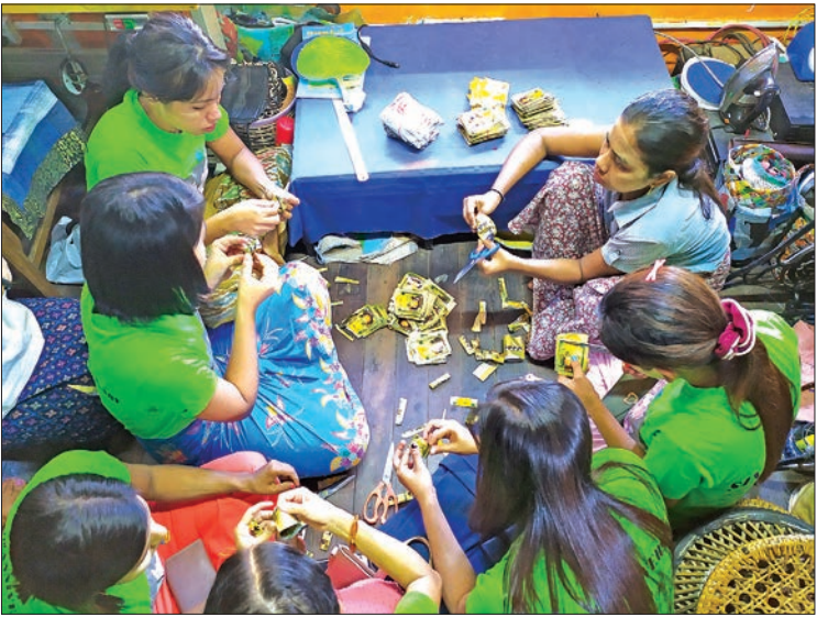
Trainees make household goods from waste materials in Kyut Kyut center in Dala Township. cups by using coffee bags, tires, plastic bags, empty bottles and umbrellas. There are 12 women trainees this period. The training course was provided by Kyut Kyut project, in cooperation with Share Mercy Social Organization. — Myint Maung (Translated by Hay Mar)

Kyut Center. Kyut Kyut Center is operating with the support of Italy. The centre was officially founded in 2014 and has already provided 30 training courses to manufacture household items from waste materials. The current training will be conducted from 15 October to 3 December. Similar training courses have been opened in Chin, Rakhine, Kayar and Shan States. The training courses include making household items, such as bags, boxes and