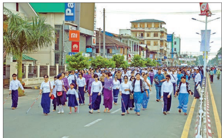
People participate in mass walk event to mark International White Cane Day 2019 in Myitkyina in Kachin State on 15 October.