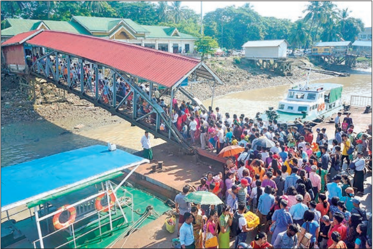
Passengers get off a ferry at the Dala Jetty in Botahtaung Township, Yangon. Yangon is packed with daily commuters and is earning revenues through fares collected on the Yangon-Dala ferry service.