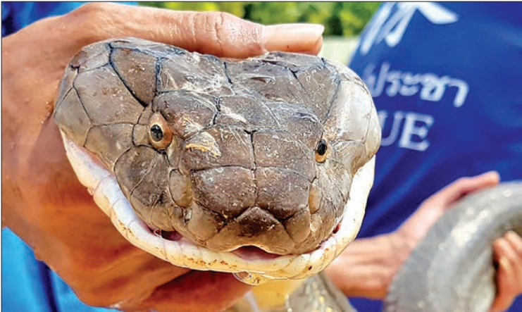
A Krabi Pitakpracha Foundation snake handler holds the four-metre (13 feet) king cobra he pulled from a sewer in southern Thailand.

Kritkamon said the snake was more than four metres long, weighed 15 kilos (33 pounds), and was the third-largest they had