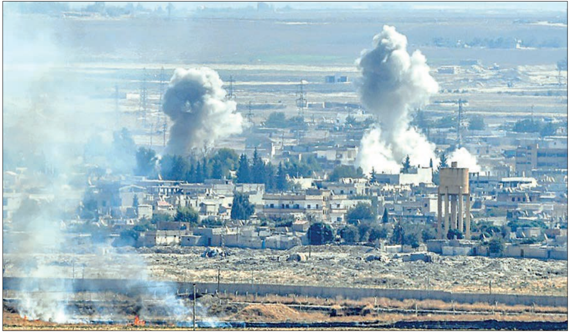
The ethnically divided Kurdish-held border town of Ras al-Ain is one of the key targets of Turkey’s nearly week-old invasion and has come under heavy bombardment.

Aid groups, which have warned of a new humanitarian disaster in Syria’s eight-year-old war, have been forced to pull out of the conflict zone, Kurdish