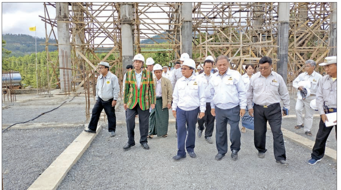
Union Minister U Han Zaw and officials inspect the buildings under construction in Chin State yesterday.

UNION Minister for Construction U Han Zaw, accompanied by Chin State' Chief Minister U Salai Lian Lwal, looked into the constructions and developments of roads, bridges and state-owned buildings in Chin State on 15 October.