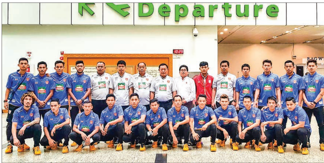
Myanmar futsal team seen off by officials from Myanmar Football Federation at Yangon International Airport yesterday.

THE Myanmar national futsal team left for Ho Chi Minh City yesterday to compete in the ASEAN Football Federation (AFF) Futsal Championship 2019, which will be held in Ho Chi Minh City, Viet Nam, from 21 to 27 October, according to the Myanmar Football Federation.