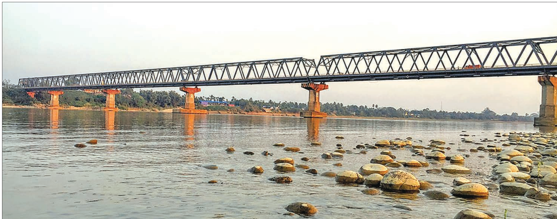
Balaminhhtin Bridge No.1 in Myitkyina, Kachin State.

FEASIBILITY study on constructing Balaminhhtin Bridge No. 2 had begun, according to Kachin State based Special Bridge-Group 1 of the Department of Bridge.