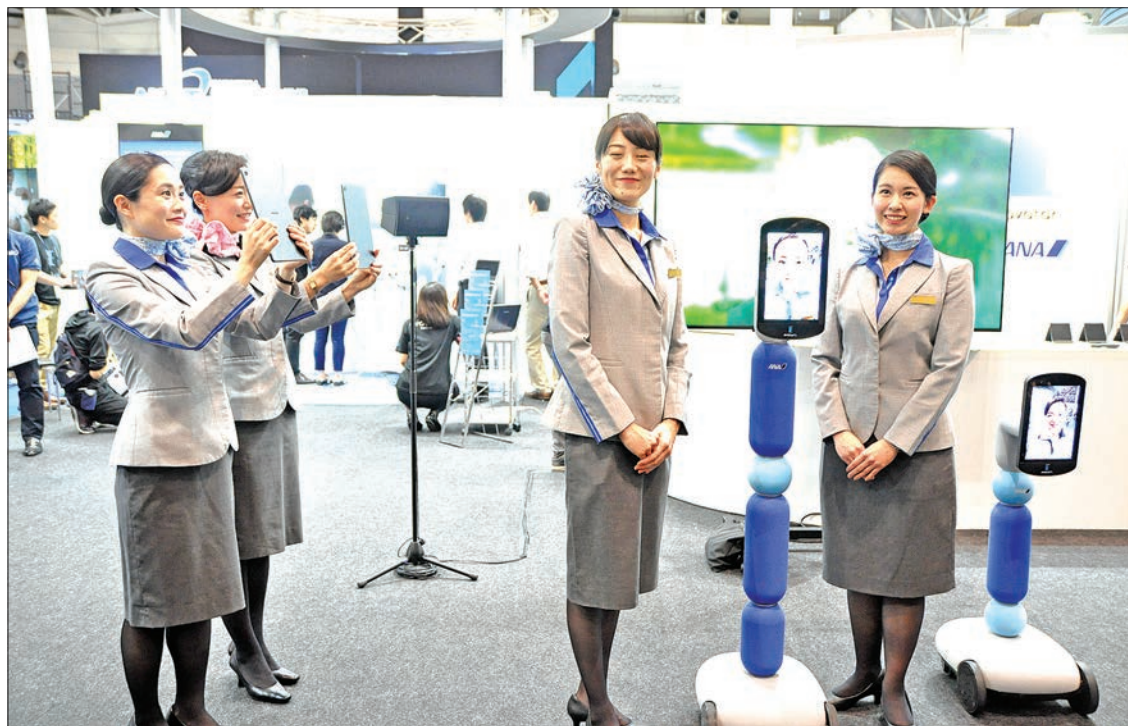
ANA Holdings Inc. shows a demonstration of ANA cabin attendants remotely controlling stick-shaped robots, with the attendant’s face shown on a tablet computer attached to it on 14 October 2019 at the Makuhari Messe convention center in Chiba.