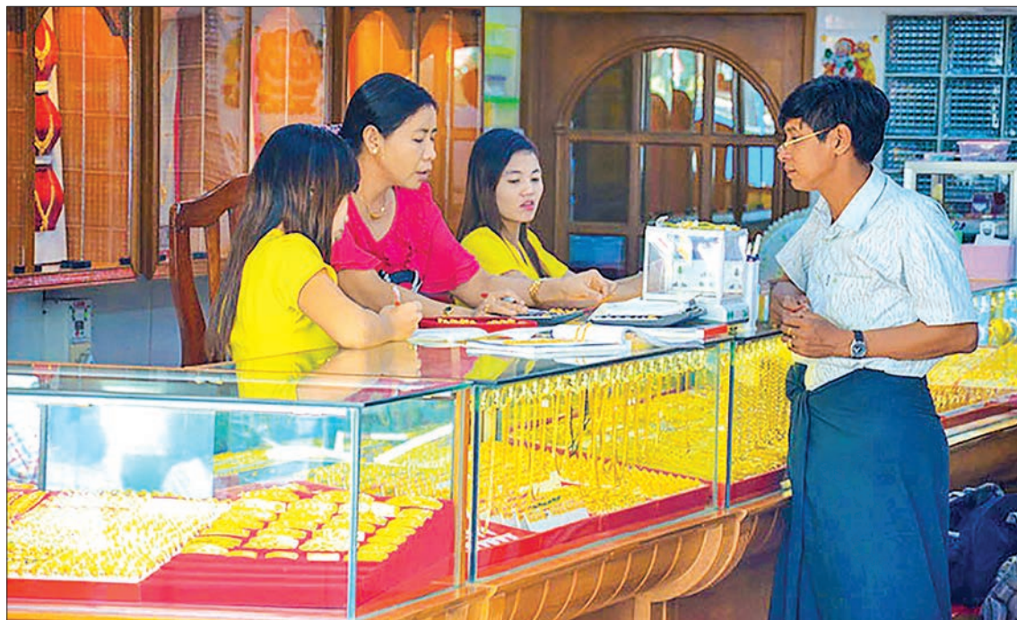
A man negotiates the price of gold jewellery at a gold jewellery shop in Yangon.

According to gold traders, the lowest price for gold in June was K1,099,000 (1 May) and the