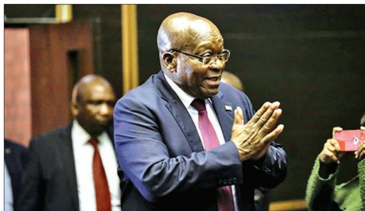
Zuma, pictured in court on Tuesday, filed a last-minute appeal against corruption charges.

“Mr Zuma would like to exercise the full extent of his constitutional rights, which includes the right to appeal,”