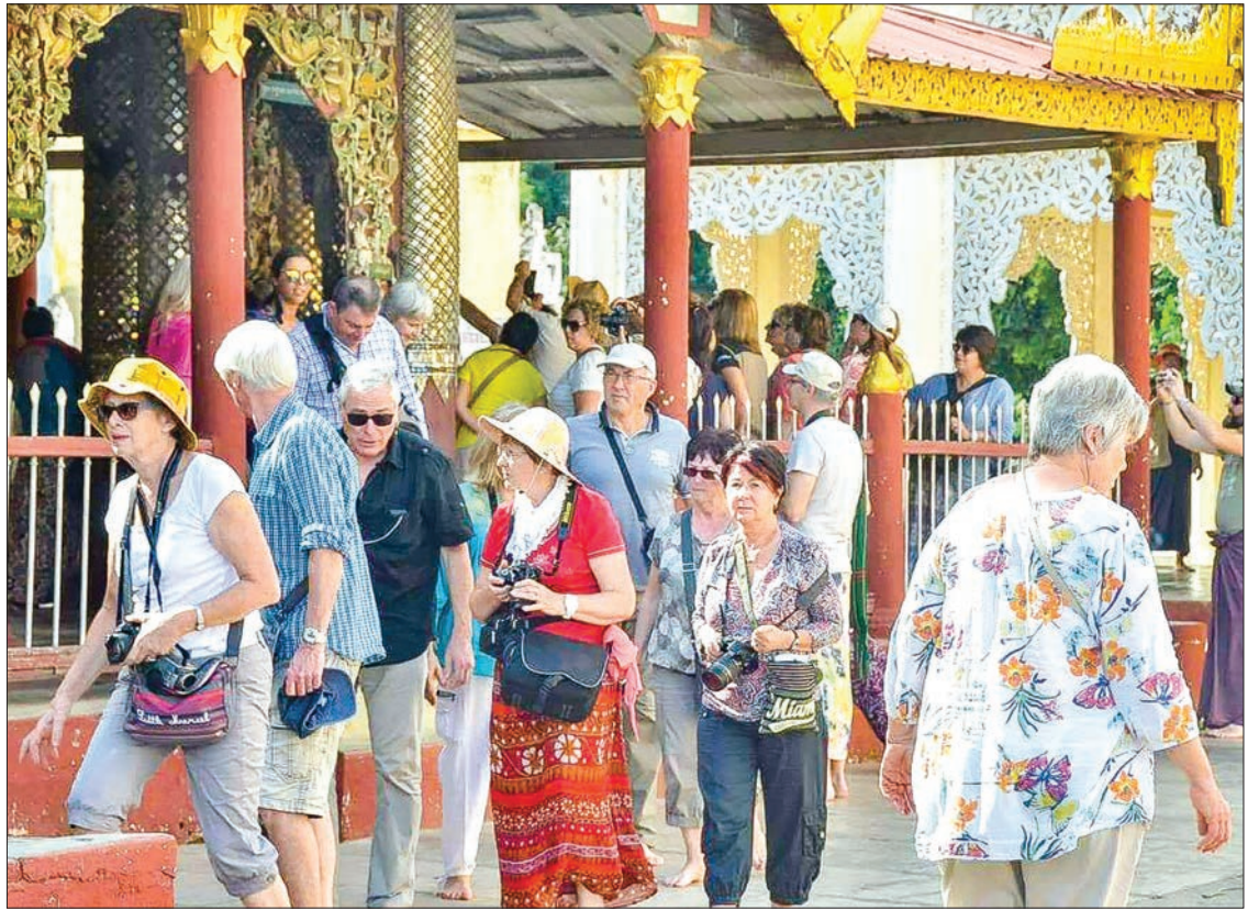
Foreign tourists tour the Shwedagon Pagoda in Yangon.