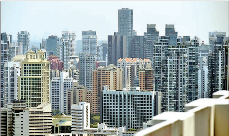
The unrest in Hong Kong has forced many property investors to focus on Southeast Asian markets like Singapore.

KUALA LUMPUR—From luxury Singapore apartments to Malaysian sea-front condos, Hong Kong investors are shifting cash into Southeast Asian property, demoralised by increasingly violent protests as well as the China-US trade war. Millions have taken to the streets during four months of pro-democracy demonstrations in the southern Chinese city, hammering tourism while also forcing businesses to lay off staff – and the property sector is feeling the pain. Property stocks in one of the world’s most expensive housing markets have plummeted since June, with developers being forced to offer discounts on new projects and cutting office rents. Hong Kong businessman Peter Ng bought a condominium on the Malaysian island of Penang – which has a substantial ethnic Chinese population and is popular among Hong Kongers --