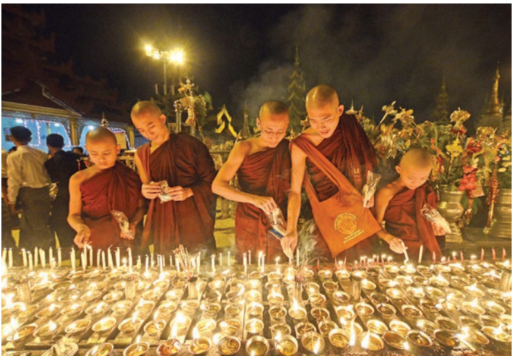
Monks and novices light candles on the night of the Thadingyut Full Moon at the Shwedagon Pagoda yesterday.

in Mandalay. Wards of the city also offered lights to their respective pagodas in preserving the age-old tradition. Three pagodas, Kyauktaw, Sadamuni and Kuthodaw, at the foot of Mandalay Hills held the pagoda festival. There were free entertainment shows and over 100 booths to go shopping. The festival is crowded with visitors till late at night.—Min Htet Aung (Sub-printing House) (Translated by TMT)