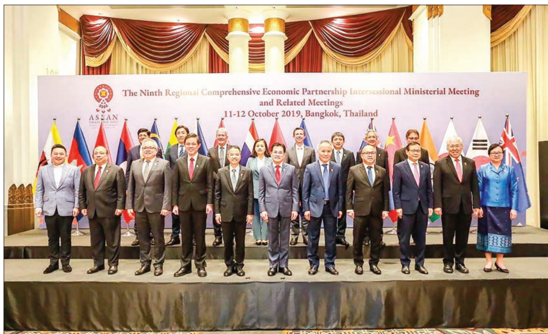
Union Minister U Thaung Tun poses for a photo with ministers from other countries at the 9 th Regional Comprehensive Economic Partnership (RCEP) Intersessional Ministerial Meeting and related meetings in Bangkok, Thailand.

The RCEP when concluded will be one of the largest trading blocs. It will cover a half of the world's populations, account for 40 percent of the global trade and around a third of the global GDP.— MNA