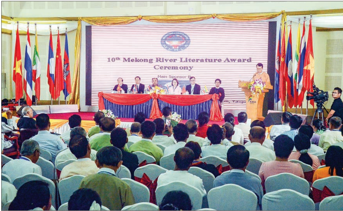
Chief Minister of Yangon Region U Phyo Min Thein delivers the opening speech at the 10 th Mekong Literature Award presentation ceremony in Yangon on 12 October.