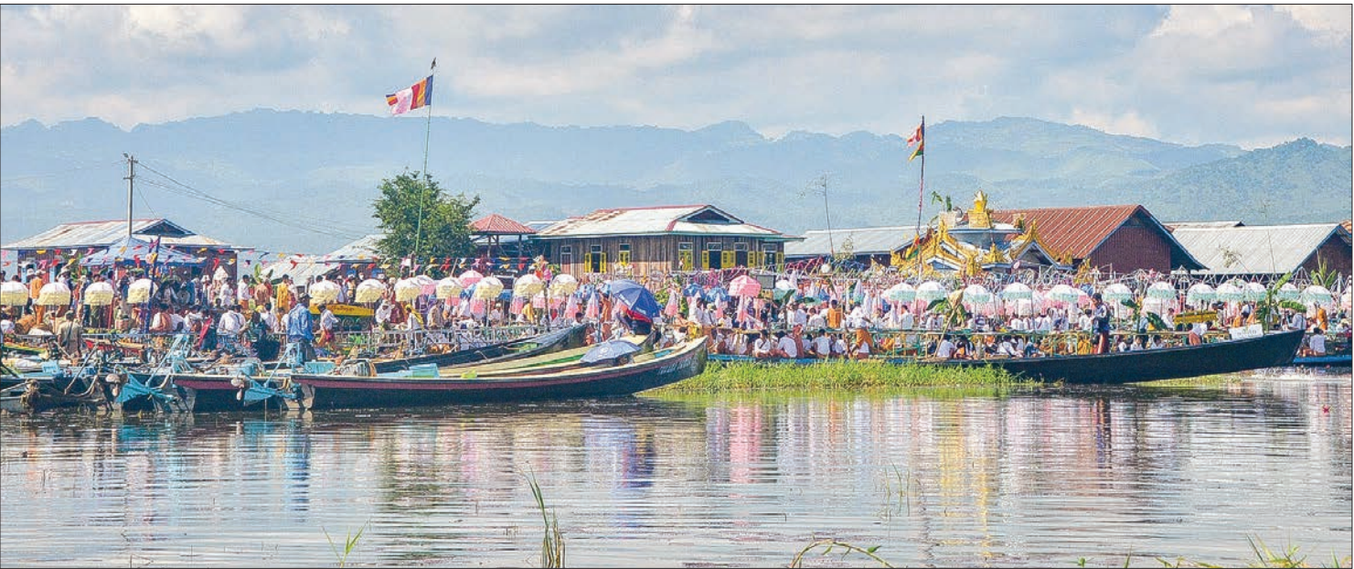
The procession of boats are seen as the Phaungdaw Oo Buddha Images are conveyed for public obeisance at the Inle Lake.

INLE Lake was crowded with holidaymakers on the Full Moon Day of Thadingyut yesterday, and souvenir shops have been recording high sales since Friday, the start of the five-day holiday. “Local visitors have bought mostly local textiles. Foreign visitors have mostly bought silverware,” said Ma