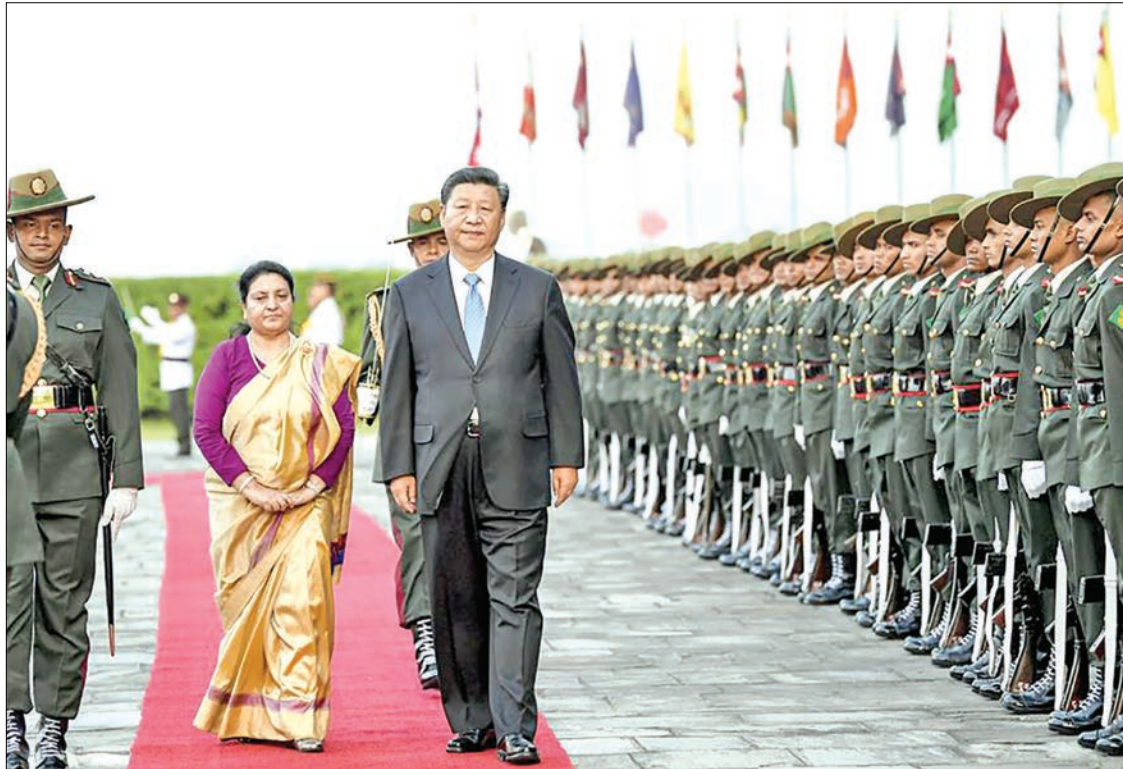
Chinese President Xi Jinping, accompanied by Nepali President Bidya Devi Bhandari, reviews the guard of honour during a welcome ceremony held at the airport in Kathmandu, Nepal, Oct. 12, 2019.