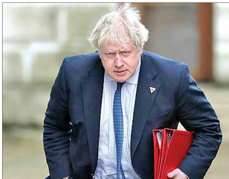
In this file photo taken on March 07, 2018 Britain's then Foreign Secretary Boris Johnson arrives in Downing Street in London.

Whether such a fudge suits both Brussels and the more ardent Brexit backers in parlia-