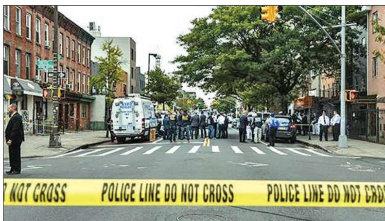
This image taken on October 12, 2019, shows Brooklyn's Utica Avenue in New York City.

The block where the building is situated was cordoned off by crime-scene tapes. Police and investigators could be seen walking in and out of the site. No arrests have been made and investigation is underway. —AFP ■