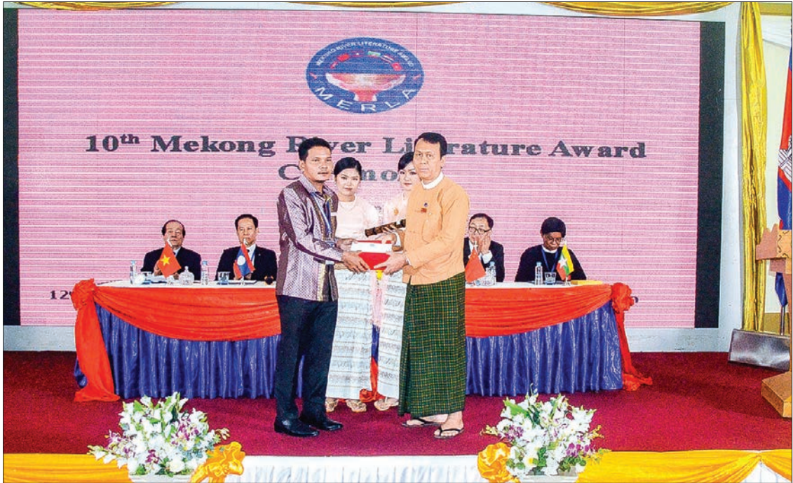
Yangon Region Chief Minister presents award to a writer at the 10 th Mekong Literature Award presentation ceremony in Yangon on 12 October.