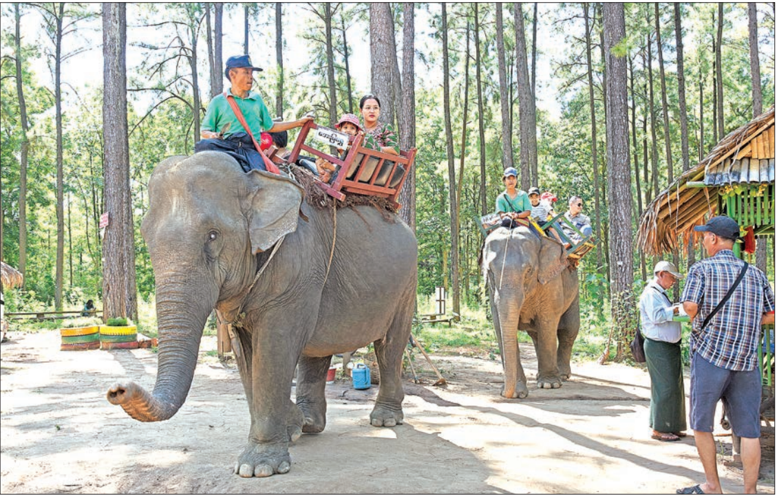
Visitors enjoy elephant ride at Ngalaik Sakanthar Elephant Camp.

THE Ngalaik Sakanthar Elephant Camp is situated in Nay Pyi Taw Council Area, and it is about 2 furlongs from the Milepost (217/0) of the Yangon-Mandalay Highway. It is located in the area of the Ngaleik Reserved Forest and near Ngaleik Dam.