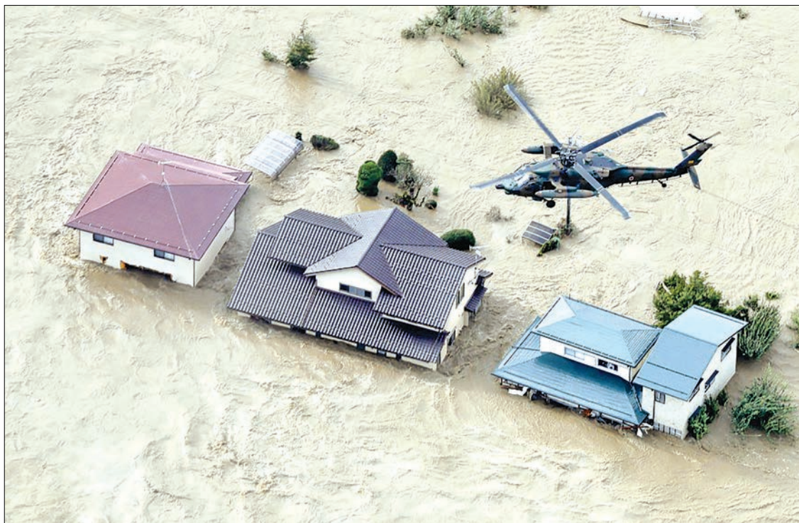
Photo taken from a Kyodo News helicopter on Oct. 13, 2019, shows houses in Nagano, central Japan, submerged after the Chikuma River overflowed due to Typhoon Hagibis.

Military and fire department helicopters winched survivors from roofs and balconies in several locations. In Iwaki City, Fukushima, a rescue went tragically awry when a woman died after falling while she was being winched to safety.—AFP ■