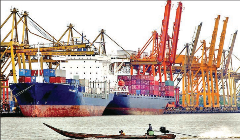
In this picture taken on August 15, 2002, a long-tail water taxi zips across Bangkok’s industrial and commercial port.

BANGKOK—Ministers from 16 countries negotiating for an Asia-wide trade pact met Saturday in Bangkok for another round of talks, with host Thailand characterizing the meeting as “very tough and serious.” A senior Thai trade official said that Singapore