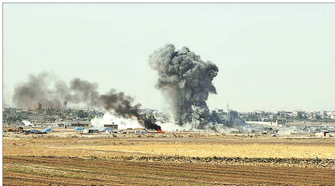
Smoke billows from the Syrian border town of Ras al-Ain on October 12, 2019, as Turkey and its allies continued their assault on Kurdish-held border towns in northeastern Syria.

GENEVA—Turkey's deadly assault on Kurdish positions in northeastern Syria has forced 130,000 people to flee their homes,