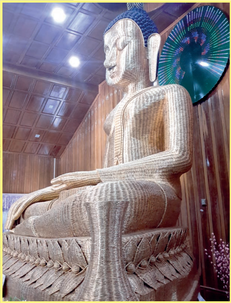
Cane Buddha statue in Nammilaung village.