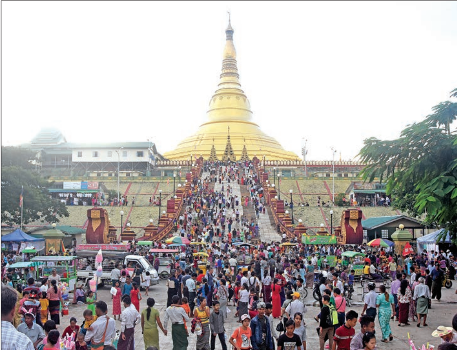
Buddhist devotees are seen at the Uppatasanti Pagoda on the Abhidhamma Day yesterday.