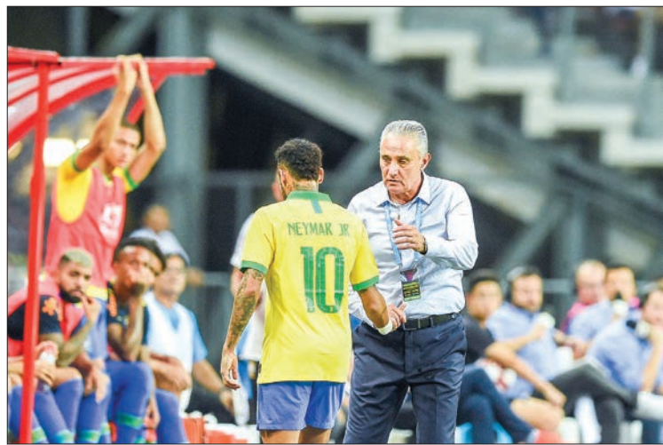
Brazil's forward Neymar (L) shakes hands with team coach Tite as he leaves the field during an international friendly football match between Brazil and Nigeria at the National Stadium in Singapore on 13 October 2019.

SINGAPORE (Singapore) — Neymar limped off injured early on as Brazil played out a 1-1 friendly draw against a spirited Nigeria at the Singapore National Stadium on Sunday.