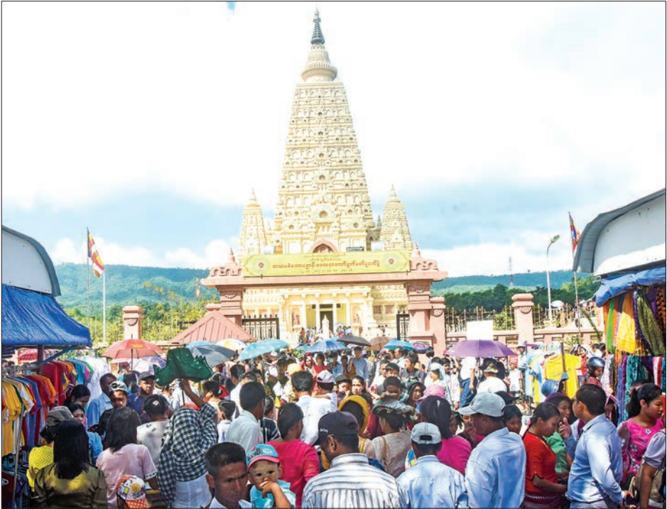
Buddhist devotees are seen at the Thatta Thattaha Maha Bodhi Pagoda on the Abhidhamma Day yesterday.