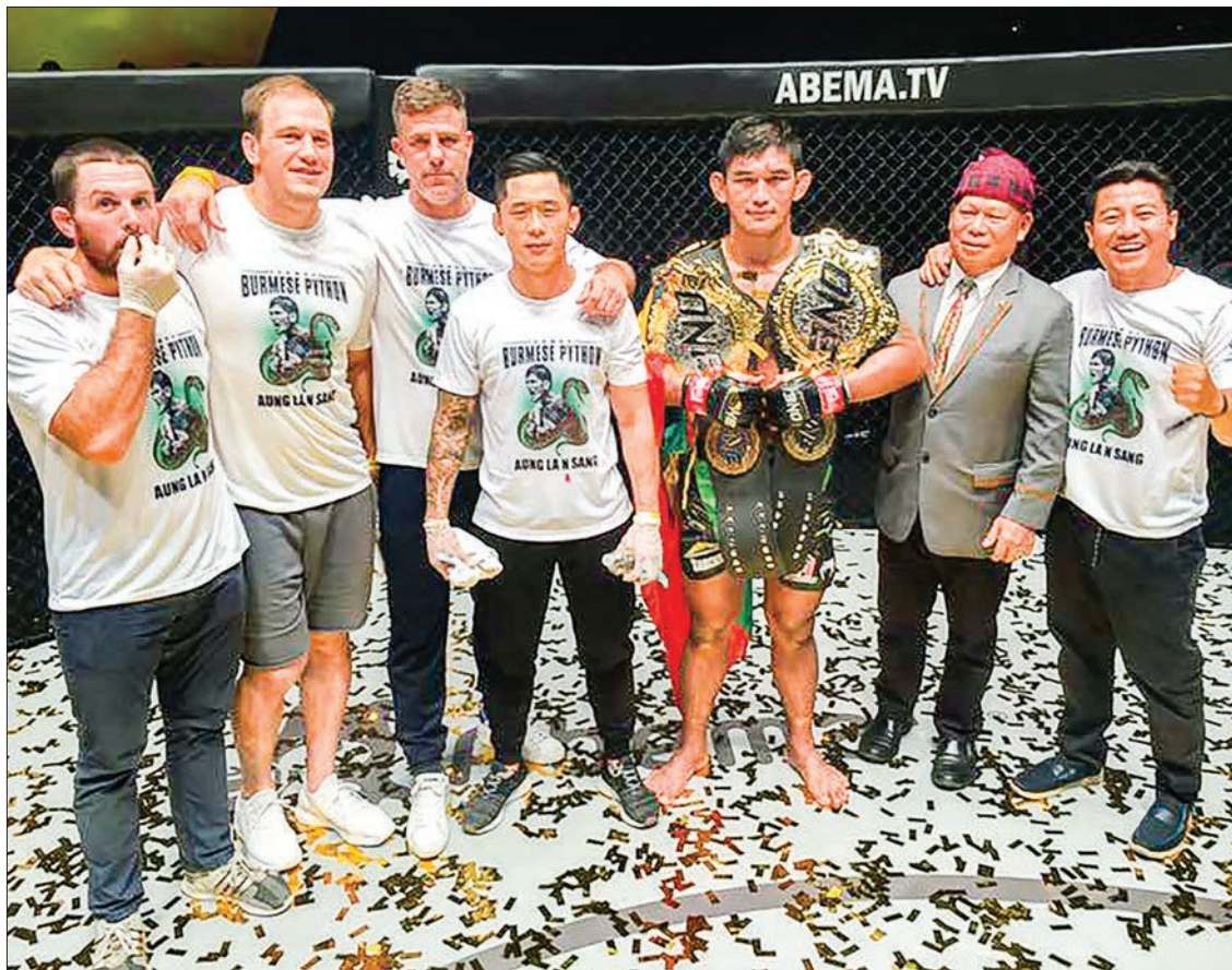
Aung La Nsang (3 rd R), his father (2 nd R) and his coach (3 rd L) pose for a photo at the 'ONE Championship: Century Part 2' event in Tokyo, Japan.