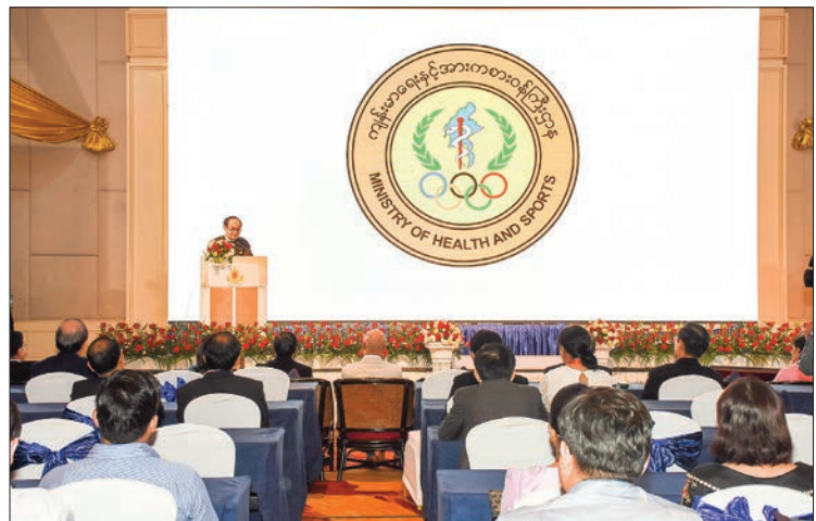
Union Minister Dr Myint Htwe addresses the fourth conference of Myanmar Nephro-Urology Society in Yangon.

THE Myanmar Nephro-Urology Society held its fourth conference at Sule Shangrila Hotel in Yangon on 12 and 13 October.