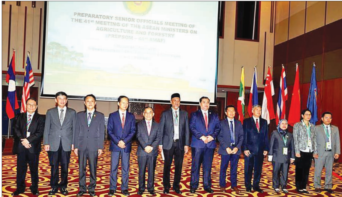
Brunei's Minister of Primary Resources and Tourism Haji Ali (5th L) poses for a group photo with officials from ASEAN countries during the Senior Officials' Meeting of the 41st Meeting of the ASEAN Ministers on Agriculture and Forestry, in Bandar Seri Begawan, capital of Brunei, on Oct. 12, 2019.

In his opening speech, Haji Ali said that cooperation under AMAF is important to Brunei. In addition to opening opportunities to develop the country's agriculture, fisheries and forestry sectors, the collaboration will also assist the country in pursuing its vision to further accelerate the growth of output in these sectors, which will contribute to