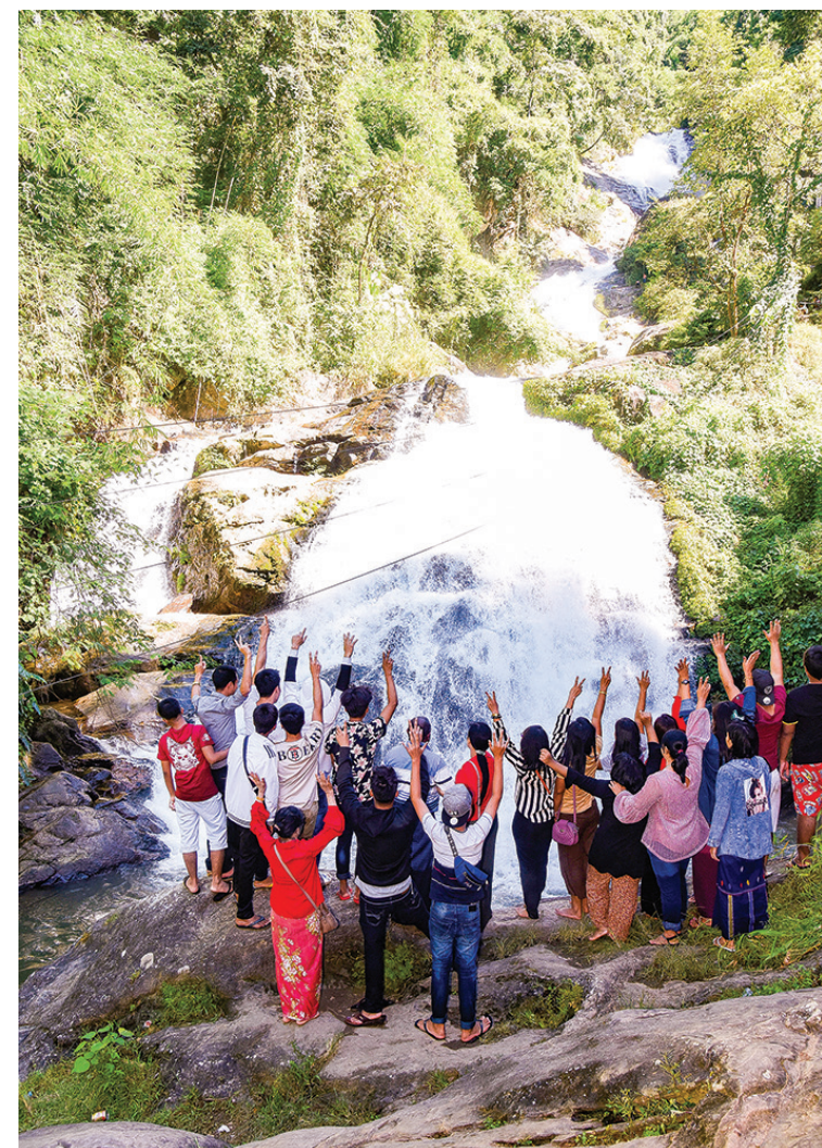
Visitors watch water falling from the Sadon Waterfall.

If compared with many other places of the country, the number of visitors to Sadon is still low. We still have many shortages in ensuring visitor convenience. Visitors can enjoy the falls in its natural position but we have no other facilities to make the place more attractive and enjoyable. We must make arrangements to protect the falls and its surrounding areas from causing any environmental damage. Thanks to the peace in the area, more vacationers are coming to the falls as the cascade and its surrounding area have the power to refresh the minds of visitors. I am so encouraged and pleased to hear positive response from visitors. I wish the government do more for the tourist industry of Kachin State. And I wish gov-