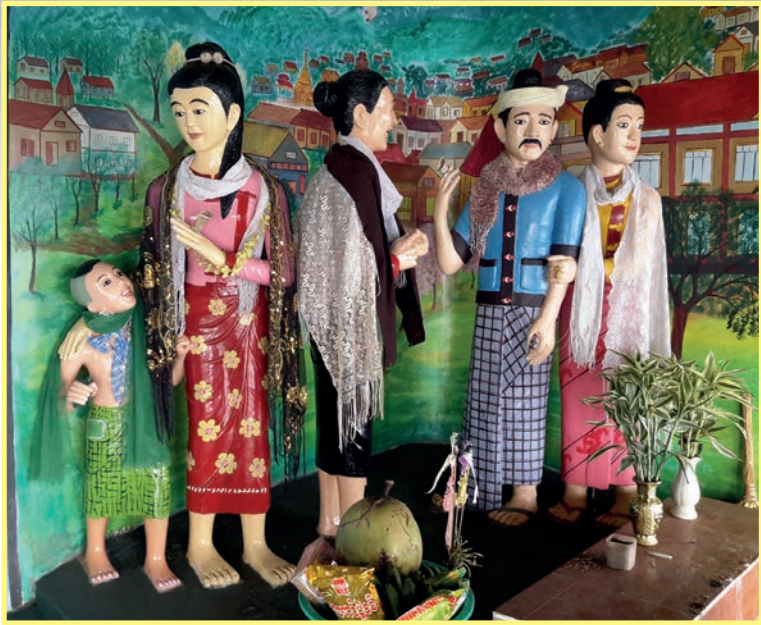
Statues at the Mote So Ma Pagoda.