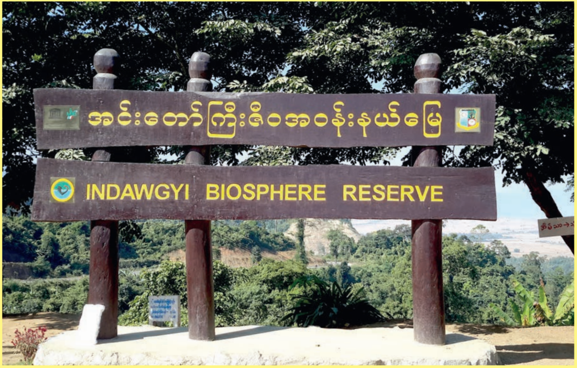
Indawgyi Biosphere Reserve.

Indawgyi region was surrounded by mountains rising up to 1,000 ft to more than 4,000 ft. 13 creeks flowing down from those mountains flow into Indawgyi. Although those creeks flow into Indawgyi from four directions, it was only through Mogaung creek that the water flows out from Indawgyi. Indawgyi was on an elevation of 546 ft. above sea level and Indawgyi Lake was the main part of seven miles (east to west) wide, fourteen miles (north to south) long wildlife conservation area. Of the four major wetland area of Myanmar, the three others being Inle in Shan State, in Bago Region and Moeyungyi