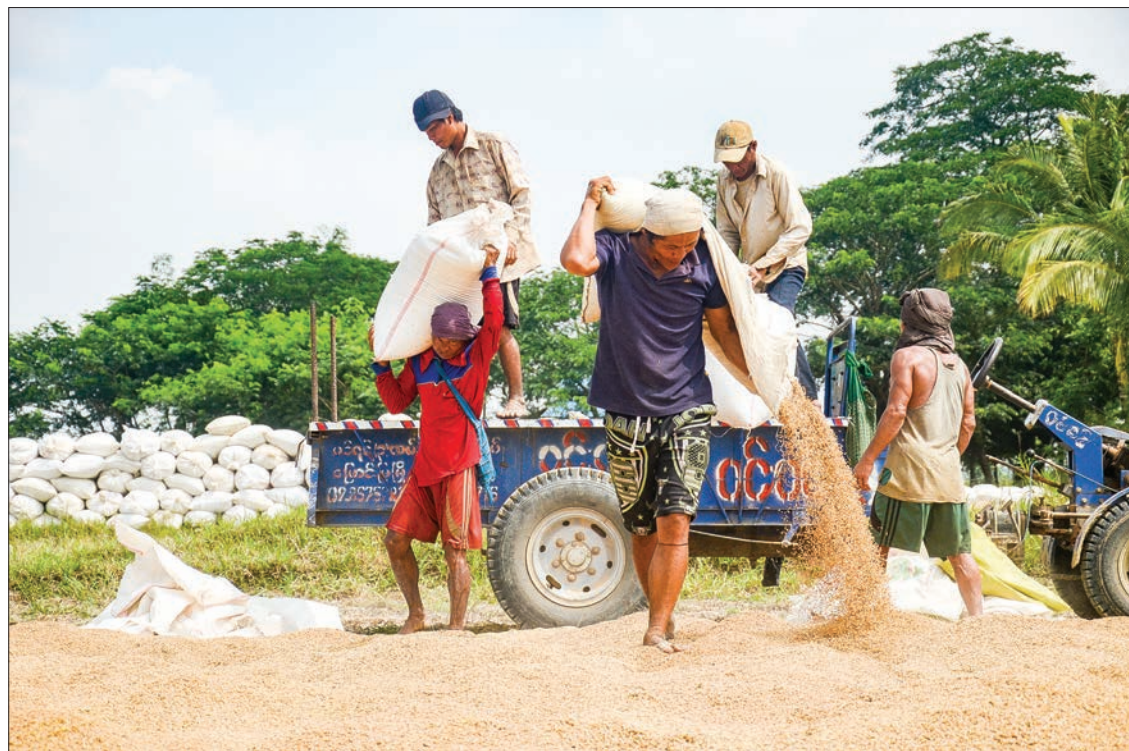
Workers spread paddy to dry under the sun at a field in Kangyidauk Township, Ayeyawady Region.

He urged the committee to set the rate depending on the production cost and benefits to farmers and traders, as well as the expected trend in future domestic and international market