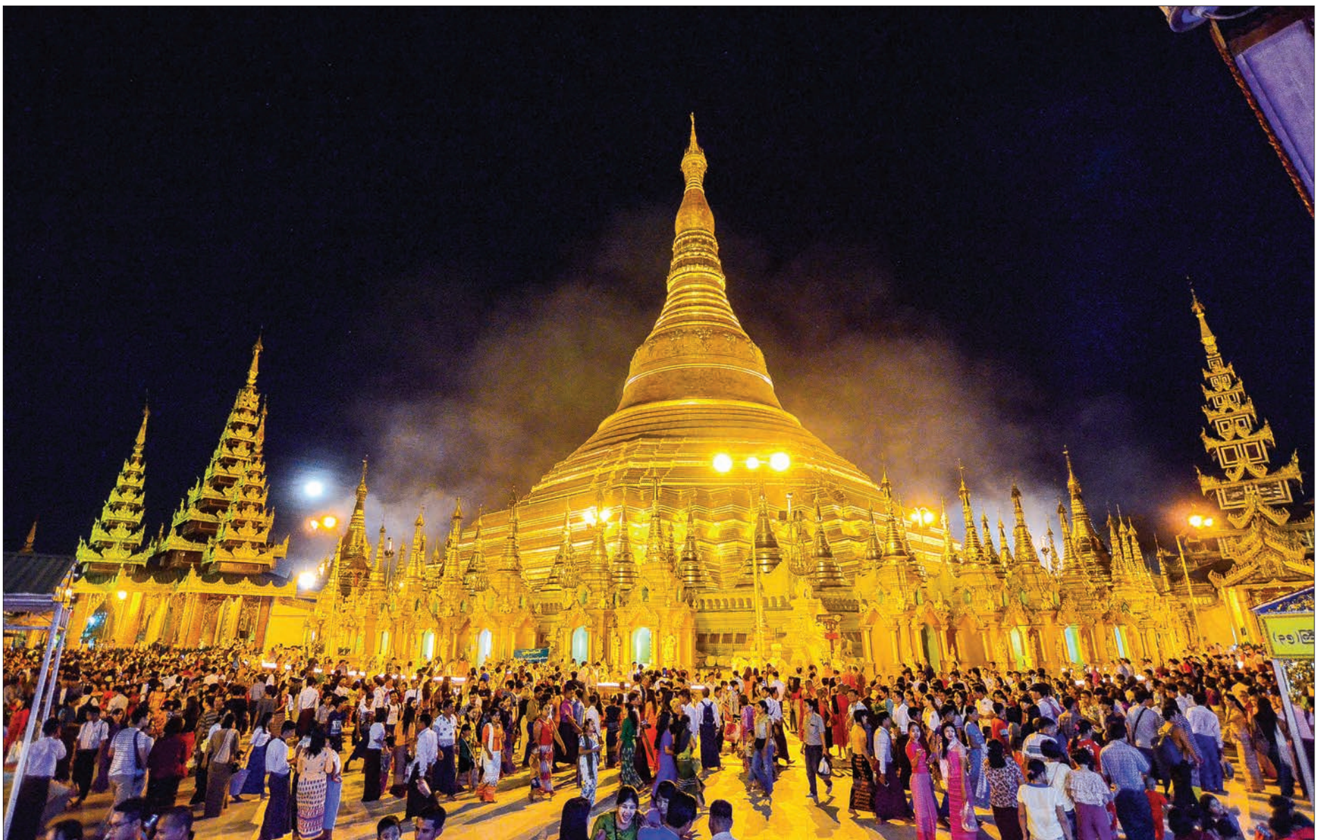
Shwedagon Pagoda is crowded with pilgrims on the Full Moon Day of Thadingyut in Yangon yesterday.

ON THE full moon of Thadingyut yesterday, the Shwedagon Pagoda and other pagodas across Myanmar were packed with Buddhist devotees.