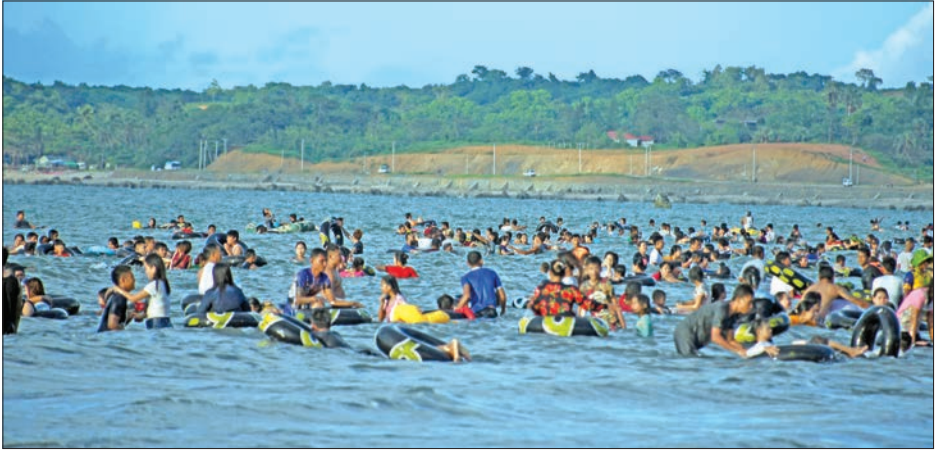
Travellers visit Chaungtha beach in Pathein Township during the Thadingyut Festival.

CROWDS of holiday-makers have fully occupied all the guesthouses and hotels at Chaungthar beach resort in Pathein Township, Ayeyawady Region, during the Thadingyut Festive this year as the beach is well-known for its pristine and pollution-free environment.