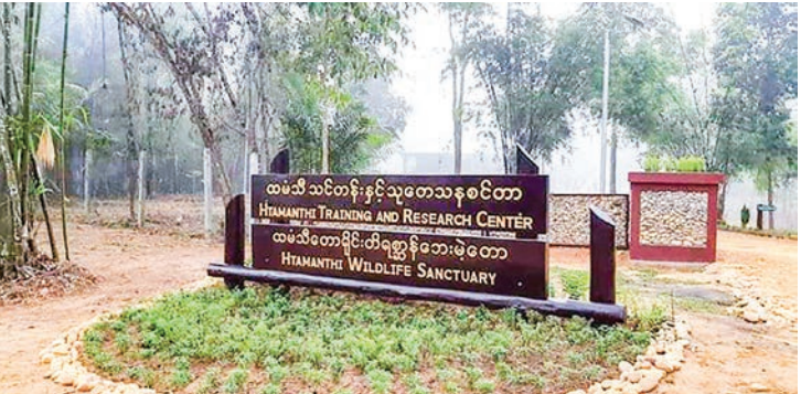
Htamanthi Wildlife Sanctuary in Sagaing Region.