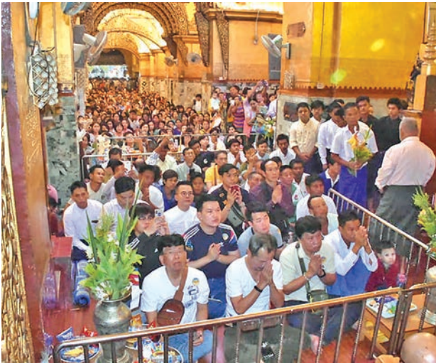
Monk cleans the face of Mahamuni Buddha Image at Mahamuni Pagoda on the full moon of Thadingyut in Mandalay