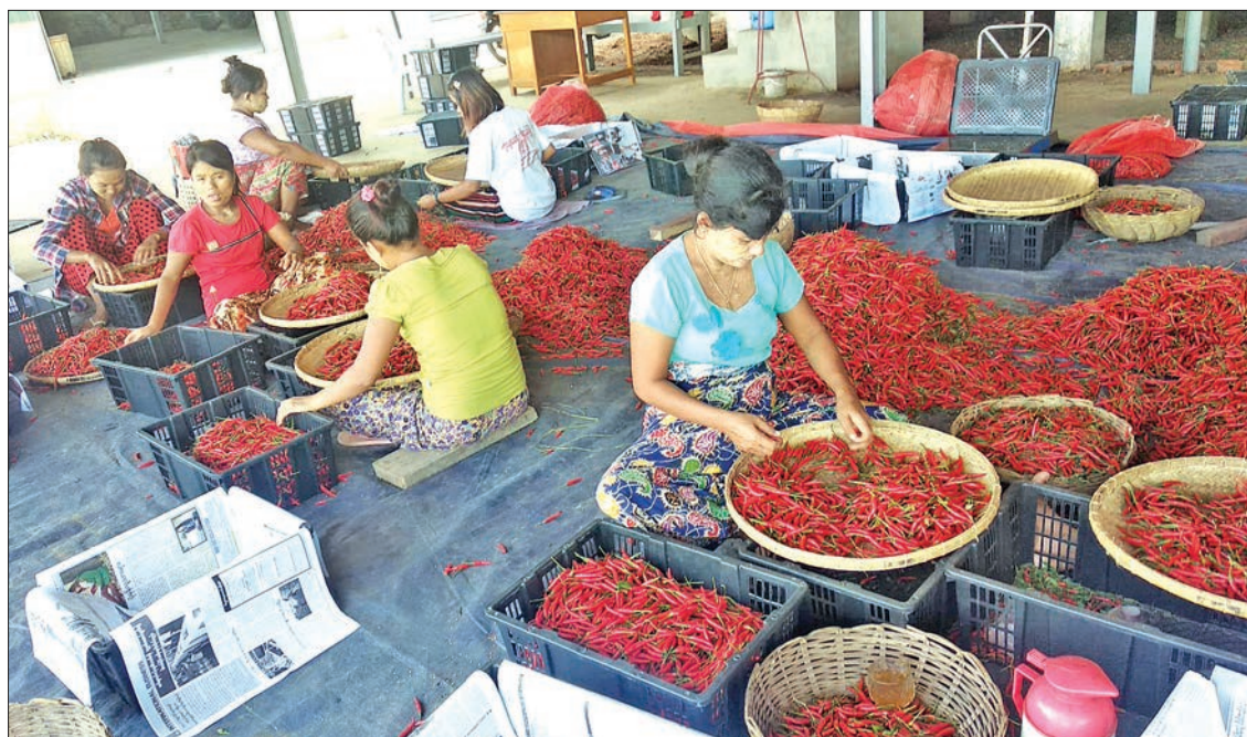
Women processing in traditional way fresh chilli in Mandalay Region.