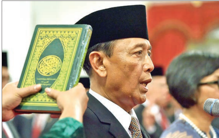
FILE PHOTO: Wiranto takes oath at an inauguration ceremony.

Wiranto, who goes by one name, suffered two stab wounds in his abdomen, Dedi told a news conference, adding he was flown to an army hospital in Jakarta after receiving emergency treatment at a local hospital.