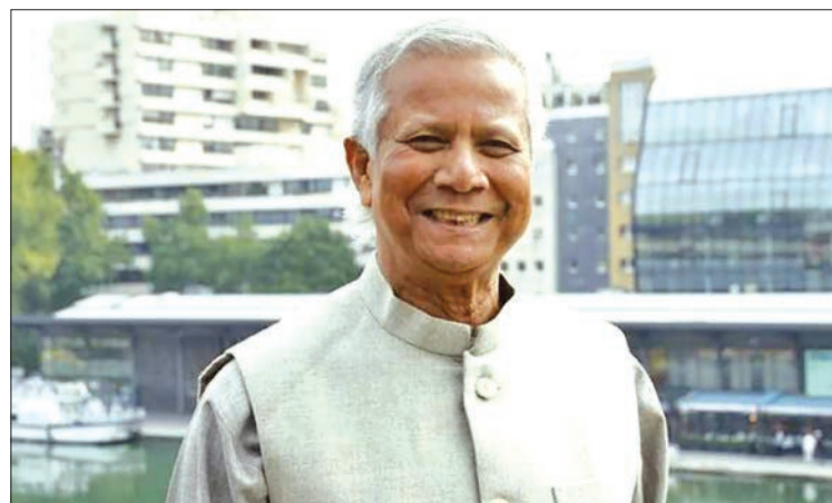
Bangladeshi economist and Nobel laureate Muhammad Yunus.