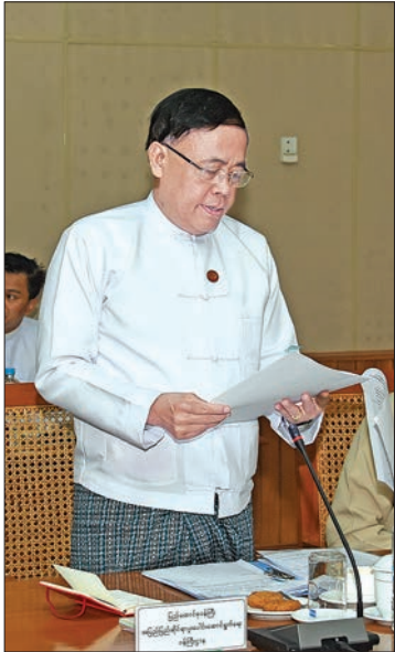
Union Minister for International Cooperation U Kyaw Tin.

The Ministry of Information was to broadcast stories, historical songs and songs related to the country's Independence Day and ensure that articles and special commemorative articles are put in the