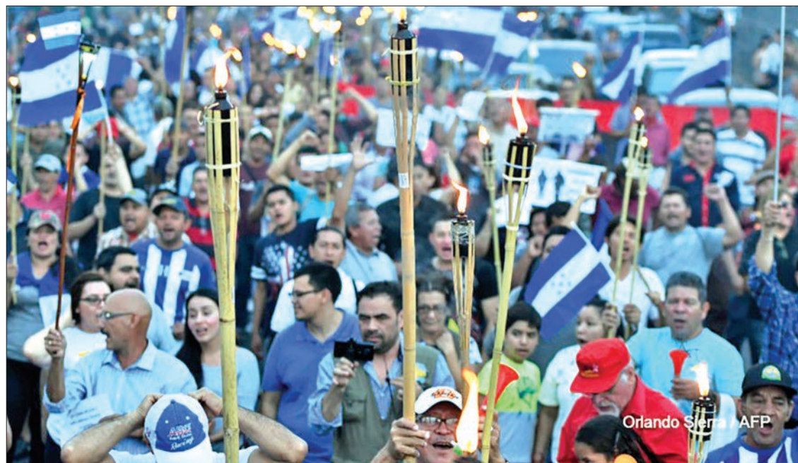
Anti-government protesters march toward the presidential palace during the "March of Torches" to demand the resignation of Honduran President Juan Orlando Hernandez, in Tegucigalpa.

"The Honduran people are good and have been with me in good times and in bad times" Hernandez said in a speech to his supporters. A country of 9.4 million plagued by gangs, poverty and corruption, Honduras has witnessed recent violent protests over the president's controversial health and education decrees.—AFP ■