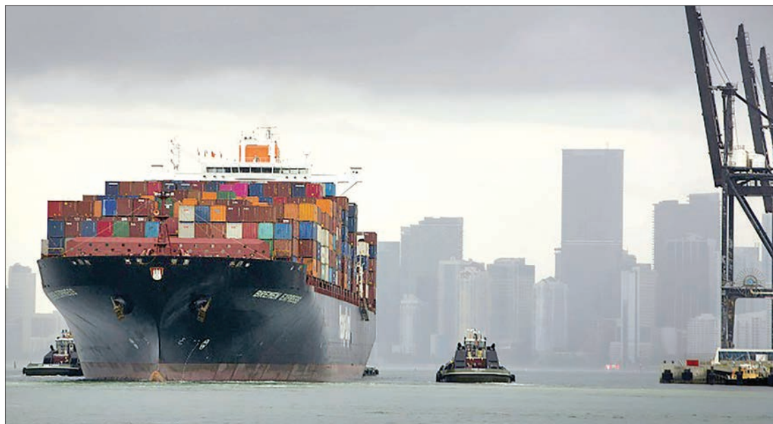
Top-level trade talks are the main point of focus.

Sources were reported as saying China had narrowed the issues it was willing to discuss as it felt in a stronger position owing to Donald Trump facing an impeachment inquiry at home and a weakening economy.—AFP ■