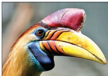
Hornbill 'ivory' is becoming increasingly popular in China, where it is made into ornaments and jewellery.

Officials uncovered the huge haul on Saturday in a raid on a house in Kapit in Malaysia's Sarawak state, and a 56-year-old