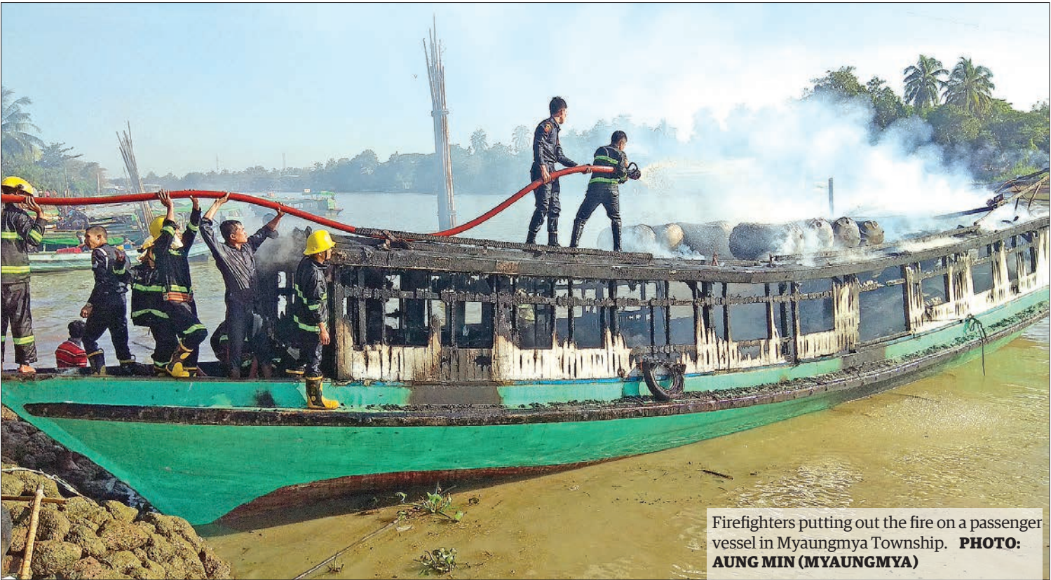
Firefighters putting out the fire on a passenger vessel in Myaungmya Township.