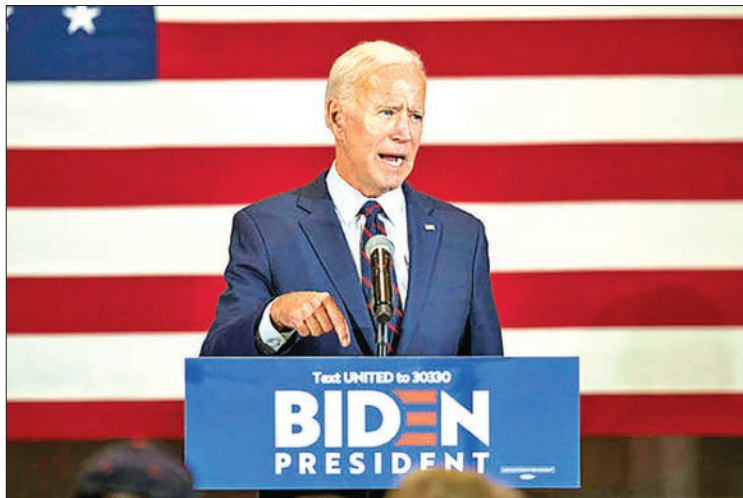
Democratic presidential candidate, former Vice President Joe Biden speaks during a campaign event on October 9, 2019 in Manchester, New Hampshire.

WASHINGTON — Democratic White House hopeful Joe Biden called Wednesday for President Donald Trump's impeachment, saying he'd "betrayed" the United States, but Trump dug in, predicting that the Supreme Court would have to resolve the fight.