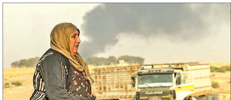
Arab and Kurdish civilians flee following Turkish bombardment in Syria's northeastern town of Ras al-Ain.