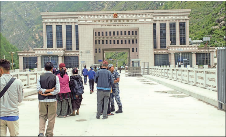
Nepali traders waiting for their containers to arrive from Gyirong queue up with identity papers at the Rasuwagadhi-Gyirong border crossing on 24 July 2019. After twin quakes in 2015 destroyed the Kodari trading route, this has become the biggest trading route between the two countries.