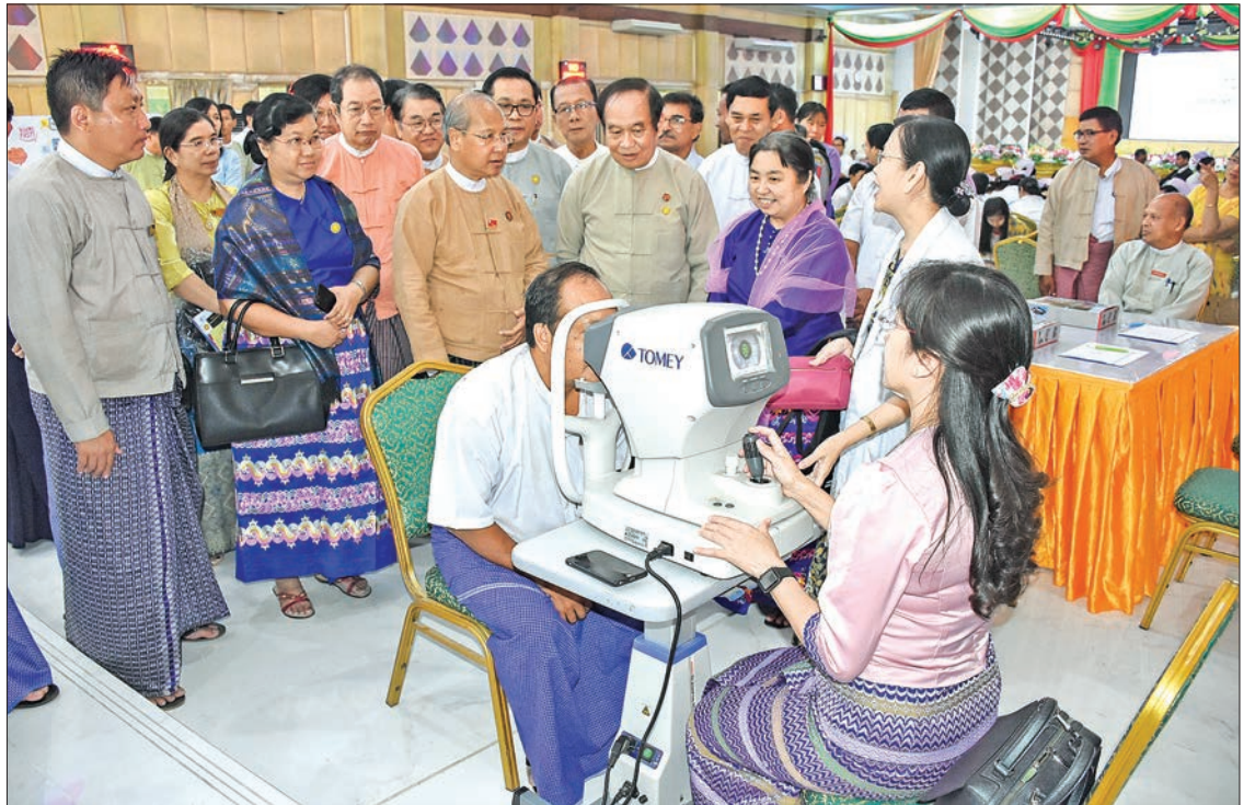
Union Minister Dr Myint Htwe, Magway Region Chief Minister Dr Aung Moe Nyo and dignitaries observe eye checking-up at the World Sight Day 2019 event in Magway yesterday.

Myanmar people who were 50 years old and above lost their vision and about 70 per cent were due to glaucoma. The aim was to provide effective treatment of cataract to prevent and reduce vision lost. WHO target was 3,000 cataract operations per one million and cataract operation in 2018 increased to 2,280 per million in Myanmar. Arrangements were also made to provide preliminary and specialist eye care services by training and producing more optometrists, ophthalmologists and opticians. Myanmar had also met WHO's Elimination Criteria for Trachoma and arrangements were made to conduct a survey in 2020 to announce the elimination of Trachoma in Myanmar. Training courses on Primary Eye Care and course to care for the eye were being increasingly conducted in states, regions and schools. All are urged to cooperate and participate enthusiastically in the aim of WHO to reduce and eliminate treatable eye diseases