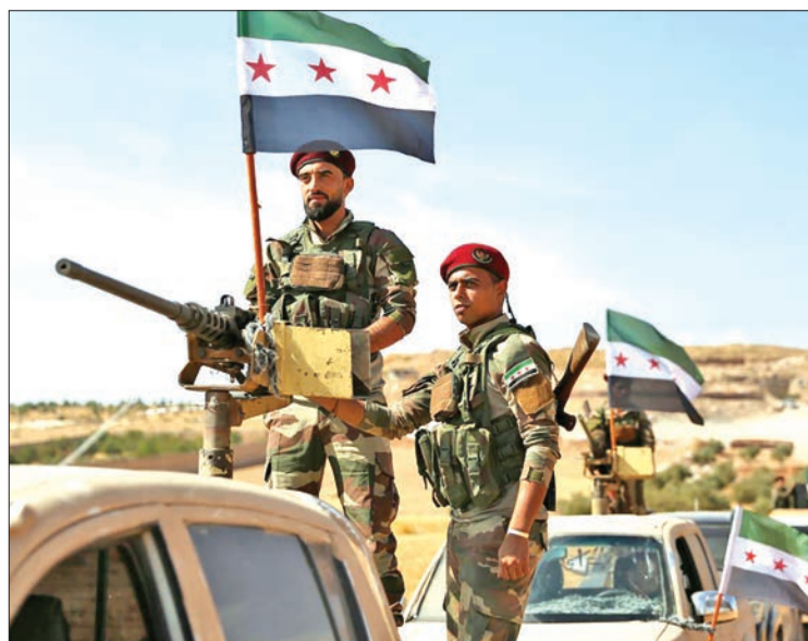
Turkish-backed Syrian rebel fighters head to an area near the Syrian-Turkish border north of Aleppo on 8 October 2019.

But it has frequently criticised Brussels for being slow in providing the money and not doing more to help with the broader refugee problem.—AFP