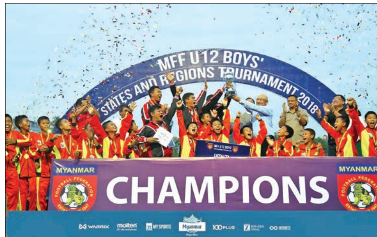
The champions of the MFF U-12 Boys' States and Regions Tournament 2018, the Magway Region team, are seen celebrating their victory on 14 December, 2018.