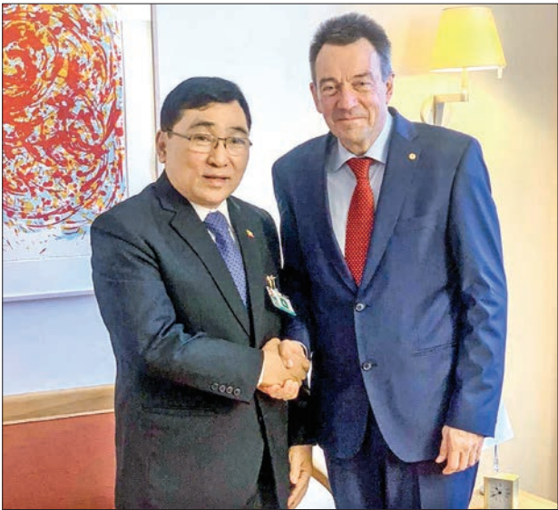
Union Minister Dr Win Myat Aye shakes hands with ICRC President Mr Peter Maurer.

He also talked on how Myanmar’s government is implementing the recommendations on Rakhine State, the formation of ten working groups under UEHRD, collaborating with UNDP on the joint survey for Rakhine and possible areas for cooperating with UN agencies, ASEAN’s readiness to assist in the repatriation process and future processes, enacting