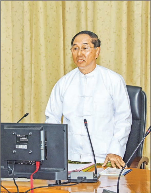
Vice President U Myint Swe addresses the first coordination meeting of the Central Committee for Organizing 72 nd Independence Day celebrations yesterday.

VICE PRESIDENT U Myint Swe, Chairman of Central Committee for organizing 72 nd Independence Day celebrations attended the first coordination meeting of the committee held at the Union Government Office meeting hall in Nay Pyi Taw yesterday morning. Speaking at the meeting, the Vice President said that in order to hold the Independence Day nationwide with the five national objectives set by the government a 37-member Central Committee for holding the Independence Day was formed. Ten sub-committees will be formed under the Central Committee