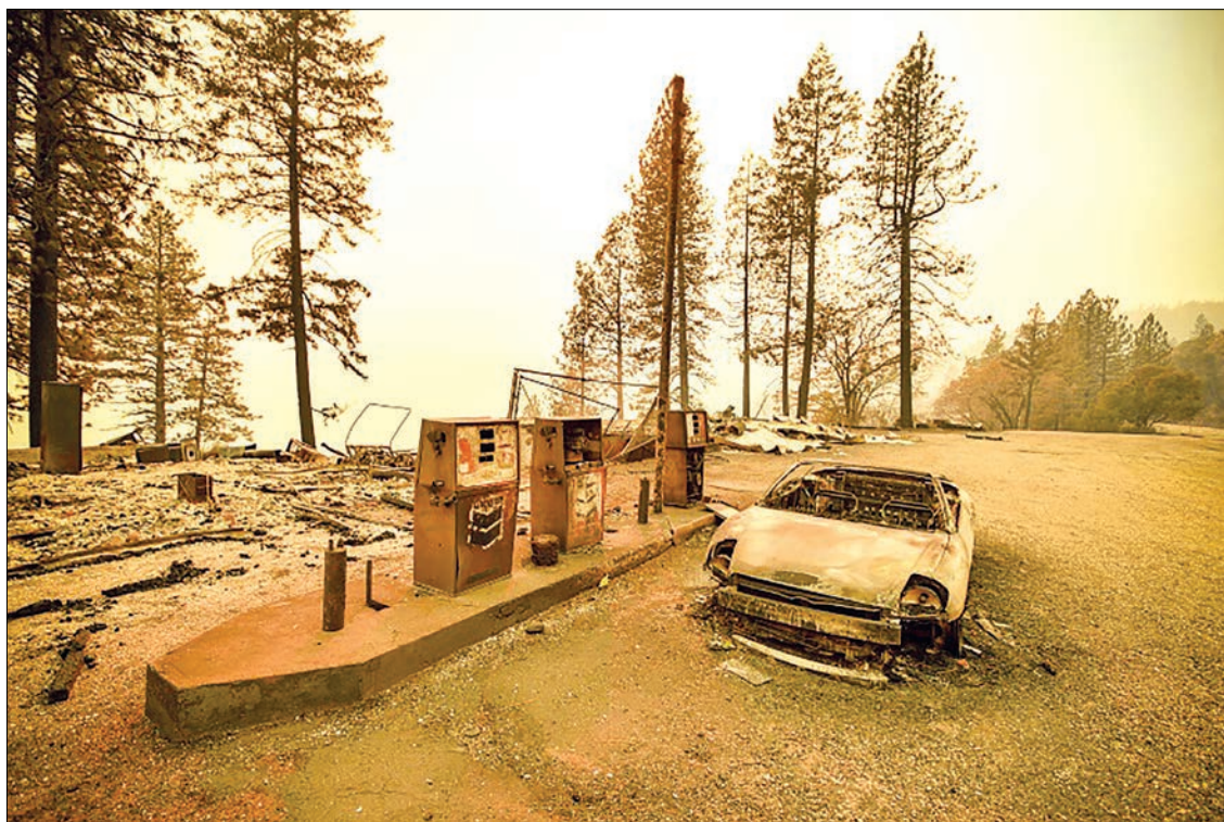
A burnt car and a gas station remain visible on 11 November, 2018 after the "Camp" fire tore through the region near Pulga, east of Paradise, California.

PG&E said the severe weather incident prompting its precautionary shutoffs — hot, dry conditions and winds gusting at up to 70 mph (110 kph) — was expected to last through midday Thursday in northern and central California. —AFP ■