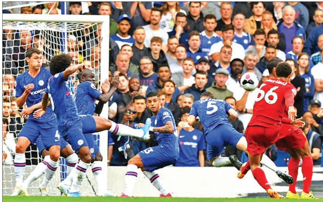
FILE PHOTO: Liverpool defender Trent Alexander-Arnold opens the scoring at Chelsea on 22 September.

LONDON — Trent Alexander-Arnold says England must improve their defensive record if they are to stand any chance of winning Euro 2020.