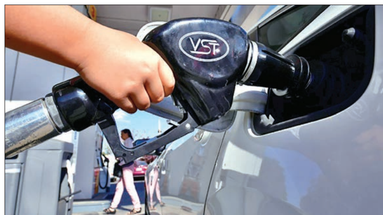
US energy prices fell again in September and are down nearly 5% over the past year, holding down CPI.

The cartel held its forecast for demand growth next year steady at 1.08 mbd.—AFP ■