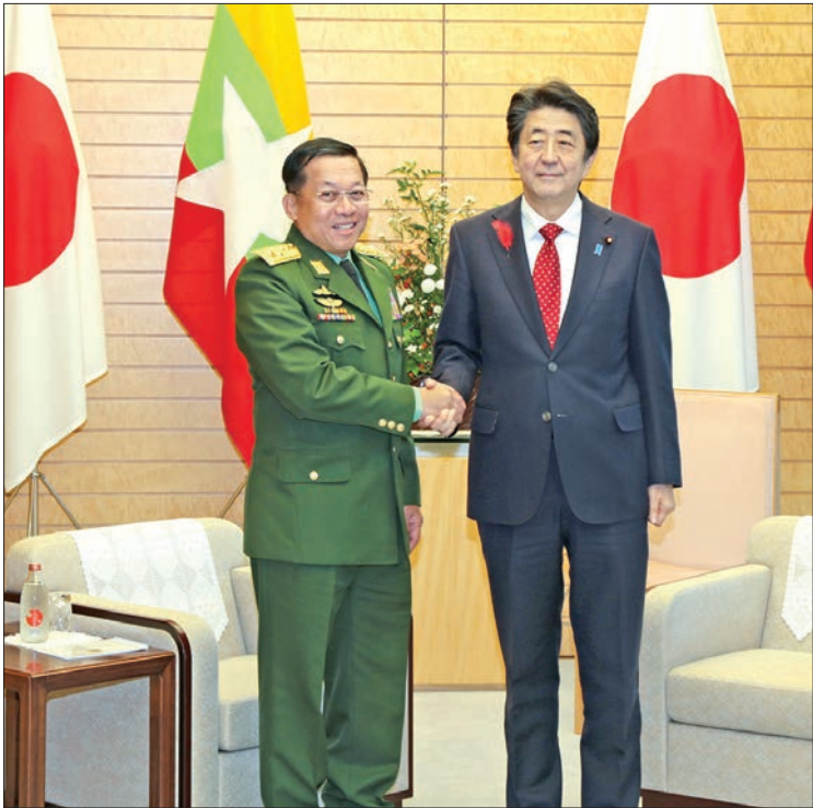
Defence Services Commander-in-Chief Senior General Min Aung Hlaing meets with Japanese Prime Minister Mr Shinzo Abe at the Prime Minister's office.

Afterward, Commander-in-Chief of Defence Services