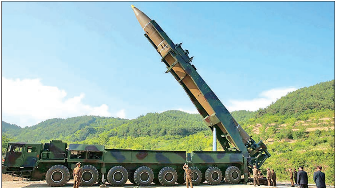
This picture taken and released on July 4, 2017 shows North Korean leader Kim Jong-Un inspecting the test-fire of the intercontinental ballistic missile Hwasong-14.

After the closed-door session in New York on Tuesday, the six European countries including Britain, France and Germany released the statement say-