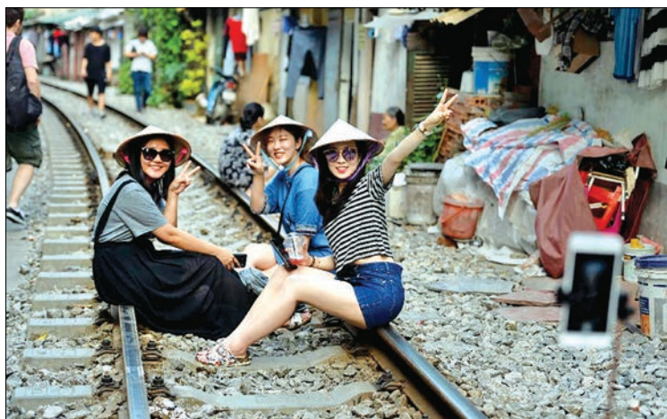
It might look pretty, but it's still a working railway and every so often tourists have to scramble out of the way of an oncoming train.

HANOI — Selfie-snapping tourists railed against the closure of Hanoi's 'train street' on Thursday after police blocked off the Instagram-famous tracks for safety reasons.