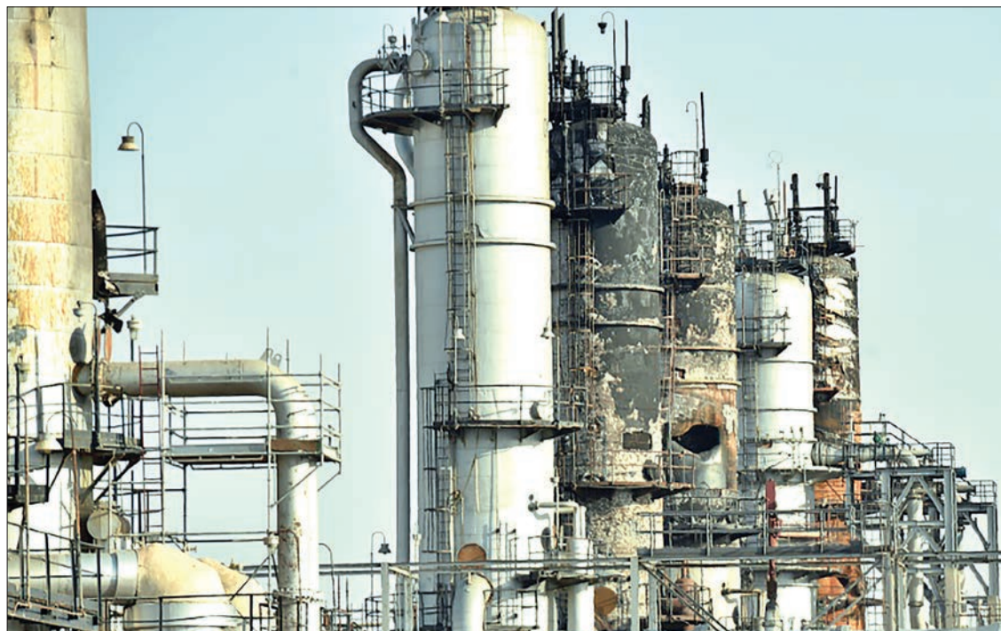
Attacks on Saudi oil installations caused a sharp, but short-lived drop in oil production.

recent decline, falling another 1.4 per cent, including a 2.4 per cent drop in gasoline. Over the last 12 months, CPI rose 1.7 per cent, the same as in August, as energy prices are down 4.5 per cent. Even when volatile food and fuel prices are stripped out, core CPI rose just 0.1 per cent for the month, below economists' expectations. Compared to September of last year, the core measure was up 2.4 per cent, also the same as August — which had been the biggest increase since July 2018 and a level not exceeded in a decade. That measure was held down by a steep 1.6 per cent drop in used car prices, but economist Ian Shepherdson of Pantheon Macroeconomics said they are expected to rebound, a repeat of what happened at this time last year.—AFP ■