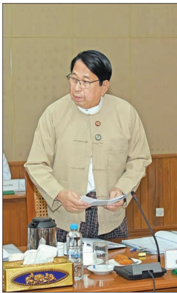
Union Minister for Information Dr Pe Myint.