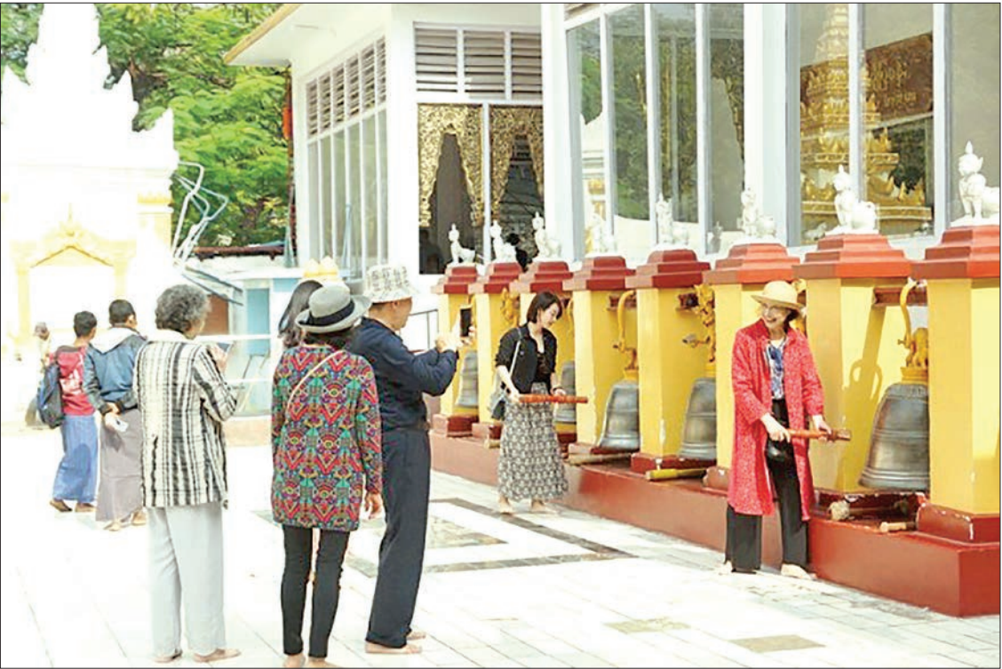
A tourist takes a photo of a fellow tourist striking a bell at the Mahamuni Pagoda in Mandalay.

OVER 50,000 international visitors visited the Mandalay Mahamuni Pagoda between July and September, according to data provided by the Mahamuni Pagoda trustee board. The entrance fee for the Mahamuni Pagoda was fixed at K5,000 from 1 July. During the three months from July, entrance fees of over K25 million was collected from 50,104 international visitors. Currently, tourists are being allowed to enter the Mahamuni pagoda only through the Tourist Information Center, located in the north of the pagoda. Another tourist information center is being constructed to serve the high number of tourists. Moreover, toilets, lockers, wet tissues, and other services are already being offered to international visitors, and security staff and direction boards have been placed at the entrance, according