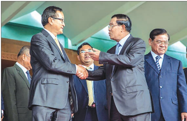
Cambodian Prime Minister Hun Sen (r) shakes hands with the President of the opposition Cambodia National Rescue Party, Sam Rainsy in July 2014.

The fresh charge of an attempted coup alone could land him in prison for as long as 30 years if found guilty.