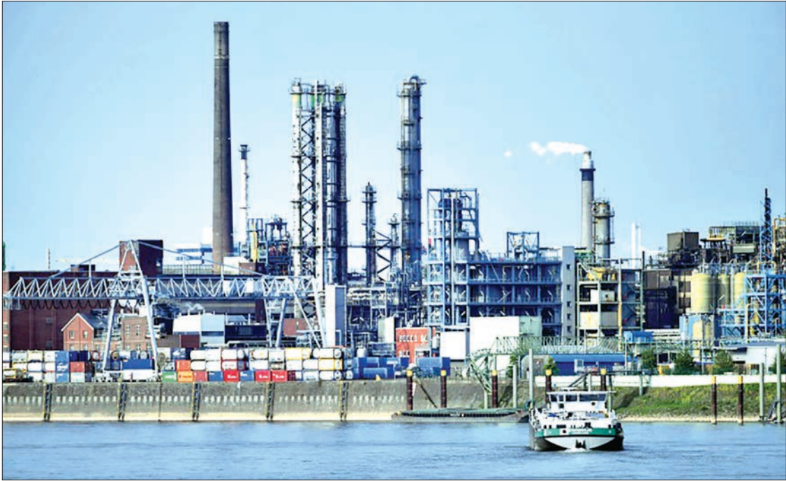
The German chemical industry has put a price tag on going carbon neutral.

FRANKFURT AM MAIN — The industry federation of Germany’s powerful chemical sector said Wednesday companies could achieve carbon neutrality by 2050, but at a massive cost in financial and energy terms. A study showed reaching net zero output of greenhouse gas carbon dioxide (CO2) by mid-century would cost 45 billion euros ($49.4 billion) in additional investment, said the VCI group, which brings together giants like BASF and Lanxess with hundreds of smaller firms. “The necessary CO2-free processes to produce basic chemicals are known in principle, but have to be developed further for large-scale application,” it added, suggesting many could be ready “in the mid-2030s”. But for the plans to make business sense, low electricity prices and a massive increase in renewable generation would be needed. Switching to the new carbon-neutral processes and technologies would multiply the key industry’s electricity demand elevenfold, to 628 terawatt-hours per year, the VCI estimated – or as much as Germany generates annually today. By comparison, a no-new-action scenario could bring a 27-percent reduction in CO2 output using only the seven billion euros already committed to greening chemical plants.—AFP ■