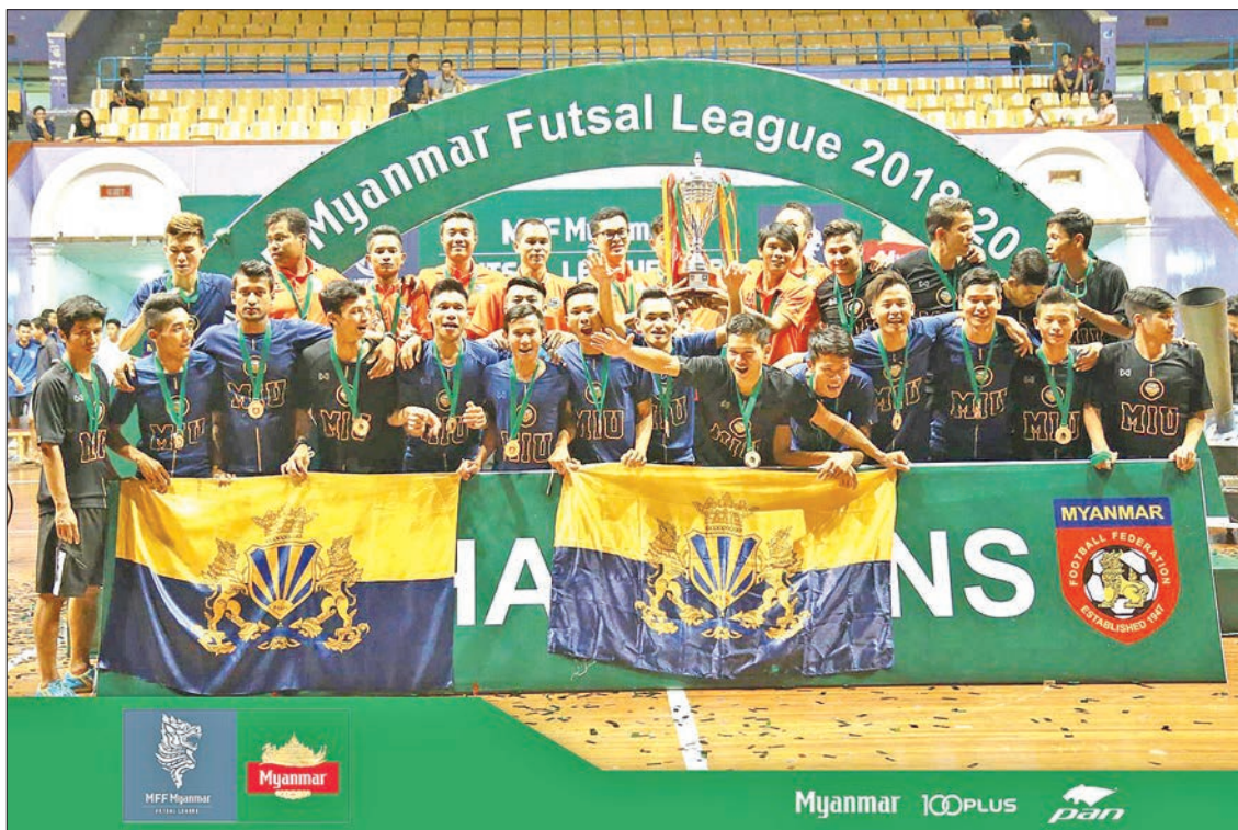
The champions of the Myanmar Futsal League 2018-2019, the Myanmar Imperial University F.C., seen holding their championship trophy.

THE Myanmar Futsal League 2019-2020, which will be supervised by the Myanmar Football Federation, will be held in November. Twelve teams will compete in the tourney, according to a statement issued yesterday by the football federation.