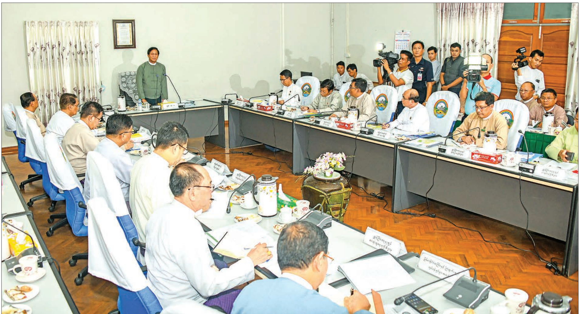
Vice President U Henry Van Thio addresses the coordination meeting concerning the sugar and marine products industries at the Ministry of Agriculture, Livestock and Irrigation.

V ICE PRESIDENT U Henry Van Thio suggested the state-departments and the private sector to work together in promoting sugar and marine products industries in line with the existing laws and regula-