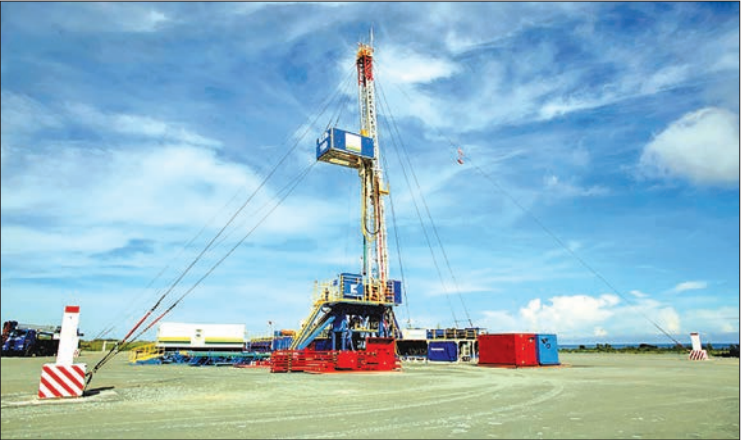
Russia sees the oil price at $50 per barrel.