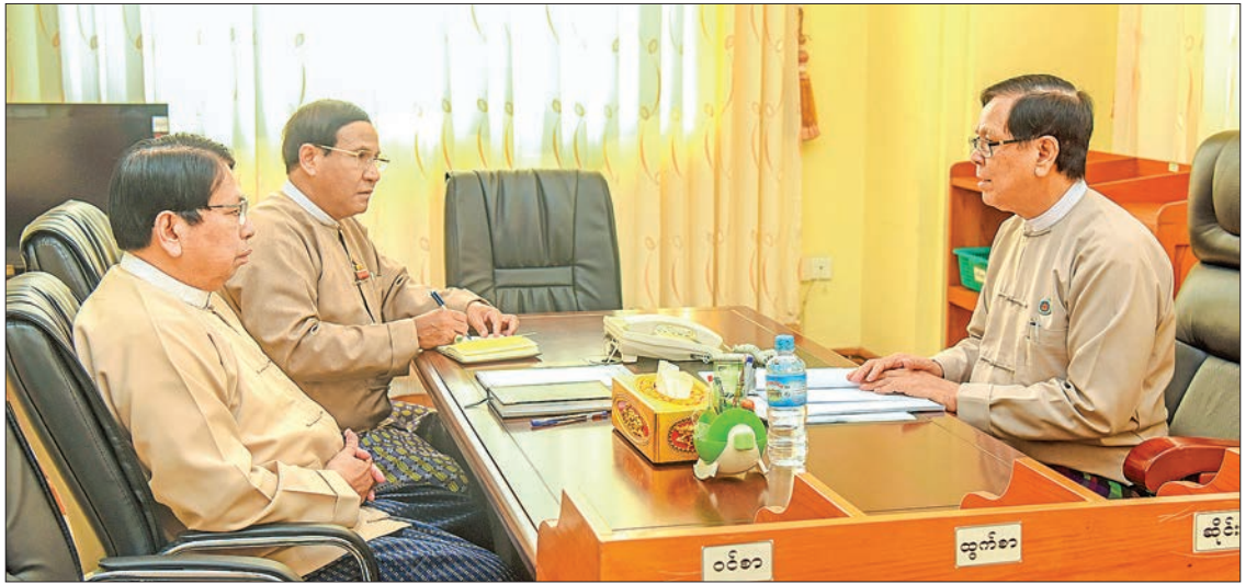
Amyotha Hluttaw Deputy Speaker U Aye Tha Aung, Union Minister Dr Pe Myint and Deputy Minister for Office of the Union Government U Tin Myint hold coordination meeting in Nay Pyi Taw.