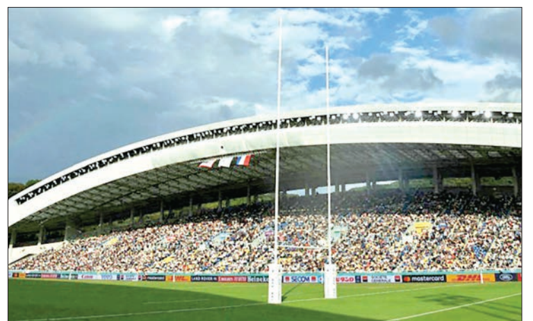
Rugby World Cup fixtures and the Formula 1 Japanese Grand Prix could be affected by Typhoon Hagibis, which is expected to bring disruption to southern Japan. The Fukuoka Hakatanomori Stadium will host the Ireland vs. Samoa pool A match on 12 October.

Hagibis, the 19 th typhoon of the season, is moving at a speed of around 15 kilometers per hour and has an atmospheric pressure of 915 hectopascals at its center. The powerful storm is packing gusts of up to 270 kph, the JMA also said. —Xinhua ■