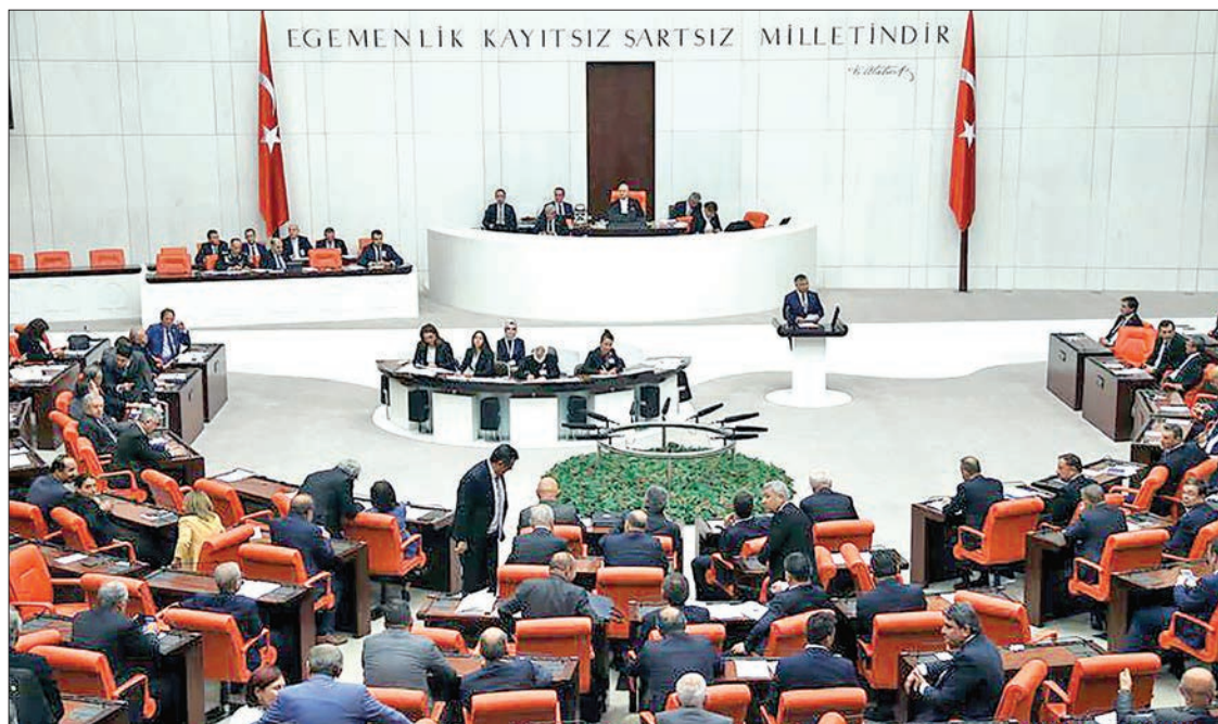
Turkish parliament members vote for a motion to extend the government's authority to launch cross-border military operations in Iraq and Syria, in Ankara, Turkey, on 8 October, 2019.

The motion stated that Turkey attaches great importance to the protection of Iraq's territorial integrity, national unity, and stability. "However, the existence of PKK and Daesh in Iraq poses a direct threat to regional peace, stability and the security of our country," it added, using the Arabic acronym of Islamic State (IS). It also said that Turkey has continued security activities in the east of Euphrates in line with its legitimate security interests.