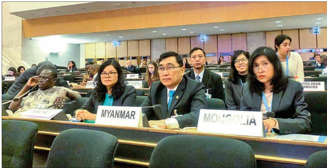
Union Minister Dr Win Myat Aye attends the 70 th Annual Plenary Session of the Executive Committee of the High Commissioner's Programme (ExCom) in Geneva.

"Although Myanmar is not a party to the 1954 Convention relating to the Status of Stateless Persons and the 1961 Convention on the Reduction of Statelessness, the Government has committed to achieving the realization of human rights based on international humanitarian principles."