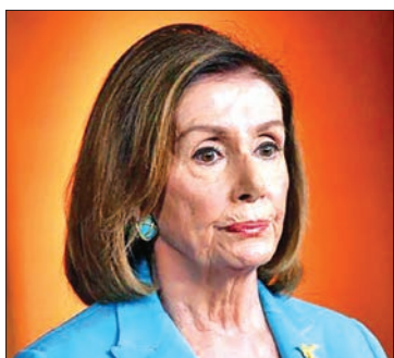
Top Democrat Nancy Pelosi on 8 October, 2019, accused the White House of an "unlawful attempt to hide the facts" after it ruled out cooperating with an impeachment probe of President Donald Trump.

"Put simply, you seek to overturn the results of the 2016