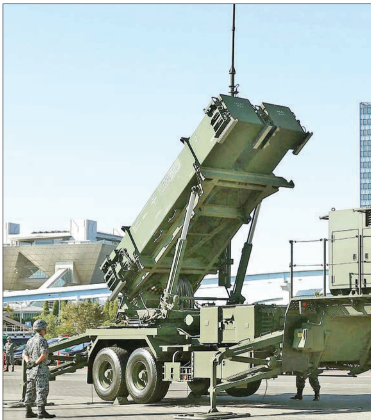
Japanese Air Self-Defense Force personnel install a missile interceptor system called Patriot Advanced Capability-3 during a drill open to the press in Tokyo's Ariake area on 9 October, 2019.

In the exercise shown to the media at the Tokyo Rinkai Disaster Prevention Park in the capital's waterfront Ariake district, around 30 ASDF members set up the equipment and then spent 20 minutes checking each step in preparation for launching interceptors. The drill was observed by Defense Minister Taro Kono and Tokyo Gov. Yuriko Koike. —Kyodo News ■