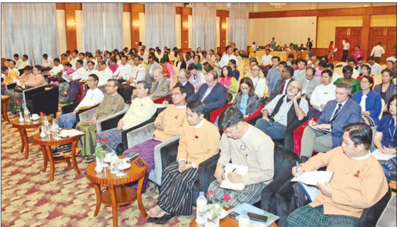
Union Minister for Health and Sports Dr Myint Htwe addresses the second coordination meeting of National Nutrition Steering Committee in Nay Pyi Taw yesterday.

THE second coordination meeting of National Nutrition Steering Committee was held at the Horizon Lake View Hotel in Nay Pyi Taw yesterday morning. Union Minister for Health and Sports Dr Myint Htwe, the chairman of the committee, presided over the meeting, with emphasizing the importance of nutrition for the multi-sectoral development of the country. He also said his ministry is implementing the five-year Multi-sectoral National Plan of Action on Nutrition (MS-NPAN) 2018-2023, while Myanmar is expanding vaccination programme and actively participating as a member country in the Scaling Up Nutrition (SUN) movement for reducing malnutrition in