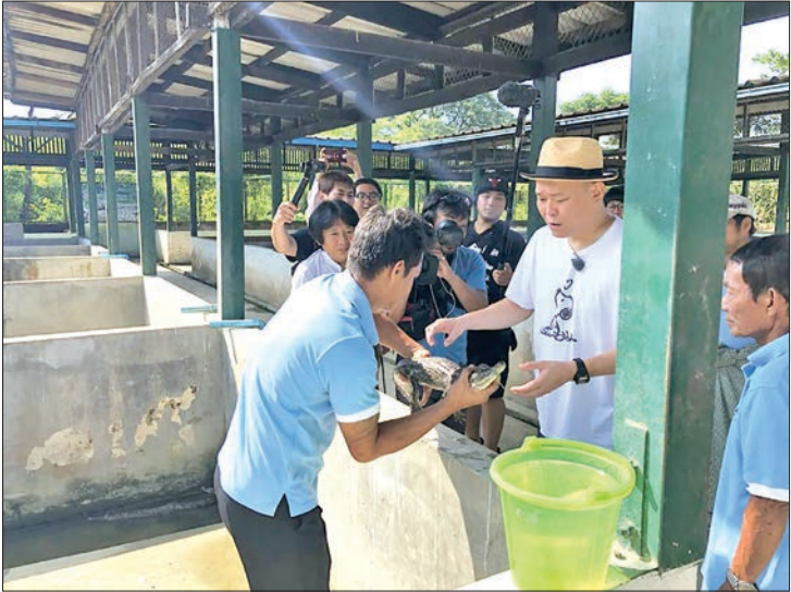
Film crew shooting the crocodile farm in Thaketa.

for episode 18 of their global travel programme. They will next film the crocodile farm in Thakayta and the Drug Elimination Museum. The documentary will promote international interest in Myanmar and will be broadcast on Japan's Yomiuri TV.—Win Thein (FDC) (Translated by Zaw Htet Oo)