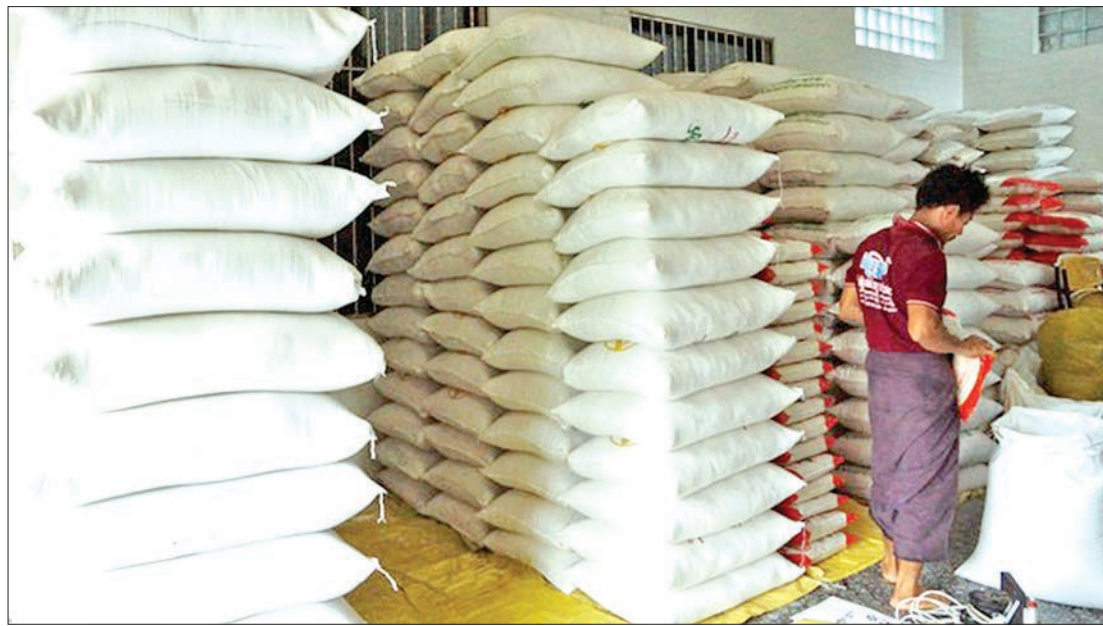
Accumulation of rice bags for export.

THE volume of rice and broken rice exported over eleven-and-a-half months since October in the previous financial year was estimated at over 2.29 million metric tons, worth $691 million, according to an announcement from the Myanmar Rice Federation.