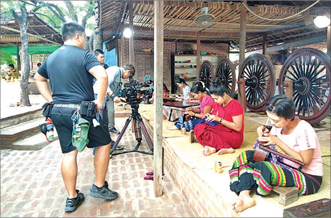
Channel News Asia crew shooting women crafting on lacquerwares in Bagan.

THE Channel News Asia filmed a travel documentary in and around ancient Bagan, the UNESCO Heritage Site of Myanmar. On 8 October, the Singapore-based television crew shot the scenes of Bagan temples,