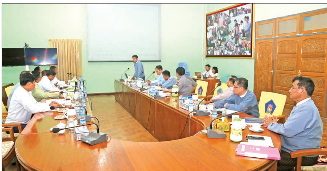
Deputy Minister U Soe Aung attends the coordination meeting on the surveys conducted by Committee for Implementation of the Recommendations on Rakhine State held in Nay Pyi Taw yesterday.

The Committee conducted a field survey in Rakhine State from 29 September to 4 October 2019. The field survey and the findings and reports of the United Nations Secretary-Gen-