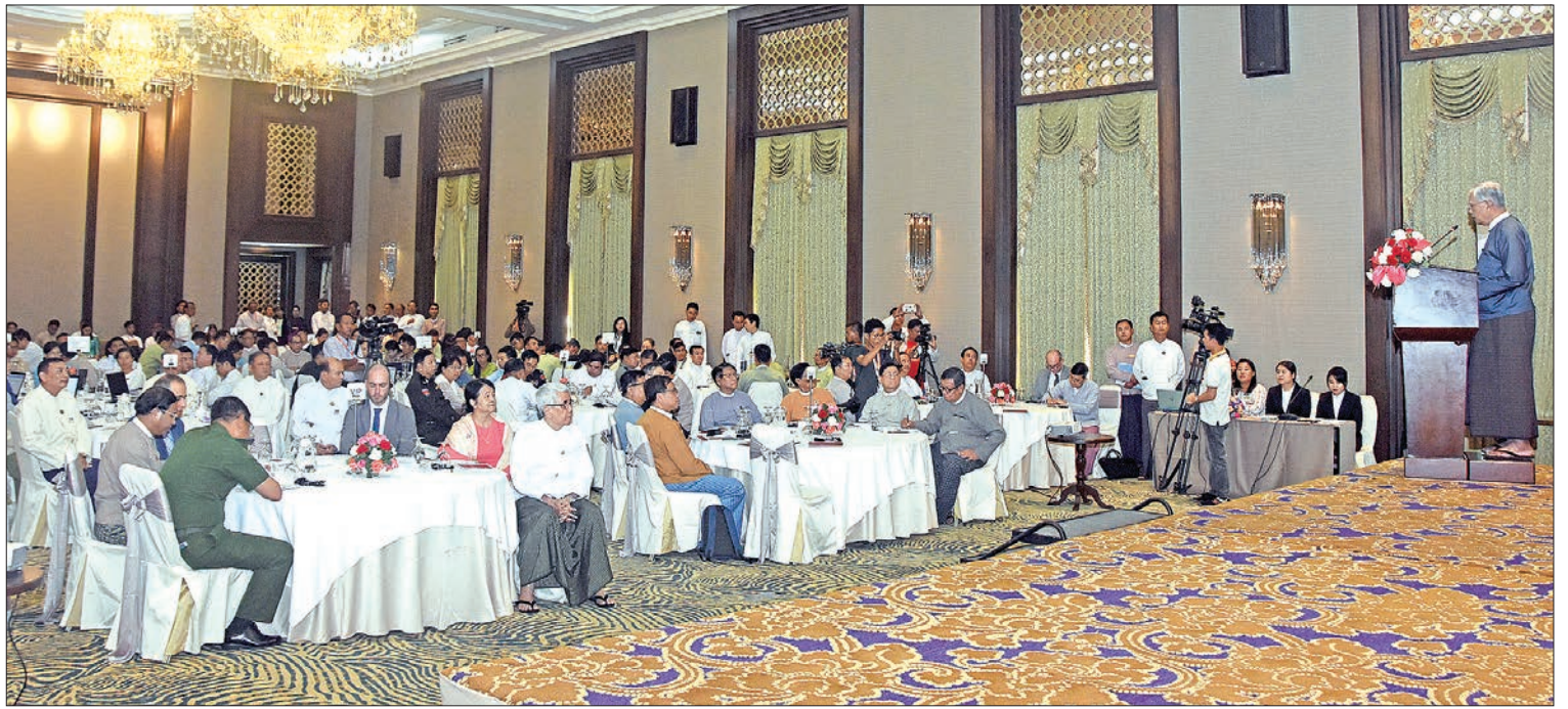
Anti-Corruption Commission Chairman U Aung Kyi delivers the opening speech at the ceremony to undergo trial the corruption prevention unit toolkit (CPU toolkit) in Nay Pyi Taw yesterday.

Currently, there are 37 CPUs under 17 union ministries and 5 Union-level institutions and all of them are assigned