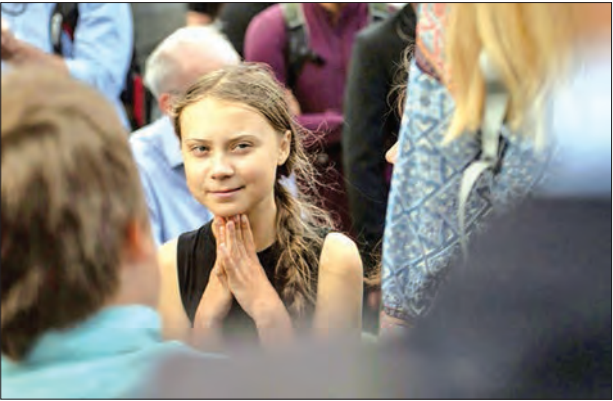
Bookmakers are tipping teenage activist Greta Thunberg for the Nobel Peace Prize but observers are sceptical.

STOCKHOLM — Experts are cautious, but bookies are tipping teenage climate campaigner Greta Thunberg for the Nobel Peace Prize next week, while two literature laureates will be crowned after last year's award was postponed over a sex harassment scandal. Odds from bookmakers such as Ladbrokes indicate the 16-year-old activist is the one to beat for the Nobel Peace Prize after she launched a school strike that inspired millions to join her "Fridays for Fu-