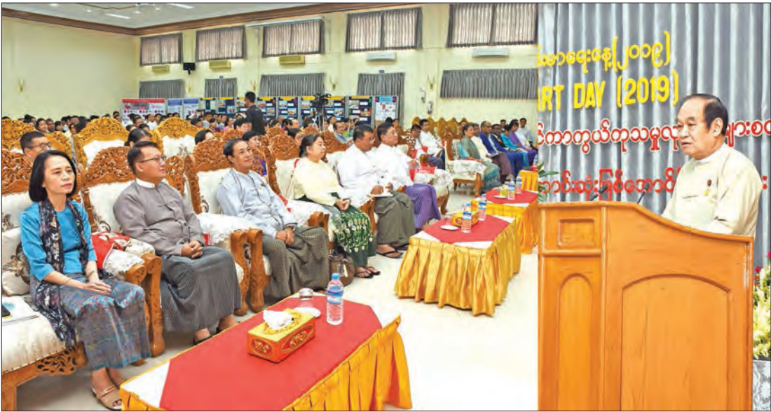
Union Minister Dr Myint Htwe addresses the ceremony to commemorate World Heart Day 2019 at the Ministry of Health and Sports, Nay Pyi Taw yesterday.

UNION Minister for Agriculture, Livestock and Irrigation Dr Aung Thu received Finnish Under-Secretary of State for External Economic Relations Ms Nina Irmeli Vaskunlahti at his office in Nay Pyi Taw yesterday. During the meeting, they discussed matters related to electrifying Myanmar's households in off-grid areas with the aim of National Electrification Plan (NEP), providing solar electricity in private houses and public buildings, investment in Myanmar's solar energy projects by Finnish private entrepreneurs and promoting of rural socio-economic conditions by using solar energy. – MNA (Translated by TTN)