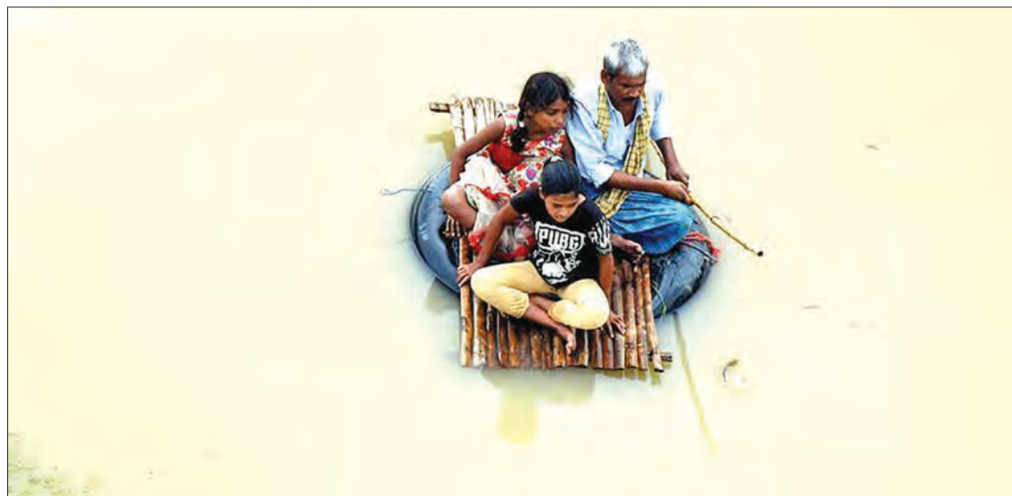
Residents move on a makeshift raft in India's eastern state Bihar on 2 October, 2019. As many as 42 people have died since last week in rain-related incidents in India's eastern state of Bihar, media reports said on Wednesday.

The India Meteorological Department (IMD) has predicted that heavy rainfall is very likely at isolated places in Bihar on Thursday. —Xinhua ■