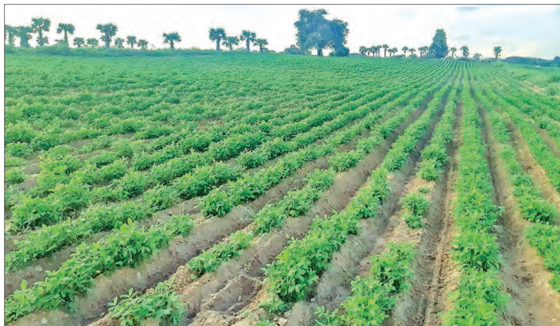
A peanut plantation in Wundwin Township, Mandalay Region.

PEANUT farmers in Htanaungkone village, Wundwin Township, Mandalay Region said they are expecting a good yield from crops planted in the mid-monsoon season.