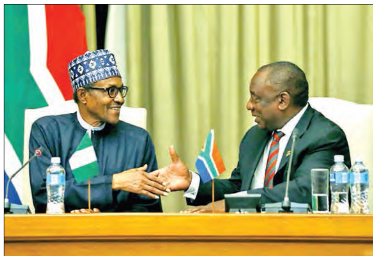
Handshake: Buhari, left, and Ramaphosa.

Mobs descended on foreign-owned stores in and around Johannesburg in early September, destroying properties and looting. "We call for the strengthening and implementation of all the necessary measures to pre-