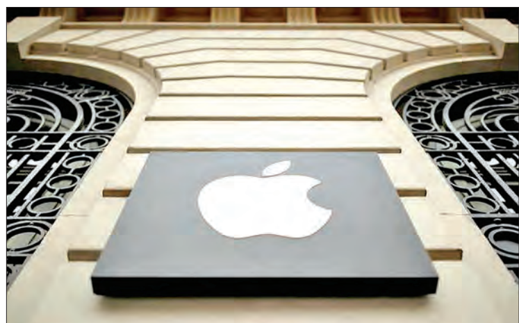
The man filed suit in a Moscow court asking for one million rubles ($15,000) after an incident this summer in which a cryptocurrency called “GayCoin” was delivered via a smartphone app, rather than the Bitcoin he had ordered.

The suit was filed on September 20 and the court will hear the complaint on October 17, according to information on its website. —AFP ■