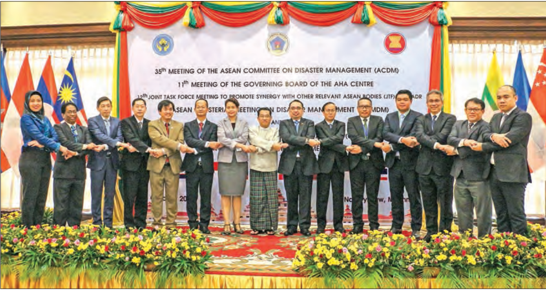
Attendees pose for a photo at the third day of the 35th Meeting of the ASEAN Committee on Disaster Management (ACDM) in Nay Pyi Taw yesterday.