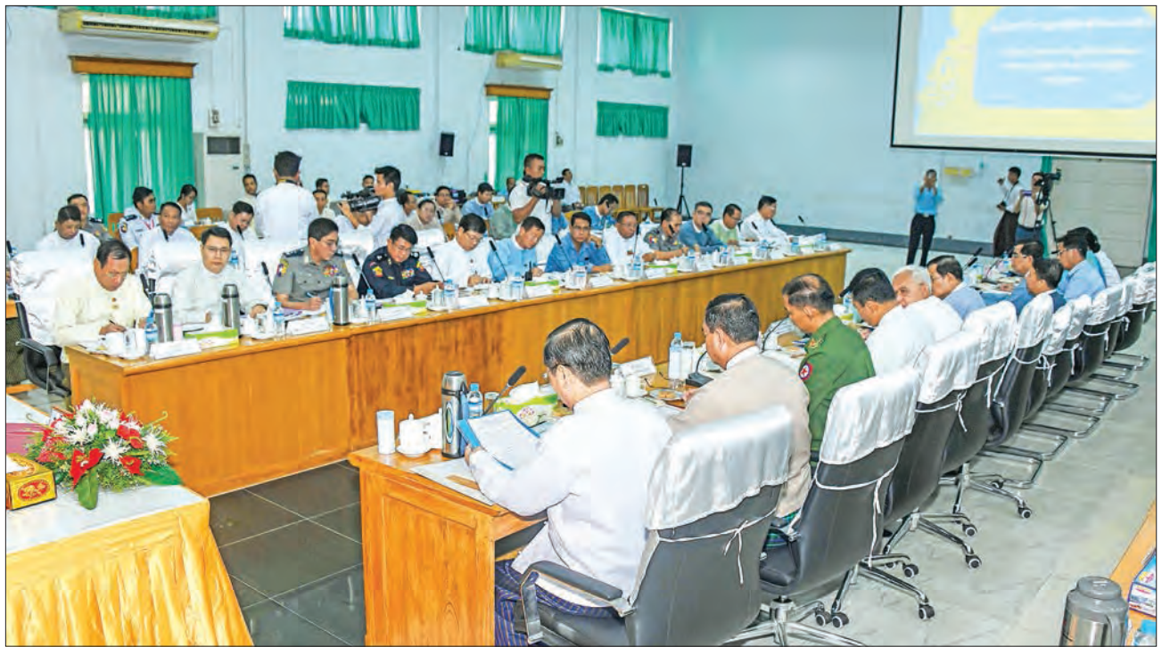
Vice President U Myint Swe addresses the coordination committee meeting for Kathina Robe Offering Ceremony at the Ministry of Religious Affairs and Culture in Nay Pyi Taw yesterday.

THE Union Government Kathina Robe Offering Ceremony Steering Committee meeting was held yesterday morning in the assembly hall of the Ministry of Religious Affairs and Culture. The meeting was addressed by Vice President U Myint Swe, patron of the steering committee.