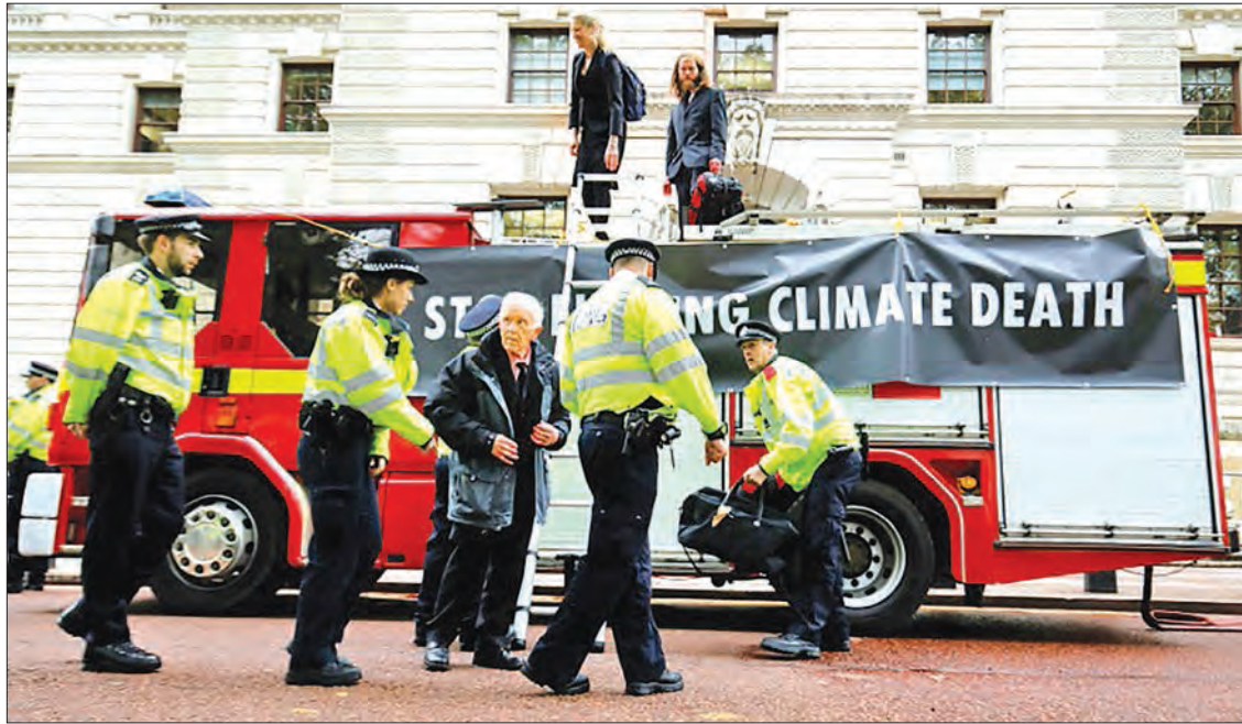
Four people were arrested on suspicion of criminal damage following the incident.

LONDON — Members of the environmental activist group Extinction Rebellion on Thursday used a decommissioned fire engine to spray fake blood over the front of Britain's finance ministry in London.