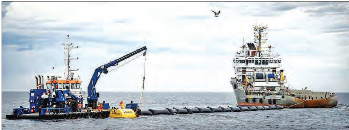
The project by The Ocean Cleanup, a Dutch non-profit group, involves a supply ship towing a floating boom that corrals marine plastic with the aim of cleaning half of the infamous patch within five years.

The system includes a tapered three-metre skirt to catch plastic floating just below the surface.—AFP ■