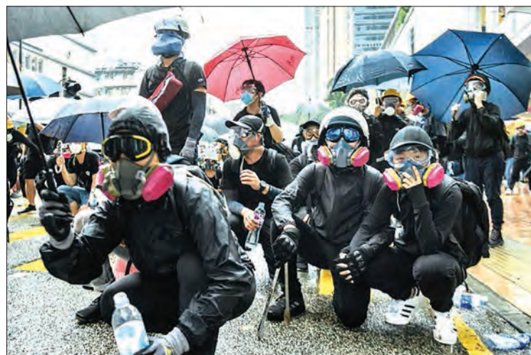
Protesters have been wearing masks to protect themselves from tear gas and hide their identities in Hong Kong.

Reports of the face mask ban lifted the Hong Kong stock market, which ended the day 0.3 per cent higher. —AFP ■