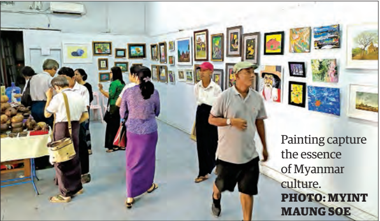
Painting capture the essence of Myanmar culture.