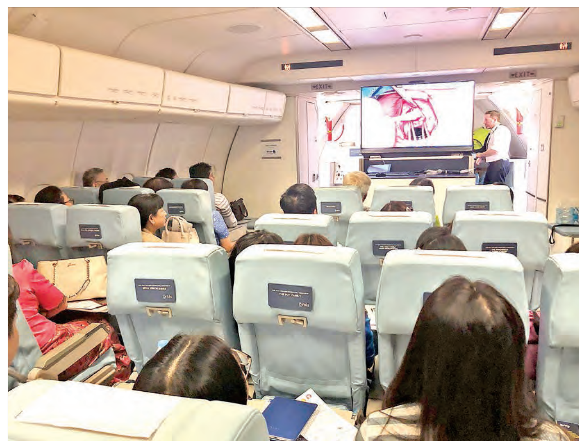
The Orbis flying hospital houses a state-of-the-art teaching facility.

trainees all boarded the Flying Eye Hospital. Security was tight from the entrance of the airport up to the airplane. We were all given ID card with straps.