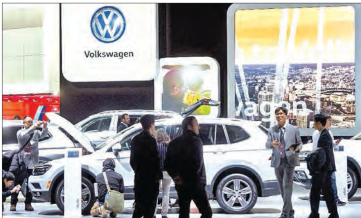
Attendees look at the the Volkswagen lineup of cars and SUVs during the 2017 North American International Auto Show in Detroit, Michigan on 9 January, 2017.

“Since the Chinese market is a key market for the German auto industry, the German auto industry has been severely damaged by US customs policy. The behavior of the USA is thus the opposite of alliance policy,” Dudenhoeffer stressed. —Xinhua ■