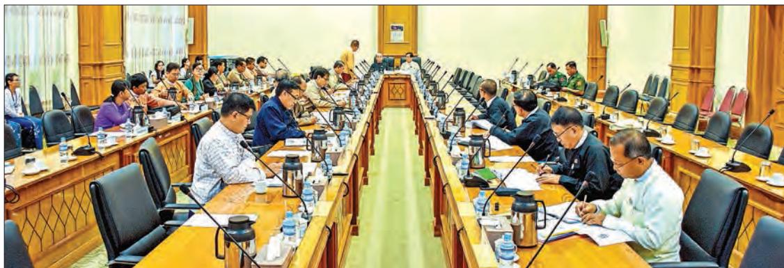
Joint Committee on Amending the 2008 Constitution meeting held in Nay Pyi Taw yesterday.

MEETING 46/2019 of the Joint Committee on Amending the 2008 Constitution was held at the Pyidaungsu Hluttaw Building D in Nay Pyi Taw yesterday morning.