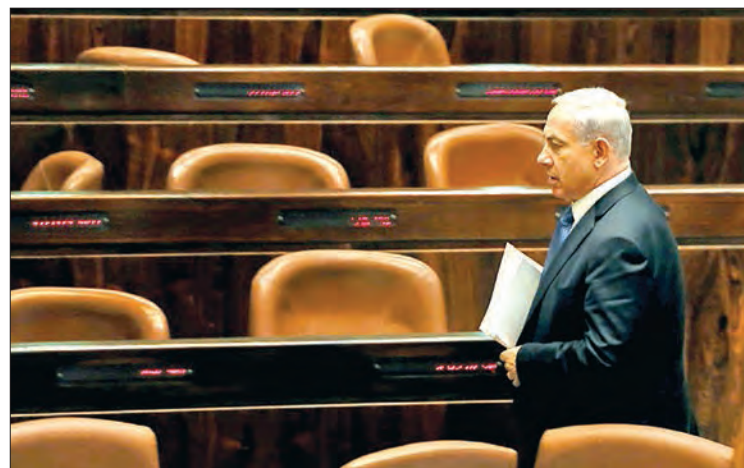
Israeli Prime Minister Benjamin Netanyahu is still scrambling to find a path to extend his long tenure in power as the new parliament elected on 17 September is set to be sworn in.

Lieberman has declined to endorse either Netanyahu or