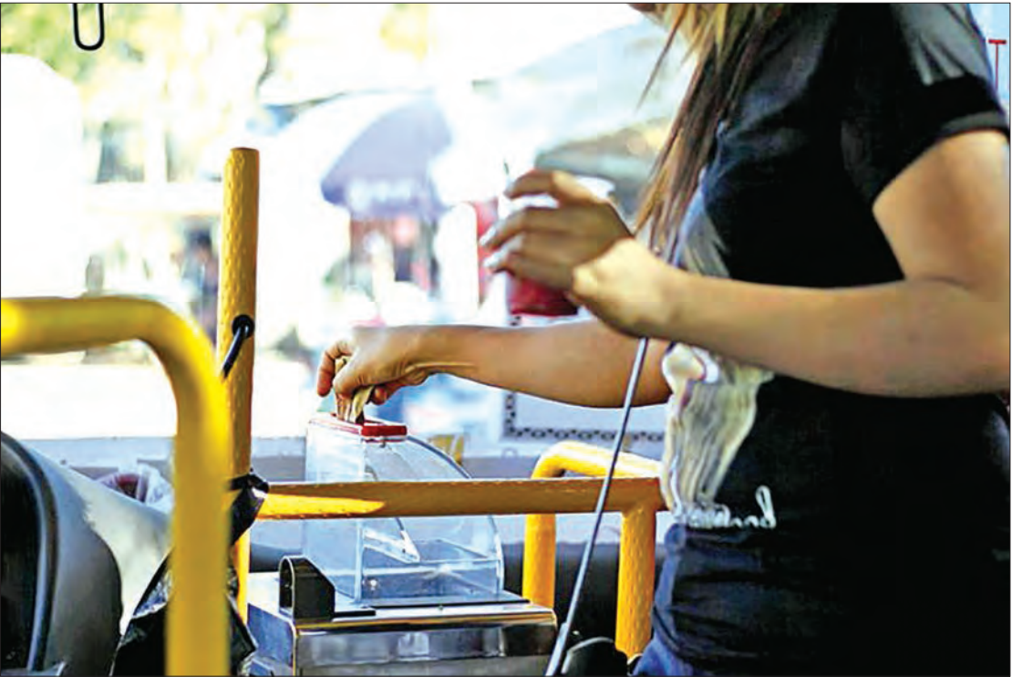
A passenger drops money into a cash box in the YBS bus in Yangon.

The YRTA will have the personal information of every single