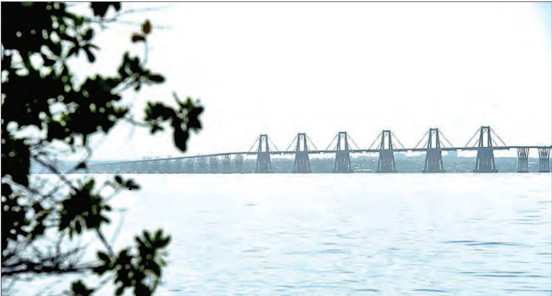
Venezuela is home to the world’s biggest proven oil reserves.

MOSCOW —Venezuela, the biggest exporter of oil in South America, Thursday announced an ambitious goal of doubling production by 2020 amid an economic crisis and US sanctions. He said Caracas would “target more than 2 million barrels a day in 2020”. In August 2019, its production amounted to 933,000 barrels per day according to official figures quoted by OPEC, down from more than two million in 2017. Venezuela is home to the largest proven oil reserves in the world. The country derives almost all its revenues from oil and plunged into crisis in 2014 during a collapse in crude prices. Caracas is also the target of a large number of US economic sanctions aimed at putting pressure on President Nicolas Maduro, including an oil embargo. Russia is a key international supporter of Venezuela and has made a number of investments in the country through the oil giant Rosneft. —AFP