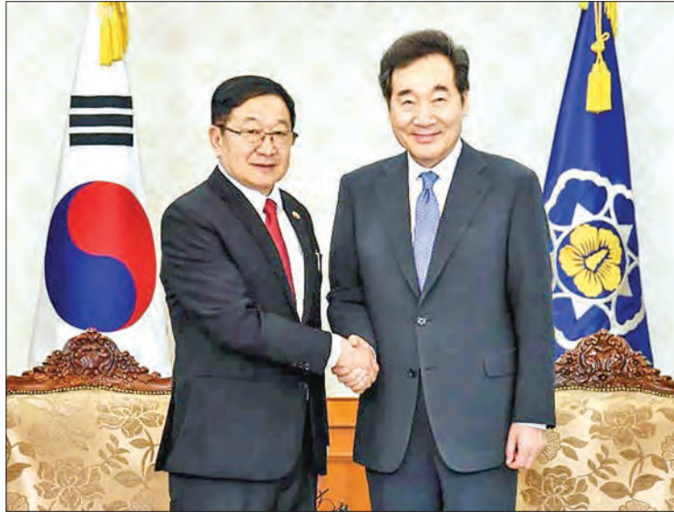
Pyithu Hluttaw Speaker U T Khun Myat (Left) shakes hands with Prime Minister of the Republic of Korea Mr Lee Nak-yon in Seoul.