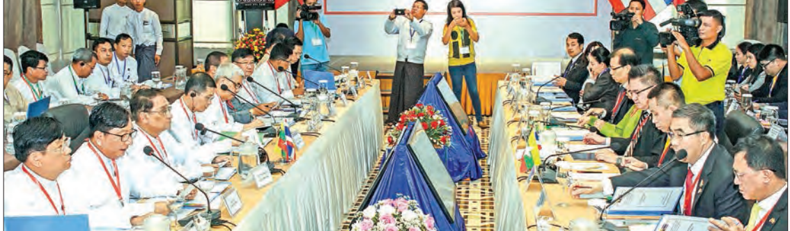
Ninth Myanmar-Thai Joint Coordinating Committee (JCC) ministerial level meeting in progress.

programs to be conducted by Myanmar and Thailand on comprehensive development of Dawei SEZ, implementation matters to conduct main project together with the preliminary project, the role and organization of special purpose vehicle (SPV) Dawei SEZ Development Co., Ltd., future works on construction of two-lane motor vehicle road and holding of Myanmar-Thai Joint High-level Committee (JHC). From the Myanmar side, Deputy Minister for Transport and Communications, Depu-