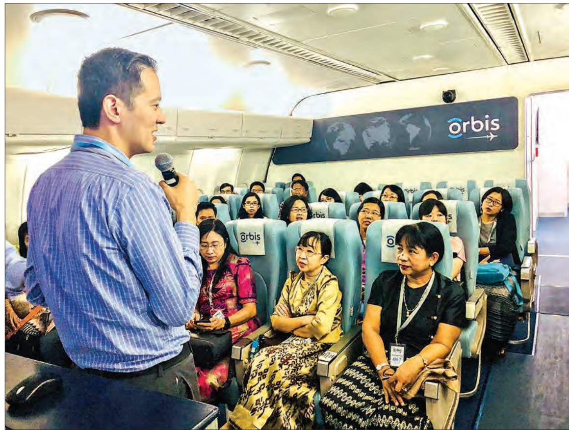
There were 38 ophthalmologists and 7 cabin crew on Orbis this time.

We received practical training for treating cataracts with a