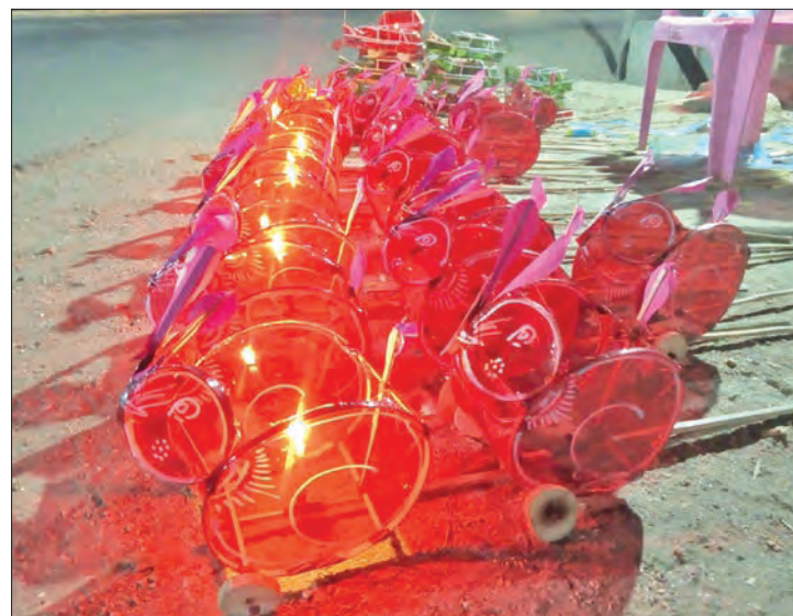
Traditional hand-made paper Lanterns.

In the 2018-2019 fiscal year, foreign investments have flowed into agriculture, livestock, manufacturing, power, transport and communications, hotels and tourism, real estate, industrial estate, and other services sectors. Under the Myanmar Investment Law, the Region and State Investment Committees are allowed to endorse local and foreign proposals, where the initial investment does not exceed K6 billion, or $5 million. This is aimed at simplifying the verification process of investment projects. ■ (Translated by Ei Myat Mon)