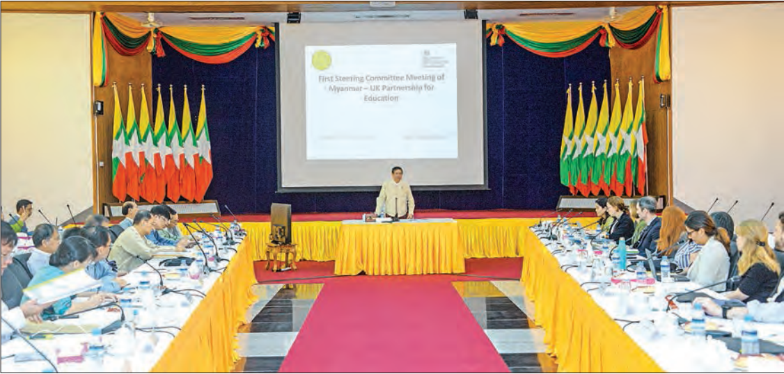
Union Minister Dr Myo Thein Gyi addresses first committee meeting of Myanmar-UK Partnership for Education (MUPE) at the Ministry of Education in Nay Pyi Taw yesterday.

the Thai side, a total of 35 people attended the meeting. —MNA (Translated by Zaw Min)