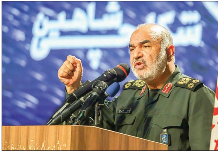
Major General Hossein Salami heads Iran's Revolutionary Guards.

The official IRNA agency also carried his remarks, but