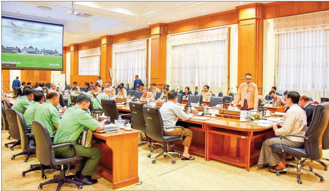
Meeting 43/2019 of the Joint Committee on Amending the 2008 Constitution held in Nay Pyi Taw yesterday.