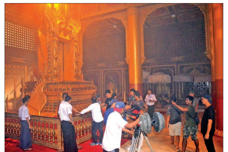
Aung San movie being shot at the National Museum on Pyay Road in Yangon yesterday.