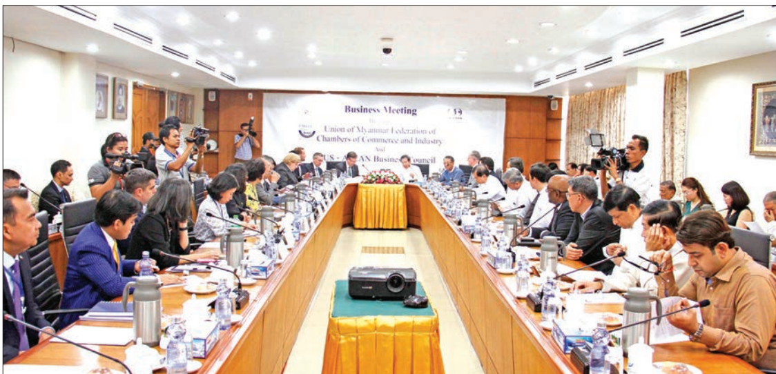
Members from Union of Myanmar Federation of Chambers of Commerce and Industry and US-ASEAN Business Council delegation hold a meeting in UMFCCI office in Yangon yesterday.

UNION of Myanmar Federation of Chambers of Commerce and Industry (UMFCCI) and US-ASEAN Business Council delegation held a meeting in UMFCCI office yesterday afternoon.