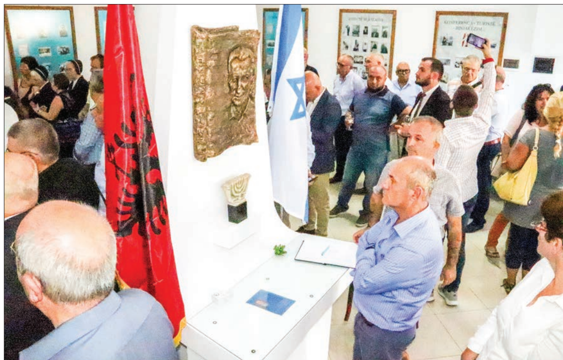
Visitors attend the opening ceremony of the renovated Solomon Jewish history museum in the Albanian city of Berat, on 29 September 2019.

They were "deeply, unimaginably humane" people, said Vrusho, whose own image, carved into a relief, now hangs in the new