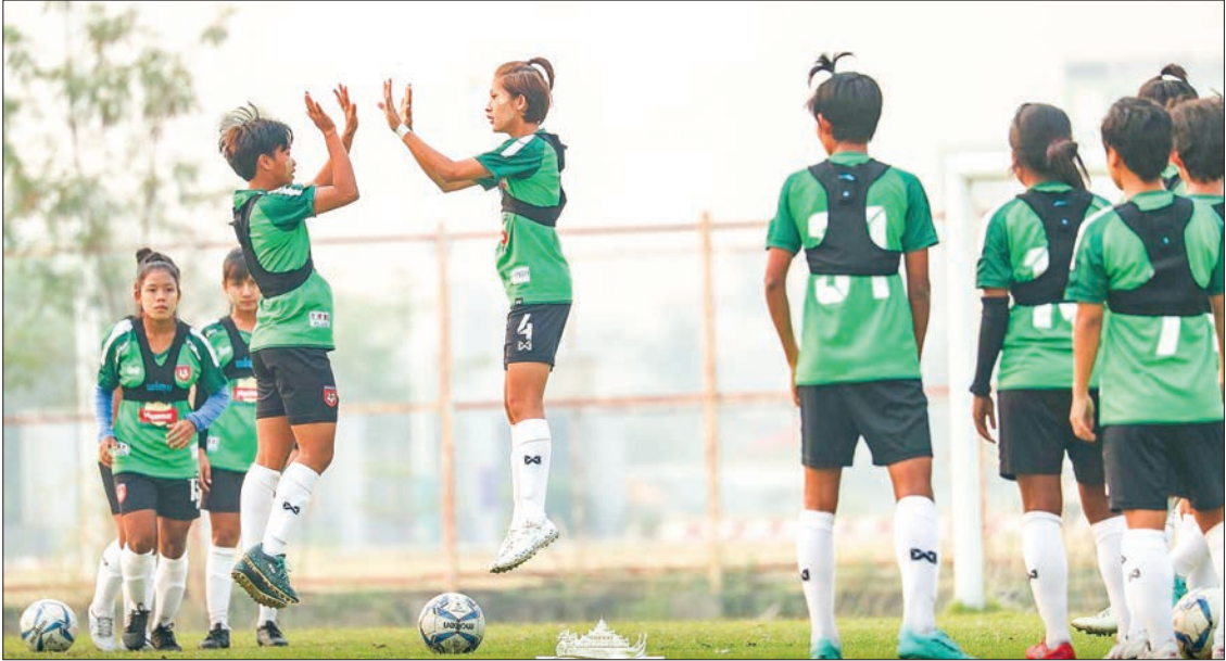
The Myanmar U-19 women’s football team will train at the Mandalay Thiri Stadium from 6 to 19 October.

For the AFC U-19 Women’s Championship 2019, Myanmar