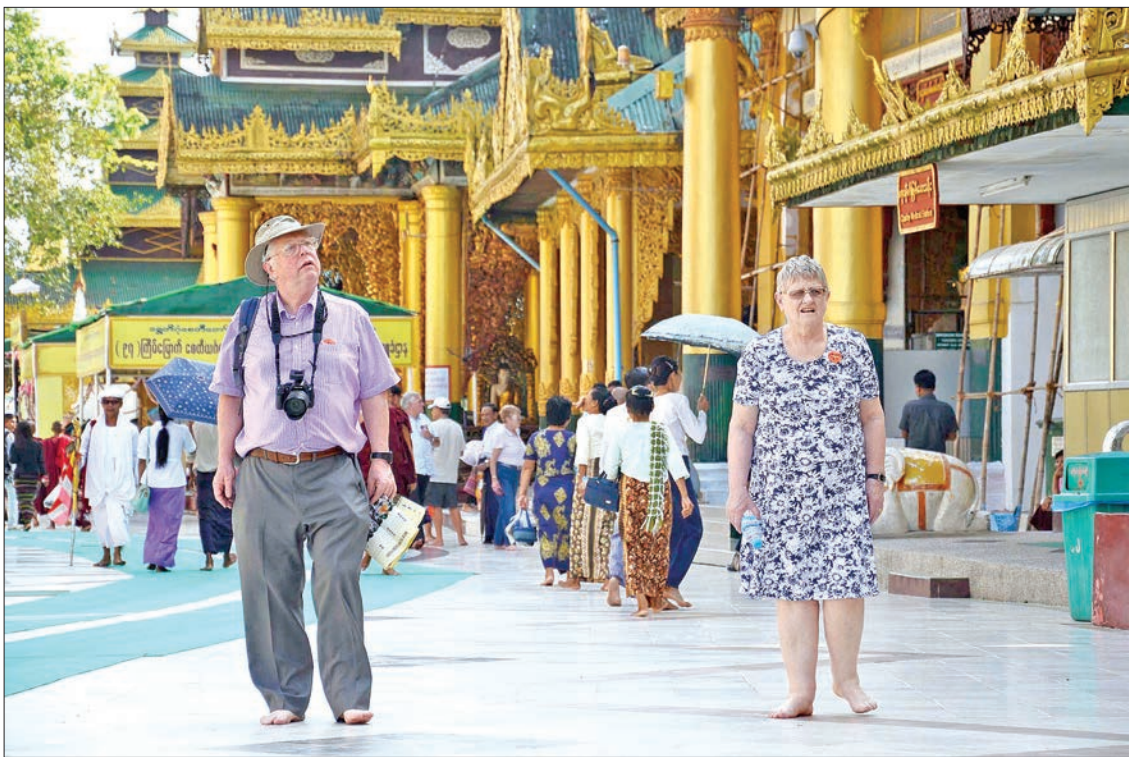
A tourist couple visiting Myanmar's national landmark Shwedagon Pagoda in Yangon.

“More than 1 million tourists enter the country per year. We