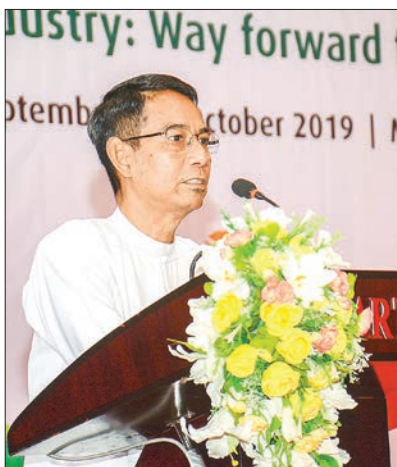
Union Minister Dr Aung Thu addresses the opening ceremony of the International Rubber Conference 2019 in Nay Pyi Taw yesterday.