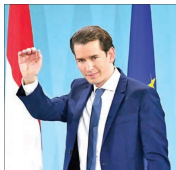
Sebastian Kurz must start looking for coalition partners.

Dejected current FPÖ leader Norbert Hofer says steps towards the "reconstruction" of the party will be announced in the coming days, while the influential Strache, who led the party for 14 years, could be expelled if the expenses allegations turn out to be true. —AFP ■