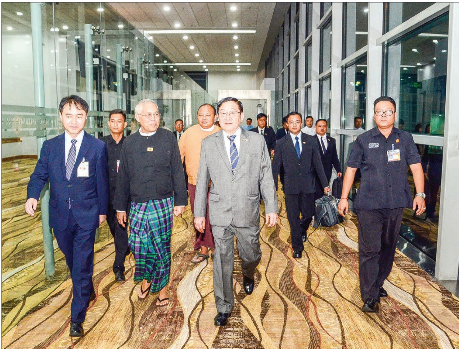
Pyithu Hluttaw Speaker U T Khun Myat seen off by dignitaries at Yangon International Airport in Yangon yesterday.

A MYANMAR Hluttaw goodwill delegation led by Pyithu Hluttaw Speaker U T Khun Myat left Yangon for the Republic of Korea at 11: 15 pm yesterday at the invitation of ROK's National Assembly Speaker Mr Moon Hee-sang.