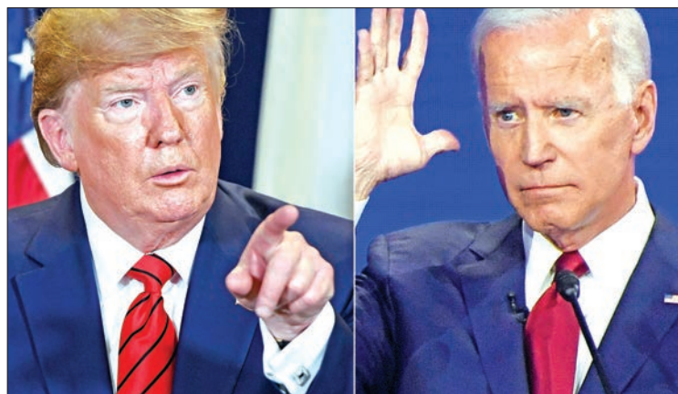
Donald Trump is accused of pressing Kiev to investigate his potential rival for the White House in 2020, Joe Biden.

"He wrote down and read terrible things, then said it was