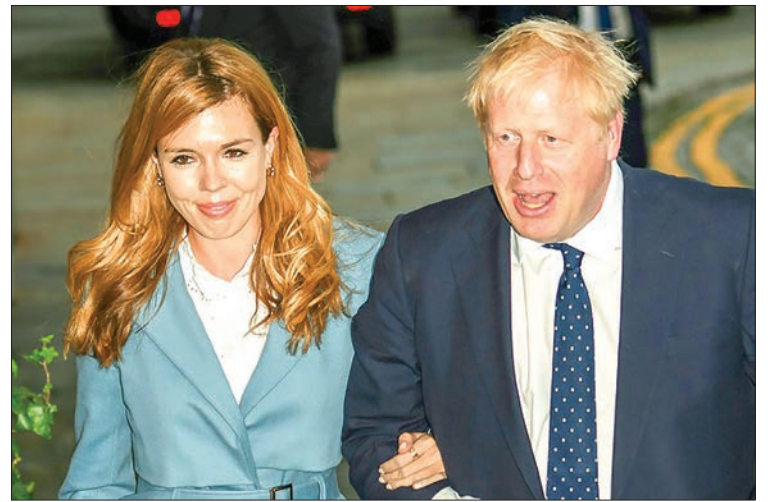
Johnson refuses to talk about his private life, including reports about his girlfriend Carrie Symonds.

It went "to the heart of this question about character and integrity of people in public life