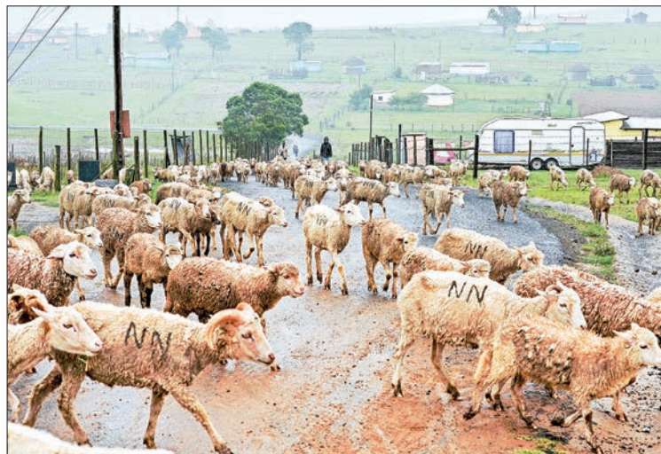
The file photo shows a shepherd boy herds sheep near South African former president Nelson Mandela's former home in Qunu on 12 December 2013.