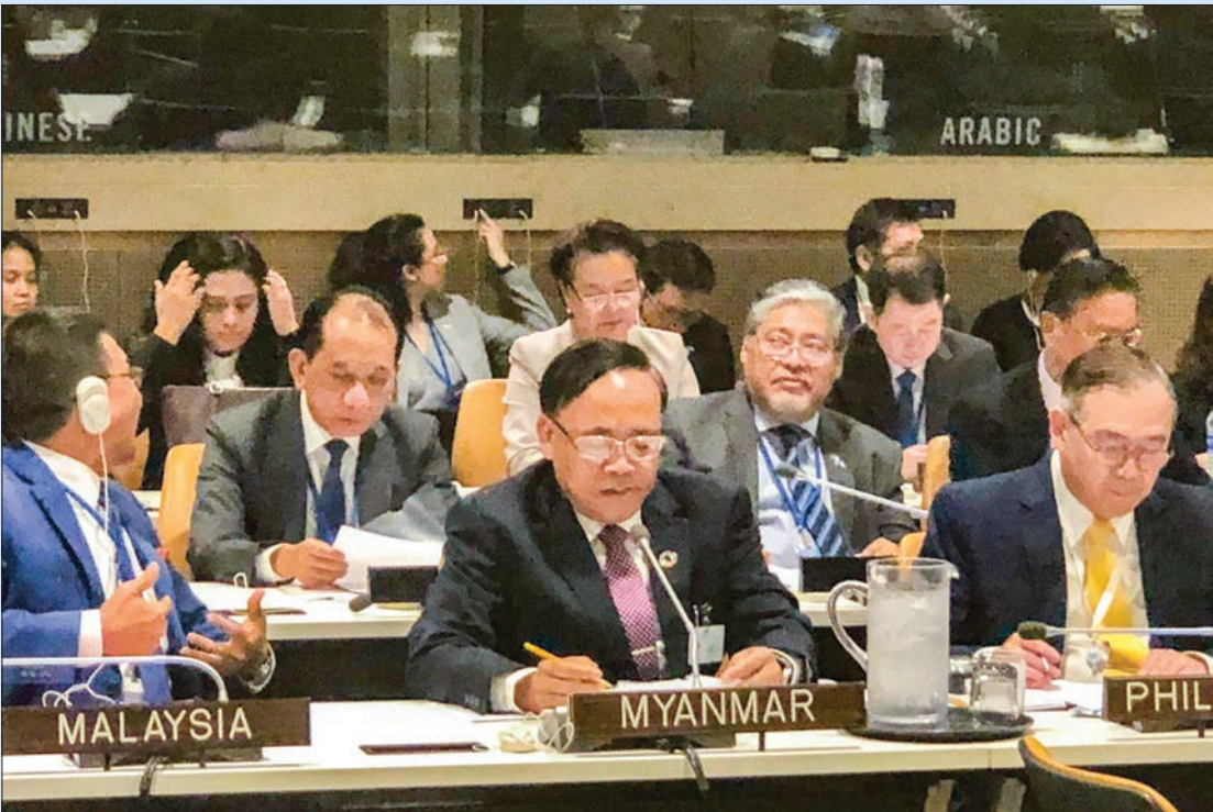
Union Minister for International Cooperation U Kyaw Tin.

He added that the meeting that ASEAN had also joined the Myanmar High-level delegation’s visit to Cox’s Bazaar to explain the displaced persons to explain about the arrangements made for their return. He assured that his work of ASEAN AHA team will not substitute but complement and reinforce the ongoing work of the UNHCR and UNDP. He also informed that ASEAN ERAT team was also present together with Myanmar officials at the reception centre