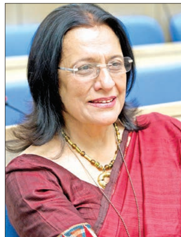
Dr Poonam Khetrapal Singh

opment Goal Agenda has now been finished. Emergency risk management proceeds apace, while the battle to eliminate diseases on the verge of elimination is being won. The drive to End TB has gathered unprecedented momentum.