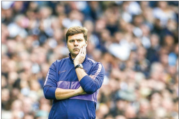
Spurs’ head coach Mauricio Pochettino has plenty to think about as his side prepare to face Bayern Munich in the Champions League on Tuesday.