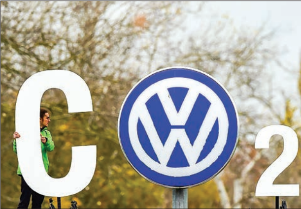
Dieselgate is now ‘part of the group’s history’.