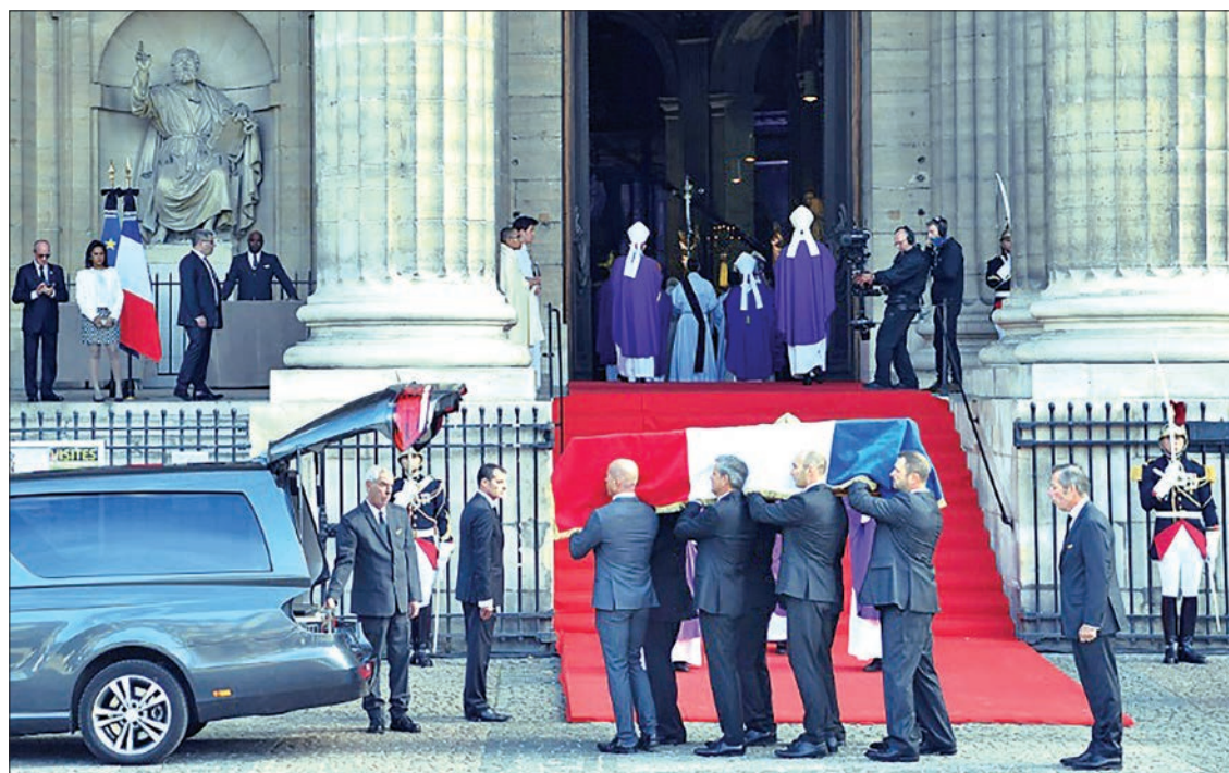
The funeral service was held at the Saint-Sulpice church in central Paris.

After a private service for his family at the Invalides memorial complex, Chirac's coffin was driven under military escort through the streets of Paris to Saint-Sulpice. Thousands of people had braved wet weather and hours of waiting Sunday to view Chirac's coffin at the Invalides military hospital and museum in