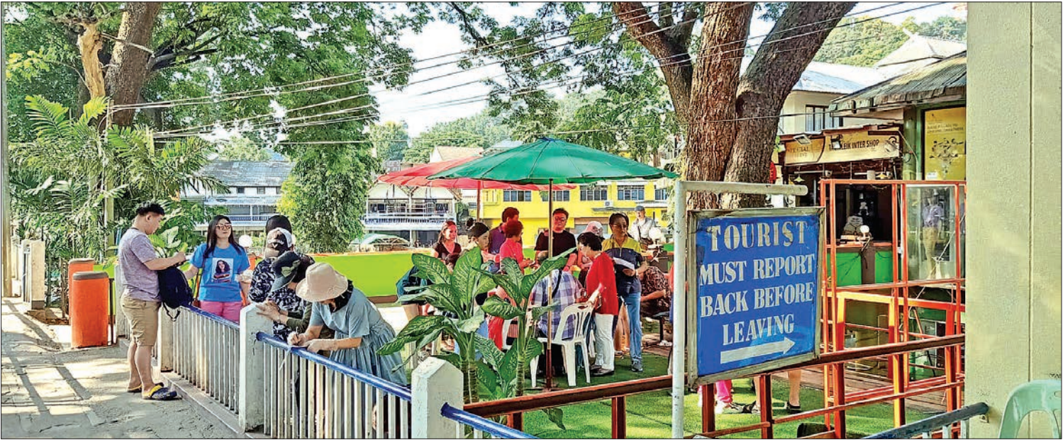
Foreign travellers are seen near a border gate in Myanmar.

THE TACHILEK border gate registered 26,322 tourist arrivals between 20 and 26 September, according to official data. Tourists entered Myanmar through the gate for day trips and overnight stays.