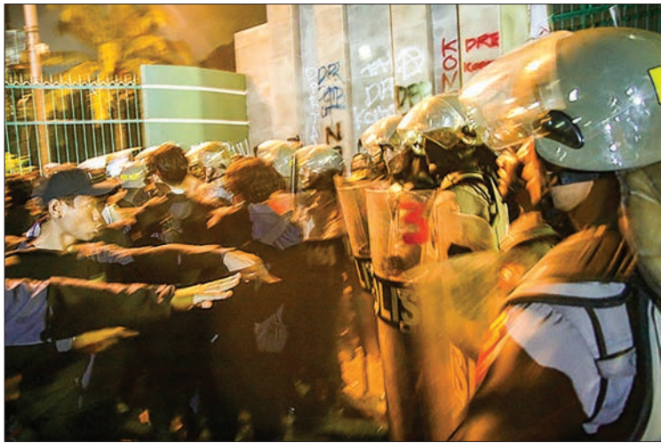
Students clash with Police as they try to enter the House of Representative building during a demonstration in Jakarta, on Monday, 23 September 2019.

The bill proposes to punish extramarital sex by up to