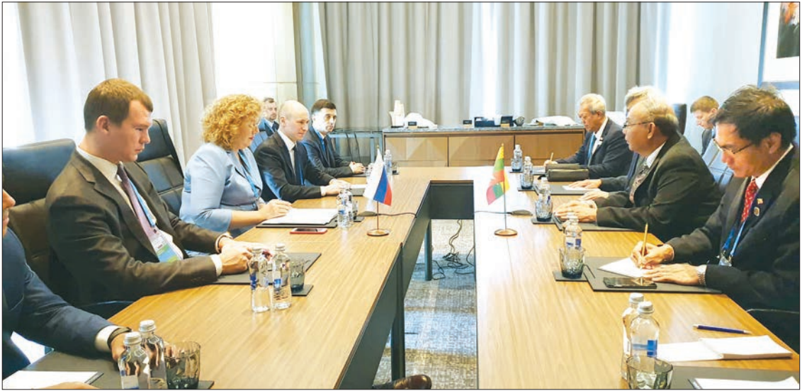
Amyotha Hluttaw Speaker Mahn Win Khaing Than meets with the Deputy Chairman of the State Duma, Ms Olga Yepifanova on 23 September.

the attending delegation leaders delivered their addresses during the Plenary Session.