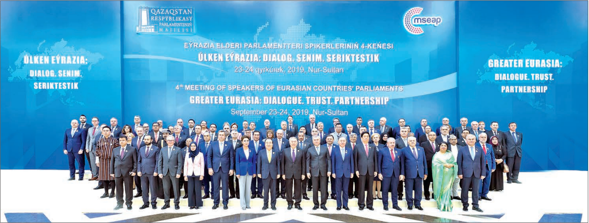
Amyotha Hluttaw Speaker Mahn Win Khaing Than and attendees pose for a documentary photo at the 4 th Meeting of Speakers of Eurasian Countries' Parliaments in Nur-Sultan.