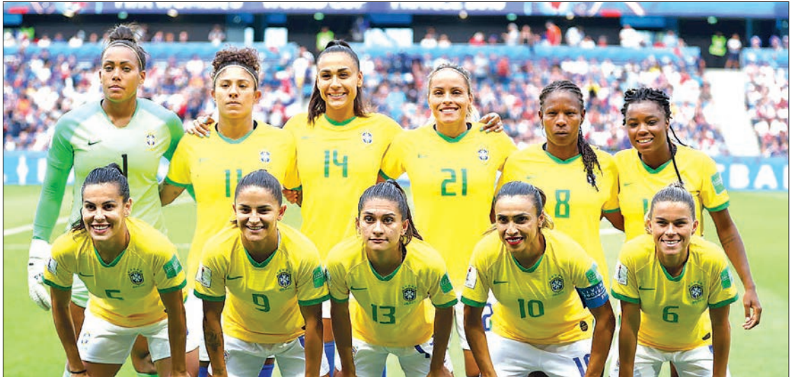
The Brazil women's national football team pose for a group photo at an international football match.

The competition with world class teams will help prepare team Myanmar for the upcoming 2019 South East Asian Games,