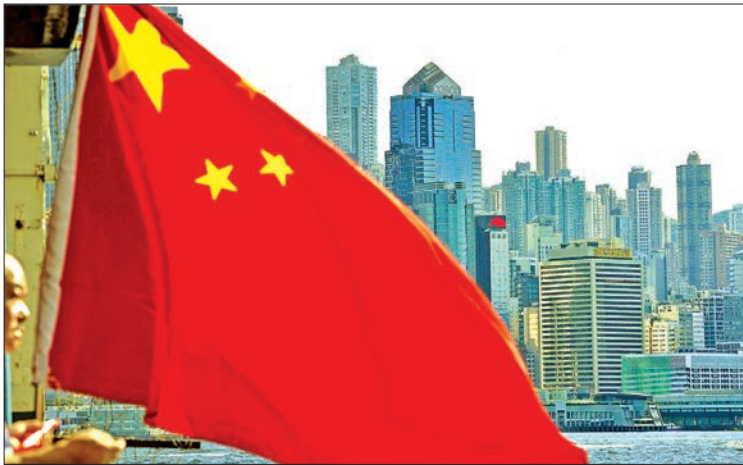
A Chinese flag flies in Hong Kong.

“This act confuses black and white in disregard of facts,” Chi-