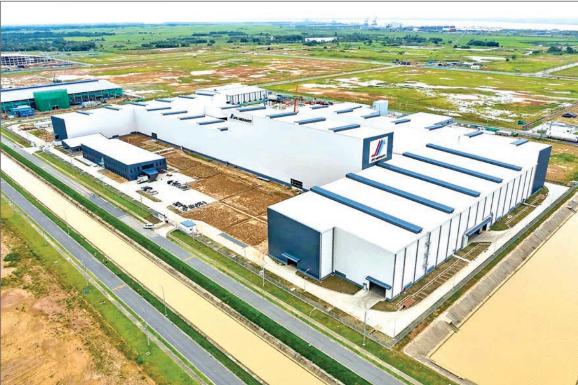
Photo shows JFE Meranti Myanmar (JMM) factory in Thilawa Special Economic Zone.

expected to generate about 500 jobs, depending on the demand for products. JMM was founded in 2017 as a joint venture between JFE Steel, Meranti Steel, JFE Shoji, Marubeni-Itochu, and HANWA. The joint venture has received a total investment of US$85 million.—Zarni Maung ■ (Translated by GNLM)