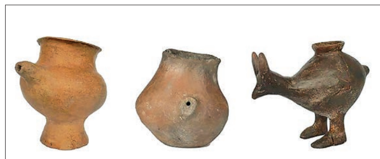
The bottles unearthed in prehistoric children's graves were used to wean infants, experts believe.