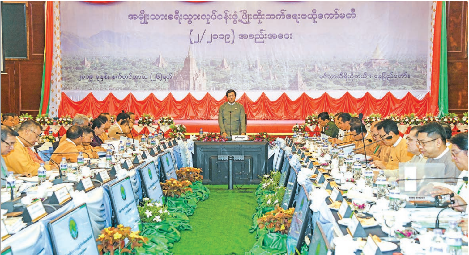
Vice President U Henry Van Thio addresses the meeting of National Tourism Development Central (NTDC) Committee at Mingala Thiri Hotel, Nay Pyi Taw yesterday.

Tourism has established the Myanmar Tourism Master Plan 2013-2020 as a guide to future works. It was learnt that the ministry was cooperating with the World Tourism Organization and development partner organization Luxembourg Development Agency to draw up projects for the 2020 to 2025 period. Tourism required cooperation with all sectors and cooperation between private entities and relevant departments was required. State/Region governments were also learnt to be coordinating and drawing up region wise tourism master projects that would increase local participation.