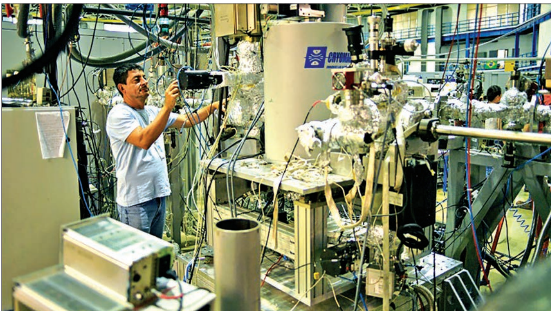
A man works on a particle accelerator at the Sirius campus.

So far, the LNLS has received only 30 per cent of the funds for this year from the Ministry of Science and Technology. Funding for scientific research was squeezed under previous governments, but the cuts have deepened since President Jair Bolsonaro took power in January and the future money flow for Sirius is in doubt.—AFP