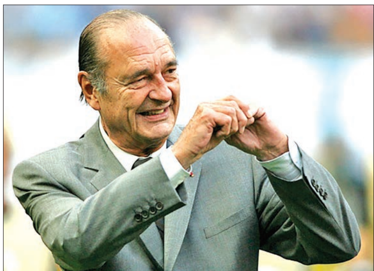
A file photo dated 15 May, 2007 shows that former French President Jacques Chirac gestures before his handover ceremony in Paris, France.