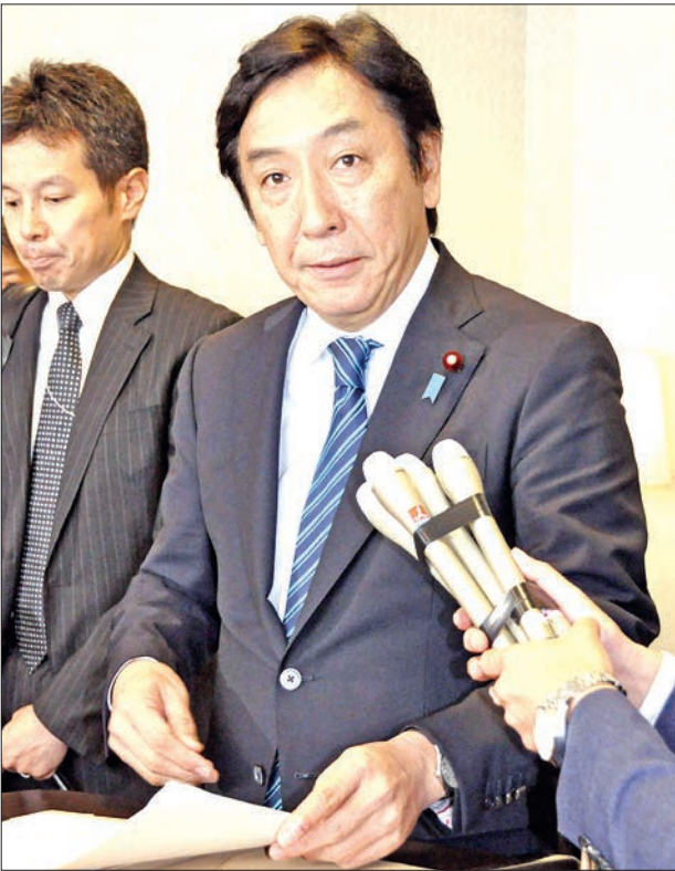
Economy, Trade and Industry Minister Isshu Sugawara.

“Every (Japanese) automaker continues to make efforts to be the best