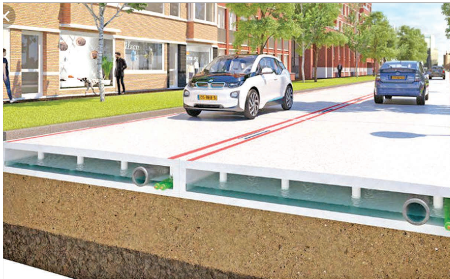
A process that creates plastic pellets from bottles and bags and melts them into asphalt makes for stronger roads and less waste.

tions are some what spared from the dangers of the toxic gases. The asphalt concrete roads are more durable and smoother than the tarred roads. Thus asphalt concrete roads are more environmentally friendly and are of better quality than the tarred roads.