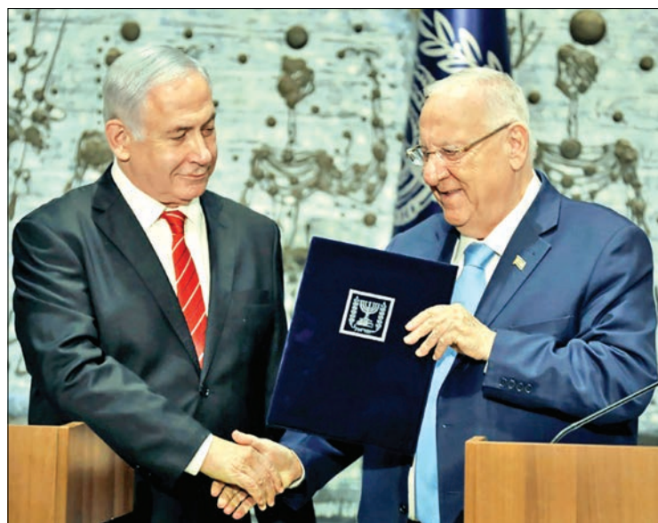
Israeli President Reuven Rivlin gives veteran incumbent Benjamin Netanyahu the potentially impossible task of forming a majority coalition while battling the looming threat of corruption charges.

When accepting the mandate, Netanyahu again called on his main opponent Benny