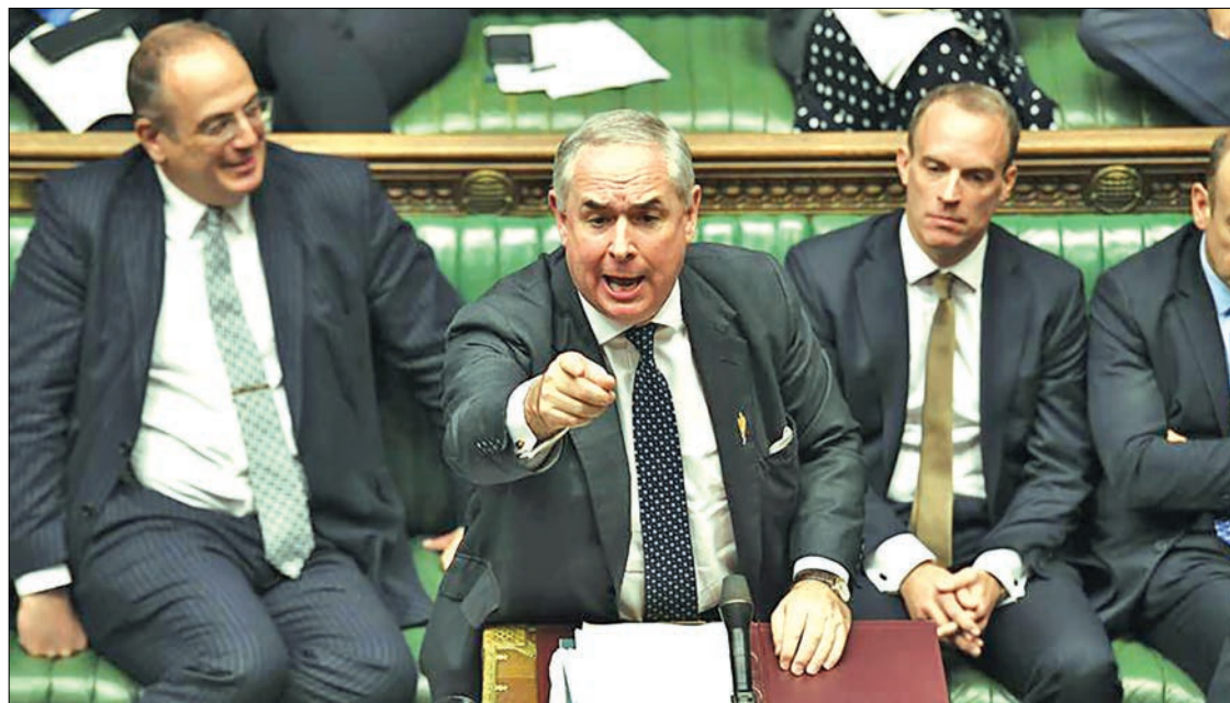
Britain's Attorney General Geoffrey Cox (Front) speaks at the House of Commons in London, Britain, on 25 September, 2019.

He said: "I think the (Supreme) court was wrong to pro-