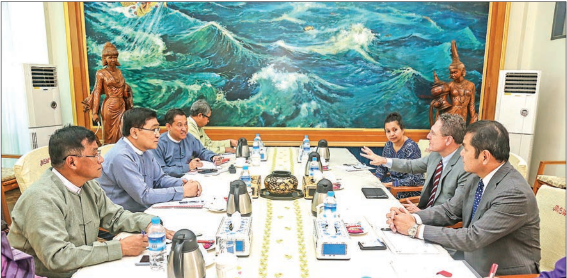
Union Minister Dr Win Myat Aye holds talks with guests in Nay Pyi Taw yesterday.