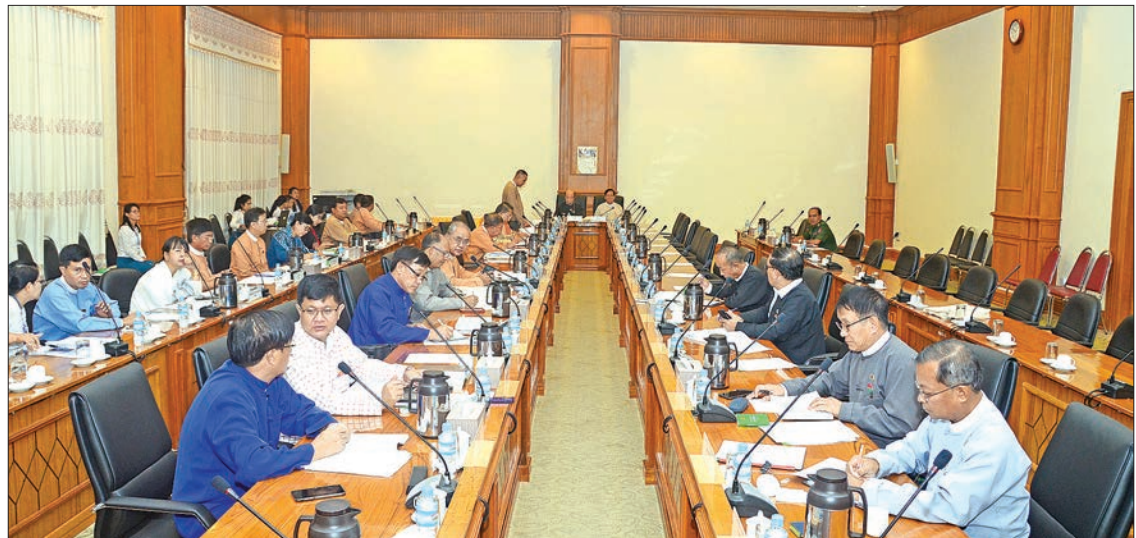
Meeting 41/2019 of Joint Committee on Amending the 2008 Constitution held in Nay Pyi Taw yesterday.

MEETING 41/2019 of the Joint Committee on Amending the 2008 Constitution was held at Pyidaungsu Hluttaw Building D in Nay Pyi Taw yesterday morning.