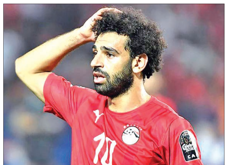
Salah hinted at his disappointment through his social media activity.

The statement released late Tuesday said the association had sent its votes officially to FIFA on August 15 and they were registered on August 19.—AFP ■