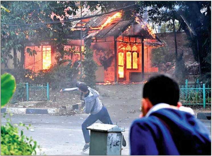
A building goes up in flames in Jakarta as a protester hurls rocks at police during violent demonstrations against the government’s proposed change to the criminal code.

There has also been a backlash against a separate bill that critics fear would dilute the powers of Indonesia’s corruption-fighting agency — known as the KPK — including its ability to wire-tap graft suspects.—AFP ■