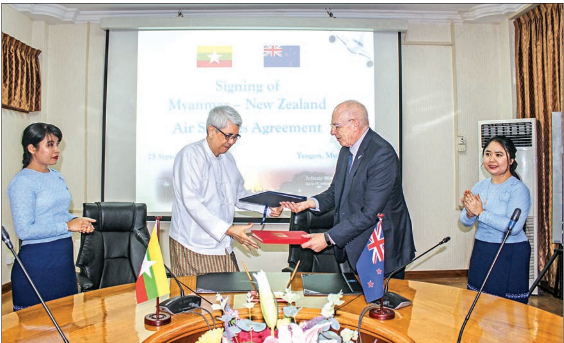
Deputy Minister U Kyaw Myo and Ambassador of New Zealand Mr Stephen Marshall participate in a signing ceremony for exchange of notes for air services between Myanmar and New Zealand in Yangon.

by U Kyaw Myo, Deputy Minister for Transport and Communications and Mr Stephen Marshall, Ambassador of New Zealand to Myanmar. The signing ceremony held at the DCA in Yangon was also attended by officials from the DCA and the Embassy of New Zealand in Yangon, and representatives from Myanmar National Airlines and Myanmar Airways International.—MNA ■ (Translated by GNLM)