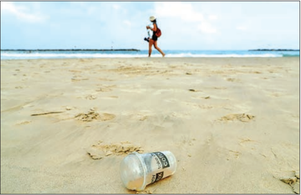
Waste litters beaches all over the world, but one South Korean mayor found there wasn’t enough on his local coastline, so he trucked in a tonne of rubbish for volunteers to pick up.

“We brought in waste styrofoam and other coastal trash gathered from nearby areas so the 600 participants could carry out clean-