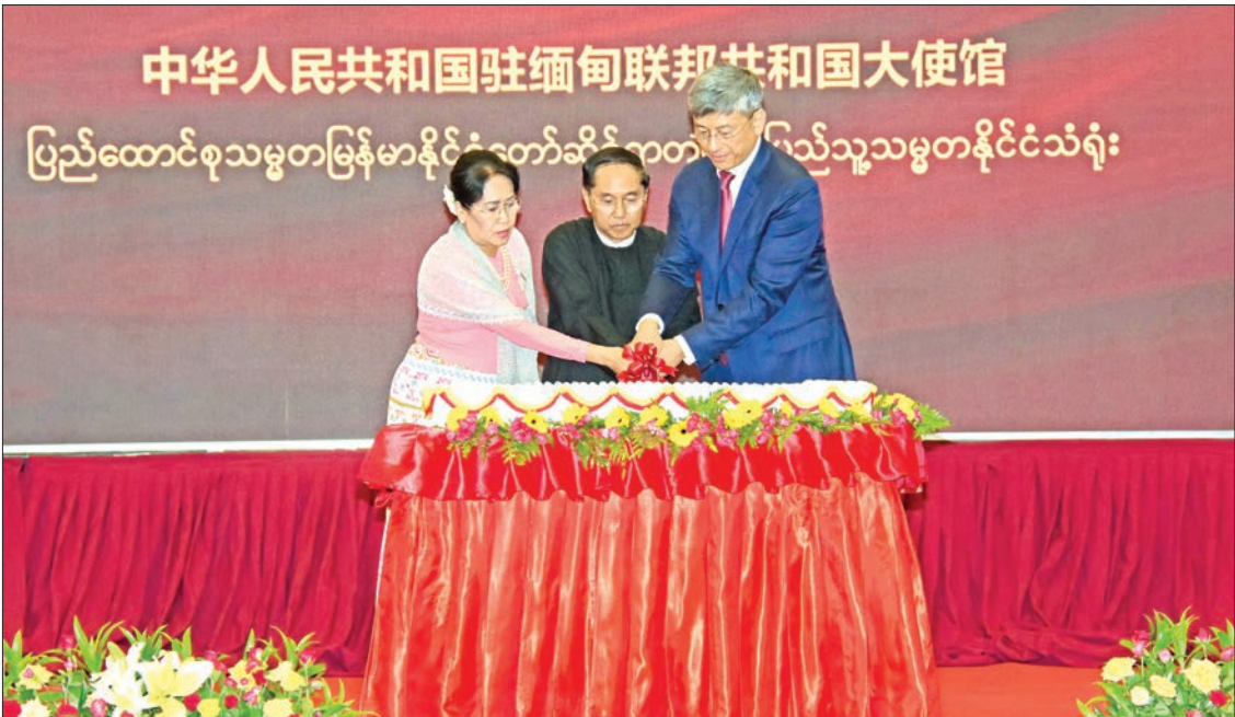
Vice President U Myint Swe and wife, and Chinese Ambassador Mr Chen Hai cut commemorative cake at the event to mark the 70 th Founding of the People's Republic of China yesterday.

State Counsellor Daw Aung San Suu Kyi attended the Second Belt and Road Forum for International Cooperation held in Beijing in April 2019. The forum raised the existing friendly bilateral relations to the next level and created opportunities to raise cooperation even further. Through signing of three agreements "Economic and Technical Cooperation Agreement," "China-Myanmar Economic Corridor Cooperation Plan (2019-2030)" and "Agreement on Formulation of the Five-Year Development Program for Economic and Trade Cooperation" the momentum of bilateral cooperation has been raised further.