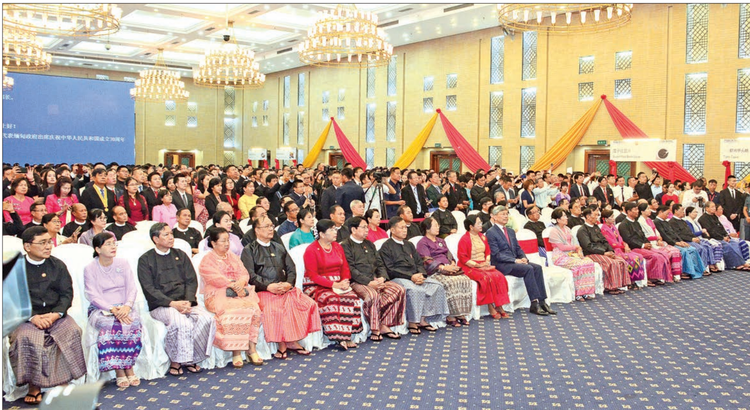
Vice President U Myint Swe delivers the speech at reception to mark the 70 th Anniversary of the Founding of the People's Republic of China (PRC) at Myanmar International Convention Center-II in Nay Pyi Taw yesterday.

it was an honor to see the rapid social and economic developments of the PRC. Furthermore due to the efforts made during the past 70 years, more than 700 million of PRC's population was freed from poverty. It has now become a country with the most rapid economic development in the world and had become the second biggest economically powerful country in the world. It was seen happily as the most successful country. During these years the PRC's economy developed significantly.