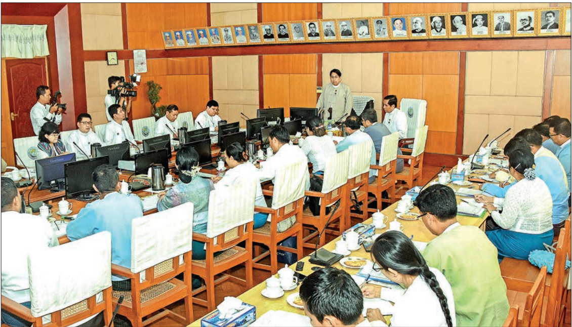
Union Minister for Information Dr Pe Myint delivers the speech at the meeting with the heads of the Information and Public Relations Department from the states and regions in Nay Pyi Taw yesterday.