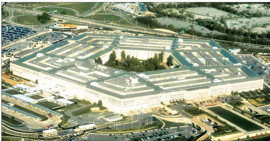
The Pentagon says it has a “multi-level approach” to weed out recruits with potential far-right sympathies, but the task is complex.

“There is a renewed effort within part of the white supremacist world to focus on the military because they have such valuable skills,” he added, pointing to Smith’s case. The links between the far-right and the US armed forces first came to light in the 1980s when Vietnam veteran Louis Beam came home, joined the Ku Klux Klan and had links to the Order, an underground neo-Nazi group that called for the overthrow of the US government.—AFP ■