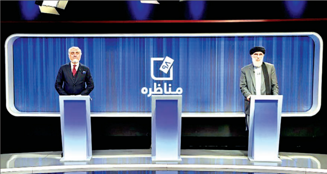
Afghan presidential candidates Abdullah Abdullah (left) and Gulbuddin Hekmatyar take part in a presidential debate at Tolo News TV station in Kabul. Current President Ashraf Ghani faced derision when he declined to participate.

Both claimed victory in the 2014 election — a vote so tainted by fraud and violence that it led to a constitutional crisis and forced then-US President Barack Obama to push for a compromise that saw Abdullah awarded the subordinate role.—AFP ■