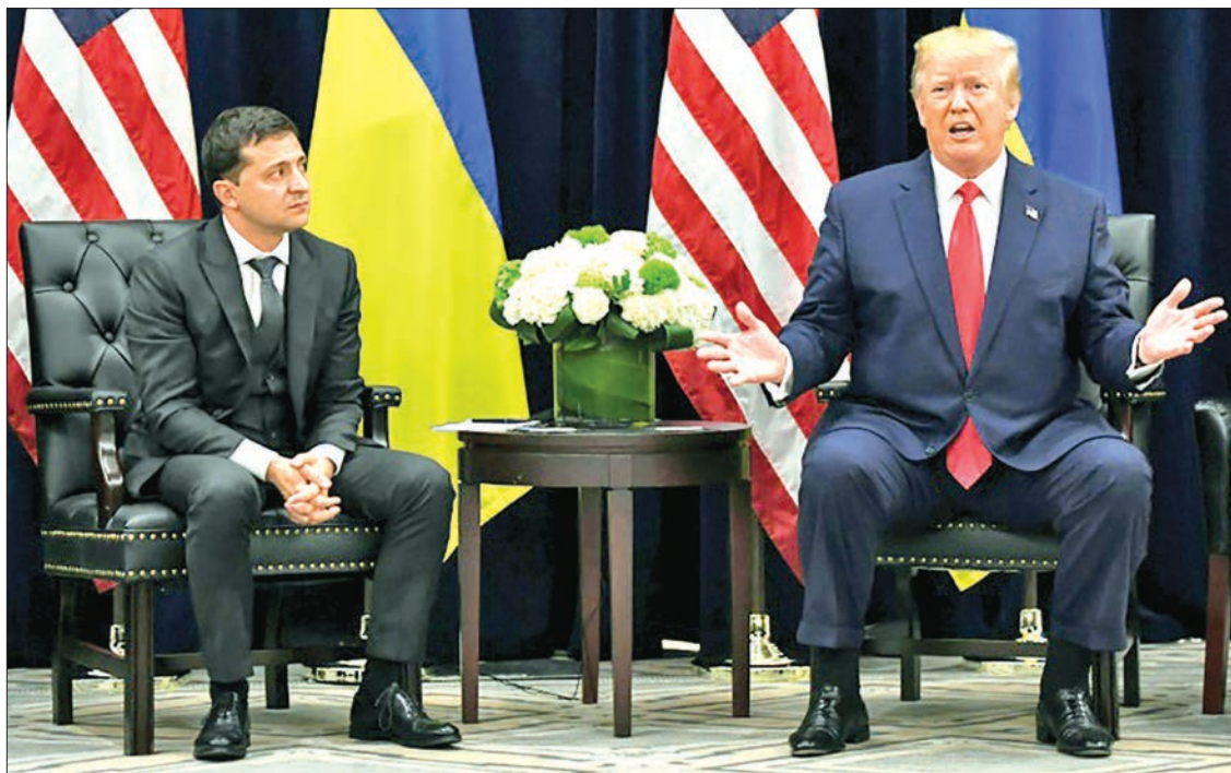
US President Donald Trump insisted he exerted “no pressure” on Kiev — a claim echoed by Ukrainian leader Volodymyr Zelensky, who appeared side-by-side with Trump at a long-planned meeting on the sidelines of the UN General Assembly.

Top Democratic Senator Chuck Schumer told reporters the complaint was “very troubling” — an assessment echoed by Republican Senator Ben Sasse, who said that “there’s obviously lots that’s very troubling