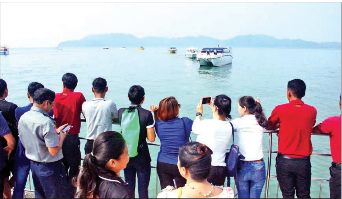
Travellers visit with boats along Kawthoung’s spectacular stretch of coast. PHOTO: KYAW SOE (KWATHOUNG)

There are 30 untouched islands featured in the archipelago trips in Kawthoung District. Of them, visitors can make day trips