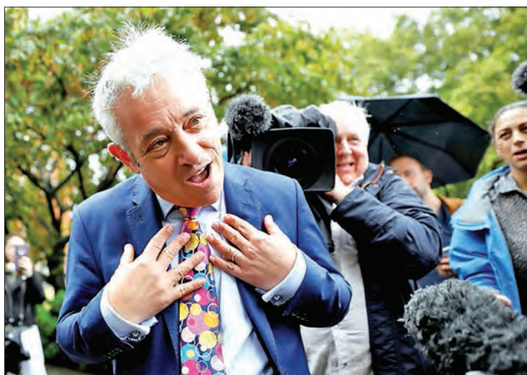
Speaker of the House of Commons John Bercow announcing that parliament will return to work on Wednesday.

The judgement has hit Johnson's authority, prompting calls for his resignation and cast further doubt on his promise to pull Britain out of the EU on October 31, come what may. The Conservative leader landed back in London at around 10:30am (0930 GMT) after his trip to New York, heading straight into a political maelstrom triggered by Tuesday's damning court ruling that his decision to suspend parliament for five weeks was unlawful. Britain's right-wing tabloids reacted angrily to the ruling, with The Sun saying it