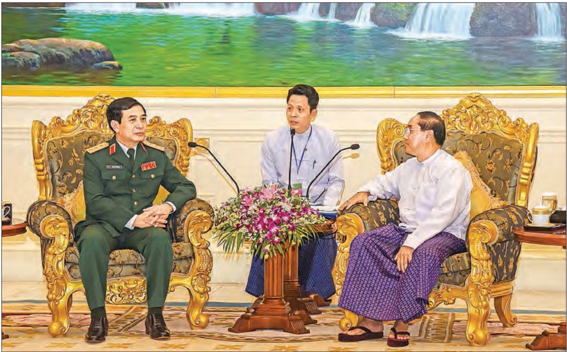
Vice President U Myint Swe meets with Senior Lieutenant General Phan Van Giang, the Chief of the General Staff of the Viet Nam People's Army in Nay Pyi Taw yesterday.