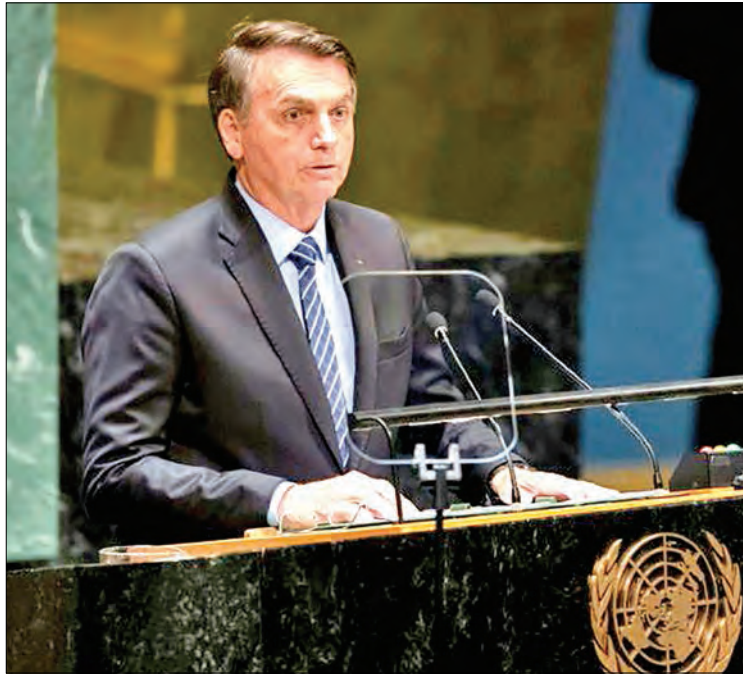
Jair Bolsonaro, President of Brazil, tells the UN General Assembly that the Amazon rainforest is sovereign territory.

UNITED NATIONS—Brazil’s President Jair Bolsonaro said Tuesday it was a lie that the Amazon was being devastated by fire and accused countries critical of him of having a “colonialist spirit.” Speaking first at this year’s UN General Assembly, the far-right leader also heaped praise on