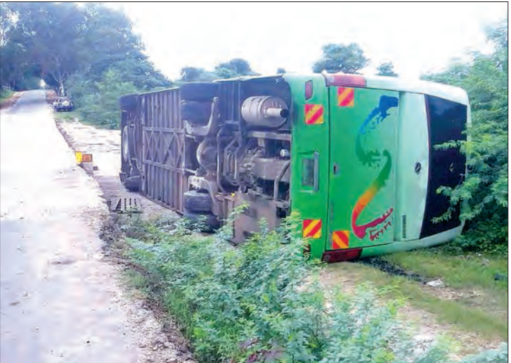
A passenger bus carrying 45 passengers turned over in Mahlaing Township.

A PASSENGER bus over-turned on the morning of 25 September near Thapyaypin village in Mahlaing Township after the driver lost control of the vehicle while trying to avoid a head-on collision with a car. Thirteen passen-gers were injured in the ac-cident.