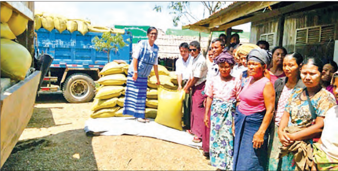
Officials from Disaster Management Department distribute rice bags to displaced people at IDP camps in MraukU Township, Rakhine State.

Myothit, Aung Tat Ward. The officials also went to Tein Nyo Village and provided 852.5 bags of rice for one month to 2,842 displaced people of 712 households at the village's IDP camp.—MraukU (IPRD) ■ (Translated by Kyaw Zin Tun)