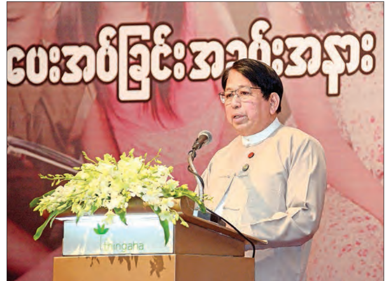
Union Minister for Information Dr Pe Myint delivers the speech at the handover ceremony in Nay Pyi Taw yesterday.

The State Counsellor and the attendees posed for documentary photos before closing the ceremony. After greeting those present at the ceremony, they looked around the displays of documentary photos about inauguration ceremonies of community centres, their