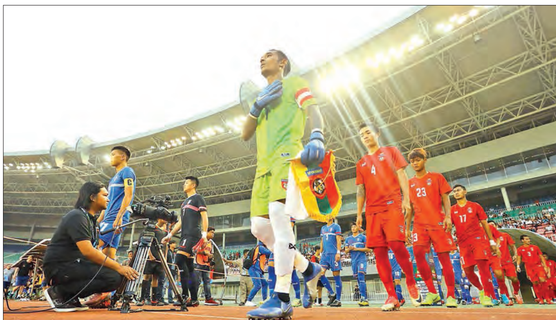
The Myanmar national team (right side) walk into the Mandalay Thiri Football Stadium on 19 March before a FIFA friendly match against Chinese Taipei.

their special training session on 25 September and will leave for Kyrgyzstan next month. Myanmar have met Kyrgyzstan twice