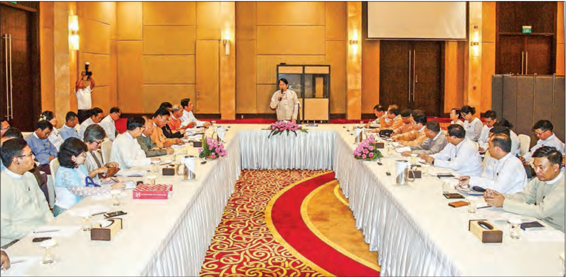
Union Minister for Information Dr Pe Myint addresses the meeting on development of community centers in Nay Pyi Taw yesterday.

Foundation. At the meeting, they discussed community based mobile libraries, computer courses, children’s reading rooms, mini museums, public talks, reading sessions and contests which are conducted in collaboration with Daw Khin Kyi Foundation. They also discussed funds for the activities.—MNA ■(Translated by Alphonsus)