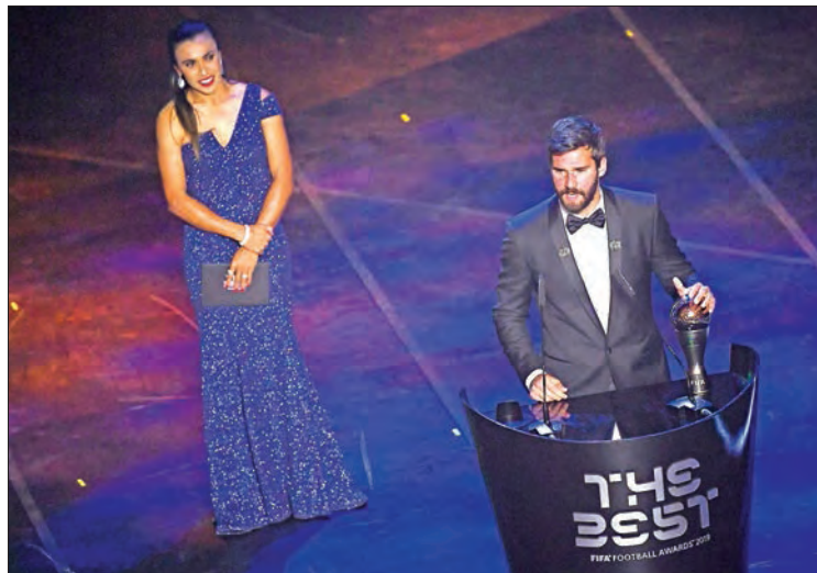
Liverpool's Alisson Becker is nearing a return from a calf injury.

"Before that happens we would prevent any of our players turning out for the national side."—AFP ■