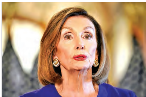
Nancy Pelosi, the speaker of the US House of Representatives, had resisted calls for Donald Trump’s impeachment for months, preferring to focus on the 2020 election.

WASHINGTON—Top US Democrat Nancy Pelosi Tuesday announced the opening of a formal impeachment inquiry into Pres-