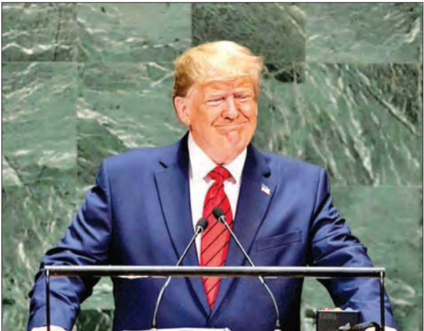
President Donald Trump used his UN address to hit out at China's trade 'abuses'.

The dollar steadied versus the euro and yen amid renewed trade fears as Trump adopted a hard line on China. The pound meanwhile dropped as British MPs returned to parliament one day after a momentous Supreme Court ruling that Prime Minister Boris Johnson's decision to suspend parliament ahead of Brexit was unlawful. "Markets have taken a bit of tumble on fears US president Trump could be impeached, while the (UK) drama... is just as intoxicating as the Brexit