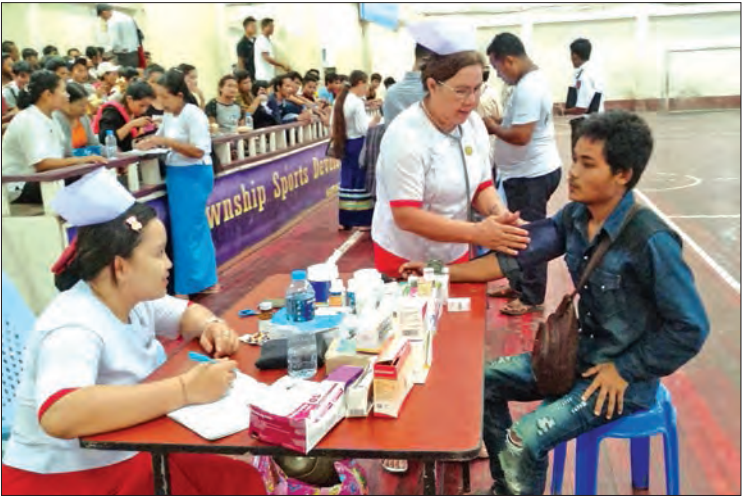
Township Public Health Department staff provide healthcare to the workers in Kawthoung.