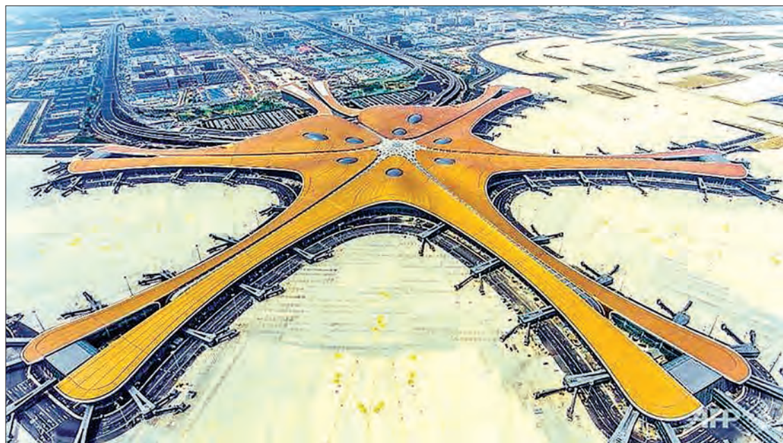
The terminal of the new Beijing Daxing International Airport.

BEIJING—Chinese President Xi Jinping on Wednesday announced the official opening of the Beijing Daxing International Airport. Xi, also general secretary of the Communist Party of China Central Committee and chairman of the Central Military Commission, attended the operation ceremony of the airport on Wednesday morning.—Xinhua ■