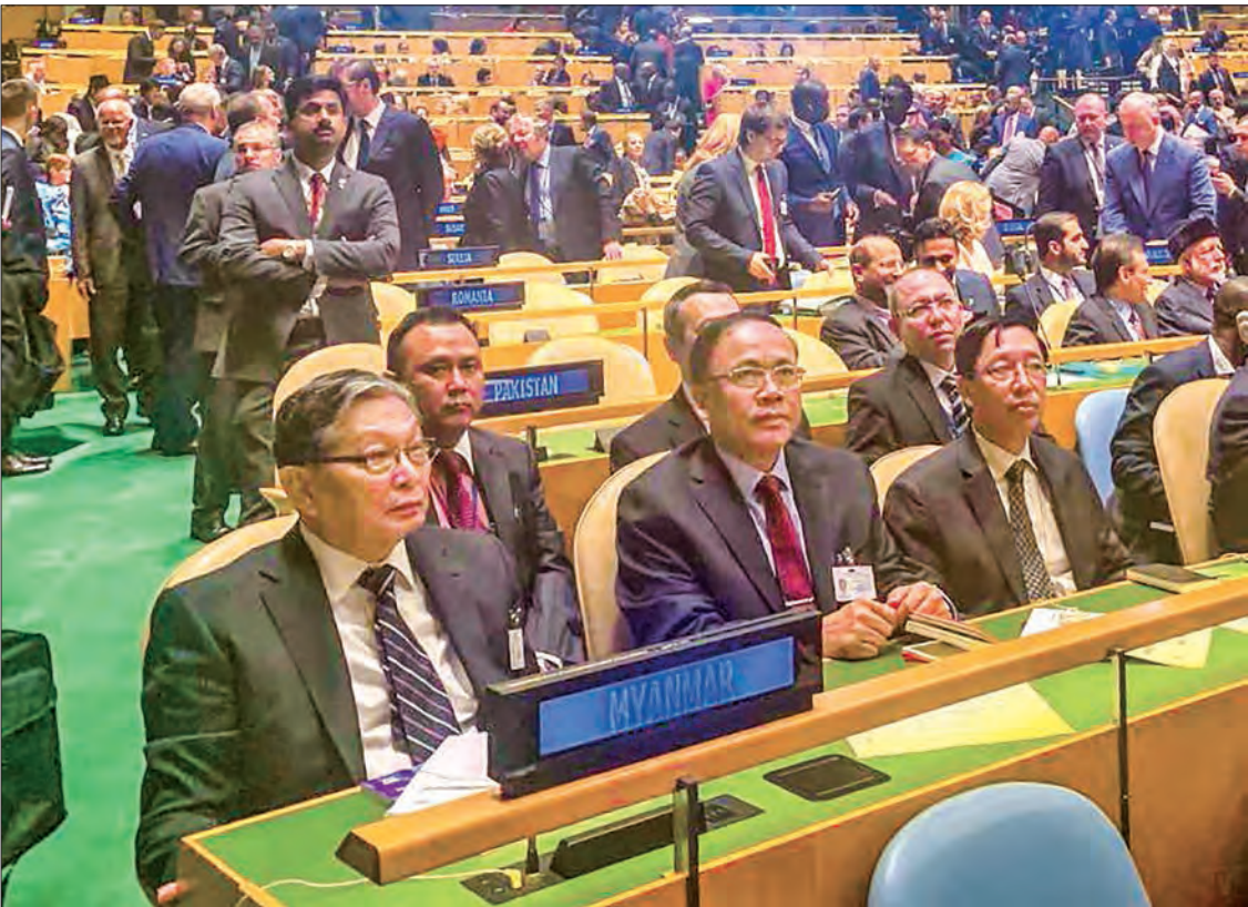
Myanmar delegation led by Union Minister U Kyaw Tint Swe attends 74th Session of United Nations General Assembly held in New York on 24 September 2019.