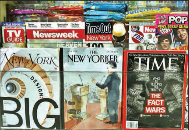
Launched in 1968 'New York' magazine has become a prominent voice in culture and lifestyle in its home city and beyond.

magazine and a series of other titles. A joint statement presented the move as a merger, although Jim Bankoff,