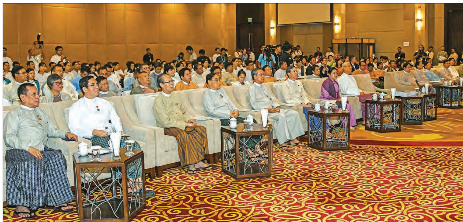
State Counsellor Daw Aung San Suu Kyi delivers the speech at the handover ceremony in Nay Pyi Taw yesterday.

It had developed into a State project. It had been proven that the mobile libraries could reach many corners of the country, and the project is therefore handed over to the government.