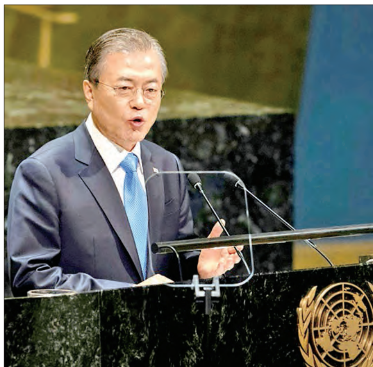
South Korean President Moon Jae-in laid out his rosy vision for the last Cold War frontier in an address to the UN General Assembly.

NEW YORK—South Korean President Moon Jae-in on Tuesday proposed that the United Nations create an “international peace zone” to replace the peninsula’s divide, saying the idea would both reassure the North and inspire the world.