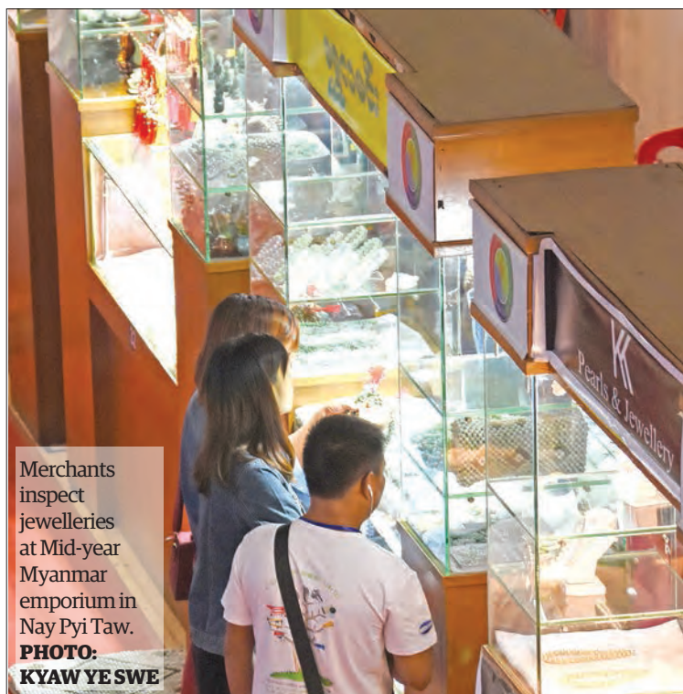
Merchants inspect jewellerys at Mid-year Myanmar emporium in Nay Pyi Taw.