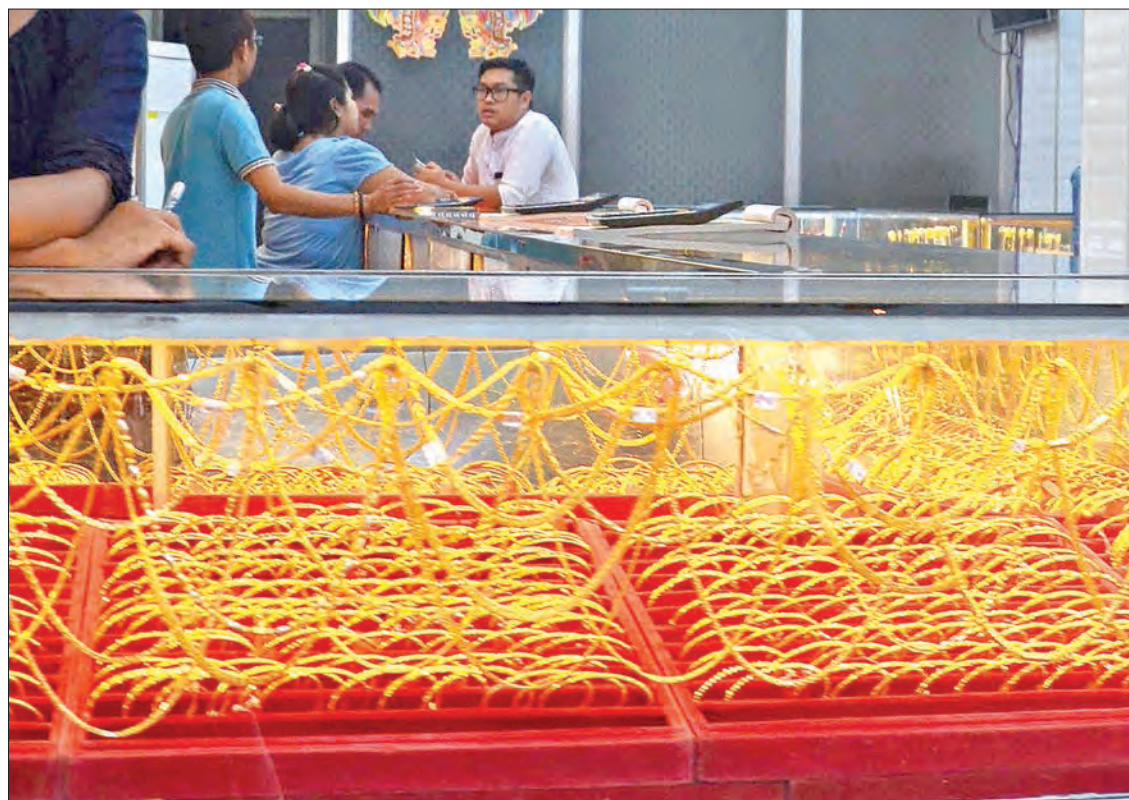
Gold jewelry seen at shop in downtown Yangon.

The prices moved in the range of K1,099,000 (1 July) and 1,149,400 (31 July) in July. Last month, the prices ranged between K1,141,5000 and K1,263,000.—GNLM ■ (Translated by Ei Myat Mon)