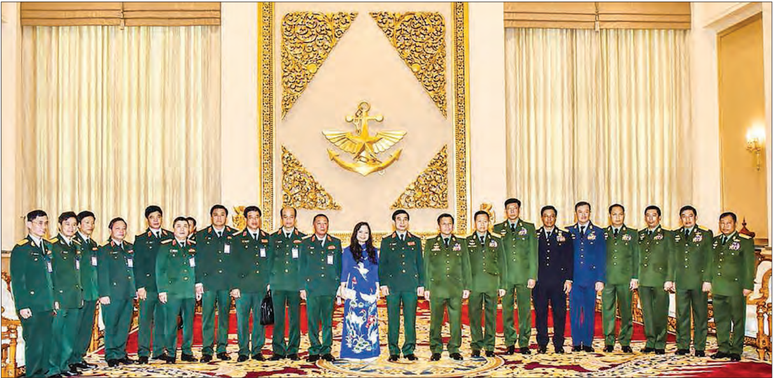
Senior General Min Aung Hlaing and Senior Lieutenant General Phan Van Giang pose for a group photo together with senior military officers of both countries in Nay Pyi Taw yesterday.

During the meeting, they discussed the need for unity, cooperation and strengthened relations among the militaries of ASEAN member nations in order to ensure sustainable development and stability within the region.