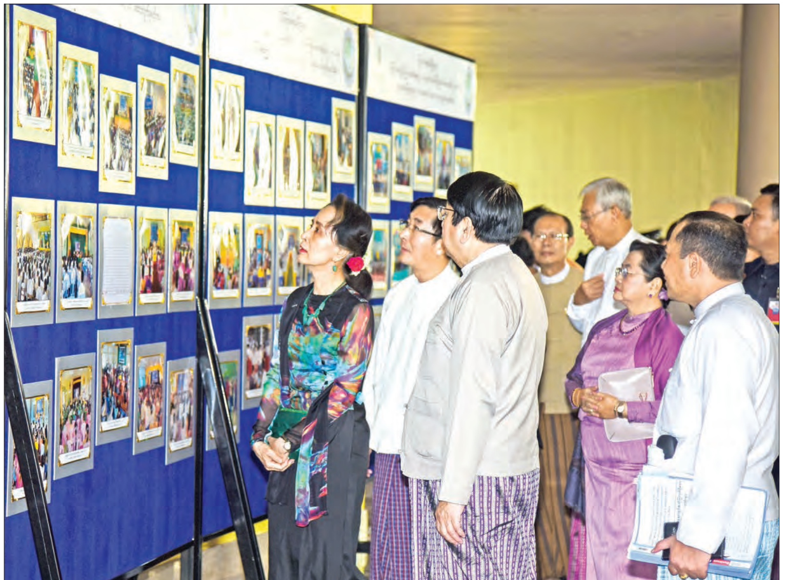
State Counsellor Daw Aung San Suu Kyi, former President U Htin Kyaw and wife, and dignitaries looking at documentary photos on activities of community centres displayed at the ceremony to hand over mobile libraries of Daw Khin Kyi Foundation to Ministry of Information in Nay Pyi Taw yesterday.