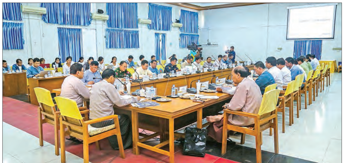
Union Ministers U Min Thu and Dr Win Myat Aye attend the coordination meeting for discussing more effective responses to natural disasters and better cooperation of the relevant ministries and states/regions in Nay Pyi Taw yesterday.

Union Minister U Min Thu then said the State Counsellor has instructed the relevant ministries to review the appropriateness of existing short and long-term plans with the ongoing