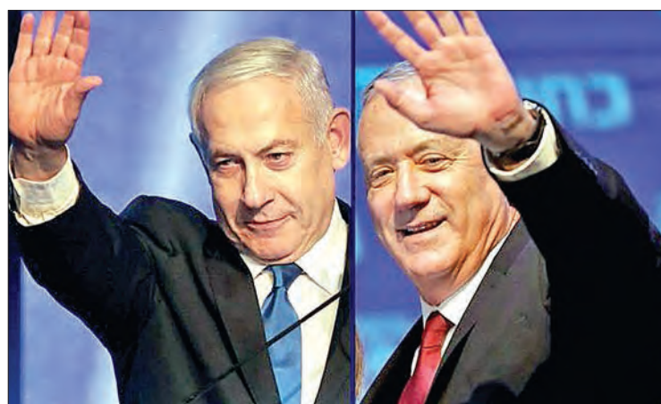
The combination picture created on 18 September 2019 shows, Benny Gantz (R) waving to supporters in Tel Aviv early on 18 September 2019, and Israeli Prime Minister Benjamin Netanyahu (L) addressing supporters at his Likud party's electoral campaign headquarters in Tel Aviv early on 18 September 2019.

"I therefore believe that the right path for the state of Israel today is to build as broad a governing coalition as possible," Riv-