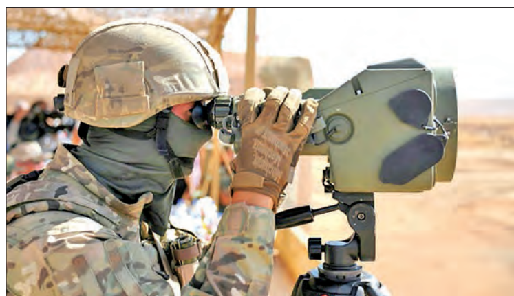
Russian military support has allowed Syrian government forces to retake large parts of Syria from rebels and jihadists since 2015, and now they control around 60 percent of the country.

YAFOUR (Syria)—Wearing clean bullet-proof vests and knee pads, fighters from a new Syrian army battalion showcase the skills they have learned from Russia's military advisers. In the countryside west of Damascus, the soldiers carry out a mock assault, fire mortar rounds and rockets, perform mine-clearing and first aid exercises. Large clouds of dust rise over the training camp as troops in camouflage fatigue open fire.