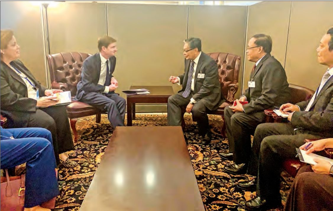
Union Minister U Kyaw Tint Swe meets US Under Secretary of States for Political Affairs Mr David Hale in New York on 23 September.

U Kyaw Tint Swe, Union Minister for the Office of the State Counsellor who is currently in New York attending the 74 th Session of the United Nations General Assembly, met with US Under Secretary of States for Political Affairs Mr David Hale at the United Nations Headquarters on 24 th September 2019.