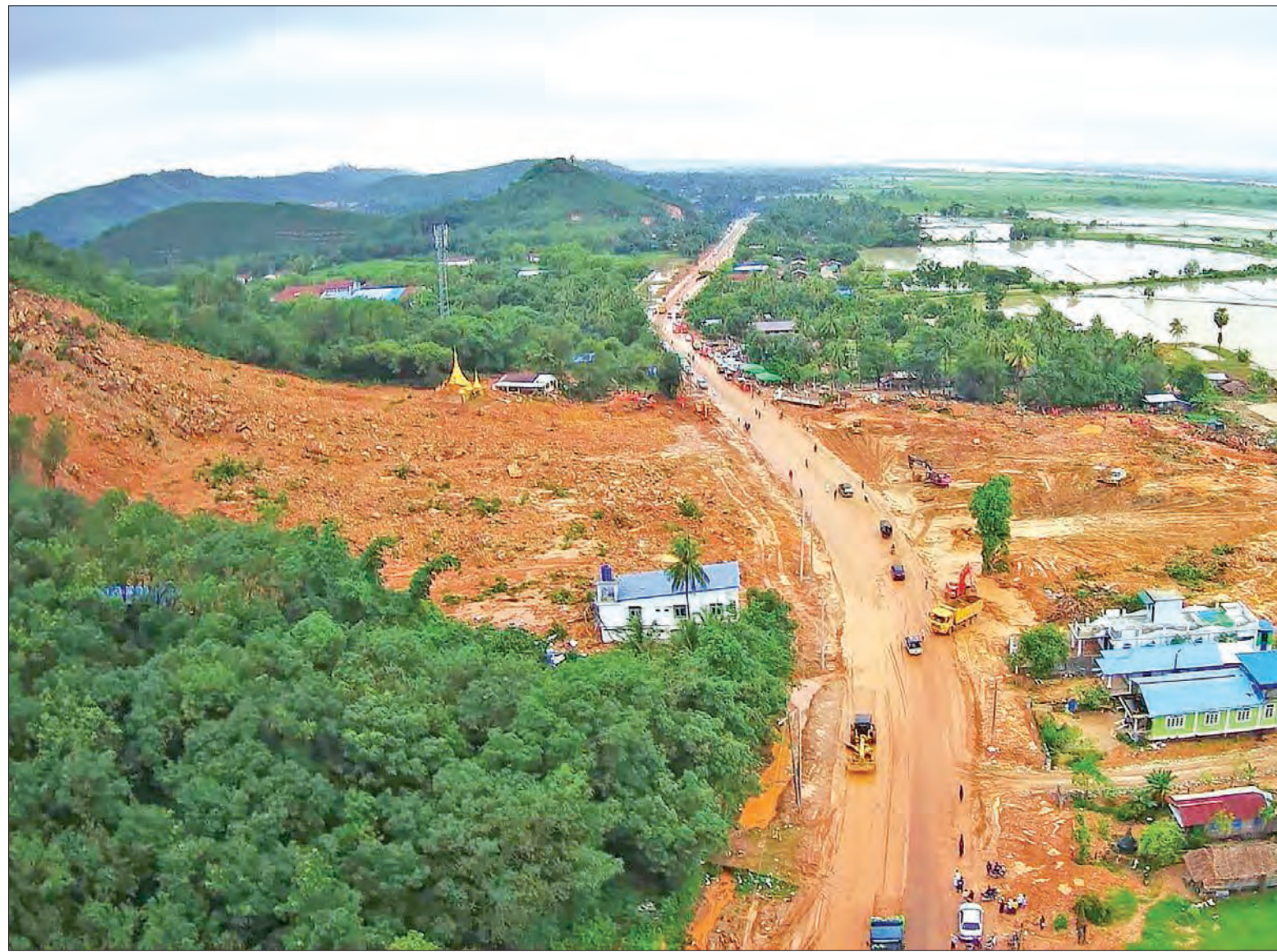
Photo shows an aerial view of the area of deadly landslide that struck a village in Paung Township in August, 2019.

The emergence of a storm depends of three fundamental factors; the factor is low pressure area followed by the second factor of high temperatures on the sea water and third one is the acidity rate high on low pressure area. The earth rotates at a sloping 23 degree centigrade around its own axis and completes one revolution around the sun about 365 days, thus making the wind move quickly here and there as the