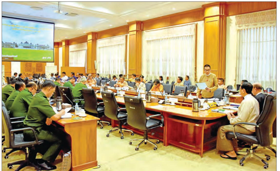
Joint Committee on Amending the 2008 Constitution holds its 40/ 2019 meeting in Nay Pyi Taw yesterday.