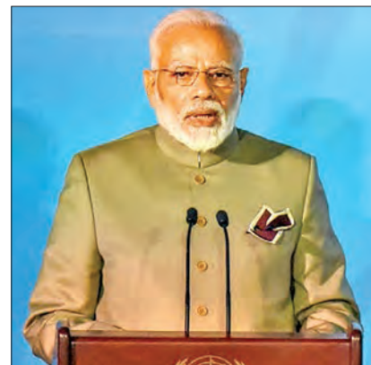
The decision to honor Narendra Modi provoked several withering op-eds and the ire of three Nobel prize winners, citing rising attacks against minorities under his tenure.

NEW YORK—Indian Prime Minister Narendra Modi on Tuesday brushed aside an outcry from human rights activists to receive an award from the Gates Foundation in New York for his efforts to end open defecation. The decision to honor the Indian leader provoked several withering op-eds and the ire of three Nobel prize winners, citing rising attacks against minorities under Modi’s