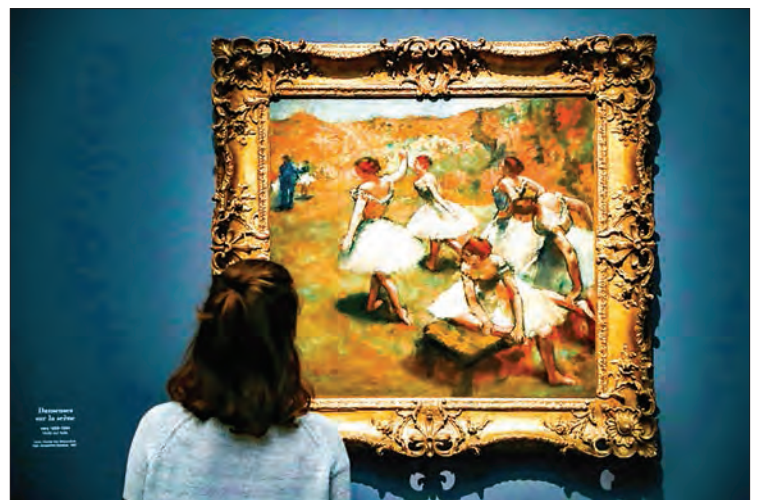
Degas created "his own Opera... through the filter of memory and his imagination", according to the former head of the Louvre and Musee d'Orsay in Paris.