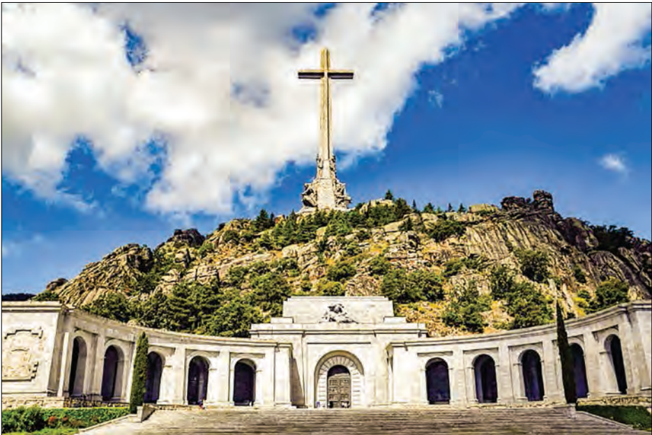
Franco is buried inside a grandiose basilica at the Valley of Fallen, which also holds the remains of 33,000 dead from both sides of the civil war.