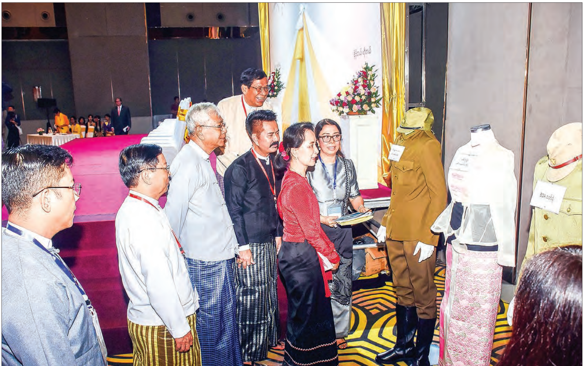
State Counsellor Daw Aung San Suu Kyi, former President U Htin Kyaw, Union ministers and artistes look around costumes for characters in the Bogyoke Aung San Film displayed at the ceremony to launch the filming of 'Aung San' in Yangon yesterday.

T HE 'Aung San' film based on the struggles of Myanmar national leader Bogyoke Aung San for independence is set to be on camera beginning 30 September.