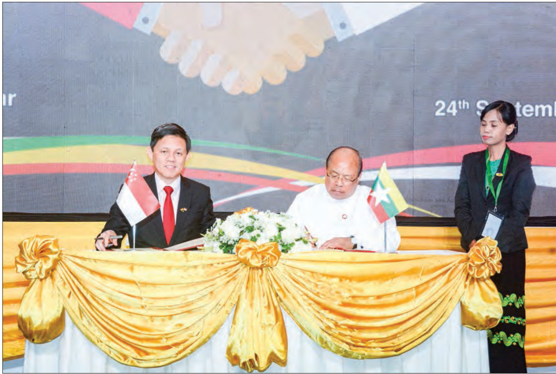
Union Minister for Investment and Foreign Economic Relations U Thaung Tun and Singapore's Minister for Trade and Industry Mr Chan Chun Sing sign the Agreement on the Promotion and Protection of Investment between Myanmar and Singapore in Yangon yesterday.

THE 7 th Joint Committee of Myanmar–Singapore Ministerial Meeting was held on 24 September 2019 at the Melia Hotel in Yangon.