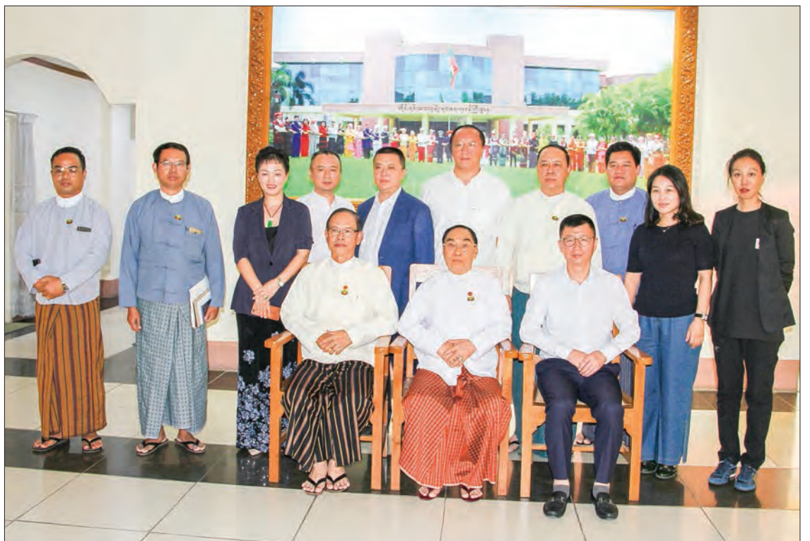
Union Minister for Ethnic Affairs Nai Thet Lwin and a delegation led by Chairman of China Council for the Promotion of National Trade (CCPNT) Mr Lan Jun pose for a photo in Nay Pyi Taw yesterday.