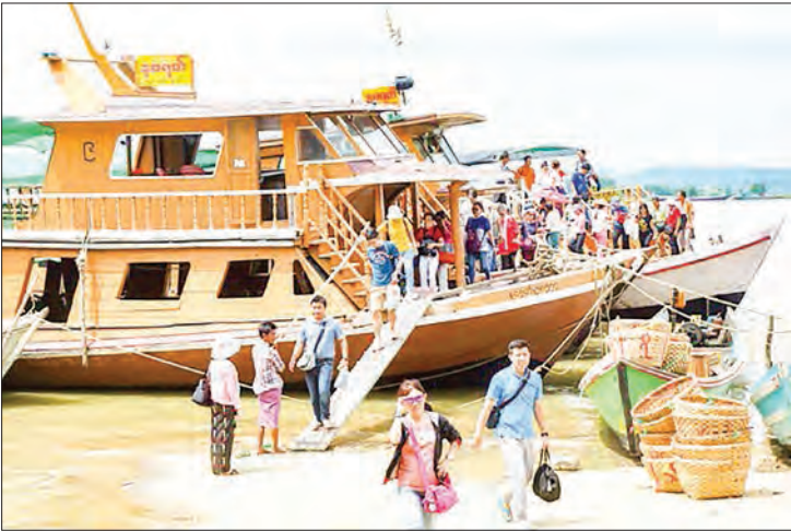
Tourist boat with tourists at Mayanchan Jetty in Mandalay Region.

THE number of tourist arrivals at Mayanchan jetty in Mandalay Region has been on the rise as the Ayeyawady River has been a major draw for visitors, according to the Private Vessel Supervisory Committee.