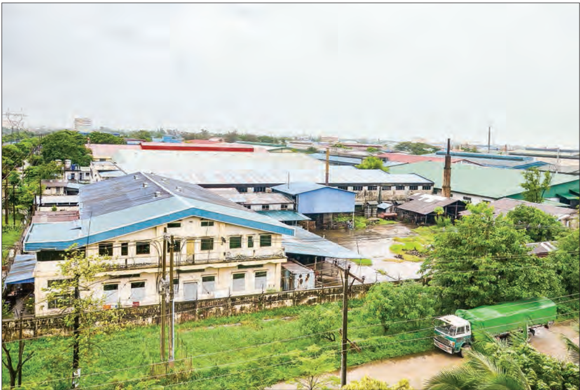
Photo shows Hlinethaya Industrial Zone in Yangon. PHOTO: PHOE KHWAR

Suggestions were invited from the public on the Industrial Zone Bill on 3 May. Twenty chapters and 80 sections have been embodied in the bill. As per Chapter 10 on investor obligations and exemptions, each and every construction project has to be completed by them within a fixed period. If they fail to do so, a reasonable reason must be provided to the respective industrial zone committee, along with the recommendation of the Industry Zone Management Committee. If the reason