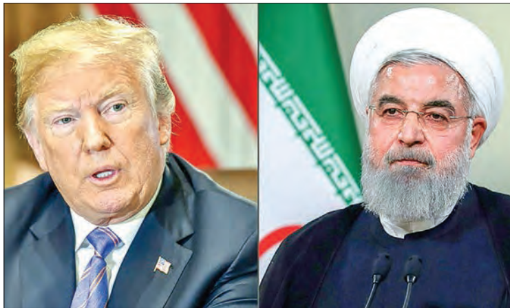
All eyes are on US President Donald Trump and his Iranian counterpart Hassan Rouhani who are both in New York for the United Nations General Assembly.

Macron is cautiously hopeful for a breakthrough and is seeking