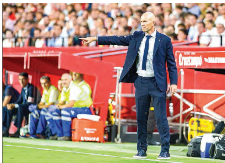
Real Madrid's win over Sevilla on Sunday eased the pressure on coach Zinedine Zidane.

Madrid have won three of their six games in all compe-