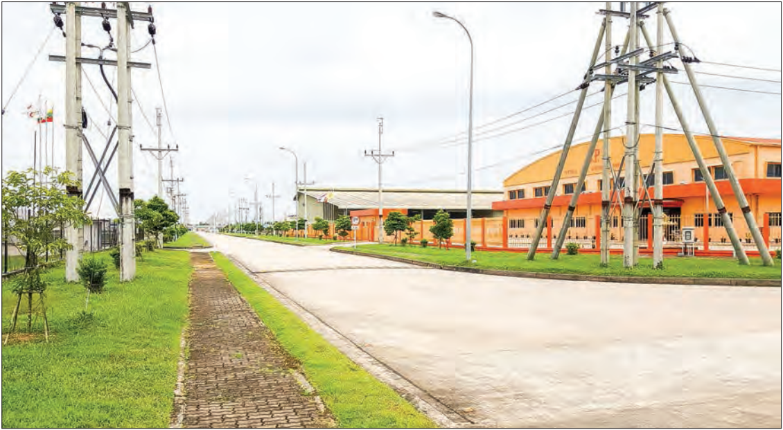
S.P. PETPACK INTER GROUP (MYANMAR) CO., LTD. of Thailand at Thilawa Special Economic Zone on 22 September, 2019.