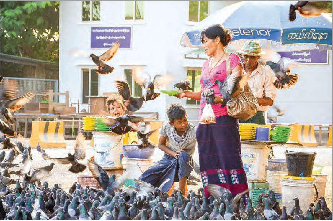
Woman feeding pigeons in Botahtaung Township in Yangon.

“The pigeons will surely flock to any place where there