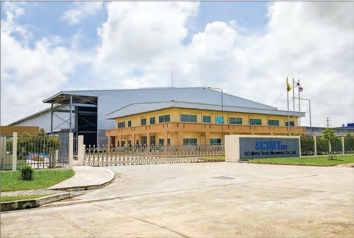
Thailand – Myanmar SCI Metal Tech Co., Ltd., Steel Structure Manufacturing Industry, being seen at Thilawa Special Economic Zone on 22 September, 2019.

Myawady, Kawthoung, Myeik, Hteekhee and Mawtaung gates. Bilateral trade between Myanmar and Thailand totalled US$ 11 billion, with Thailand being Myanmar's third largest trading partner and third largest foreign investor after Singapore and China. Investments from Thailand in Myanmar amounted to US$ 6.6 billion in the financial year 2018-2019, with half of the investments went into oil and gas sector, according to a senior official from the ministry. ■ ■ ■