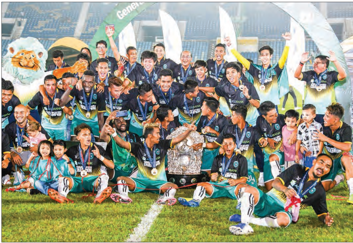
Yangon United celebrate their victory on 24 September after claiming the 2019 General Aung San Shield at the Thuwunna Stadium in Yangon.