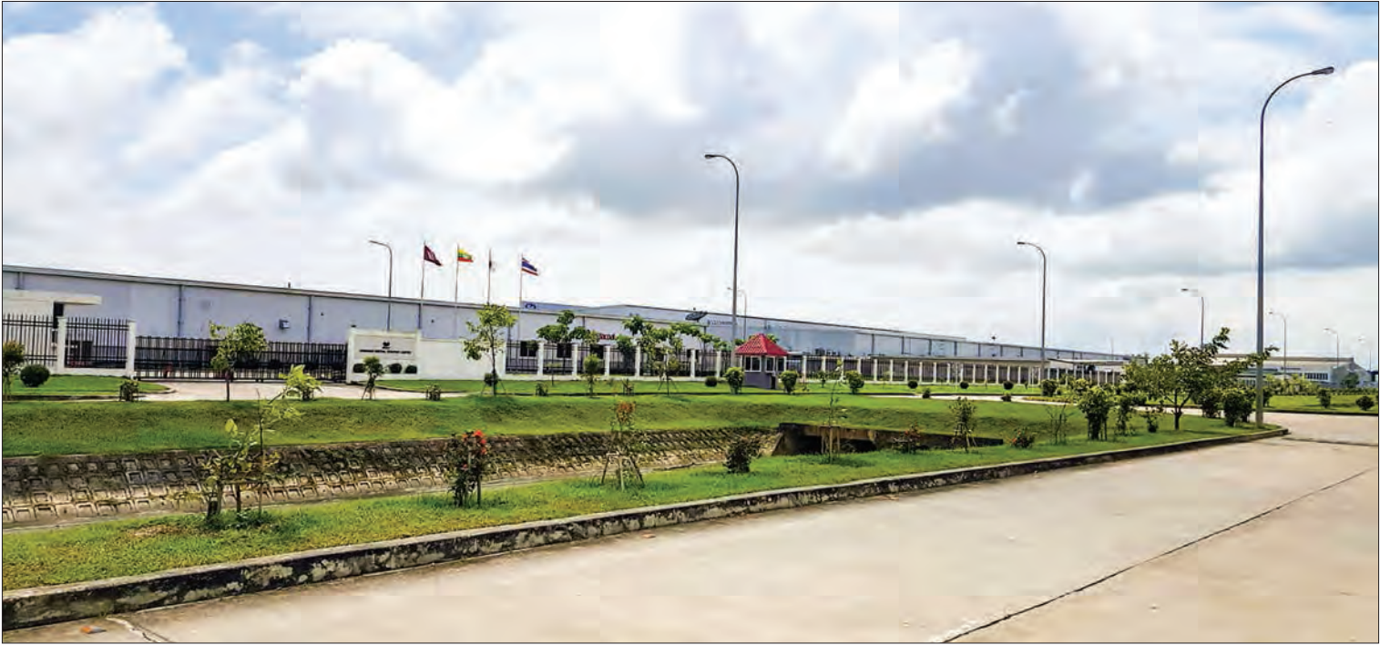
Myanmar Wacoal Company Limited at Thilawa Special Economic Zone on 22 September, 2019.

to enhancing regional cooperation with ASEAN member countries under the Master Plan on ASEAN Connectivity 2025 in order to ensure sustainable urban development and create new investment opportunities. Establishment of special economic zones in Myanmar aims to help foreign investors attract, the Union Minister added. The Yangon government is implementing the mega projects to support foreign investments in the region. The Yangon City Project, Yangon Amata Smart and Eco City Project, Eco Green City Project, Korea-Myanmar Industrial Complex Project and Yangon Project Bank are being developed by foreign investors