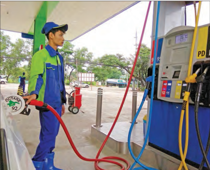
An employee at a fuel station fills up a car’s oil tank.