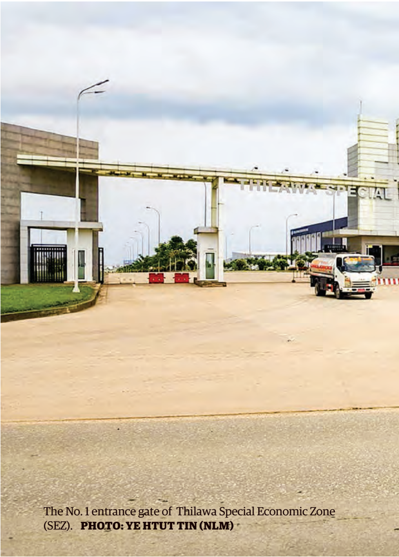
The No. 1 entrance gate of Thilawa Special Economic Zone (SEZ).

U Thaung Tun at the business forum. The Union Minister highlighted that Myanmar's GDP increased to more than US$ 71 billion in 2018 from US$ 8.9 billion in 2000, saying Myanmar's GDP is estimated to achieve 7 percent annually during the period from 2019 to 2023. Long-term foreign investments have been channelled into the transport, infrastructure, urbanization and communications sectors of the country. Myanmar is committed