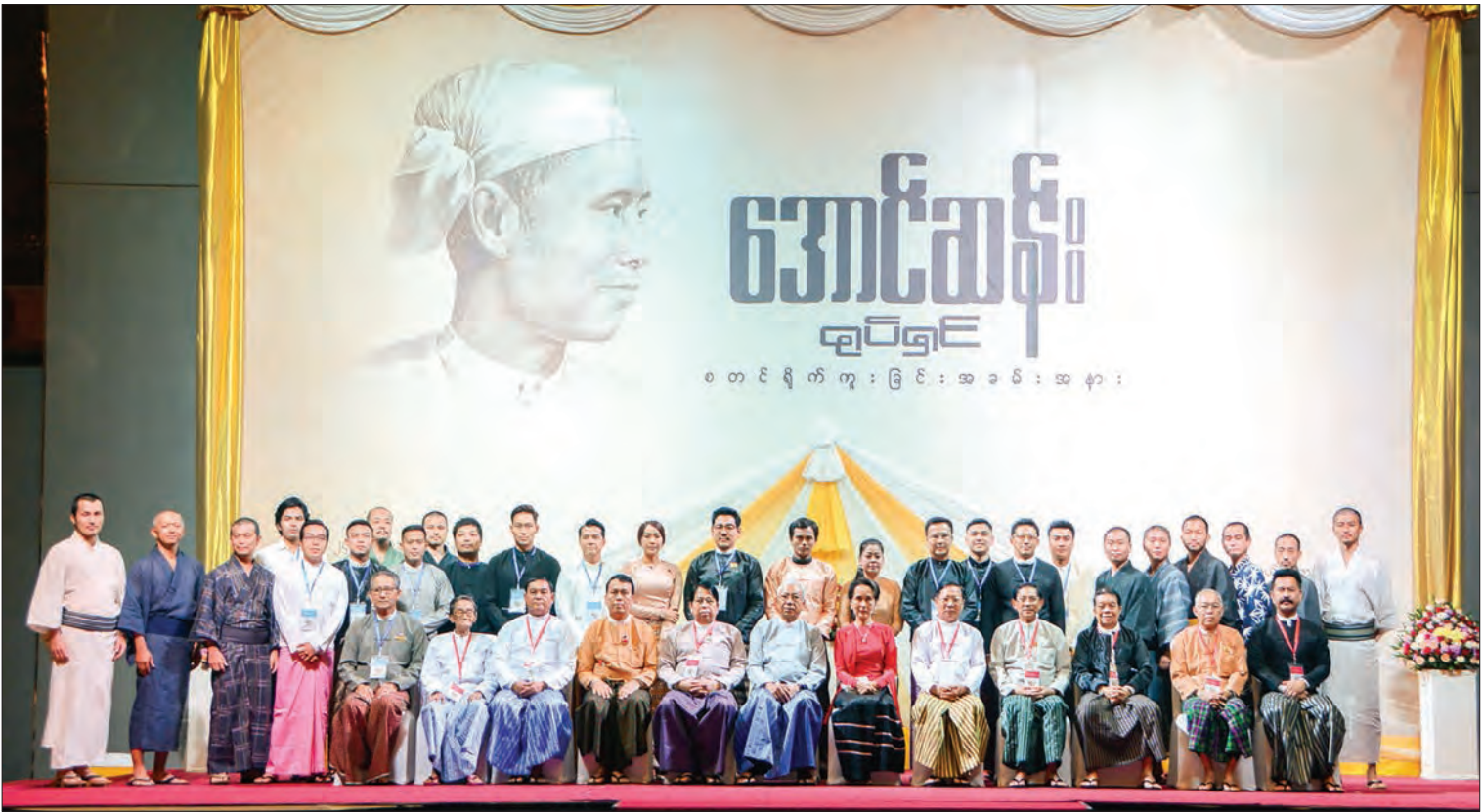
State Counsellor Daw Aung San Suu Kyi poses for a documentary photo together with former President U Htin Kyaw, Union Ministers, government officials, artistes and actors who will act in ‘Aung San’ Film at the ceremony to launch shooting Bogyoke Aung San Film in Yangon yesterday.

signer team has already created the sample military dresses, and double-checked with those in the Defence Services Museum.