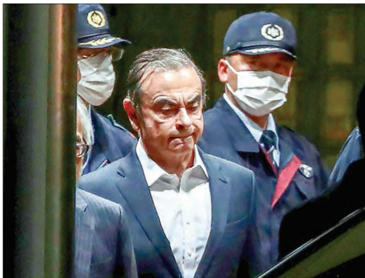
Nissan's former CEO Carlos Ghosn will pay $1 million in fines to settle with US securities regulators over what they said was a fraud related to his expected retirement income.

The machinations allegedly stemmed from a shift in Japanese policy in 2009 that required disclosure of indi-