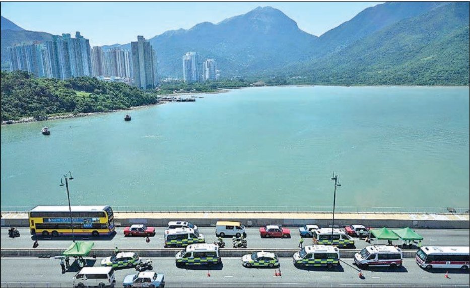
Police perform vehicle checks on a bridge which links Tung Chung to an artificial island upon which the airport is located, in Hong Kong on September 22, 2019.

abroad. “We will know by tomorrow if agreement is reached,” the source told AFP. The firm’s shareholders and creditors are scheduled to meet from 9 am (0800 GMT) on Sunday morning, followed by a meeting of the board of directors in the afternoon. The Transport Salaried Staffs Association, which represents workers at the company, called on the government to rescue the firm. —AFP ■