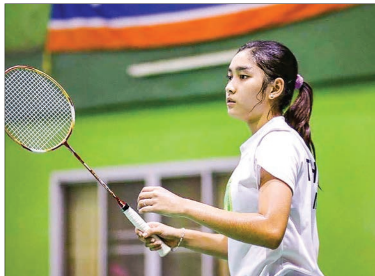
Myanmar badminton star Thet Htar Thuzar.

Thet Htar Thuzar will compete in other international badminton series till April, 2020, according to an official.—Lynn Thit (Tgi)