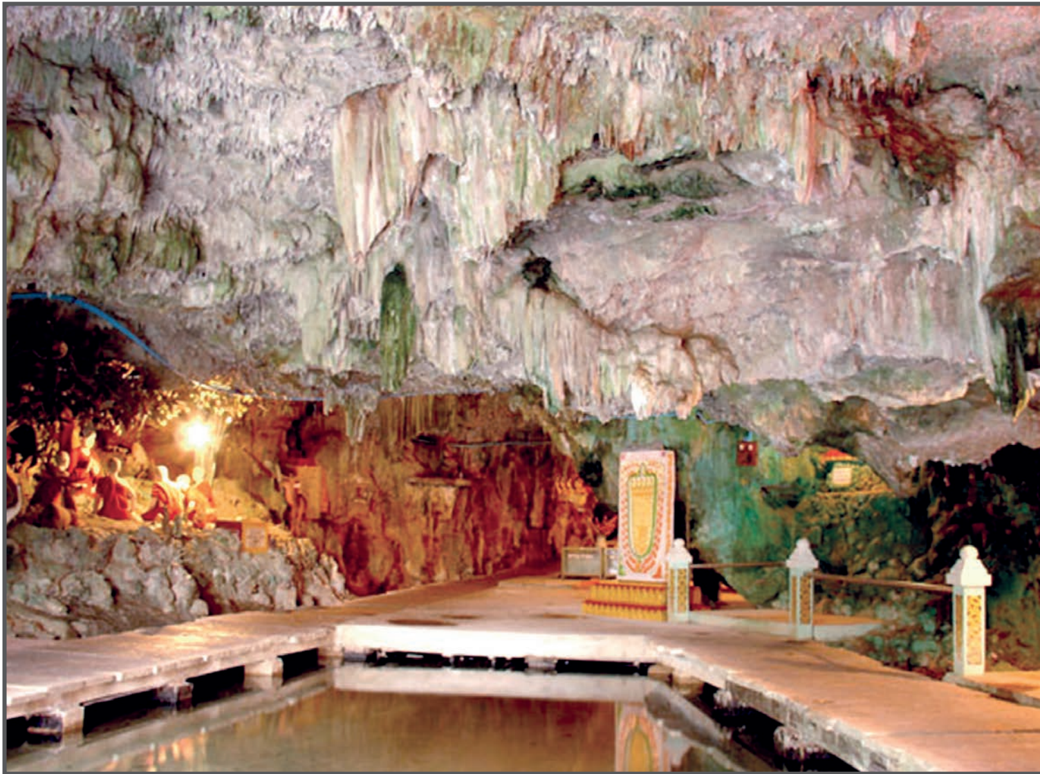
Peik Chin Myaung Cave in Pyin Oo Lwin.

I T is a town that linked the Shan mountains with the plain. A town situated at the edge of Mandalay Region bordering Shan State. It was known in many names. Flower town, hill station town, hill step town etc. During colonial time, it was Maymyo or May Town and now known as Pyin Oo Lwin. The weather was never at an extreme. Cool all the time. It was a place where many colonial mansions and bungalows abound.