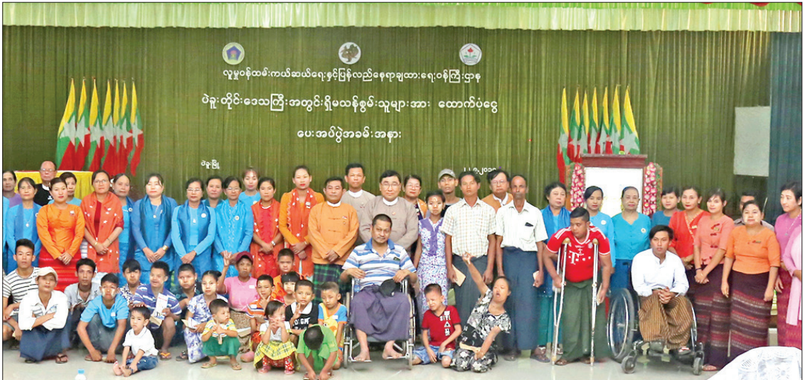
Union Minister Dr Win Myat Aye and officials pose for a group photo with persons with disabilities at Bago City Hall in Bago yesterday.

registration of people with disabilities were underway and during which the initial cash assistances for the persons with disabilities were being provided. The government will also create job opportunities for the persons with disabilities by setting up a fund for them, he added. The union minister also urged national committees on rights of persons with disabilities and persons with disabilities organizations to work in cooperation. Bago Region Chief Minister U Win Thein expressed thanks for the cash assistance. A total of