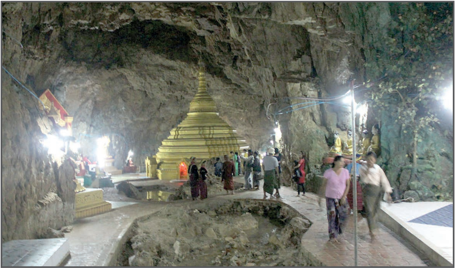
Peik Chin Myaung Cave pagodas.

yard with some boats in it. It is an interesting place to visit.