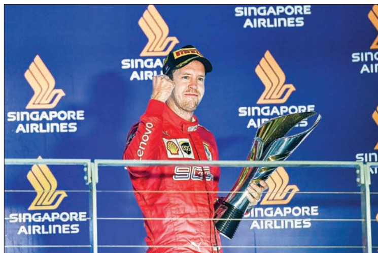
It was Vettel's fifth win on the Marina Bay circuit.

Both sides were cagey at the start of the match, with neither side able to create clear-cut chances.—AFP ■