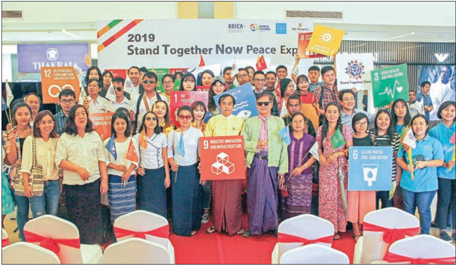
Attendees and organizers pose for a photo at the 2019 Stand Together Now Peace Expo in Yangon yesterday.