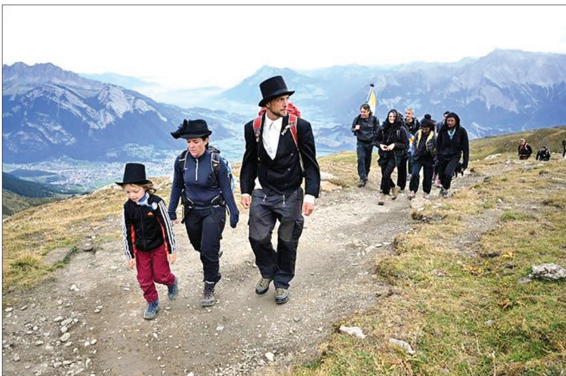
The solemn two-hour “funeral march” led up the side of Pizol mountain in northeastern Switzerland to the foot of the rapidly melting ice formation.

But unlike Iceland, Sunday’s ceremony does not mark the first disappearance of a glacier from the Swiss Alps.