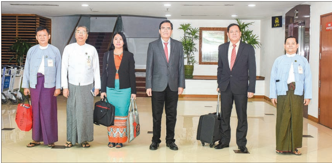
The delegation led by Deputy Minister U Aung Hla Tun welcomed back by officials at the Yangon International Airport yesterday after attending China-ASEAN Radio and Television and New Media Forum and Television Fair in Nanning, China.