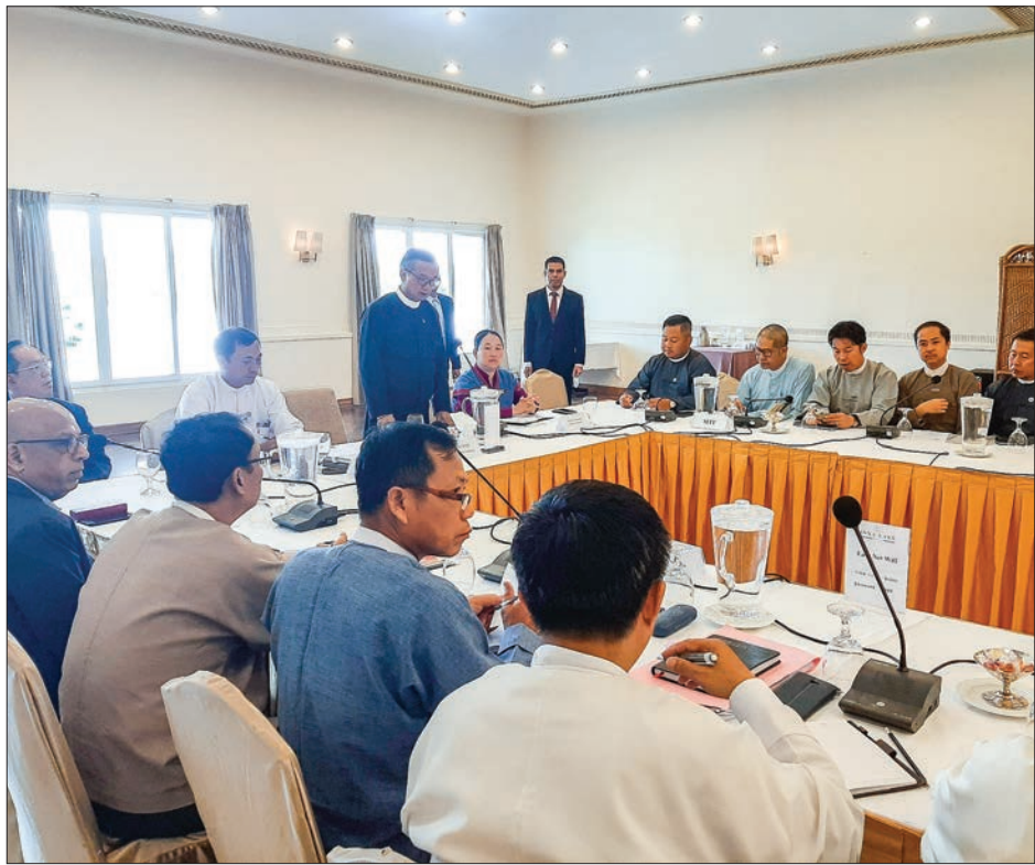
Union Minister U Ohn Maung addresses the meeting to get accurate data required to identify actual incomes of tourism industry.