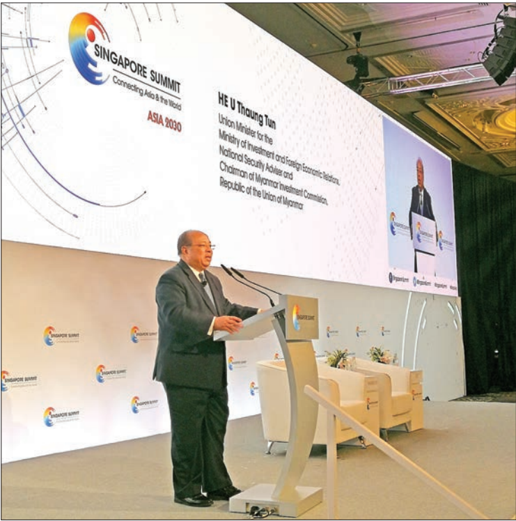
Union Minister U Thaung Tun addresses the Singapore Summit 2019 which was held from 20-21 September.

MYANMAR delegation led by Union Minister for the Ministry of Investment and Foreign Economic Relations and Chairman of the Myanmar Investment Commission (MIC), U Thaung Tun, attended the Singapore Summit 2019 from 20 – 21 September. The Summit, organised by the Temasek Foundation – with the support of the Singapore Economic Development Board, the Monetary Authority of Singapore and the GIC Private Limited, was held with the aim of discussing global trends in business, finance, and geopolitics, and their impact on regional and global growth. The summit provided an opportunity for senior government officials and business leaders from around the world to discuss emerging challenges and