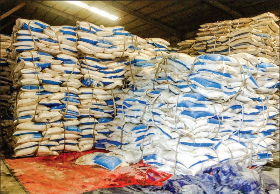
Sugar bags are piled at the Great Wall Sugar Plant in Mandalay.