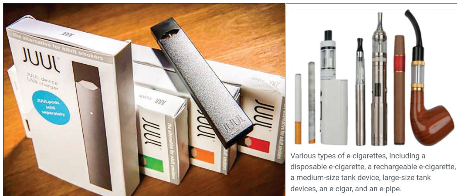
Various types of e-cigarettes, including a disposable e-cigarette, a rechargeable e-cigarette, a medium-size tank device, large-size tank devices, an e-cigar, and an e-pipe.

Based on the above mentioned facts related to e-cigarettes used in vaping or juuling, it is quite obvious that they are addictive and not safe. All claims by the producers of those devices are all myths and lack truth. My advice to the youths of today is not to fall prey to the false claims of the dealers of e-cigarettes that they are non-addictive and harmless. Tobacco or more precisely the nicotine present in it are always addictive and harmful in whatever way they are consumed - either by smoking vaping, juuling or chewing. Also many people sharing one e-cigarette as mentioned above is unhealthy, because germs from one person will be transmitted to the others. Just imagine what could happen with ten people putting the same device into their mouths by turn.