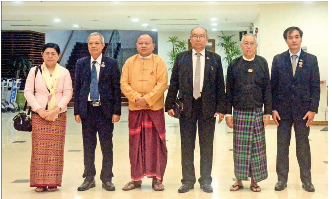
The delegation led by Amyotha Hluttaw Speaker Mahn Win Khaing Than pose for a group photo with other dignitaries at the Yangon International Airport before leaving for the Republic of Kazakhstan to attend the 4 th Meeting of Speakers of the Eurasian Countries' Parliaments.