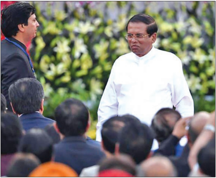
Sri Lanka's president Maithripala Sirisena said the new commission has wide judicial powers to gather evidence on the Easter Sunday bombings.

The five-member panel is headed by a Court of Appeal judge and includes three other judges and a retired civil servant. It is to report back