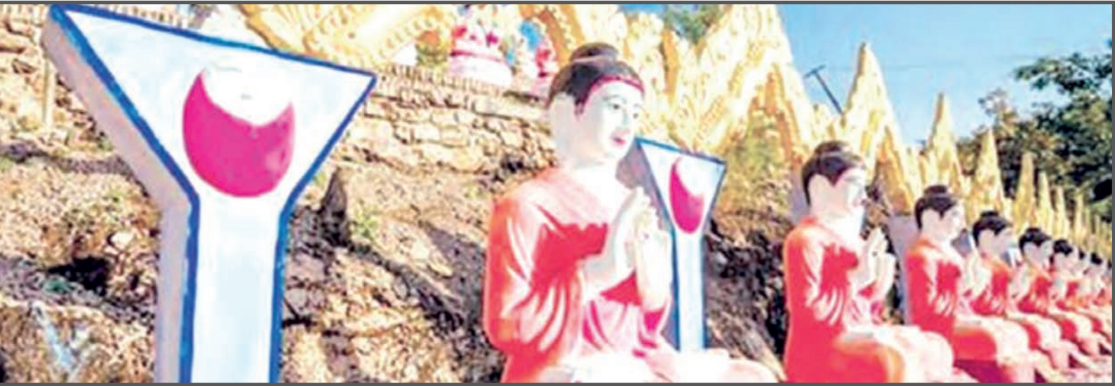
Buddha statues being seen at Pyittainghtaung monastery.

passing December Farm, you'll see a signboard on the left side of the road pointing to Humpty dumpty pagoda and monastery. After passing December Farm, have a keen lookout for that signboard as we almost always went past it and had to turn back whenever we went there. Humpty dumpty pagoda is a pagoda with Buddha images among humpty dumpty dolls. A strange place with a strange construction but color combinations was attractive enough to make you take photographs.