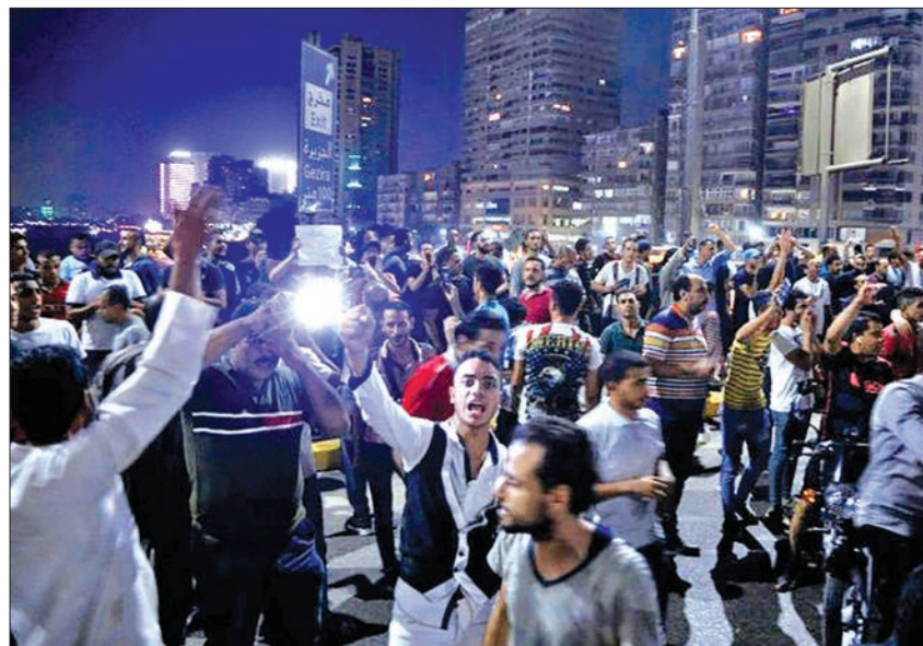
Demonstrations are extremely rare in Egypt after the government effectively banned protests following the 2013 military ouster of Islamist ex-president Mohamed Morsi.

CAIRO—Egyptian security forces clashed with hundreds of anti-government protesters in the port city of Suez on Saturday, firing tear gas and live rounds, said several residents who participated in the demonstrations.