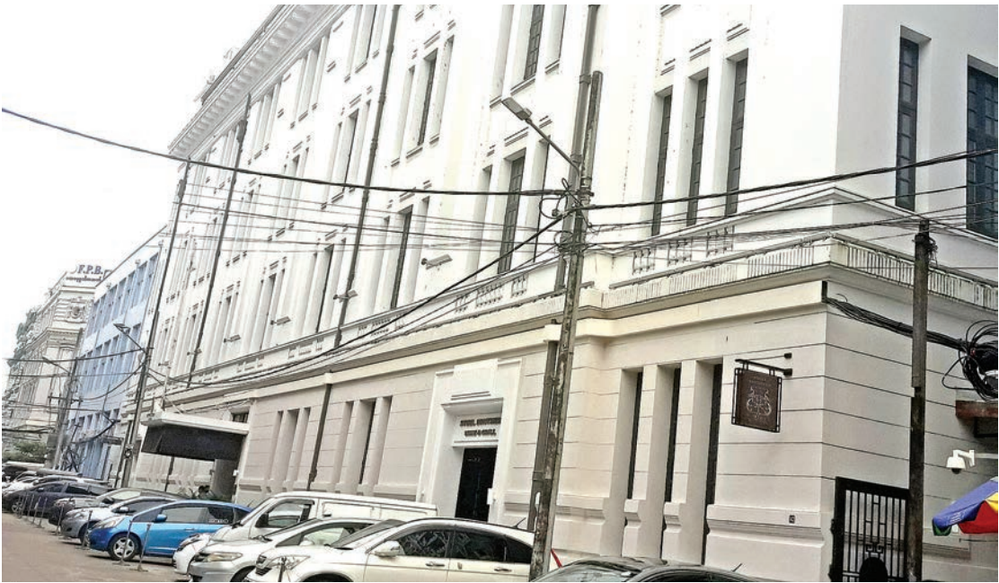
The Yangon Excelsior Hotel on Bo Sun Pat Street to get the blue plaque from the Yangon Heritage Trust on 28 September.

“Some buildings have already got the attention of the people, while some have still not been noticed. The city’s