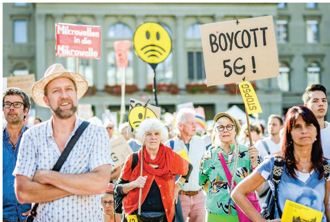
People take part to a nationwide protest against the 5G technology and 5G-compatible antennae deployment in front of the Swiss house of Parliament in Bern, on 21 September 2019.

start by conflict in eastern DRC, as well as attacks on medical teams tackling the haemorrhagic fever amid resistance within some communities to preventative measures, care facilities and safe burials.—AFP ■