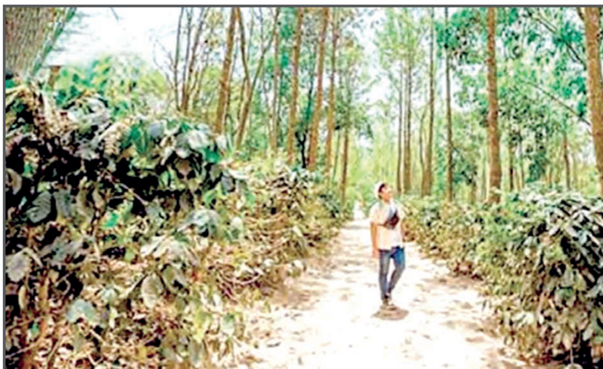
Sitha Coffee Farm's plantation.

It was a place where many races and religions lived in peace and harmony. Places of worship related to many religions can be found here. Many dress styles can be seen and a variety of foods can be tasted.