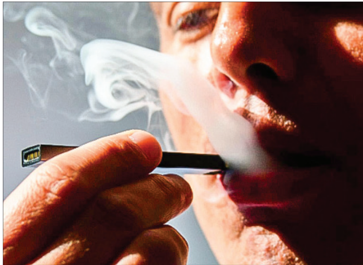
Vaping, also known as Juuling, is becoming more popular with youth in middle school and high school.

Juuling - While vaping isn't a new trend, teens in the U.S. do have a new word for it. Juuling, which essentially means vaping, was coined after the popularity of the Juul e-cigarette. Here, Juul is the brand name of that device. According to a report in Time magazine, they made up 33 per cent of the e-cigarette market in