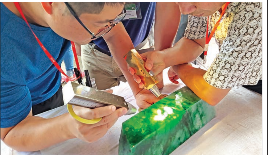
Jade merchants check quality of a jade stone during the mid-year Myanmar Gem Emporium at Maniyadana Jade Hall in Nay Pyi Taw on 21 September. NEWS ON PAGE-1