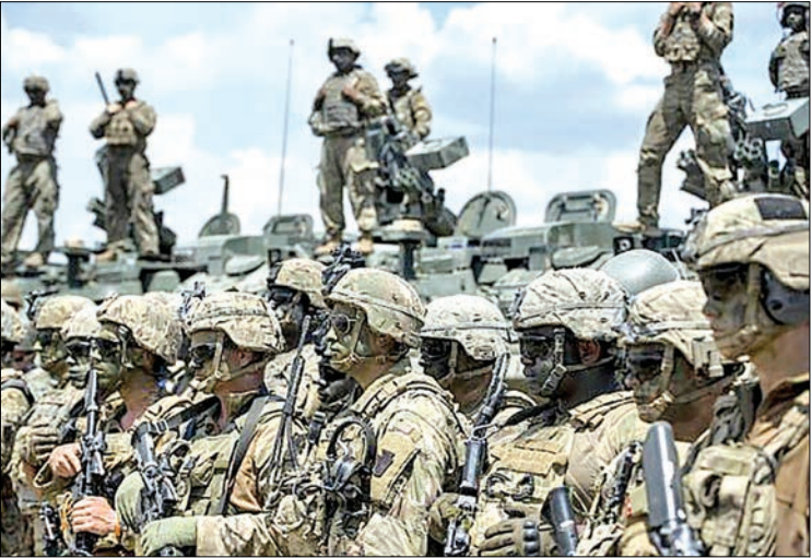
FILE PHOTO: US soldiers take part in the 'Decisive Strike' military exercise in their camp at the Training Support Center (TSC) Krivolak, near Skopje, on June 17, 2019.

Rouhani said Iran would present a plan for peace to the United Nations in the coming days. —AFP ■