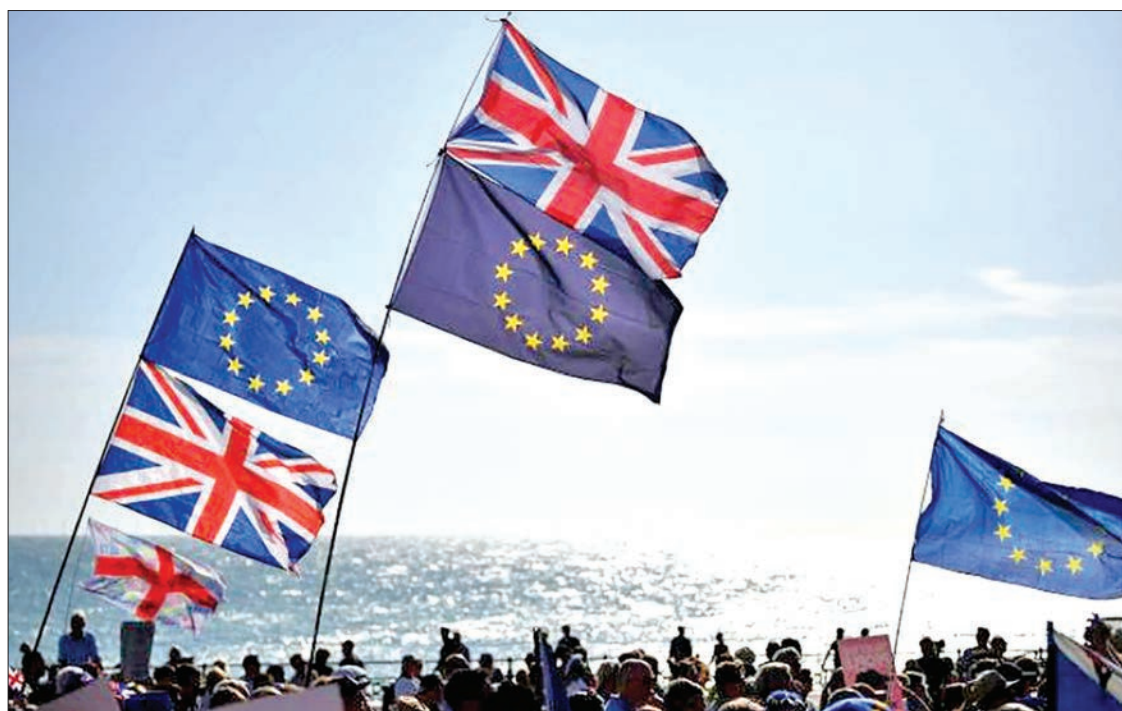
The prospect of trade barriers being re-erected on Nov 1 between Britain and its EU neighbours has led to fears of nightmarish tailbacks at borders, with potentially huge losses for exporters.

Britain says it will scrap tariffs on most imports, while keeping a reduced rate for some agricultural products to protect