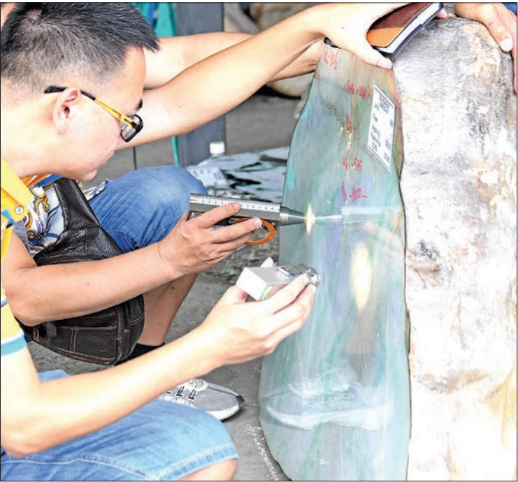
Merchants evaluate the quality of the jade lot at the Mid year-Myanmar Gems Emporium 2019 at Maniyadana Jade Hall in Nay Pyi Taw on 21 September.