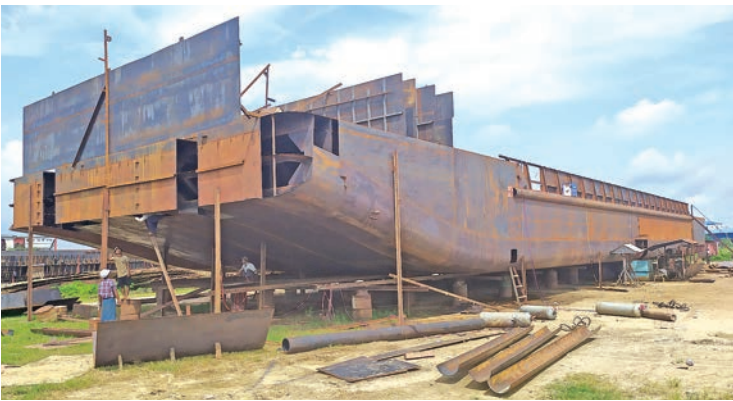
The ferry which will ply between Yechanpyin and Agnumaw is currently under construction at the Dagon Seikkan Shipyard.

Yangon Region is aimed to be shaped as a livable, economic capital through sustainable development and heritage conservation,” the Yangon Region Chief Minister had said at the event held to mark the Rosewood Yangon Hotel as Yangon’s 31st heritage site.—Zar Ni Maung/ Ko Khant ■ (Translated by Ei Myat Mon)