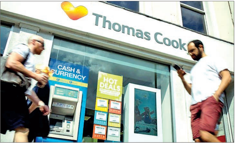
In urgent need of more cash.

months. WTI closed the week at 58.09 U.S. dollars a barrel on the New York Mercantile Exchange, while Brent crude finished the week at 64.28 dollars a barrel on the London ICE Futures Exchange. WTI and Brent crude prices have increased 27.95 percent and 19.48 percent, respectively, so far this year, falling from their peak levels in April when the growth of WTI hit over 40 percent, and Brent crude over 30 percent.—Xinhua ■