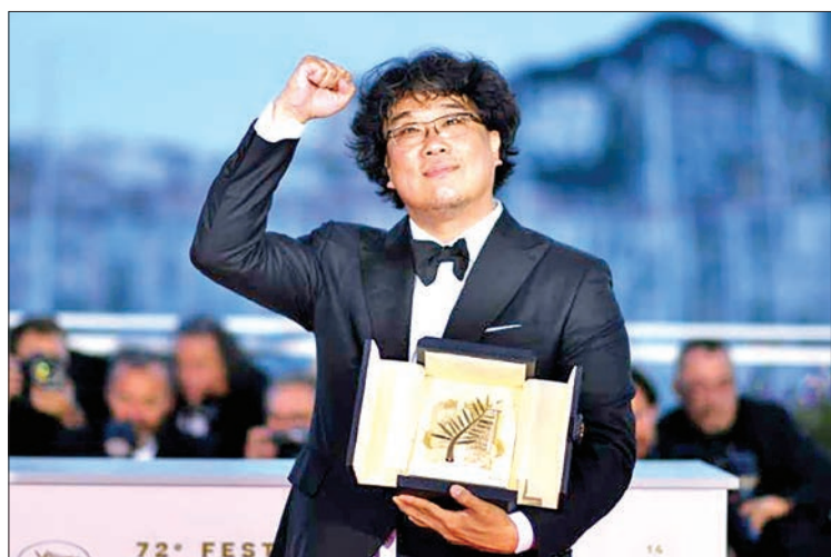
FILE PHOTO: South Korean director Bong Joon-ho celebrates winning the Palme d’Or at the Cannes film festival in May.

PARIS — The South Korean satire “Parasite” has become the most successful Cannes-winning film at the