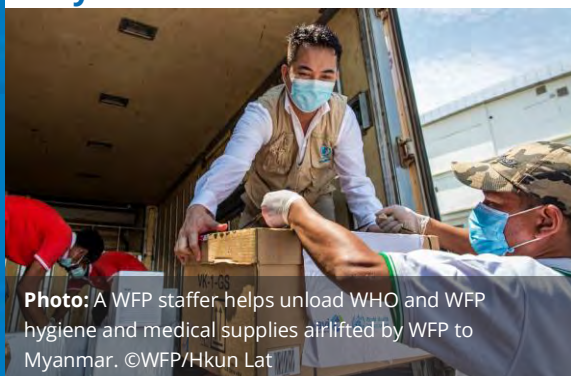
Photo: A WFP staffer helps unload WHO and WFP hygiene and medical supplies airlifted by WFP to Myanmar. ©WFP/Hkun Lat