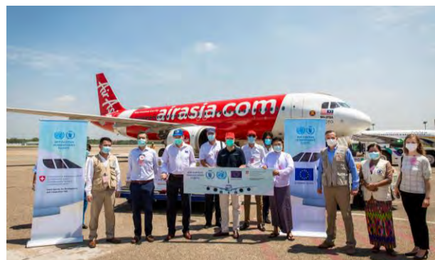
Photo: The first of the aid flights launched by WFP in Myanmar successfully landed in Yangon on 10 May, bringing 10,000 UNICEF COVID-19 test kits to Myanmar. ©WFP/Hkun Lat

Financial support from the European Union and Switzerland made it possible for WFP to establish the initial weekly flight service from 10 to 24 May. On 31 May, WFP transitioned to a regional air service funded through WFP's Global Logistics Service Provision Plan. This arrangement is intended to remain in place until regular commercial flights to Myanmar resume.