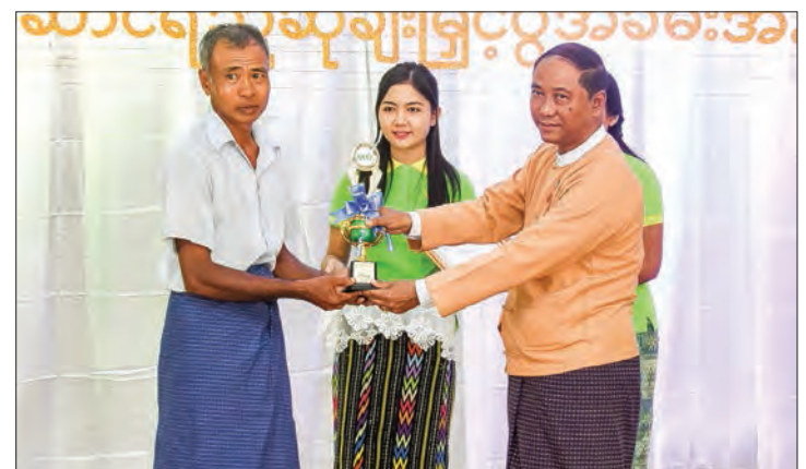
An official presents agricultural performance award to an outstanding farmer.

Myanmar Agri Foods Co., Ltd. is located near Kyi In Village beside the Nay Pyi Taw by-pass road and is exporting frozen vegetables while working together with partner farmers to expand the production and processing of farm products, it is learnt.—MNA ■