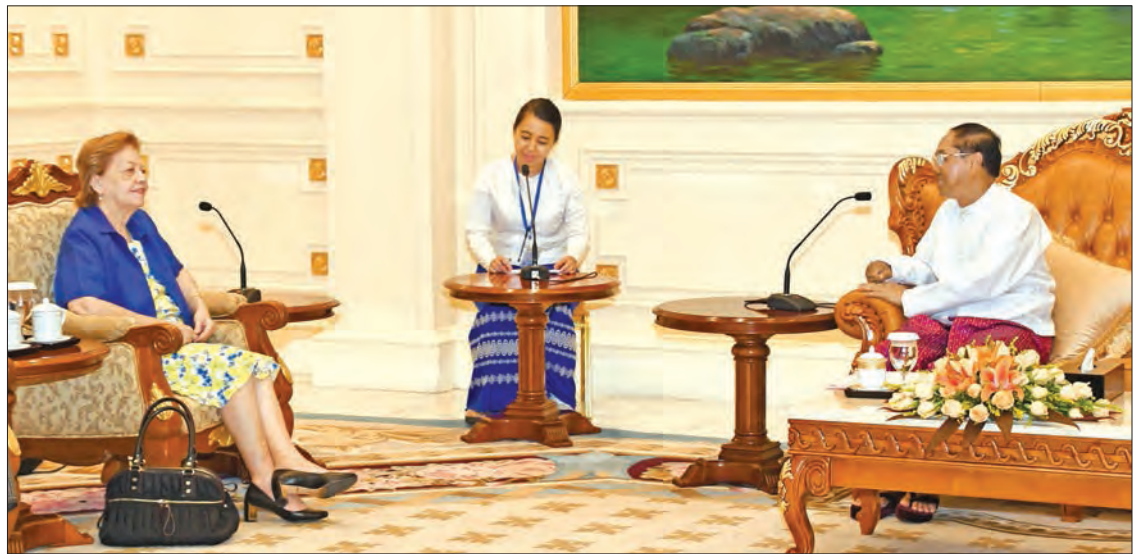
Vice President U Myint Swe holds talks with Ambassador H.E. Rosario Manalo at Presidential Palace in Nay Pyi Taw yesterday.