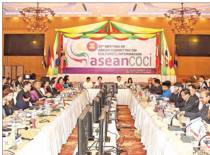
The 53 rd ASEAN Committee on Culture and Information in process in Royal Nay Pyi Taw Hotel in Nay Pyi Taw.

Participants at the meeting then discussed cooperation with dialogue partner countries and analyzed the state of implementation of the previous meeting's decision, strategic plans, and reviews on funding for 2019 finance.