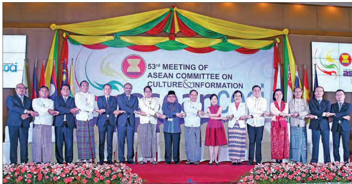
Participants pose for the commemorative photo at the opening ceremony of 53 rd meeting of ASEAN Committee on Culture and Information in Nay Pyi Taw yesterday.

The Union Minister said in 1999, the ASEAN-COCI changed its mode of operation. It now op-