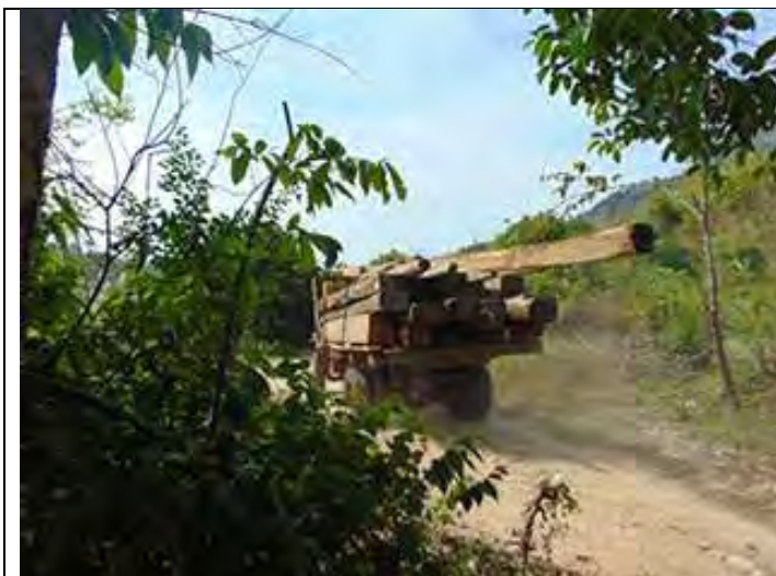
MNLA soldiers arrested villagers transporting logs in their truck when a logging dispute led to skirmishes between the MNLA and KNLA.

Disputes between the KNLA and MNLA relating to land in Tanintharyi Region date back to 1988. After the ethnic armed groups participated in negotiations mediated by the National Democratic Front, a coalition of ethnic groups, they agreed to stop fighting. After more than 20 years of stability, skirmishes between the MNLA and KNLA resumed in December 2016, 3 when clashes occurred near Mann Aung because of disputes over natural resources and territory. 4