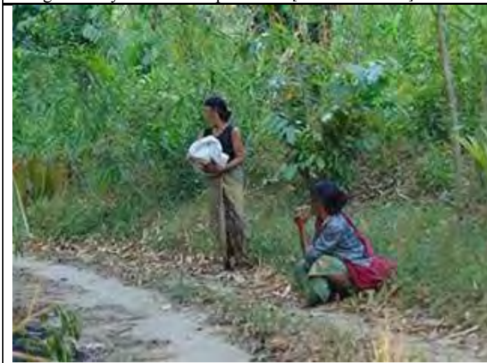
Two Mon villagers stop on their way to work. They are afraid of soldiers patrolling near their village. The MNLA told Mon villagers to sit down when they see soldiers, to keep a low profile.

Local villagers reported to KHRG that they were worried the skirmishes between the MNLA and the KNLA would cause tension between Karen and Mon villagers in Mann Aung. Karen and Mon families have been living together in harmony for years. They are worried that the relations between the two ethnic groups will be strained because of the fighting.