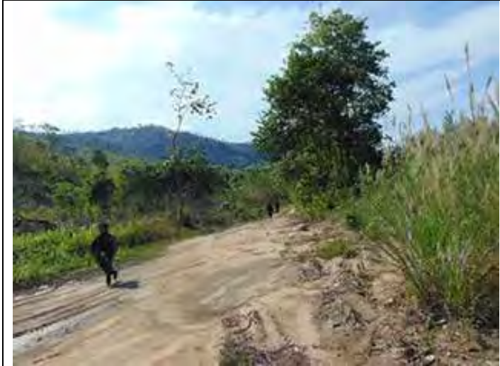
A group of soldiers from the border security force from KNLA are seen patrolling the border between Doooplaya District and Mergui-Tavoy District in April 2018.