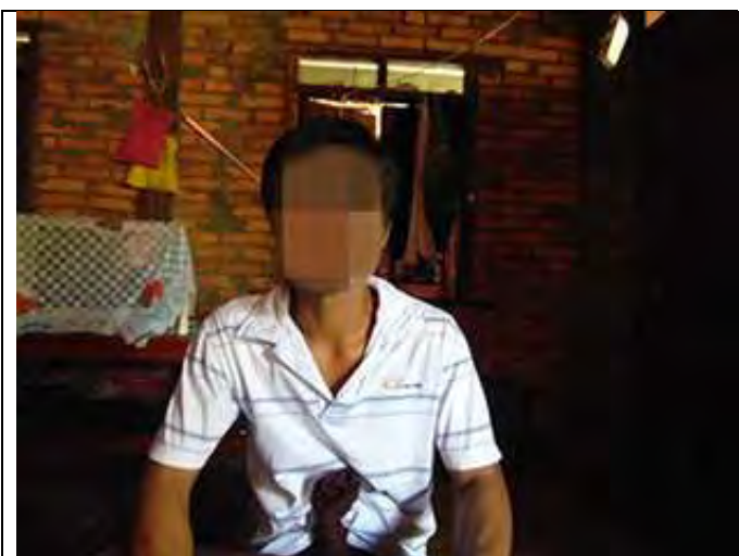
This photo was taken on April 12 th 2018. It shows a mahout from Man Aung village. He was one of the civilians arrested by the MNLA for illegal logging in January 2018.

Tensions continued to escalate between the KNLA and the MNLA, leading to an outbreak in fighting.