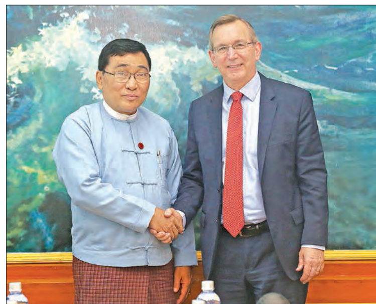
Union Minister Dr. Win Myat Aye shakes hands with US Ambassador Mr. Scot Marciel in Nay Pyi Taw yesterday.