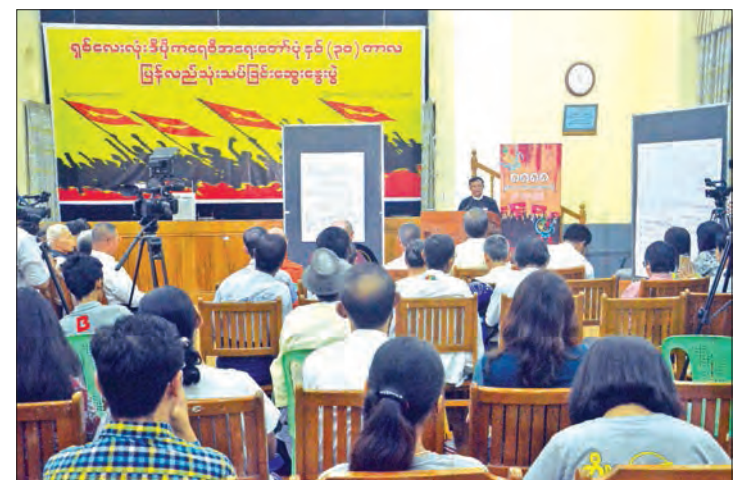
Political talks held to mark the 30 th anniversary of the 8888 Uprising at Yangon University in Yangon yesterday.

The 30 th anniversary of the 8888 Uprising will be held on a grand scale today.—Zaw Gyi (Panita) ■