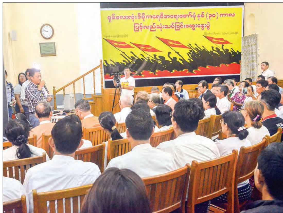
Political discussions held at the ceremony to mark the 8888 Uprising in Yangon.

During the 25 th silver anniversary of the 8888 Uprising, held at the Myanmar Convention Center in Mayangone Township, decisions were successfully made to establish a democratic federal union, amending the 2008 constitution or drafting a new one, and convening an inclusive national reconciliation conference. —Zaw Gyi (PaNiTa) ■