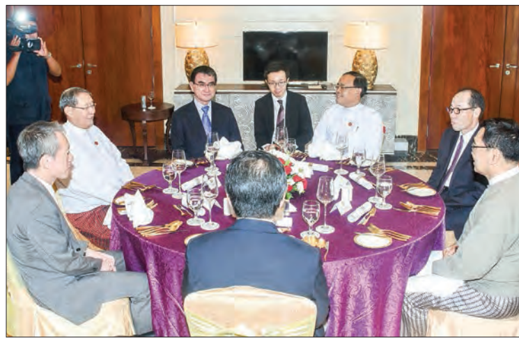
Minister for Foreign Affairs of Japan Mr. Taro Kono and his delegation being hosted a luncheon by Union Minister U Kyaw Tin yesterday.

UNION Minister for International Cooperation U Kyaw Tin hosted a luncheon for the Japanese Minister for Foreign Affairs Mr. Taro Kono and his delegation at the Park Royal Hotel in Nay Pyi Taw yesterday. — Myanmar News Agency ■