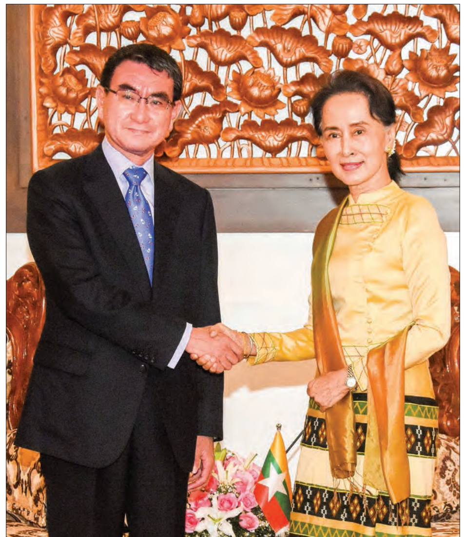
State Counsellor Daw Aung San Suu Kyi welcomes Japanese Foreign Minister Mr. Taro Kono in Nay Pyi Taw yesterday.

Japan welcomes progress, efforts made by Myanmar Government in resolving situation in Rakhine State