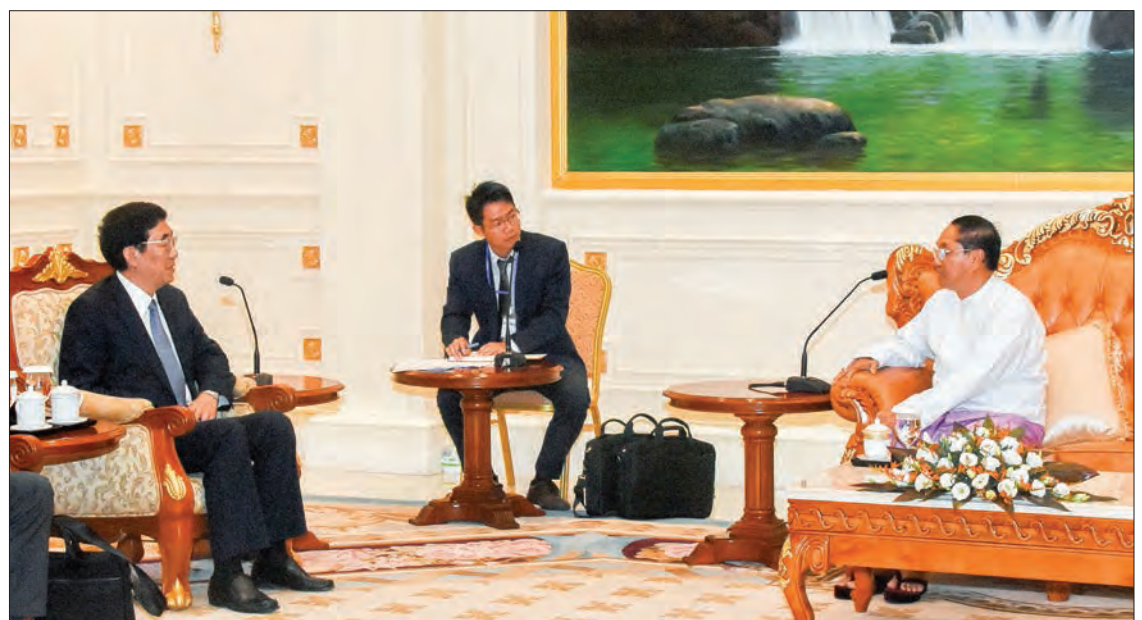
Vice President U Myint Swe meets with Mr. Bayin Choalu, Secretary of Jilin provincial committee of the Communist Party of China (CPC), in Nay Pyi Taw yesterday.

Present at the meeting were Union Minister for Transport and Communications U Thant Sin Maung, Union Minister for Labour, Immigration and Population U Thein Swe, Ministry of Foreign Affairs Permanent Secretary U Myint Thu and other officials. — Myanmar News Agency ■