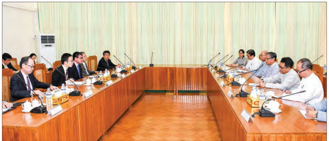
Union Minister for the Office of the State Counsellor U Kyaw Tint Swe holds talks with Minister for Foreign Affairs of Japan Mr. Taro Kono in Nay Pyi Taw yesterday.

Also present at the meeting were Deputy Minister for the Office of the State Counsellor U Khin Maung Tin, Ambassador of Japan to Myanmar H.E. Mr. Ichiro Maruyama and responsible officials.—MNA ■