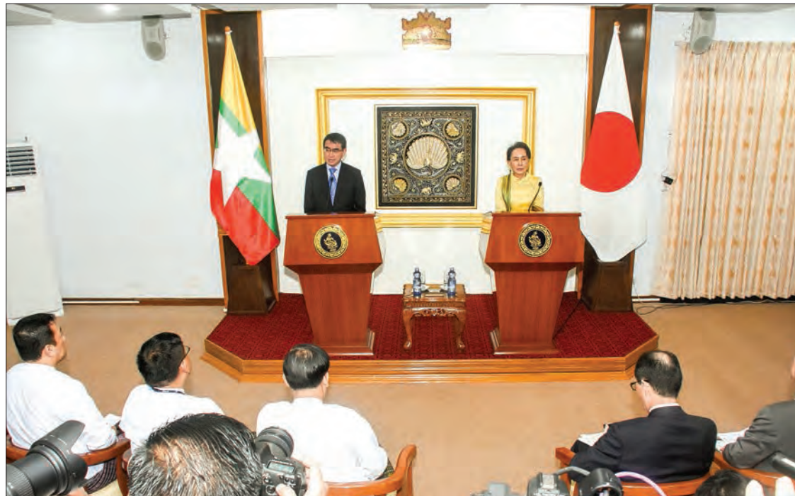
State Counsellor and Union Minister for Foreign Affairs Daw Aung San Suu Kyi holding a joint press conference with Minister for Foreign Affairs of Japan Mr. Taro Kono yesterday.

Mr. Taro Kono said that the government of Japan praised the Myanmar's government for the formation of an independent panel to investigate into al-