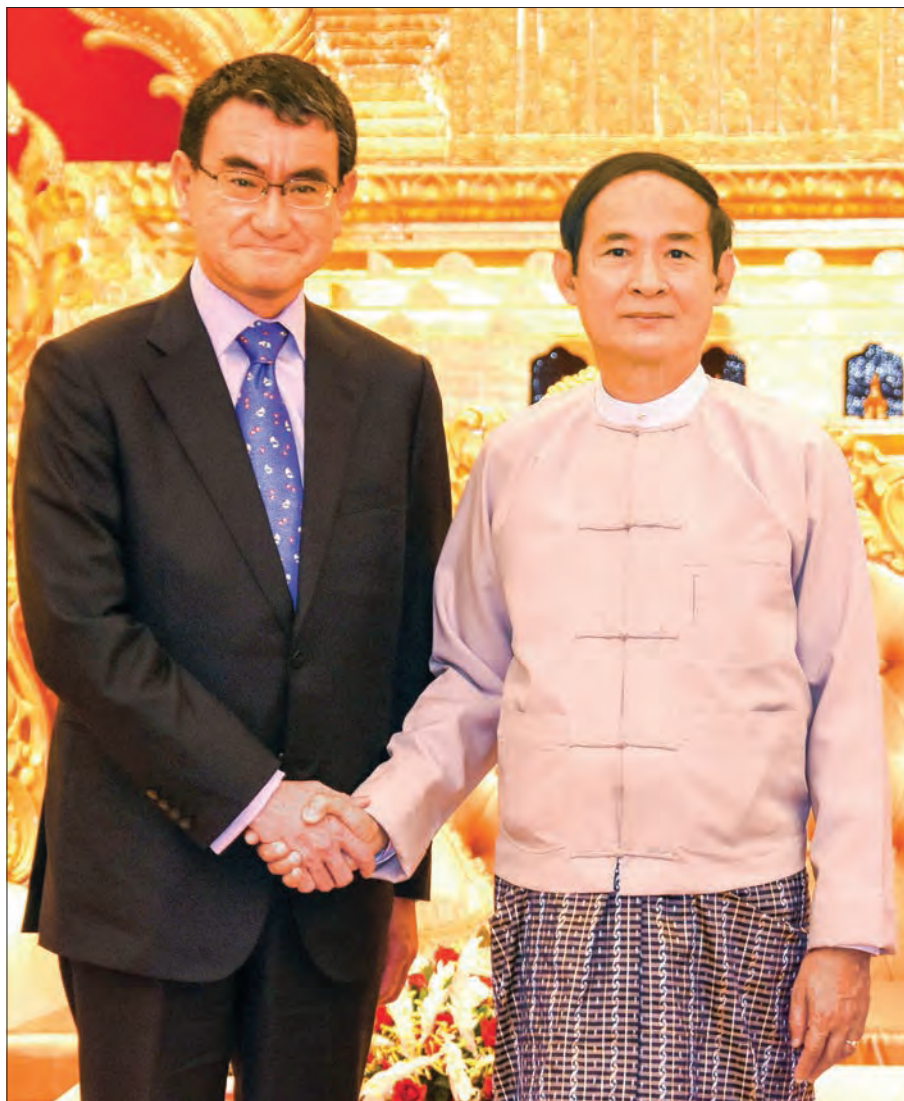
President U Win Myint shakes hands with Japanese Foreign Minister Mr. Taro Kono in Nay Pyi Taw yesterday.

Flood assistance, Yangon City civic development among topics discussed