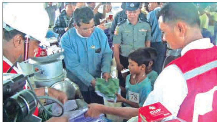
Deputy Minister U Soe Aung provides aids to children at Nga Khu Ya reception centre yesterday.