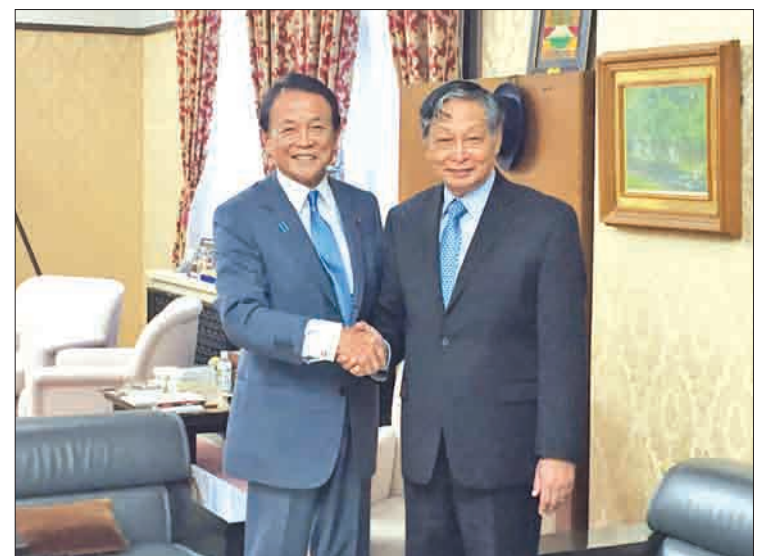
Union Minister U Kyaw Tint Swe shakes hands with Mr. Taro Aso, Deputy Prime Minister and Minister for Finance.

exchanged views on the strengthening of Myanmar-Japan friendship, closer cooperation in different sectors which can benefit both citizens, promoting people-to-people connectivity, Myanmar's peace process, current situation in Rakhine State, Myanmar's positive developments in the reform process and continuing the march on the federal democratic path.—MNA ■