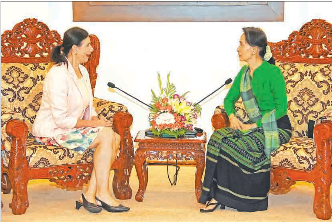
State Counsellor Daw Aung San Suu Kyi meets with Senator the Honourable Concetta Fierravanti-Wells, the Minister for International Development and the Pacific of Australia in Nay Pyi Taw.