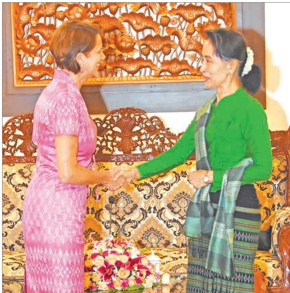
State Counsellor Daw Aung San Suu Kyi welcomes United Nations Secretary-General's Special Envoy on Myanmar Ms. Christine Schraner Burgener in Nay Pyi Taw yesterday.

State Counsellor and Union Minister for Foreign Affairs Daw Aung San Suu Kyi received United Nations Secretary-General's Special Envoy on Myanmar Ms. Christine Schraner Burgener at 10 am yesterday at the Ministry of Foreign Affairs in Nay Pyi Taw.