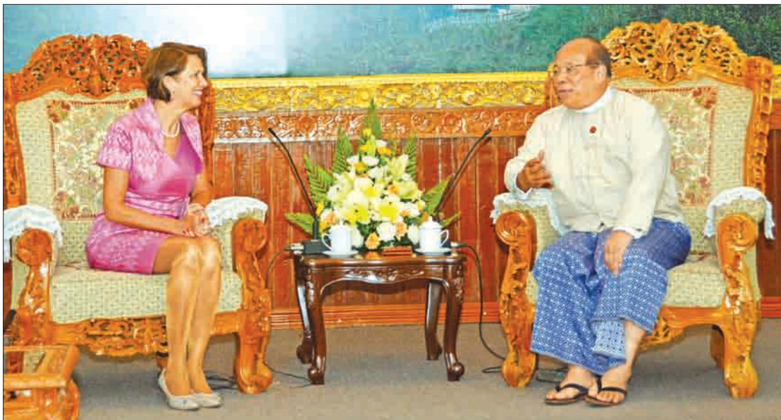
Union Minister U Thaung Tun holds talks with UNSG's Special Envoy Ms. Christine Schraner Burgener in Nay Pyi Taw yesterday.

U THAUNG TUN, Union Minister for the Office of the Union Government, received Ms. Christine Schraner Burgener, Special Envoy of the United Nations Secretary-General and her delegation at 11 am yesterday at the Ministry of the Office of the Union Government in Nay Pyi Taw. During the meeting, they discussed on co-operation between Myanmar and the United Nations as well as matters relating to the Rakhine State.— Myanmar News Agency ■