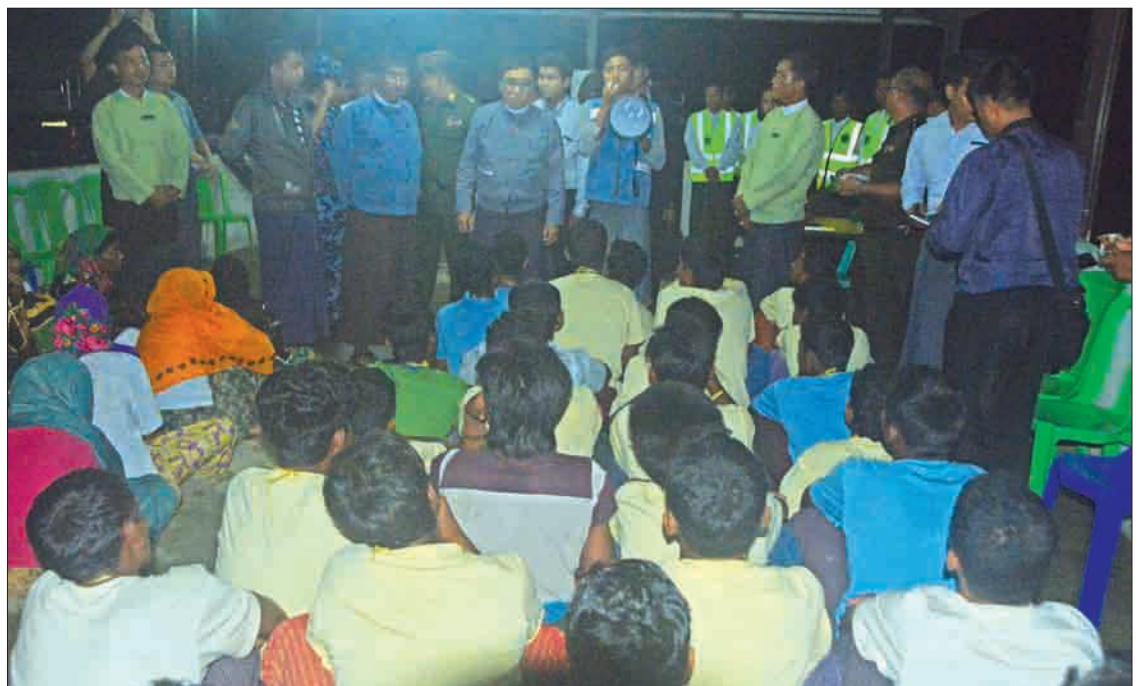
Union Minister Dr Win Myat Aye (Centre) and Officials meet the boat crash survivors at Nga Khu Ya reception centre.

The Social Welfare Department will send psychosocial support and the Ministry of Health and Sports will open a medical tent to provide health-care to the boat crash survivors.—Myanmar News Agency ■