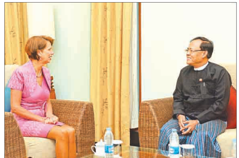
Union Minister U Kyaw Tin meets with UNSG's Special Envoy Ms. Christine Schraner Burgener in Nay Pyi Taw yesterday.

UNION Minister for International Cooperation U Kyaw Tin hosted a dinner to a delegation led by United Nations Secretary-General's Special Envoy on Myanmar Ms. Christine Schraner Burgener at 6:30 pm at Thingaha Hotel in Nay Pyi Taw.