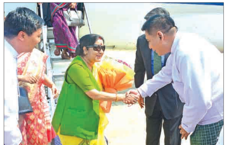
Indian Minister of External Affairs Ms. Sushma Swaraj arrives at Nay Pyi Taw International Airport yesterday.

The dinner was also attended by Union Minister for the Office of the Union Government U Thaug Tun, Union Minister for Industry U Khin Maung Cho, Union Minister for Construction U Han Zaw and other officials. — MNA ■