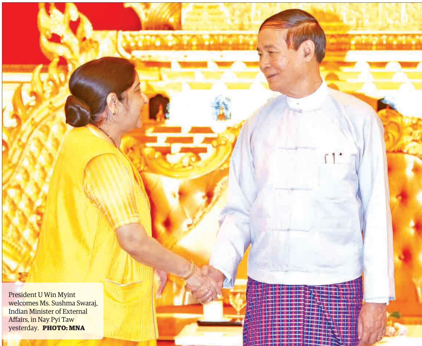
President U Win Myint welcomes Ms. Sushma Swaraj, Indian Minister of External Affairs, in Nay Pyi Taw yesterday.