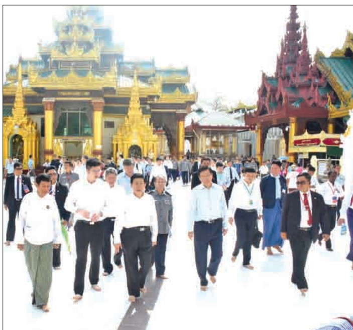
Chinese Minister of Public Security Mr. Zhao Kezhi and delegation visit Shwedagon Pagoda in Yangon yesterday.

Later, the Chinese Minister of Public Security donated two laptops to the police station, inspected the layout of the police station, the detention centre at the police station and the patrol car donated by the People's Republic of China.