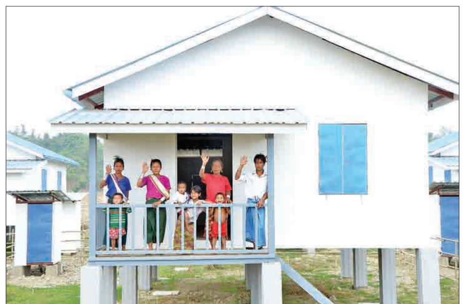
A Mro family waves from their new house in Kontaing Village.