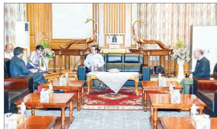
Pyithu Hluttaw Speaker U T Khun Myat meets with Indian Ambassador Mr. Vikram Misri in Nay Pyi Taw.