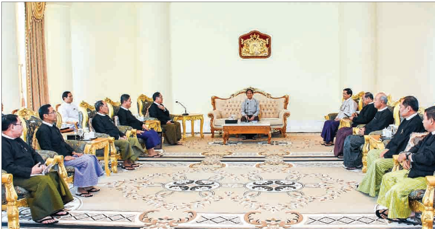
President U Win Myint, centre, meeting with Union Chief Justice U Htun Htun Oo, sixth from left, and Supreme Court Judges yesterday.