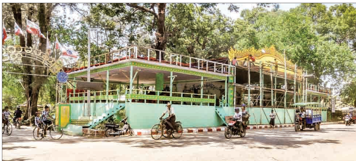
Local people ready to get wet in Traditional Thingyan Water Festival in Rakhine State.

He said the festivals will include the pandals, a large platform from which water is thrown at Thingyan participants, a competition in the making of Thanakha (Limonia acidissima) an ancient process that has been handed down the generations, sacred bathing of the images of Buddha, washing of the hair of old women by young ladies, keeping the Sabbath, doing charitable deeds, paying homage to the elderly and participating in water dousing