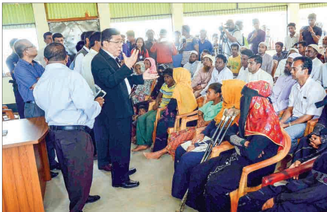
Union Minister Dr Win Myat Aye meets with people at IDP camps in Cox's Bazar, Chittagong.