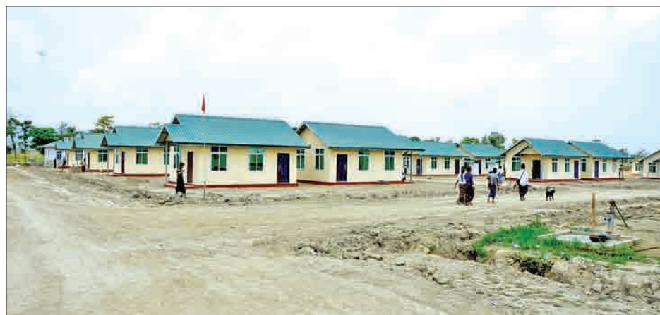
Mro ethnic villagers walk past their new houses in Maungtau.

The government expects that the construction of such villages will improve the livelihood and social conditions of the people.—Tin Soe ■