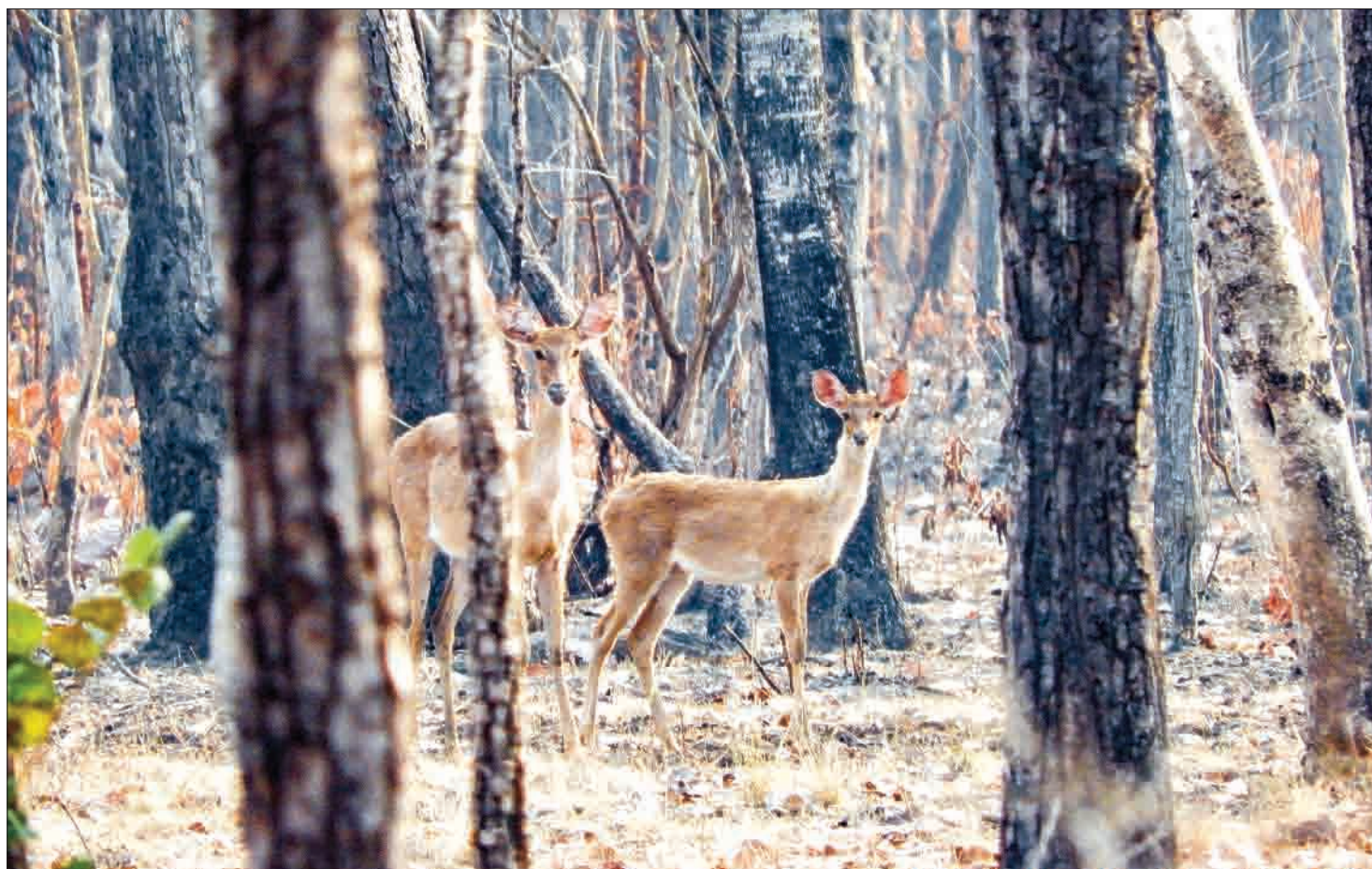
The endangered golden deer species is found in Myanmar, mostly in Chatthin and Shwesattaw Wildlife sanctuaries.