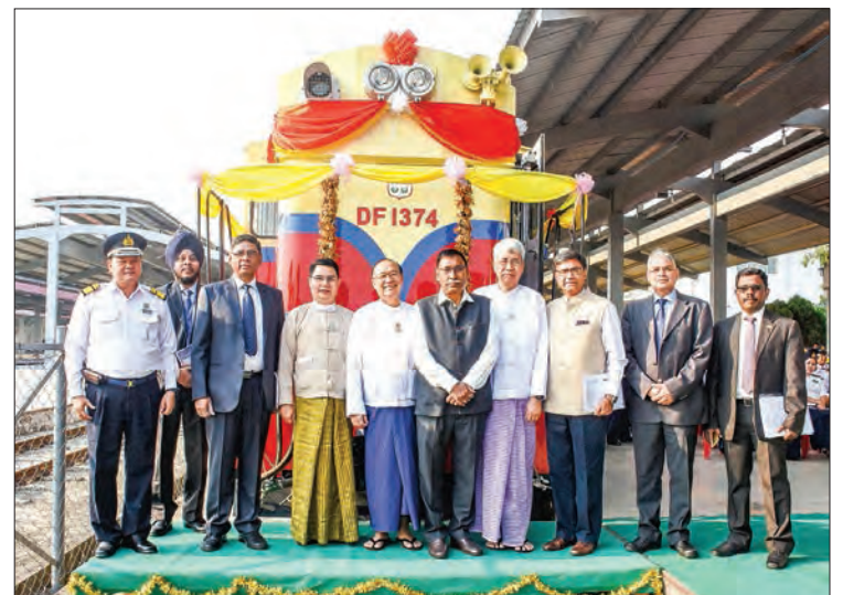
Officials from Myanma Railways and India's railway ministry pose in front of YDM-4 locomotive.