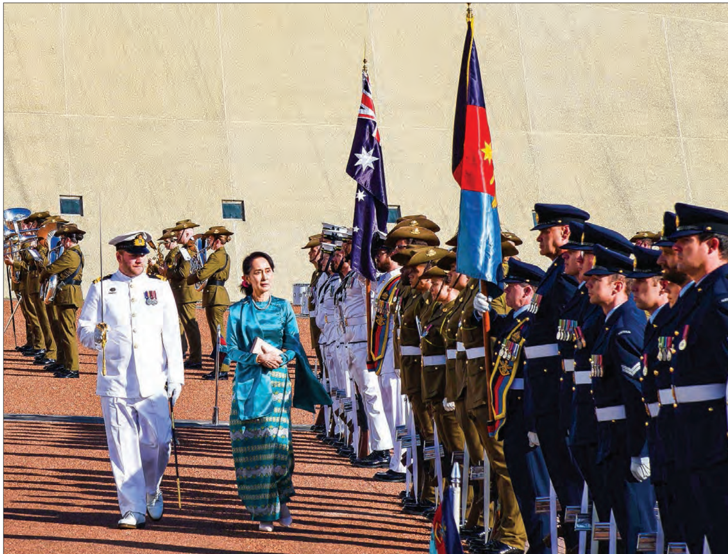
State Counsellor Daw Aung San Suu Kyi inspects the Honour Guard as she arrives in Canberra, Australia.