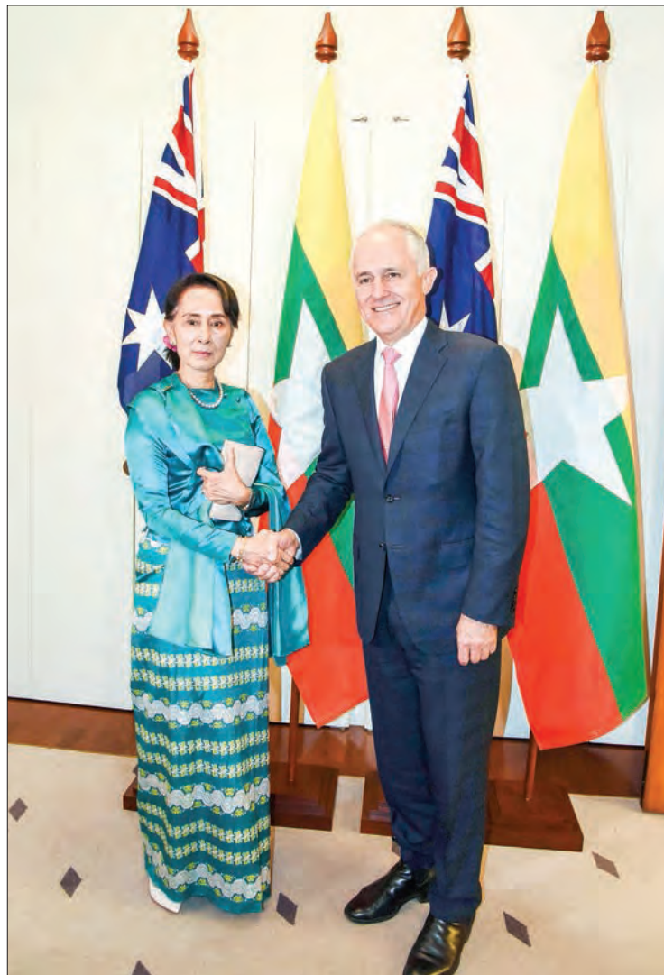
State Counsellor Daw Aung San Suu Kyi is welcomed by Australian Prime Minister Malcolm Turnbull in the Australian Parliament.

Later that night, Union Minister for the Office of the Union Government U Thaung Tun, and Union Minister for International Cooperation U Kyaw Tin attended a dinner hosted by Aust-Cham (Australia Chamber of Commerce) member companies, which are investing in the various sectors in Myanmar, at the Hyatt Hotel. At the event, the Union Ministers explained about Myanmar's political and socio-economic development and then answered questions posed by Australian companies —Myanmar News Agency ■