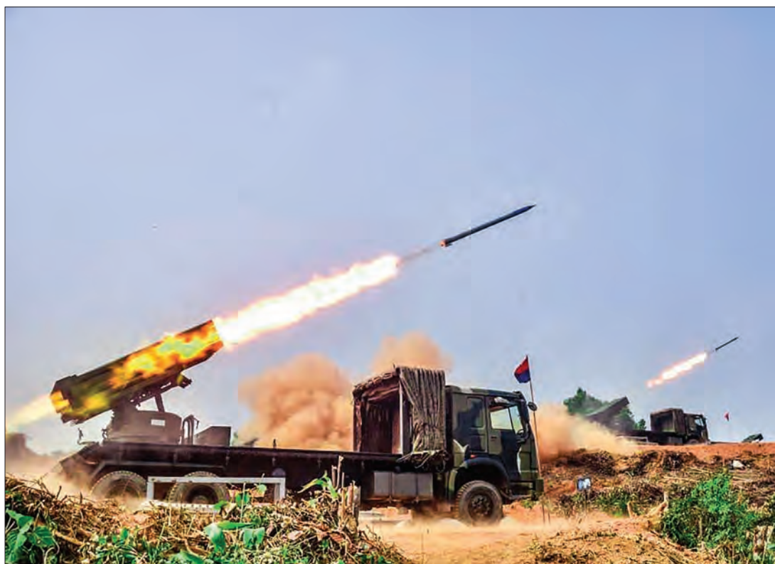
Army fires missiles during the combined military exercise in Patheingyi.

I wish you memorable and enjoyable 70th anniversary celebrations.