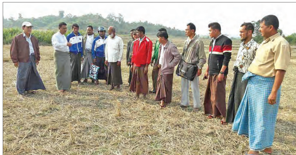
Authorities and local people inspect the mass grave reported in the Associated Press (AP) near Gu Dar Pyin Village in Buthidaung Township yesterday.

The terrorists and villagers had used machetes and homemade arms in the attack, and the security forces