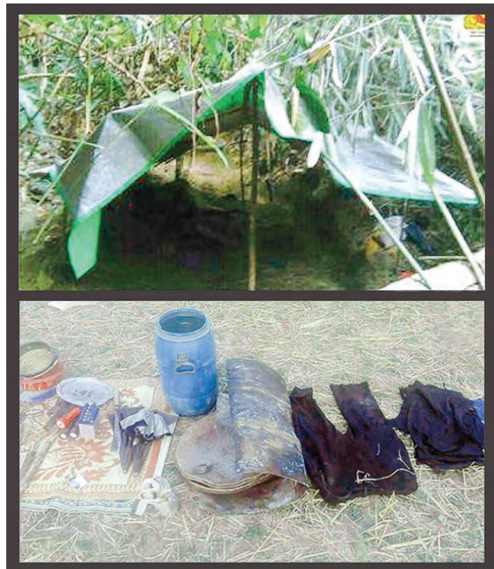
Evidences seized from the suspects.

They also confessed that plans were made to open terrorist training sites at Tinn May, Ngamyinbaw, Yinma Kyauktaw and Innchaw Badana villages. They were arrested while attending the first training session at Tinmay Village, according to the State Counsellor's Office Information Committee.— Myanmar News Agency