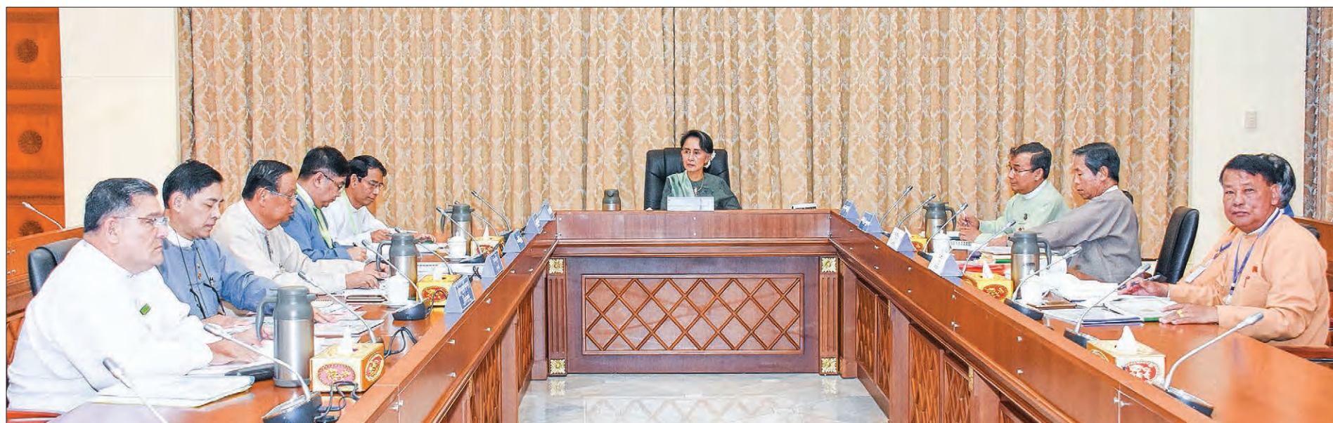
State Counsellor Daw Aung San Suu Kyi addresses in coordination meeting between ministries and Sagaing Region Government at the Presidential Palace in Nay Pyi Taw yesterday.

STATE Counsellor Daw Aung San Suu Kyi has stressed the need to improve the transport and electricity infrastructures in Sagaing Region to be able to attract foreign investments in the region.