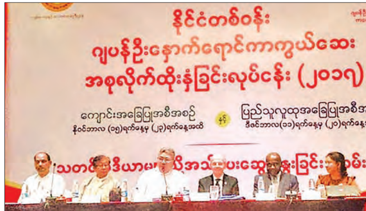
The ceremony for nationwide Japanese Encephalitis vaccination programme 2017 in progress.

"A vaccination team will not vaccinate more than 100 children. Then, we will keep a health staff at the vaccination programme health centre as a standby to ask for the medical biography of the children. We also will keep the health group to observe the post-vaccination condition of the children. We are also planning to provide the key message of the consequences of the JE vaccination to the parents. We are also making ready to provide emergency treatment if we find any post-vaccination problems,"