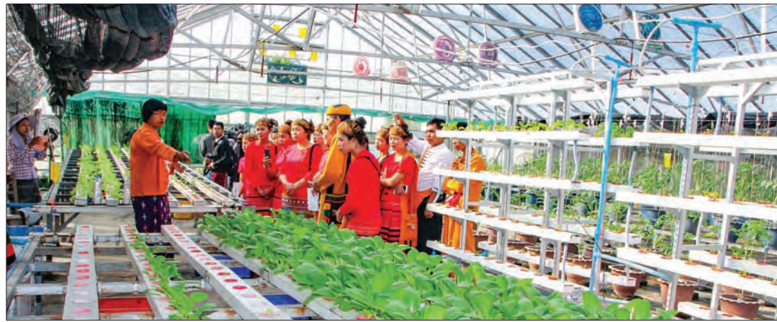
Ethnic delegation observes crop cultivation at Yezin University of Agriculture.

A delegation comprised of ethnic people from border areas visited Nay Pyi Taw yesterday at the invitation of the Ministry of Border Affairs.