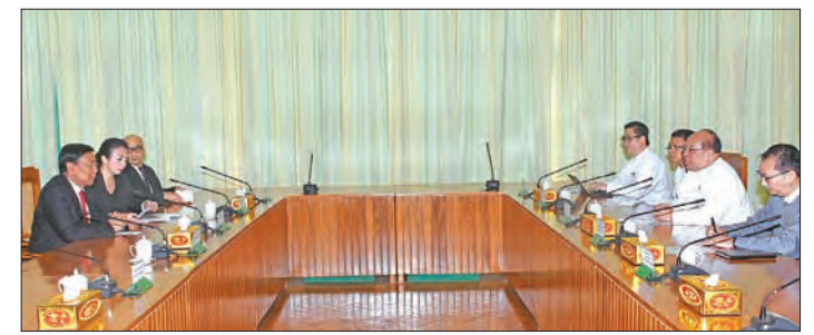
Union Minister U Thaung Tun receives Indonesia Minister Dr. H. Wiranto in Nay Pyi Taw on 5 December.

H.E. U Thaung Tun, Union Minister for the Office of the Union Government, received Coordinating Minister for Political, Legal and Security Affairs of the Republic of Indonesia, H.E. Dr. H. Wiranto in Nay Pyi Taw at 10 am on 5 December 2017. During the meeting, they