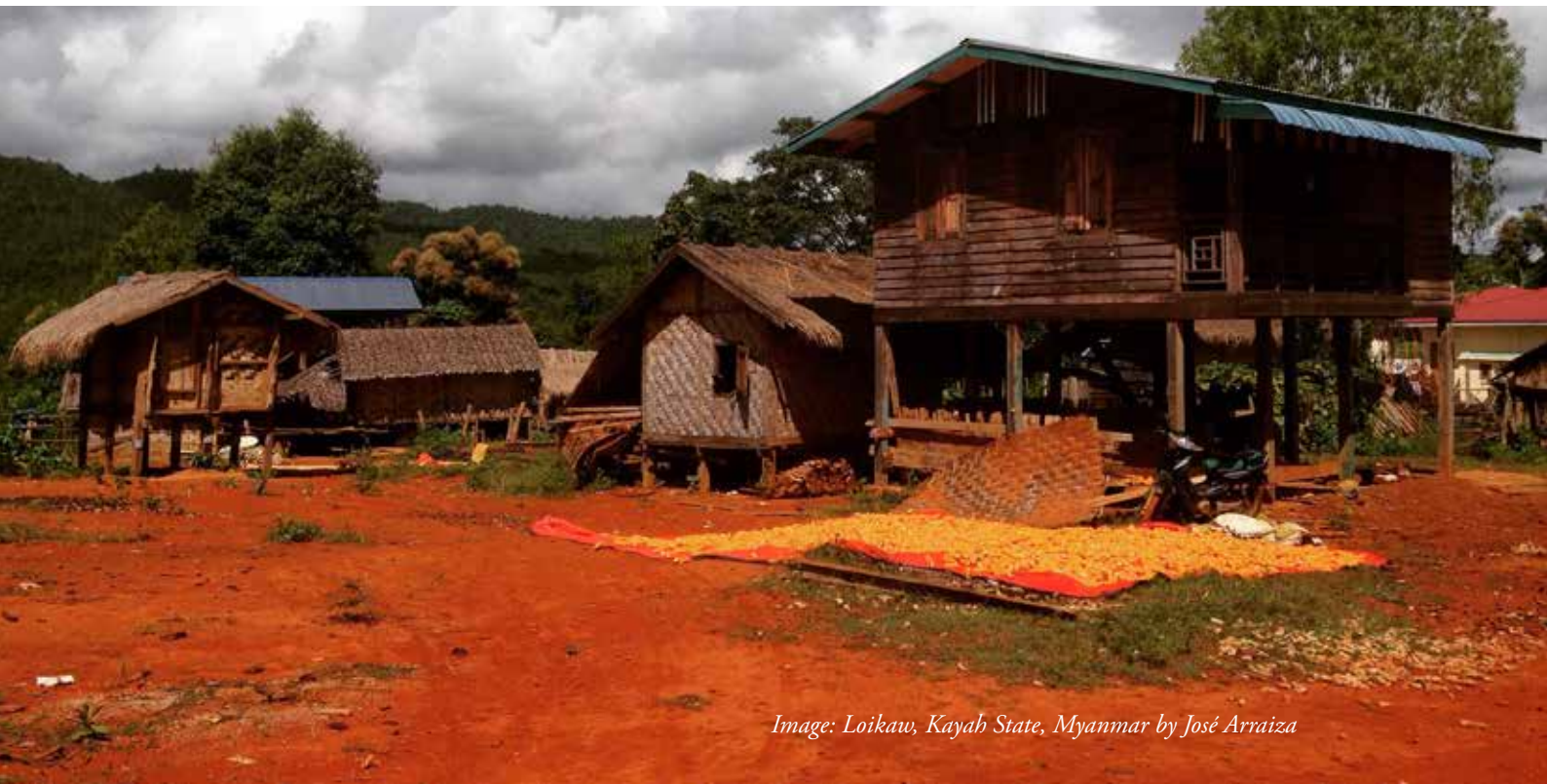
Image: Loikaw, Kayah State, Myanmar