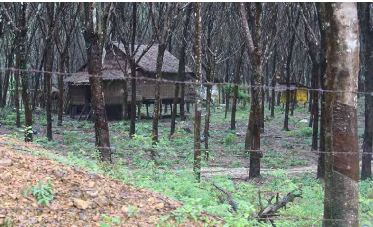
Image: Pa Pyin, Myeik Township, Tanintharyi Region

A: Restitution rights begin to apply the moment you are displaced from your home due to circumstances beyond your control. The concept of restitution, of course, has a lengthy history in terms of international law and, has long been accepted as an important judicial remedy within a wide range of national and international legal codes. It is on these foundations that much of the subsequent progress specifically on housing, land and property restitution has been built. International law approaches restitution generally through the lens of infringements of law due to what are defined as wrongful acts or omissions attributable to States through the application of the law of State responsibility. One of the premier international law making bodies, the International Law Commission, in their 2001 Articles on State Responsibility outlines the legal meaning of the term ‘internationally wrongful acts’, as well as noting the following: Article 34: A State responsible for an internationally wrongful act is under an obligation to make restitution, that is, to re-establish the situation which existed before the wrongful act was committed, provided and to the extent that restitution: (a) is not materially impossible; (b) does not involve a burden out of all proportion to the benefit deriving from restitution instead of compensation.