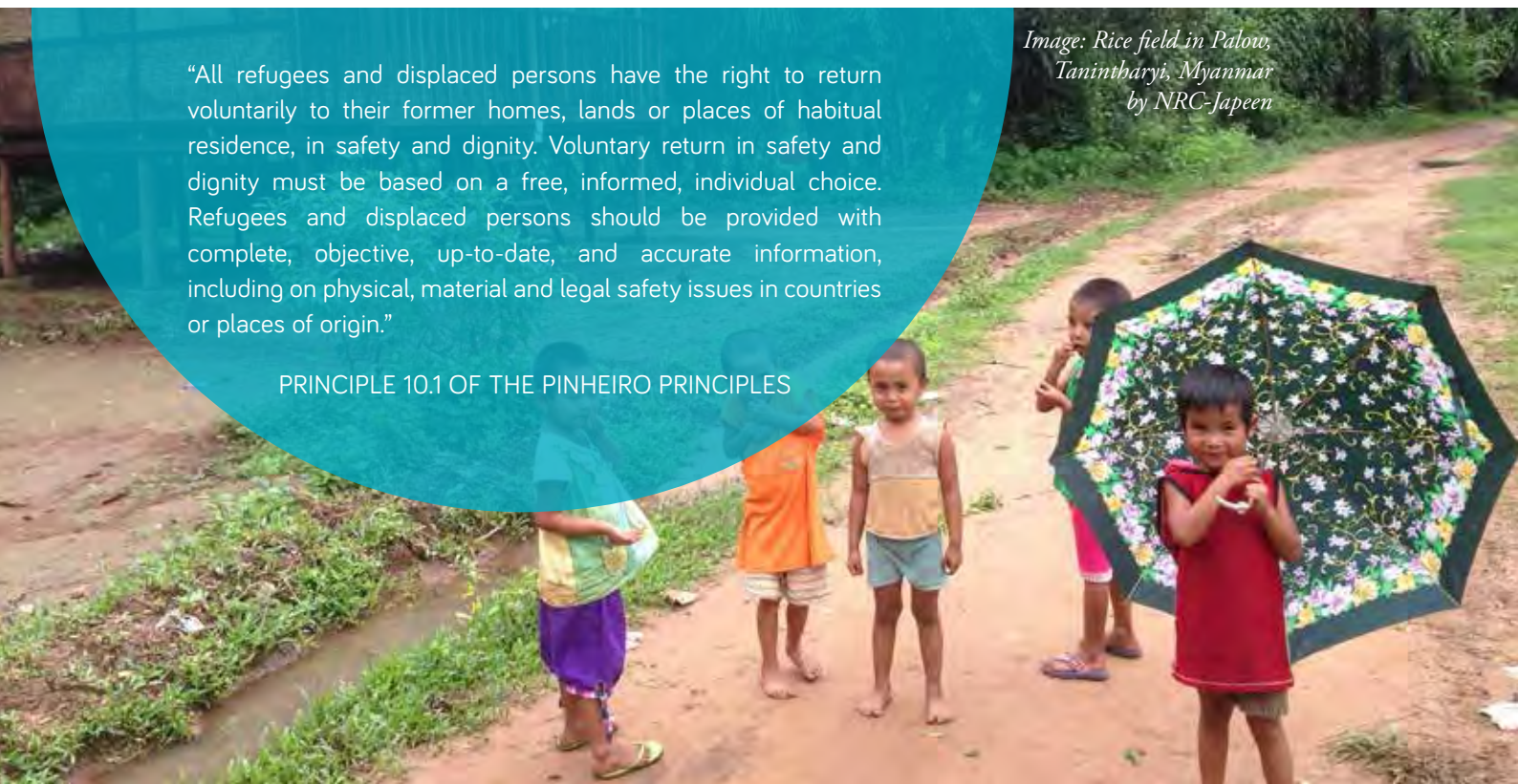
Image: Rice field in Palaw, Tanintharyi, Myanmar

PRINCIPLE 10.1 OF THE PINHEIRO PRINCIPLES