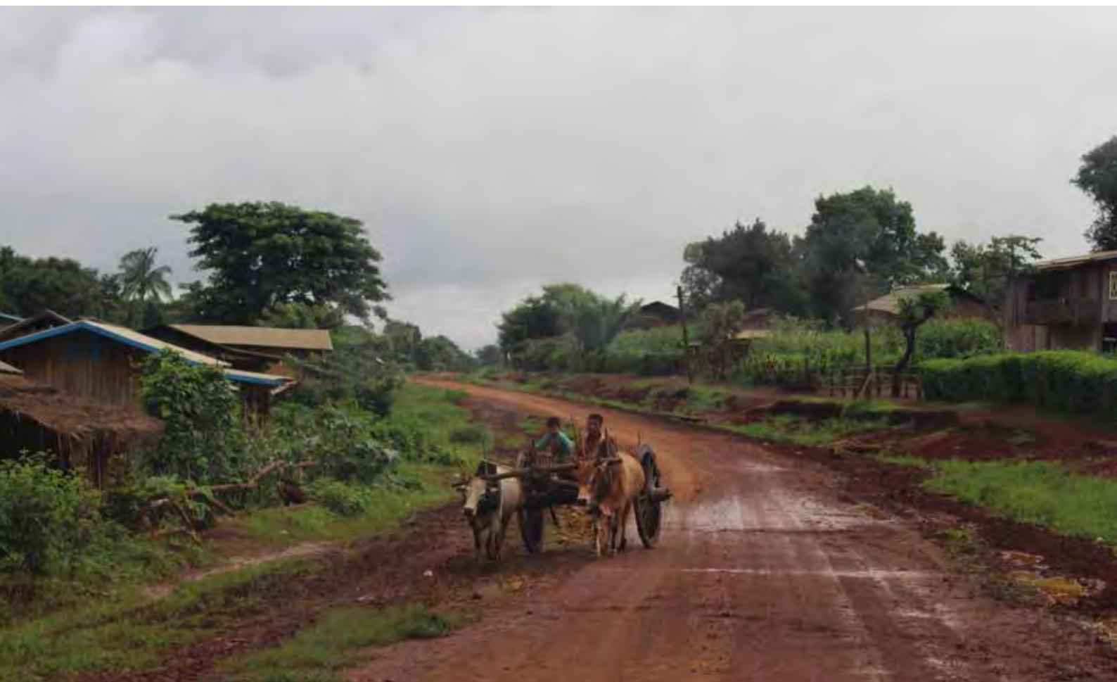
Image: Pho O Kone, Palaw Township, Tanintharyi Region

Particularly crucial in these contexts, of course, are the expressed wishes of those holding restitution rights; beneficiaries of these rights can neither be forced to return, nor forced to accept a resolution of their restitution claims unless this is fully consistent with the law.