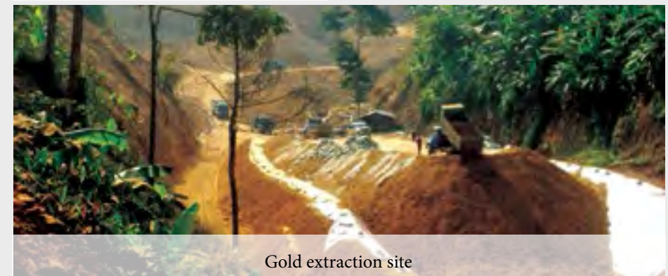
Gold extraction site