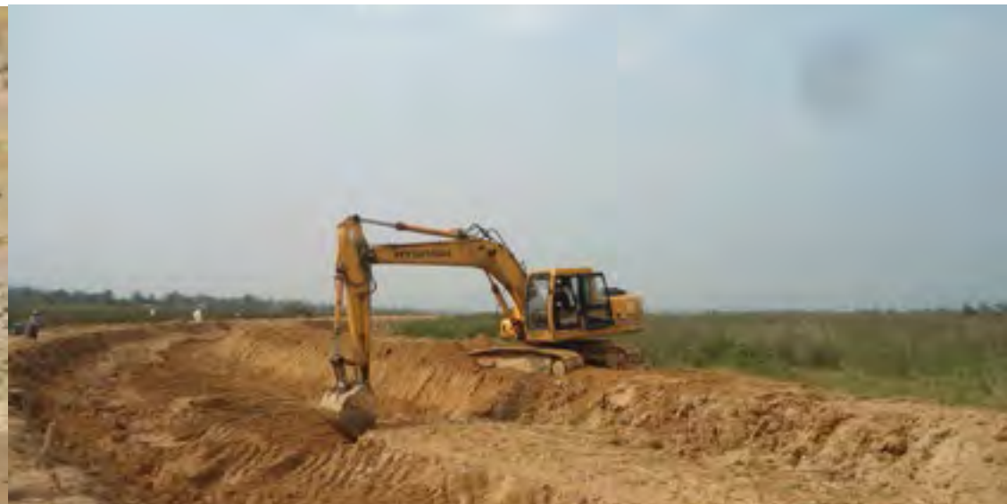
Dredging the Nam Kham stream