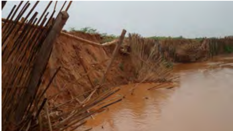
Collapsed river bank barriers

After Sai Aik Pao ordered the companies to restore the waterways and lands, the companies agreed to restore a 4,400 feet section of the Nam Kham stream that runs alongside Na Hai Long village and down to the Nam Len River. It was agreed that Sai Thip and Loi Kham Long would each restore 40% of the waterway, and Sai Saik Pyo Ye would restore 20%. This division was according to the number of mining concessions operated by the companies: Sai Thip and Loi Kham Long each had four concessions, and Sai Sai Pyo Ye only had two.