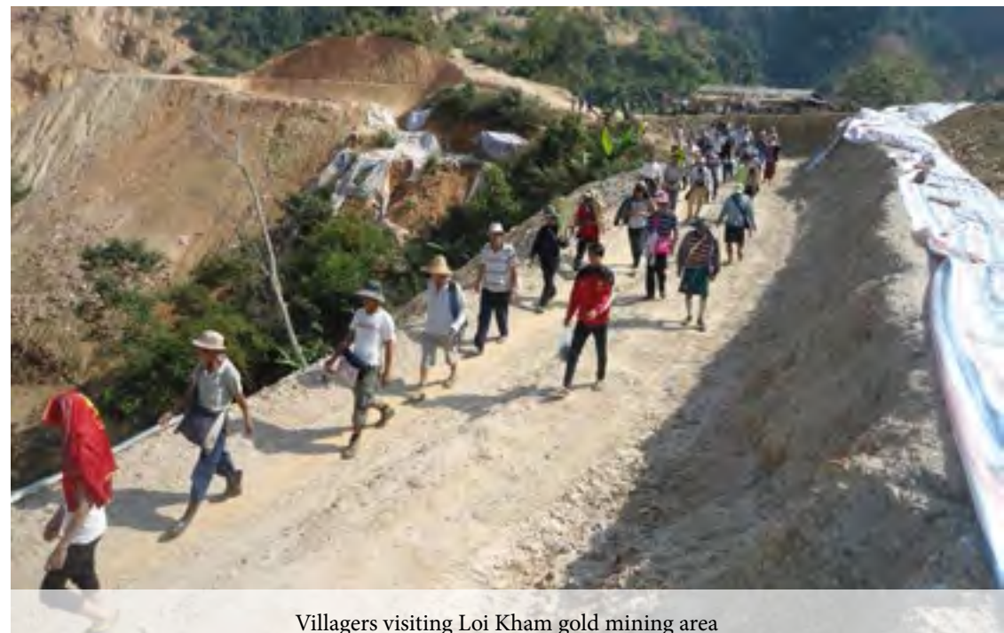
Villagers visiting Loi Kham gold mining area