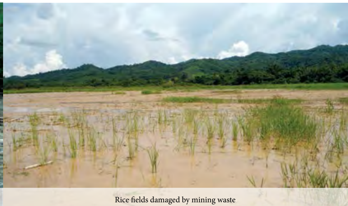
Rice fields damaged by mining waste