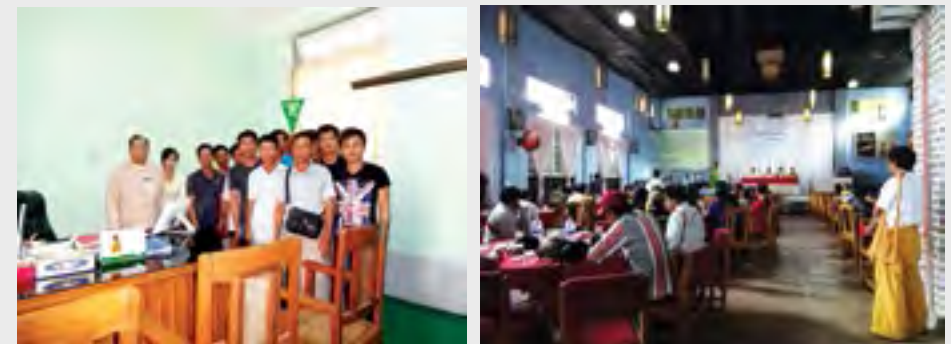
Na Hai Long villagers meeting with Shan State Forestry and Mining Minister Sai Aik Pao