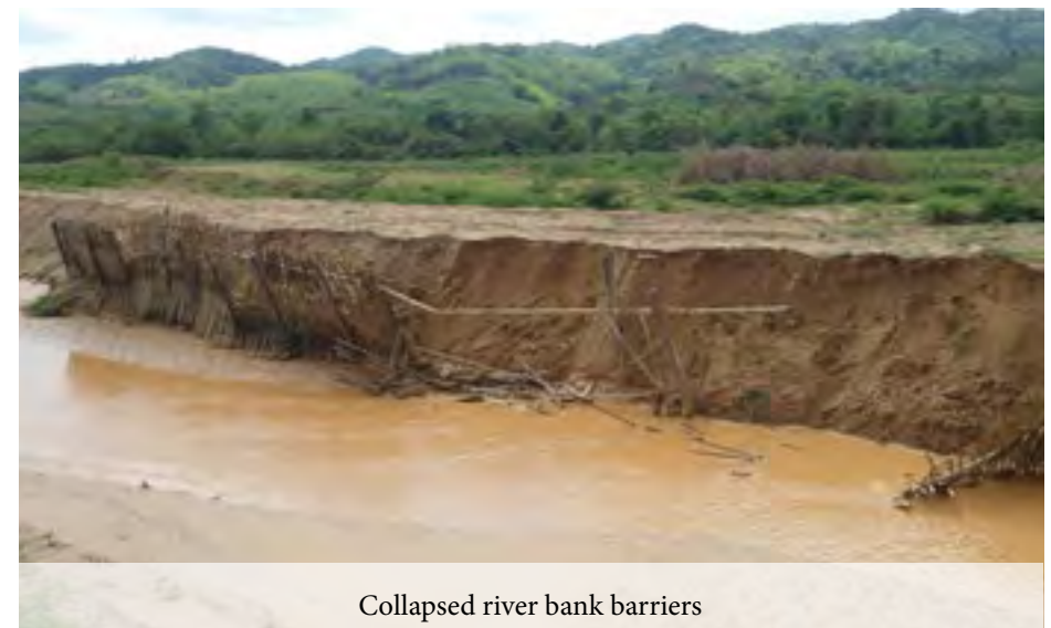
Collapsed river bank barriers

In order to continue pressing their demands to stop the mining, villagers have documented what has happened on the ground over the past year and compiled the information into this booklet.