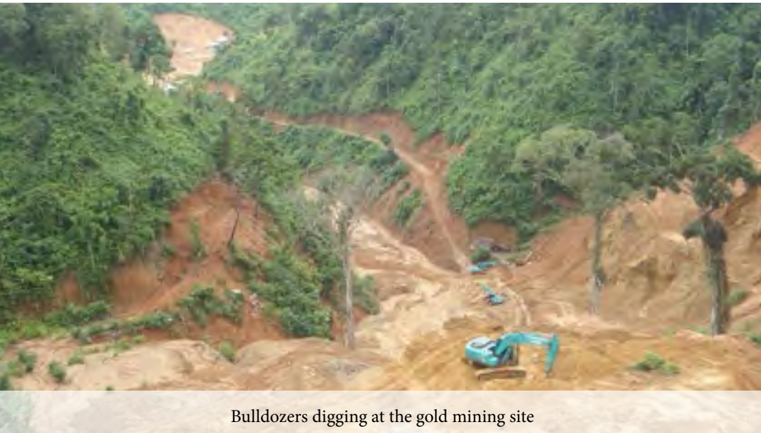
Bulldozers digging at the gold mining site