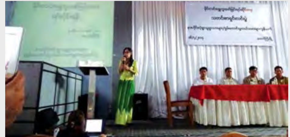
Press Conference by Na Hai Long villagers at Taunggyi

Finally, villagers call for a nationwide ban on the use of cyanide and other dangerous chemicals in mining operations in Burma.