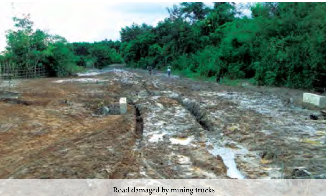
Road damaged by mining trucks