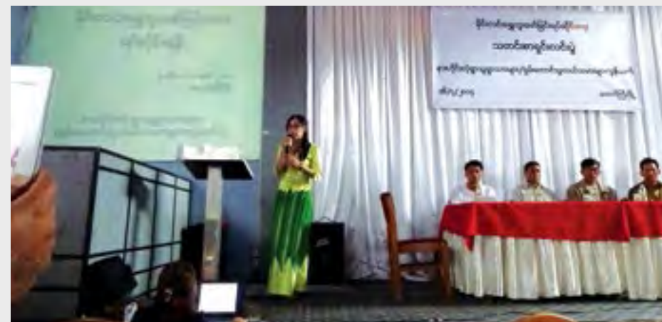
Press Conference by Na Hai Long villagers at Taunggyi

Finally, villagers call for a nationwide ban on the use of cyanide and other dangerous chemicals in mining operations in Burma.