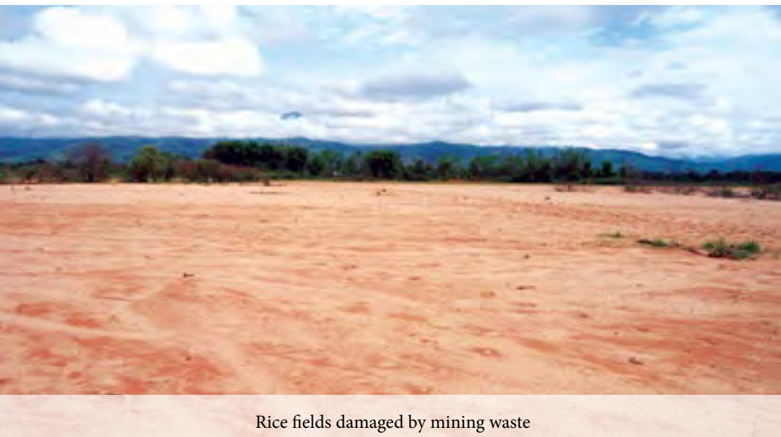
Rice fields damaged by mining waste