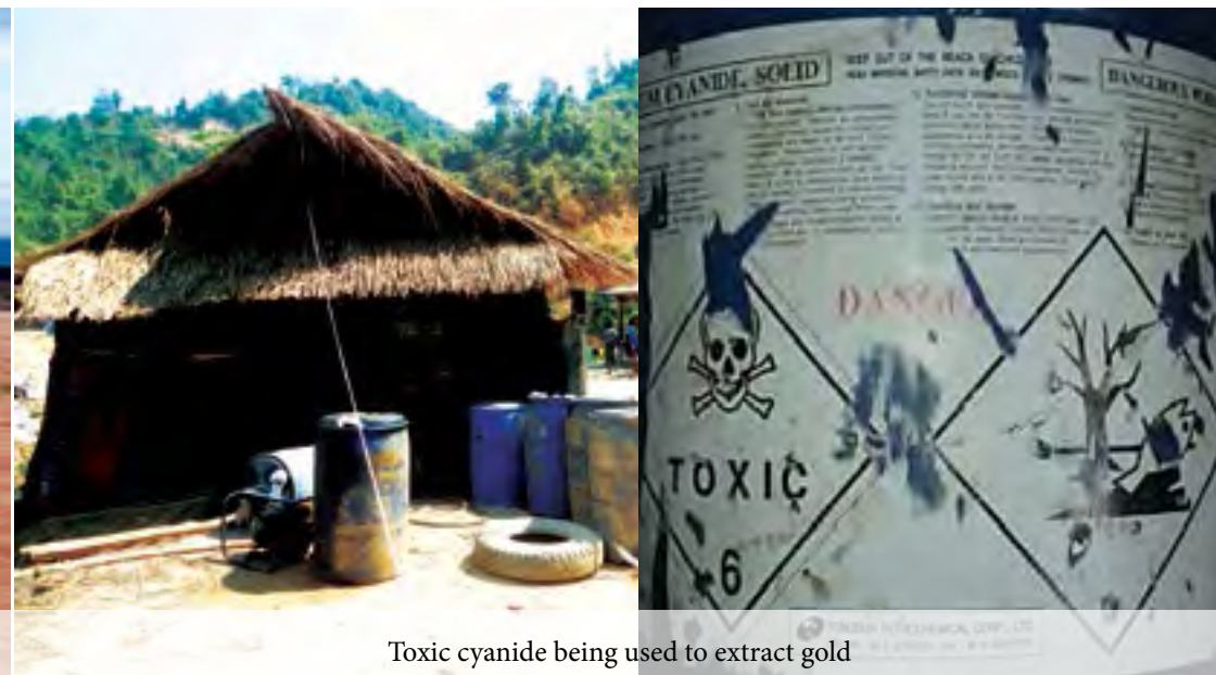
Toxic cyanide being used to extract gold