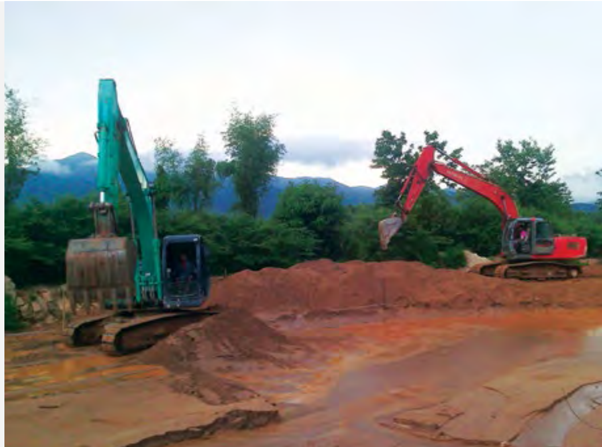
Dredging the Nam Kham stream