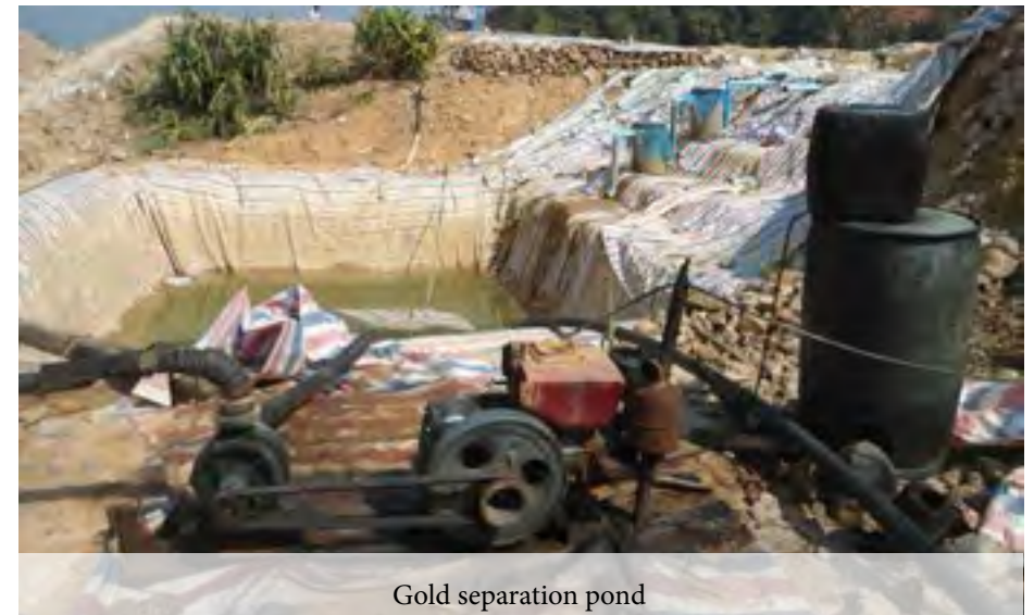
Gold separation pond

In the first half of 2015, two women in the village delivered babies. Both babies were born underweight. One, which weighed just over 1 kg, died soon after birth.