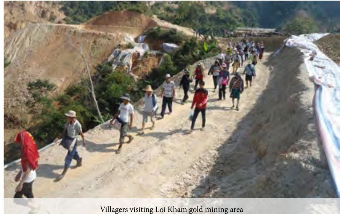
Villagers visiting Loi Kham gold mining area