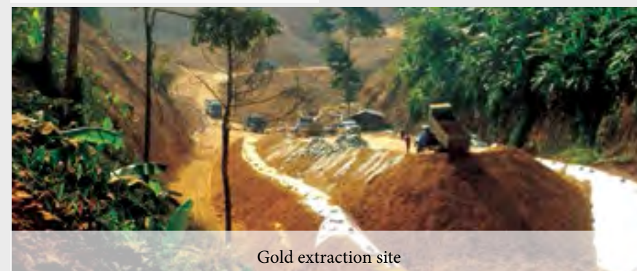
Gold extraction site