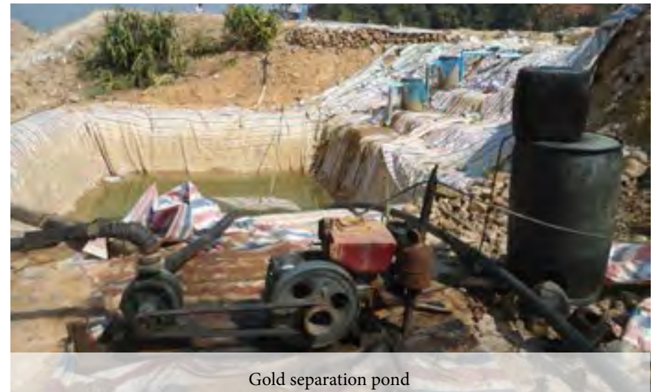
Gold separation pond

In the first half of 2015, two women in the village delivered babies. Both babies were born underweight. One, which weighed just over 1 kg, died soon after birth.