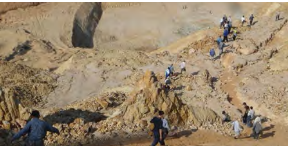
Villagers visiting Loi Kham gold mining area