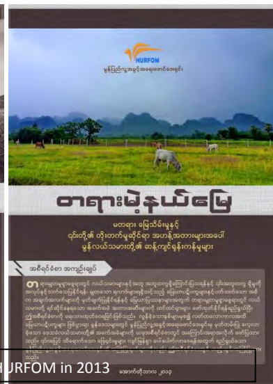
"Disputed Territory", published by HURFOM in 2013