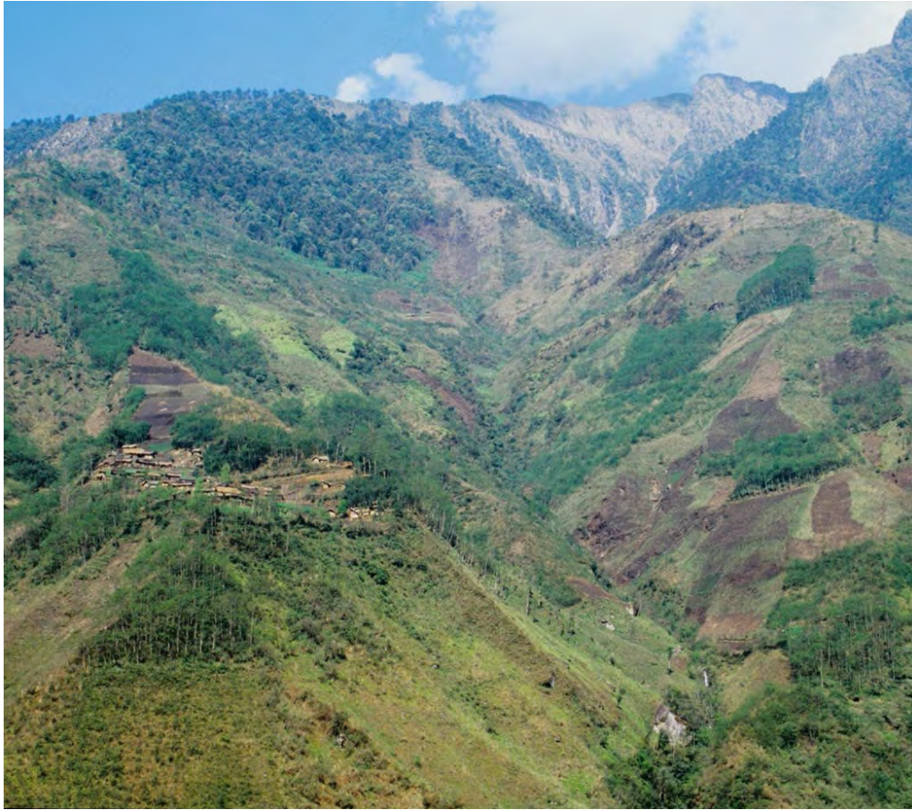
Figure 3. Patchwork of alder fields on mountain slopes, central Dulong Valley.