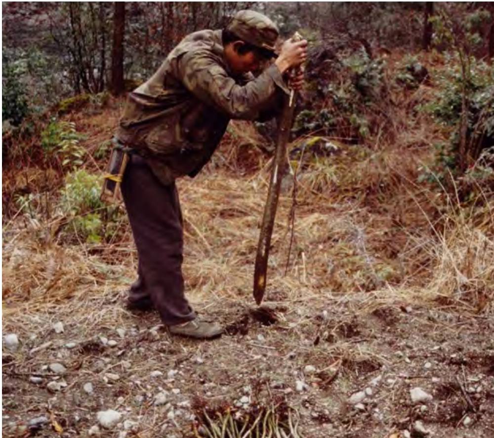
Figure 4. Planting of alder saplings, Dizhengdang village, Northern Dulong Valley.