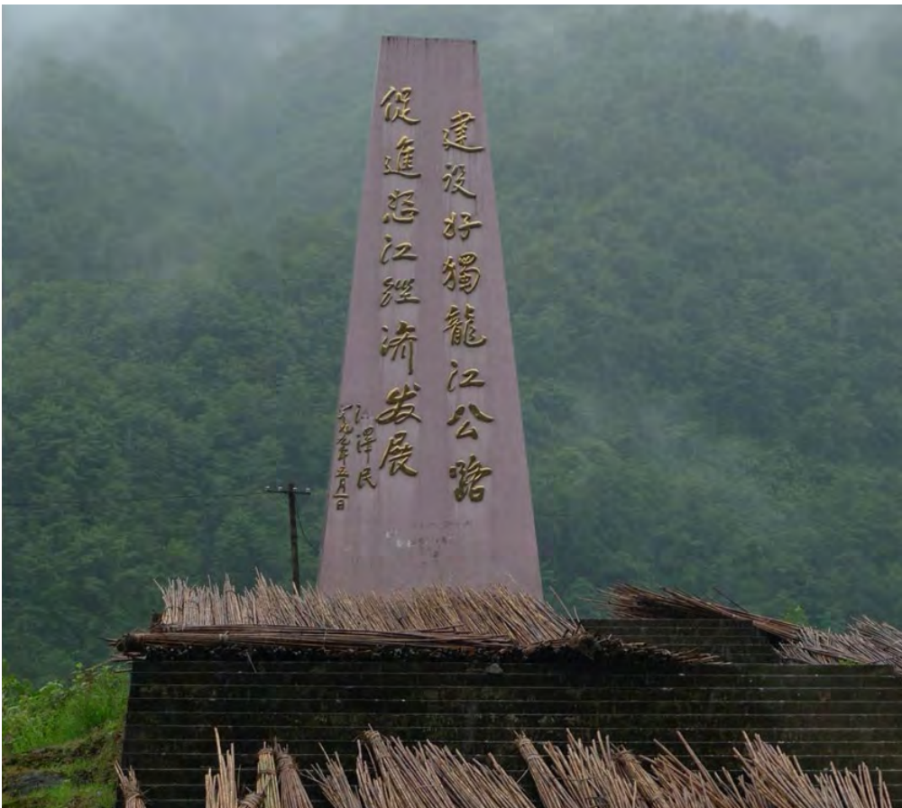
Figure 2. Memorial in honor of the road, Kongdang village, 2010. The memorial reads: "Building the road to the Dulong River, promoting the economic development of Nujiang." Jiang Zemin, 1 May 1999.