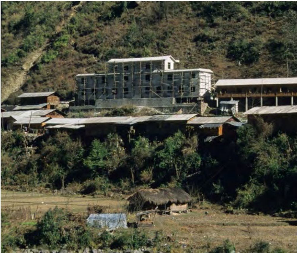
Figure 1. One of the first multi-story buildings in the Dulong Valley, Kongdang village, County seat.