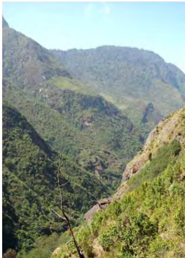
Figure 1: Shifting cultivation landscape in KCA

The term shifting cultivation is often used interchangeably with slash-and-burn or swidden agriculture. A wide variety of practices across the globe falls under these terms, but not all can be considered shifting cultivation. In fact, slash-and-burn is a land clearing method, which is used by many for the permanent clearing of land (Kerkhoff and Sharma 2006). Shifting cultivation is characterised by a short ‘cultivation phase’ of a few years followed by a relatively longer ‘forestry phase,’ usually referred to as the ‘fallow’ (Kerkhoff and Sharma 2006). Fujisaka et al (1996) define ‘traditional’ shifting cultivation as the form in which indigenous communities clear and cultivate secondary forests, and leave parcels