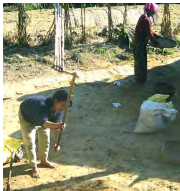
Figure 7 : Threshing finger millet by using multiple stick threshers