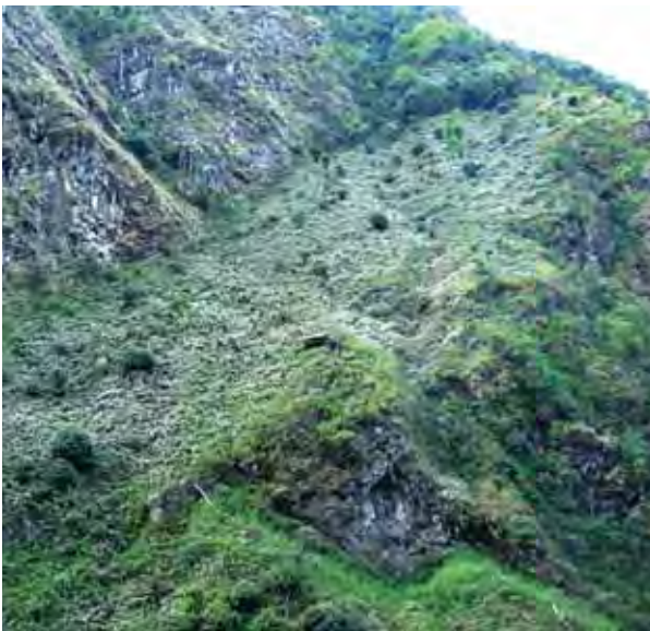
Figure 12 : Chiraito cultivation in fallow field

Chiraito grows best on recently burned sloping land which has enough rainfall and moderate sunlight. It is said to be best in black sandy loam soil. Silty soil is also regarded as best for its growth, and farmers say it prefers north-facing slopes. In the KCA it can be grown as part of the shifting cultivation cycle, but land owners with large holdings prefer to grow chiraito under a non-shifting cultivation scheme as the high market price makes it attractive. They clear the land through slash-and-burn and grow chiraito , after which there is another cycle of slashing and burning. There is no rotation of plots and no fallow phase. Wild chiraito is collected from the forest, sometimes damaging the plant through harvesting before the seeds are ripe or by uprooting the whole plant to sell it to the local traders. Recently, chiraito cultivation is also being promoted as an income generation activity for community forest user groups.