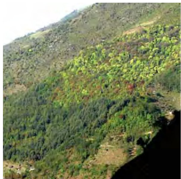
Figure 14 : Community forest in KCA

On the negative side, people reported that grazing livestock often damage the chiraïto seedlings in their early stages. Lack of knowledge on production technologies and raising seedlings is a problem with local farmers reporting the cultivation of chiraïto being quite technical. Illegal harvesting, unsustainable harvesting and theft of privately grown seedlings is a growing problem due to the high value of the plant. In addition, the aforementioned fluctuating prices and lack of organized market systems is another disadvantage.