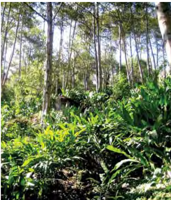
Figure 10 : Cardamom field under alder trees

Agroforestry with large cardamom ( Amomum subulatum ) (Figure 10) and alder is a traditional farming system developed by farmers in neighbouring Sikkim, India (Sharma et al 2000), which has gained increased popularity in eastern Nepal during the last 10-15 years. Farmers convert the best shifting cultivation land to cardamom-with-alder plantations, as it requires shade and moist soils. According to Sharma et al (2000), the main advantages of cardamom are that it can grow on relatively steep slopes and that it requires very little labour. After its first establishment, farmers only need to harvest the crop every year from the third year onwards. The most common shade provider is the alder ( Alnus nepalensis ), which is a nitrogen-fixing tree species. This system is now practiced in all the study villages, except Lawajin, and is common between the altitudes of 1,700-2,100m. It is a fast-growing economic enterprise for people in the study area, and more and more people are showing interest. The cultivation area of individual farmer ranges up to 0.26 square kilometres. Farmers reported that they will start to get returns three years after planting for about 20 years without much investment. According to them, this production is feeding them for three to four months a year.