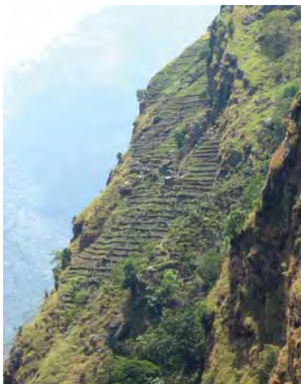
Figure 15 : Terracing may not be suitable on these extremely steep slopes

In the literature so far published on the Kangchenjunga Conservation Area (KCA) and its inhabitants, the existence of shifting cultivation as a land use practice is barely recognised. In the current KCA Management Plan (2063-64 to 2067-68 9 ), there is no mention of any specific activities for shifting cultivators. Moreover, it is difficult to distinguish shifting cultivation plots from rain-fed permanent plots and fallow forests from the protected forests on remotely sensed maps. Even the tenure status (whether the land is registered as private or government land) does not tell the true story, because many of the traditional shifting cultivation lands have not been registered,