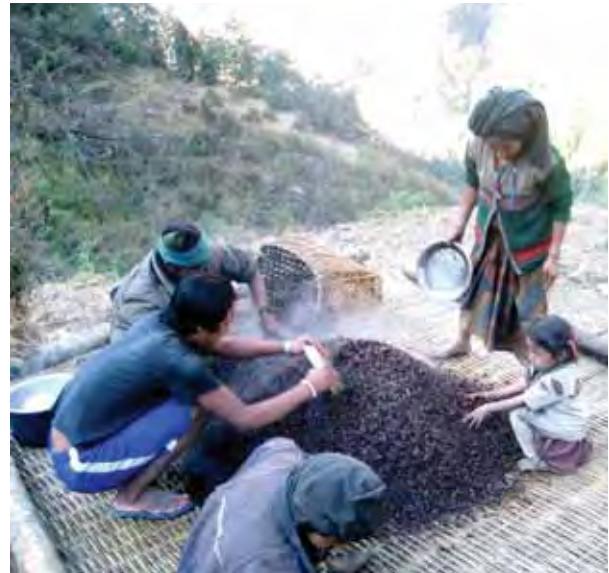
Figure 11: Local method of curing and shining cardamom

Curing is a local processing method that involves smoking, to make it easier to separate the fruit. After the fruit is separated, it is washed and cleaned it is dried in the sun for 10 days or put in to the smoking chamber. People use a little bit water and gently massage the dried fruit to make the fruit shine before selling to the trader. (Figure 11) Normally, the dried fruit is sold to the local traders in the village. Sometimes, people from district headquarters will come to buy in bulk and traded in the other areas. The price of the product varies; normally people sell it by the mon (40 kg), which would raise around Nrs 8,000-9,400. The cardamom