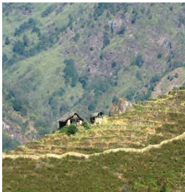
Figure 9 : Malingo bamboo mat fencing used to protect against wildlife