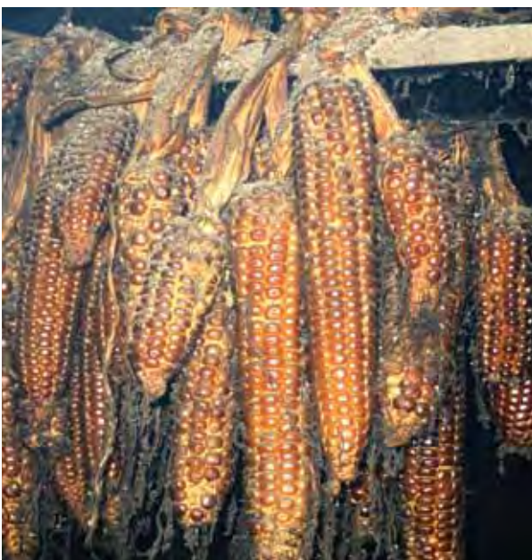
Figure 8 : Prematurely harvested maize needs to be boiled and smoked to preserve it for future use