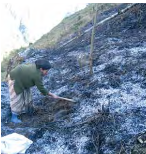
Figure 6 : Mixing the ash into the soil to conserve nutrients

This lack of registration is partly due to complications in the process. The land registration process is only possible for bari land as officials are reluctant to register land which during its long fallow period looks like forest. In fact, national forests and fallow land with a large amount of forest cover have been handed over to the communities under community forest programmes.