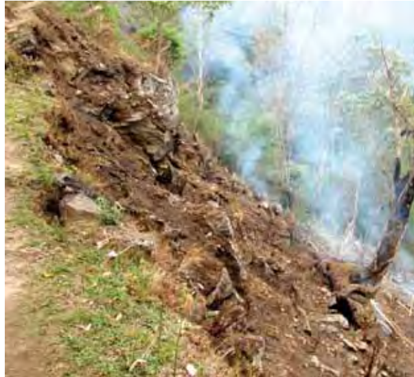
Figure 3 : Burning of slashed materials during land clearing

first year. In recent years, farmers have started to grow chiraito 7 from the second to third year onwards for three to five years, rather than leaving the land to fallow. It is sown between mid May and mid July, taking at least three years till its first harvest. A disadvantage of the chiraito is that if it is sown before the last maize harvest, it may inhibit the maize weeding, as