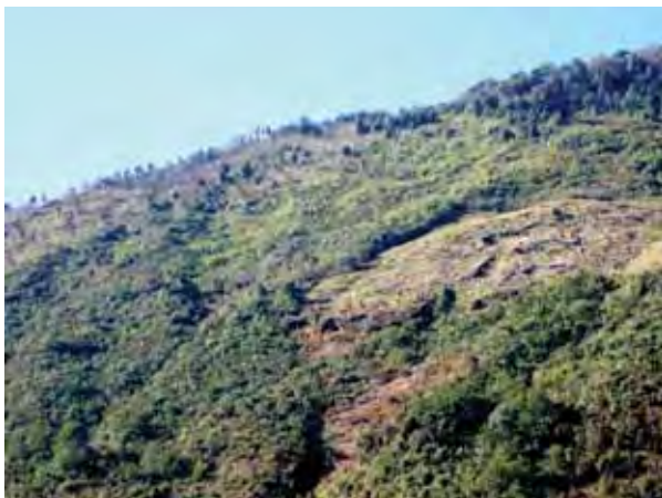
Figure 2 : Crop and fallow fields

In the case of rotational agroforestry there is one disadvantage of the co-management concept in that in many parts, the management is now largely under community-only control. Therefore, if co-management is promoted, farmers may see this as a way for governments to increase their control. In India and Nepal, this issue has arisen when community forestry and joint forest management were promoted. In those situations where communities themselves are largely in control a community-based approach to natural resource management in rotational agroforestry is preferred in which the supportive role of governments is enhanced; however it does not necessarily mean resource management is under government control.