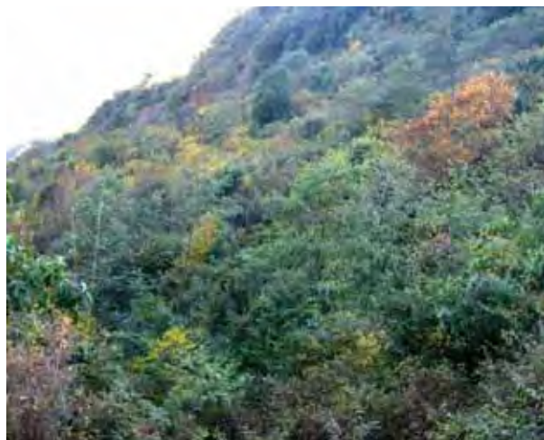
Figure 5 : Twelve year fallow field in Lawajin area of KCA

Over the centuries, farmers have developed their own, location specific, holistic and harmonious knowledge and practices. There are number of innovations which are based on farmer's knowledge and practices. Table 2 shows some of these innovations:-