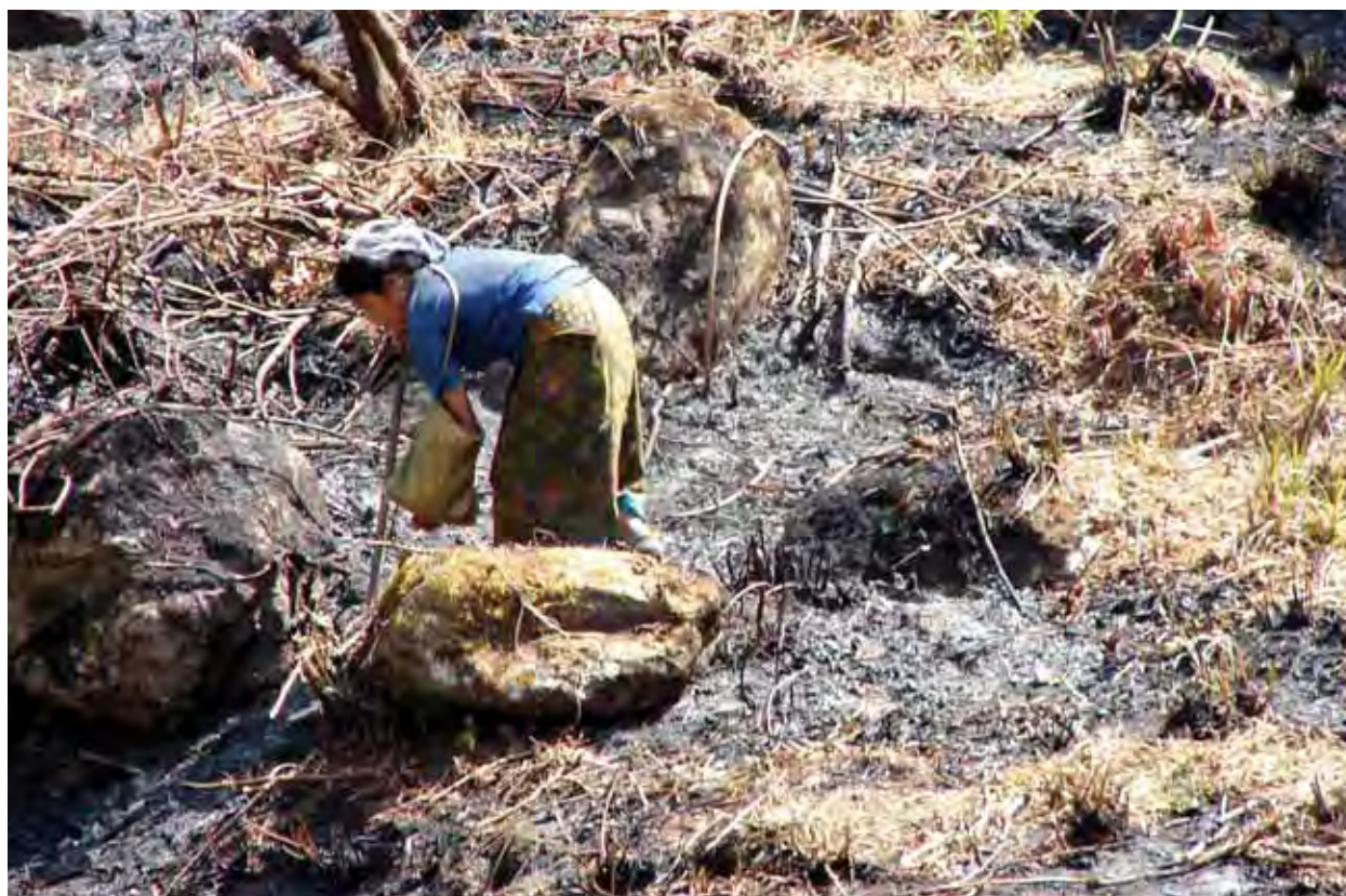
Figure 4 : Sowing of maize by dibbling

Soil erosion and land degradation were reported to be a problem, especially in Langluwa and some parts of Yasang, but the farmers had not yet found adequate conservation measures. Studying the amount of soil loss was not possible within the scope of this study, so it is unclear whether it is within or beyond acceptable levels. Normally, the soil loss is very high right after slashing and burning, due to the thick forest soil being exposed to the rain and wind. However, a vegetation cover is re-established and maintained soon after, mitigating this hazard. After the cropping phase, there is hardly any erosion for the duration of the fallow phase. In fact, in the villages studied,