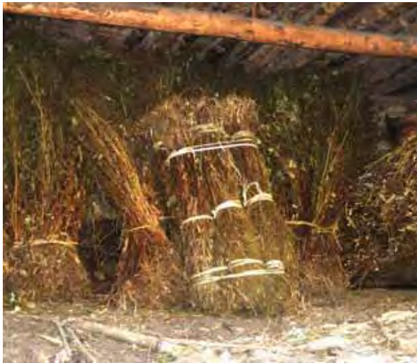
Figure 13 : Bundling chiraïto for transportation to market

After the management system was handed over to the community people, the local committee in each VDC became responsible for the monitoring. This seems to be more practical and people do complete the required process which involves the VDC office informing KCAMC that the marketing is legal. Farmers have to pay NRs 2.50 per kg of chiraïto to the KCAMC which is deposited in the community committee fund. If chiraïto is collected from a national forest, the collector is required to pay NRs 15 per kg as a tax which will be deposited in the national tax revenue office and half of the price collected later comes back to the community fund. However, neither of these two systems of collecting funds is very practical in the case of the Kangchenjunga Conservation Area.