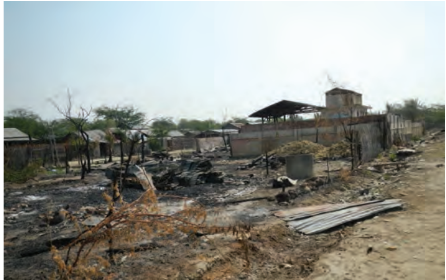
Site of the Mingalar Zayyone madrasa which was burned to the ground in March 2013.