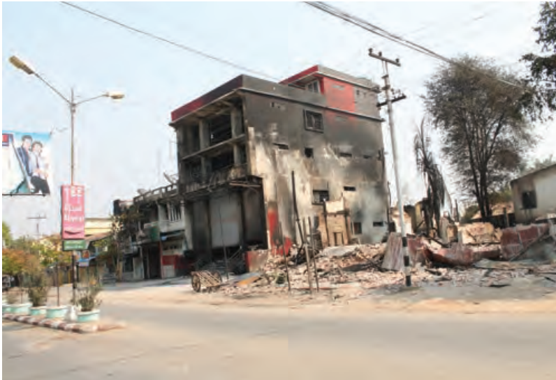
Property destroyed during the violence in Meiktila, Burma from March 20-24, 2013.