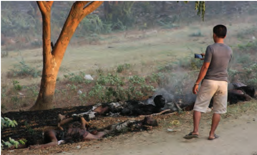
A man takes pictures of burnt bodies in Meiktila, Burma on March 22, 2013.

them to Yin Taw Village [a Muslim enclave], where they belong!” 209 When Aung got to the trucks, two of the three were already filled. His group climbed onto the third truck and he estimates they rode for about 15 minutes until they arrived at Meiktila’s No. 2 police station at around noon on March 21. 210