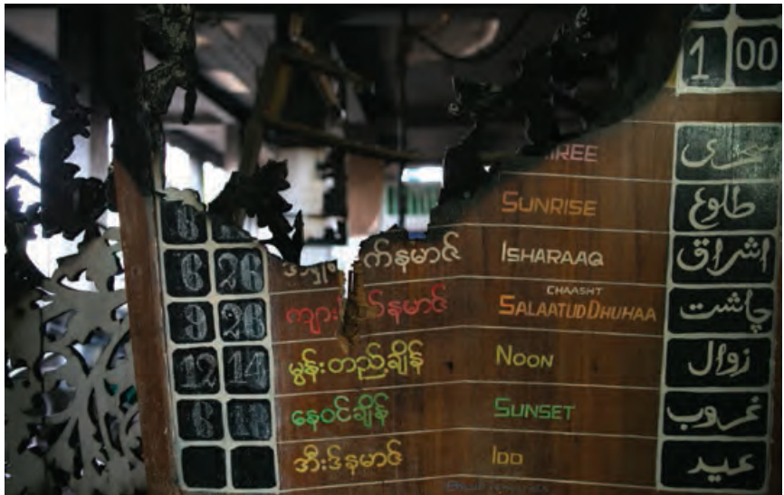
A sign showing the prayer times is burned inside a mosque in Meiktila, Burma.