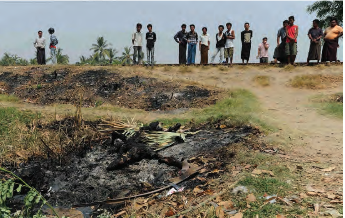
Residents look at the charred remains of burnt bodies in Meiktila, Burma on March 23, 2013.