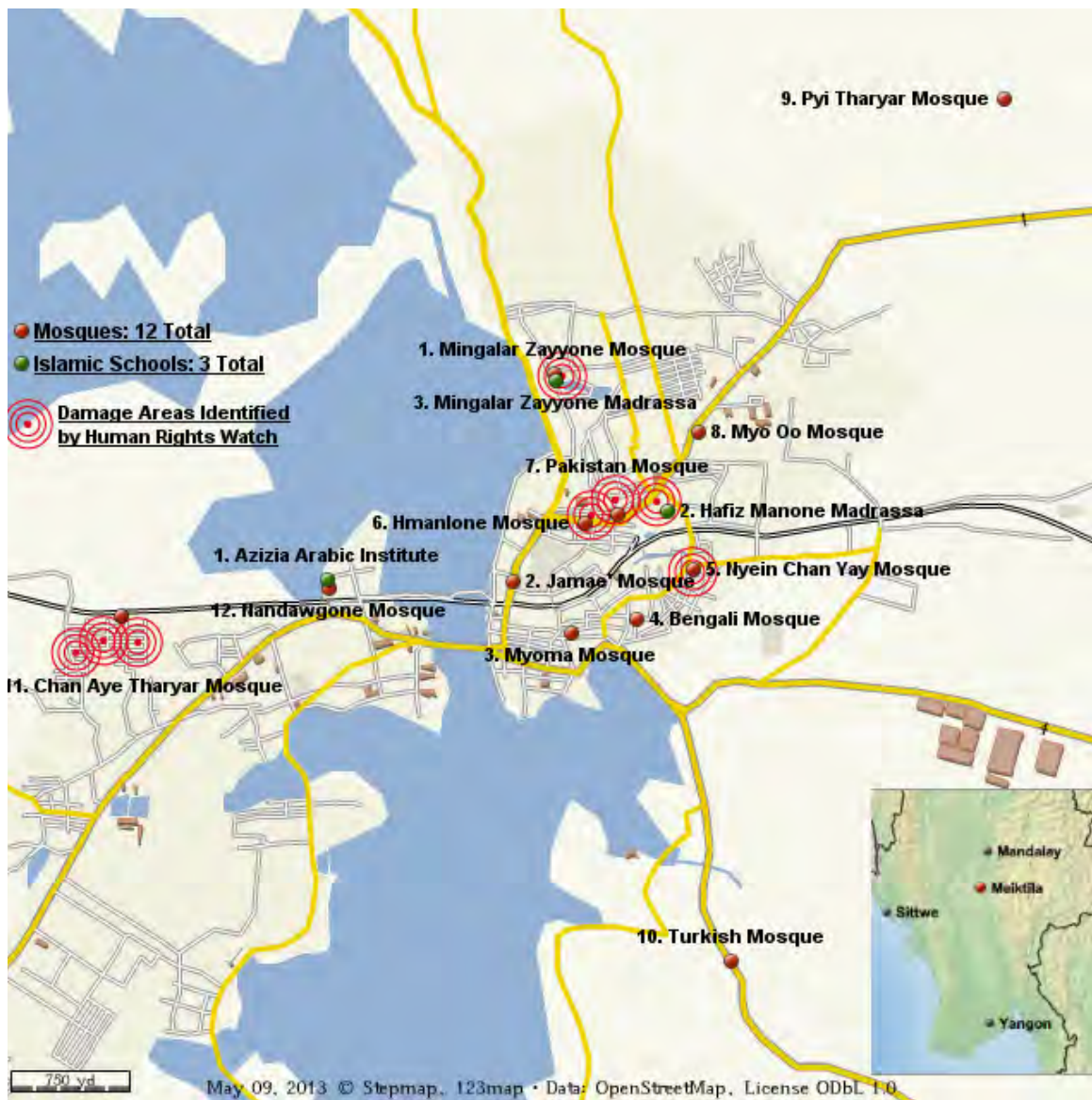
22 Map: PHR-Verified Destruction of Mosques and Islamic Schools in the City of Meiktila, Burma March 20-23, 2013