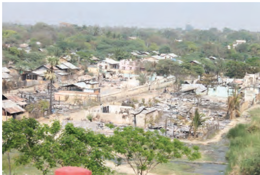
General view of the destruction in Mingalar Zayyone quarter, including burnt out homes, the mosque, and the school.

While it was still dark, the group of 150 students, teachers, and others from the neighborhood who had been hiding all night in Wat Hlan Taw began to run back toward the school, away from the main road. 95 The entire group ran to get out of the grass and sought refuge in a nearby residential compound. 96 Myint saw some in his group break down the bamboo fence of the western wall of the compound, where there were four buildings. 97 While the students were running from the bushes to the neighbor's house, the armed men saw them and followed them to the house where others were hiding. 98