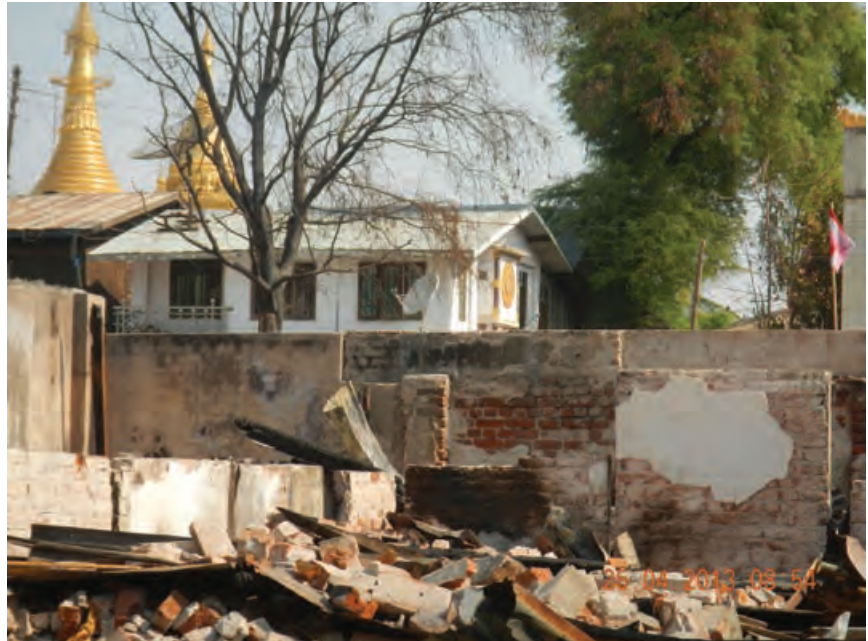
In the foreground a Muslim home in Meiktila, Burma that has been destroyed while the Buddhist home and temple behind were unscathed.

A man who lived in the quarter also came to the school and told the teachers to "keep everyone in the school and don't go into town." 42 One of the teachers then told all the boys to go to the mosque next door, as they were going to make an announcement. The boys were told that they were all to stay in the school and not venture out as it was not safe. 43 Three other students each similarly reported that the teachers informed them that "it was not a good situation in town" and that a mosque had been attacked and destroyed. 44 Sensing there was a problem between Buddhists and Muslims, the teachers told the students to take off their caps ( taqiyah ) so as not to call attention to their Muslim identity. 45 They also told the students to remain calm and quiet. 46 The teacher decided that if their madrassa was attacked they would not resist and instead would plead for the attackers not to harm the students. The teachers told the students "not to raise a fist" if the "terrorists" came. 47